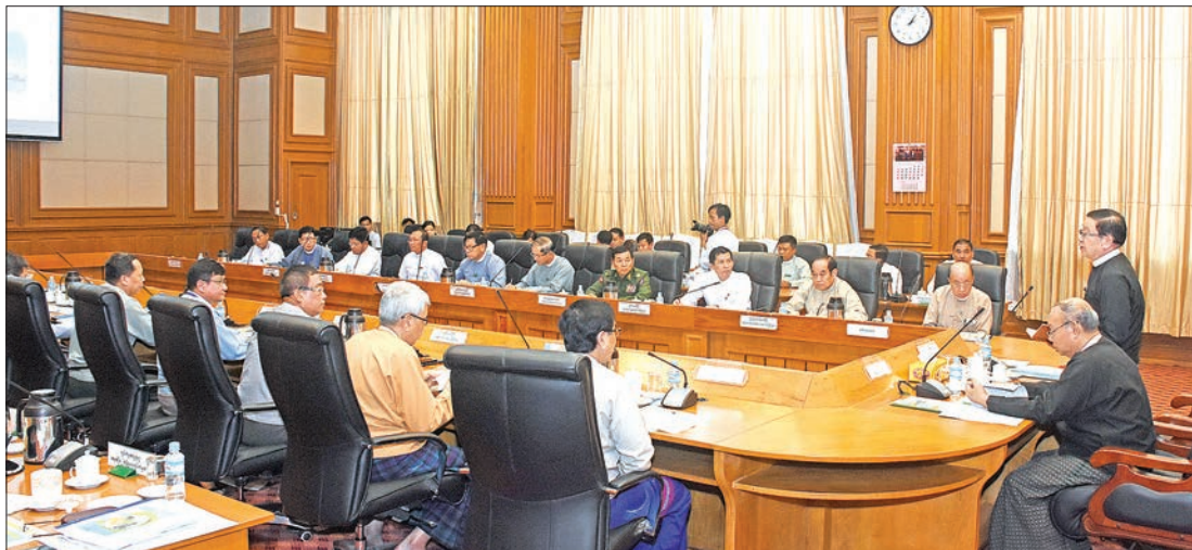
Pyithu Hluttaw Speaker U T Khun Myat delivers the speech at the coordination meeting of the central committee at the Hluttaw building in Nay Pyi Taw yesterday.

THE coordination meeting (4/2018) of the central committee and work committees in charge of organizing Hluttaw meetings was held at the Hluttaw Building Zabuthiri Hall yesterday.