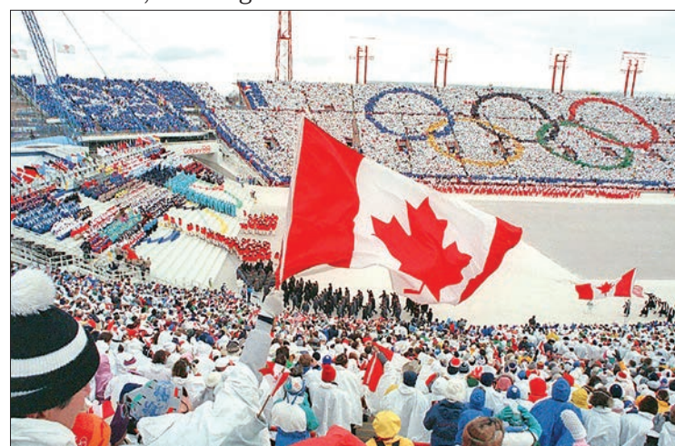
In this file photo taken on 13 February 1988 fans cheer and wave flags as the Canadian delegation (lower right) parades during the opening ceremony of the XVth Winter Olympic Games 13 February 1988 in Calgary.

Outside, they waved placards that read "Go Olympics" and "Don't Luge this Calgary," at times breaking into chants of the national anthem. — AFP ■