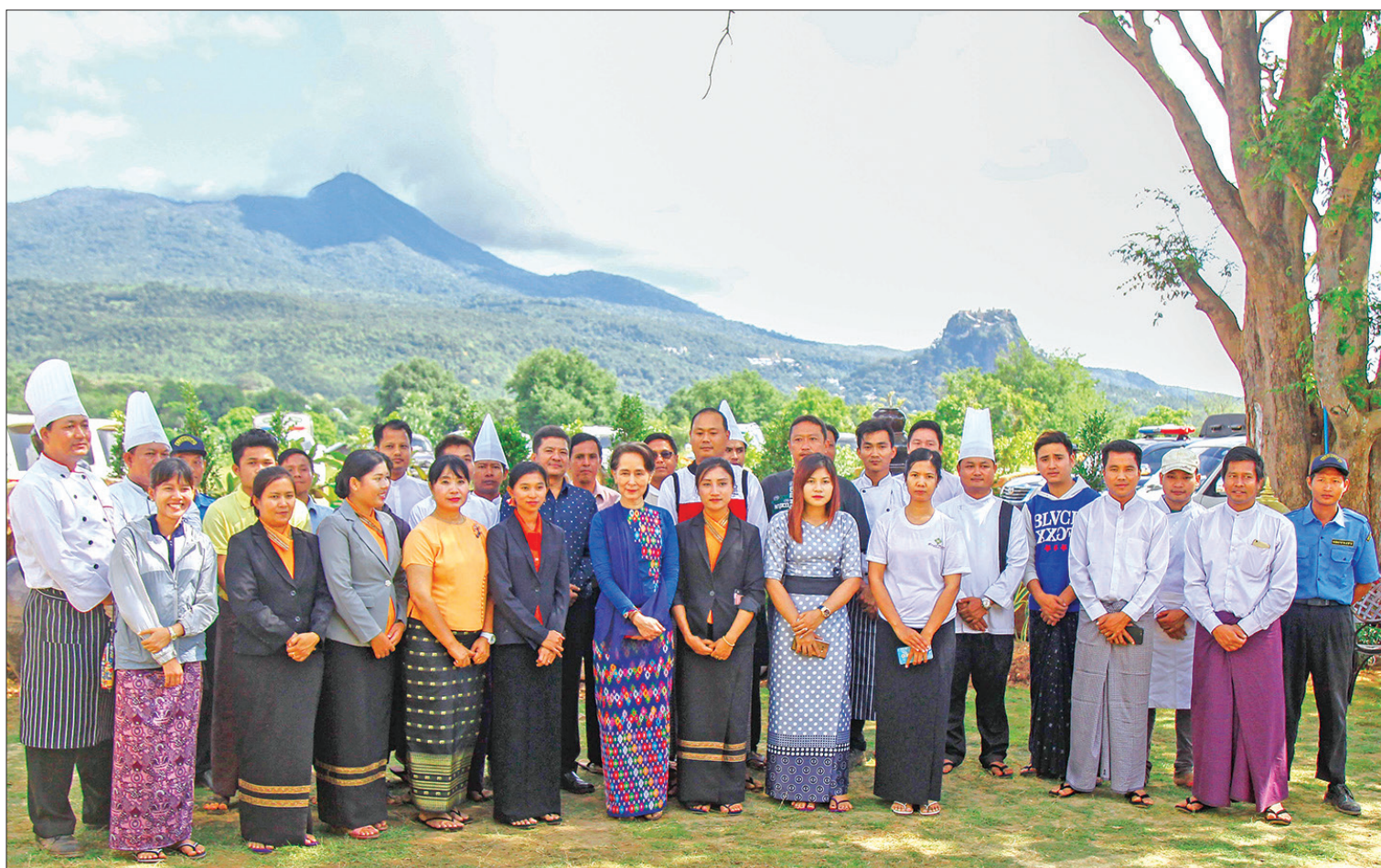
State Counsellor Daw Aung San Suu Kyi poses for the documentary photo with members of the Mt. Popa Lovers Association and staff of the Sagawa Garden Hotel during her visit to inspect the long term development of Mt. Popa in Mandalay Region.