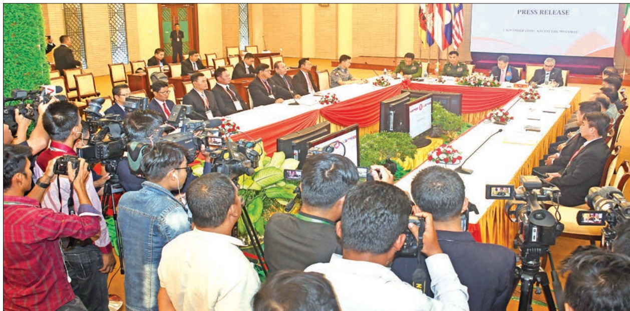
Union Minister for Home Affairs Lt-Gen Kyaw Swe attends the 12 th ASEAN Ministerial Meeting on Transnational Crime in Nay Pyi Taw yesterday.

The 12 th ASEAN Ministerial Meeting on Transnational Crime met the press following the conclusion of the meeting in Nay Pyi Taw yesterday.