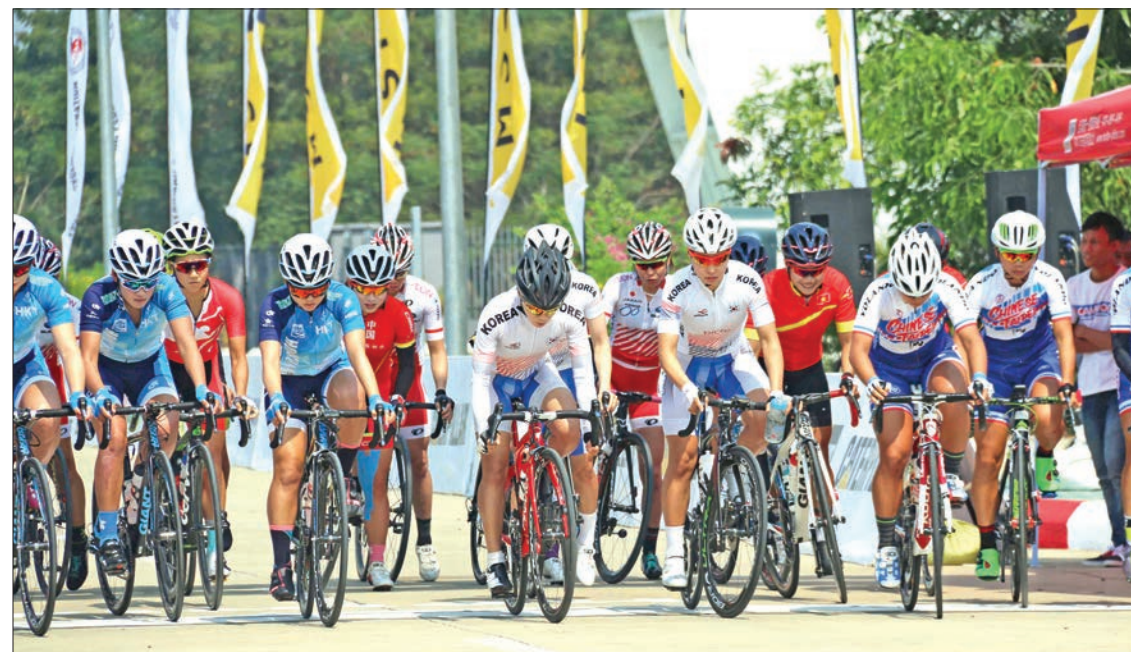
Cyclists are in a road race in Myanmar.

Cash prizes will be awarded to first three winners of each race category. The first prize for Men's U-23 and Men's Junior U-19 is US$ 2,000, the second US$1000 and the third US$ 500. The first prize for Open is Ks 500,000, the second Ks 300,000 and the third Ks 200,000. The first prize for Masters is Ks 300,000, the second Ks 200,000 and the third Ks 100,000. —Htut Htut