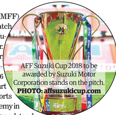
AFF Suzuki Cup 2018 to be awarded by Suzuki Motor Corporation stands on the pitch.