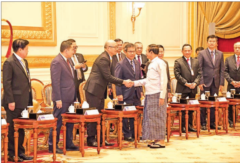
President U Win Myint greets representatives of ASEAN countries who attended 12 th ASEAN Ministerial Meeting on Transnational Crime and related meetings.