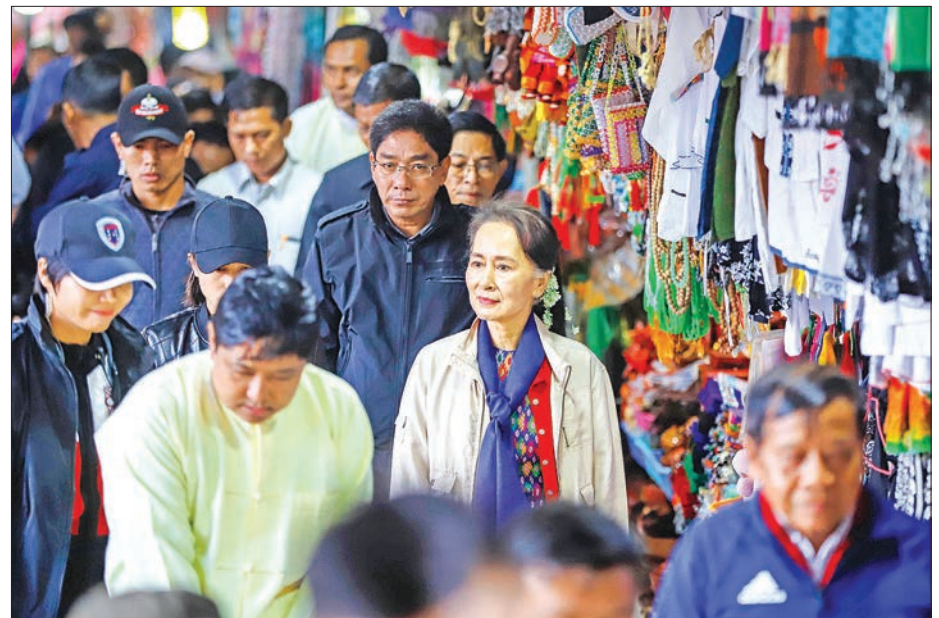
State Counsellor Daw Aung San Suu Kyi visits Popa Taung Kalat to inspect the long-term development and greening works on Mt. Popa yesterday.