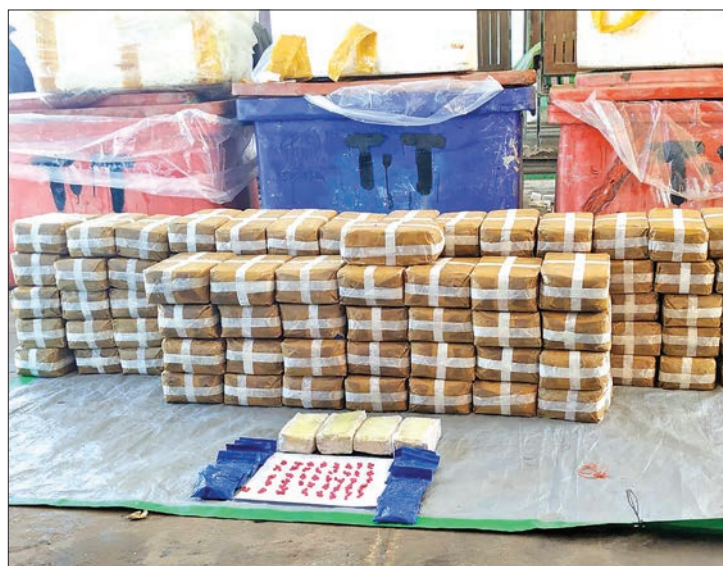
Police seized stimulant tablets in Buthidaung Township.

According to the investigation, police searched the cargo ship, which is berthed at a jetty in Meikyahtar Seik ward, and found 975,000 Yaba pills weighing 975 kilograms and valued at Ks 1.9 billion. The pills were mixed with ice and fish inside containers.