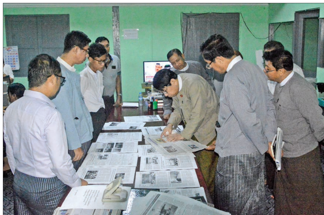
Union Minister for Information Dr. Pe Myint and Deputy Minister U Aung Hla Tun examine the workflow of The Global New Light of Myanmar at the daily's editorial department in Yangon.

General of the Printing and Publishing Department U Aung Myo Myint suggested changing the prices for the three 100 Myanmar