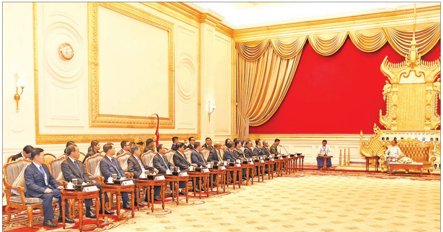
President U Win Myint receives representatives from ASEAN countries attending the 12 th ASEAN Ministerial Meeting on Transnational Crime at the Presidential Palace in Nay Pyi Taw yesterday.