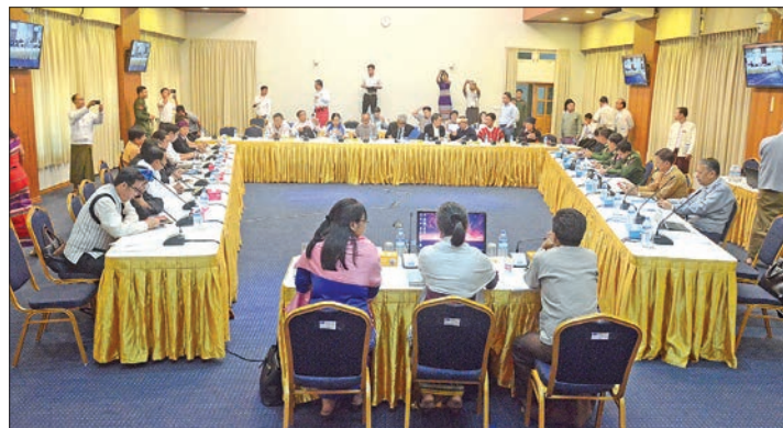
The political dialogue framework meeting will be held for three days at the NRPC in Yangon.

He expressed his hope that all three groups present at the day's meeting will be able to formulate the best guidelines for the UPDJC (Union Peace Dialogue Joint Committee), secretaries, working committees and national-level political discussions for the upcoming 4 th Session of the Union Peace Conference - 21 st Century Panglong.