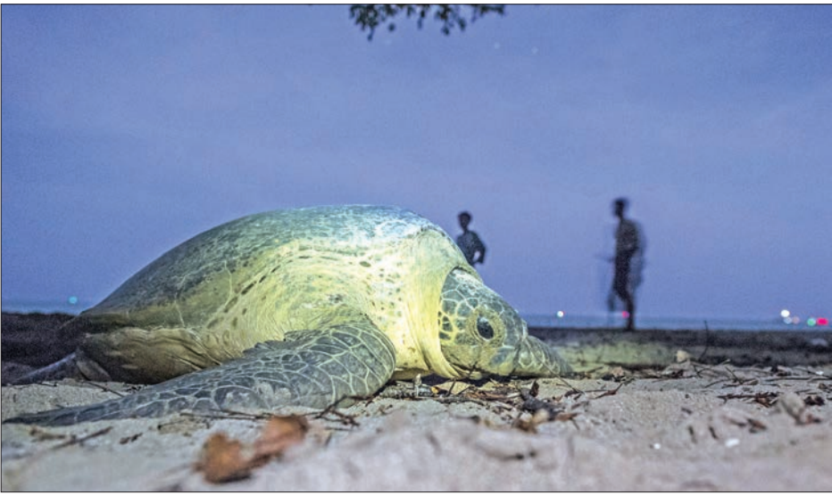
This picture taken on 19 October, 2018 shows rangers standing near a green turtle heading back to the sea after laying eggs at a beach on Thameehla Island.

Sea turtles have temperature-dependent sex determination — warmer