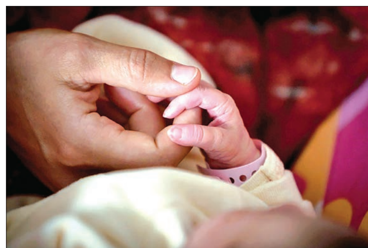
Newborns of fathers aged 55 and over tend to score worse in standardised health tests.

But recent studies suggest that being a father later in life may also be associated with higher risks in offspring of autism, genetic abnormalities and mental