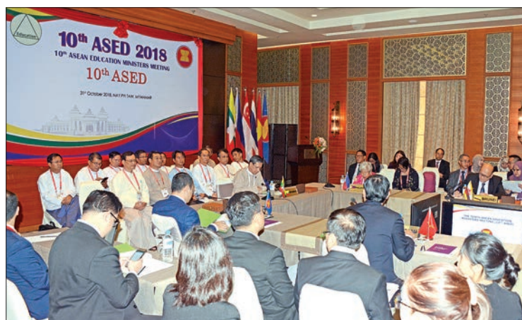
Union Minister Dr. Myo Thein Gyi attends 10 th ASEAN Education Ministers Meeting in Nay Pyi Taw yesterday.

The participants took part in the discussion regarding the education sectors in the ASEAN nations, SHARE EU Project of the ASEAN Education Sector for youths, scholarship privileges, risks and benefits of a fourth industrial revolution for the ASEAN regions, technology, professions, education, training courses,