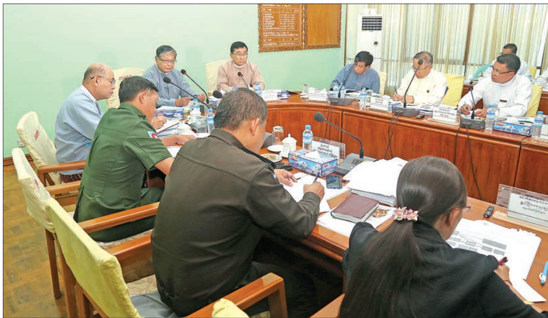
Union Ministers U Kyaw Tint Swe and Dr. Win Myat Aye attend the coordination meeting at the Ministry of Social Welfare, Relief and Resettlement in Nay Pyi Taw yesterday.

U KYAW Tint Swe, Union Minister for the Office of the State Counsellor, attended coordination meeting 6/2018 of the Rakhine State Repatriation and Resettlement of Returnees Committee, held at the meeting hall of the Ministry of Social Welfare, Relief and Resettlement yesterday.