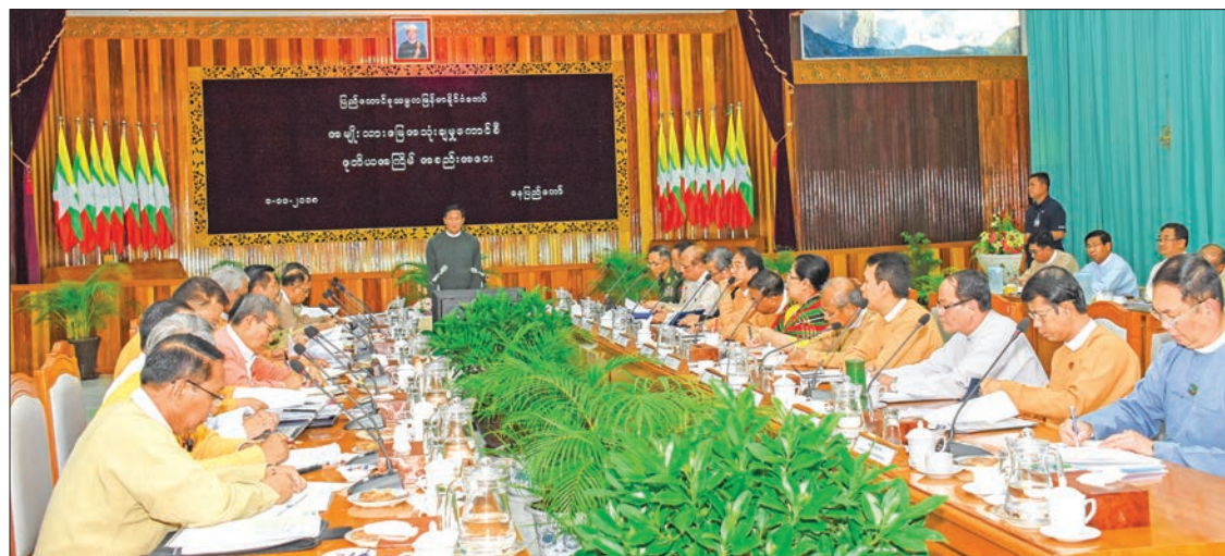
Vice President U Henry Van Thio delivers the speech at the 2 nd coordination meeting of the National Land Use Council in Nay Pyi Taw yesterday.

NATIONAL Land Use Council Chairman Vice President U Henry Van Thio addressed the second coordination meeting of the National Land Use Council held at the Ministry of Natural Resources and Environmental Conservation in Nay Pyi Taw yesterday afternoon. The meeting was held to implement the aims, guidelines and basic principles in the national land use policy. This was the second meeting of the National Land Use Council, that has been formed to carry out laws related to land use policies.