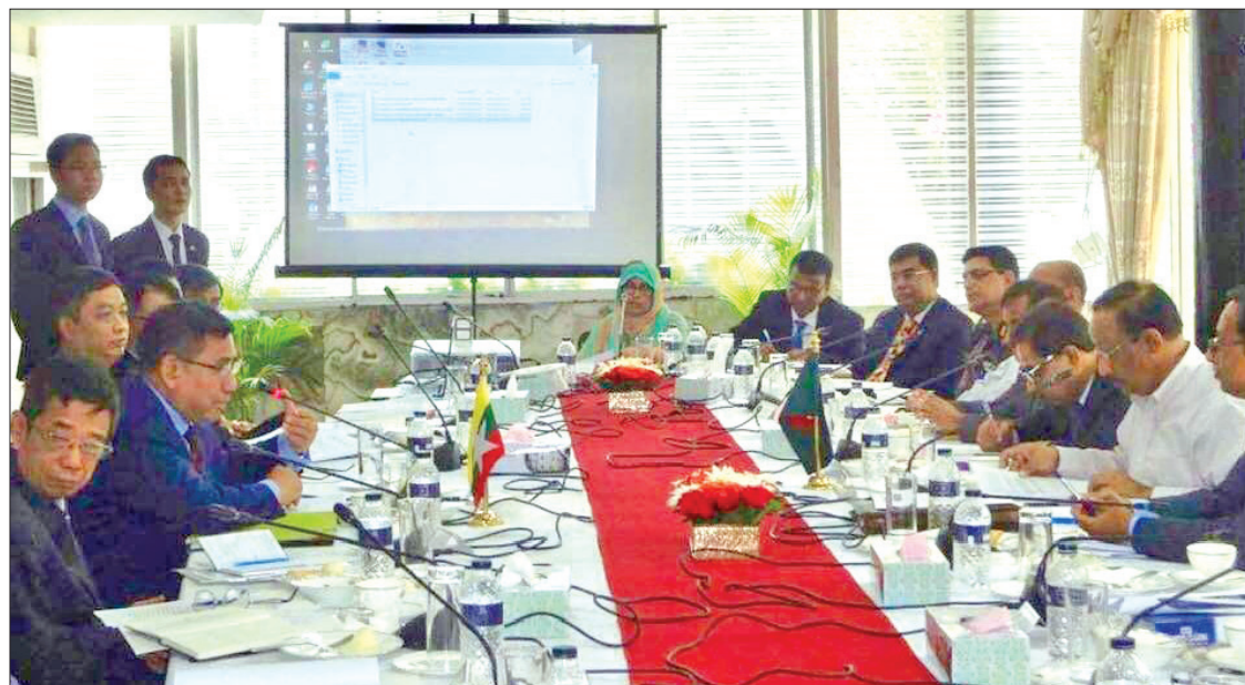
High-level officials from Myanmar and Bangladesh convene at the third meeting for repatriating verified displaced persons held in Dhaka, Bangladesh from 29 to 31 October.

At the Meeting, both sides exchanged views and reviewed the repatriation process, including conducive environment, safety, security and confidence building for the prospective returnees, preparation for resettlement, verification process, dissemination of information among the returnees on information about National Verification Card (NVC), involvement of the United Nations Agencies, INGOs and international partners in the processes of repatriation, resettlement and reintegration.