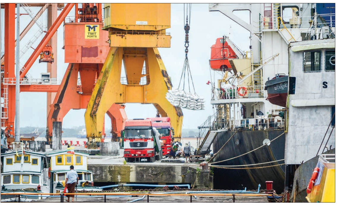
(FILES) Rice bags are being loaded onto lorries at a port in Yangon on 18 September 2017.

In the current financial year, 694,222 tonnes of rice and broken rice were exported