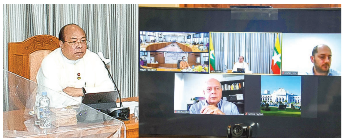
Union Minister U Thaung Tun announces awarding of a contract to Roland Berger Co. Ltd., for end-to-end for consulting services to finalize a Swiss Challenge tendering process on 4 Sept.