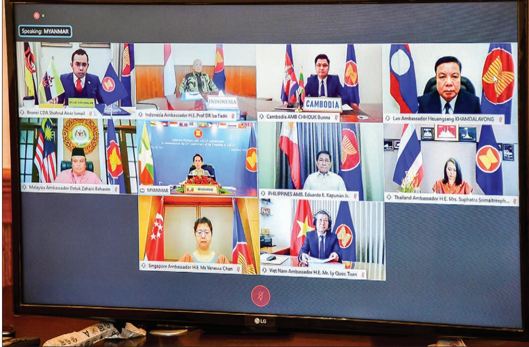
State Counsellor Daw Aung San Suu Kyi holds meeting online with ASEAN Ambassadors in commemoration of the 53rd Anniversary of the Founding of ASEAN Day on 4 September 2020.

commemoration of the 53rd Anniversary of the Founding of ASEAN, State Counsellor and Union Minister for Foreign Affairs Daw Aung San Suu Kyi held a videoconference with the ASE-AN Ambassadors to Myanmar yesterday at 10 am from the Ministry of Foreign Affairs, Nay Pyi Taw and exchanged views on national efforts of ASEAN Member States and shared information, experiences and best practices in response to the COVID-19 pandemic. The Ambassadors from Viet Nam, Cambodia, Indonesia, Lao PDR, Malaysia, the Philippines, Singapore, Thailand and Charge d' Affaires a.i. of Brunei Darussalam participated in the videoconference.