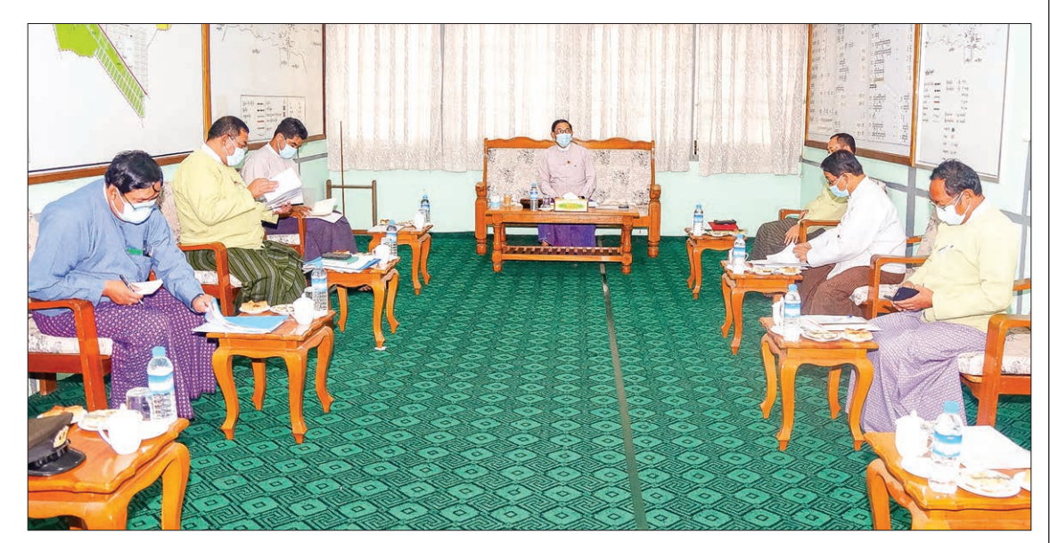
Union Minister U Min Thu discusses adminstrative procedures for successful holding of 2020 Gnereral Election on 4 September 2020.

UNION Minister for the Office of the Union Government U Min Thu held a meeting with chairperson and members of Takton election sub-commission at the Government Administration Office in Tatkon, Nay Pyi Taw yesterday.