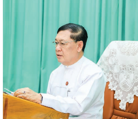
Union Minister U Thein Swe (R) joins the meeting of National Advisory Committee via videoconference on 4 September 2020.

al-level on Prevention, Control and Treatment of COVID-19 and the Ministry of Health and Sports.