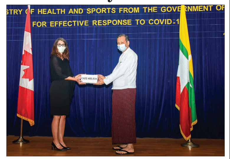
Ministry of Health and Sports receives N-95 masks from Embassy of Canada on 4 Sept.

THE Embassy of Canada donated N-95 masks worth of 489,934 Canadian dollar to the Ministry of Health and Sports yesterday in Yangon to mitigate and prevent the spread of the COVID-19 in Myanmar.