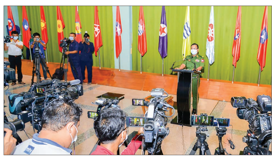
Tatmadaw True News Information Team holds a press conference on 4 August.

THE Tatmadaw True News Information Team held a press conference at the Defence Services Museum in Nay Pyi Taw yesterday.