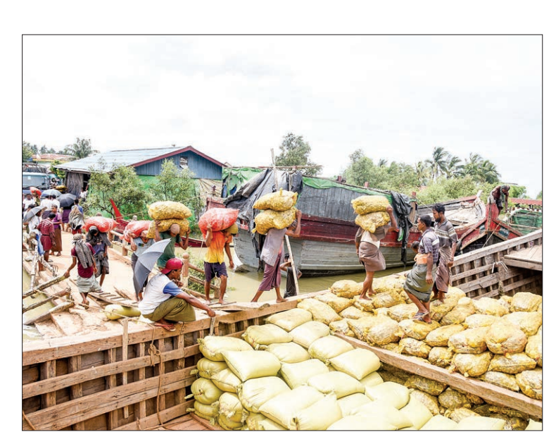
Workers load goods into a vessel for export.

The products traded between the two countries in-