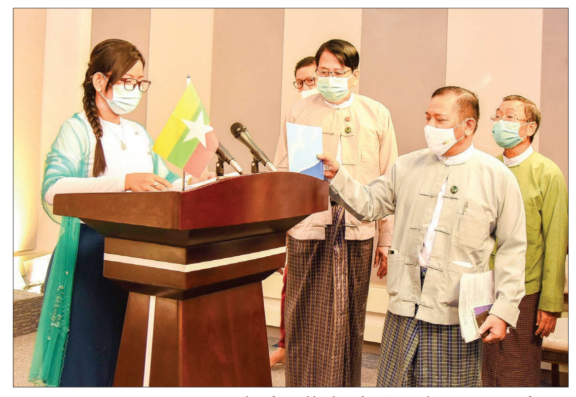
\label{thm:condition} \begin{tabular}{ll} \textbf{Union Minister Dr Pe Myint inspects preparations for making broadcast campaign programmes of political parties on 4 Sept. \end{tabular} \begin{tabular}{ll} \textbf{} \end{tabular}