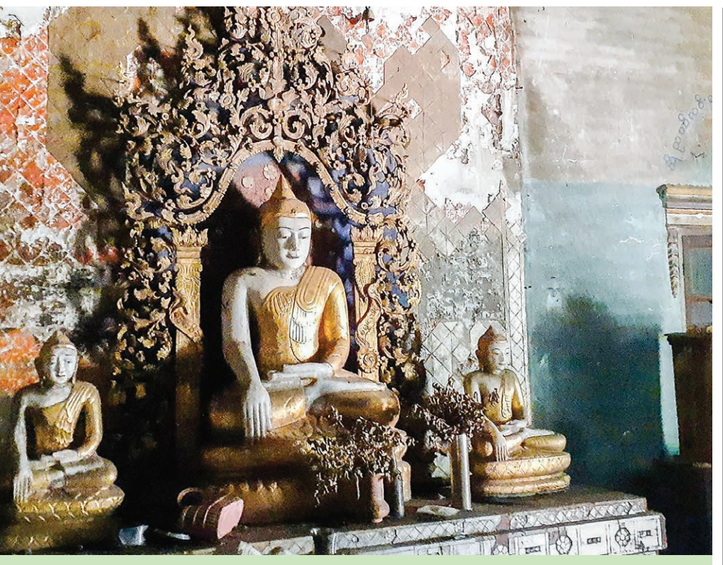
Buddha Statues in Sayadaw U Bud Monastery.