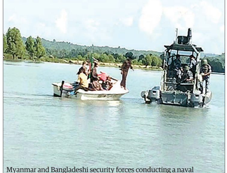
patrol by boats along the Naf River. PHOTO: MYANMAR