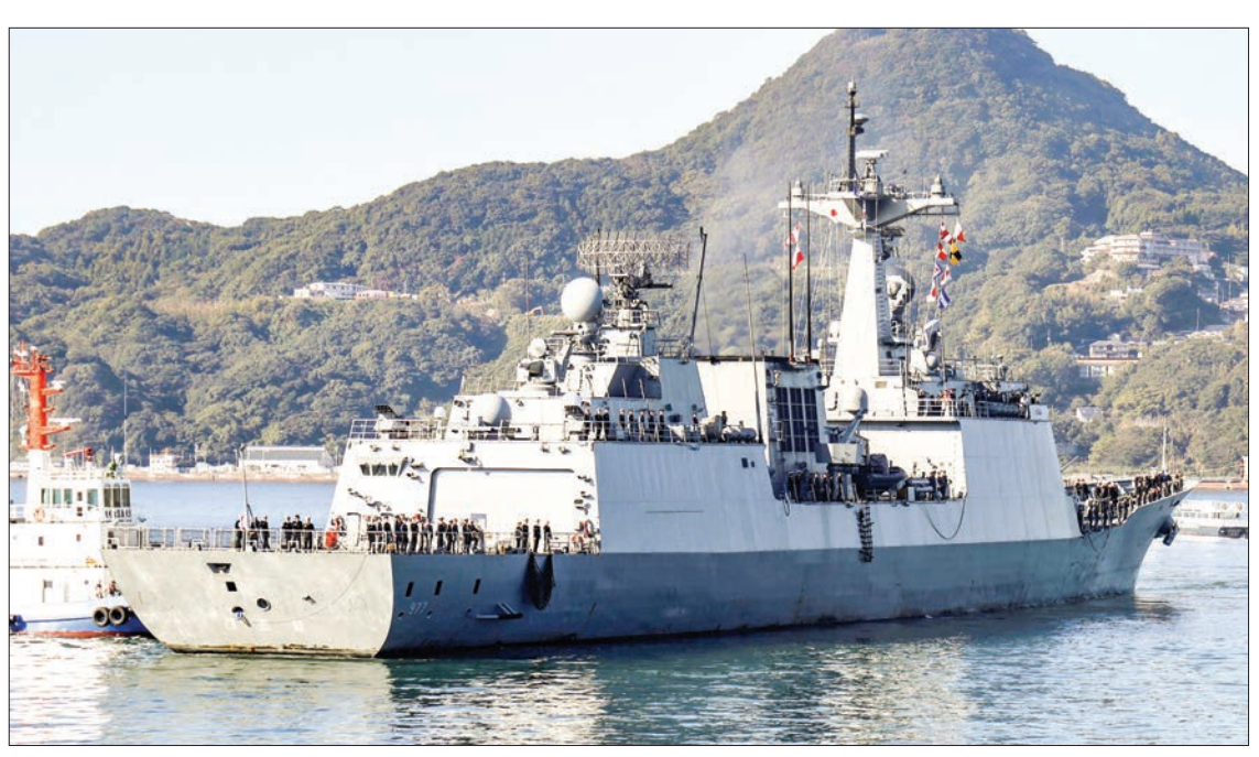
South Korean destroyer Dae Jo Yeong visits a port at the Japan Maritime Self-Defence Force's Sasebo base in Nagasaki Prefecture, southwestern Japan on 5 November, 2018.

In August, South Korea told Japan and other countries that their warships should only fly their national flag and that of South Korea during the international event. Tokyo cancelled its participation, claiming Seoul's request was "unacceptable." It maintains the rising sun flag has long been recognized under international law as indicating a vessel belongs to Japan, and MSDF ships are required to fly the flag under Japanese domestic law. —Kyodo News ■