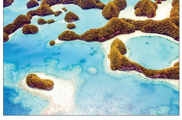
Palau is to introduce the world's first ban on sunscreen chemicals to protect its famed corals.

But rigid building codes and strict enforcement mean even strong tremors often do little damage.—AFP ■