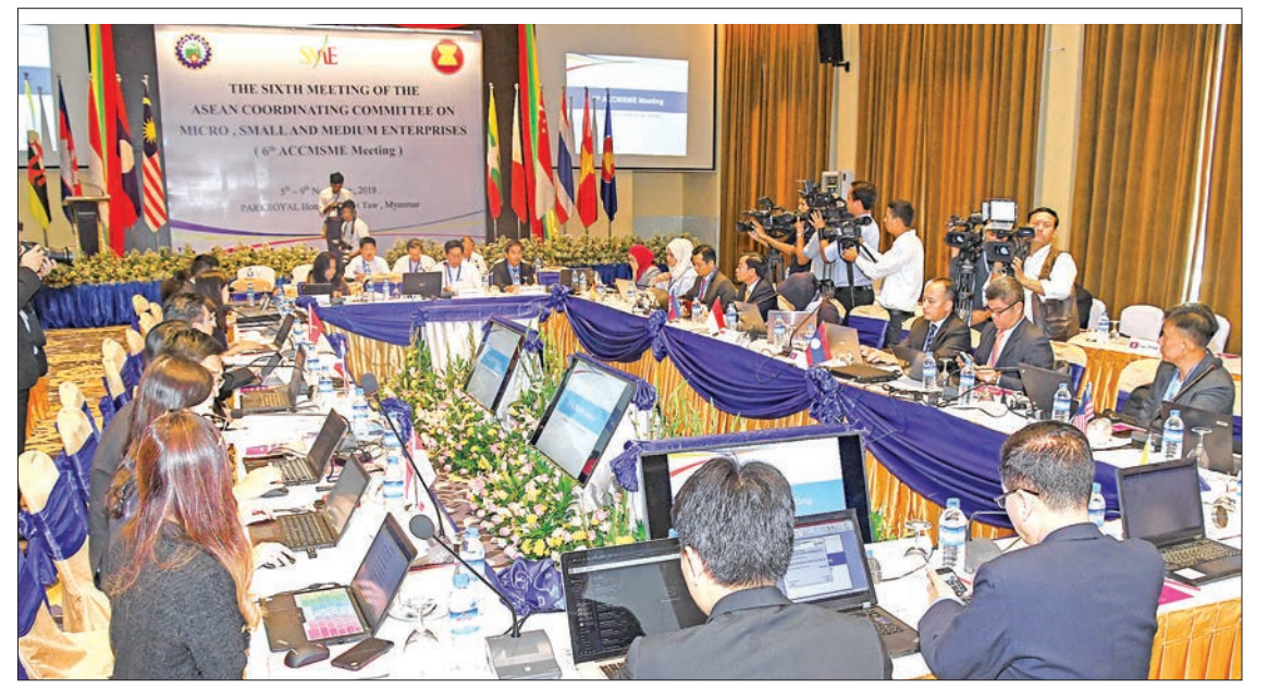
The 6th ACCMSME Meeting and related meetings continue in Nay Pyi Taw.

During the second part of the ceremony, Union Minister for Industry U Khin Maung Cho led the 6<sup>th</sup> ACCMSME meeting. — MNA ( Translated by Zaw Min )