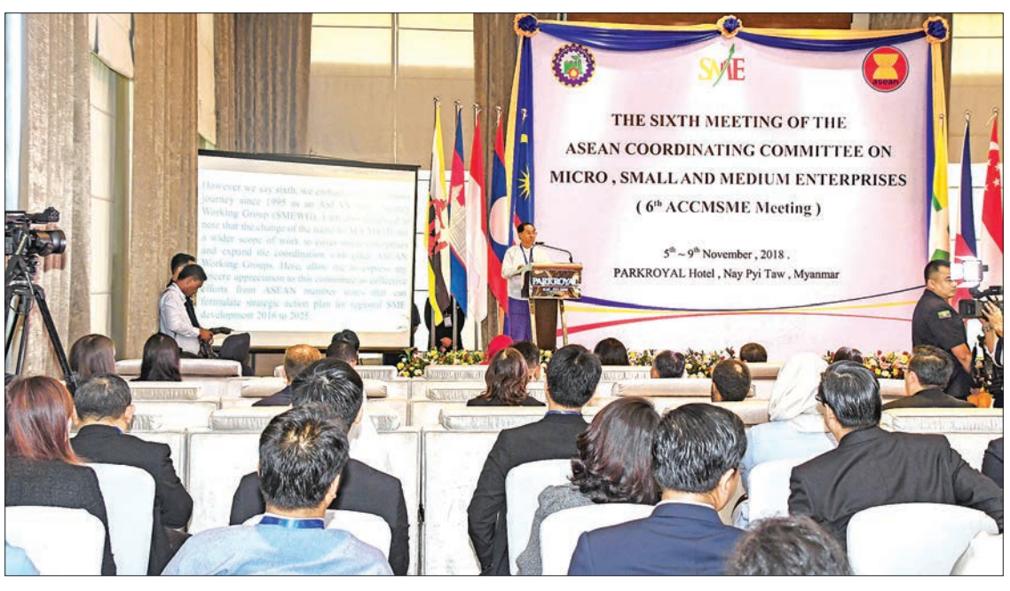
Vice President U Myint Swe addresses at the Sixth Meeting of the ASEAN Coordinating Committe on Micro, Small and Medium Enterprises held in Park Royal Hotel, Nay Pyi Taw.

To expand the market of MSMEs in the travel sector, garment and clothing sector, supply linkages are required, as well as other opportunities, such as obtaining information resources.