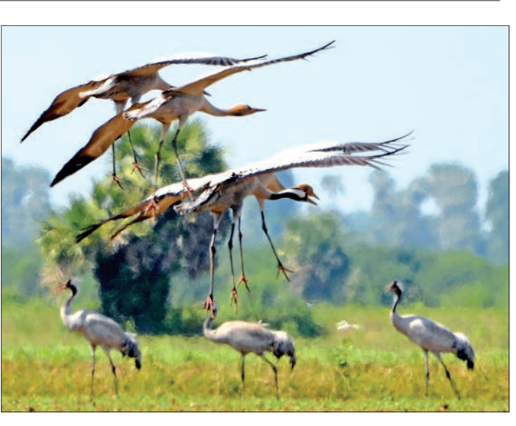
Migrating cranes arrive in Paleik Lake in Kyaukse District, Mandalay Region for the winter.

According to the surveys conducted in 2012-2013, 30 water bird species, 11 winter bird