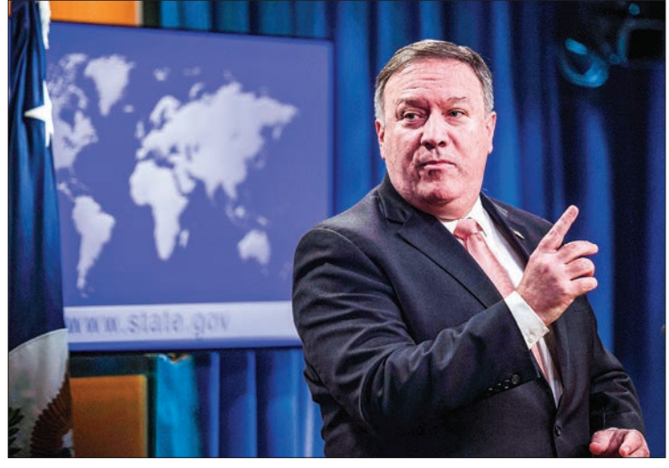
US Secretary of State Mike Pompeo.

But the progress has fallen well short of the promise of the summit, with Washington pushing to maintain sanctions