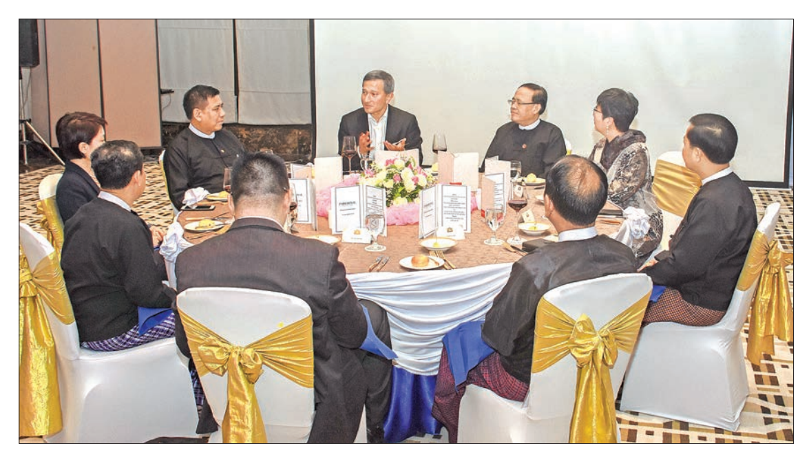
Union Minister for International Cooperation U Kyaw Tin hosts dinner in honour of the Singapore Foreign Affairs Minister Dr. Vivian Balakrishnan and delegation at Park Royal Hotel in Nay Pyi Taw.