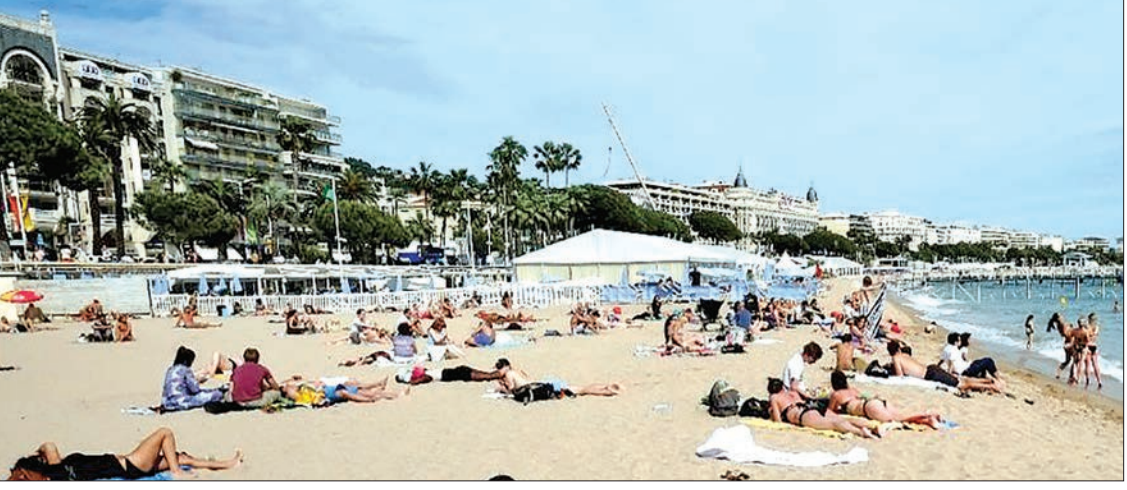
Evidence suggests men are less likely to protect themselves from the sun or heed public health warnings, researchers said.

In the United States, which was not included in the study,