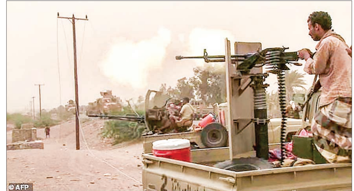
This image grab taken from a AFPTV video shows Yemeni pro-government forces firing a heavy machine gun

It had suspended the offensive ahead of UN efforts to hold peace talks in Geneva that eventually collapsed in September. The UN-sponsored process