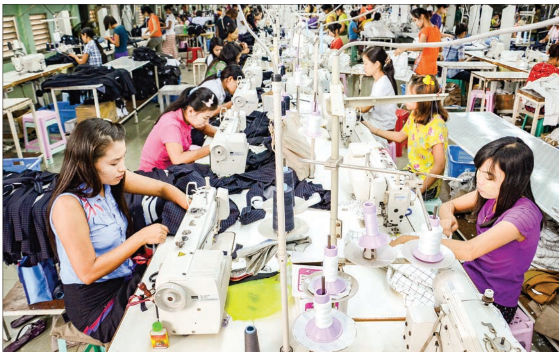
A file photo shows workers seen on a production line at a garment factory in Hlinethaya.