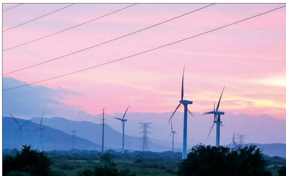
Wind farms are known to be harmful to birds, disrupting their migration patterns and causing above average death rates.

In particular, the team observed an explosion in the raptors' favourite meal, fan-throated lizards, in areas dominated by the turbines. Furthermore, they saw significant changes in lizard behav-