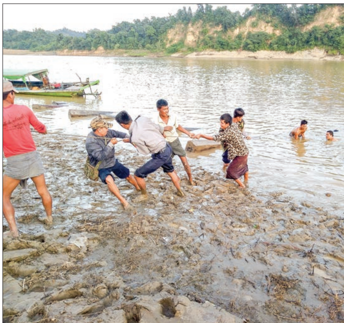
Forestry Department officials seized Tanmalan teak near Chindwin River in Sagaing Region on 5 November.