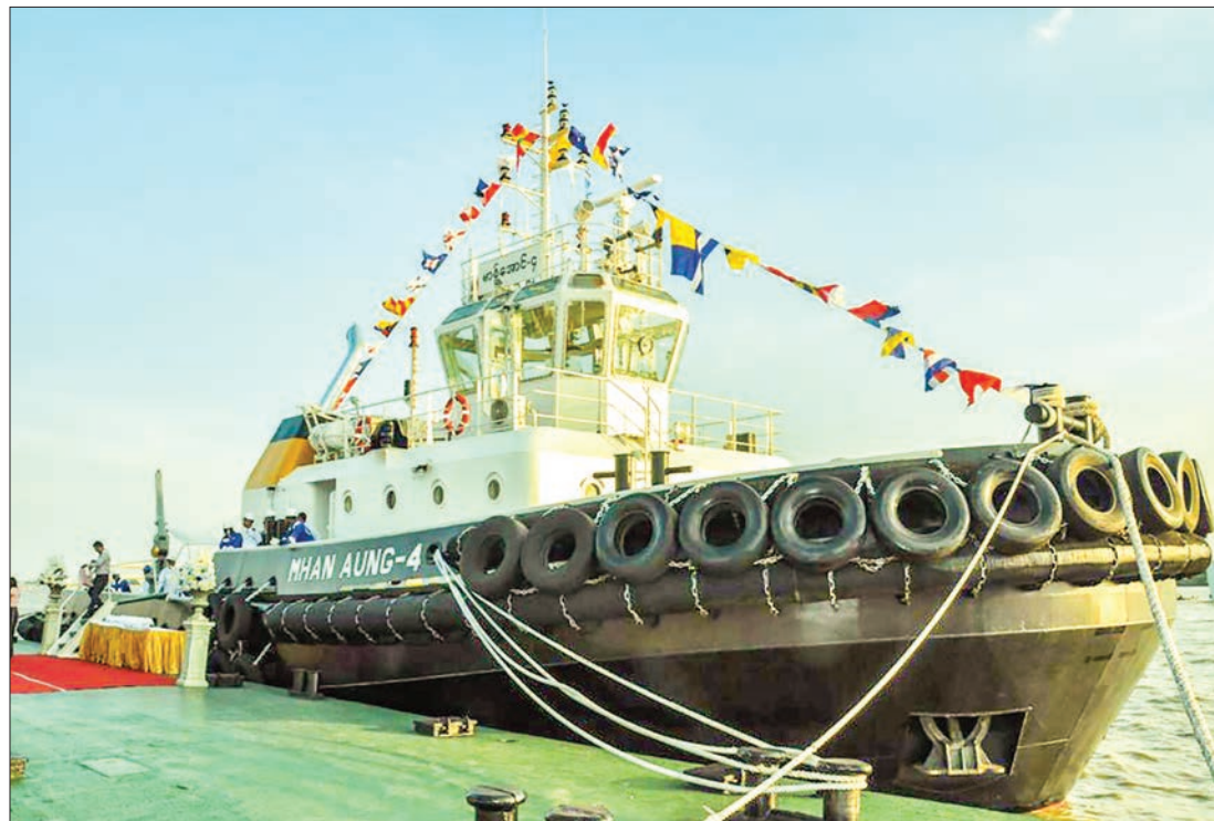
New 300-HP tugboat docks at Health Jetty in Yangon.

MYANMA Port Authority got an over 3000-HP tugboat yesterday for its port works built by Myanmar shipyards –AMECC JV.Co.,Ltd, which is a joint venture company with the Ministry of Transport and Communications.