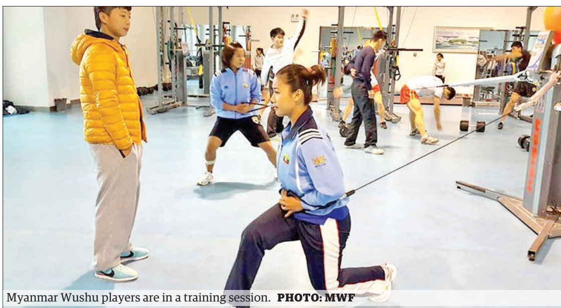
Myanmar Wushu players are in a training session.

Myanmar will host 2 nd Taolu World Cup in National Indoors Stadium-1 (Thuwunna) from 14 to 18 November and give away 22 gold medals to the winners. According to competition rules, four participants from each