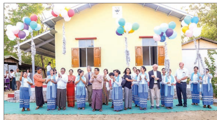
Union Minister Dr. Win Myat Aye formally opens the Youth Training building at Hnget Aw San in Kawhmu Township.

AN opening ceremony for a new building, donated by New Humanity Myanmar, was held at Hnget Aw San Youth Training School, Kawhmu Township, in Yangon Region, yesterday afternoon.