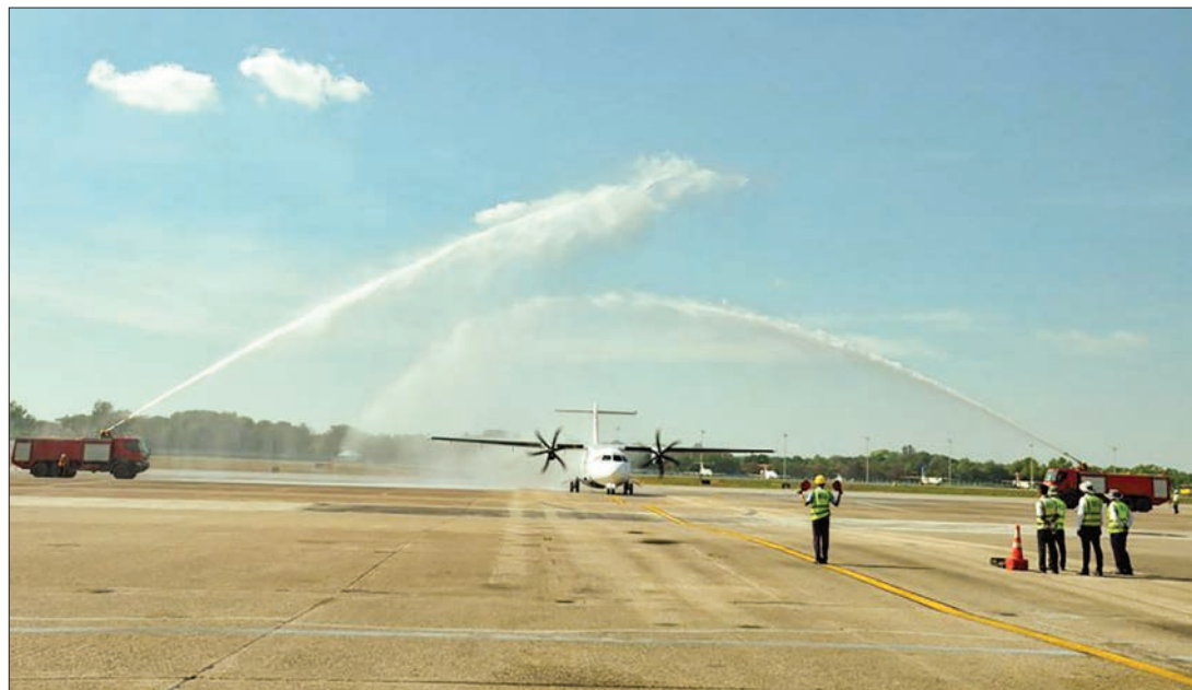
ATR 72-600 XY-AML aircraft under a ceremonial water arch upon its arrival at Yangon International Airport yesterday.

MYAMAR National Airlines welcomed its additional ATR 72-600 XY-AML aircraft at the Yangon International Airport yesterday.