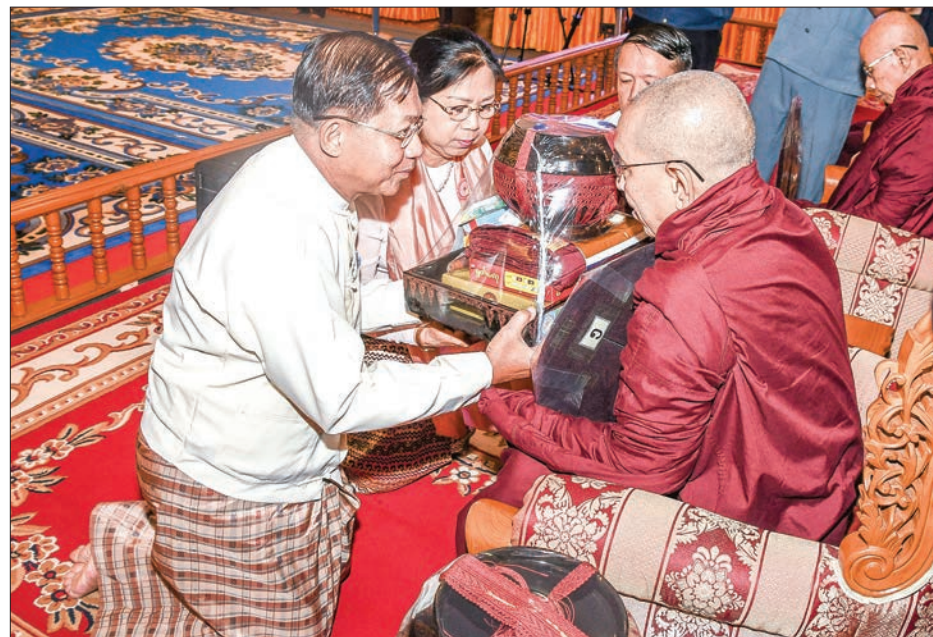
Senior General Min Aung Hlaing and wife offer Kathina robes to a Sayadaw at the Kathina Robe Offering Ceremony, Uppatasanti Pagoda, in Nay Pyi Taw.