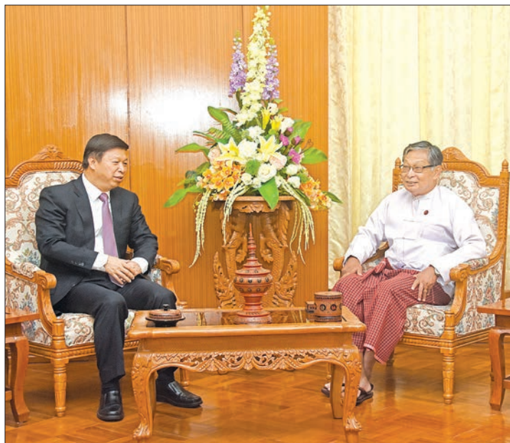
Union Minister U Kyaw Tint Swe receives Mr. Song Tao, Minister of the International Department of the Communist Party of China in Nay Pyi Taw, on 6 November, 2018.

AT THE invitation of Union Minister for the Office of the State Counsellor U Kyaw Tint Swe, a delegation led by Mr. Song Tao, Minister of the International Department of the Communist Party of China, arrived in Nay Pyi Taw yesterday.