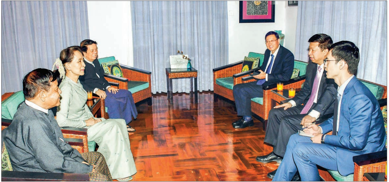
State Counsellor Daw Aung San Suu Kyi receives Mr. Song Tao, Minister of the International Department of the Communist Party of China in her residence in Nay Pyi Taw yesterday.

After the meeting the State Counsellor hosted a dinner for H.E. Mr. Song Tao. — MNA ■