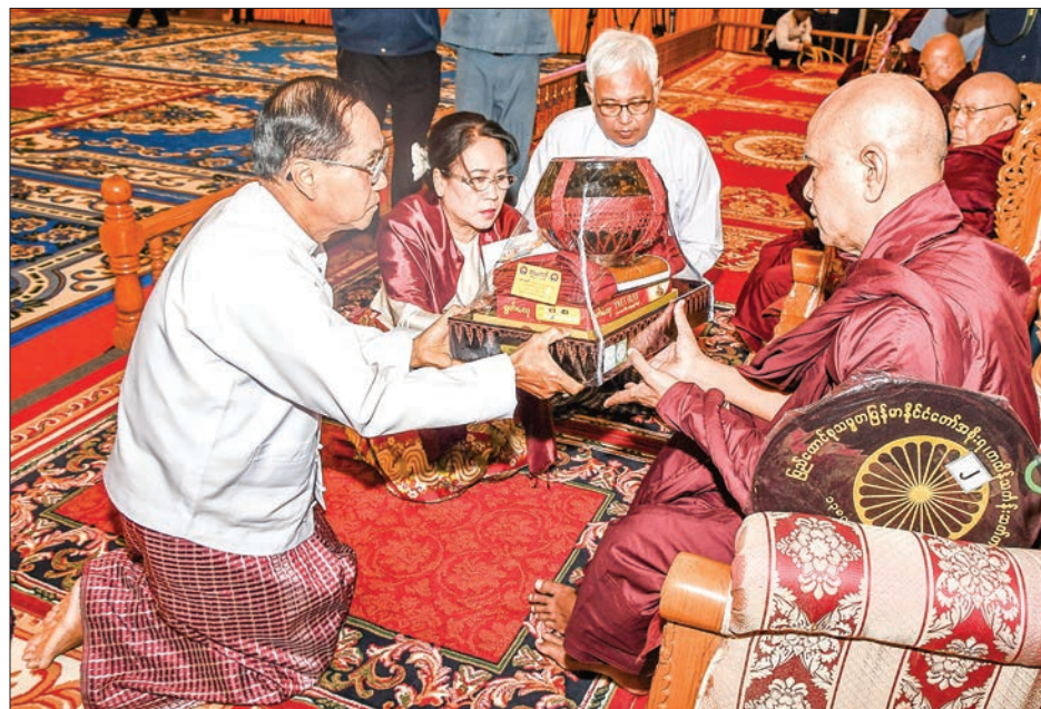
Vice President U Myint Swe and wife offer Kathina robes to a Sayadaw at the Kathina Robe Offering Ceremony, Uppatasanti Pagoda, in Nay Pyi Taw.

mony Ks 85,339,950 worth of offertories were donated. — MNA ■