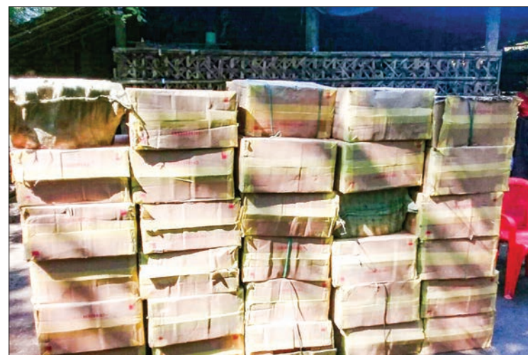
Cigar boxes confiscated in Maungtaw Township.

of Ks 3,540,000 intoal inside a bush in Pyuuma creek between Taman Thar Village and Min-galar Nyunt Village. A case has been opened by the police. — MNA ■ (Translated by Myat Thandar Aung)