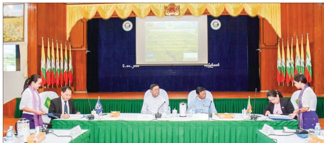
Deputy Minister U Hla Kyaw, Deputy Minister U Maung Maung Win attends the signing ceremony of the loan agreement for agro-economy in Nay Pyi Taw yesterday.