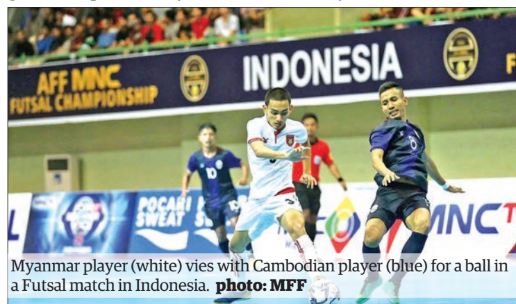
Myanmar player (white) vies with Cambodian player (blue) for a ball in a Futsal match in Indonesia.