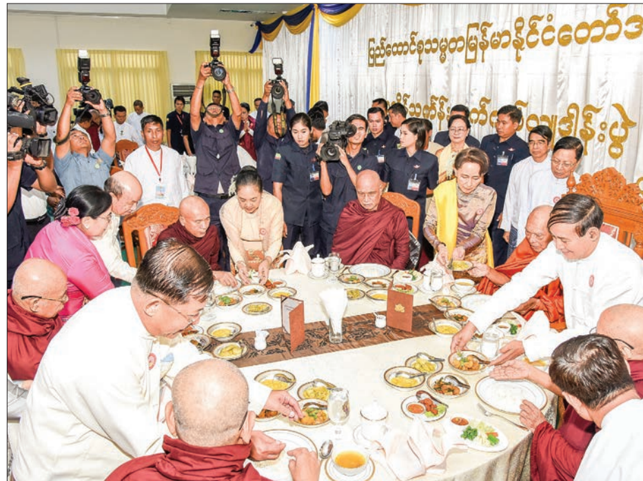
President U Win Myint, First Lady Daw Cho Cho, and State Counsellor Daw Aung San Suu Kyi, and attendees offer soon to the Members of the Sangha at the Kathina Robe Offering Ceremony in Nay Pyi Taw.

After the event, President U Win Myint, First Lady Daw Cho Cho, State Counsellor Daw Aung San Suu Kyi and guests offered soon to the Members of the