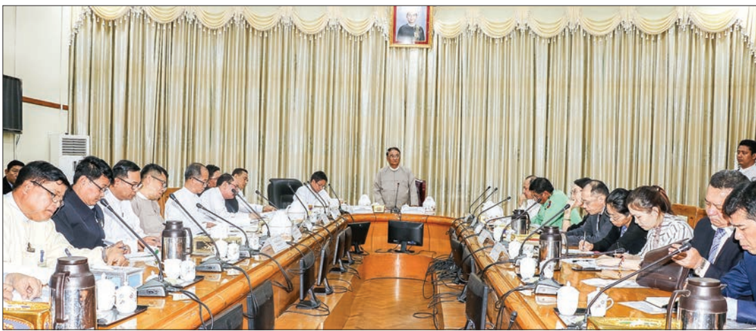
Union Minister Dr. Than Myint delivers the speech at the coordination meeting with officials from the People's Republic of China yesterday.

DR. THAN MYINT, the Union Minister for Commerce, attended a coordination meeting with officials from the People's Republic of China at his ministry yesterday, where they discussed opening the Kyin San Kyawt border gate in order to facilitate smoother trade between Myanmar and China.