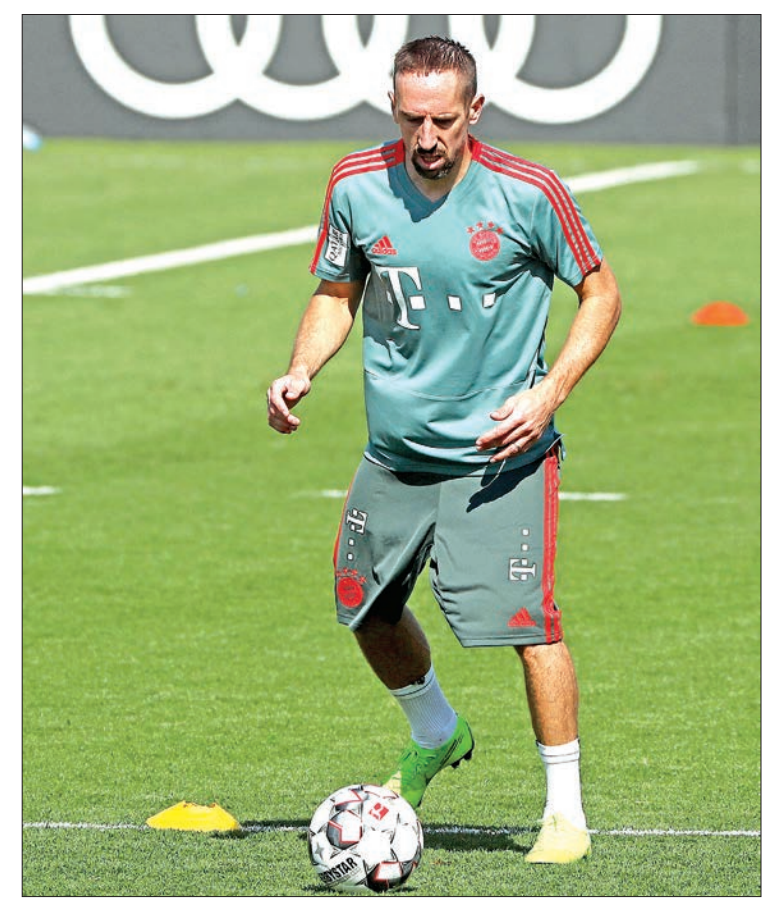
FC Bayern Munich's French midfielder Franck Ribery takes part with other teammates in a training session during their winter training camp at the Aspire Academy for Sports Excellence in the Qatari capital Doha on 5 January, 2019.

Bayern and Rummenigge have also been on the defensive recently after criticism from some of the club's own fans over the decision to return to Qatar for winter training.—AFP■