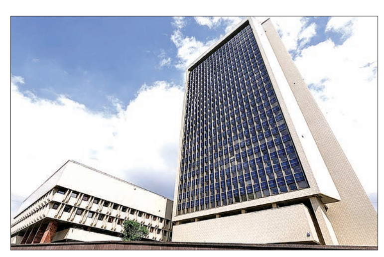
Roscosmos.

He also declared that the Trump Administration had made