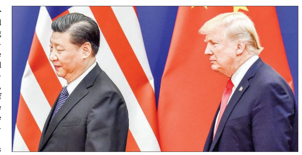
File photo taken in November 2017 shows US President Donald Trump (r) and Chinese President Xi Jinping at the Great Hall of the People in Beijing.

With trade tensions between the two powers escalating, stock prices have faced downward pressure across the globe and fears have grown that weakness in the Chinese and US economies could