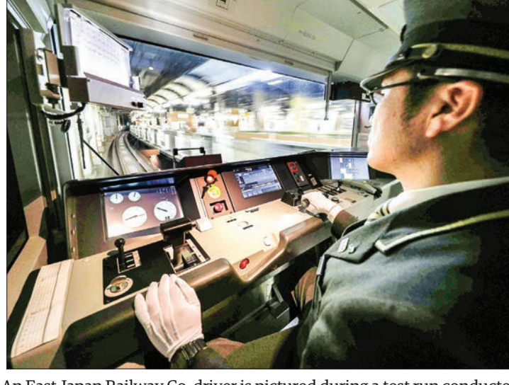
An East Japan Railway Co. driver is pictured during a test run conducted on Tokyo's Yamanote loop line in the early hours of 7 January 2019 to check its self-driving system.

The train started moving after the driver simply pushed