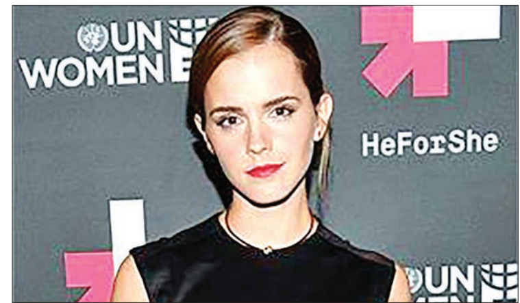
Emma Watson.

"I hope that more people will be inspired by the #TIME-SUP anniversary to give at home here in the UK, so the Justice and Equality Fund can reach even more under-resourced organisations and campaign groups in 2019," the actor wrote.—PTI ■