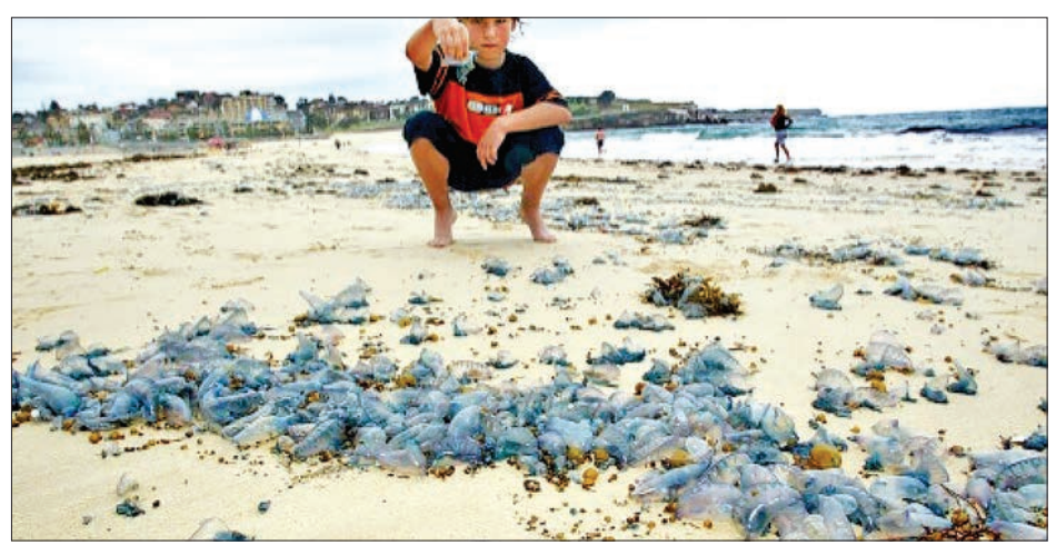
Bluebottle stings are a frequent occurrence in Australia Bluebottle stings are a frequent occurrence in Australia.

"A wall of bluebottles is approaching #Rainbow beach. Lifesavers are clos-