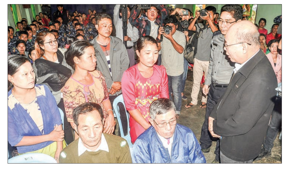
Deputy Minister U Khin Maung Tin consoles families of police personnel who were killed in action during the attacks on police outposts by AA terrorist insurgents.

Later in the afternoon, the Deputy Minister went to the office of No. 3 Border Guard Police Force to