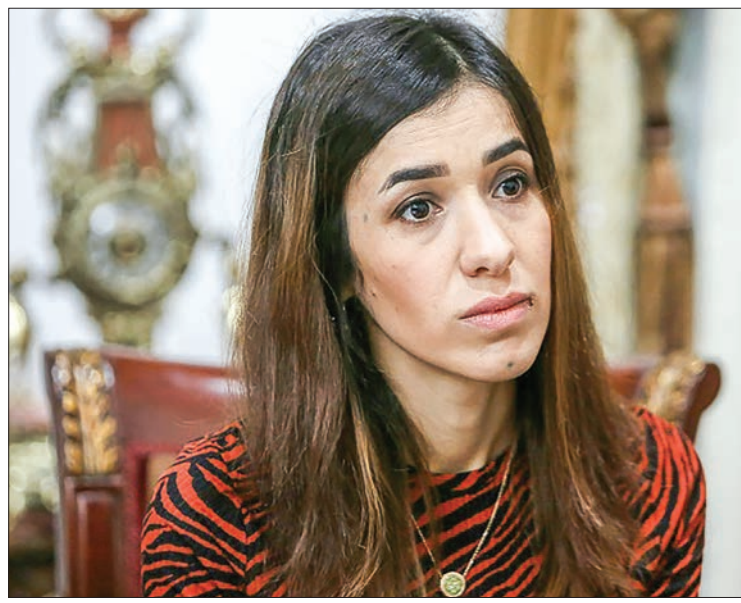
Iraqi Nobel laureate Nadia Murad (pictured December 2018) was the victim of human trafficking for sexual exploitation, but trafficking is also used to "finance activities" or increase workforces.

role of groups involved in various armed conflicts in using human trafficking "to finance activities or increase their workforce", as well as for sexual slavery.