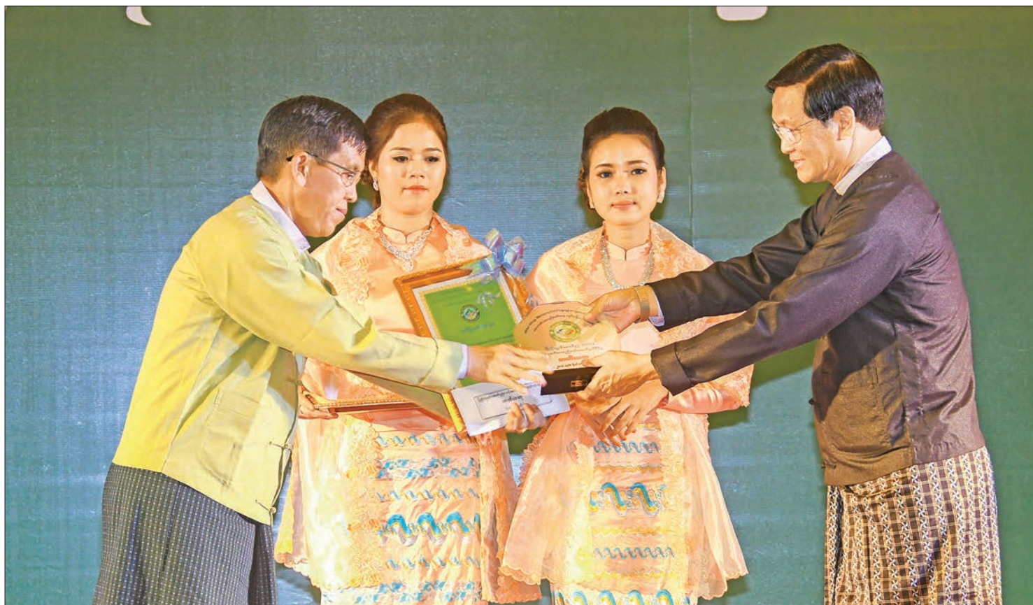
Vice President U Henry Van Thio presents honorary prizes to the One Stop Shops with outstanding performance for public services of the General Administration Department at the ceremony to celebrate the 30 th anniversary re-establishment of the department in Nay Pyi Taw.

Avoid corruption to increase public trust: U Henry Van Thio