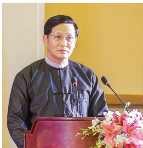
Vice President U Henry Van Thio delivers a speech at the 30 th anniversary celebration of the General Administration Department.

“You are obliged to fulfill the needs of the people, in accordance with the law. At the