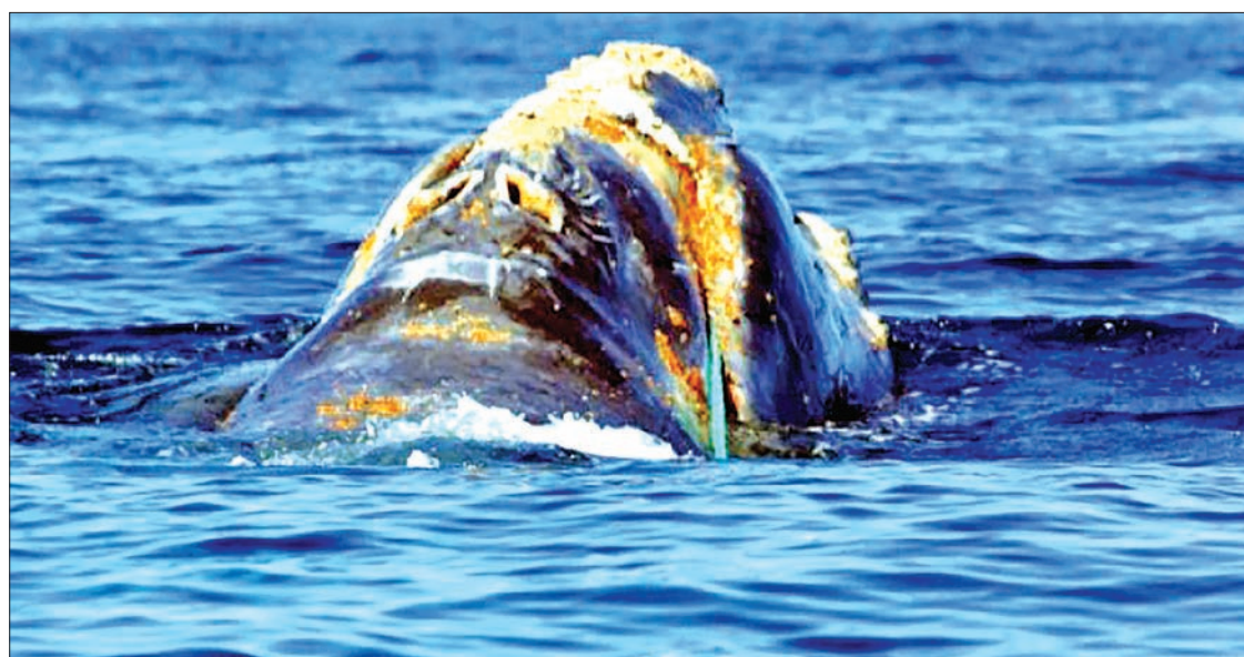
This endangered North Atlantic right whale is entangled in heavy plastic fishing link off Cape Cod, Massachusetts.

would be twice as many female whales: "The general slope of the recovery trajectory is driven by female mortality," they added.