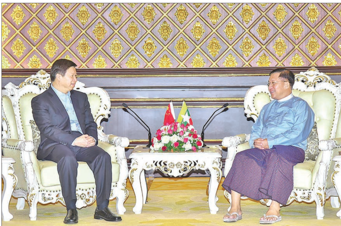
Senior General Min Aung Hlaing meets Mr. Song Tao, Minister of the International Department of the Communist Party of China, in Nay Pyi Taw yesterday.