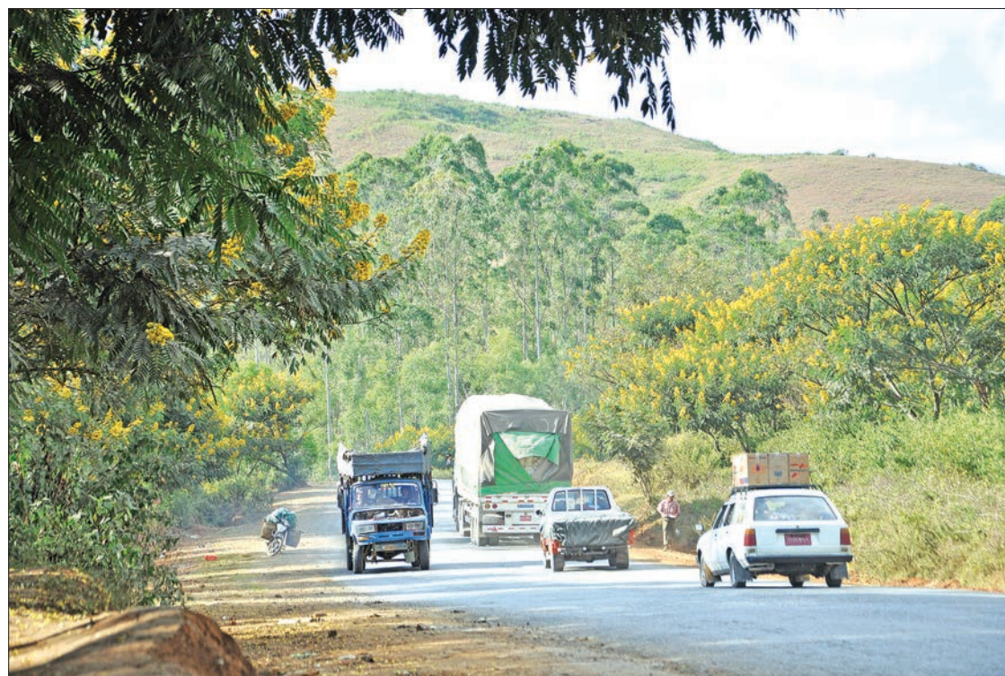
Vehicles run near the 105-mile Muse Border Trade Zone in northern Shan State. Muse is the major border trade gate in Myanmar, conducting the largest trade volume.

Sino-Myanmar border trade was worth $279.7 million at Muse, $3.5 million at Lwejel, $30.5 million at Chinshwehaw, $2.82 million at Kanpikete and