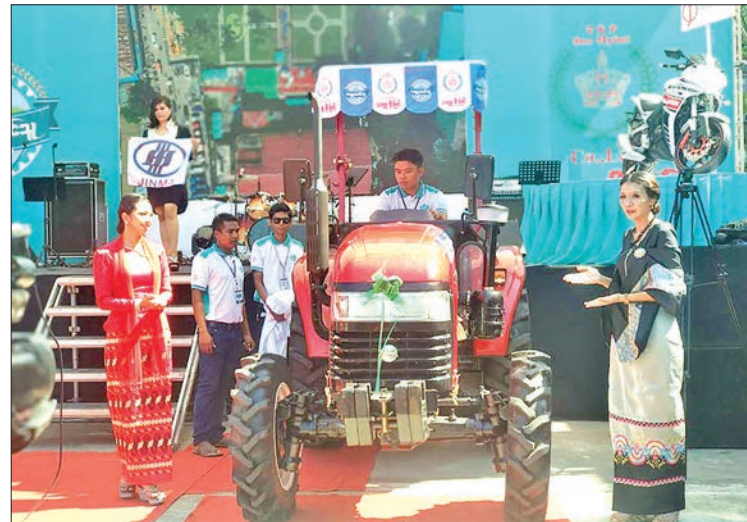
A technician demonstrates a tractor at the Tharaphu Farmers Festival held in Pathein, Ayeyawady Region.