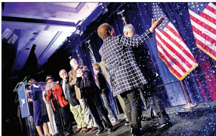
Democrats celebrate a projected Democratic Party takeover of the House of Representatives during a midterm election night party hosted by the Democratic Congressional Campaign Committee on 6 November, 2018 in Washington, DC.

Tuesday's contest saw several historic firsts in the Democratic camp: in Kansas Sharice Davids — an attorney and former mixed martial arts fighter — became the first Native American woman elected to Congress.