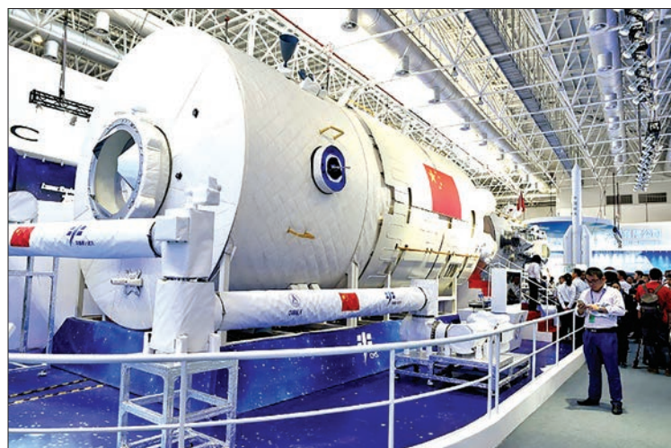
China says its space station will be open to all countries.