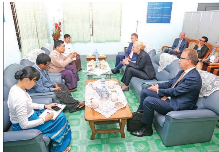
Union Minister Dr. Win Myat Aye meets with Dutch Foreign Trade Minister Mrs. Sigrid Kaag in Yangon yesterday.