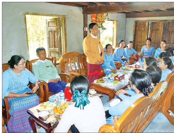
A meeting for opening of the child protection office held in Hpa-an Township in Kayin State yesterday.

WITH the aim of reducing the percentage of orphans and protecting children, a ceremony marking the opening of the child protection office was held at 1 p.m. yesterday in Khaymar Street, 5 th Ward in Hpa-an Township.