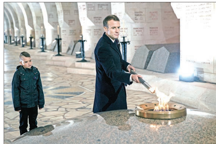
French President Emmanuel Macron (r) lights the flame to pay his respect at the Douaumont Ossuary as part of ceremonies marking the centenary of the First World War, in Douaumont, eastern France on 6 November, 2018.

"But there's a massive gap between the European defence that Emmanuel Macron dreams about and the reality of very powerful disagreements between European partners." —AFP ■