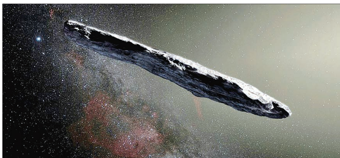
This photo released by the European Southern Observatory on 20 November, 2017 shows an artist's impression of the first interstellar object known to enter our solar system: Oumuamua.