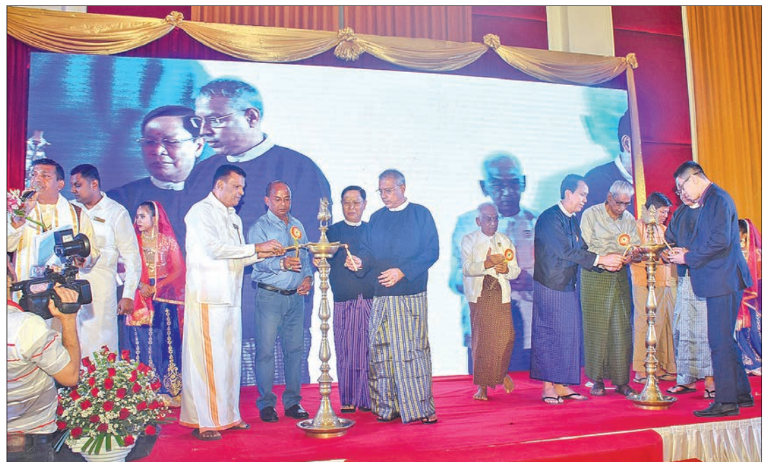
Union Minister for Religious Affairs and Culture Thura U Aung Ko, Yangon Region Chief Minister U Phyo Min Thein and officials attend the celebration of the 2018 Deepavali festival in Yangon.

Hindu traditional dances and Indian songs and dances were also performed at the festival. —MNA(Translated by Kyaw Zin Tun) ■