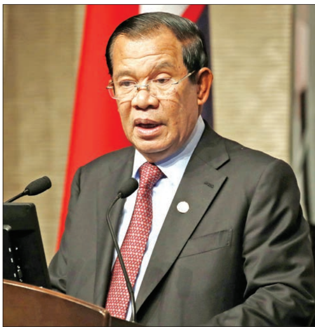
Cambodian Prime Minister Hun Sen delivers a speech during a business forum in Tokyo on 9 October, 2018.

“The release — attributable only to inter-