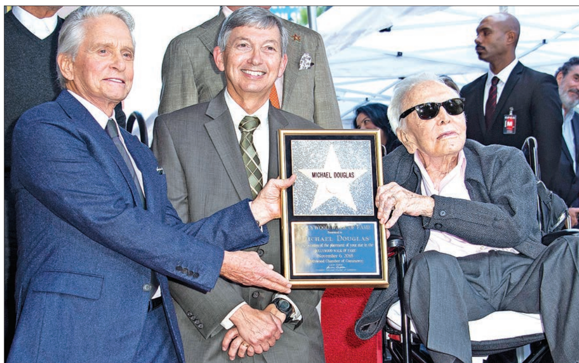
Actor Kirk Douglas (R) attends a ceremony honoring his son actor Michael Douglas (L) with a Star on Hollywood Walk of Fame, in Hollywood, California on 6 November, 2018.