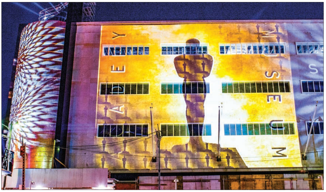
View of the fully restored building facade of the Academy Museum of Motion Pictures' future home.

SOCIAL 15 DECEMBER 2018 THE GLOBAL NEW LIGHT OF MYANMAR