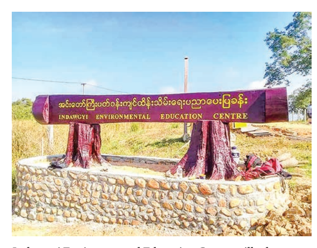
Indawgyi Environmental Education Centre will educate the public about the environment.