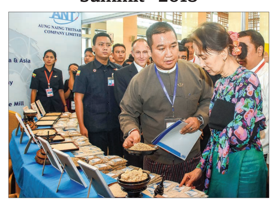
State Counsellor Daw Aung San Suu Kyi observes ANT booth displayed at 3<sup>rd</sup> Myanmar Entrepreneurship Summit 2018 in Nay Pyi Taw yesterday.

TATE Counsellor Daw Aung San Suu Kyi addressed the 3rd Myanmar Entrepreneurship Summit - 2018 organized by Myanmar Young Entrepreneurs Asa.m. yesterday.