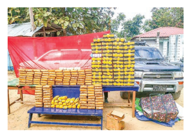
Heroin, yaba pills and opium confiscated by police in Hopin.