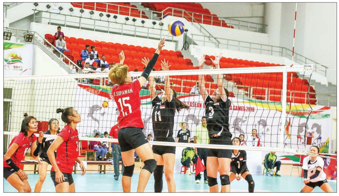
Thailand and Singapore compete in the final of women's volleyball competition.

MYANMAR secured the gold medal in the 1000-meter women's traditional boat race and took the bronze medal in men's volleyball at the 19<sup>th</sup> ASEAN University Games in Nay Pyi Taw yesterday.