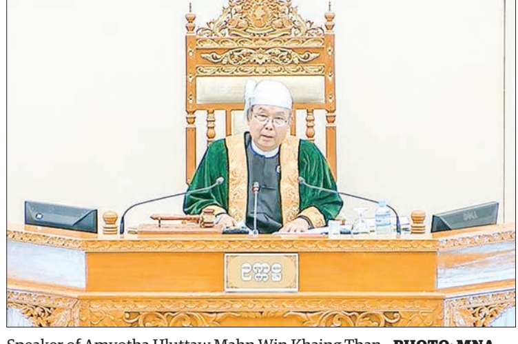
Speaker of Amyotha Hluttaw Mahn Win Khaing Than.

U Zung Hlei Thang of Chin State constituency 4 asked the