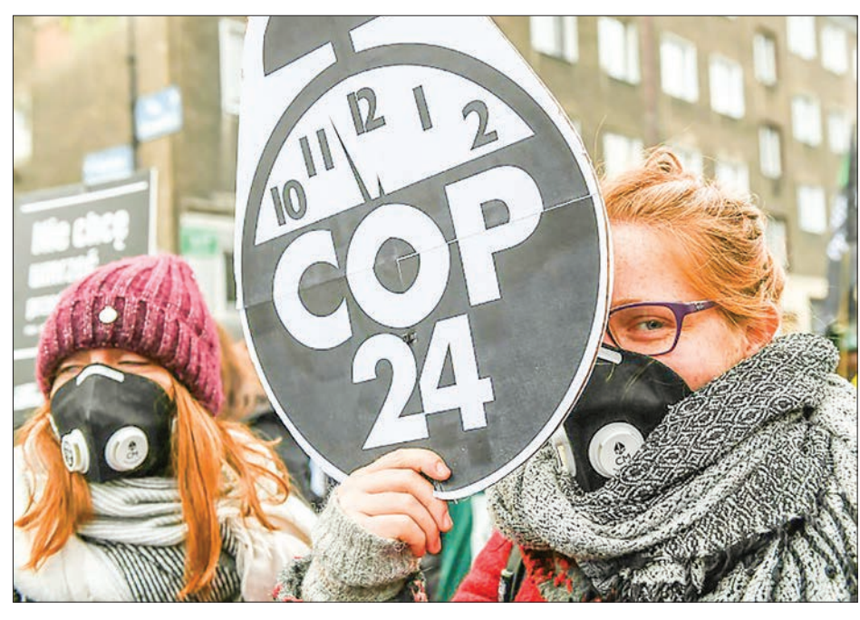
UN climate change negotiations in Poland remain deadlocked.

The treaty, already ratified, goes into effect in 2020. Among the more nettlesome issues is how nations report progress in