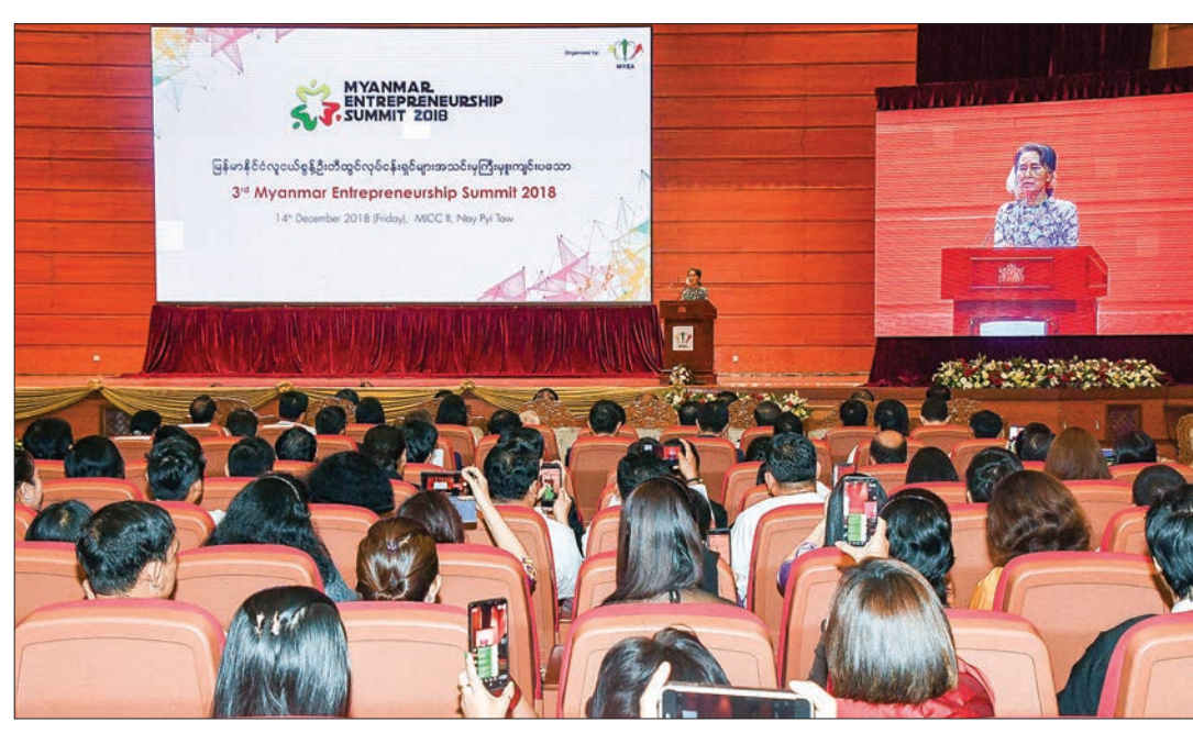
State Counsellor Daw Aung San Suu Kyi addresses the 3<sup>rd</sup> Myanmar Entrepreneurship Summit - 2018 in Nay Pyi Taw yesterday.

"I want the young entrepreneurs in our country to develop the nation in a way that is unique and different from other countries. I have to say I adore the dance performance from the group of youths from earlier. Basically, it is our Myanmar culture and dance but they performed it in a way that