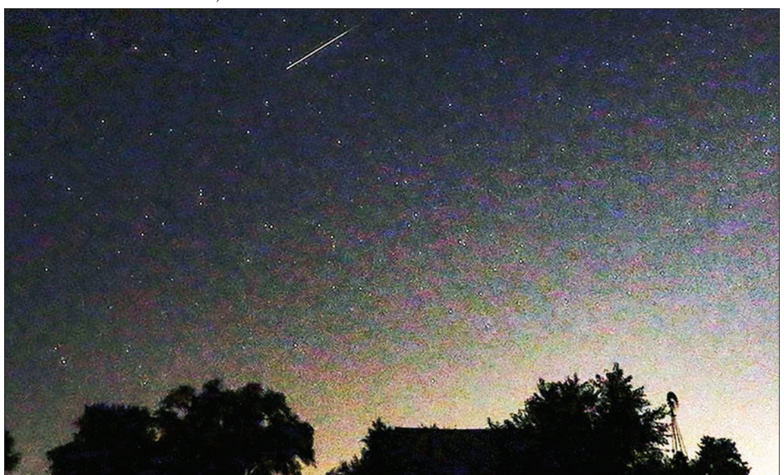
The comet will be seen in the form of a green small cloud, one would see it at nights over the southern horizon.

The Wirtanen comet (46P/ Wirtanen) with a 1.2-km nucleus was discovered on 17 January, 1948 by American Carl Wirtanen.—Tass ■