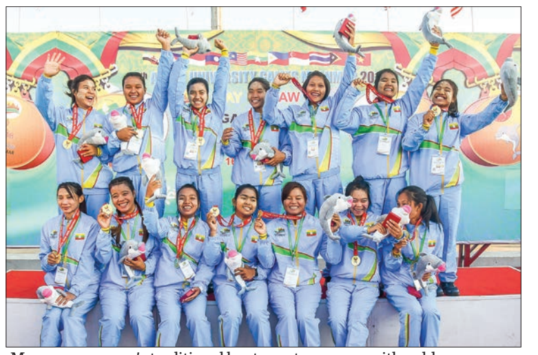
Myanmar women's traditional boat race team seen with gold medals.