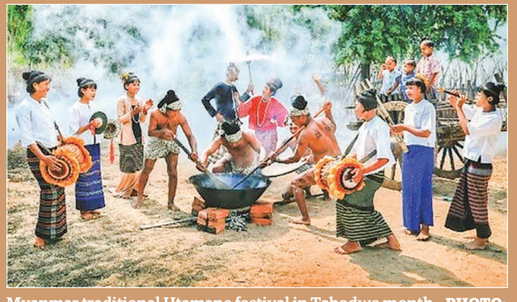
Myanmar traditional Htamane festival in Tabodwe month. PHOTO

(Excerpt from the speech by Bogyoke Aung San on the Congress at Shwedagon Pagoda on 20 August 1946.)