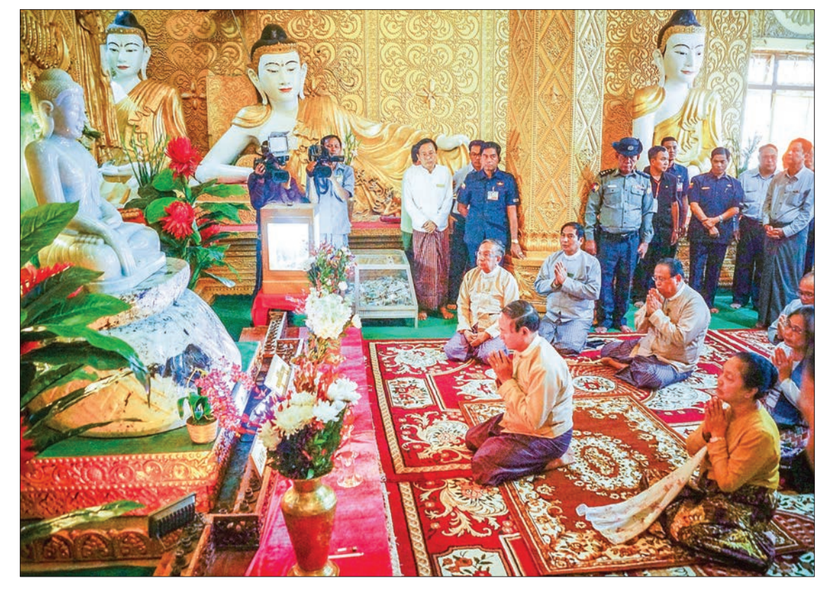
President U Win Myint and First Lady Daw Cho Cho pay homage to Kyaikthanlan Pagoda in Mawlamyine, Mon State, yesterday.

Speaking at the meeting President U Win Myint first explained about the aim of visiting Mon State. The essence of his inaugural speech delivered during the swearing in as the President in the Pyidaungsu Hluttaw was the requirement of changing the rigid mindset and habits of the people, government servants and public servants for a successful transformation process in the democracy transition period. Departmental organizations slow in reforming were to be given tighter management. The Judicial sector needed to be true and correct. Corruption needed