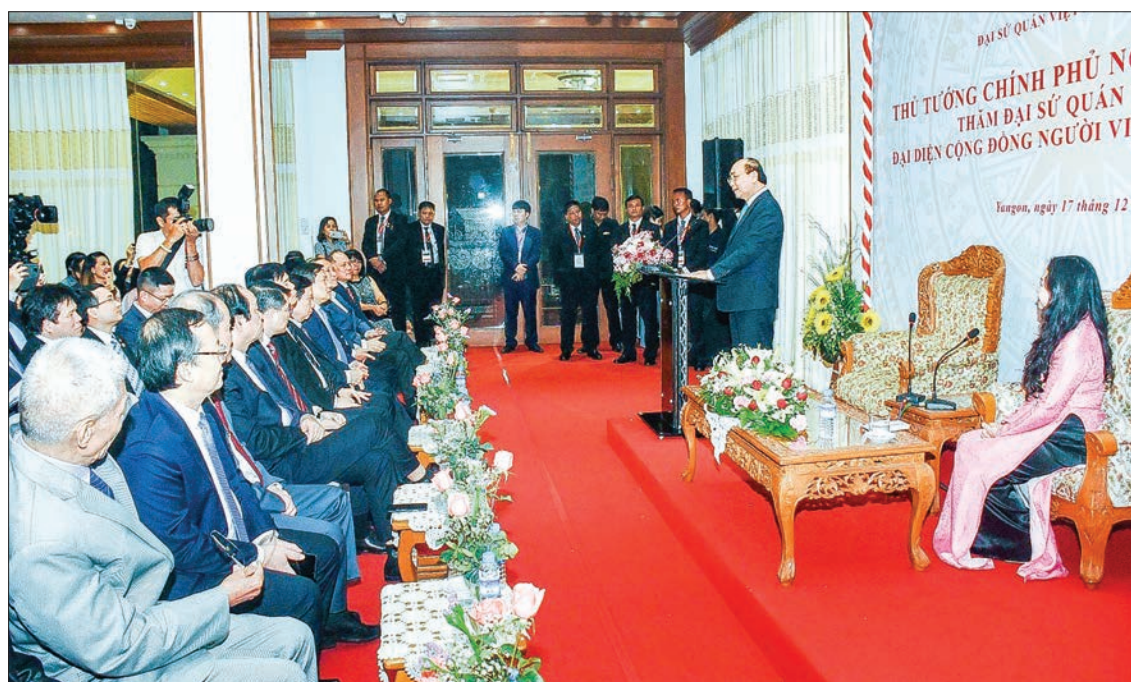
Prime Minister Nguyen Xuan Phuc of the Socialist Republic of Viet Nam delivers the speech at the Vietnamese Embassy in Myanmar yesterday.

In the afternoon, the Prime Minister and party en-