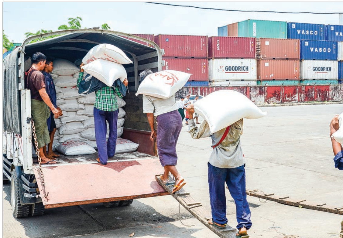
Workers loading the truck with sacks of rice at Botataung Jetty in Yangon.

At present, rice is being exported to China through a government-to-government (G2G) agreement and a barter system, in exchange for Chinese goods.