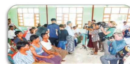
Media Access to Shwezar Village from 29 to 31 August 2019

Local and international media tours were arranged as follows to Rakhine State for media access.