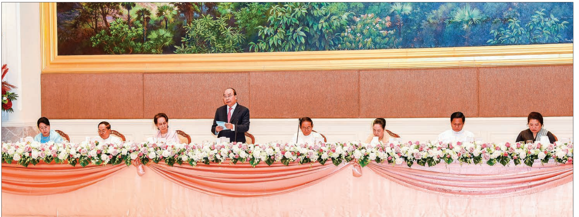
President U Win Myint and First Lady Daw Cho Cho attend the luncheon for Prime Minister Nguyen Xuan Phuc of the Socialist Republic of Viet Nam yesterday.