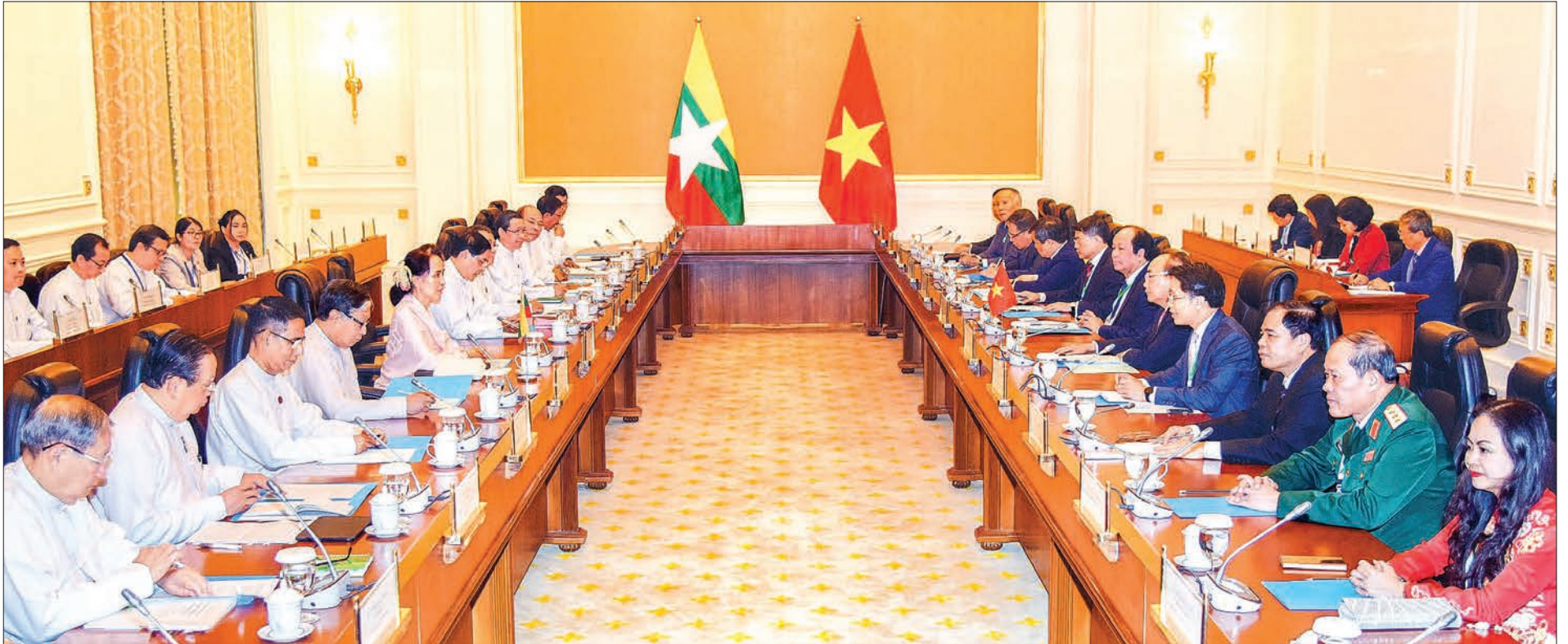
State Counsellor Daw Aung San Suu Kyi and Prime Minister Nguyen Xuan Phuc of the Socialist Republic of Viet Nam attend the senior-level meeting of the two countries.