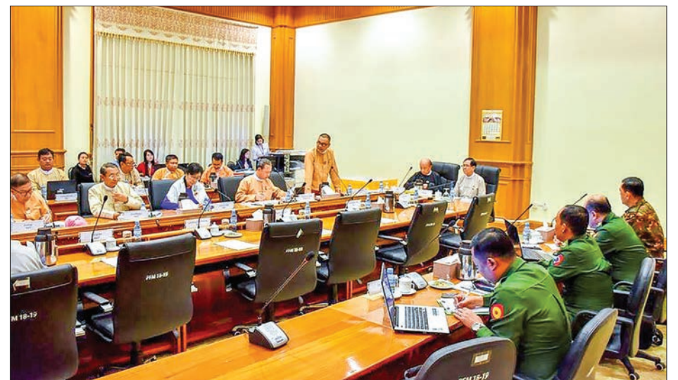
The meeting of Joint Committee on Amending the 2008 Constitution being held in Nay Pyi Taw yesterday.

JOINT Committee on Amending the 2008 Constitution held its meeting 70/2019 at the Hluttaw Building in Nay Pyi Taw yesterday.