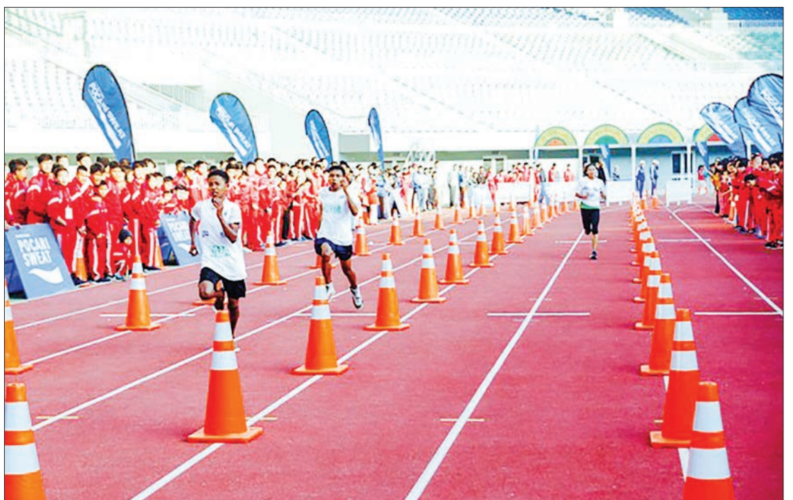
Athletes competing in the previous version of the Mandalay Mayor's Mini Marathon in Mandalay.

Prizes will be presented to outstanding athletes in the 13-mile marathon. The winner will be awarded K6 million, while the second place winner will get K4 million, and the third place winner will be