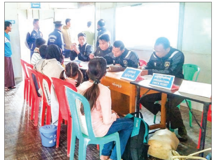
Four men and five women return on their own volition to Taung Pyo Letwe Reception Centre in Maungtaw on 17 December. PHOTO: MNA

A total of 9 persons, four men and five women, comprising two families returned on their own volition to Taung Pyo Letwe Reception Centre in Maungtaw Township, Rakhine State at 8: 15 am on 17 December morning.