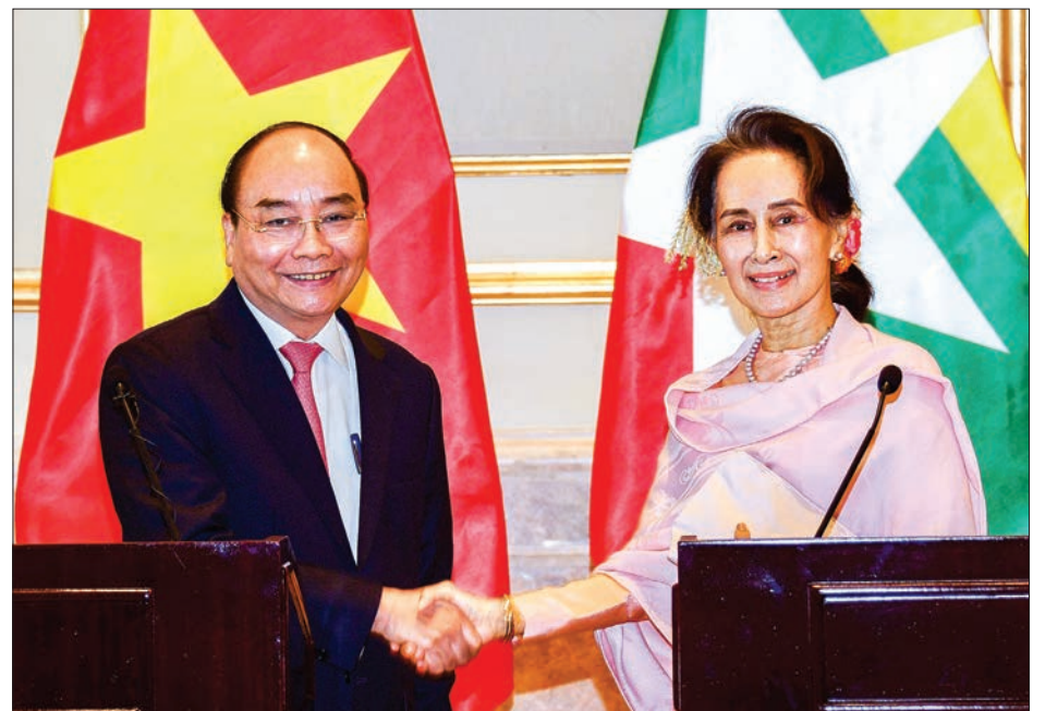
State Counsellor Daw Aung San Suu Kyi shakes hand with Prime Minister Nguyen Xuan Phuc of the Socialist Republic of Viet Nam at the press conference.