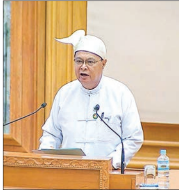
MP U Stephen.

AT the 14 th day meeting of the Second Pyidaungsu Hluttaw's 14 th regular session held yesterday a report of Joint Committee on Scrutinizing the second Bill Amending the Constitution and exemption of special commodity and commercial tax on import of six bullet proof Toyota Landcruiser cars were approved by the Hluttaw.