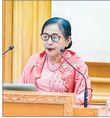
MP Daw Ohn Kyi.