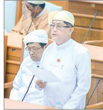
Deputy Minister for Planning, Finance and Industry U Maung Maung Win.

Hluttaw Speaker announced for Hluttaw representatives who want to discuss the matter to register their names.