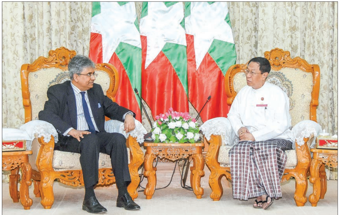
Union Election Commission Chairman U Hla Thein holds talk with Indian Ambassador Mr Saurabh Kumar in Nay Pyi Taw yesterday.

At the meeting, they discussed preparations for the 2020 general elections, conducting capacity building courses for staff of the UEC being conducted by the UEC and the India's Election Commission, the Election Law and its rules, amending the Codes of Conducts for political parties and candidates, media ethics and security ethics for the general elections, plans for formation of security management committee for the general elections and negotiation committee and suggestions for using IT technology in future general elections.—MNA