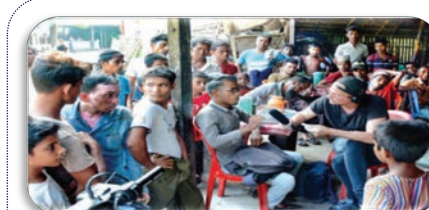
Media Access to Thechaung IDP Camp from 28 to 30 May 2019

Access to Rakhine State for local and international news media