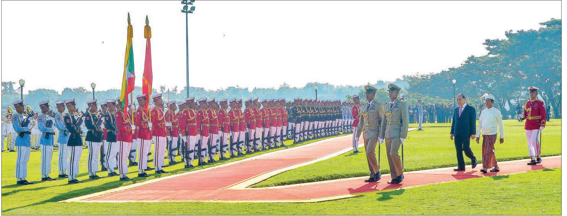
President U Win Myint and Prime Minister Mr Nguyen Xuan Phuc of the Socialist Republic of Viet Nam inspect the Guard of Honour in Nay Pyi Taw yesterday.