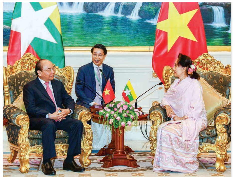
State Counsellor Daw Aung San Suu Kyi holds talk with Prime Minister Nguyen Xuan Phuc of the Socialist Republic of Viet Nam at the Presidential Palace in Nay Pyi Taw yesterday.

S TATE Counsellor received Prime Minister Nguyen Xuan Phuc of the Socialist Republic of Viet Nam at the Credentials Hall of the Presidential Palace in Nay Pyi Taw yesterday morning.