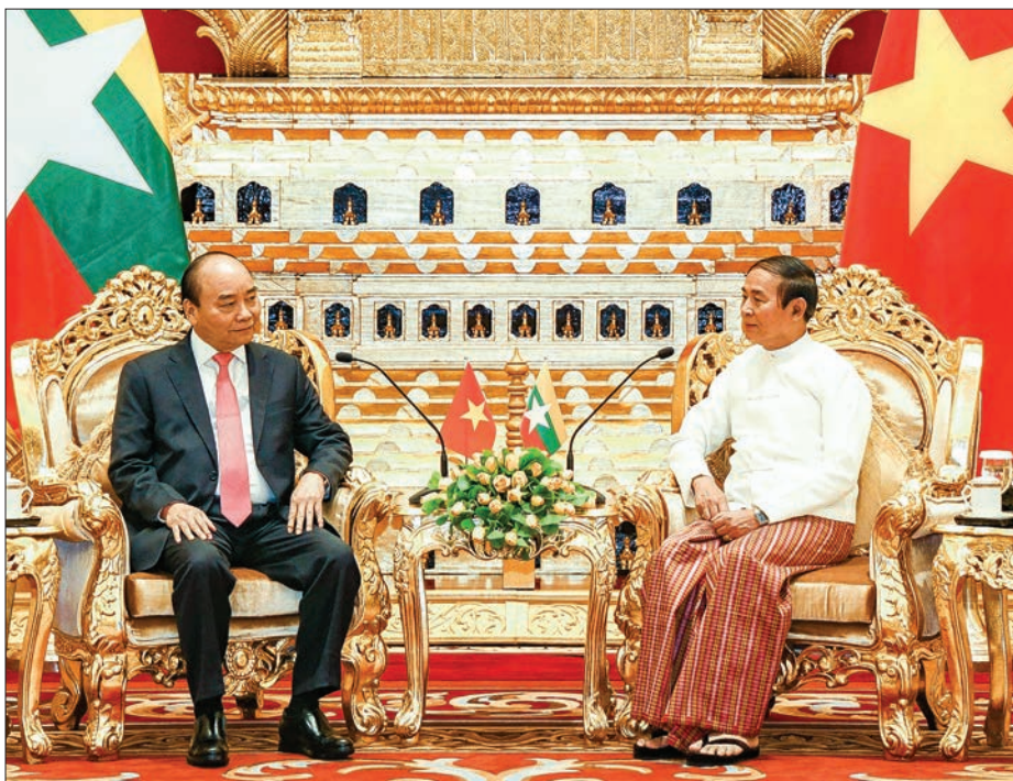
President U Win Myint holds talk with Prime Minister Nguyen Xuan Phuc of the Socialist Republic of Viet Nam at the Presidential Palace in Nay Pyi Taw yesterday.

P RESIDENT U Win Myint welcomed Prime Minister Nguyen Xuan Phuc of the Socialist Republic of Viet Nam, who is making an official visit in Myanmar at the invitation of Myanmar President and First Lady, at the Presidential Palace in Nay Pyi Taw yesterday morning.