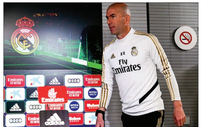
Real Madrid's French coach Zinedine Zidane arrives for a press conference at the Real Madrid City sports facilities in Madrid on December 17, 2019, on the eve of their Spanish League football match against Barcelona FC.

Zidane added: "We never thought this game would not go ahead. What we have to do is put all our energy into the match because the rest, we could spend a week talking about it." — AFP ■