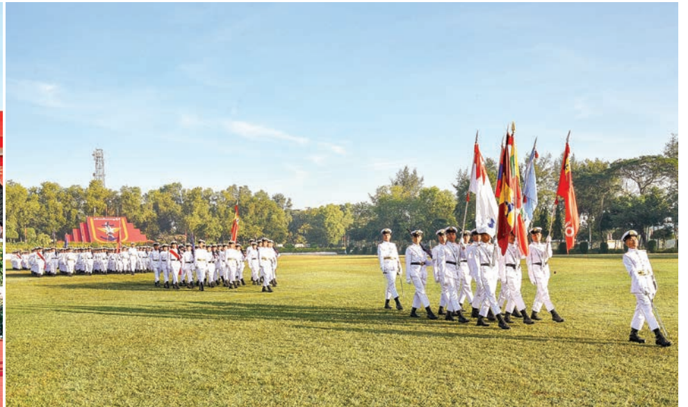
Commander-in-Chief of Defence Services Senior General Min Aung Hlaing takes the salute of the cadet companies at the graduation parade of the 20 th Intake of Defence Services Medical Academy in Yangon yesterday.

THE graduation parade of the 20 th Intake of Defence Services Medical Academy was staged at its parade ground in Yangon yesterday morning.