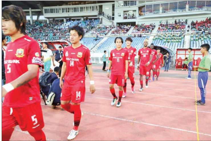
Shan United players (red jersey) seen at the match against Yangon United in the previous season of Myanmar National League.

2018-2019 season of the Myanmar National League with a no-loss result and Ayeyawady United had finished the season as the first runner-up, trailing Shan United by two points.