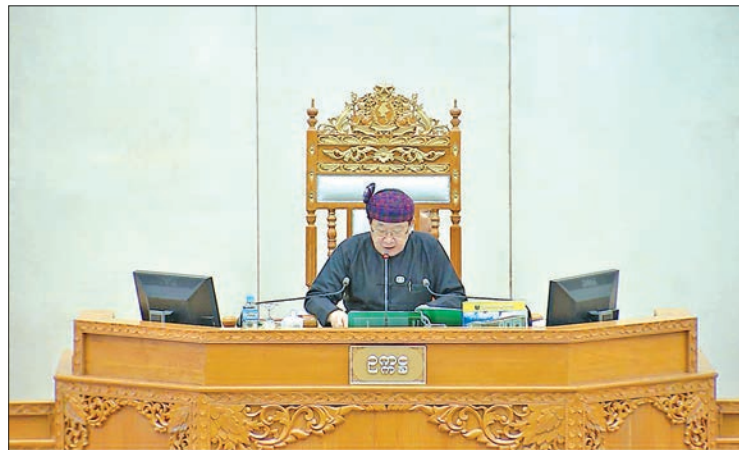
Pyithu Hluttaw Speaker U T Khun Myat. PHOTO: MNA

Next, Pyithu Hluttaw Natural Resources and Environmental