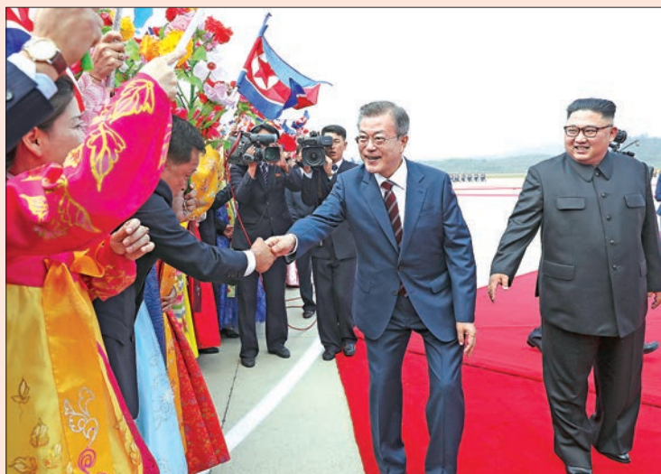
South Korean President Moon Jae-in (2 nd r) is welcomed by North Korean citizens as North Korean leader Kim Jong Un (r) looks on during a welcoming ceremony at Pyongyang airport on 18 September, 2018.

"I am acutely aware of the weight that we bear," Moon told Kim as they opened two