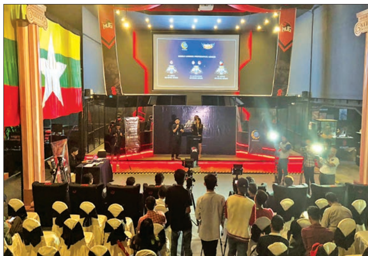
Press conference regarding Mobile Legends: Professional League (MPL) being held at the HOG e-Sports Center.

World Electronic Sports Game (WESG) and HOG e-Sports Center have collaborated in holding Myanmar's first-ever Team/Contestants Selection Competition in the annual WESG SEA 2018, in which Myanmar will be represented. HOG e-Sports Center, a Platinum Medal recipient, is the only and first-ever entrepreneurial e-Sports Center, and it was established by students from the Institute of Medicine 1, Yangon University for Foreign Languages and former students who completed their