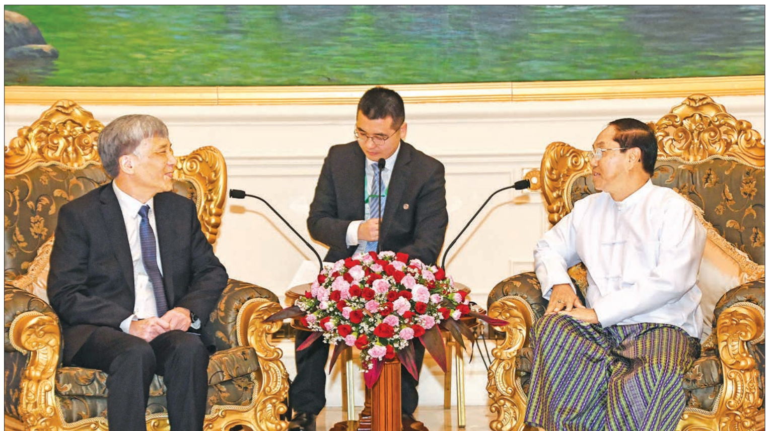
Vice President U Myint Swe holds talks with Mr. Ding Zhongli, Vice Chairman of Standing Committee of the National People's Congress of China, at the Presidential Palace in Nay Pyi Taw yesterday.