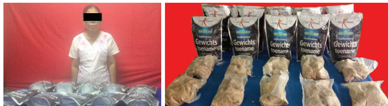
Daw Aye Thidar Tun is seen together with seizure found from the parcel and from her apartment.

troops in Kutkai, Shan State, discovered buried chemicals used for making drugs on 16 September. The seizures include ethyl ether weighing 2,520 liters, acetone weighing 1040 liters, and 400 litres of hydrochloric acid in four containers.— MNA ■