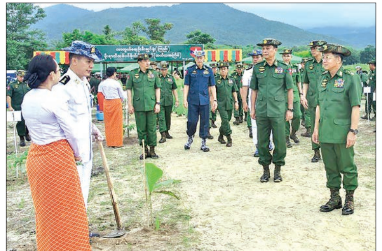
Senior General Min Aung Hlaing attends the third monsoon tree planting ceremony near Yezin Dam yesterday.