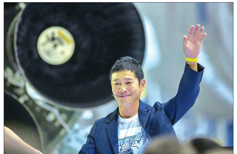
Japanese billionaire Yusaku Maezawa will be the first private passenger to fly around the Moon aboard the SpaceX BFR rocket.

“When you are pushing the frontier, it is not a sure thing. There is a chance something could go wrong.”