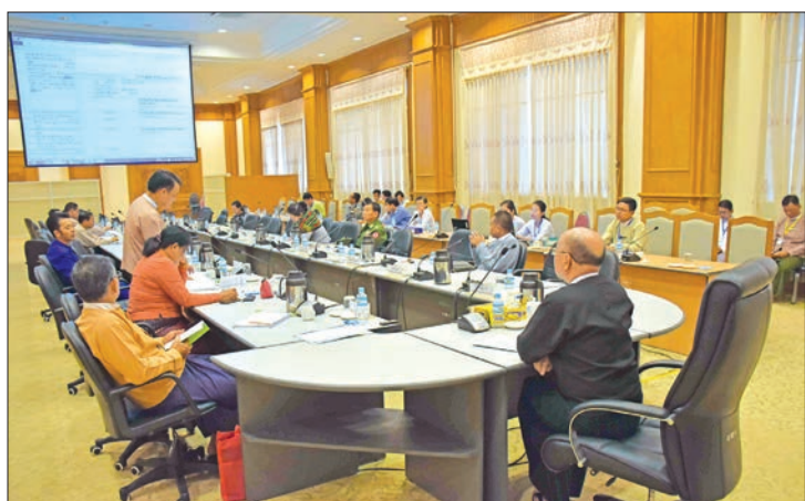
Pyidaungsu Hluttaw Joint Bill Committee holding meeting in Nay Pyi Taw yesterday.

THE Pyidaungsu Hluttaw Joint Bill Committee held a meeting over Fiscal Year 2018-2019 Tax Administration Bill at the Pyidaungsu Hluttaw Building D, second floor meeting hall, yesterday afternoon.