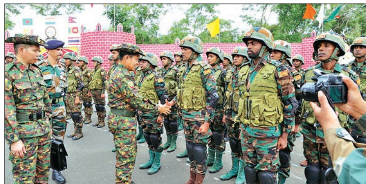
Vice Senior General Soe Win greets military troops from Myanmar in Pune, India.