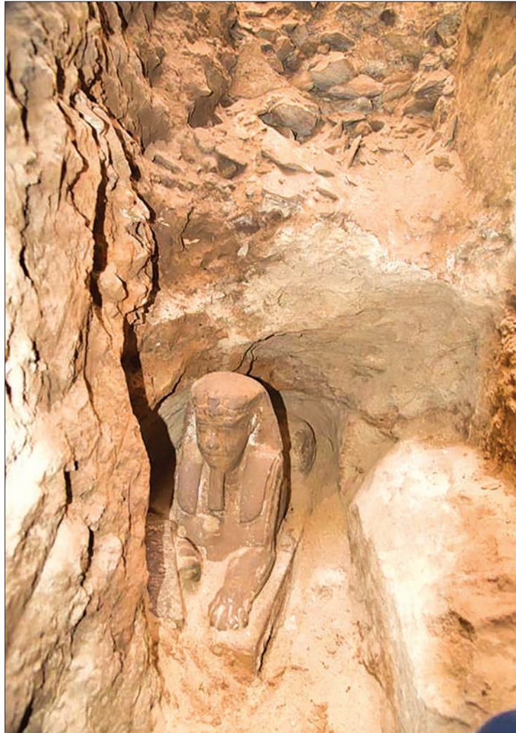
This undated photo shows a statue of Sphinx in the Temple of Kom Ombo in Aswan, Egypt. Egyptian Ministry of Antiquities said on Sunday an ancient sphinx statue was found in the Temple of Kom Ombo in Aswan, Egypt.

CAIRO — Egypt's antiquities ministry said on Sunday that it has uncovered a sandstone Sphinx statue during an excavation at the Kom Ombo Temple in Upper Egypt's province of Aswan.