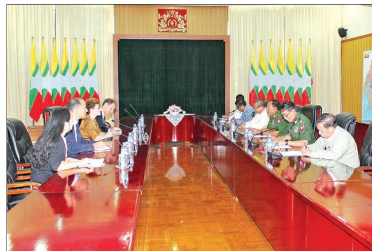
Union Minister Lt-Gen Ye Aung holds talks with World Bank's Country Director for Myanmar Ms. Ellen Goldstein yesterday.

UNION Minister for Border Affairs Lt-Gen Ye Aung received World Bank's Country Director for Myanmar Ms. Ellen Goldstein and party at Union Minister's meeting hall yesterday morning.