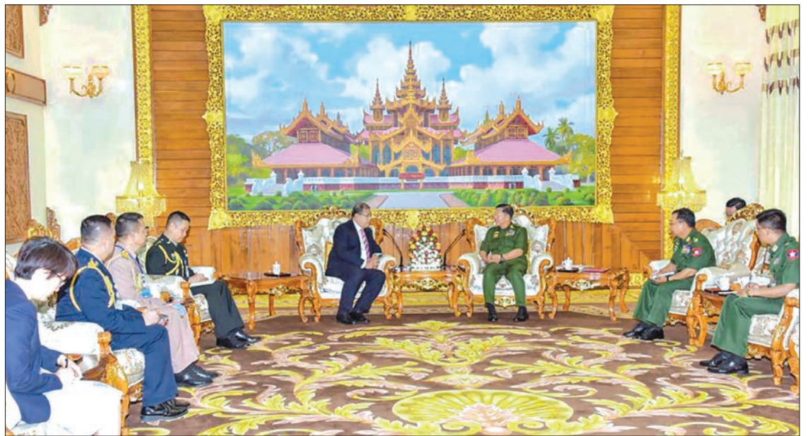
Senior General Min Aung Hlaing meets with Thailand Ambassador Mr. Jukr Boon-Long in Nay Pyi Taw.

between military forces of the two countries, providing protection to Myanmar migrant workers in Thailand, boosting the economy through cooperation in tourism sector, exchange of military medicines and agricultural science, border issue and peace and stability at the border areas between Myanmar and Thailand, according to news release of the Office of the Commander-in-Chief.—MNA ■