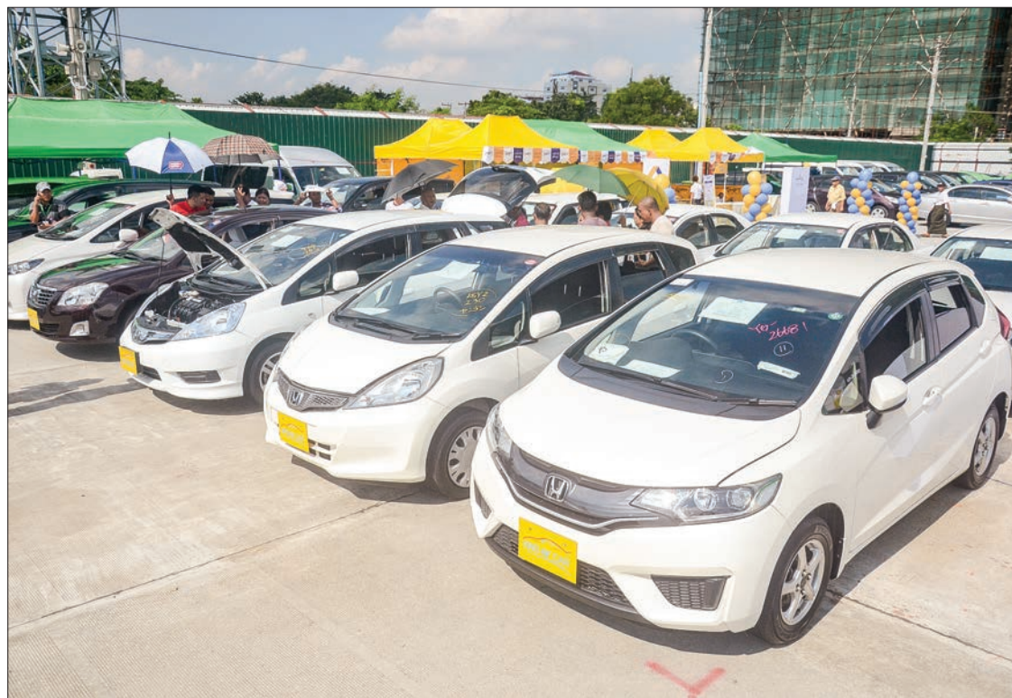
Right-hand drive cars on exhibition for sale in Yangon.

"As right-hand drive vehicles are fewer, their price is expected to rise in the market. Although, some buyers have shown an interest in purchasing completely knocked down (CKD) or semi knocked down