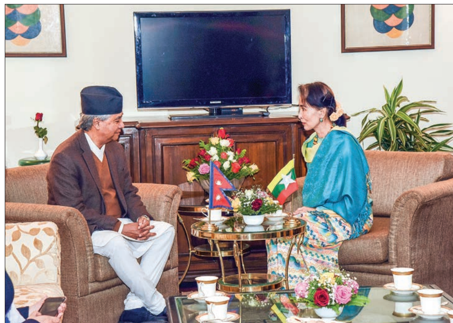
(Left), State Counsellor Daw Aung San Suu Kyi attends the dinner hosted in honour of heads of states and heads of governments attending the Asia-Pacific Summit 2018 at Soaltee Crowne Plaza Hotel in Kathmandu. (Right) State Counsellor Daw Aung San Suu Kyi meets with former Nepal Prime Minister and Congress Party Chairman Mr. Sher Bahadur Deuba.