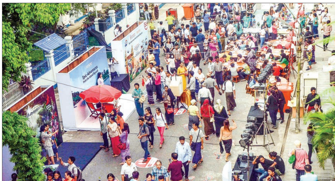
People visit the Singapore Festival 2018 which will be held from 30 November to 2 December.