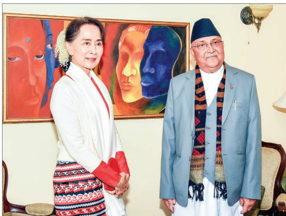
State Counsellor Daw Aung San Suu Kyi meeting with Prime Minister of Nepal Mr. K. P. Sharma Oli at Hotel Annapurna in Kathmandu.

Following this State Counsellor Daw Aung San Suu Kyi and Nepal Prime Minister Mr. K. P. Sharma Oli attended the memorandum of understanding signing ceremony between the two countries held at the hotel. At the ceremony Myanmar-Nepal memorandum of understanding on cooperation in trade and investment was signed and exchanged by Union Minister for International Cooperation U Kyaw Tin and Nepal Minister for Foreign Affairs Mr. Pradeep Kumar Gyawali in the presence of the State Counsellor and the Nepal Prime Minister.