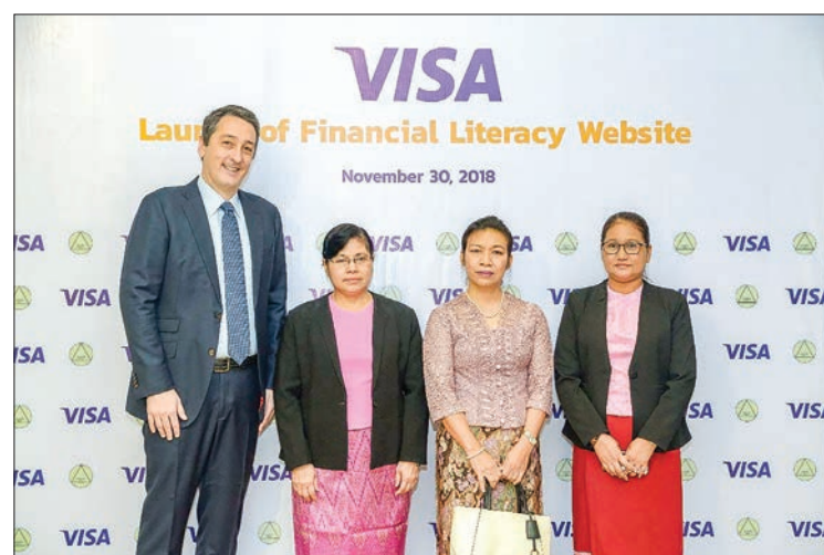
Officials take a photo at a ceremony to launch financial literacy website by VISA.

The ability to manage personal finance will benefit a person for a lifetime. We also hope the launch of our Practical Money Skills website will foster collaboration in financial literacy between public and private entities that will lead to open and