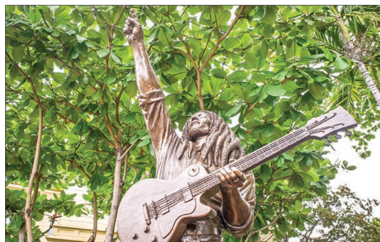
A statue of Jamaican Reggae legend Bob Marley welcomes visitors at his museum in Kingston on 30 June 2012.

Among the other additions Thursday were the ancient Irish sport of hurling, the spring rituals of Kazakh horse breeders, includ-