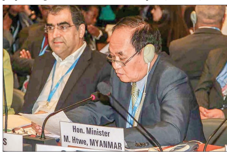
Union Minister for Health and Sports Dr Myint Htwe discusses at the 71 st World Health Assembly on 22 May, 2018, in Geneva, Switzerland to join "the Global HIV Prevention Coalition"

In 2017, 36.9 million [31.1 million-43.9 million] people globally were living with HIV and 21.7 million million people were accessing antiretroviral therapy. 1.8 million people became newly infected with HIV and 940 000 people died from AIDS-related illnesses. Every week, around 7000 young women aged 15-24 years become infected with HIV. The risk of acquiring HIV is 27 times higher among men who have sex with men; 23 times higher among people who inject drugs; 13 times higher for female sex workers; 12 times higher for transgender women. TB remains the leading cause of death among people living with HIV and TB