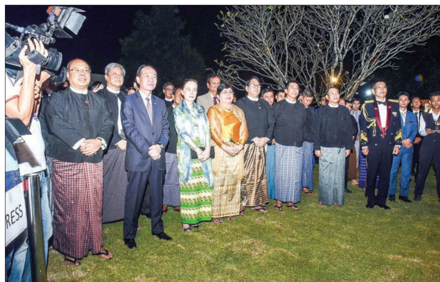
Union Minister U Kyaw Tint Swe, (Right), delivers a speech at the ceremony to mark the Japanese Emperor's birthday at the Japanese Ambassador's residence.

The ceremony was attended by the Union Minister for Information, Dr. Pe Myint, and