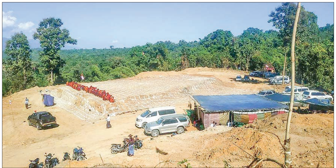
A compound seen, in which a jade pagoda will be built in Kachin State.

constructed on a one-acre land plot located at the summit of the old Buddhist monastery near the bottom of the Lwekham Mountain in Mawhan Village, Mohnyin Township. Gems and jewellers from Mawhan area