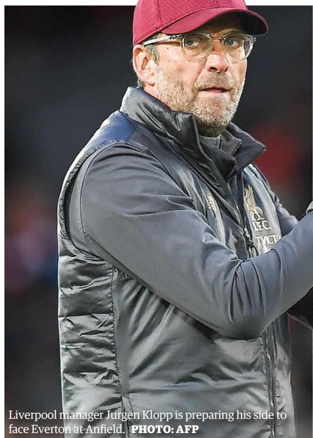
Liverpool manager Jurgen Klopp is preparing his side to face Everton at Anfield.

LONDON (United Kingdom) — Liverpool face a derby clash against Everton as they lick their Champions League wounds while Tottenham travel to Arsenal with a spring in their step on a weekend of big-city derbies.