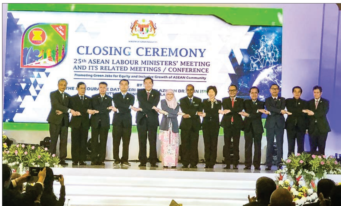
Union Minister U Thein Swe and ministers from ASEAN countries have the documentary photo taken in ASEAN way at closing ceremony of 25 th ASEAN Labour Ministers' Meeting in Kuala Lumpur.

Afterwards, the Union Minister attended the closing ceremony of the 25 th ALMM and its related meetings and returned to Myanmar in the evening. —MNA (Translated by Zaw Htet Oo)