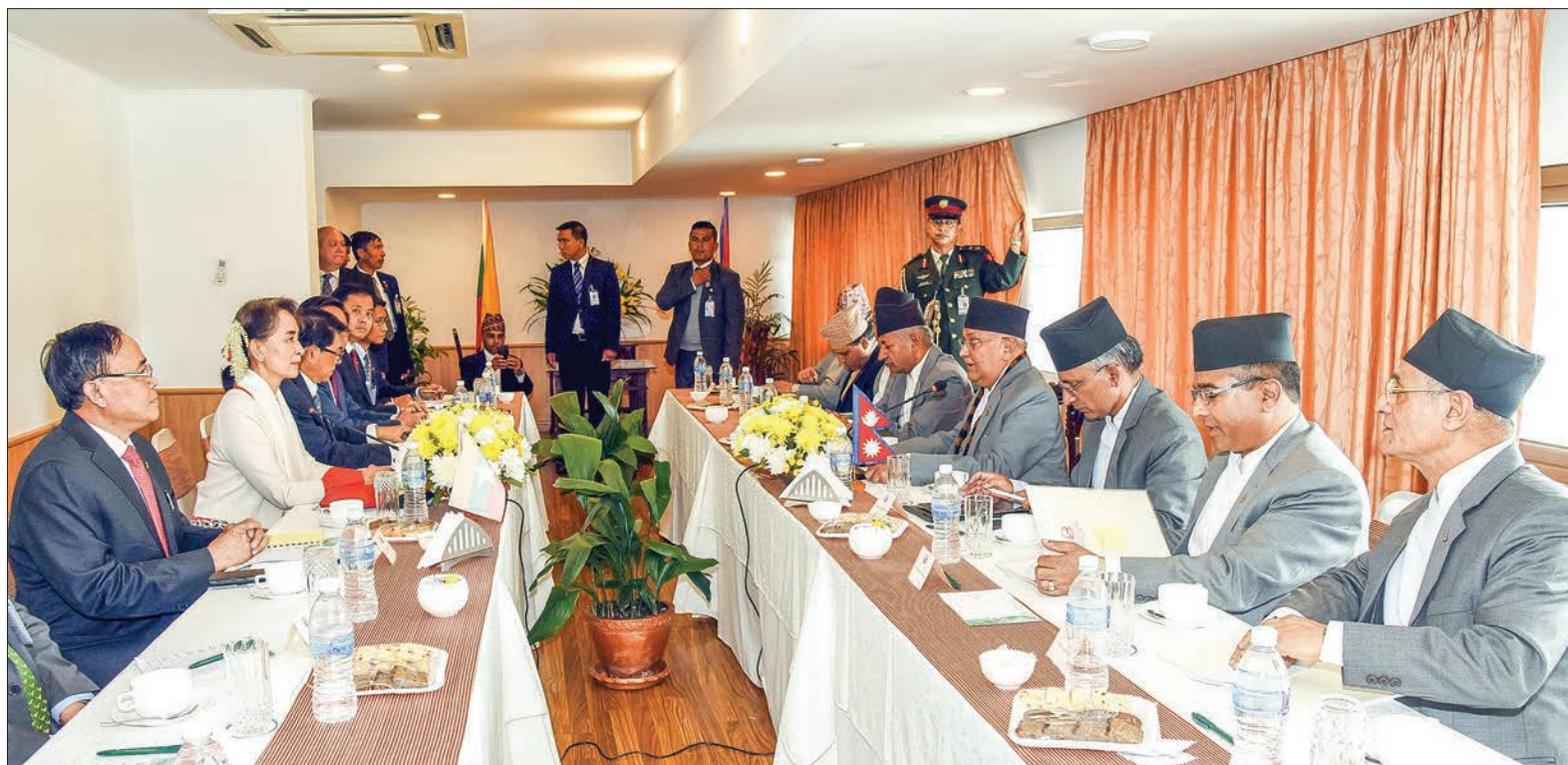
Myanmar and Nepal hold the bilateral meeting at Hotel Annapurna in Kathmandu, yesterday.

The State Counsellor was accompanied by Union Ministers U Min Thu and U Kyaw Tin, Deputy Minister U Aung Htoo, Myanmar Ambassador to Nepal and officials at the bilateral meeting.