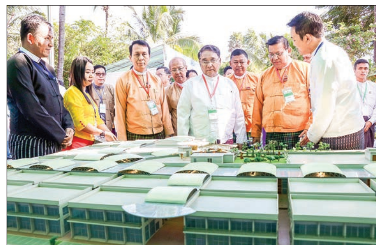
Union Minister Dr. Than Myint, and dignitaries view a scale model of a housing at Ayeyawady Region Investment Fair.

domestic and foreign entrepreneurs also attended the fair.—Zaw Gyi (Translated by Zaw Htet Oo)