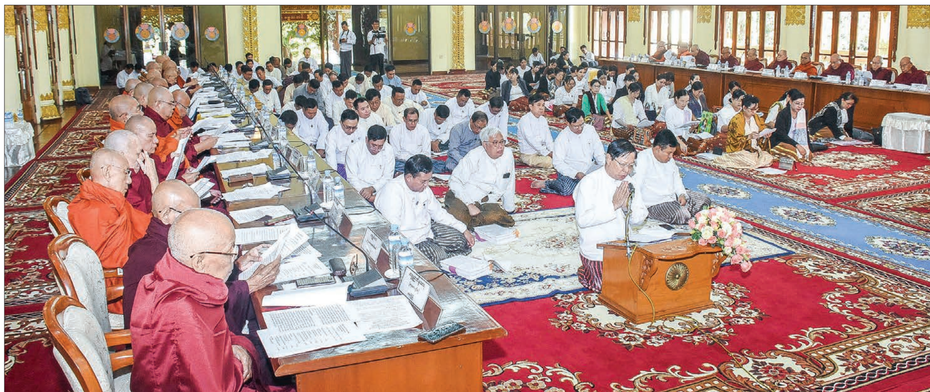
7 th State Sangha Maha Nayaka Committee holds its 47-member leading committee meeting in Yangon yesterday. (Upper). Union Minister for Religious Affairs and Culture Thura U Aung Ko supplicates matters related to religious affairs (Lower).