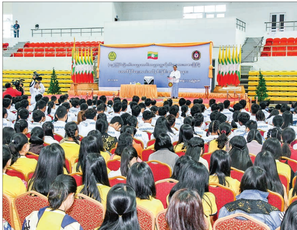
Vice President U Myint Swe addresses Myanmar university sports teams and attendants at the handing over ceremony of the victory flag for the 19 th ASEAN University Games.

He said Myanmar accepted the honor of hosting the AUG in that regard and has set the motto 'Youth and Friendship'. He said prominent sports competitions like the AUG also support