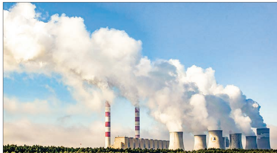
Poland currently uses coal to meet around 80 per cent of its energy needs and some 82,000 people work in the coal sector.

He points to the recent launch of the Ostrołęka coal-fired power plant by Energy Minister Krzysztof Tchórzewski, in a region