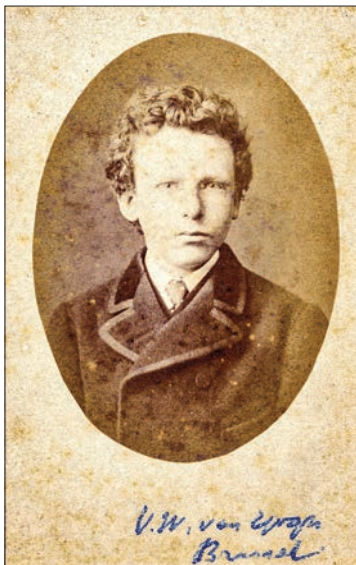
The picture of a teenaged Van Gogh, but which brother?

While Vincent Van Gogh is famed for his vividly-coloured, emotionally turbulent self-portraits in oils, he showed a surprising reluctance to be captured on camera. He committed suicide at the age of 37 in 1890 after an emotionally turbulent life, detailed in years of correspondence with Theo, an art dealer who supported the artist emotionally and financially.