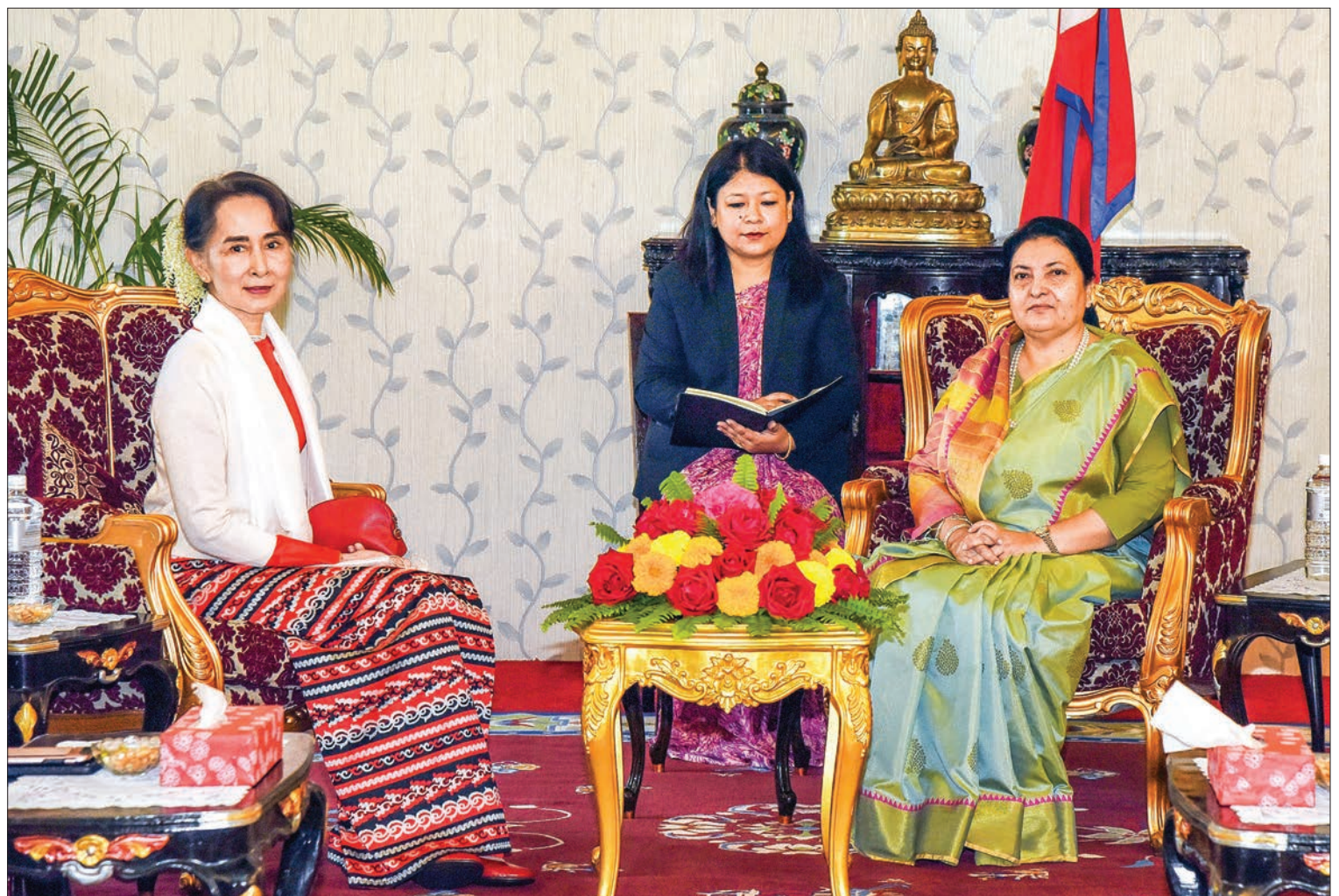
State Counsellor Daw Aung San Suu Kyi meeting with Mrs. Bidhya Devi Bhandari, President of Federal Democratic Republic of Nepal, in the Presidential Palace in Kathmandu.

Present at the meeting were Union Minister for the Office of the Union Government U Min Thu, Union Minister for International Cooperation U Kyaw Tin,