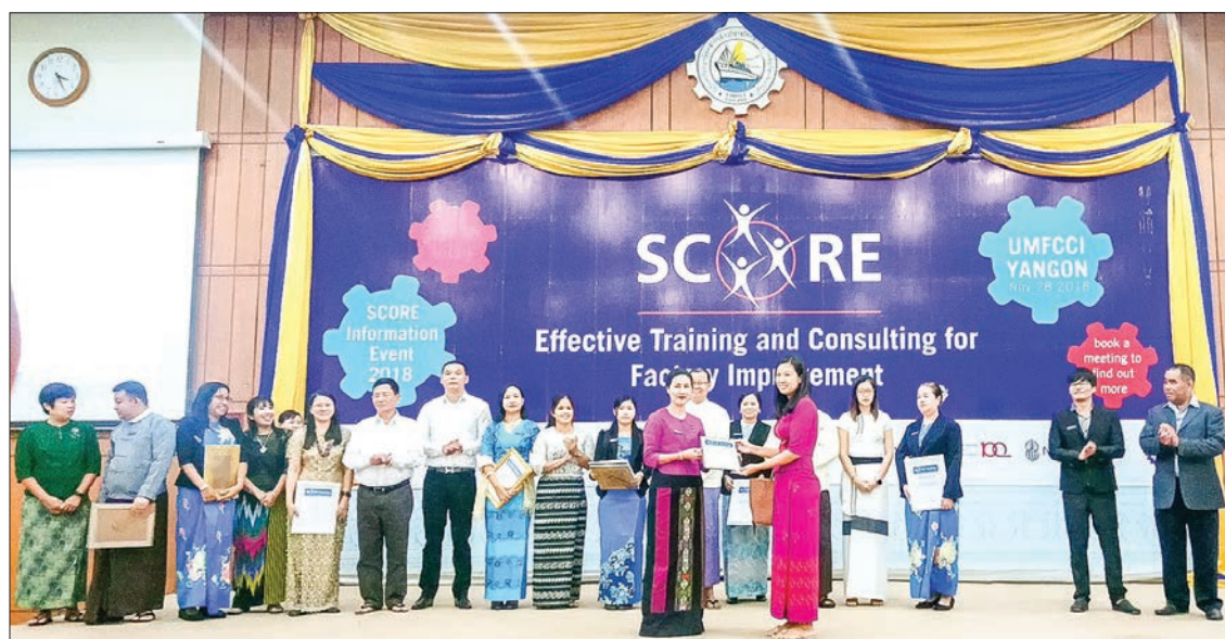
SCORE convenes effective training and consulting for facility improvement at the UMFCFI in Yangon.

to life. Greater personal financial knowledge and skills are an important building block for the industry and economic development of Myanmar. We encourage consumers, students and educators to take advantage of this very useful content.”—GNLM ■