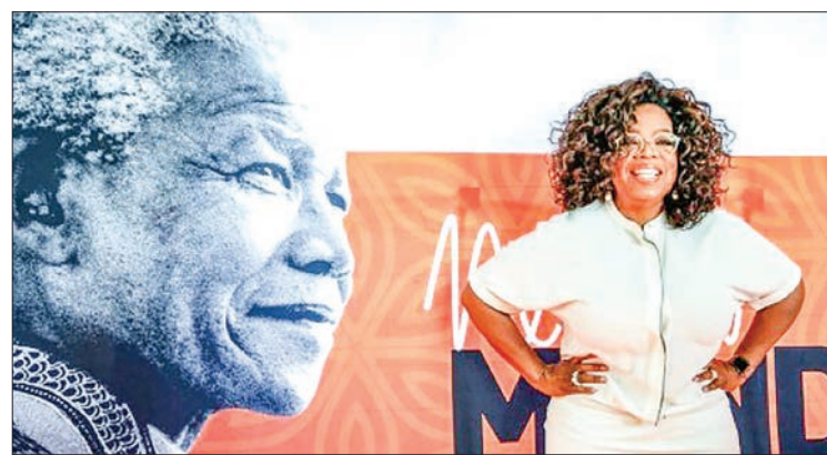
The concert hosted by Winfrey is the climax of a year of events celebrating the centennial of Mandela’s birth in 1918.