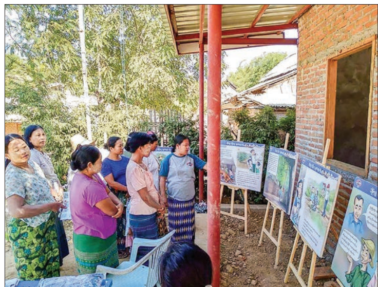
Local women taking part in the program to give their suggestions and to discuss social responsibilities in Mann oil field.

TO establish and maintain good relations between locals of Mann Oil Field and companies doing business there, the MPRL E&P Company conducted a program inviting suggestions and discussions from locals for Fiscal Year 2018-2019 from 30 October to 29 November.