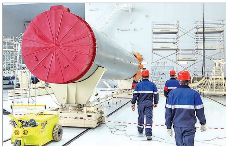
The respective protocol also envisages exploring the Moon and deep space.

the signing of a protocol in which the two parties agreed to take further steps to seek rapprochement in implementing joint projects for the manufacture of space vehicles and rocket engines, exploring the Moon and deep space, remote sensing of the Earth, satellite navigation, creating a base of electronics components for the space industry, and low orbit mobile communication systems and space debris monitoring,” the report runs. —Tass ■