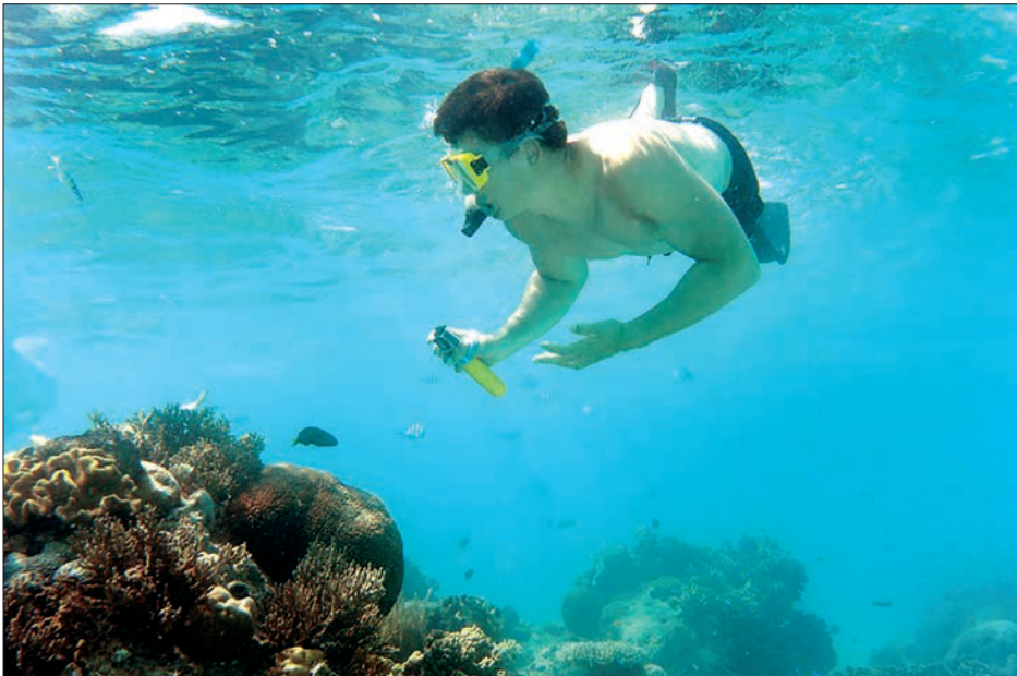
Tourists to the Great Barrier Reef generate revenues of $4.3 billion (Aus$5.9 billion) and support 64,000 local jobs.