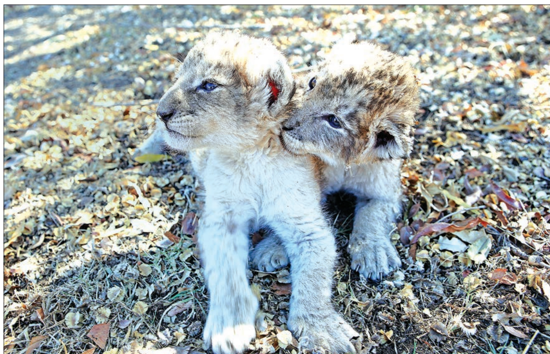
Scientists hope the artificial insemination technique can be used to save other endangered big cats.