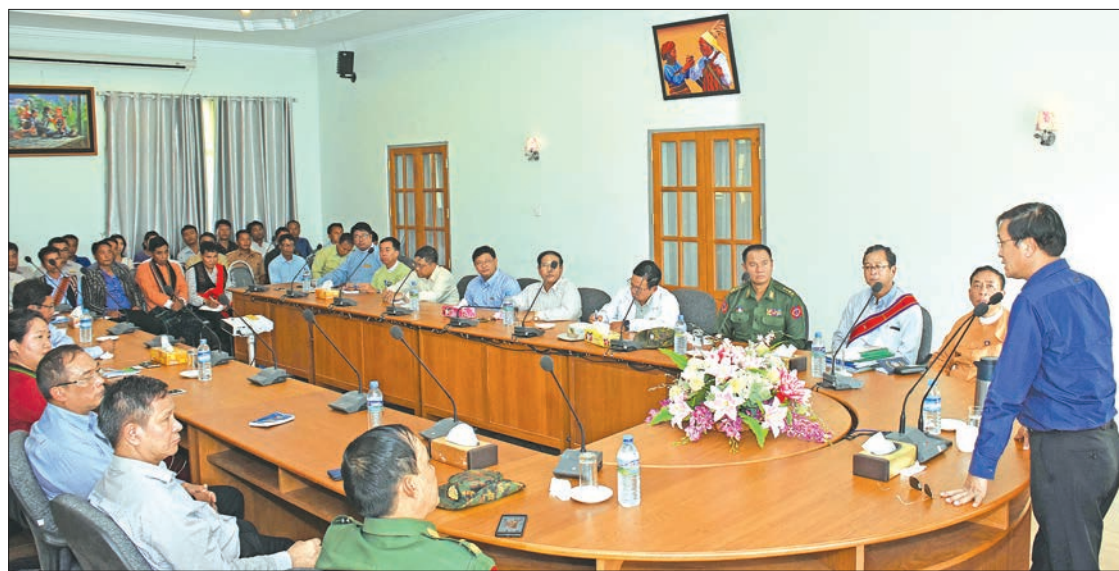
Vice President U Henry Van Thio meeting with departmental officials and local people at Pyidaungsu Hall yesterday.

At the Surbon airport project in Falam, the Vice President heard a report on the work programs, completed portions of the project under the year-wise budgets, design of the retaining wall, water and power supply