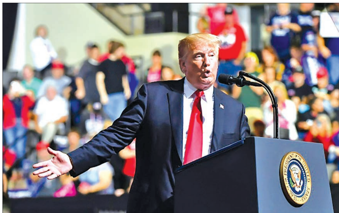
US President Donald Trump speaks during a rally in Wheeling, West Virginia, where he said he and North Korean leader Kim Jong Un had fallen "in love".

Trump followed those comments by saying Wednesday he had received an "extraordinary