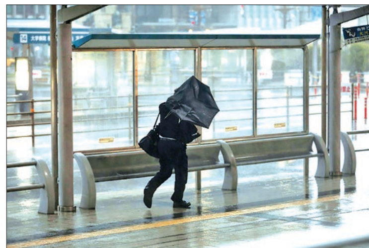
The Japanese weather agency has warned of record winds.

The Japanese meteorological agency issued a special warning of landslides and floods in Kagoshima and Chiba, while saying heavy rain seen once in half a century has been monitored in Yakushima island, southern Kagoshima. —AFP ■