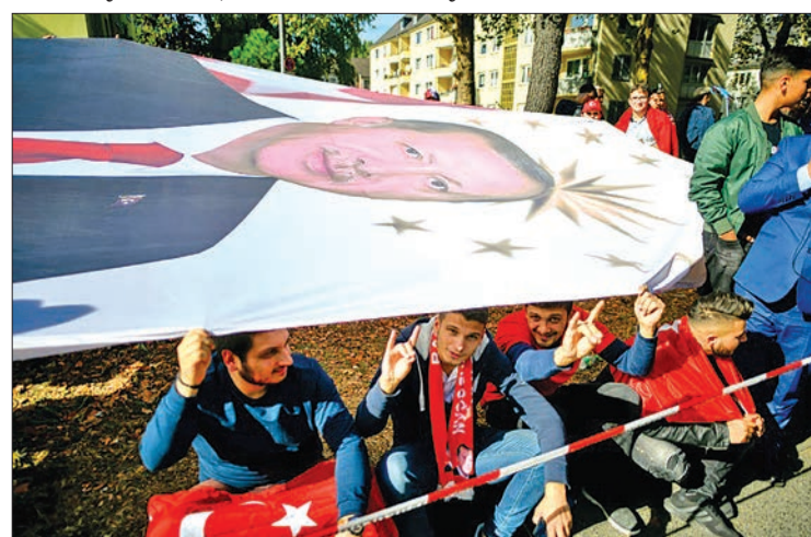
As well as protesters, wellwishers took to the streets of Cologne holding a huge portrait of the Turkish president as he arrived to open one of Europe's largest mosques.