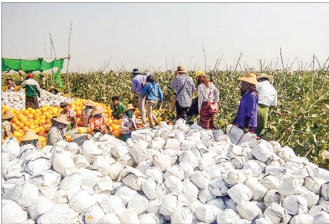
Farmers collecting melons in a field in Muse.

“Over 20 trucks loaded with watermelons are daily entering the Muse 105 th Mile market. Currently, about 10 trucks from ChaungU area are leaving for border gates every day. Monsoon muskmelons are sent to Yangon and Mandalay market”, said U Soe Lwin. —Myo Win Tun (Monywa) ■