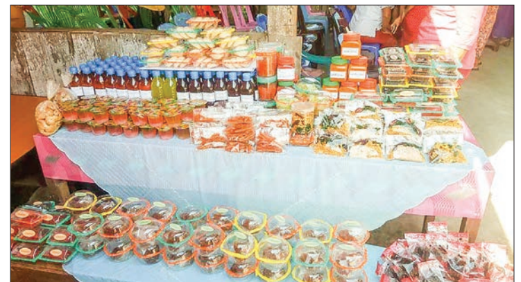
Various kinds of food produced at the course.

The course was attended by 25 attendees and trainers Daw Hnin Nanda Hlaing and