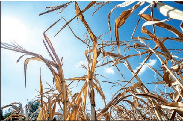
A study from UN-led scientists warns that even capping global warming at an ambitious 1.5 degree Celsius is not enough.