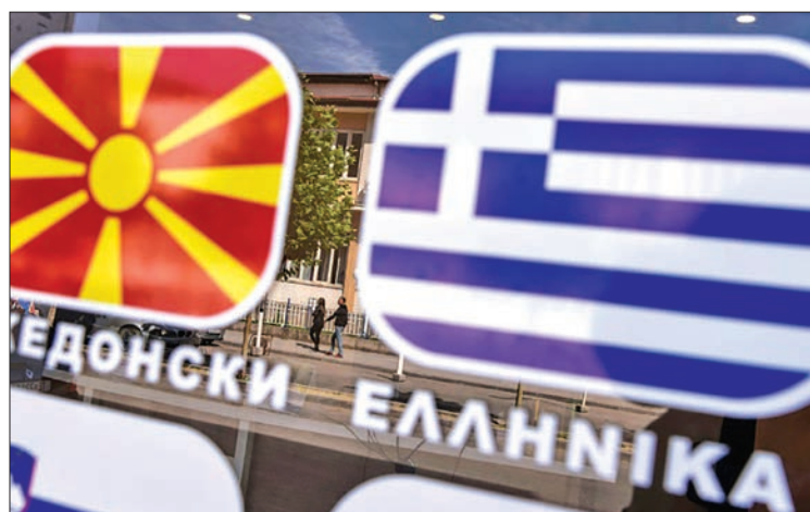
Macedonia, whose national flag is pictured left, has struggled for recognition of its name since its birth in 1991.

North Korea's foreign minister Ri Yong Ho on Saturday told the UN there was "no way" that his country would disarm first as long as the US to push for tough enforcement of sanctions against Pyongyang.— AFP ■