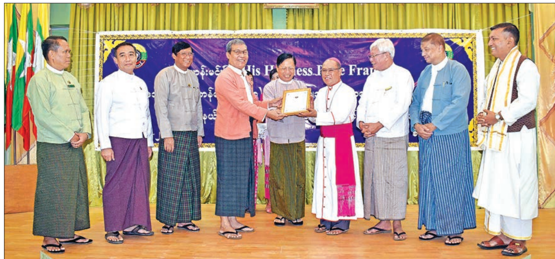
State Chief Minister U Nyi Pu presenting a certificate of appreciation at the donation event.

the aim of donation by His Holiness Pope Francis at the ceremony.