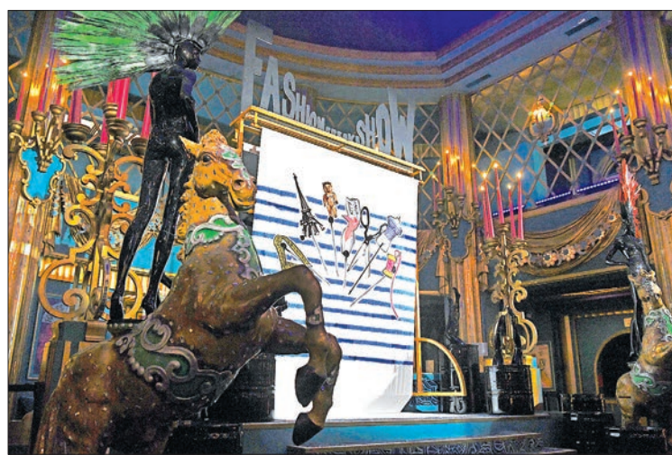
The show opens to the public on 2 October.

PARIS — "I was weaned on musicals ... totally transfixed by the plumes and the paste jewels. I told myself that one day I would stage a revue," Jean Paul Gaultier said of a childhood dream that has now taken shape at the Folies Bergeres, a landmark Parisian theatre.