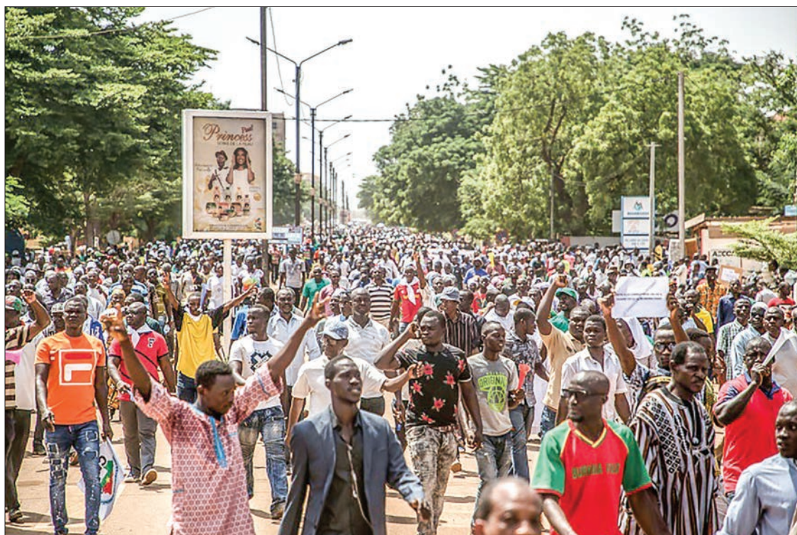
People gather during a rally in the Burkinabe capital Ouagadougou in the first large protest by opposition supporters against the current government's policy since the election of President Kabore in November 2015.

OUAGADOUGOU (Burkina Faso) — Thousands of opposition supporters took to the