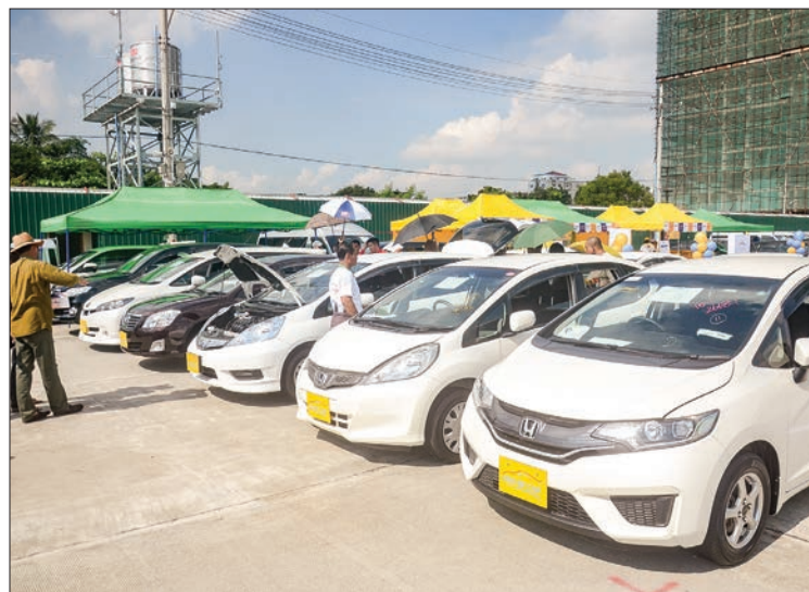
Cars displayed at a sales center.

Cars installed locally will possibly get more market shares in 2019. Eighteen companies have been permitted for locally produced cars under CKD/SKD system. — SMW ■