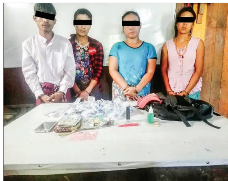
The suspects together with the seized drugs.