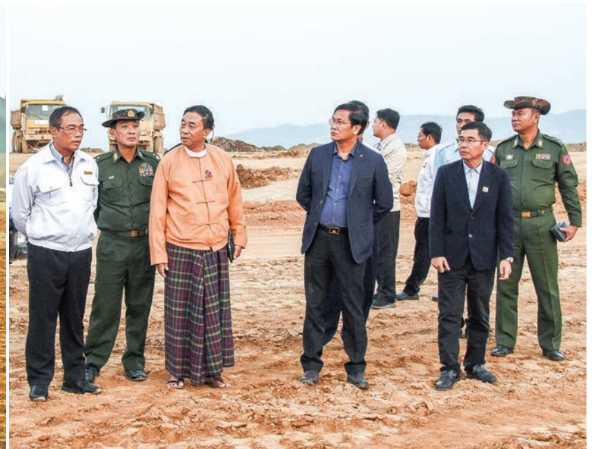
Vice President U Henry Van Thio inspecting the current status of Surbon airport project in Falam.

“AS the Reekhorda-Zokhawthar border gate has become an international level facility it will help develop tourism as well as trade,” said Vice President U Henry Van Thio during his inspection of the freight handling yard there yesterday.