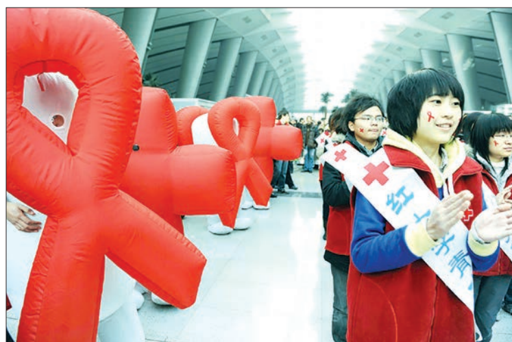
More than 820,000 people had HIV/AIDS in China at the end of June, up by 100,000 year-on-year.

It stemmed from a tainted government-backed blood donation programme and infected tens of thousands of people, including entire villages. —AFP ■