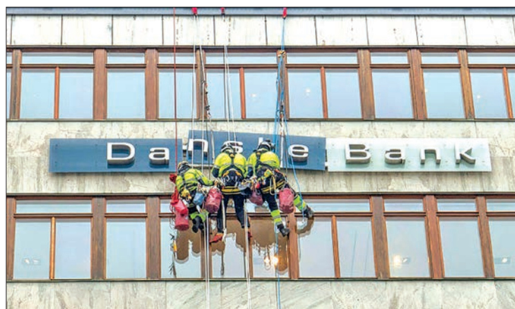
The EU needs to clean up its anti-money laundering act, experts say.

PARIS — European Union nations may boast the world's most stringent anti-money laundering rules, but recent scandals show that criminals are good at exploiting the bloc's Achilles' heel: A patent lack of coordination.