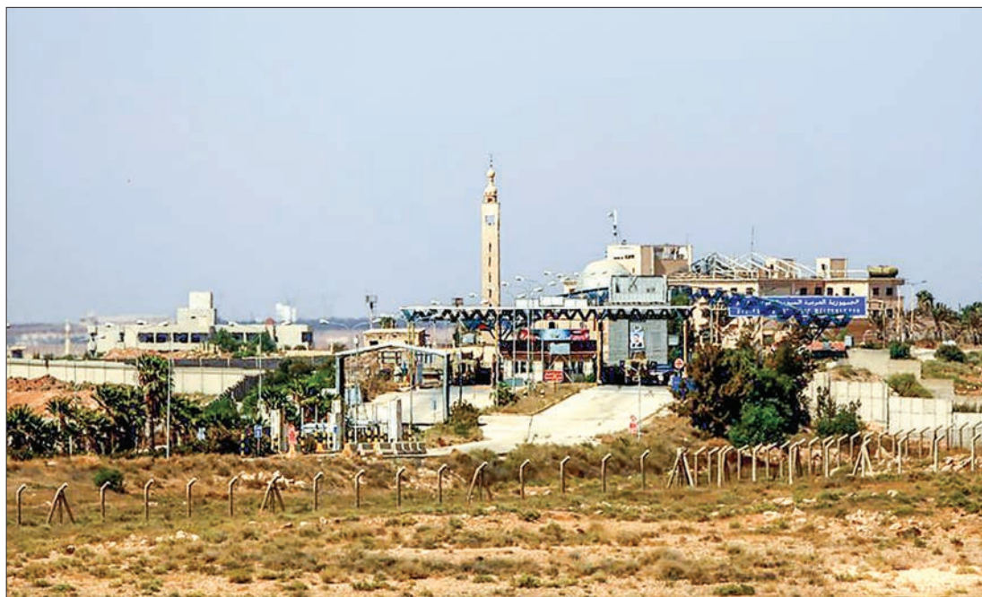
Jordan's Jaber checkpoint near Nasib border crossing between Jordan and Syria, near Mafraq, Jordan.

Reports said the loss of the Jordanian transport sector from the border closure is estimated at around half a billion U.S. dollars. —Xinhua ■