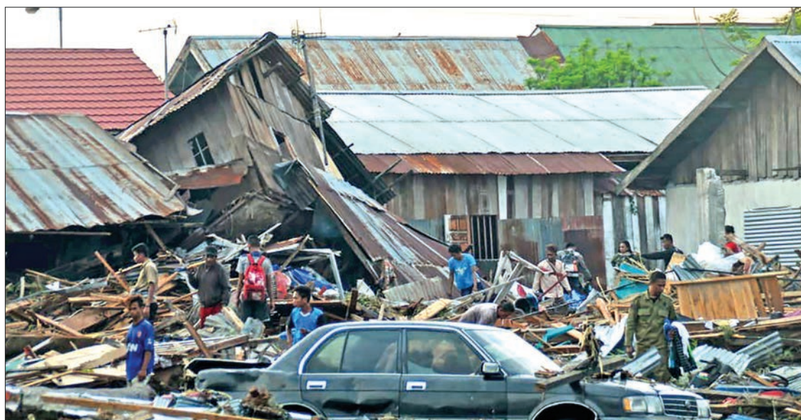
Amid Palu's levelled trees, overturned cars, concertinaed homes and flotsam tossed up to 50 metres inland, residents and rescuers struggled to come to grips with the scale of the disaster.