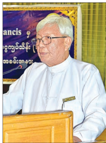
U Myint Swe.