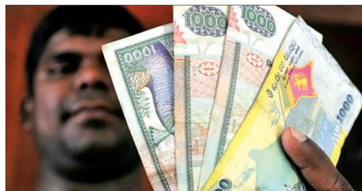
The Sri Lankan rupee has lost more than 10 percent of its value against the US dollar.