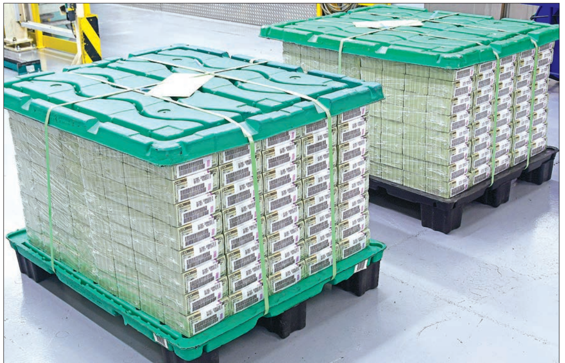
Freshly printed, bundled and packaged money sits ready for shipment to the US Federal Reserve, as prominent investors and economists warn of voracious borrowing by corporations and emerging market economies.

ness investment, and this spending crunch would push the economy into recession," Feldstein wrote.