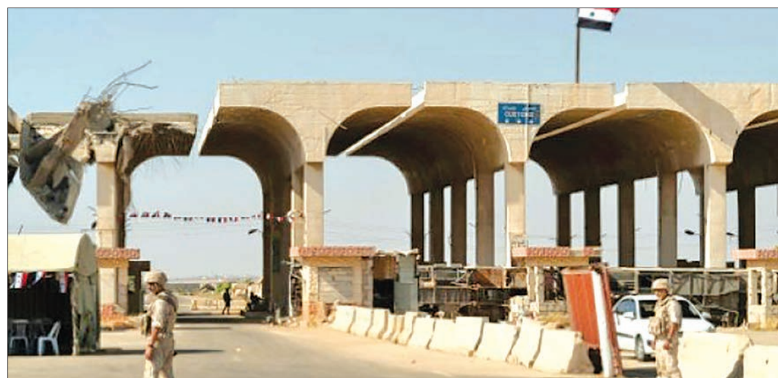
Syria's transport ministry says the main border crossing with Jordan, seen here being patrolled by Russian military police on August 14, 2018, has reopened to trade for the first time in three years after its recapture in July.

Despite retaking swathes of territory in successive Russian-backed offensives this year, Damascus still controls only half of the 19 crossings along Syria's lengthy borders with Lebanon, Jordan, Iraq and Turkey.—AFP ■