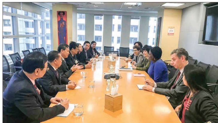
Union Minister Dr. Myo Thein Gyi and party discussing education issues in United States.

The Union Minister then explained the current conditions of universities and colleges in Myanmar and coordinated on the World Bank's assistance. — MNA ■