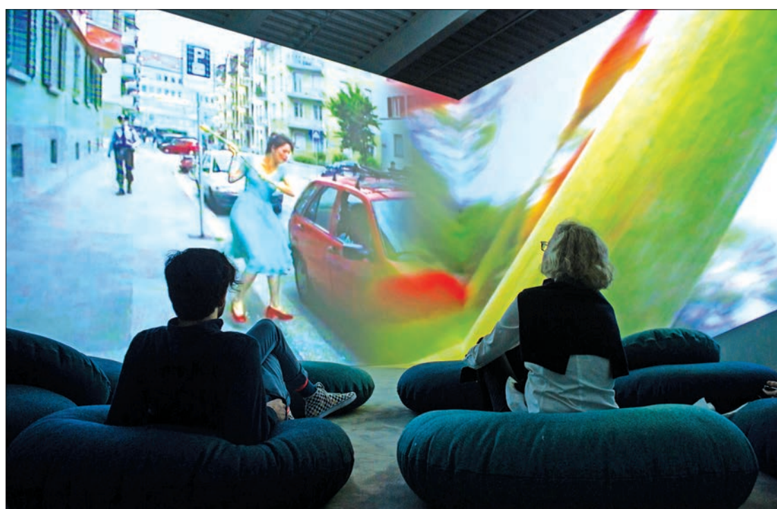
Visitors are invited to relax on soft seats as they watch Pipilotti Rist's video 'Ever Is Over All' (1997) featuring playful music while the Swiss artist smashes multiple car windows, a smile on her face.

A water court of aquatic plants ringed by walls of glass provides the beating heart of the Thomas Phifer-designed building, flooded with natural light and shaped with individually poured blocks of gray concrete.