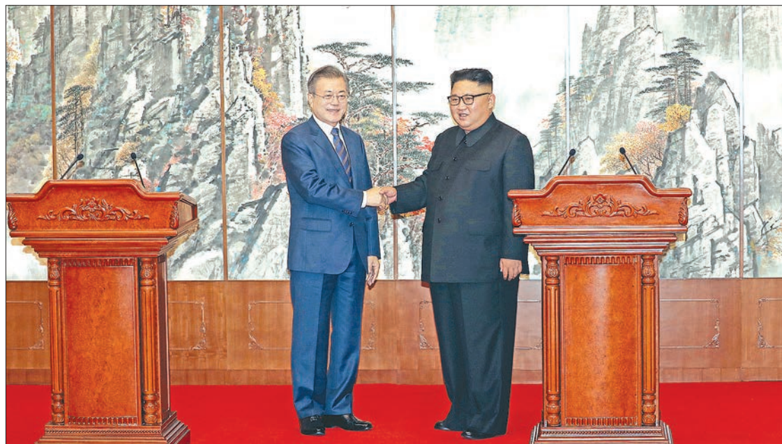
South Korean President Moon Jae-in (L) shakes hands with North Korean leader Kim Jong Un (R) during a joint press conference after their summit at Paekhwawon State Guesthouse in Pyongyang on 19 September, 2018.

At Kim's historic summit with US President Donald Trump