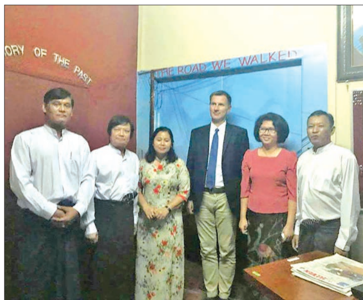
British Secretary of State for Foreign and Commonwealth Affairs Rt. Hon. Jeremy Hunt MP poses for a documentary photo with AAPP secretary U Teit Naing in Yangon.

A DELEGATION led by the British Secretary of State for Foreign and Commonwealth Affairs, Rt. Hon. Jeremy Hunt MP, landed in Yangon at 3:45pm yesterday.