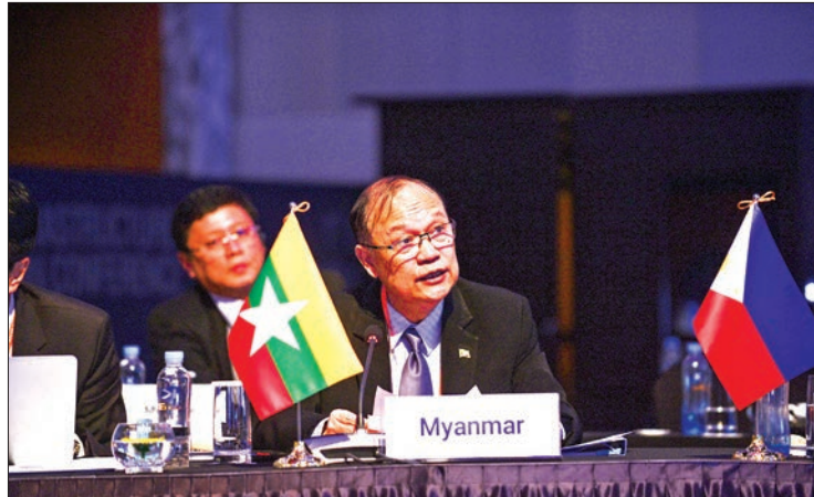
Union Minister U Thant Sin Maung attending 1 st ASEAN-ROK Infrastructure Ministers' Meeting in Seoul.

Attending the meeting were South Korean Minister for Land, Infrastructure and Transport Ms. Kim Hyun-mee, other transport, construction and infrastructure ministers from ASEAN countries, and