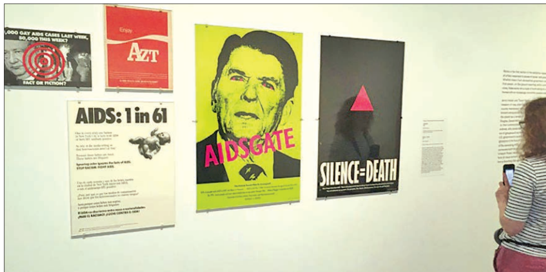
A woman looks at works by the SILENCE = DEATH Project (1987) at New York's Met Breuer museum as part of the "Everything Is Connected: Art and Conspiracy" show that runs through 6 January, 2019.

itself but the investigations that followed, notably the Warren and Church commissions that examined the actions of the US spy agencies, which drive the show.