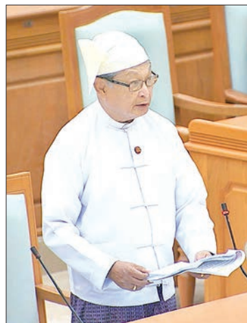
Union Minister U Kyaw Tint Swe.

Following is the full text of the report delivered by Union Minister U Kyaw Tint Swe during the Pyidaungsu Hluttaw meeting yesterday: