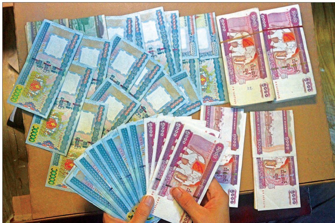
Myanmar local currency banknotes.

In the floating exchange rate regime, traders buying foreign currency in hard cash are more seen than international bank-to-bank transfers or foreign exchange dealing services for large