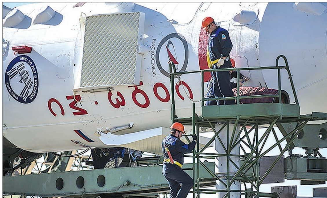
An internal check in the Rocket and Space Corporation Energia (RSC Energia) revealed no systemic flaws in the production of the Soyuz spacecraft.

Twitter and other social networks have faced criticism in recent weeks including from President Donald Trump that they suppress some messages based on political bias. The company has denied the allegations.—AFP ■