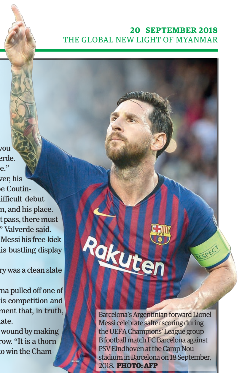
Barcelona's Argentinian forward Lionel Messi celebrate after scoring during the UEFA Champions' League group B football match FC Barcelona against PSV Eindhoven at the Camp Nou stadium in Barcelona on 18 September, 2018.

Instead, Madrid rubbed salt into the wound by making it look easy and winning their third in a row. "It is a thorn in our side," Luis Suarez said. "It's time to win the Champions League," said Messi. —AFP ■