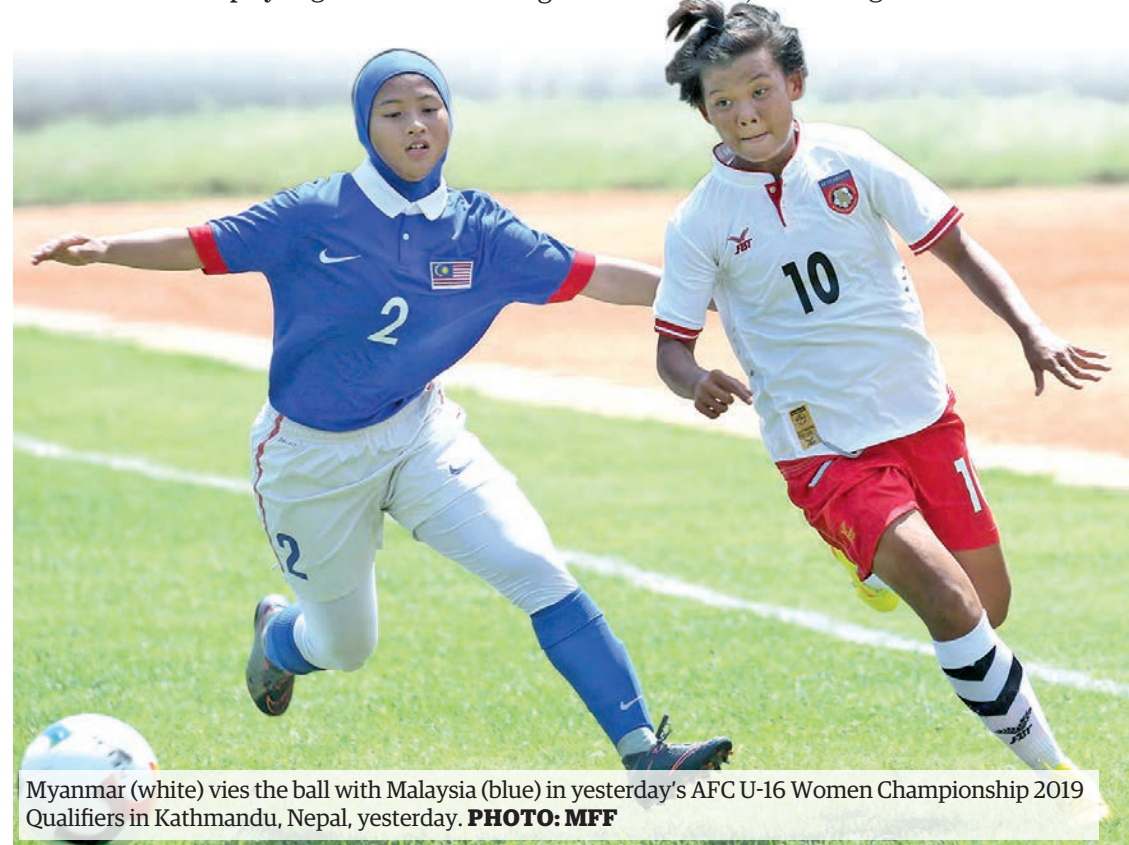
Myanmar (white) vies the ball with Malaysia (blue) in yesterday's AFC U-16 Women Championship 2019 Qualifiers in Kathmandu, Nepal, yesterday.

Myanmar U-16 women team will next play against Nepal U-16, while Malaysia U-16 will play against the Philippines U-16 on Friday.—Lynn Thit (Tgi) ■