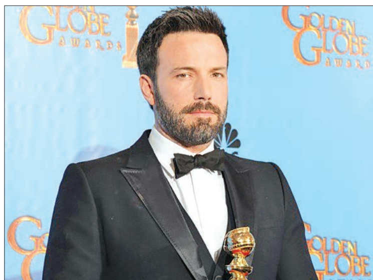
Hollywood star Ben Affleck.

"I hope this pain goes away, 'cause they can never really guarantee it — and if it doesn't, then I'm done, dude," Seger told the music site Louder earlier this year, while emphasizing that he was recovering and his voice was unaffected. —AFP ■