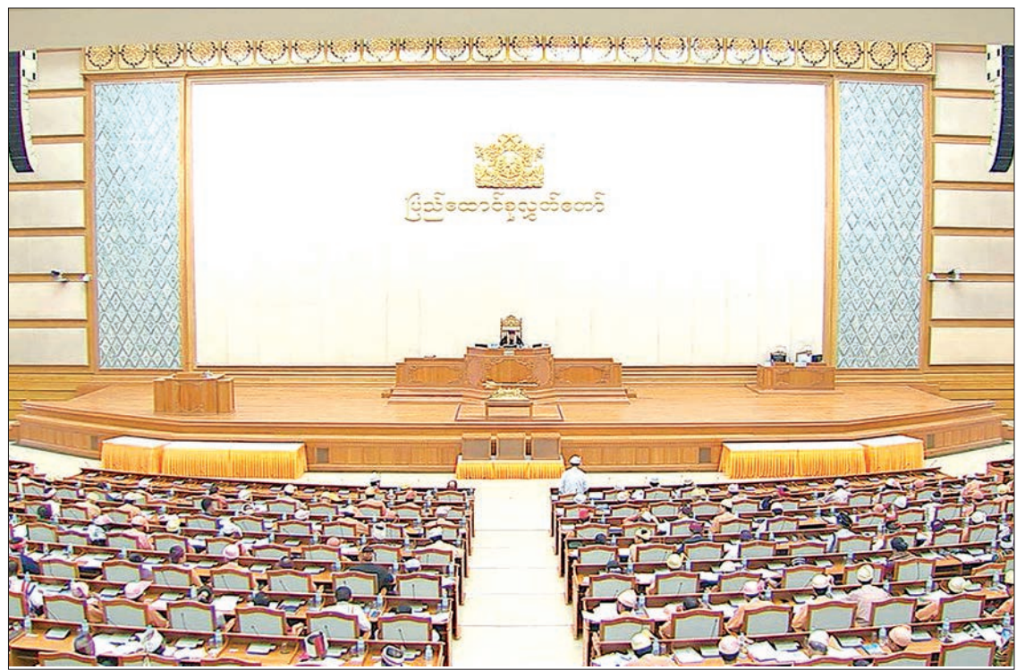
Second Pyidaungsu Hluttaw concluding its ninth regular session in Nay Pyi Taw yesterday.