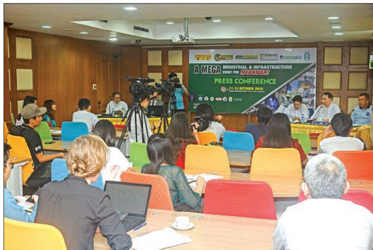
Industrial & Infrastructure Event holding a Press conference in Yangon.

Over 350 companies from 23 countries will showcase their products, technology and their services, including subcontracting, business-match-