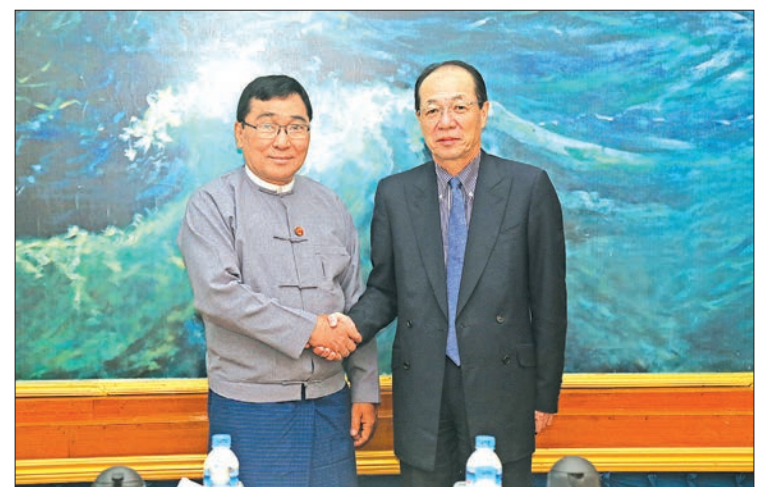
Union Minister Dr. Win Myat Aye shakes hands with Japanese Ambassador Mr. Ichiro Maruyama.

UNION Minister for Social Welfare, Relief and Resettlement Dr. Win Myat Aye received Japanese Ambassador to Myanmar Mr. Ichiro Maruyama at the Maykalar Hall in his ministry in Nay Pyi Taw yesterday morning.