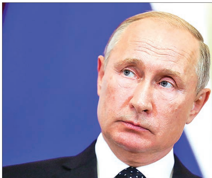
Russian President Vladimir Putin.

On Tuesday morning, the Russian Defence Ministry stated that the Il-20 aircraft had been accidentally downed by Syrian air defences because the Israeli F-16 jets had been using it as cover. According to Defence Ministry Spokesman Major General