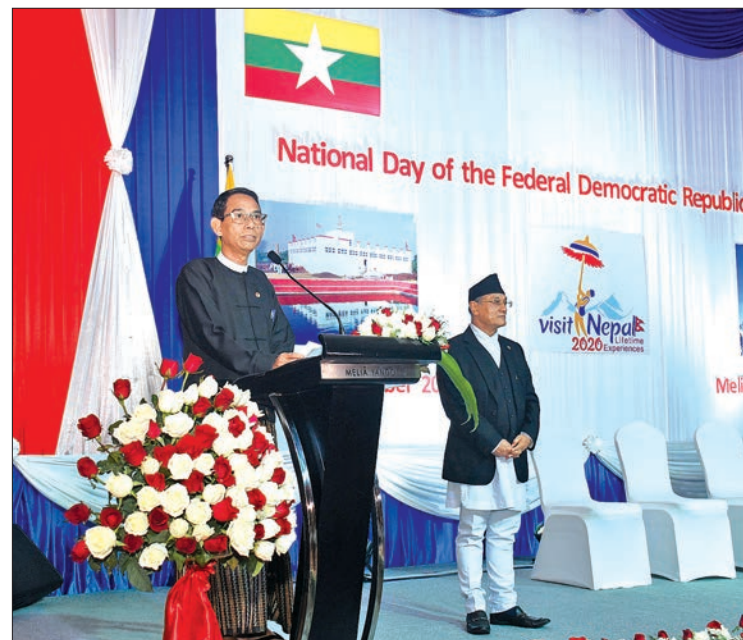
Union Minister Dr. Aung Thu delivers a speech at a celebration of the Nepali National Day in Yangon.

Attending the celebration were foreign ambassadors assuming office in Yangon, charge d'affairs, UN departmental representatives and other invited guests. —MNA ■