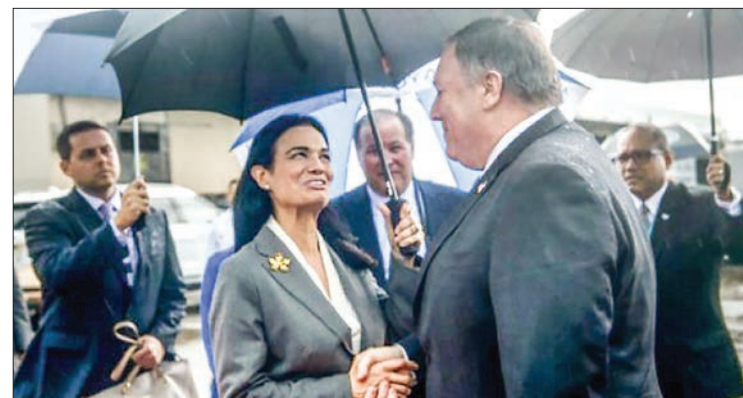
US Secretary of State Mike Pompeo (r) is greeted by Panama's Vice-President and Foreign Minister Isabel Saint Malo as he arrives at Tocumen International Airport on October 18, 2018.

On Tuesday, Trump threatened Central American countries with aid cuts if they failed to stop the caravan. — AFP ■