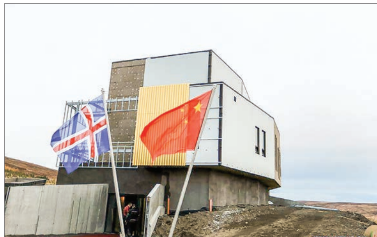
Photo taken on 18 October, 2018 shows the China-Iceland Arctic Science Observatory located at Karholl, some 66 km east of Akureyri in northern Iceland. The China-Iceland Arctic Science Observatory was inaugurated and officially began operation on Thursday in northern Iceland.

OSLO — The China-Iceland Arctic Science Observatory was inaugurated and officially began operation on Thursday in northern Iceland.