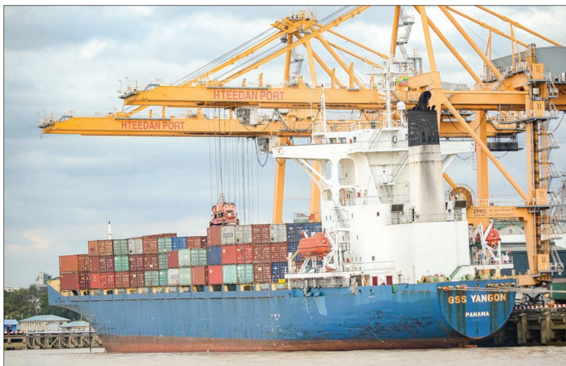
An ocean liner carrying containers docks at a jetty in the Yangon River.