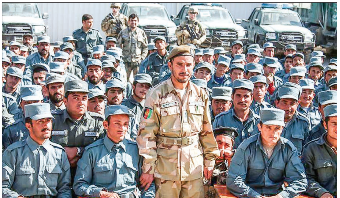
General Abdul Raziq — the police chief of Kandahar province who had a fierce reputation for brutality — was one of the targets of the shooting.