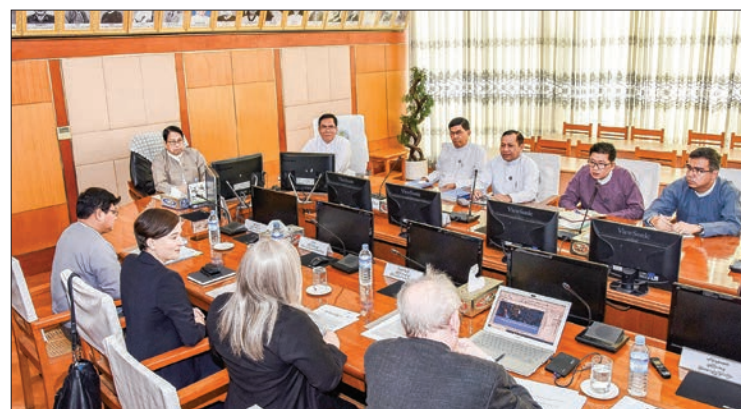
Union Minister for Information Dr. Pe Myint meets with Country Director of DW Akademie Ms. Eva Mehl and party yesterday.

During the meeting, DW Akademie showed a Power Point Presentation about Public Service Broadcasting (PSB) plus general workflows, composition, election process of their members and budget system with the Union Minister asking questions and discussing over the presentation.