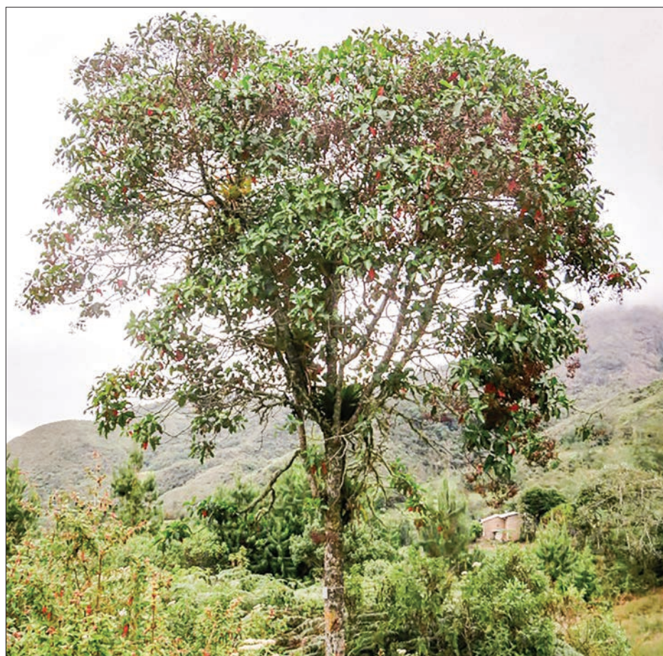
Although the cinchona is a tree and quinoa a cereal, some Peruvians are unable to tell the two apart.

ruvian government may not value the cinchona, its bark was much sought after in Europe once it was brought to the old continent in 1631 by a Jesuit priest.