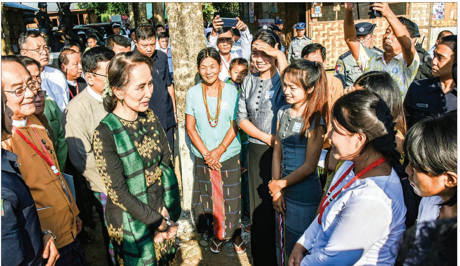
State Counsellor Daw Aung San Suu Kyi meeting with people at Ingyandon Baptist IDP camp in Thatkon Ward in Myitkyina yesterday.

S TATE Counsellor Daw Aung San Suu Kyi travelled to Myitkyina in Kachin State yesterday and visited a boarding school for students from the hilly regions, a drug rehabilitation center donated by the Daw Khin Kyi Foundation, and IDP camps in the area, where she provided them with necessities.