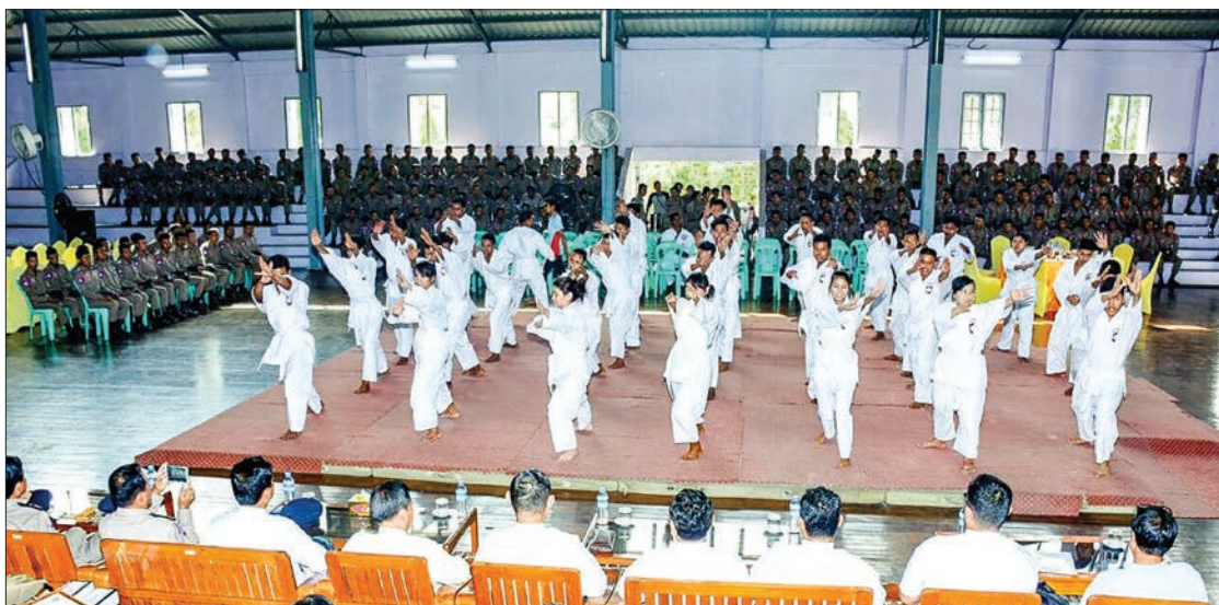
Judo athletes show their skills at a conclusion ceremony of Judo course in Yangon yesterday.