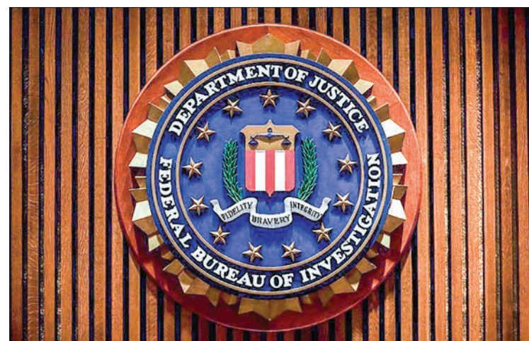
A crest of the Federal Bureau of Investigation is seen 03 August 2007 inside the J. Edgar Hoover FBI Building in Washington.