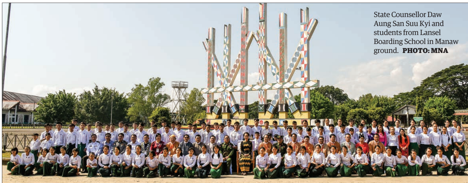
State Counsellor Daw Aung San Suu Kyi and students from Lansel Boarding School in Manaw ground.

State Counsellor Daw Aung San Suu Kyi and party then left Myitkyina by special flight and reached Nay Pyi Taw in the evening. — MNA ■