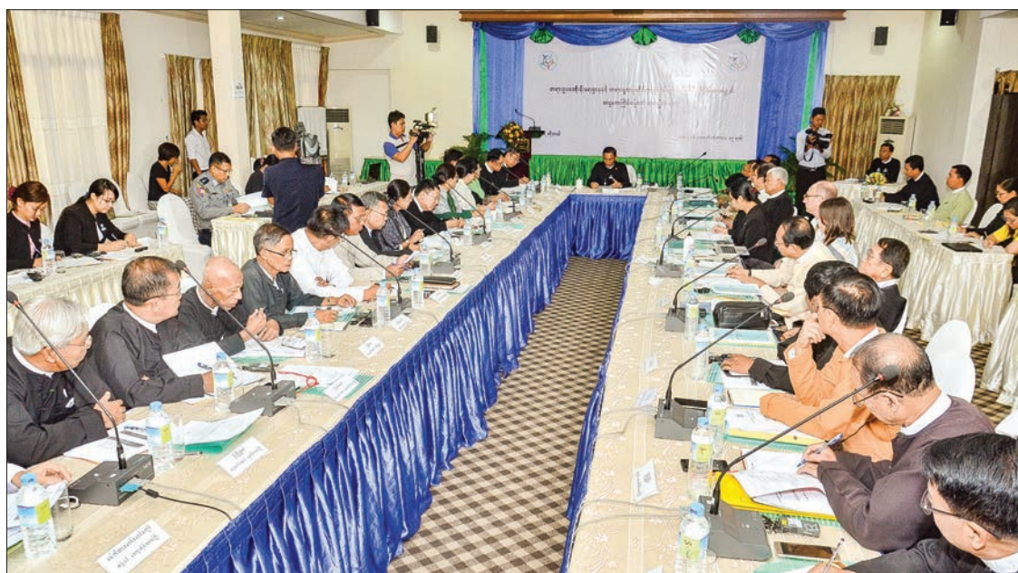
Union Attorney-General U Tun Tun Oo attends the sixth meeting of the Coordination body of Rule of Law Department and Judiciary Fairness in Nay Pyi Taw.

man of the Joint group Committee for Rule of Law and Justice Fairness, the Deputy Chairman, members and advisors of the coordinating committee were present. — MNA ■