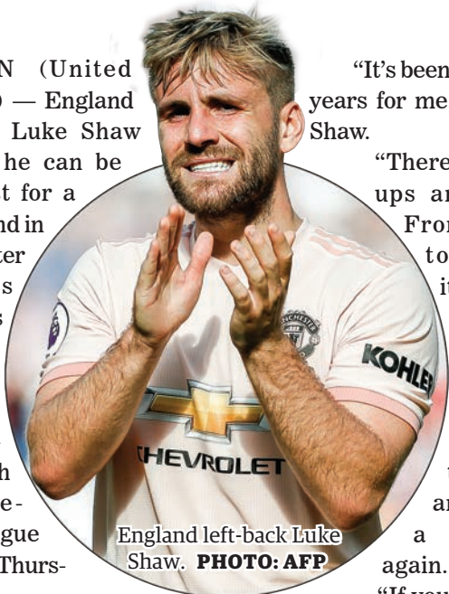
England left-back Luke Shaw.

LONDON (United Kingdom) — England left-back Luke Shaw believes he can be a catalyst for a turnaround in Manchester United's fortunes after signing a new five-year contract with the Premier League giants on Thursday.