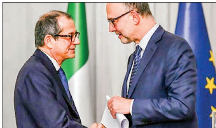
Underlining the sensitivity of the matter, a letter from the European Commission warning Italy about its budget will be delivered by Commissioner Pierre Moscovici (l) in person to Italian Finance Minister Giovanni Tria (r).

BRUSSELS (Belgium) — The European Commission on Thursday formally warned Italy that its budget plans for 2019 are a serious concern, demanding "clarifications" from Rome over its unprecedented deviation from EU rules. Italy's populist government on Monday submitted its draft 2019 budget to the European Commission in which it laid out plans to increase spending and end the austerity policies of recent years, despite deficit warnings.