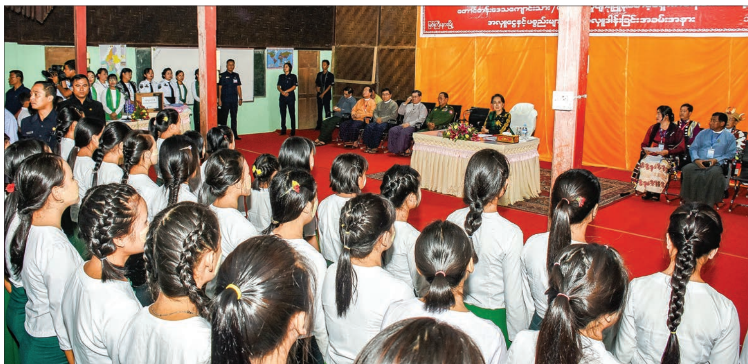
Students sing songs "Hero" and "Let's build peace" at ceremony to donate cash and aid to Lansel Boarding School in Shwe Set Ward.

"We were entertained with songs but the songs were not just for entertainment. They have meaning. The songs are unveiling the important values for the country. It's very encouraging. That's why I hope the children will have a deep appreciation for the songs in their heart when they sing them. They need to know what