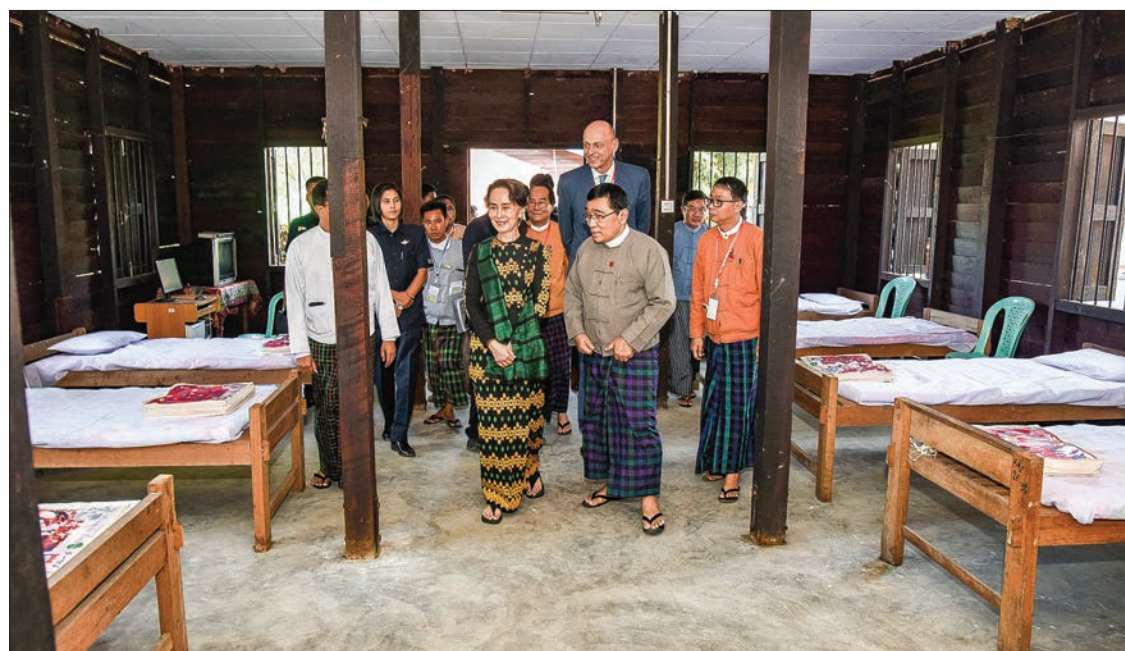
State Counsellor Daw Aung San Suu Kyi visits drug rehabilitation center in Leagone Ward.