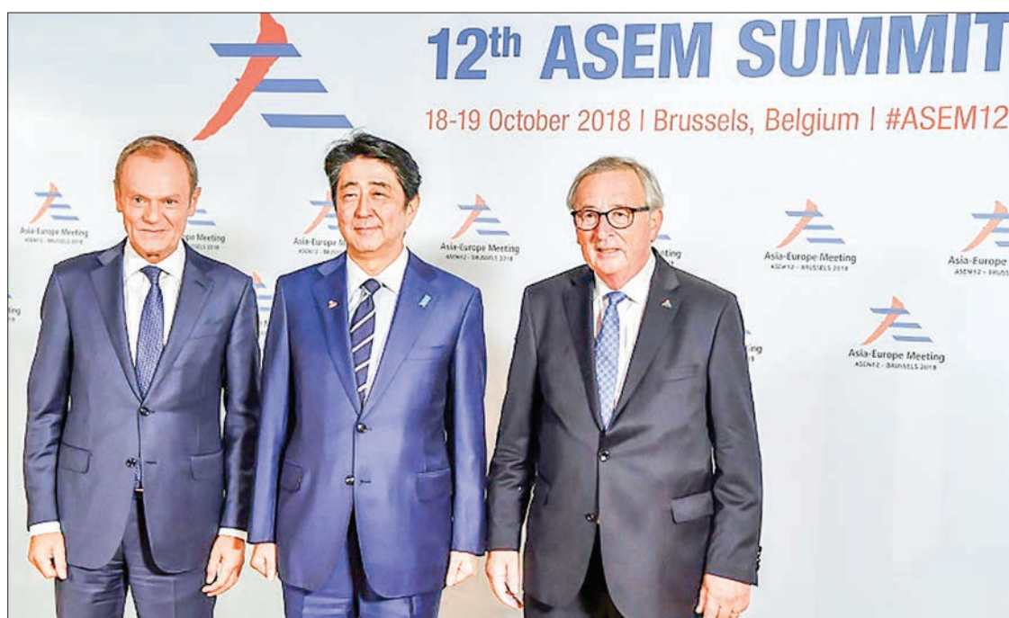
President of the European Commission Jean-Claude Juncker (r) and European Council President Donald Tusk (l) welcome Japan's Prime Minister Shinzo Abe (c) to the Asia-Europe Meeting summit at the European Council in Brussels on 18 October, 2018.

"To those who prefer quick fixes without clear rules I say it's not worth it. A world without rules is by definition a world of chaos," EU Council President Donald