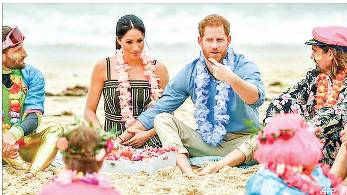
Britain's Prince Harry and his wife Meghan, Duchess of Sussex, talk to members of OneWave, an awareness group for mental health and wellbeing at Sydney's iconic Bondi Beach.

On Monday the pair will go to Queensland's Fraser Island, the world's largest sand island, before jetting off to Fiji, Tonga and New Zealand. —AFP ■