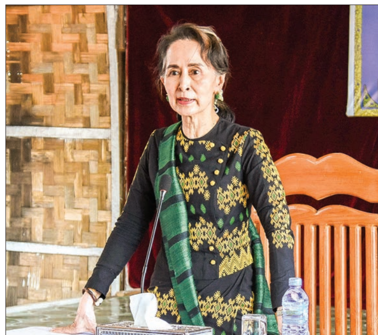
State Counsellor Daw Aung San Suu Kyi delivers the address at the donation ceremony at Ingyandon Baptist IDP camp in Tatkon ward in Myitkyina.