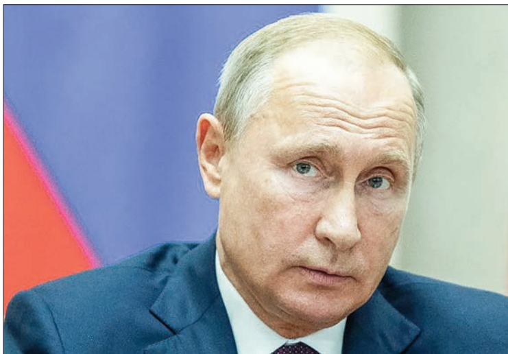
Russian President Vladimir Putin has spoken many times in the past in the past about his own regret over the break-up of the Soviet Union in the 1990s, infamously describing it as “the greatest geopolitical disaster of the 20 th century”