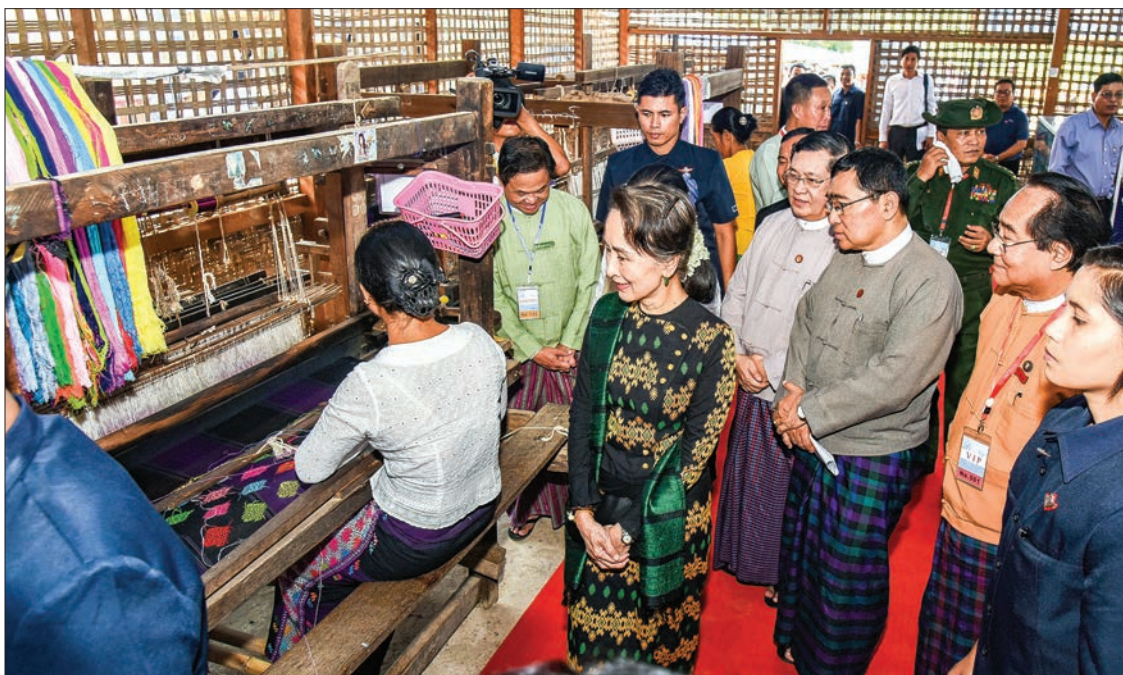
State Counsellor Daw Aung San Suu Kyi observes traditional weaving at St. Joseph IDP camp.