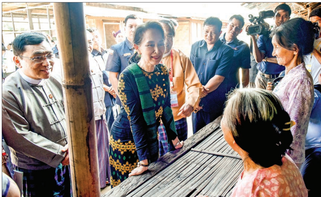
State Counsellor Daw Aung San Suu Kyi meeting with local people at Ingyandone Baptist IDP camp.

“Responsible persons at the centre also need to educate the parents and inform them of drug addiction symptoms. They are to continuously monitor their offspring. The reason this centre was opened was because of the donation by Daw Khin Kyi Foundation. But the support provided by Czech Republic to Daw Khin Kyi Foundation was what made the donation possible. Czech Republic has long history of friendly relation with Myanmar. Czech Republic is one of the countries that has understood and assisted our country. Czech Republic has plans to assist Daw Khin Kyi Foundation in making donations to other drug rehabilitation centres. Here I would like to thank the Ambassador of the country that has been friendly to us and has enthusiastically supported the rehabilitation of our youth and people. Nothing would be successful without the enthusiastic participation of the people. Regardless of a government being formed with the best people, without the support and participation of the people, it would not be successful. That is why only through the support of the people of Myitkyina can those trying to get rid of drug addic-