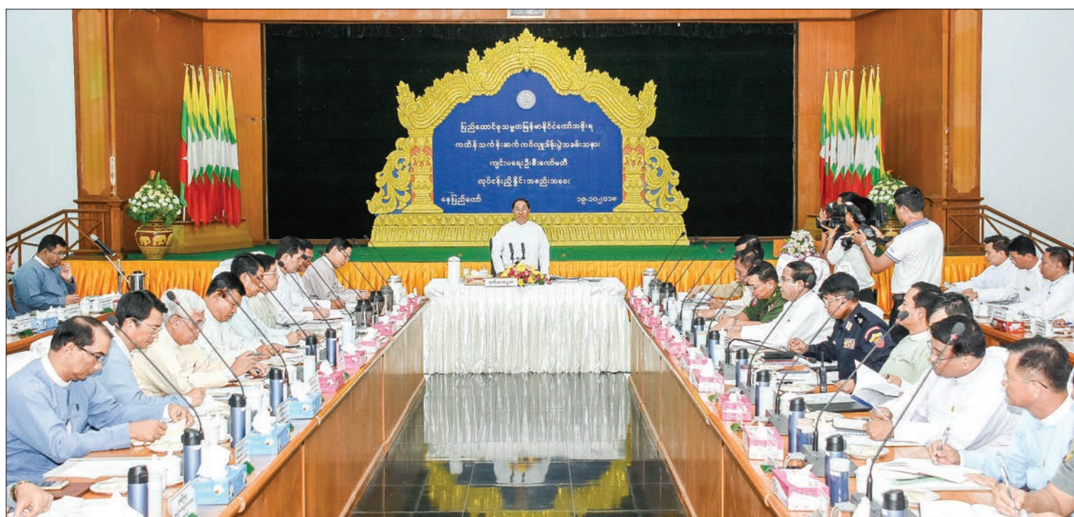
Vice President U Myint Swe addresses the committee meeting for Kathina Robe Offering Ceremony in Nay Pyi Taw yesterday.

This special donation was being conducted by the Govern-