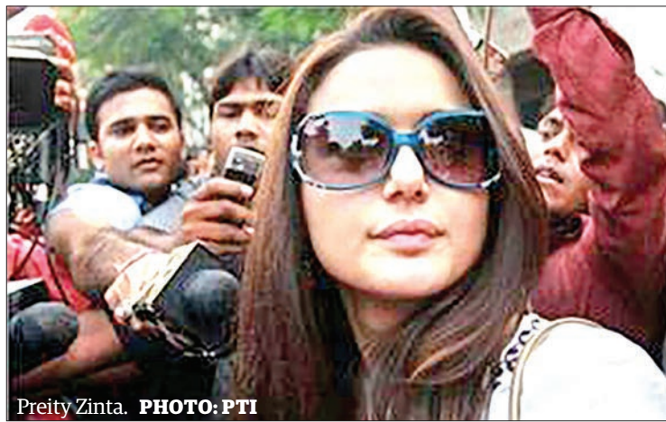
Preity Zinta.

MUMBAI — Preity Zinta says if female actresses devote as much time as their male counterparts to the film career, it would be possible for heroines to have a longer shelf-life.