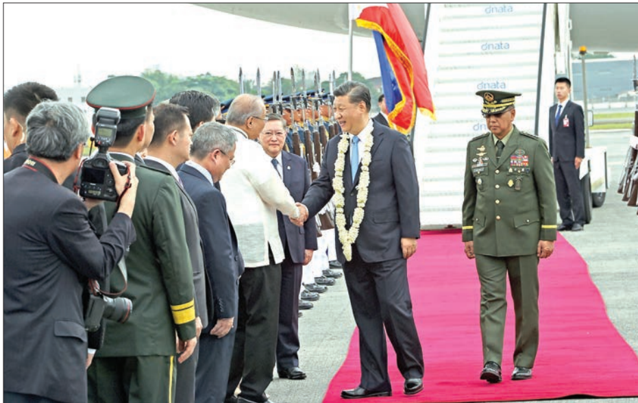
Chinese President Xi Jinping (c) shakes hands with Philippine government officials shortly after arriving at Manila international airport on 20 November, 2018.