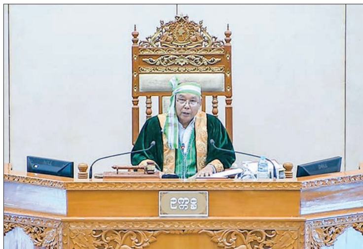
Amyotha Hluttaw Speaker Mahn Win Khaing Than.

Under Section 63 of the Central Bank of Myanmar Law and Section 8 of the Foreign Exchange Management law,