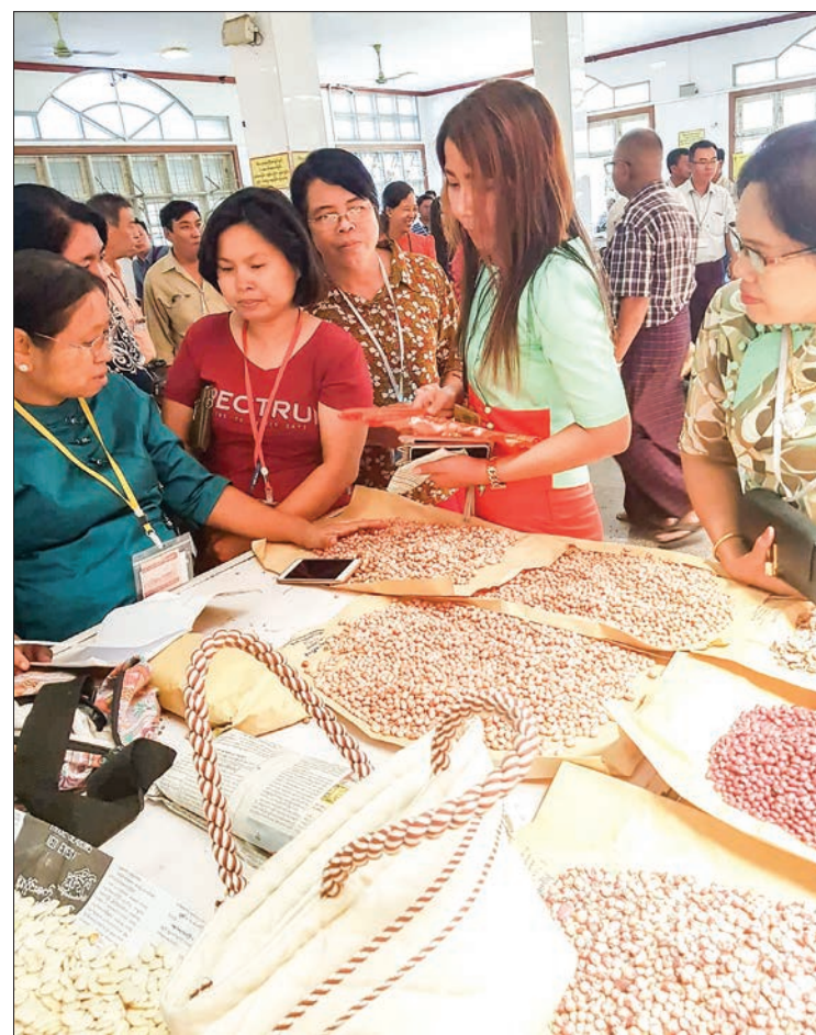
Customers shopping peanuts displayed in the Mandalay market.