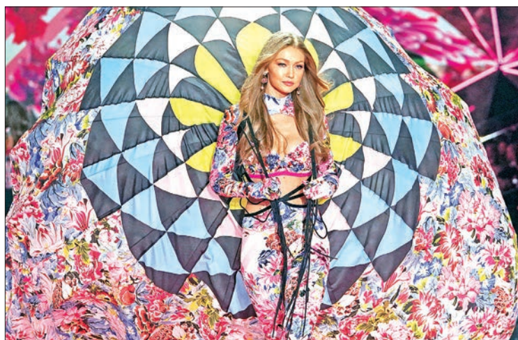
US model Gigi Hadid walks the runway at the 2018 Victoria's Secret Fashion Show on 8 November, 2018 at Pier 94 in New York City.