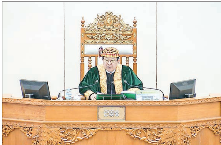
Pyithu Hluttaw Speaker U T Khun Myat.

Pyithu Hluttaw Speaker U T Khun Myat announced Hluttaw's agreement to discuss the motion after obtaining the decision of the Hluttaw. The Pyithu Hluttaw Speaker also announced