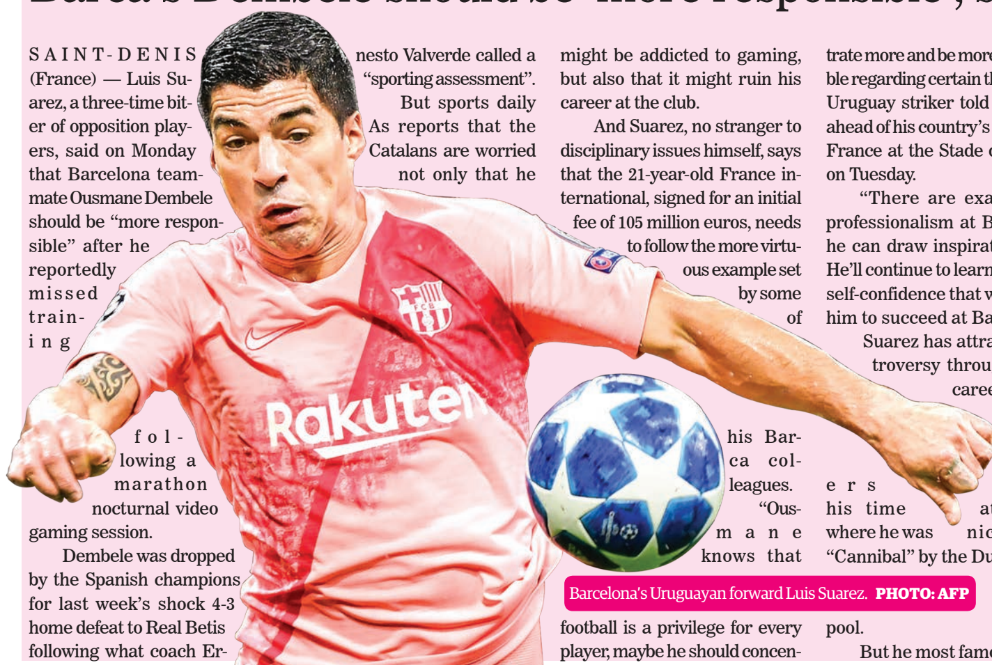
Barcelona's Uruguayan forward Luis Suarez.

In 2011 he was banned for eight matches by the Football Association for racially abusing Patrice Evra during a clash between Liverpool and Manchester United. —AFP ■