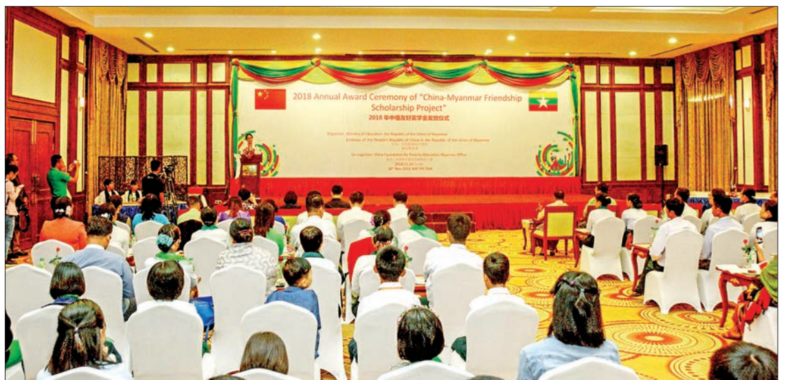
A ceremony of China-Myanmar Scholarship awards for 2018 held in Nay Pyi Taw yesterday.

THE China-Myanmar Friendship Scholarship Project for 2018 was held at the Royal Ace Hotel in Nay Pyi Taw yesterday morning. The awards have been instituted jointly by China's Embassy to Myanmar and the Ministry of Education.