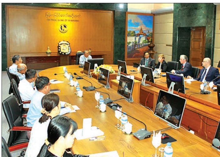
The Central Bank of Myanmar Governor U Kyaw Kyaw Maung holds talks with Ms. Loana Luca from IMF in Nay Pyi Taw.

U Kyaw Kyaw Maung, Governor of the Central Bank of Myanmar received a delegation led by Ms. Loana Luca from Legal Department of the International Monetary Fund at the Central Bank of Myanmar, Nay Pyi Taw yesterday morning.