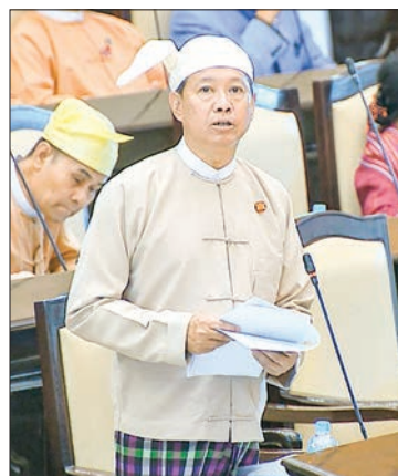
Union Minister for Education, Dr. Myo Thein Gyi.