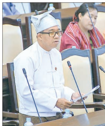
Deputy Governor of the Central Bank of Myanmar, U Bo Bo Nge.