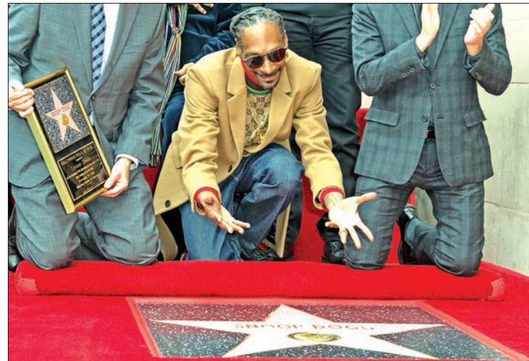
Rapper Snoop Dogg attends the ceremony honoring him with a Star on Hollywood Walk of Fame, on 19 November, 2018 in Hollywood, California.

Attending the ceremony on Monday were talk show host Jimmy Kimmel, record producer Quincy Jones and fellow rapper Dr Dre. —AFP ■