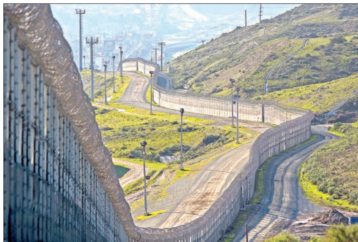
Multiple layers of steel walls, fences, razor wire and other barricades are viewed from the United States side of the US-Mexico border on 26 January, 2017 in San Ysidro, California.

“They do not realize the impact of closing the border,” she