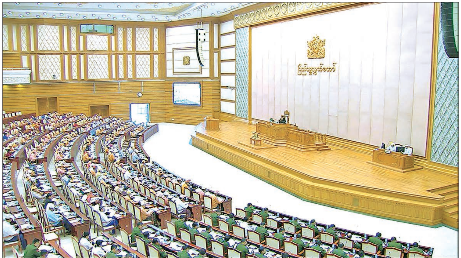
Second Pyithu Hluttaw holds 5 th -day meeting of its 10 th regular session in Nay Pyi Taw.