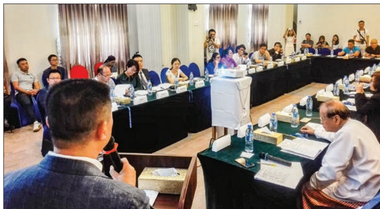
Workshop on Communication and Cooperation between Chinese Enterprises and NGOs in Myanmar held in Yangon.