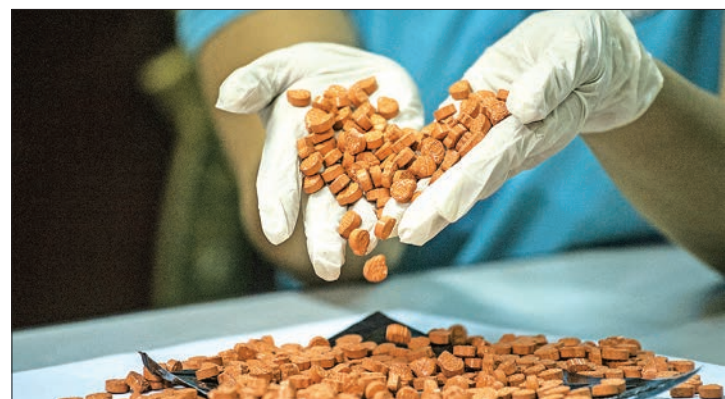
A Bureau of Customs (BOC) personnel displays confiscated illegal drugs, known as Methylenedioxymethamphetamine (MDMA), commonly referred to as ecstasy, at a press conference at the BOC headquarters in Manila on 14 September, 2016.