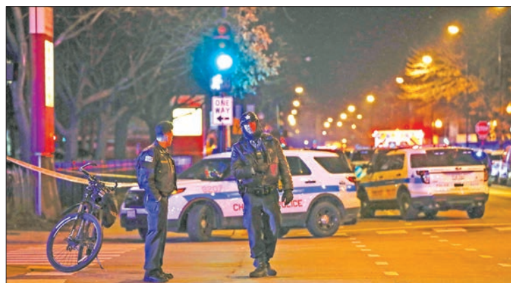
Chicago Police officers monitor the area outside of the Chicago Mercy Hospital where a gunman opened fire in Chicago on 19 November, 2018.

CHICAGO (United States) — A gunman opened fire Monday at a hospital in the US city of Chicago, police said, adding that there were reports of “multiple victims” including a wounded officer in “critical condition.”