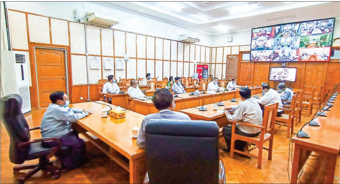
Union Minister U Han Zaw attends the meeting on video conferencing between its headquarters in Nay Pyi Taw and the directors of projects in Regions/States yesterday.

for casualties and their families. The Union Government is resolved to continue with efforts to take the Peace Process, which aims at putting an end to the sufferings imposed by conflict on our people, to a successful conclusion.—MNA