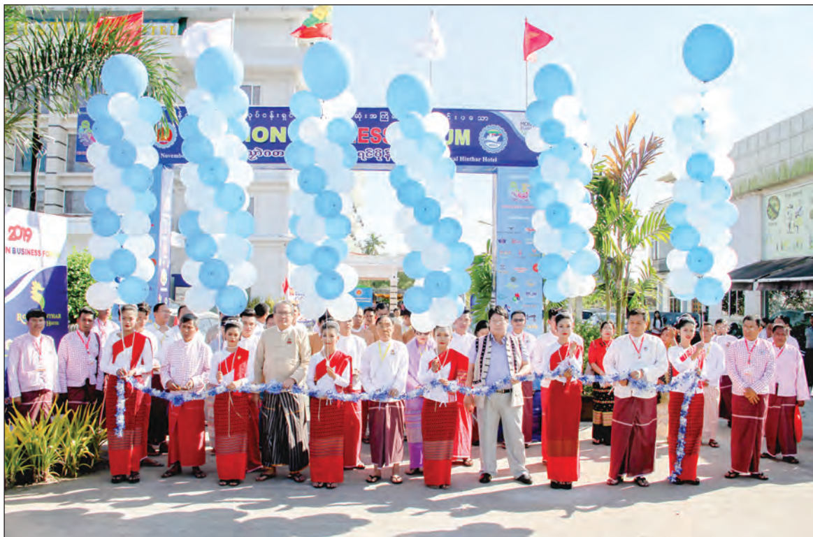
Union Minister Nai Thet Lwin attends the opening of 2019 Mon Business Forum in Mawlamyine on 2 November 2019.

According to the 2008 Constitution, "National Races" means the ethnic groups those who regard the Republic of the Union of Myanmar as their country of origin and live continuously in the country. But, those who are granted citizenship and guest citizens are not included.