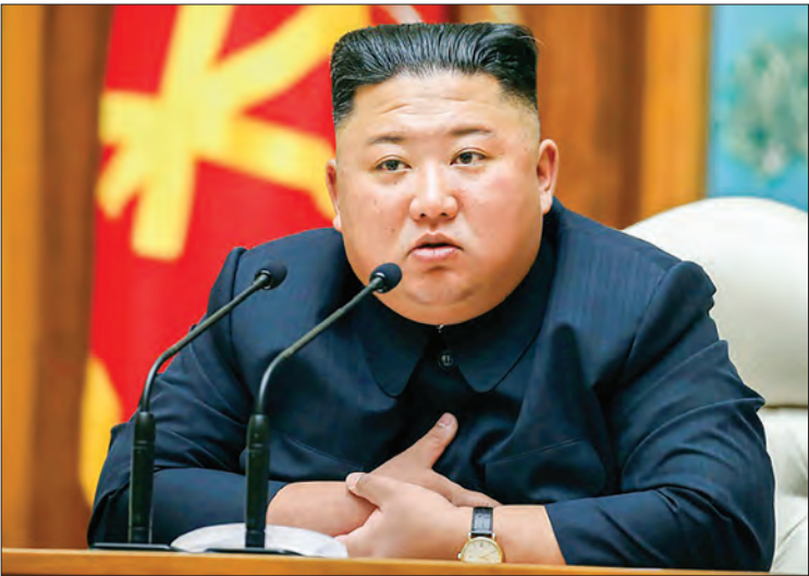
Kim Jong Un's health is frequently the subject of speculation, but little concrete is known about the secretive leader.

But there were no explicit denials that Kim, who is in his mid-30s, had had some kind of procedure. Previous absences