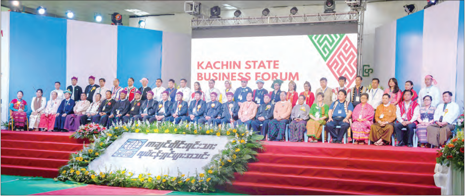
Officials and attendees pose for a group at the Kachin State Business Forum in Myitkyina.

With the aim of handing over jewellery production techniques to next generation, Su Htoo Pan, an education charity foundation, established a vocational institute for manufacturing finished jewellery. Admission to the institute was chosen by the Ministry of Ethnic Affairs. Su Htoo Pan Foundation helps those who completed a course at the institute to get a job at the small and