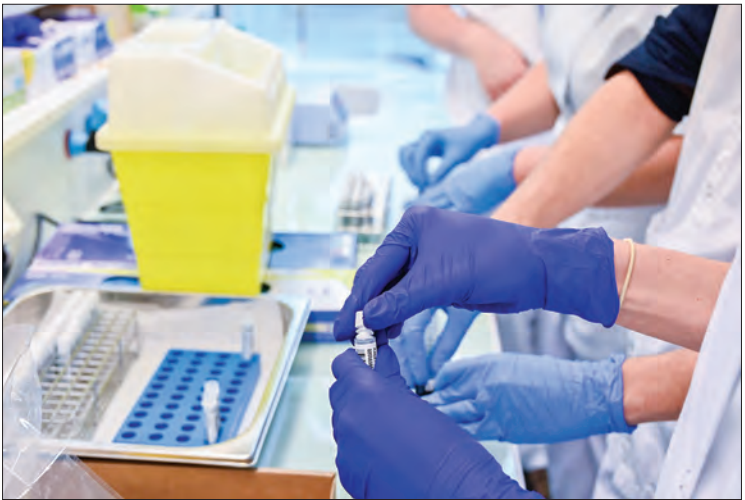
Medical staff prepare nasal swabs for analysis in a high detection rate Polymerase Chain Reaction (PCR) machine to screen for COVID-19, on 21 April 2020, at the Croix-Rousse hospital in Lyon, central-eastern France, on the 35 th day of a lockdown in France aimed at curbing the spread of the COVID-19 pandemic, caused by the novel coronavirus.

For the first time since World War II, German officials cancel Oktoberfest, a beloved beer-swilling festival in southern