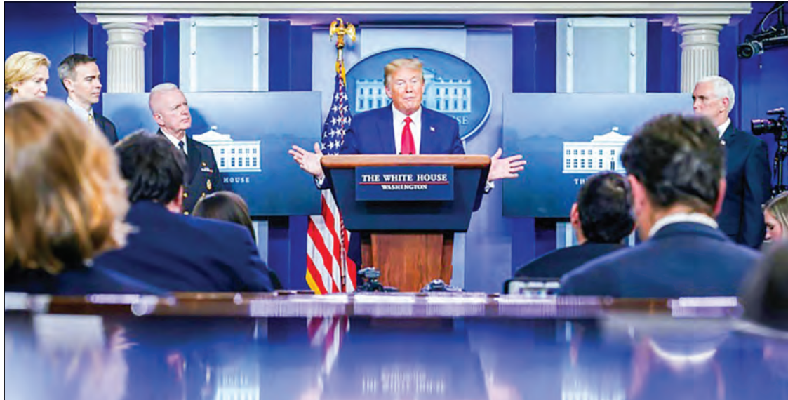
President Donald Trump speaks during the daily briefing on the novel coronavirus. He suspends immigration insisting he is protecting American jobs but critics say he is appealing to his base in an election year.

The US is the host of the world’s deadliest outbreak, with more than 42,000 deaths and 784,000 known infections nation-