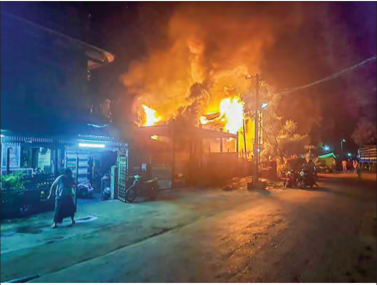
Fire gutted house in Monywa.

their houses,” said U Nyi Nyi Zaw, the head of fire services department of Monywa District. Most of the cases, 11 in total, happened in March, one of the hottest months in Monywa district with three each taking place in January, February and April. “We want the local people to change the old electric wires. Now, the weather is too hot and people are using air cons and fans all the time and the old ones could not stand to overheat. Most cases of fire outbreak took place in the vil-