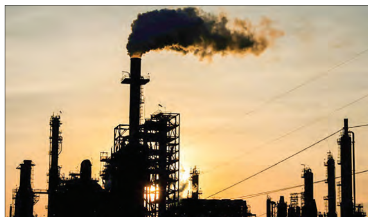
Oil markets have been ravaged this year by a collapse in demand caused by the virus and the Saudi-Russian price war.

The World Health Organization (WHO), which has people to be vigilant about claimed cures for COVID-19, did not attend the event. The US Centers for Disease Control (CDC), referring to claims for herbal or tea remedies, says: “There is no scientific evidence that any of these alternative remedies can prevent or cure the illness caused by COVID-19. In fact, some of them may not be safe to consume.” — AFP