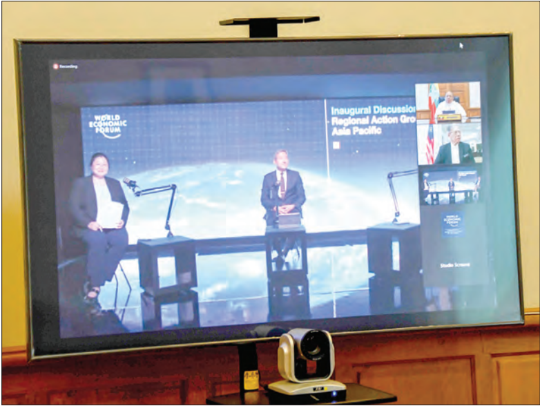
Union Minister U Thaung Tun participates via videoconference in the inaugural COVID-19 Action Platform for the Asia Pacific organised by the World Economic Forum (WEF).

The videoconference provided participants with an opportunity to exchange perspectives and share insights designed to strengthen regional resilience, develop coordinated responses, and enhance public-private cooperation in