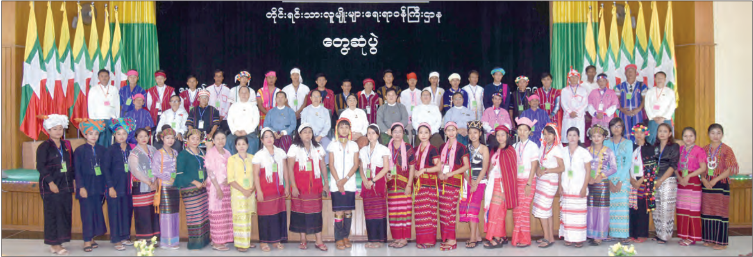
Union Minister Nai Thet Lwin poses for a group photo together with ethnic literature and culture troupes from Kayah and Chin States.

Ministry of Ethnic Affairs was striving to promote the socio-economic development of ethnic national brethren and assist building a genuine Federal Democratic Union. (Translated by Khin Wai Lwin)