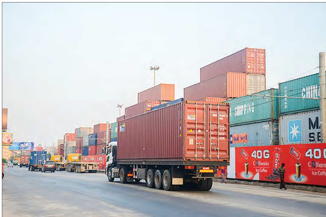
A truck drives past a cargo container yard in Yangon. FILE PHOTO