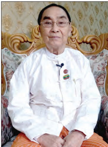
Union Minister Nai Thet Lwin

The Vice President said the meeting to organize the Myanmar Ethnic Culture Festival 2020 in accordance with the objectives of the festival -- to assist the national peace process, showcase ethnic solidarity and culture to Myanmar citizens and foreign visitors,