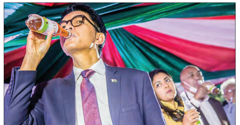
Madagascan President Andry Rajoelina gave the official launch to a herbal tea claimed to prevent and cure coronavirus.

But its safety and effectiveness have not been assessed internationally, nor has any data from trials been published in peer-reviewed studies. Mainstream scientists have warned of the potential risk from untested