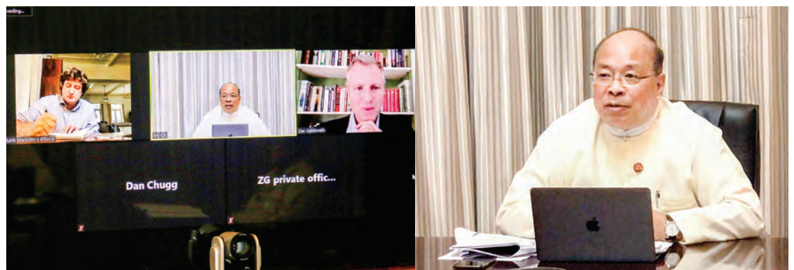
Union Minister U Thaung Tun (centre) meeting with the minister (left) and the ambassador (right) of the United Kingdom via videoconferencing on 22 Sept.

"I can confirm that our economic recovery plan recognizes the need to integrate a sound,