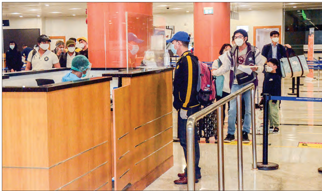
Myanmar returnees from foreign countries are queuing at immigration counter of Yangon International Airport on 22 Sept.

The Ministry of Foreign Affairs has been working with Myanmar embassies in foreign countries and local ministries concerned to bring back citizens stranded abroad due to the suspension of international commercial flights, in accordance with the guidance of the National-Level Central Committee on Prevention, Control and Treatment of COVID-19. Myanmar has organized 23 relief flights to date to bring its citizens stuck in foreign countries via Incheon International Airport every Tuesday. — MNA (Translated by Khine Thazin Han)