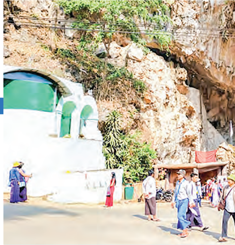
Htan San Cave.

The government is encouraging service businesses in a bid to develop in Myanmar with entrepreneurs working together with local people in order to achieve success. There is plenty of worth-visiting places in Myanmar such as waterfalls, springs, safaris, zoos, travel sites, elephant camps, community-based sites, world heritage listed ancient archeological are-