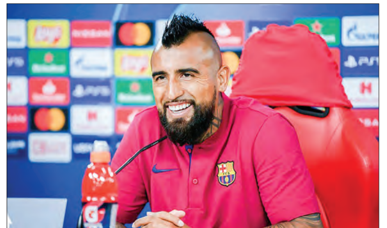
Arturo Vidal has played 115 times for Chile since his debut in 2007.

Inter described the Chilean midfielder as a "warrior". "From today, Vidal will be on the front line for the Nerazzurri, with the same objectives as ever: fighting, giving it his all, and winning," the Italian club added.—AFP ■