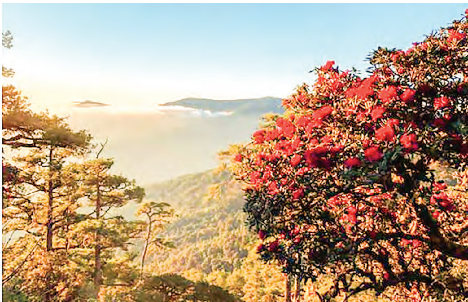
Natmataung ASEAN Heritage Natural Park in Chin State.

Entrepreneurs can do cruise business in Ayeyawady, Chindwin, Sittoung and Shweli rivers in Myanmar. Mountaineering expeditions to iced mountain and other mountains should be arranged commercially. Planning relaxation trip to the unique places like Myitson can make much profit. Myanmar's beauties of nature are more natural than some other countries' outdoing them. But to improve smokeless businesses needs peace and tranquility, better transport and infrastructure facilities. Different media channels are needed to