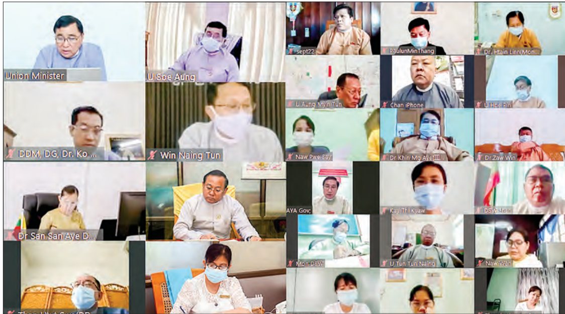
Union Minister Dr Win Myat Aye holds the virtual meeting with government officials from Nay Pyi Taw Council, regions and states on 22 September.

UNION Minister for Social Welfare, Relief and Resettlement Dr Win Myat Aye, in his capacity as Secretary of the National Volunteer Corps, held a virtual meeting with government officials from Nay Pyi Taw Council,