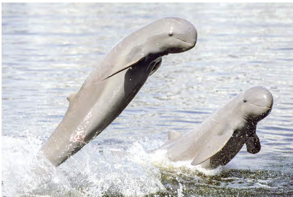
Dolphins in the Ayeyawady River.