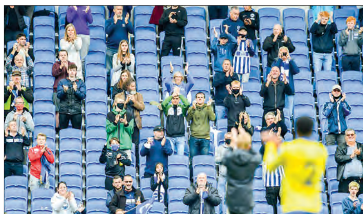
Fans attend a pre-season friendly between Brighton and Chelsea on a socially distanced basis.

But Cabinet Office Minister Michael Gove said a "mass reopening" would not be appropriate at the current time, dealing a devastating blow to sports bodies