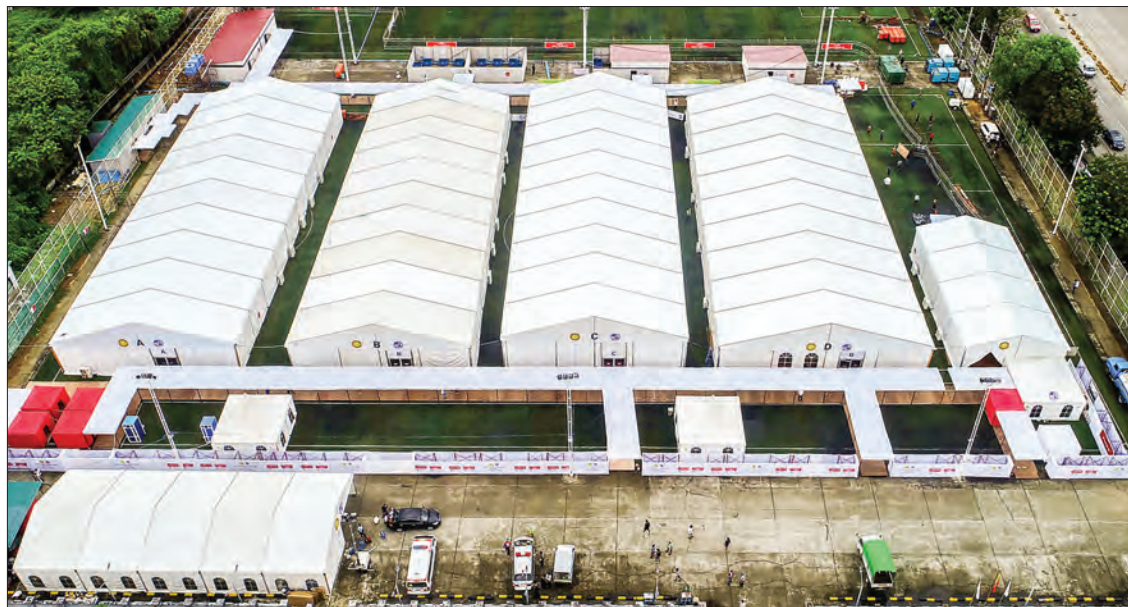
Unit A of Ayeyarwady Centre for COVID patients in Thuwunna Stadium in Yangon on 22 Sept.

THE Ayeyarwady centre will be expanded to a 770-bedded quarantine facility to provide medical treatments to COVID-19 patients in .