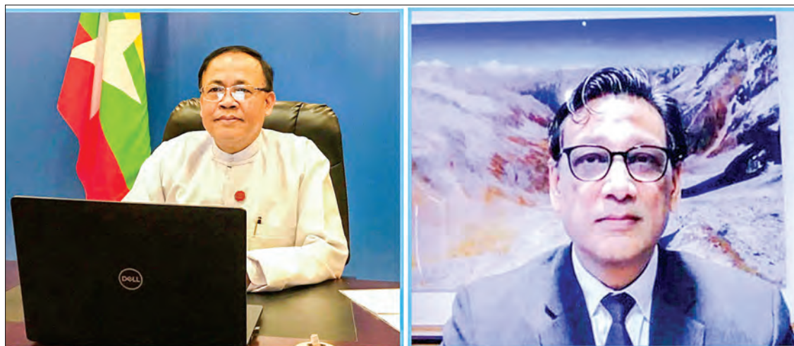
Union Minister U Kyaw Tin holds talks online with newly-appointed Resident Representative of UNDP in Myanmar.

UNION Minister for International Cooperation U Kyaw Tin held discussions with Mr Titon Mitra, the newly-appointed Resident Representative of UNDP in Myanmar, at 10:00 am, on 22 September 2020 via videoconference. During the occasion, the presentation of credentials by Mr Titon Mitra to the Union Minister was conducted through video link.