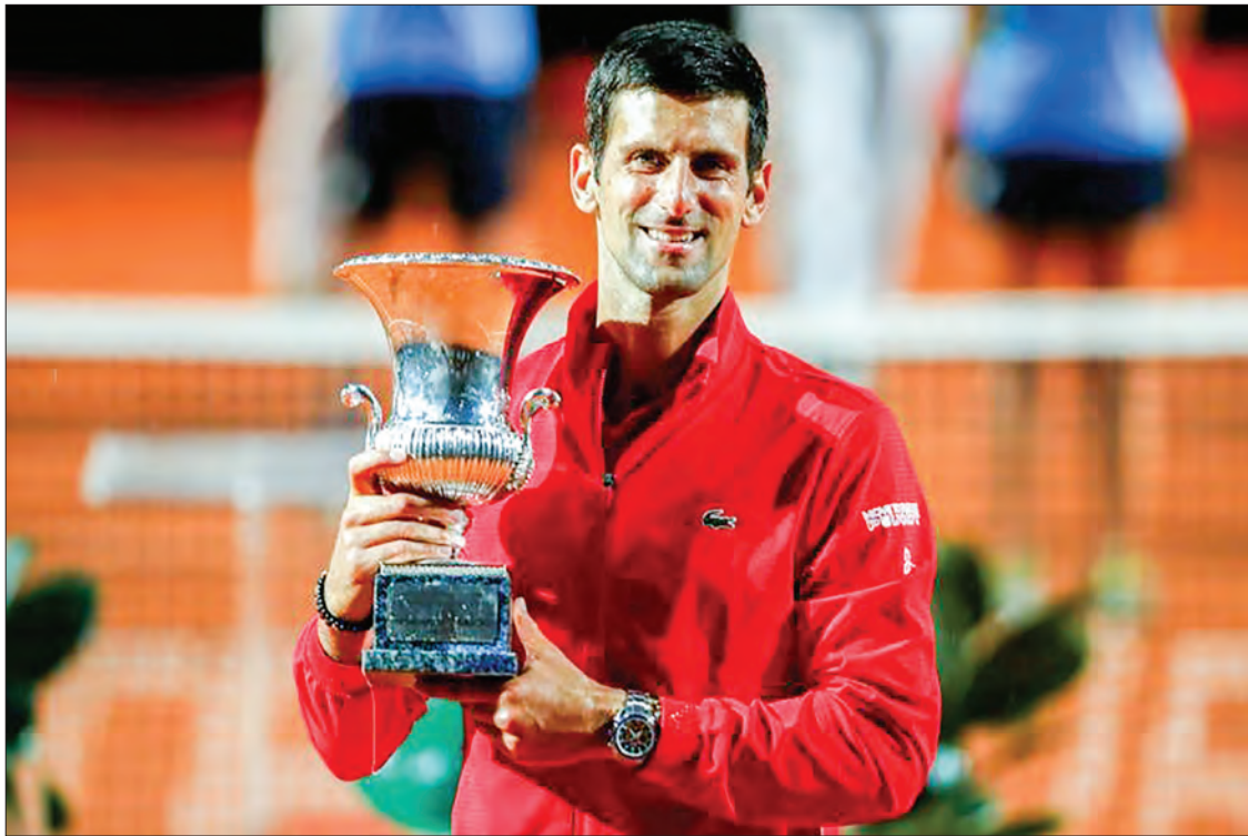
Novak Djokovic won a fifth Italian Open title and first since 2015.