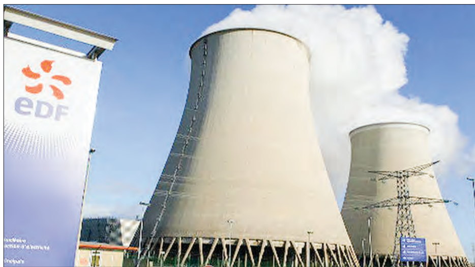
French energy giant EDF and China General Nuclear Power (CGN) are working together on the £19.6-billion ($26-billion, 22-billion-euro) Hinkley plant, which is key to the British government's long-term energy plans.

Austria has long campaigned against nuclear power, bolstered by a referendum in 1978 rejecting atomic energy. —AFP ■