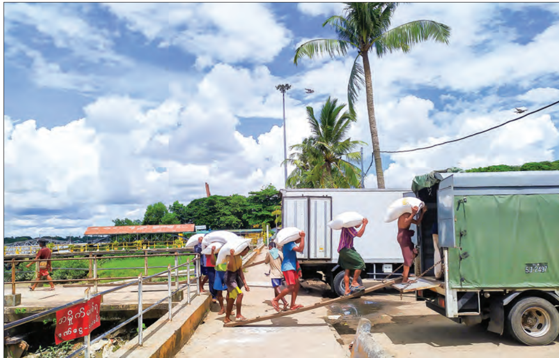
Labourers are uploading rice bags onto a truck in Yangon.

THE rice depots under Myanmar Rice Millers Association (MRMA) will be opened three days a week in Wahdan and Bayintnaung wholesale commodity