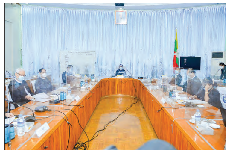
Bar Council holds the first meeting online with new members after its election in August.

discussed capacity building of advocates, their ethics, issuing advocate licences and regis-