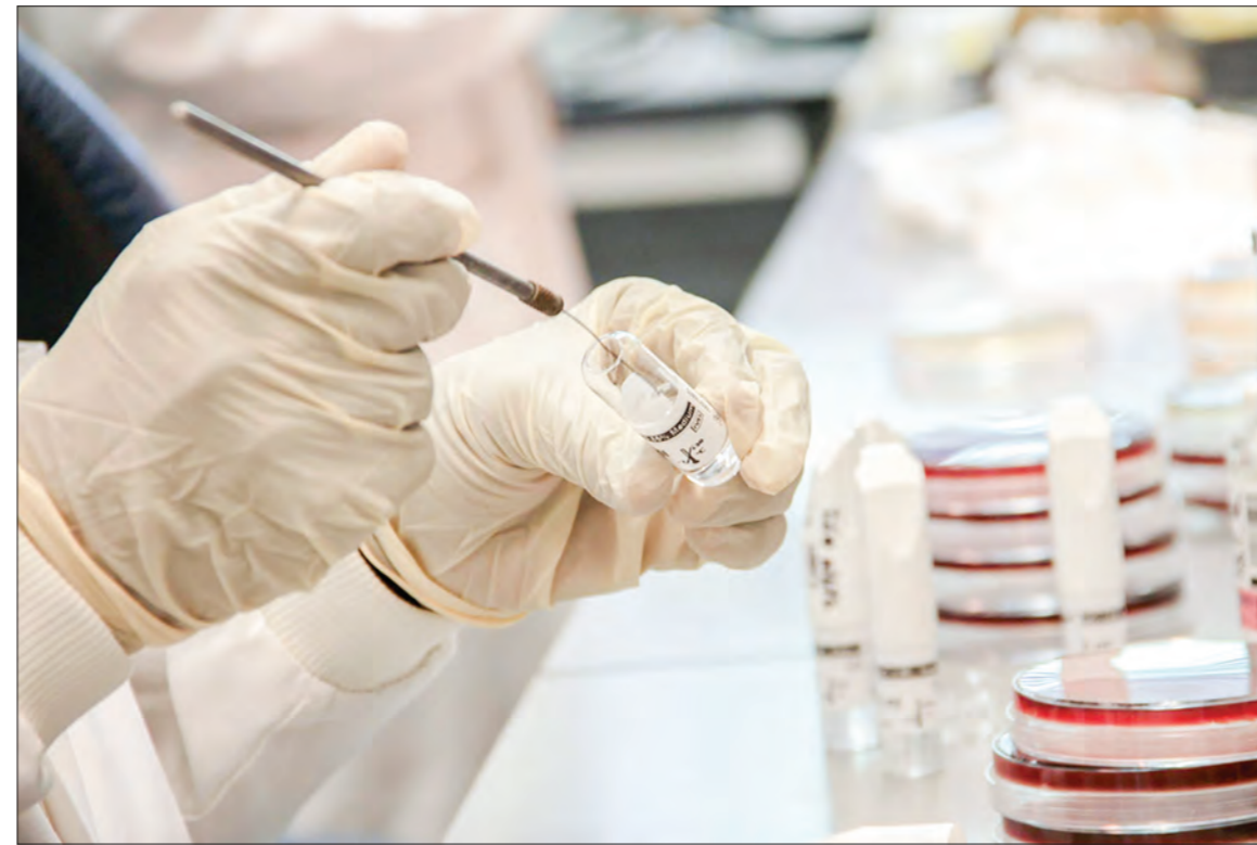
Self-financing economies, which include 29 from 'Team Europe' participating as part of an agreement with the European Commission, join 92 lower income economies eligible for financial support through the Gavi COVAX Advance Market Commitment.

The allocation of vaccines, once licenced and approved, will be guided by an Allocation Framework released today by WHO following the principle of fair and equitable access, ensuring no participating economy will be left behind. Policies determining the prioritization of vaccine rollout within economies will be guided by recommendations from the WHO Strategic Advisory Group of Experts on Immunization (SAGE), which has recently released a Val-