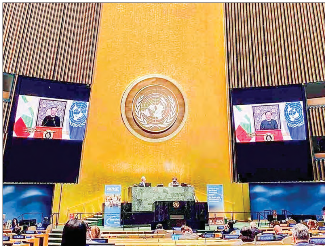
Union Minister U Kyaw Tin emphasizes the need of stronger multilateral system in his statement to the 75 th anniversary of the United Nations on 21 September 2020.

The world today is getting more polarized; geopolitical and economic tensions are rising high. Above all else, we are now faced with the COVID-19 crisis which is putting immense pressure on our societies and economies. It has caused loss of jobs and livelihoods, exacerbated poverty, disrupted education, and the hardest hit have been the most vulnerable. At this critical time, the world is more than ever in need of a stronger multilateral system for a collective response to this most consequential challenge in its history.