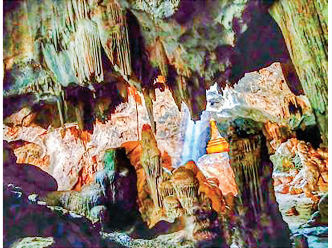
Pyadalin Cave Ywangan Township, Taunggyi, Shan State.

spotlight Myanmar's beauties of nature for enabling the global people to know them.