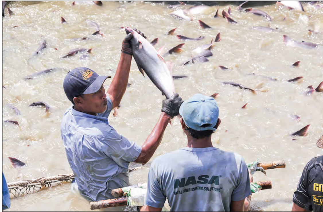
Myanmar Livestock Federation has sought permissions to run feedstuff processing factories to fulfil demand of feedstuffs.

Myanmar Livestock Sector plays a pivotal role in nutrition efficiency and food security of the people. Myanmar has a total of 388 million chickens, including broilers and layer chickens, 9.5 million draft cattle, 0.11 million dairy cattle, 1.8 million