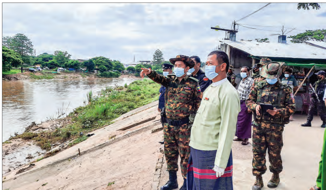
Local authorities inspect security measures along the Thaungyin River to prevent illegal crossings between Myanmar and Thailand border on 22 Sept.

Despite the suspension of border crossing amid COVID-19 spread, the reports on