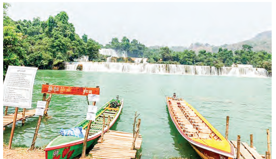
Haikpa waterfall, one of cultural heritages in Mongshu Township where Palaung ethnic reside in unison in southern Shan State, is formed with seven to nine steps of waterfall. It is a natural scene filled with various species of wildlife and birds, said locals.