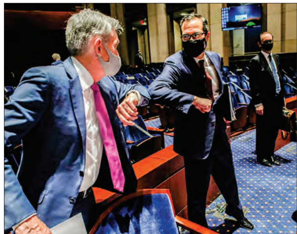
Fed Chair Jerome Powell, left, and Treasury Secretary Stephen Mnuchin, pictured in June 2020, are set to appear before the House Financial Services Committee.