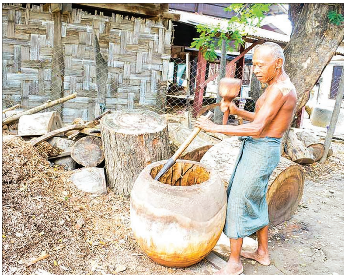
Woodturning artist pushing the inside of wooden vessel at his firm in Kyarpaing village in Monywa Township, Sagaing Region.