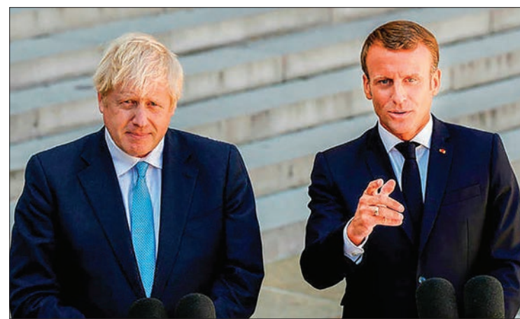
French President Emmanuel Macron (r) gestures as he delivers a speech to the press next to Britain’s Prime Minister Boris Johnson (l) prior to their meeting at The Elysee Palace in Paris on 22 August 2019.