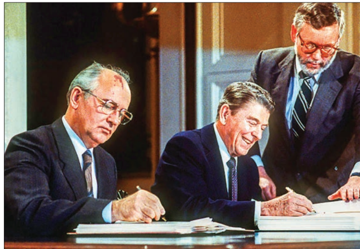
FILE PHOTO: Soviet leader Mikhail Gorbachev and US President Ronald Reagan sign a landmark treaty eliminating US and Soviet intermediate-range and shorter-range nuke missiles in Washington in December 1987.

MOSCOW — Russian President Vladimir Putin said on Friday he has ordered the military to prepare a “symmetric response” after Washington tested a formerly banned missile.