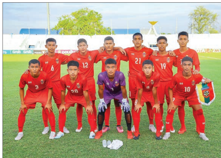
The Myanmar U-15 boys football team pose for a group photo ahead of an international football match.