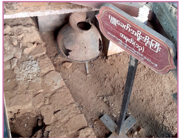
Ancient Stone burial Urn.

The pagoda built over the original pagoda was 60 elbows (equivalent to 90 feet) in the basic circumference and 50 elbows (75 feet) in height. Tamoke Shwegugyi double enveloped cave pagoda was 59 feet long, about 36 feet wide and