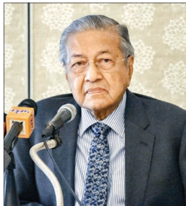
Malaysian Prime Minister Mahathir Mohamad gives a lecture in Fukuoka, southwestern Japan, on 8 August, 2019.

Malaysia, which aims to achieve a high-income econ-