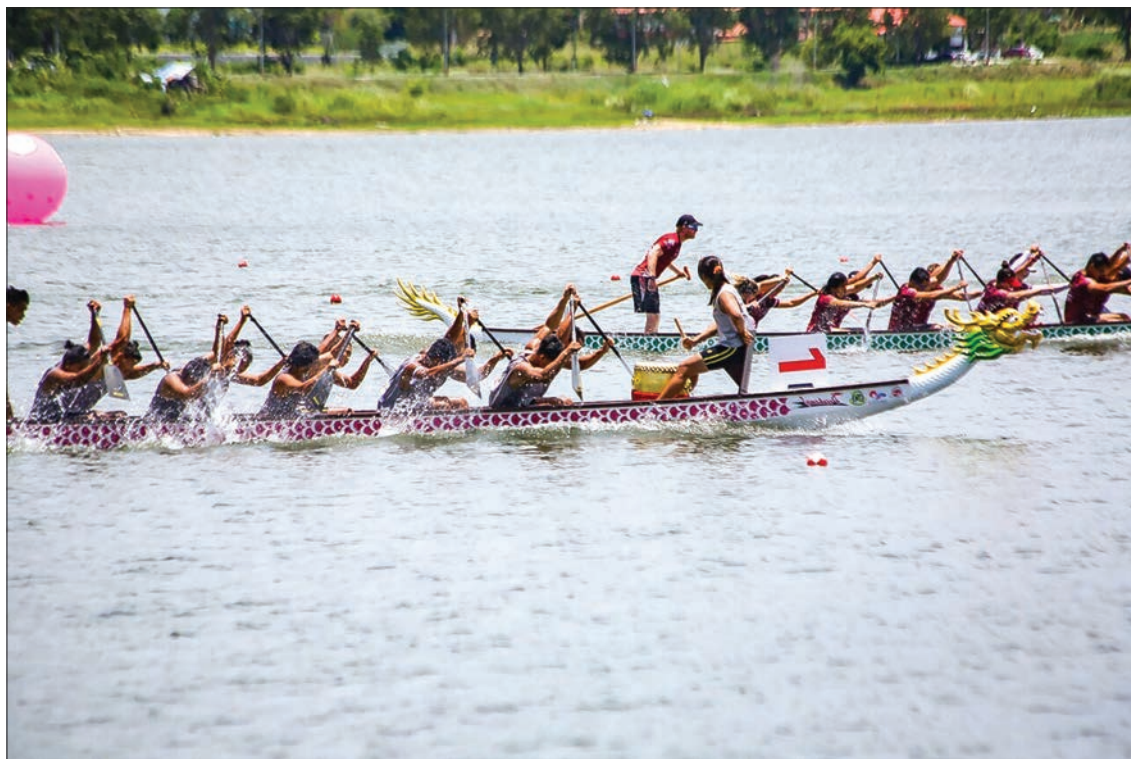
Team Myanmar compete in the Under-24 mixed men and women 500-meter Small Boat race at the 14 th World Dragon Boat Racing Championship on 23 August in Pattaya, Thailand.

MYANMAR won one silver and one bronze medal yesterday, the third day of the 14 th World Dragon Boat Racing Championship which is being held in Pattaya, Thailand.