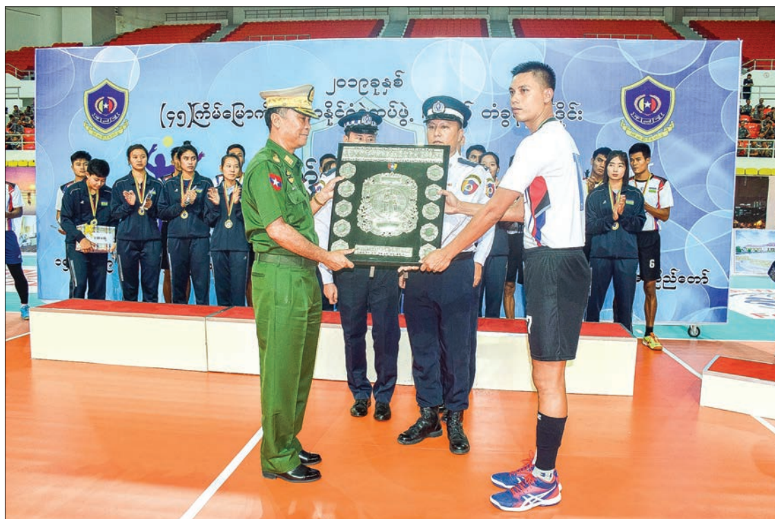
Union Minister for Home Affairs Lt-Gen Kyaw Swe presents the Championship Shield to Traffic Police Men Team at the 45 th Police Chief Shield Volleyball Championship final tournament in Nay Pyi Taw.