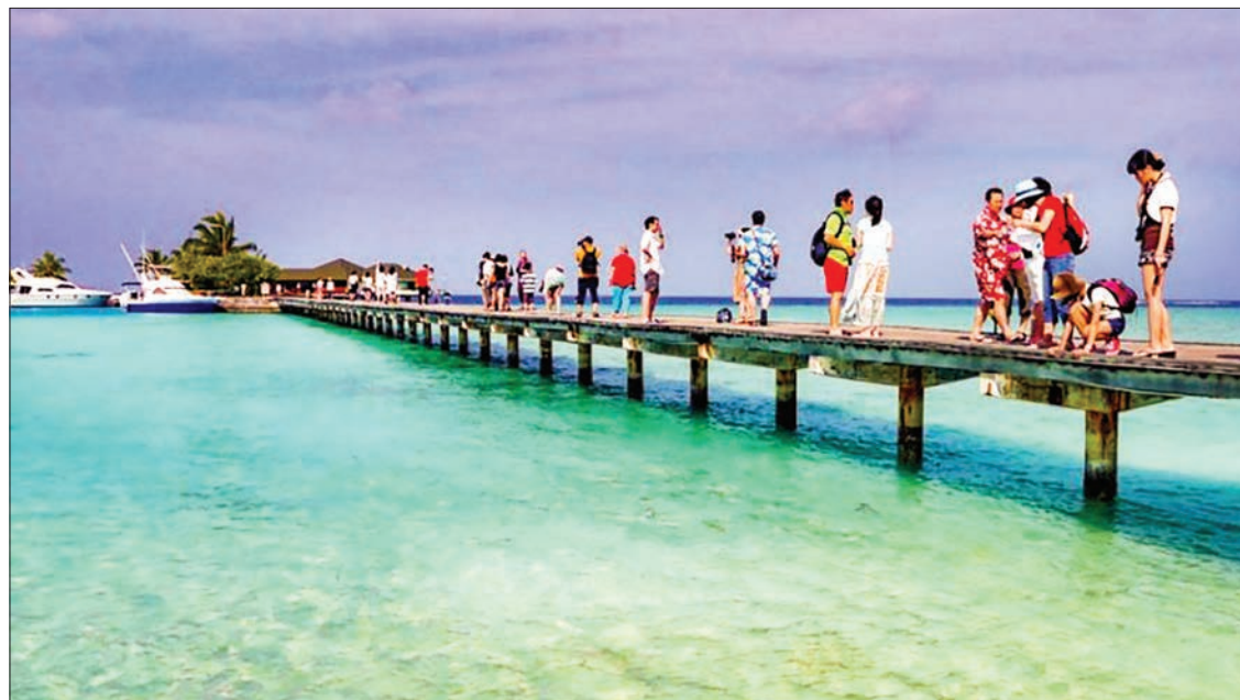
China is currently the top market for Maldives tourism as there was a 7.6-per cent growth in Chinese tourist arrivals till August.

MALE — Tourist arrivals to the Maldives crossed the 1 million mark in August as the number of visitors to the island country recorded a strong growth in recent months, the Tourism Ministry said on Friday.