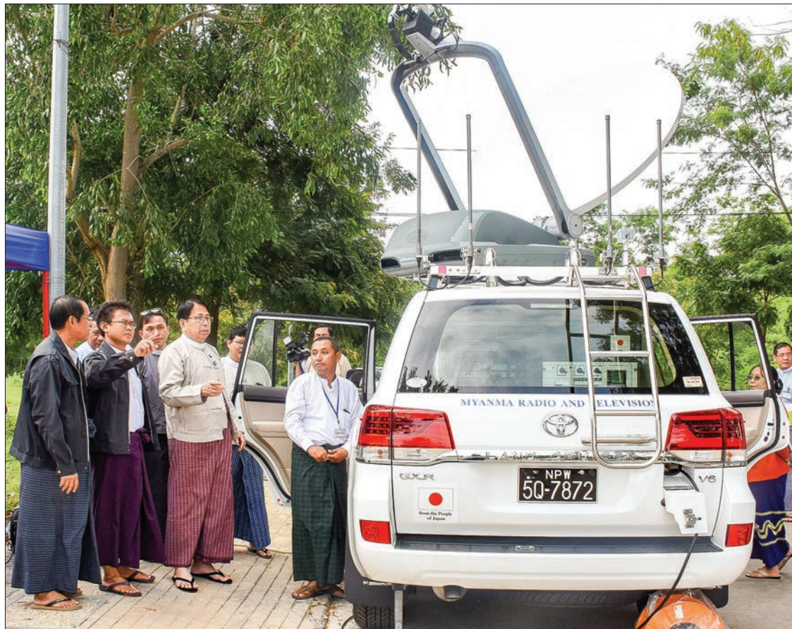
Union Minister for Information Dr Pe Myint inspects the DSNG Van of the Myanmar Radio and Television in Tatkone, Nay Pyi Taw yesterday.

UNION MINISTER for Information Dr Pe Myint advised the staff members of Myanmar Radio and Television to prove their professional standard in trying to represent the ministry.