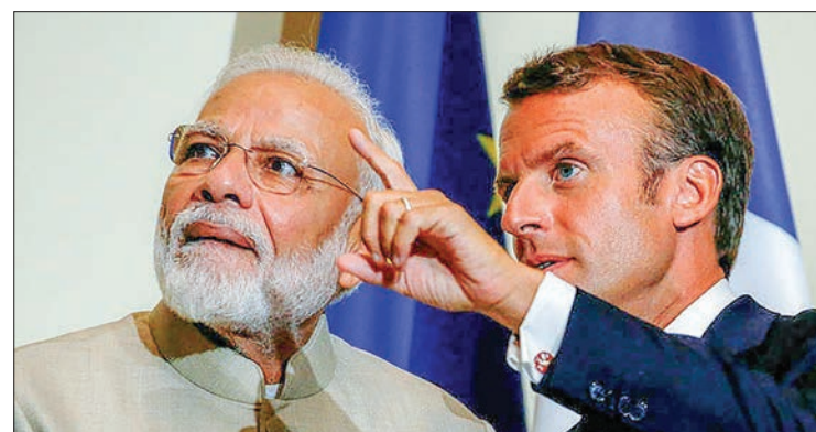
French President Emmanuel Macron gestures as Indian Prime Minister Narendra Modi looks on (l) after their joint statement following a meeting at the Chateau of Chantilly on 22 August, 2019, near Paris.