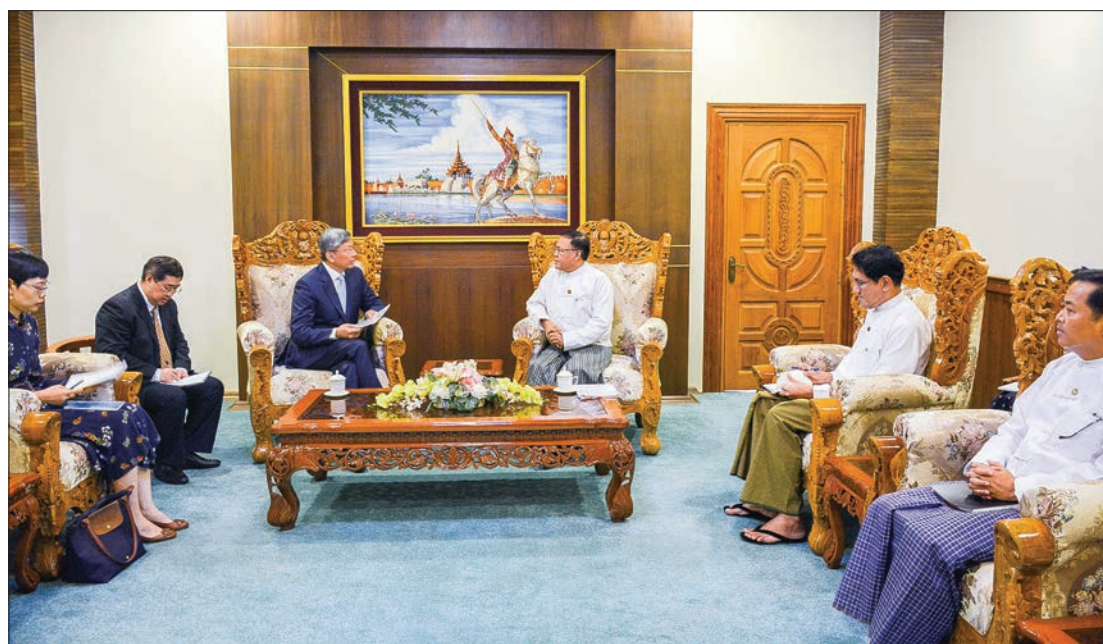
Union Minister U Kyaw Tin holds talks with Ambassador of the People's Republic of China Mr Chen Hai in Nay Pyi Taw yesterday.

U Kyaw Tin, Union Minister for International Cooperation, received Mr Chen Hai, Ambassador of the People's Republic of China to Myanmar, on 22 August 2019 at the Ministry of Foreign Affairs, Nay Pyi Taw, yesterday.