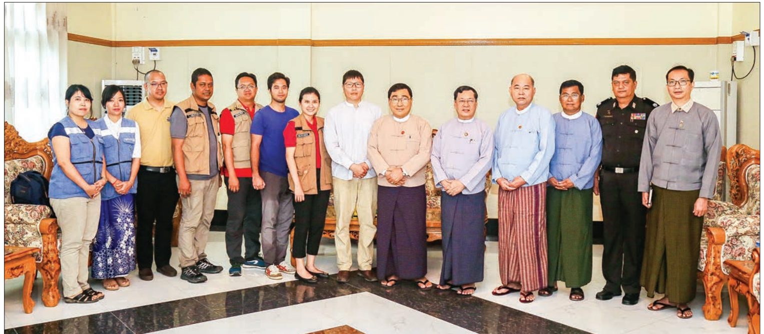
Union Minister for Labour, Immigration and Population U Thein Swe, Union Minister for Social Welfare, Relief and Resettlement Dr Win Myat Aye pose for the documentary photo together with ASEAN representatives in Sittway on 23 August 2019.

In referring to this information, the Myanmar government invited ASEAN representatives to witness the repatriation pro-