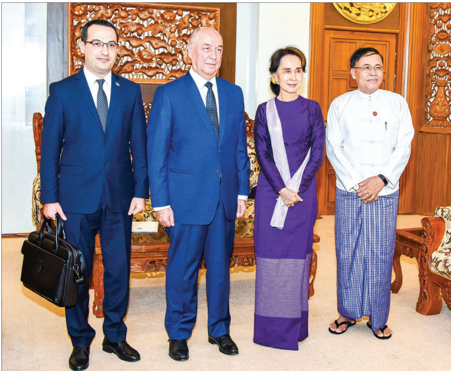
State Counsellor Daw Aung San Suu Kyi poses for a photograph together with a delegation led by Mr Qaley Allahverdiyev, Ambassador of the Republic of Azerbaijan to Myanmar in Nay Pyi Taw yesterday.

S TATE Counsellor and Union Minister for Foreign Affairs Daw Aung San Suu Kyi received Azerbaijani Ambassador to Myanmar Mr Qaley Allahverdiyev at the ministry in Nay Pyi Taw yesterday afternoon.