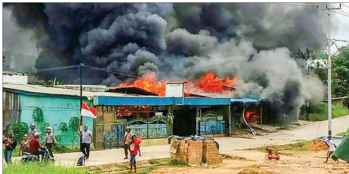
Most of the nearly 300 prisoners who fled when their jail went up in flames have voluntarily returned to serve out the rest of their sentence in Indonesian Papua.

“But they weren’t trying to escape — they just wanted to save themselves from the fire,” prison spokesman Elly Yuzar said Friday.—AFP ■