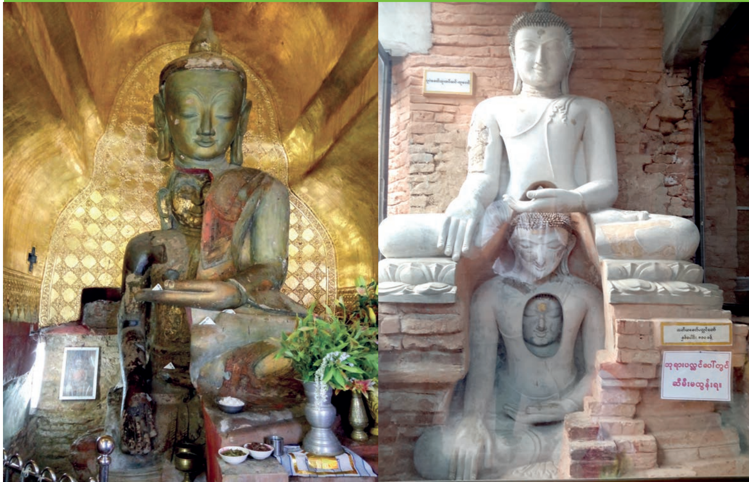
Tamoike Shinpin enveloped Buddha images.