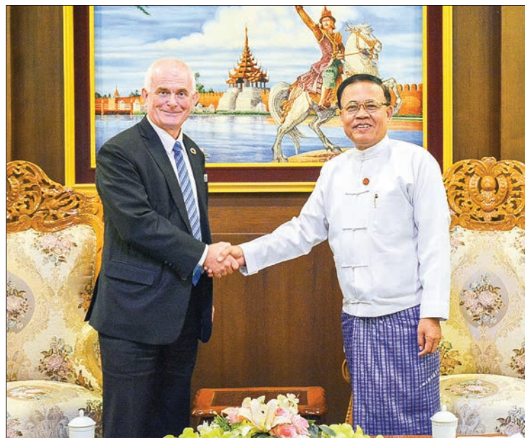
Union Minister U Kyaw Tin shakes hands with United Nations Resident and Humanitarian Coordinator, ai Mr Knut Ostby in Nay Pyi Taw.

During the meeting, they exchanged views on matters related to the strengthening of cooperation between Myanmar and the United Nations, Myanmar's efforts for commencing repatriation of displaced persons from Rakhine State, finalization of the Government-led draft "National Strategy for Closure of IDP Camps in Myanmar", the implementation of MoU signed between the Government of Myanmar, UNDP and UNHCR and the designation of new Resident Coordinator of United Nations to Myanmar. Also present at the meeting were the officials from the Ministry of Foreign Affairs. — MNA ■