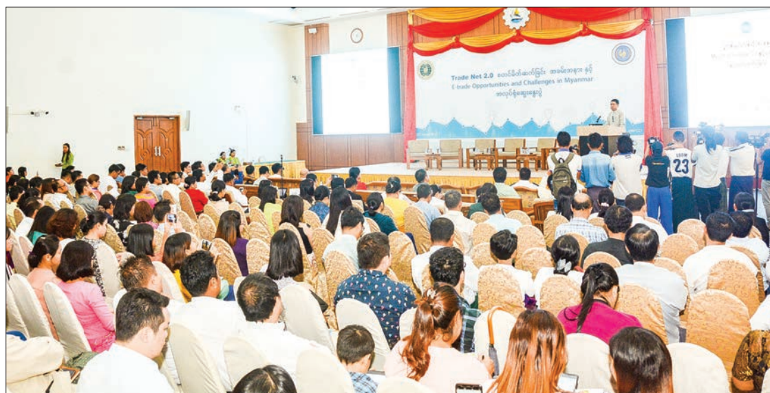
A workshop on E-trade Opportunities and Challenges in Myanmar in progress at the UMFCCI in Yangon yesterday.

She said the Ministry of Commerce began providing an online system for licensing processes and trade facilitation services in 2004 and has been upgrading their systems annually. She said