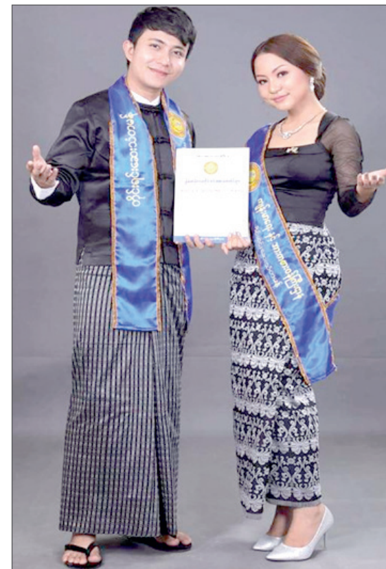
Traditional Medicine Ambassadors

In addition, the DTM is picking up speed to promote new thinking on innovation and access to traditional medicine on 19th August, 2019. So it is also believed that the Milestones of Traditional Medicine in Myanmar and Traditional Medicine