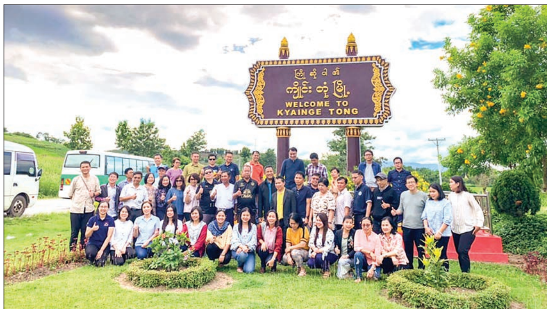
Foreign travellers seen in front of the entrance welcome sign of Kengtong in Shan State.

Visitors also made night trips to well-known pagodas, temples, monasteries, markets, villages, and other destinations in Mongphyat and Kengtung townships. Additionally, some visitors flew on the He-