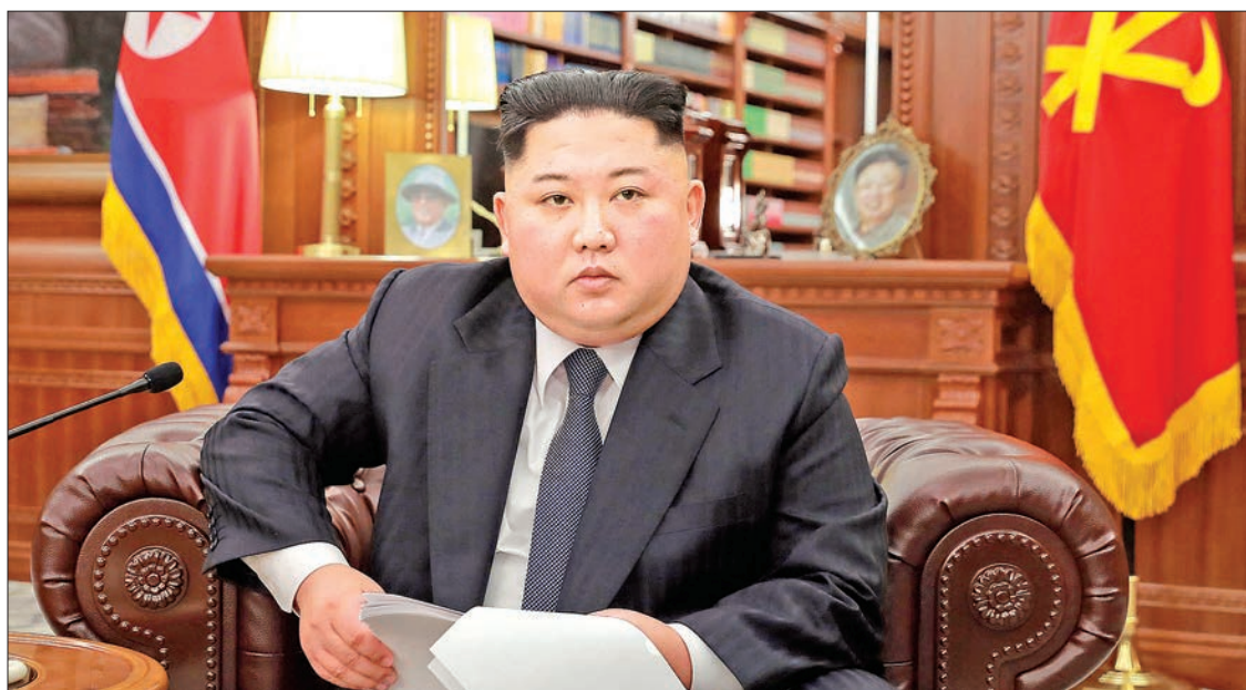
North Korean leader Kim Jong Un.