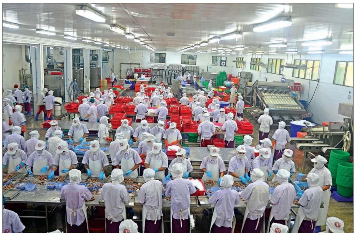
A prawn cold storage factory in Thandwe, Rakhine State.