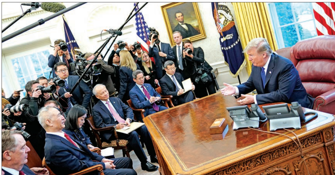
US President Donald Trump (r) meets with Chinese trade envoy Liu He (l) in the Oval Office on Friday.

Details remained scant about any concrete progress in the seven-month-old trade war, which has rattled global markets and prompted stark warnings about the risks to the world economy.