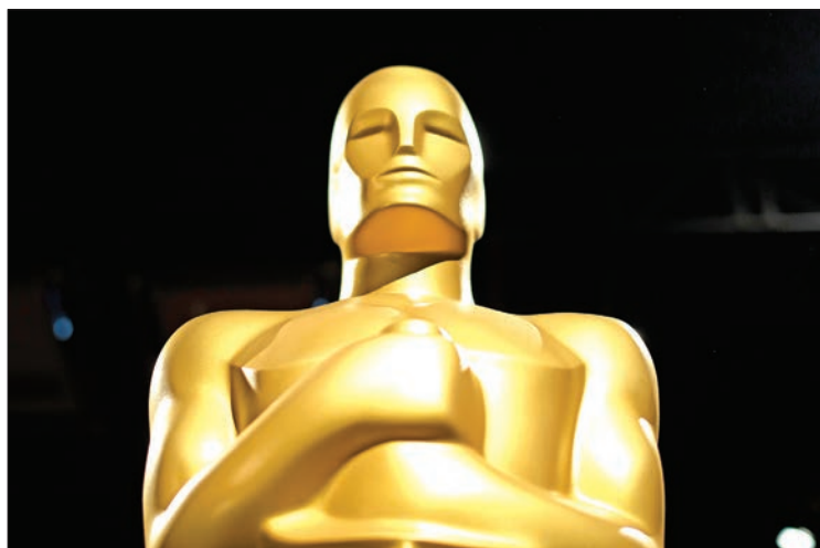
The Oscars will be without a host this year for the first time in three decades—will that make the show better?