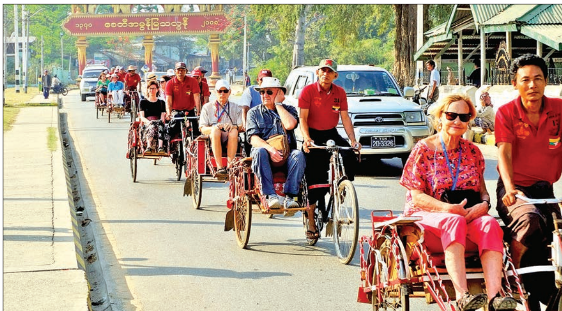
Tourists enjoy beautiful sights in Magway by riding trishaw.

Tourist arrivals in Magway Region have amounted to 2,055 as of January 2019, and there