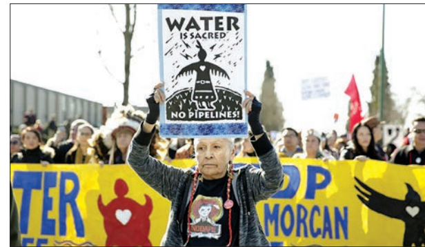
The pipeline has faced opposition from environmentalists and indigenous tribes (protest pictured March 2018) worried that increased shipping from a marine terminal in Vancouver would impede the recovery of the local killer whale populations.

OTTAWA (Canada)—Canada's energy regulator renewed its support on Friday for a controversial oil pipeline to the Pacific, saying the risks to endangered whales from increased tanker traffic were "justified." Prime Minister Justin Trudeau's government ordered a review of the Trans Mountain Project taking into account its impact on killer whales after the Federal Court of Appeal blocked it over concerns for the marine mammals. The National Energy Board (NEB) said the project would have "significant adverse environmental effects" on the whales and an oil spill could have equally horrendous impacts on the marine environment.