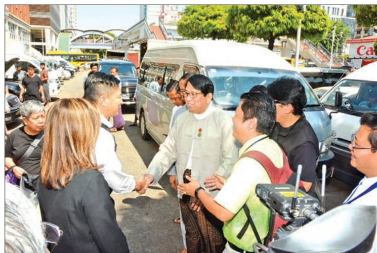
Union Minister Dr. Pe Myint greets members of the film crew of the Line Walker-2 during his visit to shooting place yesterday.