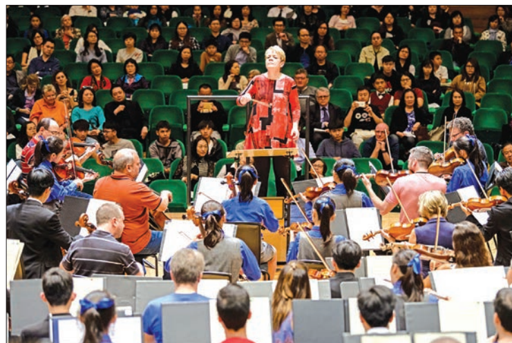
Marin Alsop hopes her ongoing efforts to widen access to the world of classical music will prove her strongest legacy.

She credits her “entirely supportive” parents and her own “stubborn” streak for helping her persevere in her push to wield the baton. Her determination and talent eventually won the budding conductor the attention of Bernstein himself, who took her