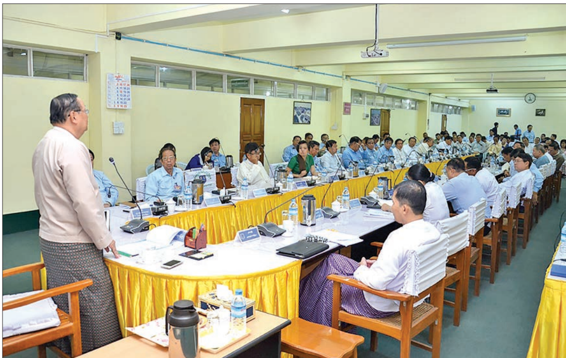
Union Minister U Win Khaing addresses the Yangon Region electrical sector coordinating meeting.

A Yangon Region electrical sector coordinating meeting between the Ministry of