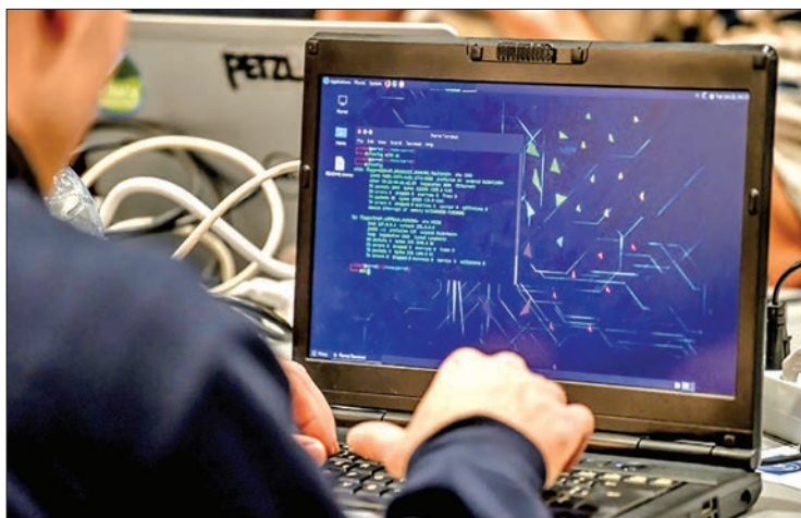
The internet’s global address keeper is warning of large-scale attacks threatening key parts of the online infrastructure.