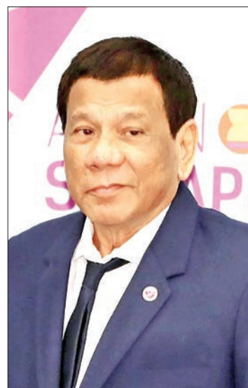
Undated file photo shows Philippine President Rodrigo Duterte.