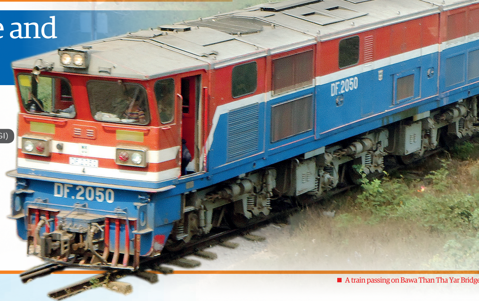
■ A train passing on Bawa Than Tha Yar Bridge.

to secure it in place. The cost of construction was said to be 1,698,200 Indian rupees (around Ks 36,543,513 in today's exchange rate).