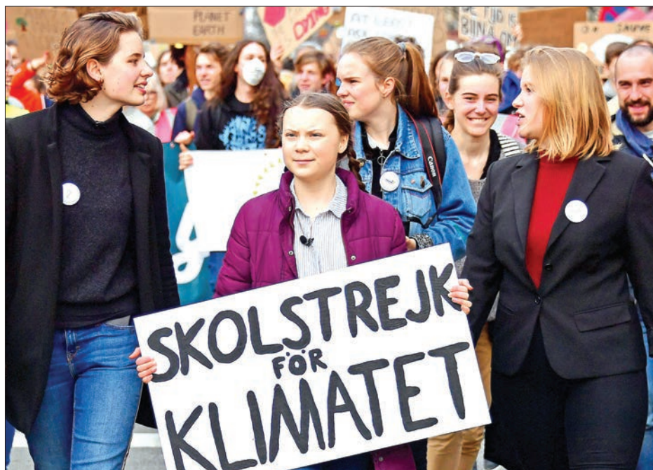
Teenage climate activist Greta Thunberg, seen here in Brussels, began skipping classes in Stockholm six months ago to hold weekly Friday protests.

In the last six months, tens of thousands of high school students—in Sydney, Brussels, Berlin, The