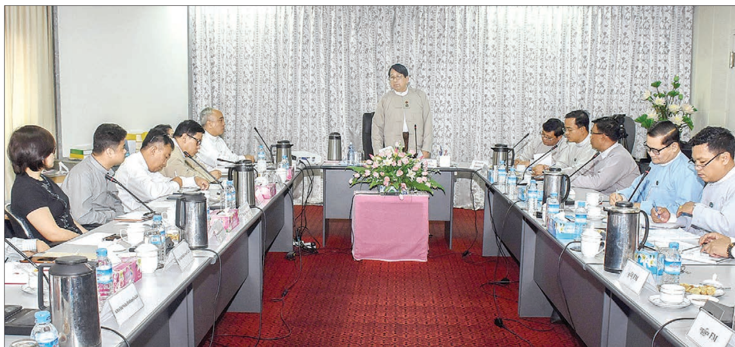
Union Minister Dr. Pe Myint meeting with the television and radio broadcasting business persons.

ion Minister spoke of enacting a Broadcasting Law that was in line with the modern age, and discussed arrangements to enact the rules, as well as the possibility of new audio, video and community radio broadcasting projects.