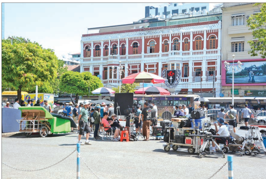
The crew of Line Walker-2 shooting a scene in downtown Yangon yesterday.