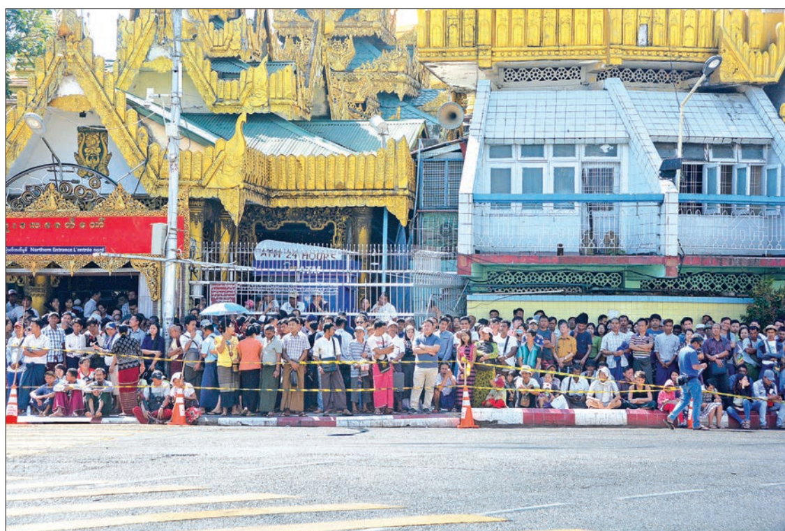
People gather to observe the Line Walker-2 shooting in downtown Yangon yesterday.