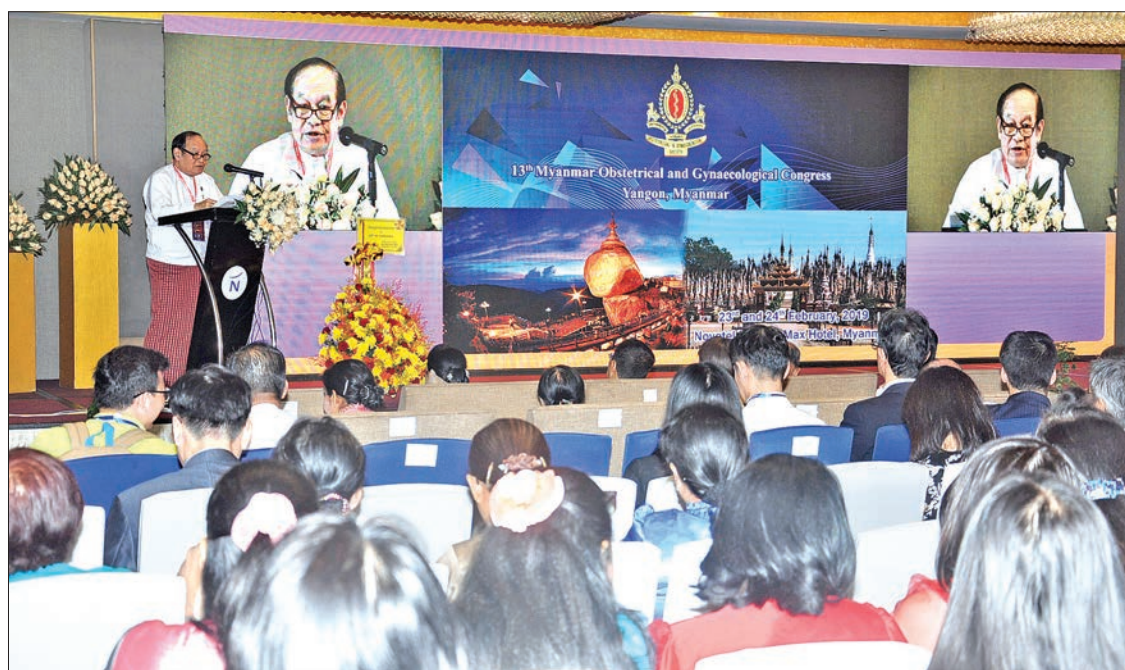
Union Minister Dr. Myint Htwe addresses the 13 th Myanmar Obstetrical and Gynaecological Congress in Yangon yesterday.

Then Vice Chairman of the 13th Myanmar Obstetrical and Gynaecological Congress Prof. Dr. Aye Aung delivered a con-