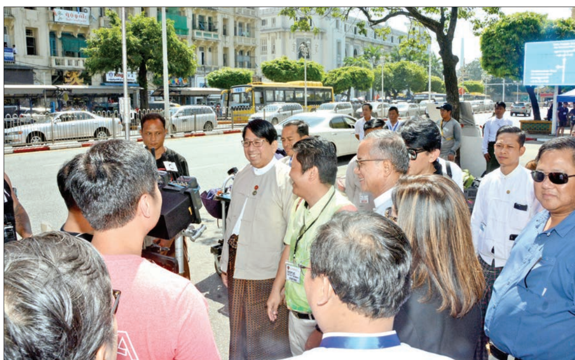
Union Ministers Dr. Pe Myint and U Ohn Maung meet with Line Walker-2 film crew.