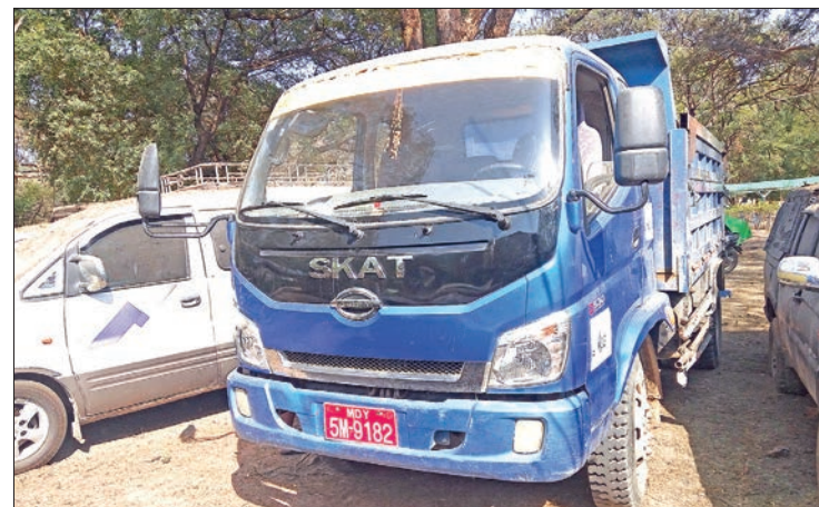
The vehicle which crashes over a motorbike seen in Myinmu Township.

Both drivers were charged with reckless driving under sections 279/337/338 of the Penal Code. ■ (Translated by Hay Mar)