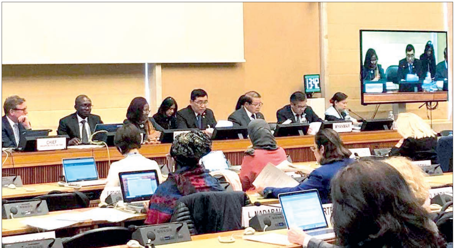
Union Minister Dr. Win Myat Aye speaks during the constructive dialogue between Myanmar and the Committee on the Elimination of Discrimination against Women (CEDAW) on the Exceptional Report submitted by Myanmar in Geneva, Switzerland.

The issue in northern Rakhine State has hindered the Government's efforts. Notwithstanding those challenges, Myanmar is now striving to ensure that democracy takes firm root, although this process takes time.