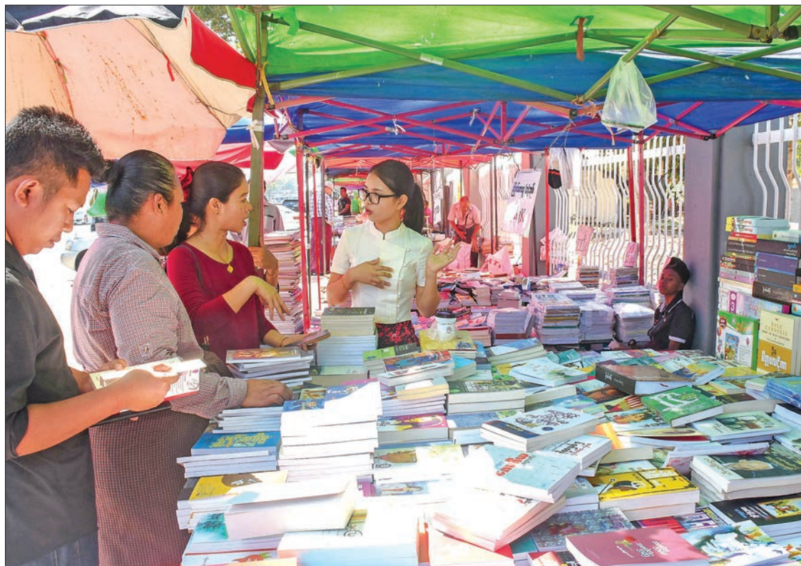
About 80 stalls selling books to visitors at the Saturday-Sunday Book Street in Yangon.