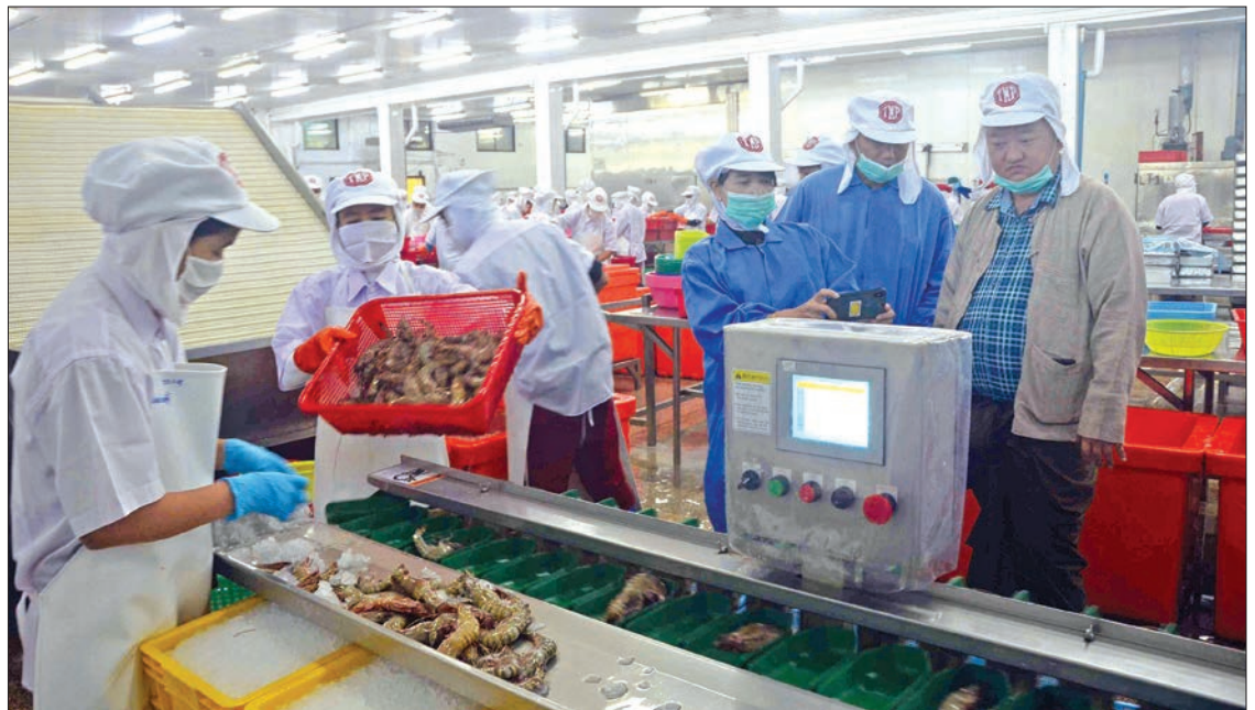
Local and foreign business persons visit a prawn cold storage factory in Thandwe Township.