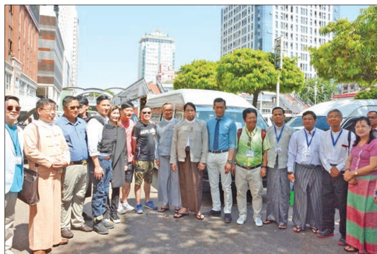
Union Ministers Dr. Pe Myint and U Ohn Maung pose for documentary photo together with members of Line Walker-2 shooting team and Myanmar movie artists.