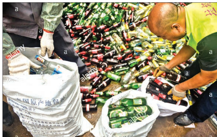
Australian researchers say they find a new way to recycle glass into everyday products.