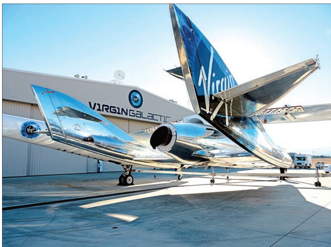
SpaceShipTwo mates to the mothership, WhiteKnightTwo, at Mojave Space Port on 19 February 2019, in Mojave, California.