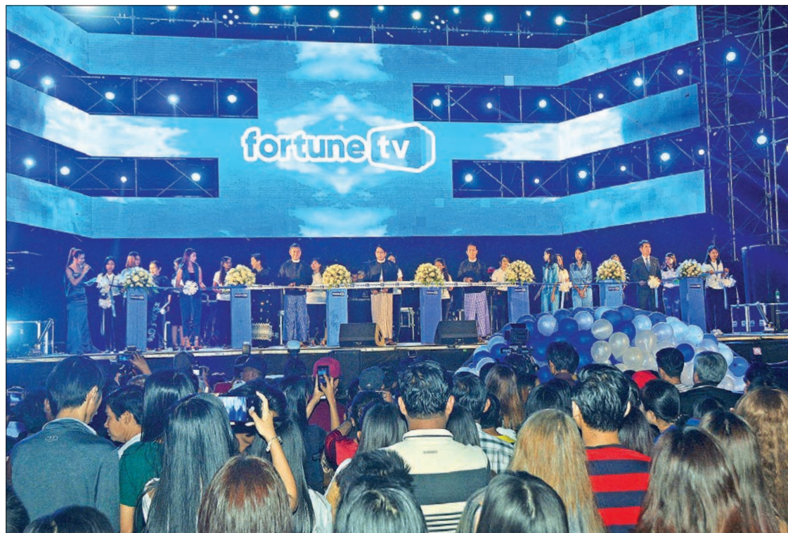
Union Minister Dr. Pe Myint and dignitaries formally open the Fortune TV funfair.

The Union Minister said that arrangements had been made recently to enable the establishment of five private-run television channels and as a result, these five television channels