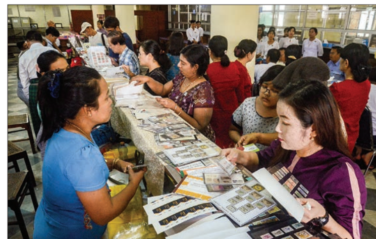
An event to issue postcode book for townships in Yangon, Mandalay and Nay Pyi Taw was held yesterday at Yangon General Post Office.

“Previously issued books provided only the code number of the post office. Only the post office staff can understand the code number of their offices. The public cannot easily trace the origin of the post office through the mail. They will understand this only if they enquire it at the nearest post office. The updated postcode book can help people find easily from which office