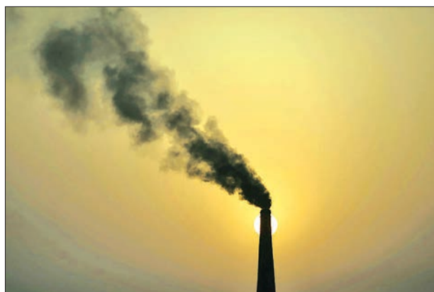
The World Bank's chief executive says a carbon tax on emissions is necessary to fight global warming.

According to the Institute for Climate Economics, 46 countries and 26 subnational governments have established a carbon