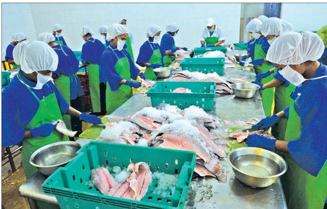
Workers at a factory that exports fishery products to foreign countries.

Bilateral trades were worth $385.63 million in the 2017-2018 fiscal year, $234.46 million in the 2016-2017 FY, $316 million in the 2015-2016 FY, $343.8 million in the 2014-2015 FY, $502.7 million in the 2013-2014 FY, $27.28 million in the 2012-2013 FY and $51 million in the 2011-2012 FY, respectively. — GNLM ■