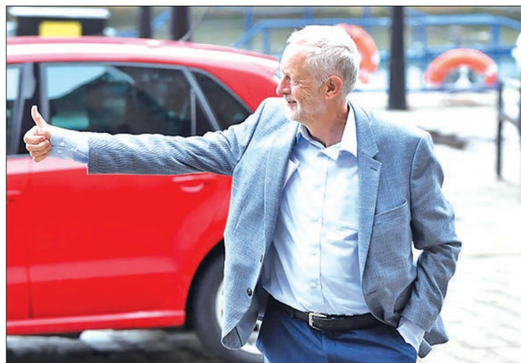
Labour leader Jeremy Corbyn has a golden opportunity to capitalise on Prime Minister Theresa May's weakness after European Union leaders rejected her Brexit plans on Thursday.