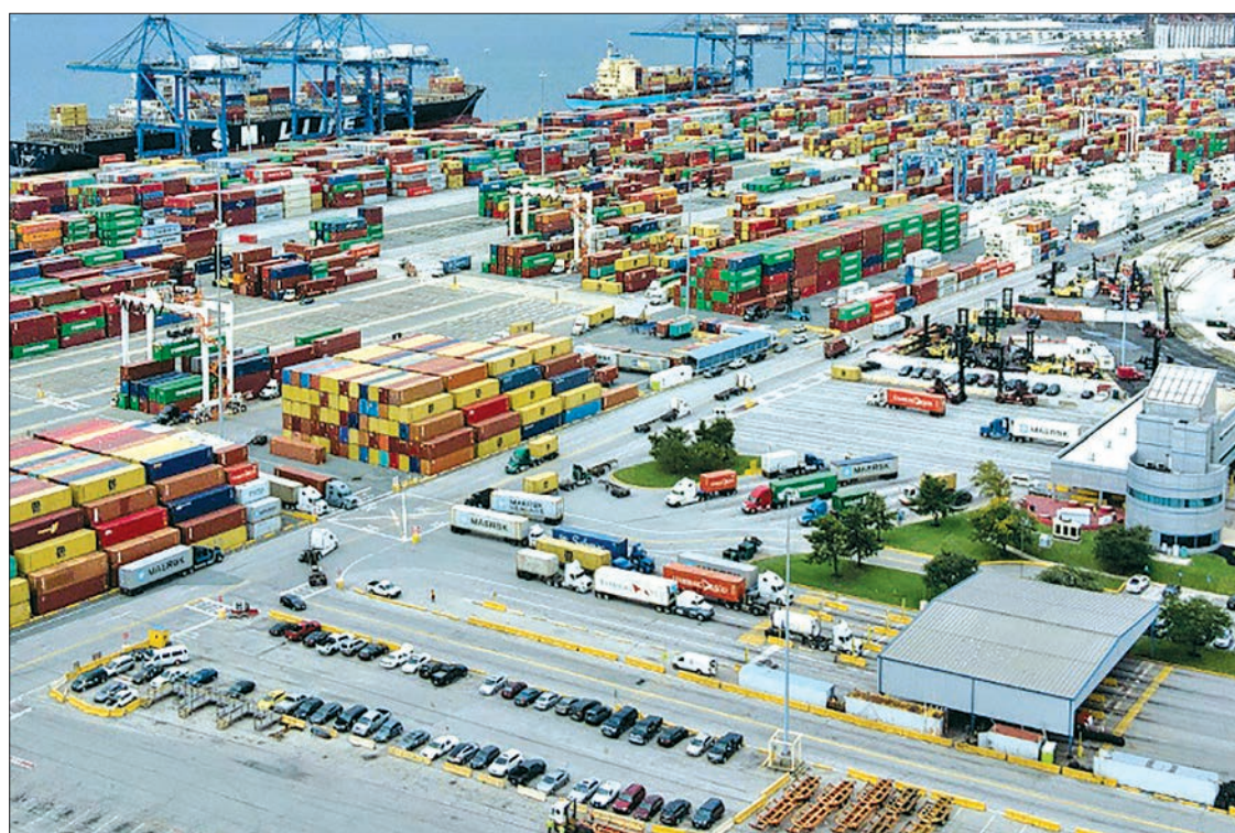
Trade conflict so far have had a mixed effect, with some ports seeing sharp declines, even as others report a surge.

2018, the port of New Orleans saw a drop of 350,000 tons of steel compared with the year-ago period, a big hit for a flagship product that is used in a petroleum-focused region.