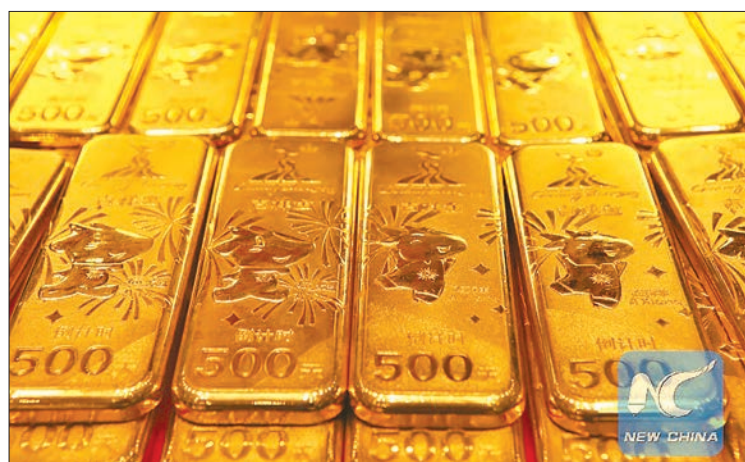
Gold usually moves in the opposite direction with the US dollar.

"We can probably take another six months, but at some point it's going to be very hard to face the situation." —AFP ■