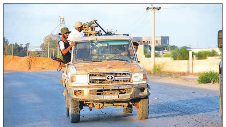
Forces loyal to the government of National Reconciliation participate in fighting between warring parties in southern Tripoli, Libya on 22 September 2018. Libyan Ministry of Health on Saturday revealed that Friday's clashes in the capital Tripoli have killed 10 people and injured 59 others, including civilians.

Libya has been suffering insecurity and escalating violence since the fall of former leader Muammar Gaddafi's regime in 2011. —Xinhua ■