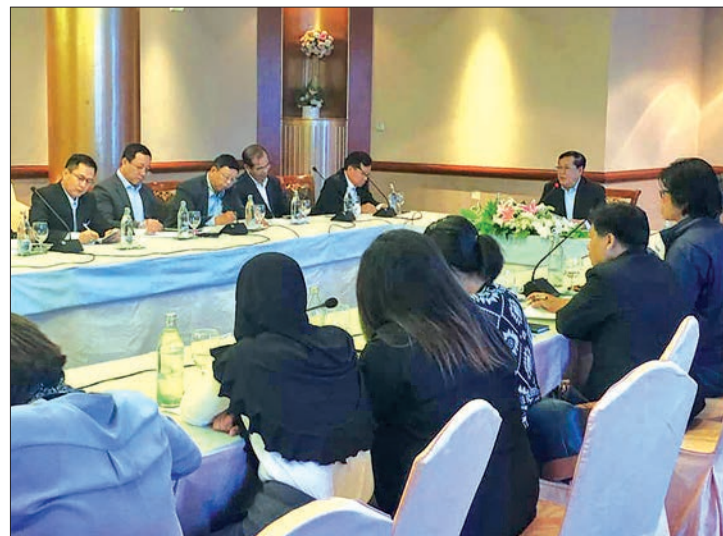
Union Minister U Thein Swe attending a meeting in Thailand regarding Myanmar migrant workers there.

The Union Minister and party will leave for Ranong, Thailand to discuss issues re- garding Myanmar fishery work- ers in Thailand and for smoother MoU system, it is learnt.—Pwint Thitsar ■