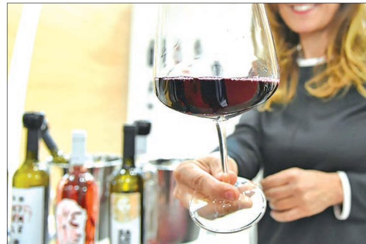
Latest available WHO data, from 2016, shows there were three million alcohol-related deaths globally — accounting for 5.3 per cent of all deaths that year — with drinking linked to dozens of illnesses.

For young people, the numbers are even more alarming,