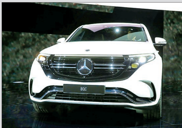
German carmakers are going after Tesla.

Musk was filmed drinking whisky and smoking cannabis (which is legal in California) with radio host Joe Rogan earlier this month, and in August