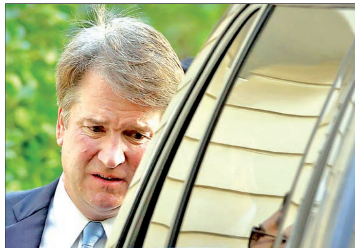
Supreme Court nominee Judge Brett Kavanaugh denies knowledge of any sexual assault and wants to give his side of the story to the Senate Judiciary Committee.

Ford alleges that Kavanaugh drunkenly assaulted her at a party when he was 17, she