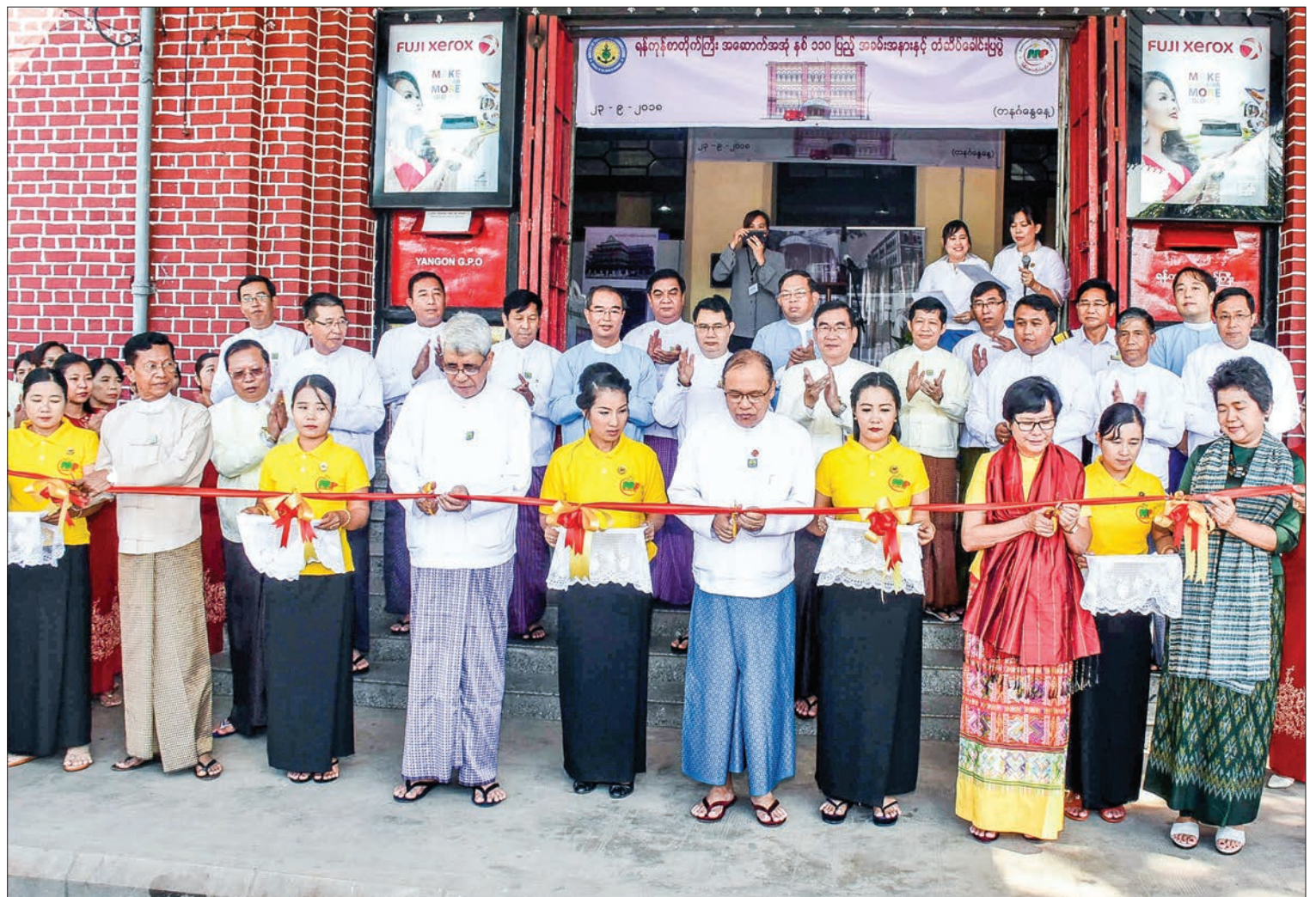
Union Minister U Thant Sin Maung and officials opening the 110 th Birthday event of the General Post Office yesterday.