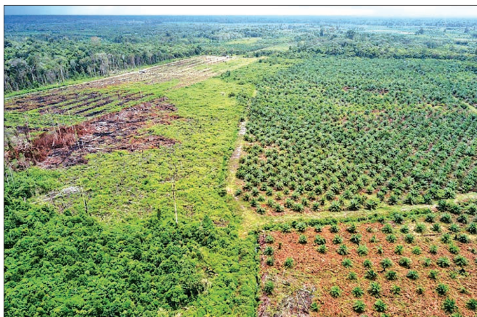
The rapid growth of palm oil plantations has been blamed for the destruction of tropical forests that are home to many endangered species, and forest fires that occur every year during the dry season due to illegal slash-and-burn clearance.

The Indonesian Forum for the Environment, Walhi, welcomed the moratorium.