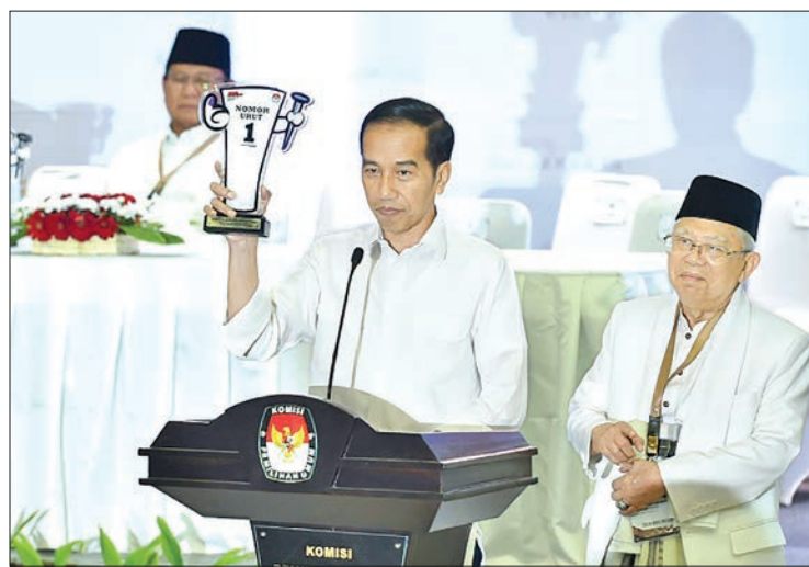
Opinion polls show Indonesian President Joko Widodo well ahead of his main challenger Prabowo Subianto.

JAKARTA — Campaigning for Indonesia's presidential election in April kicked off Sunday, pitting incumbent Joko Widodo against a former military general in the race to lead the world's third-biggest democracy.