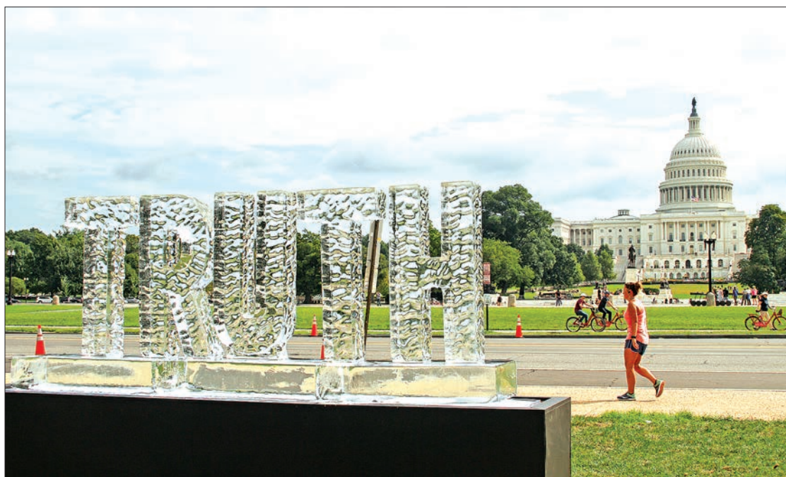
A woman walks behind an ice sculpture spelling out the word "truth" by artist duo Ligorano Reese, with the US Capitol in the background, in Washington on 22 September 2018.