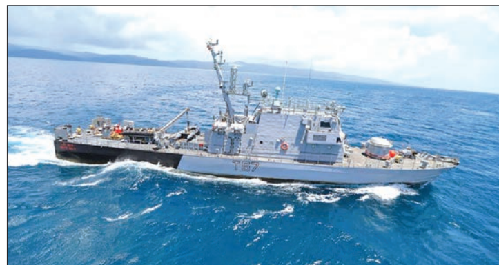
An Indian Naval ship seen in the ocean.

INS Battimalv is a Fast At- tack Craft with top speed of over 28 knots commissioned into the Indian Navy in 2006. The ship undertakes regular patrolling