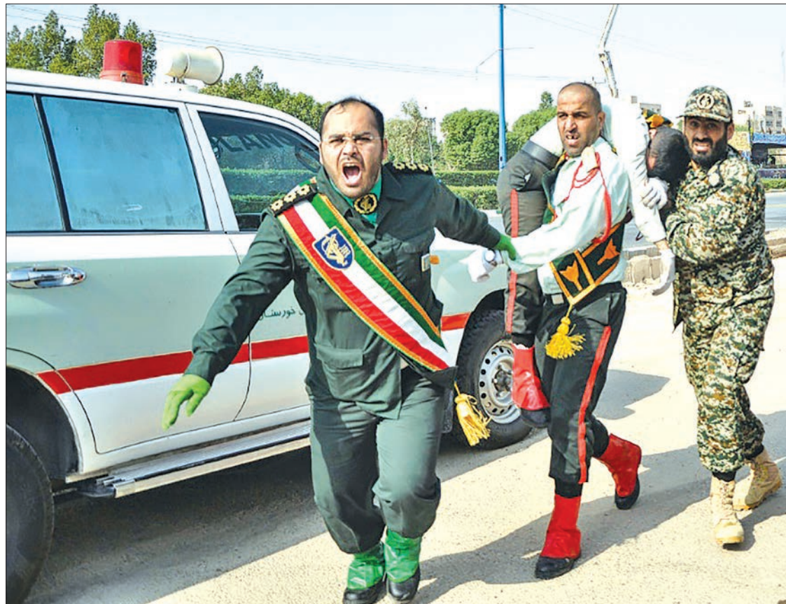
The Islamic State group has claimed responsibility for the parade attack in southwestern Iran.

Iran summoned diplomats from Denmark, the Netherlands and Britain over their “hosting of some members of the terror-