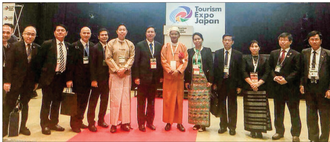
Union Minister for Hotels and Tourism U Ohn Maung and party pose for a documentary photo at the Tourism Expo Japan 2018.

Minister attended the welcoming ceremony of World Travel and Tourism Council. The Union Minister then met with Minister of Land, Infrastructure, Transport and Tourism, Mr. Keiichi Ishii and discussed promoting the tourism sector by signing an MoU between the two countries,