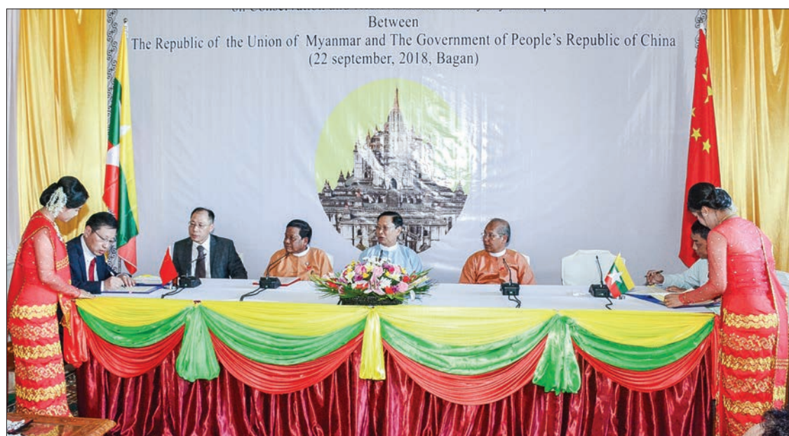
Officials signing at the ceremony to exchange letter on conservation and restoration of Thatbyinnyu Pagoda.

“China also made cash donations for the renovation of earth-quake-hit pagodas,” said