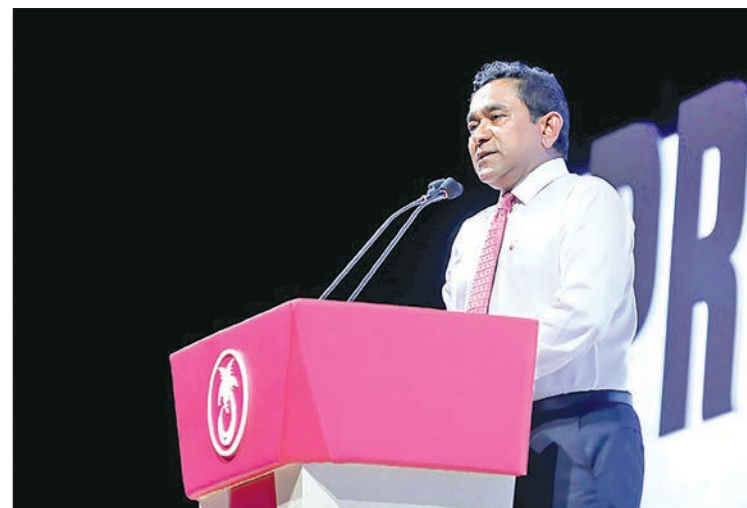
Maldives President Abdulla Yameen has imprisoned or forced into exile all his main rivals.

possible for Yameen to win because all opposition parties are united against him," said Nasheed, who is based in Sri Lanka.