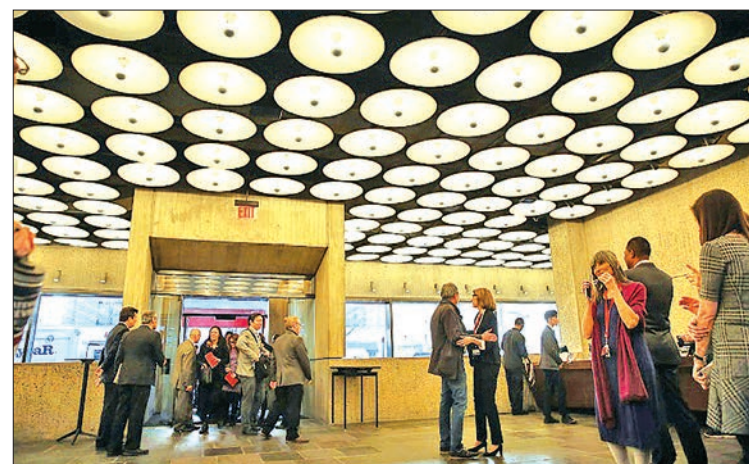
Visitors on the opening day of The Met Breuer, an expansion of the Metropolitan Museum of Art, in 2016.

The Met's lease for the Breuer building will expire in 2023. It remains unclear what will happen next to the concrete, inverted pyramid-shaped museum