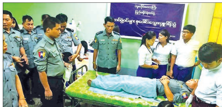
A policeman donating blood in Pyay.

TO mark the 54 th Myanmar Po- lice Force Day, which falls on October 1, a total of 63 police members from Pyay District in Bago Region recently donated blood at the 500-bed hospital in the town of Pyay. The blood donation ceremony was held at the hospital between 7 am and 11.30 am on September 18.