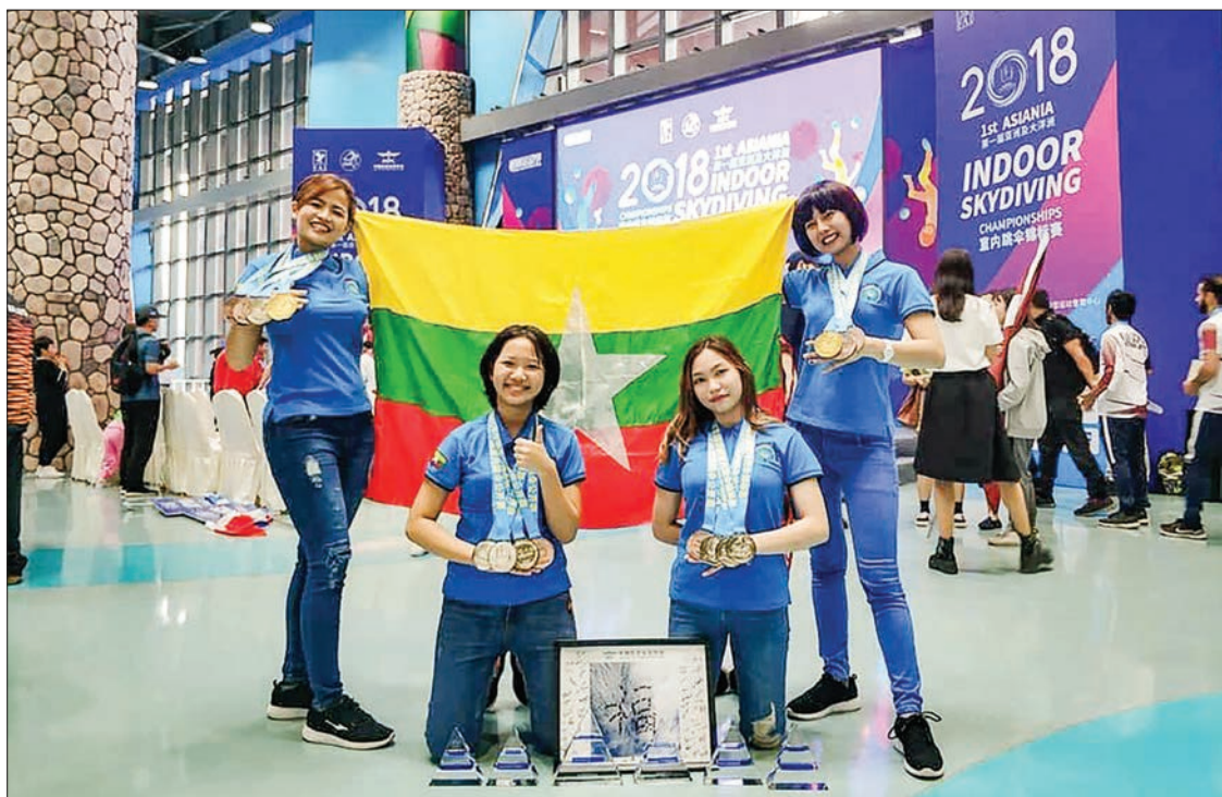
Myanmar wins one gold, three silver and two bronze medals in 1 st Asia Indoor Skydiving Championship in China.