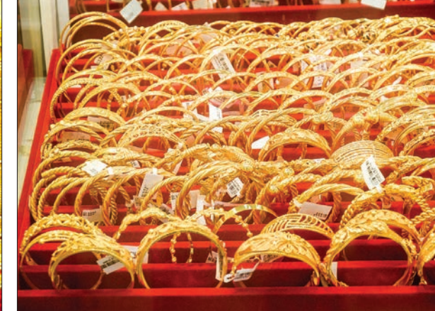
Gold jewellery displayed at a shop in downtown Yangon.

businesses rather than tightening the rules for gold export/import, providing better services for the entrepreneurs. Once the gold market becomes developed domestically, the country can begin to host gold and jewellery international expos, which in turn will support other related industries, he continued.