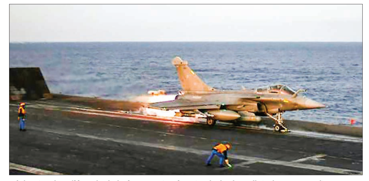
A fighter jet takes off from the deck of France's aircraft carrier Charles de Gaulle in the eastern Mediterranean Sea on 9 December 2016, as part of the international coalition against the Islamic State group.

The monitor relies on a network of sources inside Syria and tracks flight patterns, aircraft involved and ammunition used to determine who carries out raids.