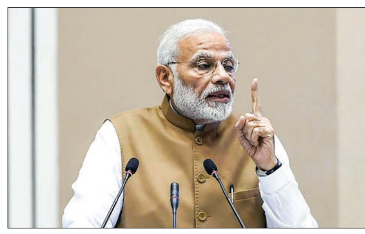
Prime Minister Narendra Modi has launched the world's largest health insurance scheme, promising free coverage for half a billion of India's poorest citizens.

NEW DELHI — Prime Minister Narendra Modi on Sunday launched the world's biggest health insurance scheme, promising free coverage for half a billion of India's poorest citizens ahead of national elections next year.