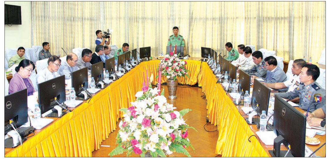
Union Minister for Home Affairs Lt-Gen Kyaw Swe addresses meeting on national crime prevention strategy in Nay Pyi Taw.

The meeting was attended by the chairman of the central committee to develop and implement a national crime prevention strategy, Union Minister for Home Affairs Lt-Gen Kyaw Swe, committee deputy chairman Ministry of Home Affairs Deputy Minister Maj-Gen Aung Thu, Deputy Minister for Border Affairs Maj-Gen Than Htut, Deputy Minister for Transport and Communications U Tha Oo, Deputy Minister for Education U Win Maw Tun, Deputy Minister for Planning and Finance U Maung Maung Win, Union Attorney General Office Deputy Attorney General U Win Myint, central committee secretary