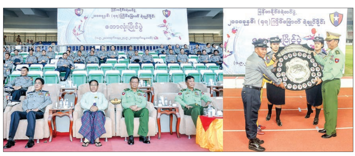
Union Minister for Home Affairs Lt-Gen Kyaw Swe attends the 47<sup>th</sup> Myanmar Police Chief Shield football final tournament in Nay Pyi Taw yesterday.

Afterwards, Union Minister presented the champion Bago Region Police Force team with the shield, individual medals and