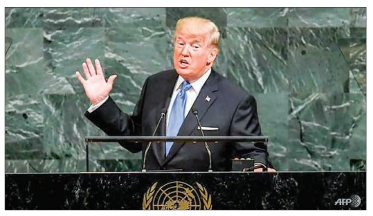
US President Donald Trump is expected to trumpet America's improved ties with North Korea when he addresses the United Nations General Assembly.