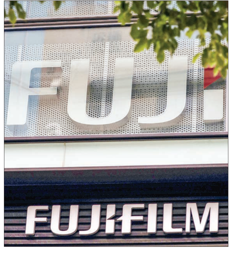
Photo taken in June 2017 shows logos installed on the building that houses the head office of Fujifilm Holdings Corp in Tokyo.

The camera and medical equipment maker, which has