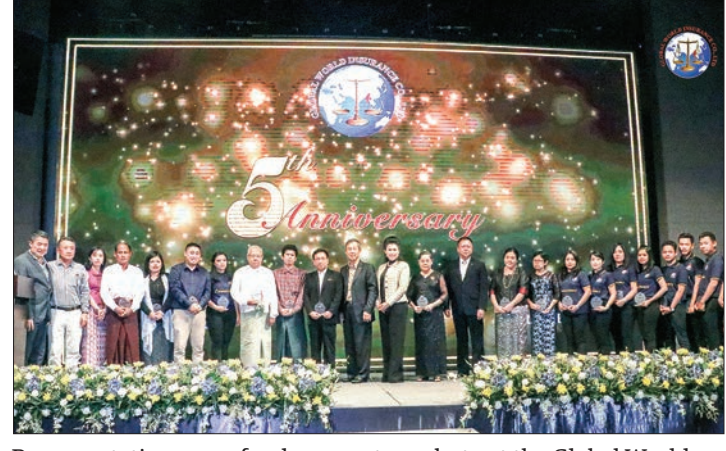
Representatives pose for documentary photo at the Global World Insurance celebration in Yangon.

GWI is one of 11 local private insurance companies within Myanmar. With an experienced team of 200 employees, located in 6 branch offices nationwide, GWI is providing 24/7 insurance services. Fur-