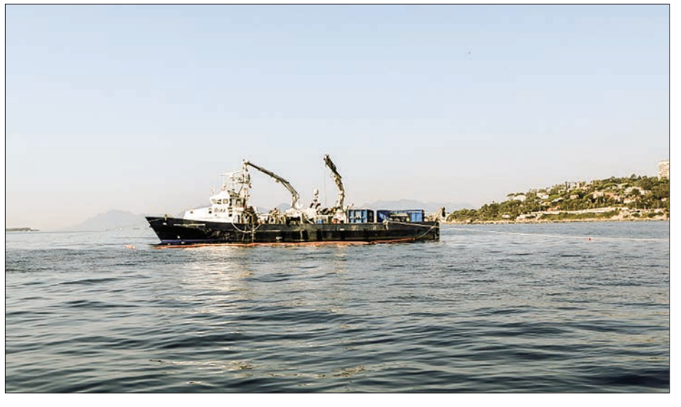
Divers and a specially equipped boat with lifting gear have been fishing out hundreds of the old rubber tyres 500 metres (1,600 feet) from an exclusive coastline between the French resorts of Cannes and Antibes.

Around 10,000 are set to be lifted by the divers and boat crew over the next few weeks, with the remaining 12,500 extracted in the second quarter of 2019.