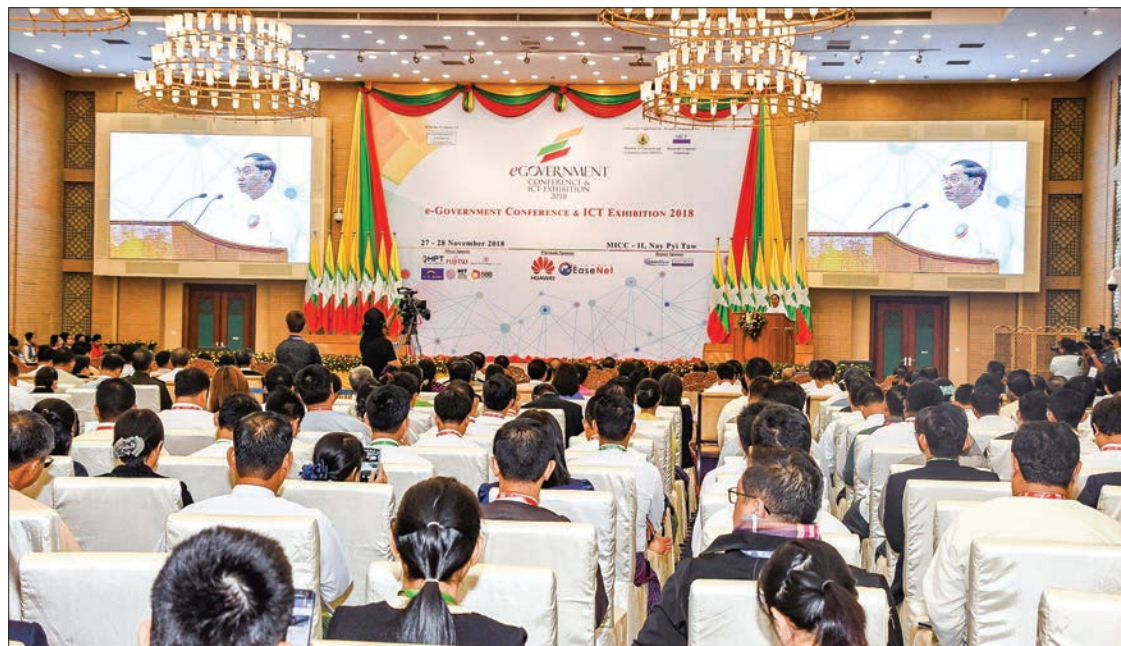
Vice President U Myint Swe delivers the speech at the opening ceremony of e-Government Conference and ICT Exhibition 2018 in Nay Pyi Taw yesterday.

e-Government development of countries are measured by the United Nations' three e-Gov-