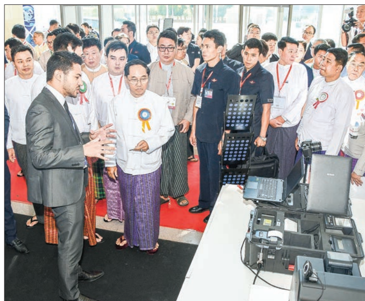
Vice President U Myint Swe inspects the exhibition at e-Government Conference and ICT Exhibition 2018 in Nay Pyi Taw.