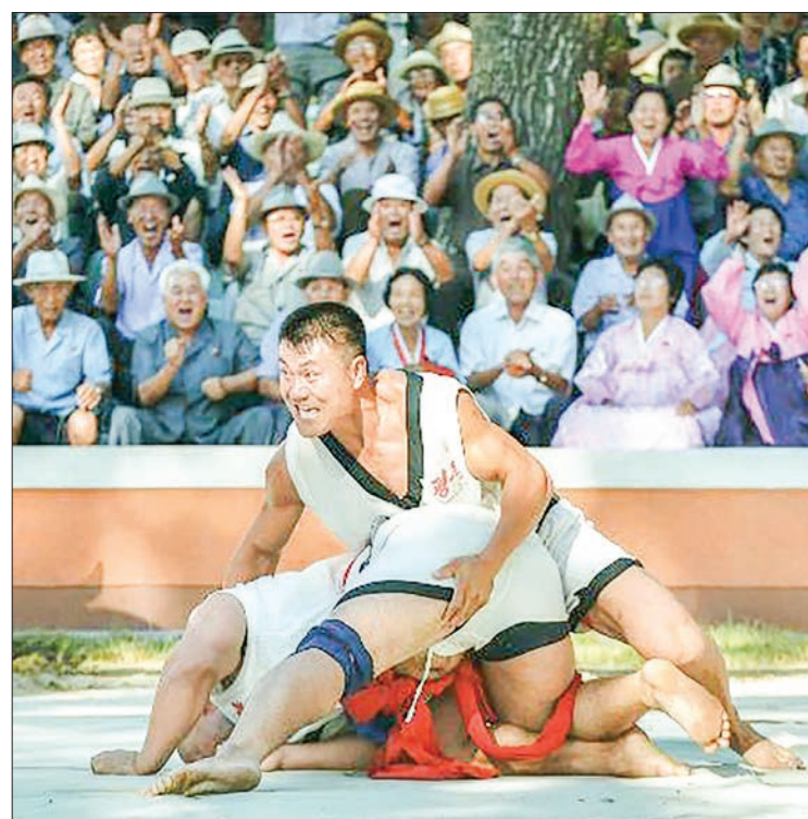
Spectators cheer for the winner of the open category at North Korea's national ssireum wrestling championships in Pyongyang on 17 September, 2015.