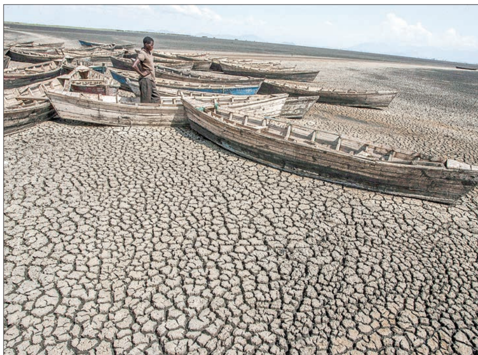
This file photo taken on 19 October, 2018 shows a young Malawian man standing among stationary engineless boats which lie idle at the dried inland Lake Chilwa's Chisi Island harbour, in Zomba District, eastern Malawi, on 18 October, 2018. PHOTO: AFP

One-and-a-half million people live in the areas on the Lake Chilwa basin, which is one of the most densely populated areas in southern Africa. —AFP ■