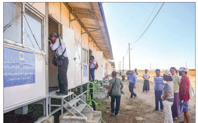
Local and foreign media visit Hla Phoe Khaung Reception Centre in Maungtaw Township.

Local and foreign media agencies have been sent to Rakhine State to gather news 6 times during the emergency period, once with arrangements from the Ministry of Defence, 6 times from the Ministry of Foreign Affairs, once from the Union government, once from the Myanmar Press Council, and 14 times on the advice of the Committee for Implementation of Recommendations on Rakhine State, which recommended two media trips a month to Rakhine State. — MNA (Translated by Zaw Htet Oo) ■