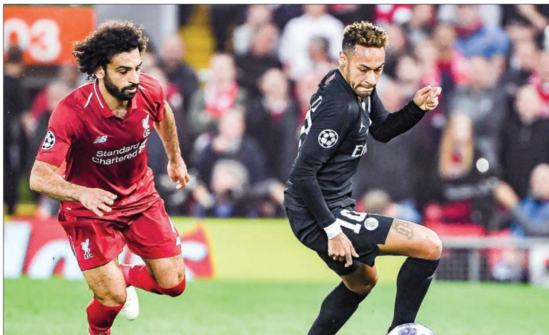
In this file photo taken on 18 September 2018 Liverpool's Egyptian midfielder Mohamed Salah (l) vies with Paris Saint-Germain's Brazilian striker Neymar during the UEFA Champions League group C football match between Liverpool and Paris Saint-Germain at Anfield in Liverpool, northwest England.

And while an upturn in fortunes, particularly defensively, has been seen in an unbeaten start to the Premier League season, it has not yet cured Liverpool's travel sickness in the Champions League. —AFP ■