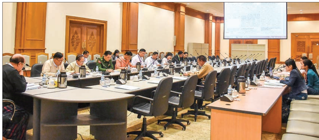
Pyidaungsu Hluttaw Deputy Speaker U Tun Tun Hein addresses the meeting of Pyidaungsu Hluttaw Joint Bill Committee in Nay Pyi Taw.

THE Pyidaungsu Hluttaw Joint Bill Committee held a meeting over an amendment bill to Sea Customs Act and Tax Management Bill, sent by Union Government at the Pyidaungsu Hluttaw Building D, second floor meeting hall yesterday.