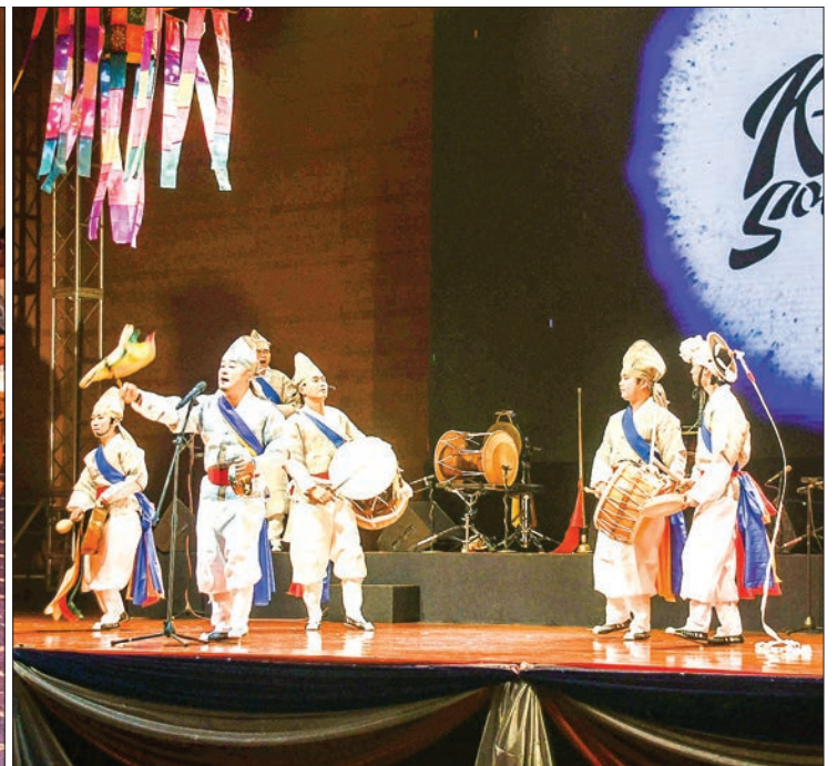
State Counsellor Daw Aung San Suu Kyi, Union ministers and their wives, and the Ambassador of the Republic of Korea and wife enjoy the Korean traditional performance titled "K-Wind Soul Beat" at the MICC-II in Nay Pyi Taw yesterday.

S TATE Counsellor Daw Aung San Suu Kyi attended a Korean traditional performance titled "K-Wind Soul Beat" at the MICC-II in Nay Pyi Taw yesterday.