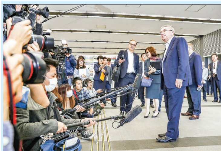
International Olympic Committee President Thomas Bach meets the press at Ajinomoto National Training Center in Tokyo on 25 November 2018.

The ATP year-end top 10 players are Djokovic, Nadal, Federer, Alexander Zverev, del Potro, Anderson, Marin Cilic, Dominic Thiem, Nishikori and Isner. —Xinhua ■