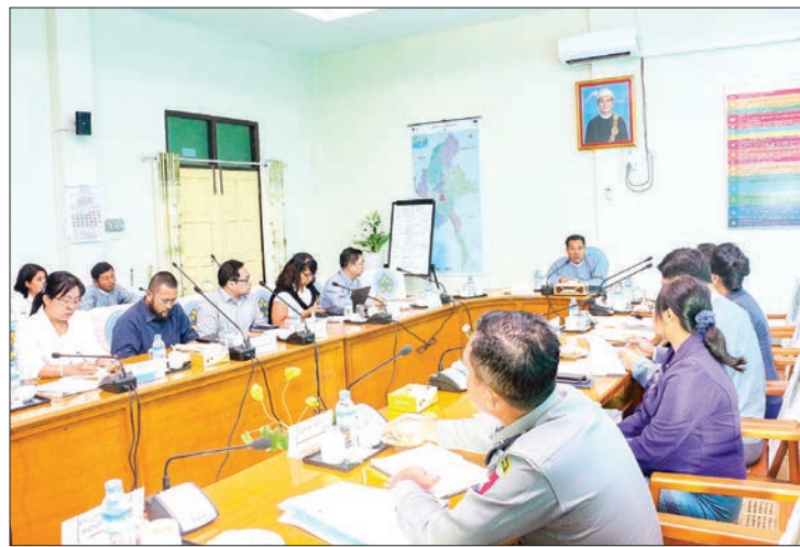
Representatives from ASEAN Secretariat and ASEAN Coordinating Centre for Humanitarian Assistance on Disaster Management (AHA Centre) hold a meeting with officials.