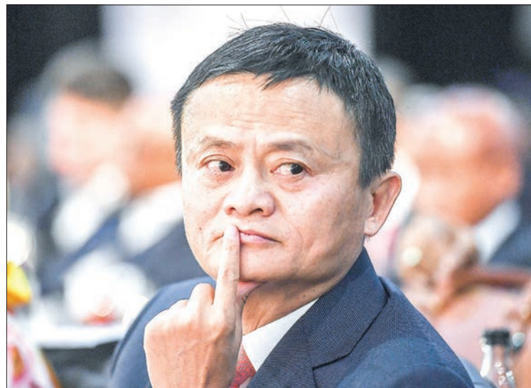
This photo taken on 26 October, 2018 shows co-founder of China's Alibaba Jack Ma gesturing as he attends an international investment conference in Johannesburg. Jack Ma, founder of Chinese tech giant Alibaba, is among the world's richest people but he has now emerged as a member of another club: China's 89-million-strong Communist Party.

"Be loyal to the party, work actively, fight for communism all one's life, always be prepared to sacrifice everything for the party and people, and never betray the party," they recite. —AFP ■