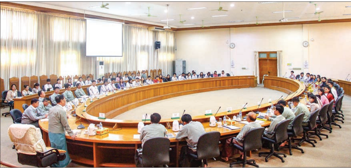
Union Election Commission Chairman U Hla Thein meeting with trainees of NEI civil service organization at the UEC Office in Nay Pyi Taw yesterday.

A DELEGATION from the civil society organization-NEI based in Mon State visited the Union Election Commission in Nay Pyi Taw yesterday. At the meeting with 54 trainees and nine staff of NEI, UEC Chairman U Hla Thein explained the responsibility of the commission, expressed the UEC's commitment to holding a free and fair election in 2020. Elections are the basic foundation of a democratic country where the Hluttaw representatives for the administrative, legislative and judiciary sectors are elected according to the people's wish. As such, the work process are being conducted fairly and transparently with basic five norms. Everyone related to the election needs to carry out his/her work dutifully and truthfully, said the UEC chairman. Each level of the election sub-commission is responsible for conducting the election work process according to the assigned duties and responsibilities. The commission is carrying out its duties dividing the election processes into three periods: pre election period, election period