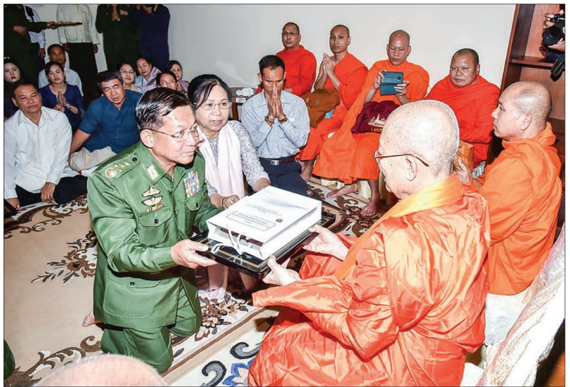
Senior General Min Aung Hlaing presents gifts to Venerable Bounma Simmaphon.