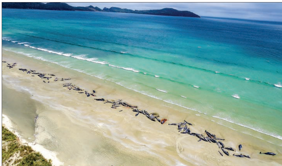
This handout photo taken and released on 26 November, 2018 from the New Zealand Department of Conservation shows dead pilot whales on a remote beach on Stewart Island in the far south of New Zealand. Up to 145 pilot whales have died in a mass stranding on a remote part of a small New Zealand island, authorities said on 26 November.

Two of the pod were already dead, and two