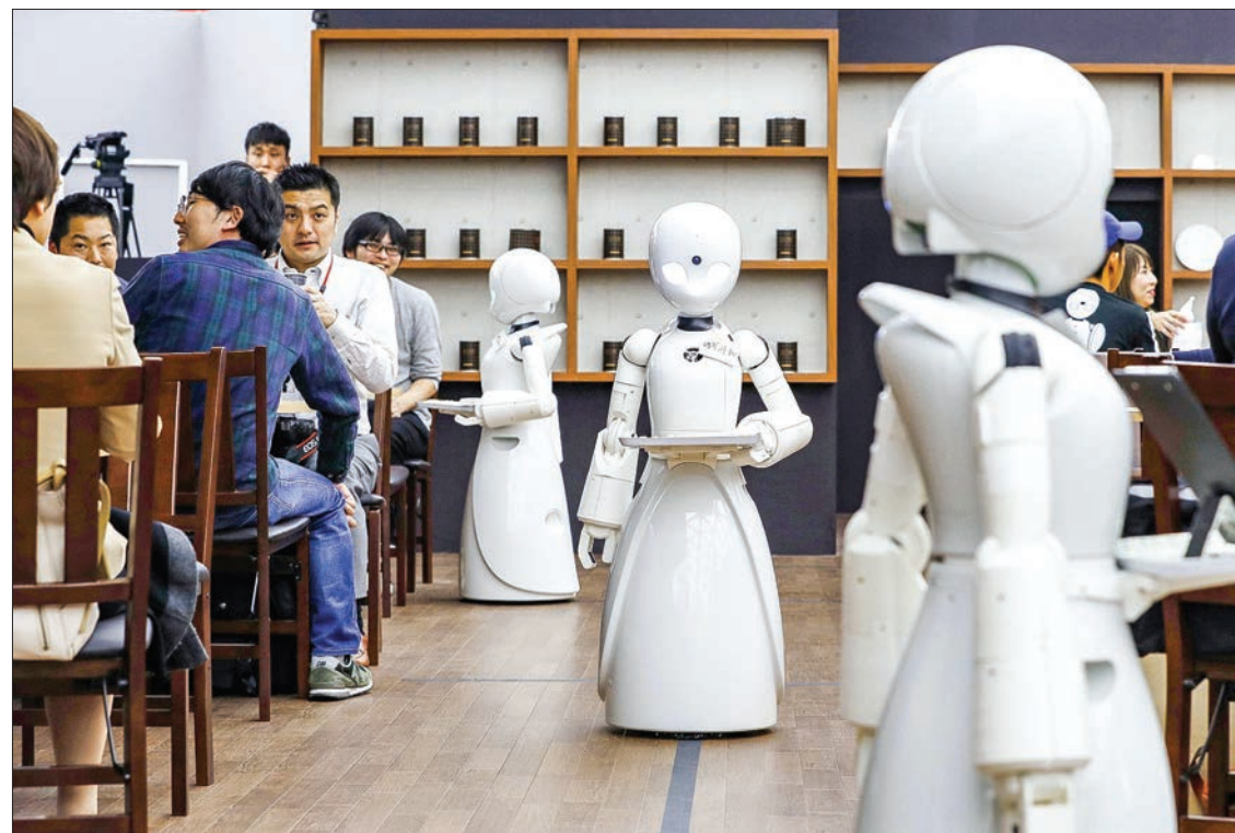
OriHime-D humanoid robots remotely controlled from home by workers with severe physical disabilities serve customers at a cafe set up in Tokyo on 26 November 2018. The cafe runs through 7 December on a trial basis.