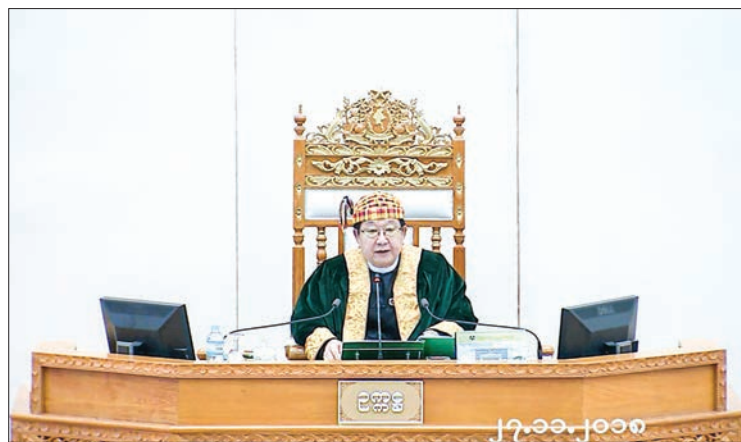
Pyithu Hluttaw Speaker U T Khun Myat.

The funding requirement for the project will be Ks 107 billion or US$ 66.6 million in foreign currency. The project is included in Myanmar Sustainable Development Plan and a proposal had been made to Ministry of Planning and Finance to conduct this project under $ 130 million loan from