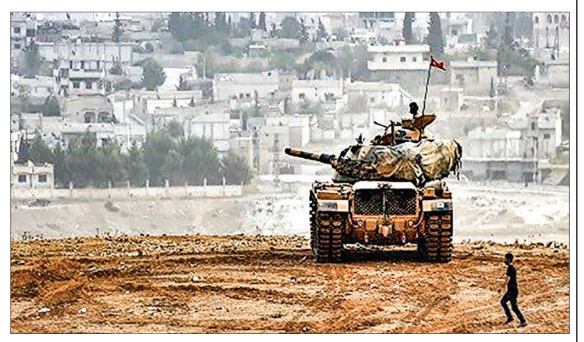
A Turkish tank near the border with the Syrian Kurdish city of Kobani.

The YPG, which holds swathes of northern and northeastern Syria, forms the backbone of the Syrian Democratic Forces (SDF), the Kurdish-Arab alliance that has received extensive American support in the