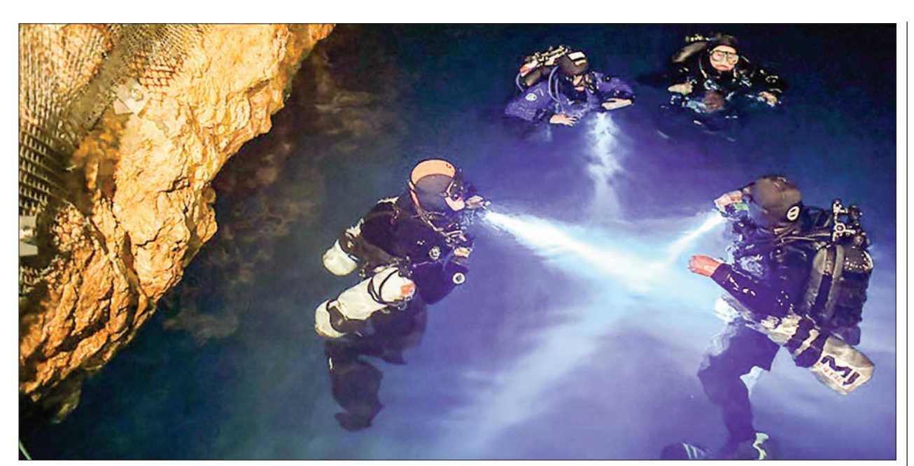
The underwater Janos The Molnar cave system, named after the Hungarian pharmacist who discovered it in the 19th century, has become a hot tip for diving aficionados.