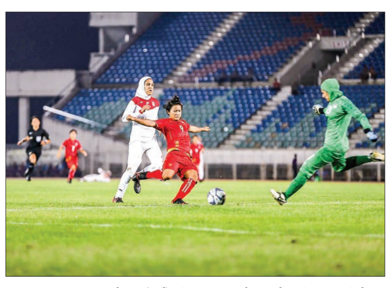
Myanmar women's player (red) tries to score the goal against Iran in last group match.

Myanmar reached the second round qualification of AFC U-19 Women's Championship by standing as the best second-placed team. —Htut Htut (Twantay) ■