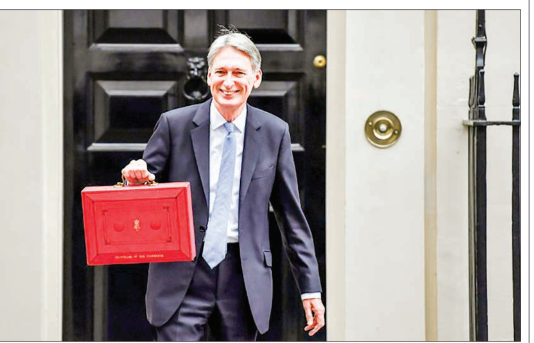
British Chancellor of the Exchequer Philip Hammond is to unveil a budget that could be scuppered by the final terms of a Brexit deal.

The small group is a kingmaker that could yet sink both the draft agreement with Brussels and May's government in