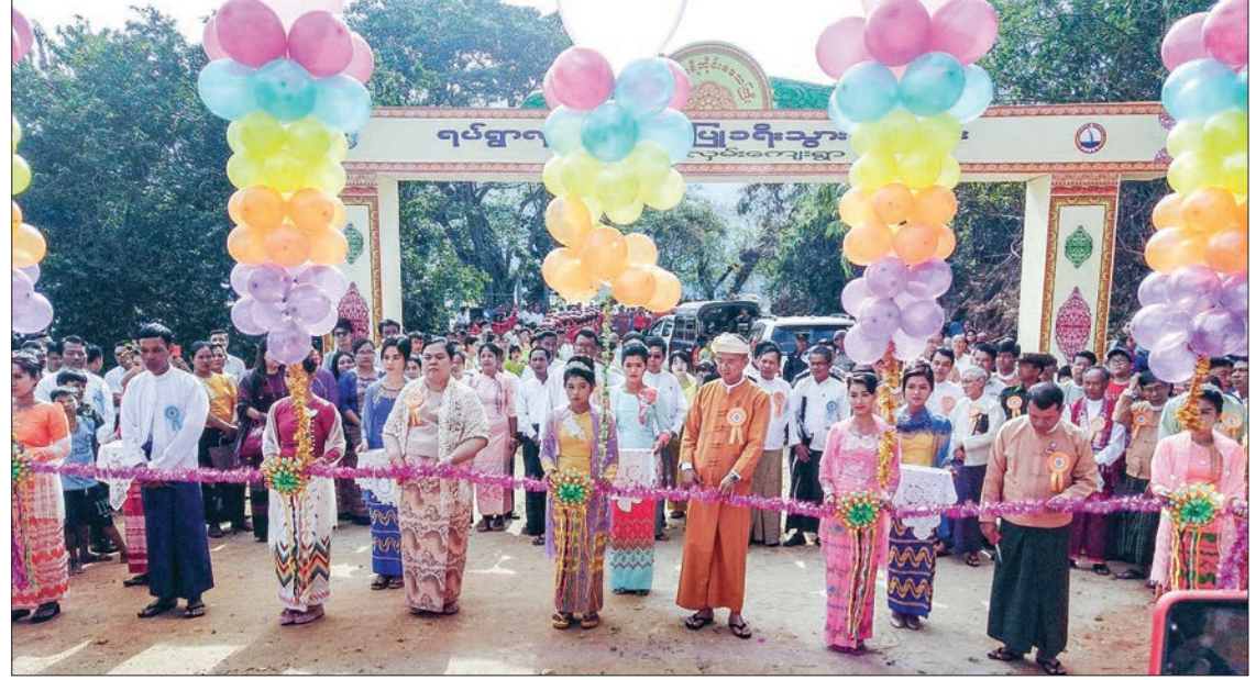
Union Minister U Ohn Maung, Chief Minister Dr. Daw Lae Lae Maw and officials cut the ribbon to launch Community Based Tourism (CBT) in Sanhlan Village.

Union Minister U Ohn Maung delivered an opening speech, saying everyone's support is required to implement CBT and the local people's living standard will develop by implementing CBT.