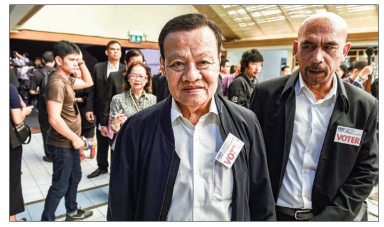
Thai politician Viroj Pao-in (c) leaves after being named the leader of Puea Thai party in Bangkok on 28 October, 2018.

The wealthy and powerful Shinawatra clan has won every election since 2001 through populist platforms and welfare schemes that have angered Bangkok's military-aligned elite. But large sections of so-