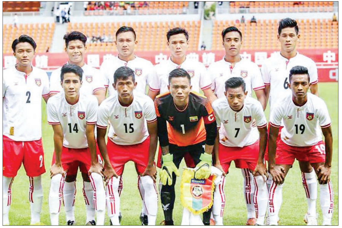
Myanmar U-21 men's players had a group photo taken in China.