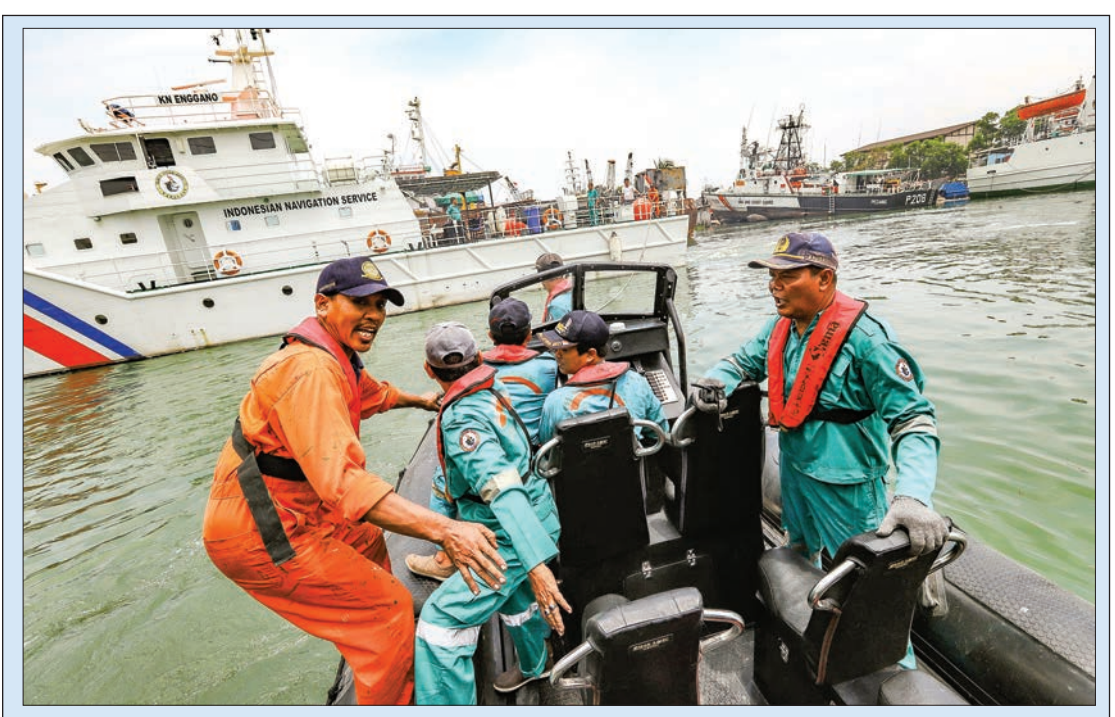
Members of a rescue team prepare to search for survivors from the Lion Air flight JT 610, which crashed into the sea, at Jakarta seaport on 29 October, 2018. The Indonesian Lion Air plane carrying 188 passengers and crew crashed into the sea on 29 October, officials said, moments after it had asked to be allowed to return to Jakarta.