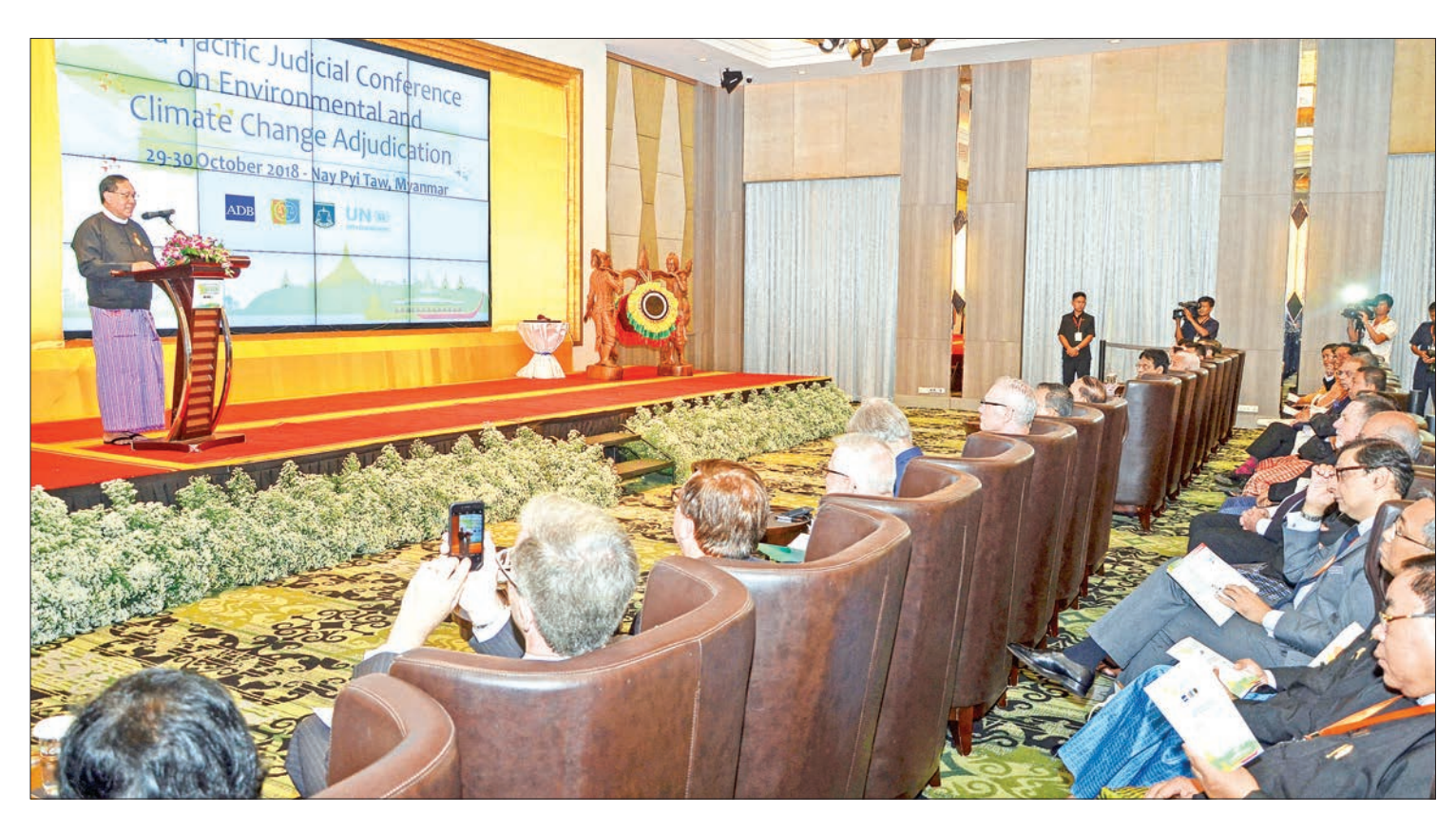
Union Chief Justice U Htun Htun Oo delivers an address at the opening ceremony of the Asia-Pacific Judicial Conference on Environmental and Climate Change Adjudication held in Hilton Hotel in Nay Pyi Taw yesterday.