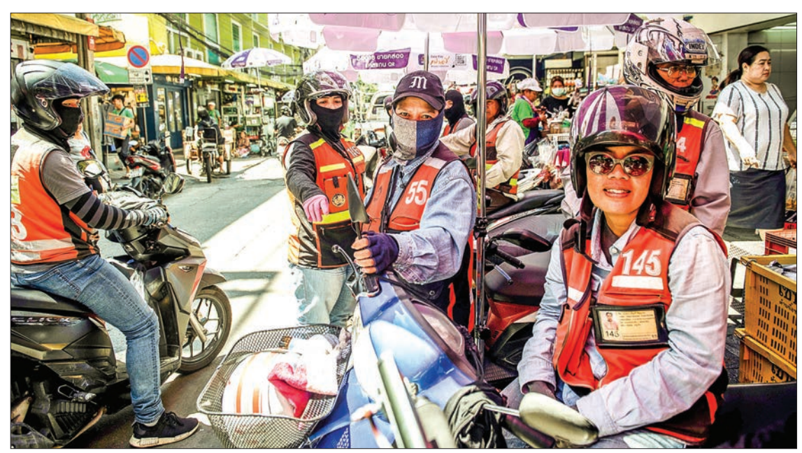
This photo taken on 26 September, 2018 shows three female motorcycle-taxi drivers waiting at a motorcycle-taxi stand in Bangkok.