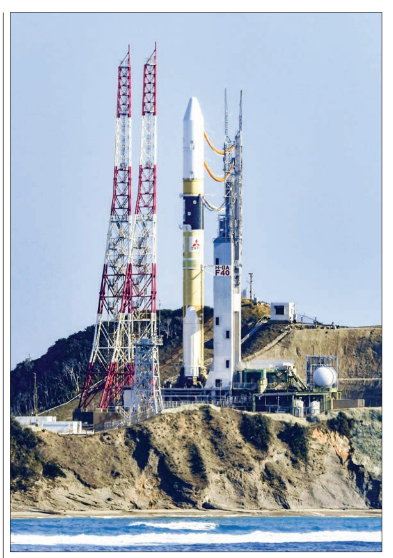
H-2A rocket carrying an Ibuki-2 greenhouse gas observation satellite at Tanegashima Space Centre on 29 October, 2018.