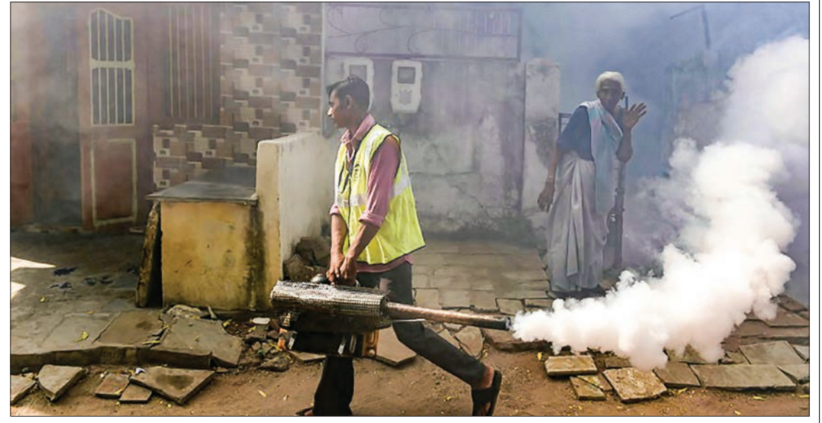
Gujarat has been fumigating public areas in an effort to kill the mosquitos that carry the diseases.

Zika was also detected in the southern Indian state of Tamil Nadu in July 2017. The World Health Organization has said no vaccine is likely to be available until 2020.—AFP