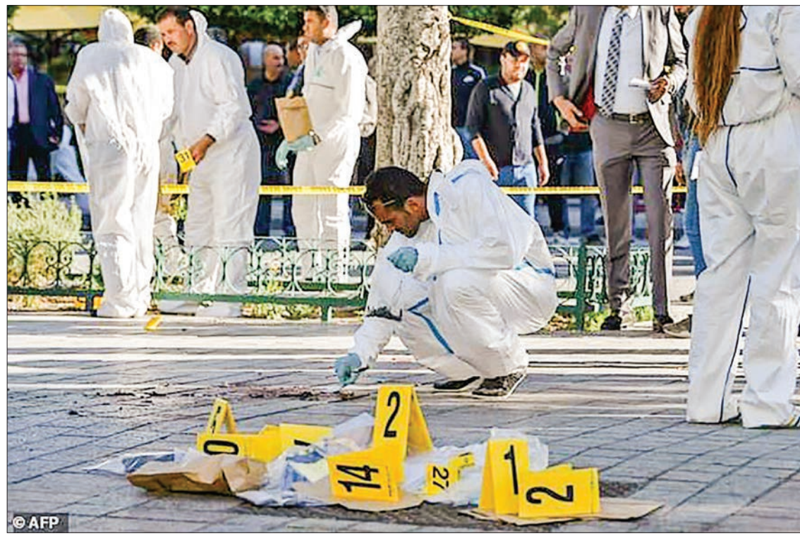
Tunisian forensics inspect the site of a suicide attack in the Tunisian capital Tunis.

the Tunisian capital since No- tary institutions and the police". vember 24, 2015 when a suicide bombing killed 12 security agents on a bus for presidential guards. That attack was claimed by the so-called Islamic State jihadist group.