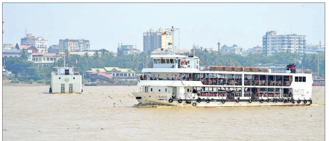
A ferry carries passengers across the Yangon River from Dala to downtown Yangon.

Dala Township is close to Twantay, Kawhmu, and Kungyangon townships in the Southern District of Yangon Region. It is also close to Pyapon, Dedaye, Bogale, Kyaiklat, and Maubin town-