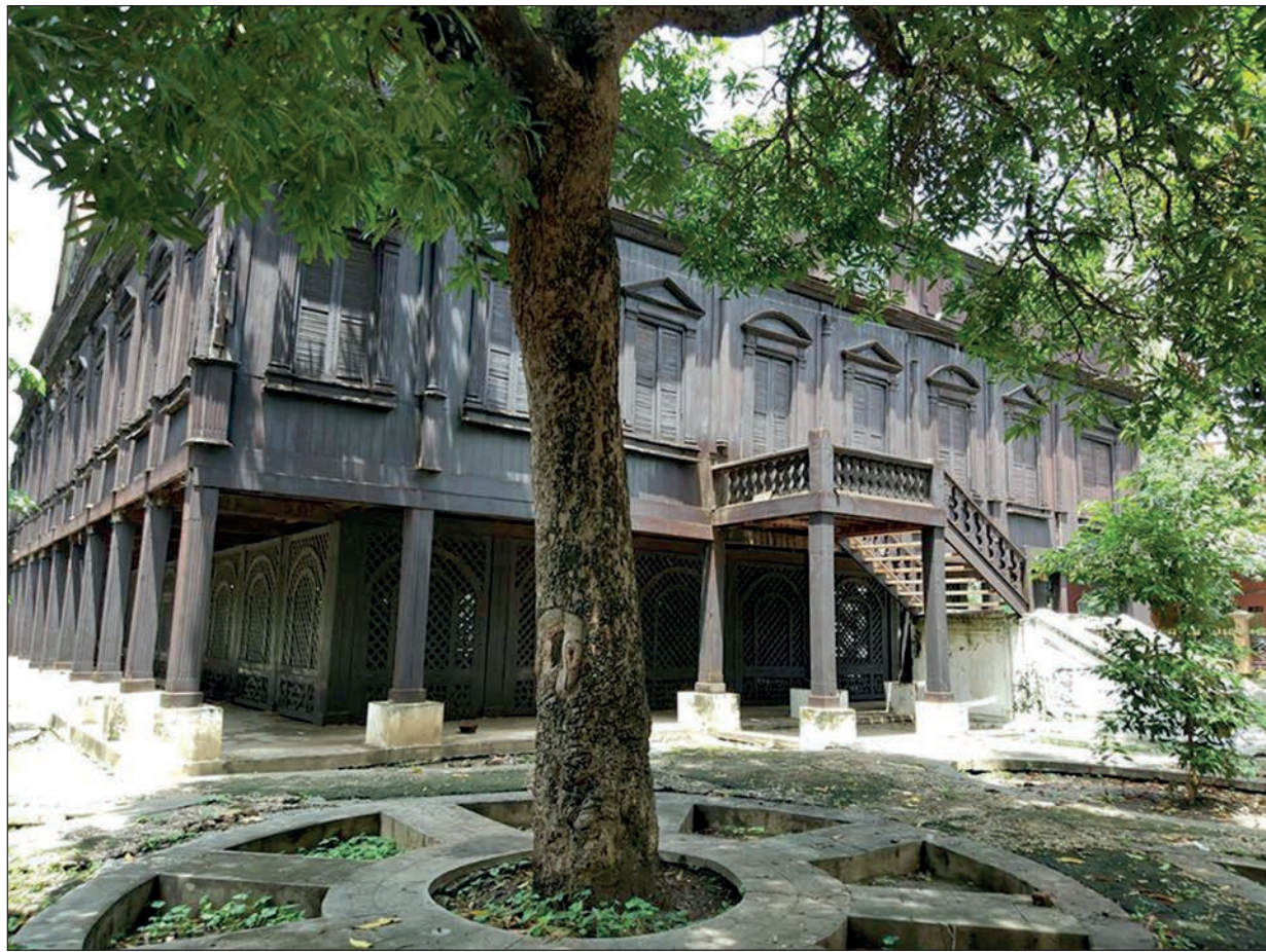
Thakawun Monastery.

However, Myanmar handicrafts can be seen at some wooden and brick buildings built in Yadanabon era thanks to successive preservation. Among them, observation can be made at two monasteries namely Thakawun monastery and Yawmingyi brick monastery built in mixed styles of Myanmar and architectural