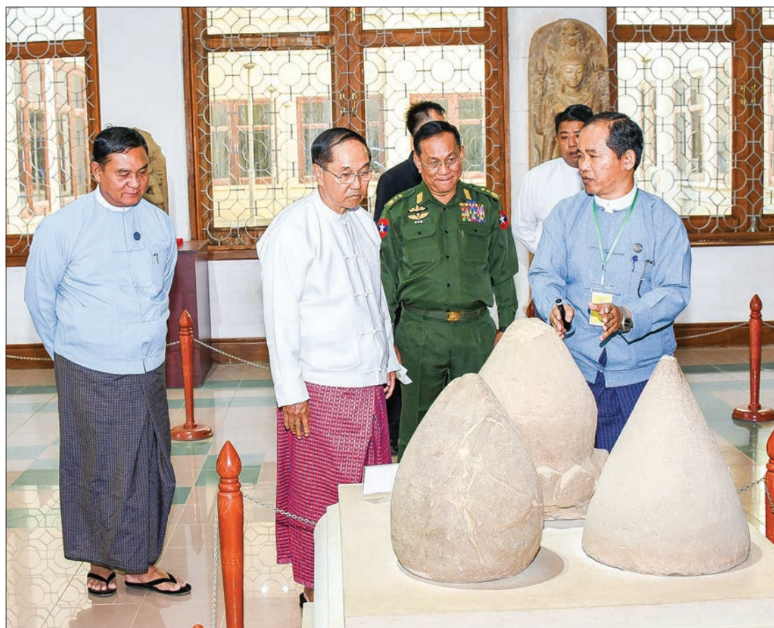
Vice President U Myint Swe visits Bagan Ancient Cultural Museum in Bagan yesterday.