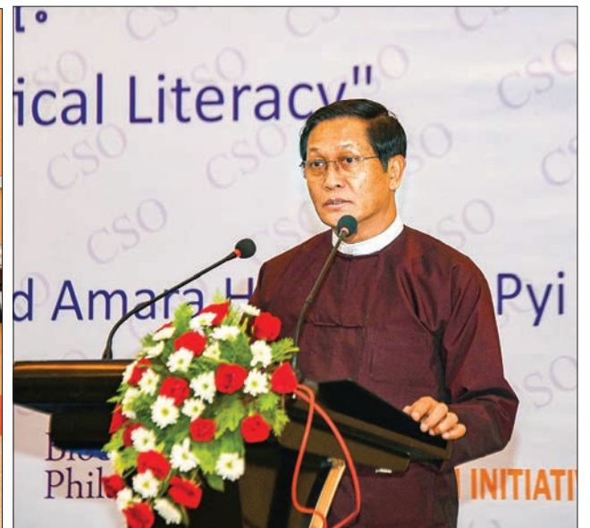
Vice President U Henry Van Thio delivers the opening address at the Myanmar Statistics Forum 2019 in Nay Pyi Taw yesterday.

V ICE President U Henry Van Thio, Chairman of the Central Committee for Accurate and High Quality Statistics addressed the Myanmar Statistics Forum 2019 held at the Grand Amara Hotel in Nay Pyi Taw yesterday morning.