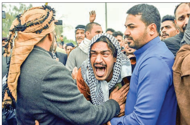
An Iraqi man mourns his brother during a funeral procession for anti-government demonstrators killed during protests a day earlier, in the shrine city of Najaf.

And Qais al-Khazaali, head of the powerful paramilitary faction Asaib Ahl al-Haq, tweeted: “Your commands will be ours, too.” —AFP ■