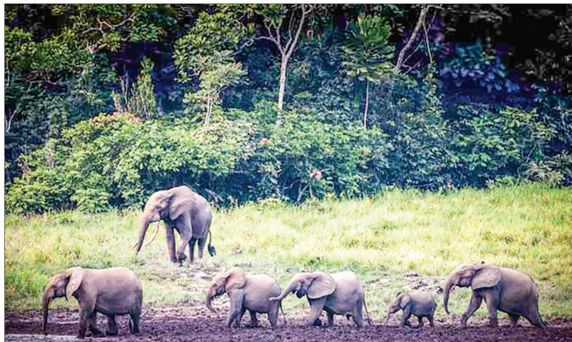
Elephants of Ivindo National Park, Gabon, May 2019.