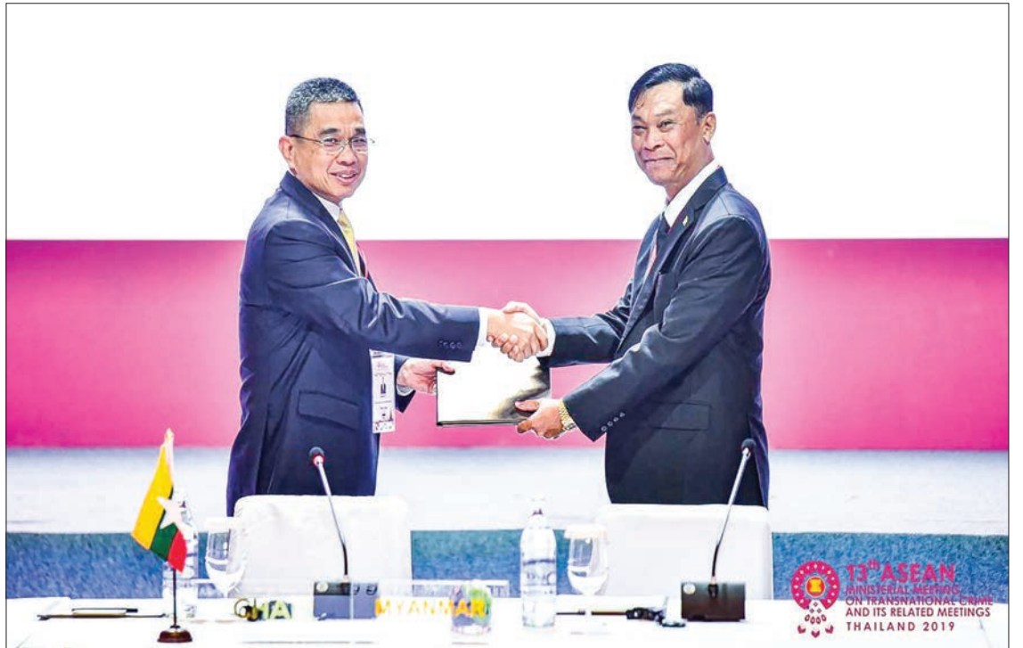
Union Minister Lt-Gen Kyaw Swe hands over the chairmanship to Thai Deputy Minister of Defence General Chaichan Changmongkol at the 13th ASEAN Ministerial Meeting on Transnational Crime and its Related Meetings (13th AMMTC) in Bangkok.

The 13 th AMMTC and Its Related Meetings were held from 25 to 28 November. During the meetings, they discussed and approved the matters related to work plans to tackle increasing violent extremism, trafficking in persons, cybercrime and anti-narcotic drugs, and strengthening cooperation on border management, using technology and capacity building for effective implementation for regional se-