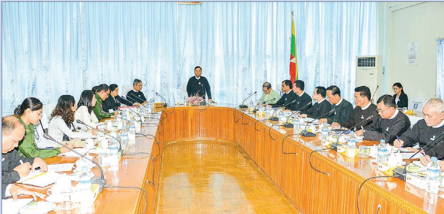
Union Attorney General U Tun Tun Oo delivers the opening speech at the first meeting of the Special Unit on International Criminal Justice at the Union Attorney General's Office in Nay Pyi Taw yesterday.