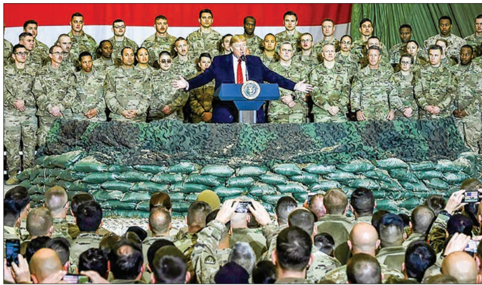
US President Donald Trump speaks to the troops during a surprise Thanksgiving visit at Bagram Airfield, on 28 November, 2019 in Afghanistan.

BAGRAM — President Donald Trump said Thursday the United States had resumed talks with Taliban insurgents as he made a surprise trip to Afghanistan to celebrate the Thanksgiving holiday with troops.