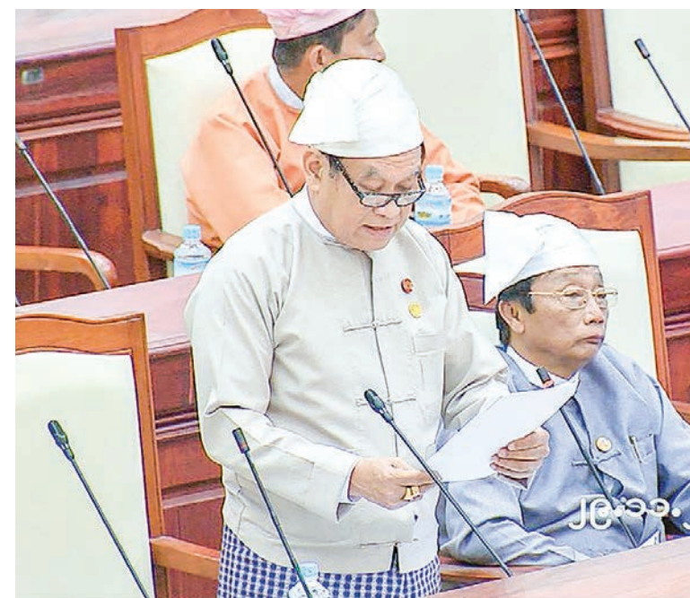
Union Minister Dr Myint Htwe. PHOTO MNA

But after the emergence of a government elected by the people and the reformation of parliaments, these ethnic medical specialists have decided to return to Myanmar and share their valu-