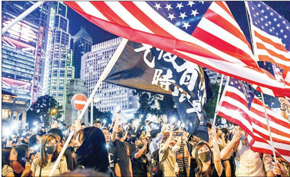
People wave American flags in a rally in Hong Kong on 14 October, 2019, calling for the US Congress to pass a Hong Kong human rights bill.

The spokesman responded to a reporter’s question over whether China will make a no-entry list of US lawmakers involved in the legislation aimed at supporting