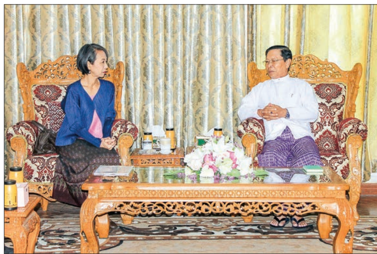
Union Minister Thura U Aung Ko meets with Thailand Ambassador Mrs Suphatra Srimaitrephithak.

UNION Minister for Religious Affairs and Culture Thura U Aung Ko received Ambassador of Thailand Mrs Suphatra Srimaitrephithak at his office in Nay Pyi Taw yesterday.