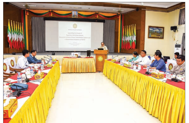
Union Minister Dr Myint Htwe delivers the address at the launching ceremony on e-Government initiatives in Nay Pyi Taw.

မေတ္တာတို့ကိုးသောကြီးအစိုးရအဖွဲ့၏ စီစဉ်မှုဖြင့် ပြန်ကြားရေးနှင့်ပြည်သူ့ဆက်သွယ်ရေးဝန်ကြီးဌာနမှ အခြေခံပညာရေးဝန်ကြီးဌာနနှင့် ပြည်သူ့ဆက်သွယ်ရေးဝန်ကြီးဌာနတို့ ပူးပေါင်းစီစဉ်ကျင်းပသော