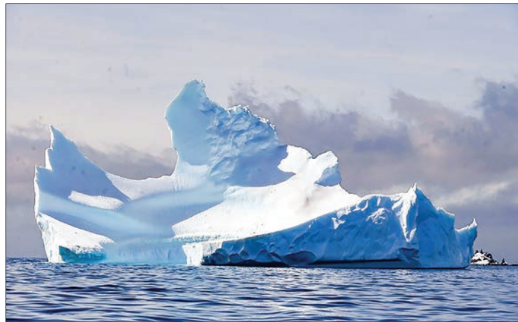
Tourism is the only commercial activity allowed, apart from fishing.

The penguins are as awkward on land as they are agile in water, while massive and majestic whales slip through the waves, and sea lions and seals laze in the sun.