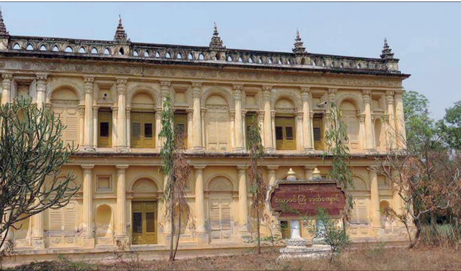
Yawmingyi Brick Monastery.