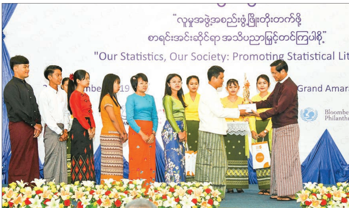
Vice President U Henry Van Thio presents first prize to student group leader from Meiktila University of Economics at the Myanmar Statistics Forum 2019 in Nay Pyi Taw yesterday.