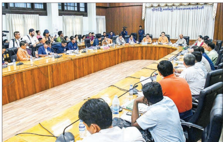
Yangon Region Chief Minister U Phyo Min Thein and shopkeepers of the Tamway Market hold a meeting for upgrading the market in Tamway Township, yesterday.

The Tamway Market Project is part of the Yangon Project Bank. — Min Thit