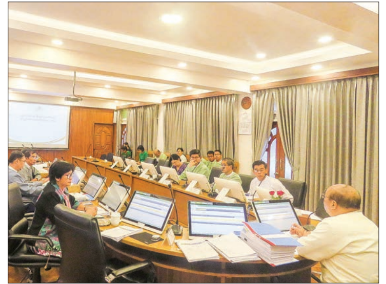
Union Minister U Thaung Tun attends the Myanmar Investment Commission meeting (19/2019) in Yangon yesterday.

The oil and gas sector has attracted the largest share of foreign investment (27.29 per cent), followed by the power