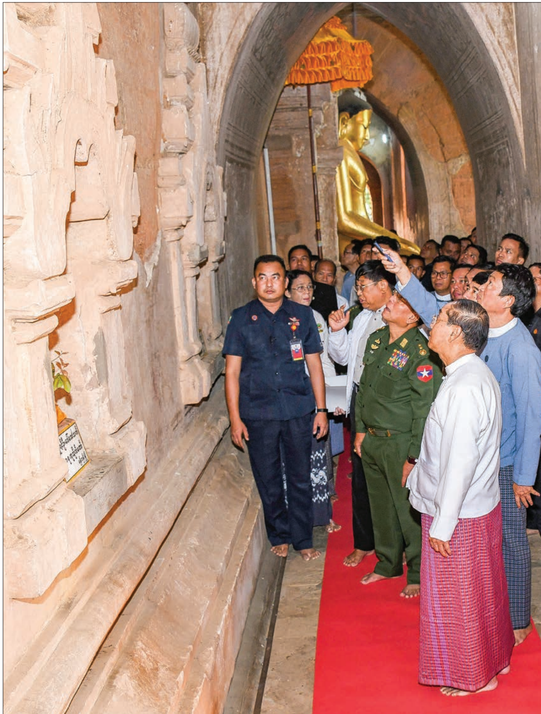
Vice President U Myint Swe inspects the restoration and conservation efforts in Htilominlo Temple, Bagan yesterday.