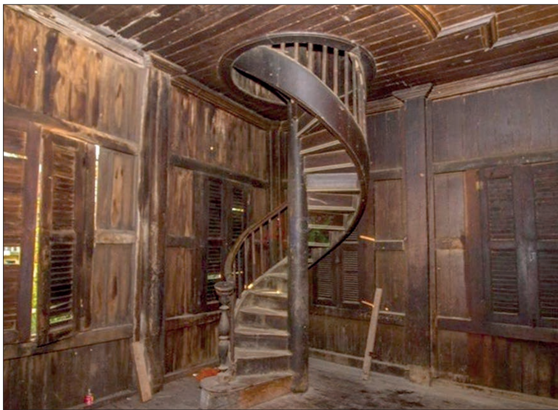
European style spiral stairs.

The brick building was formed with the main hall, the lecture hall and the chamber of Buddha image including a roofless balcony. Construction style took western architectural designs mixed with Myanmar ones, which were different from other brick monasteries in Mandalay. Indian technicians were assigned