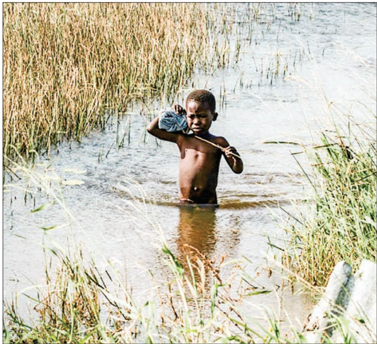
Storms in Mozambique displaced millions, destroyed homes and crops, inflicting an estimated $3 billion in damages — roughly 20 per cent of the country's GDP.

"Without finance to help countries cope with climate-induced loss and damage, the most vulnerable parts of the world will sink deeper into debt and poverty every time they are hit by climate disasters they did not cause," the letter said. —AFP ■