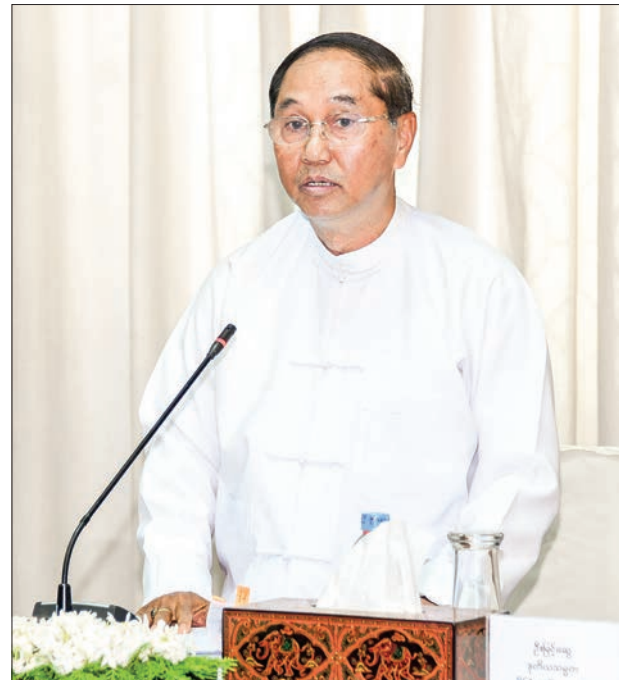
Vice President U Myint Swe delivers the speech at the fourth meeting of Steering Committee for Restoration and Conservation of Pagodas in Bagan yesterday.