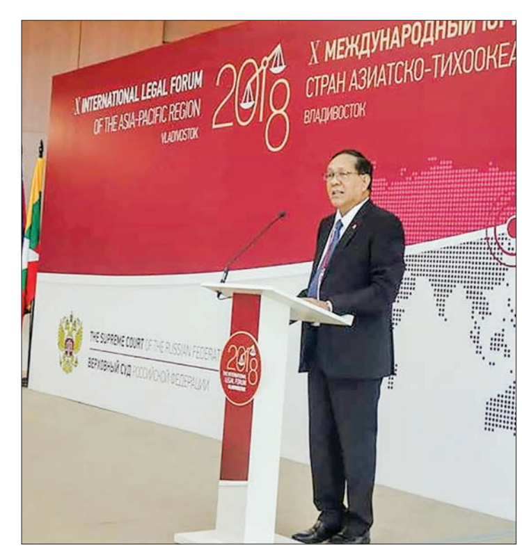
Union Chief Justice U Htun Htun Oo discusses "Role of Courts in the Fight Against International Money Laundering" at 10<sup>th</sup> Asia-Pacific International Legal Forum in Russia on 25 September.

The Ministry has already issued a directive on 10 January 2018 that the existing industries in particular nine sectors need to draw up EMP report. Those nine sectors are manufacturing of alcohol and beer, food and beverage, pesticide production including processing and packaging, textile dyeing and printing and distilleries, cement, smelting and moulding business (metal work), leather work, pulp and paper mills and sugar refinery businesses. —Myint Maung Soe