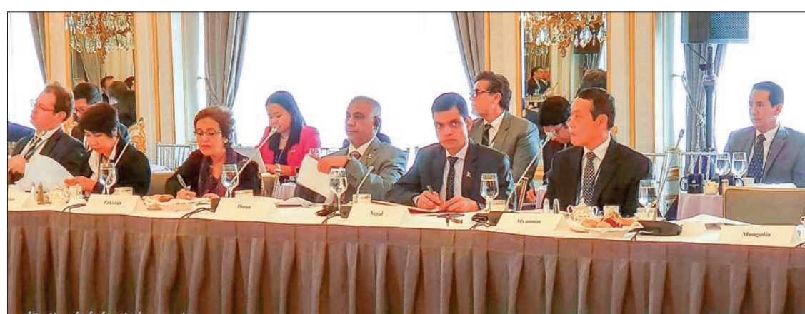
Myanmar Ambassador to the United States U Aung Lin Asia Cooperation Dialogue Foreign Minister s level meeting's working lunch in St. Regis Hotel, Penthouse, New York, in Penthouse, New York.

It is learnt that Turkey will take up the chairmanship of ACD for 2020-2021, while ACD meetings will be held in Tehran, Iran and Doha, Qatar in 2019. — MNA 🗖