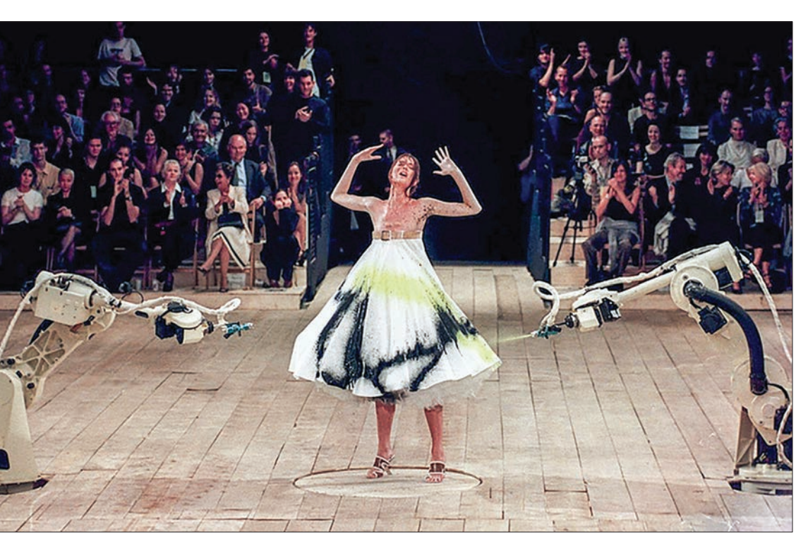
A scientist says artificial intelligence will never be able to replace humans in the field of art.

The study has been published in the journal Angewandte Chemie.