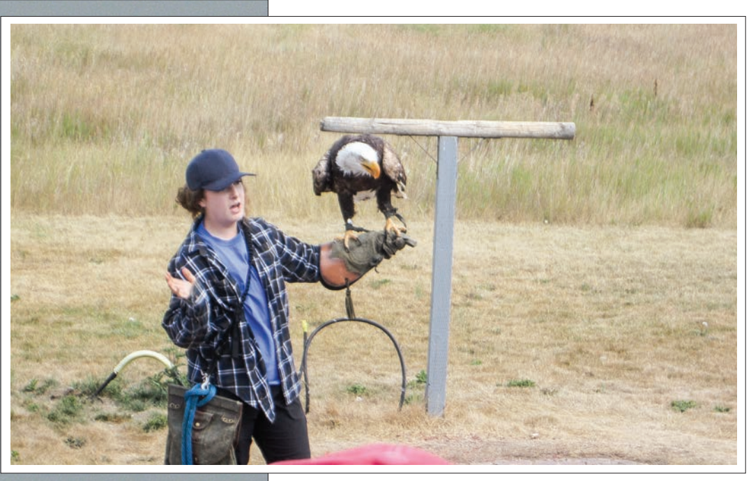
A bald eagele in a bird rehabilitation center in Western Canada.

cross pollination of flowers to mention only a handful. Today poultry birds like turkey, chicken, ducks, geese, quails, etc., serve as an important human and animal food sources in the form of meat and eggs. The poultry birds around the globe are an economically affordable and notable supply of protein and fats in our regular diet. Thus birds are a big component of human life as a natural component of our ecosystem, as an important food source, as both pests and pets as a source of inspiration for arts, aesthetics, sculpture, literature, legends, folklores, myths.