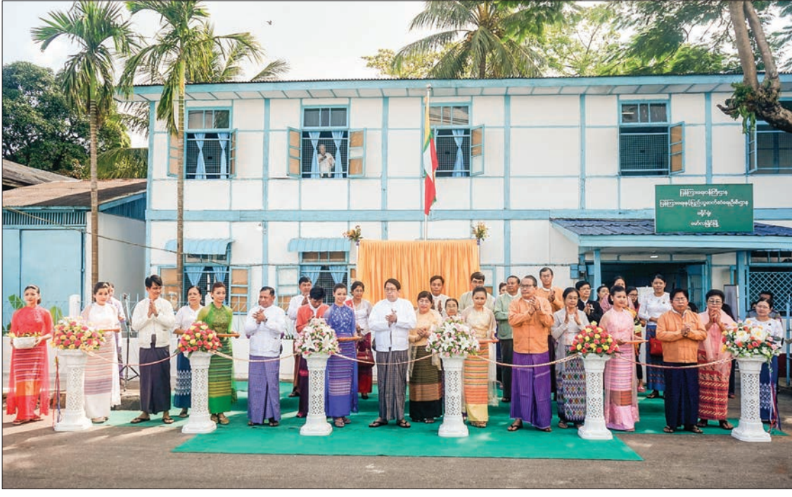
Union Minister Dr. Pe Myint and officials cut the ceremonial ribbon to open the Community Centre in Mawlamyine yesterday.

Union Minister Dr. Pe Myint said the Ministry of Information has been upgrading the libraries of the IPRDs to the community centres where local people can gather and exchange information and hold discussion about social welfare activities, and organizations and associations can hold