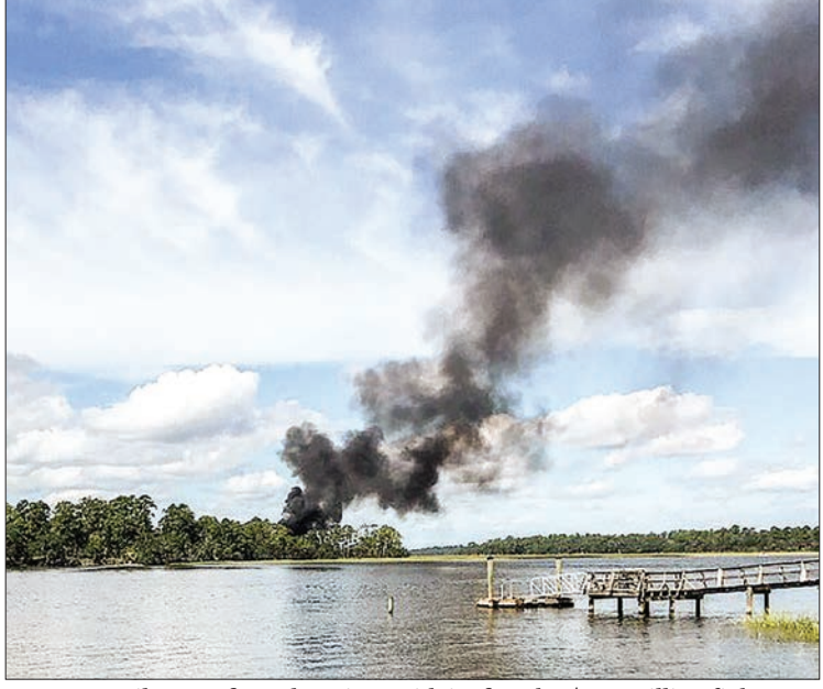
A US F-35 pilot was forced to eject midair after the $100million fighter jet crashed in South Carolina.

"For the first time, we're seeing a real effort by both sides," he said. "In the next 48 hours, we will know if we are going with a trilateral agreement."—AFP