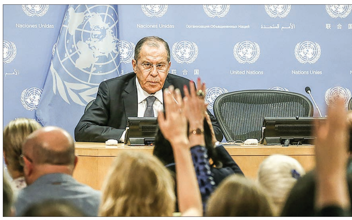
Russian Foreign Minister Sergey Lavrov.

the laws on joining the UN stipulate that the country gives priority to national legislation but none of the previous Administrations has pursued this line so openly and toughly," he said.