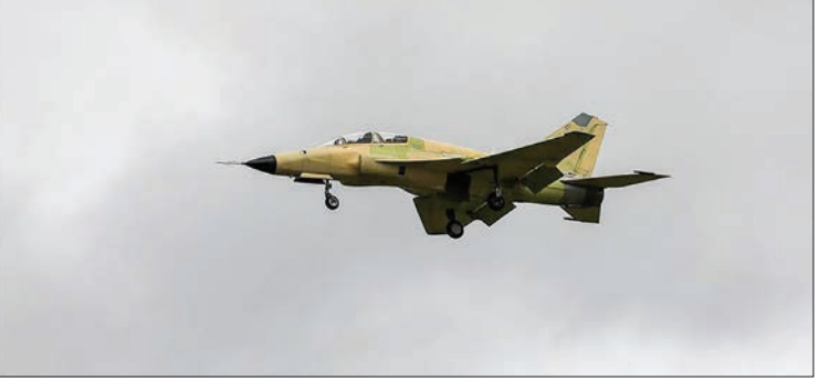
Photo taken on 28 September, 2018 shows the FTC-2000G aircraft flying in Anshun, southwest China's Guizhou Province.

The aircraft is flexible, reliable, cost-effective and is equipped with a variety of functions such as night vision. In addition, it has a strong capability for functional