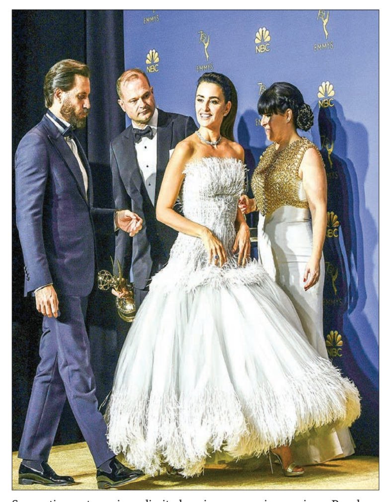
Supporting actress in a limited series or movie nominee Penelope Cruz walks on the press room stage during the 70th Emmy Awards at the Microsoft Theatre in Los Angeles, California on 17 September, 2018.

what we do," he told AFP noting that many times when charges are made public, "the person is considered guilty" without "the opportunity to defend" himself