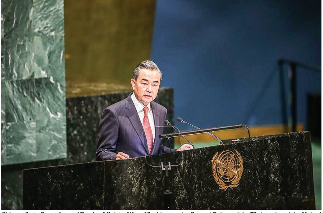
Chinese State Councilor and Foreign Minister Wang Yi addresses the General Debate of the 73rd session of the United Nations General Assembly at the UN headquarters in New York, on 28 September, 2018.

Fourth, all nations must act to deliver real results. "It is imperative that we work together to