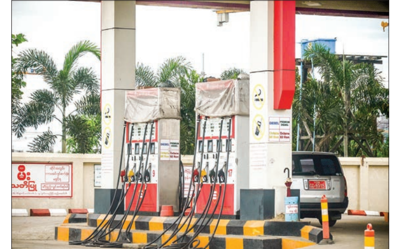
A filling station in Yangon.

The domestic fuel prices mainly depend on dollar values and MOPS prices. Local fuel prices will remain unchanged despite dollar depreciation when fuel prices are high in the global market. That is why domestic