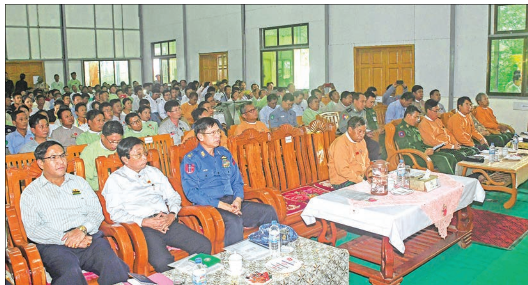
Vice President U Henry Van Thio addresses the ceremony to present land use permit form (3) to farmers in Thabeikkyin Township.

In order to develop infrastructure for the country and to increase security, urban areas were expanded, road, bridges and factories were constructed, permission granted to depart-