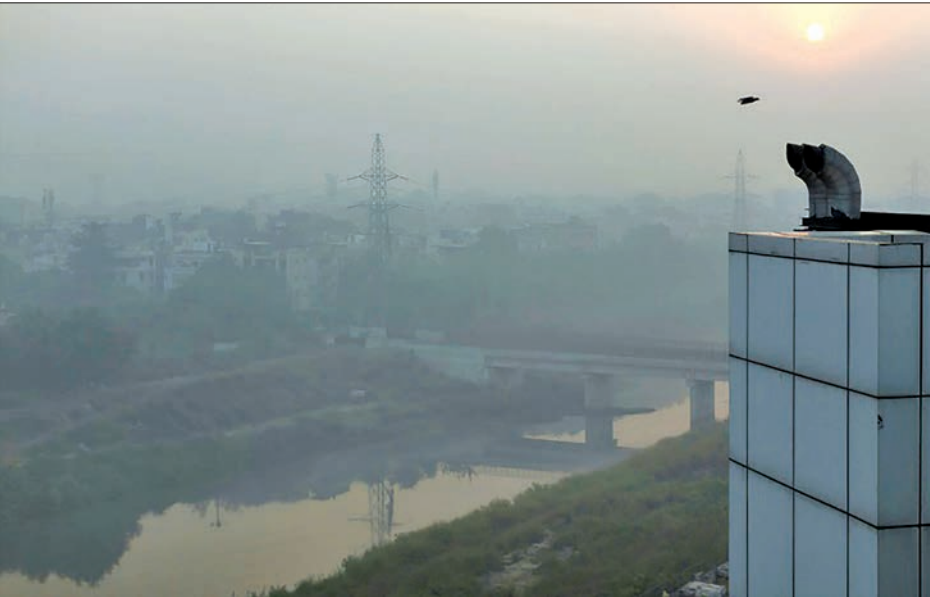
Heavy smog in New Delhi. Levels spike during winter when air quality often eclipses the World Health Organization’s safe levels.

“Air pollution is stunting our children’s brains, affecting their health in more ways than we suspected,” warned Maria Neira, the head of the WHO’s depart-