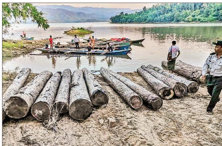
A Forestry Department official walks past illegal tree logs confiscated from Madaya forest reserve.

The forest department is measuring the seized timber