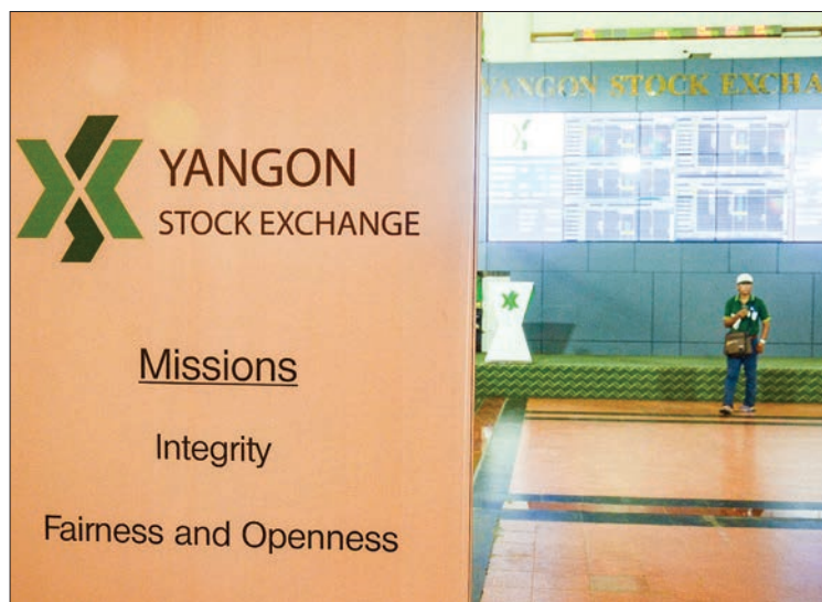
The Yangon Stock Exchange.

In a bid to grow capital markets, a market promotion team will be formed with the financial assistance of Japan International Cooperation Agency to consult with the