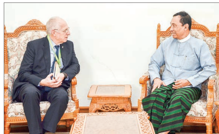
Pyidaungsu Hluttaw Commission Chair Thura U Shwe Mann holds talks with New Zealand Ambassador in Nay Pyi Taw.