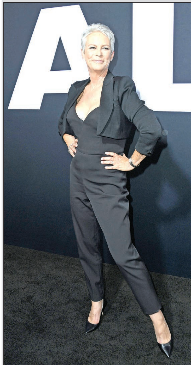
US actress Jamie Lee Curtis attends the “Halloween” premiere at the TCL Chinese Theatre in Los Angeles, California on 17 October, 2018.

Based on R.L. Stine children's books, it follows two young friends who bring to life a dummy, played by Jack Black, unleashing monsters on their town on Halloween night. —AFP ■