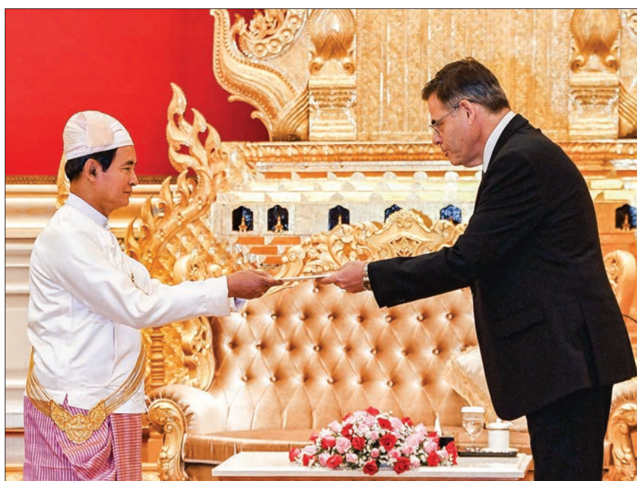
President U Win Myint accepts the credentials of incoming Ambassador of the State of Israel to Myanmar at the Presidential Palace.