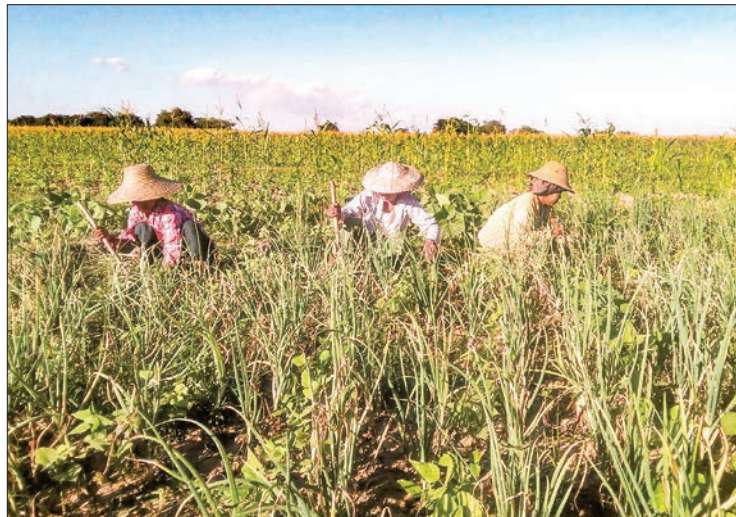
Farmers labour in the field.

During the incumbent government term the bank increased agriculture loans from Ks 20,000 to Ks 50,000 per acre for the first time. This year, the bank is increasing the loan amount from Ks 50,000 to