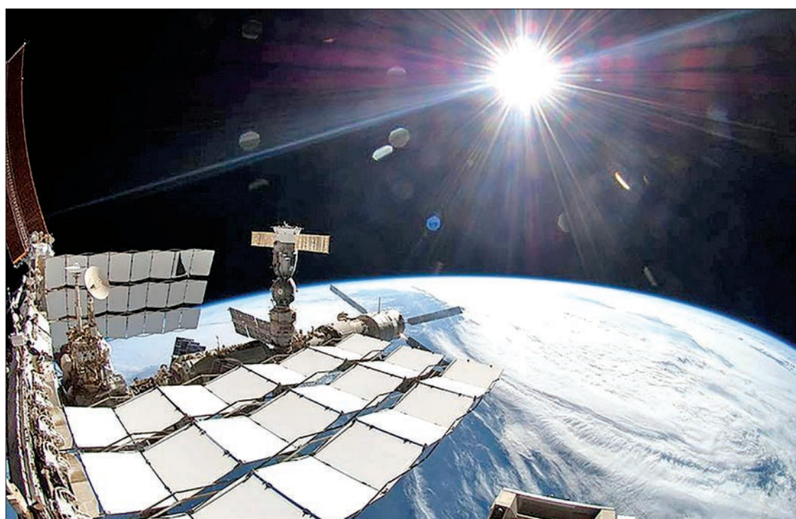
Crew members on manned missions beyond the Earth’s boundaries that last more than twelve months need protection from galactic and solar cosmic rays.