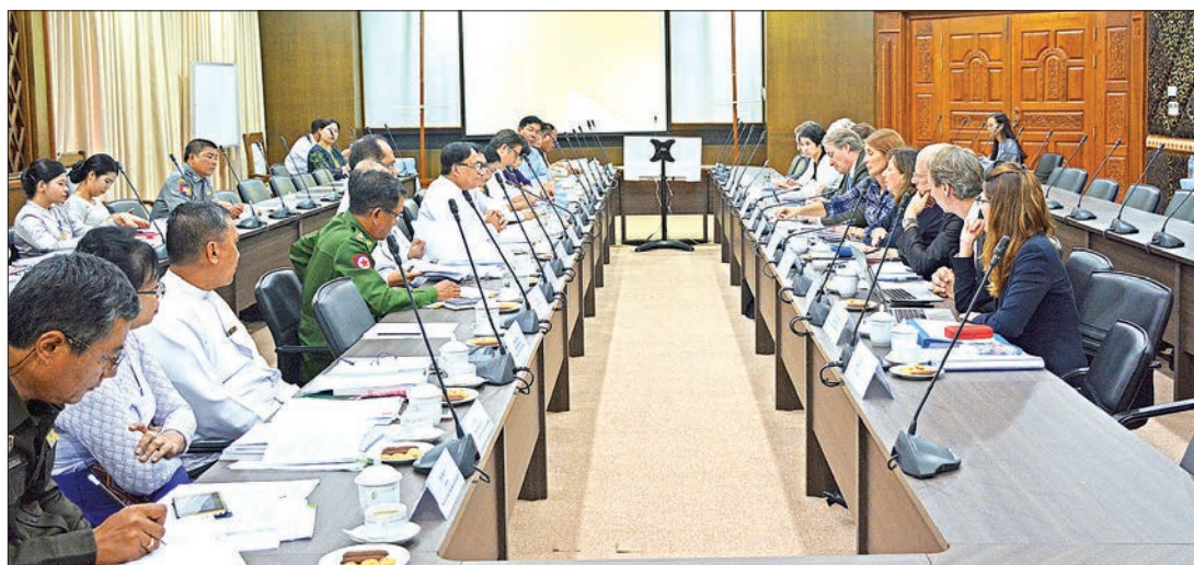
Union Minister U Kyaw Tin co-chairs the meeting with the EU EBA Monitoring Mission at the Ministry of Foreign Affairs in Nay Pyi Taw yesterday. PHOTO: MNA

The EU Monitoring Mission was also accompanied by Mr. Kristian Schmidt, Ambassador of the European Union to Myanmar. — MNA ■