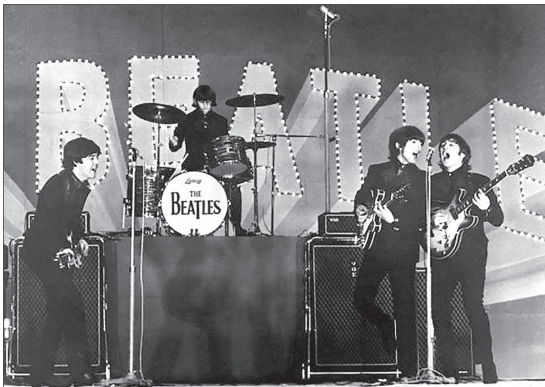
The Beatles, Paul McCartney (left to right), Ringo Starr, George Harrison and John Lennon, perform a concert at the Budokan in Tokyo in 1966.