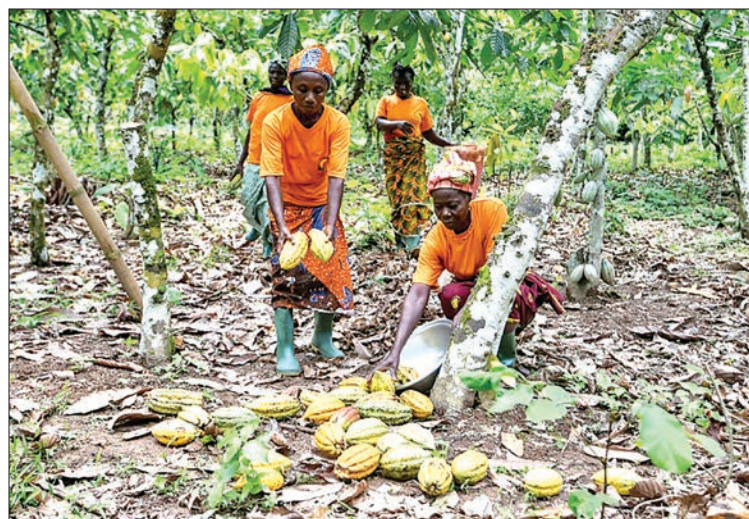
Cacao pods used today to produce chocolate have been gathered by humans for more than 5000 years, scientists say.

“It is a major part of our human story, one intimately linked to the history and ongoing cultures of indigenous south and central Americans where cacao is still grown and used today.” —AFP ■