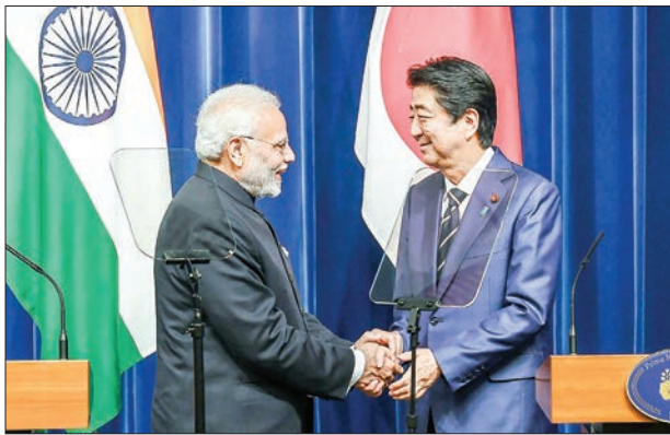
In this handout photograph released by India's Press Information Bureau (PIB) on 29 October, 2018, Indian Prime Minister Narendra Modi (L) shakes hands with his Japanese counterpart Shinzo Abe during a joint press statement in Tokyo.

TOKYO (Japan) — Japan and India agreed on Monday to upgrade diplomatic and military ties, with Tokyo also offering low-interest loans as the two countries seek closer ties to balance China's weight in the region.