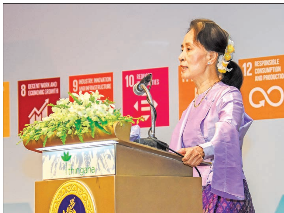
State Counsellor Daw Aung San Suu Kyi delivers an address at the reception to mark the 73 rd United Nations Day held in Thingaha Hotel, Nay Pyi Taw.

in Nay Pyi Taw at 10:00 am yesterday. Present on the occasion were Union Minister for International Cooperation U Kyaw Tin, Deputy Minister for the Office of the President U Min Thu and Director-General of the Protocol Department U Thant Sin. — MNA ■