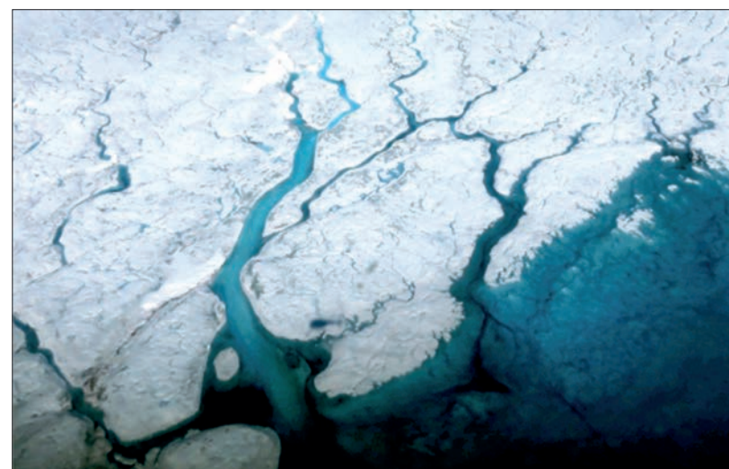
The Arctic ice breakup.

According to the CNN reports, these fires are taking toll on the atmosphere; they've re-