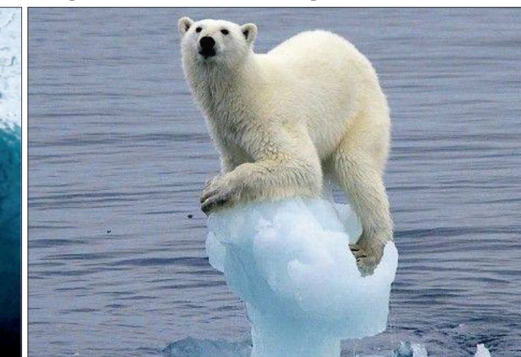
A polar bear stranded on a small iceberg during the breakup.

Having stated the latest situations of the wildfires raging on in more than 100 places in the Arctic, let us observe how seriously damaging those developments can cause to us humans, the animals and our planet itself. One thing that is undeniable is the climate change will significantly worsen. When that happens, all the adverse consequences of the climate change will take place: draughts, desertification, depletion of grazing grounds for animals, flooding, melting of ice, ocean level rises, which will result in some ocean islands disappearing and low coastal areas to recede farther inland and thus depriving inhabitable and agricultural spaces. The worst case scenario would be wide spread conflicts between the people who are desperate to get arable spaces for their survival.