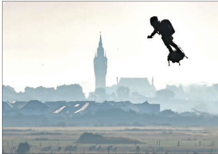
Franky Zapata had to be pulled from the water after a botched refuelling attempt when he first tried to fly across the English Channel on 25 July.

ing to repair the hoverboard after it was damaged from falling in the Channel waters 10 days ago.