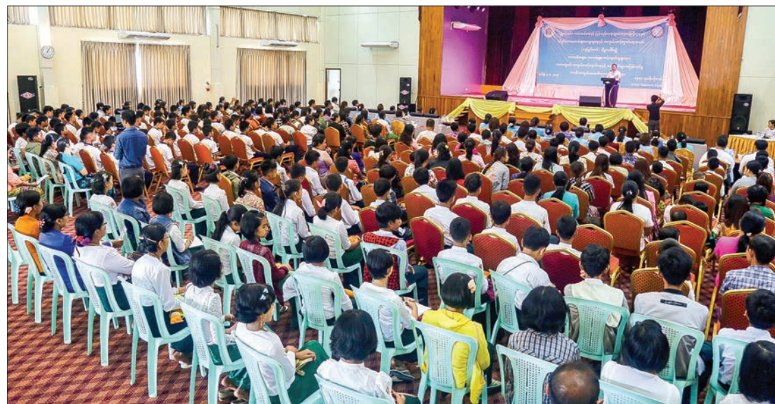
Educative talks on protection of children and women being convened yesterday.

UNION Minister for Social Welfare, Relief and Resettlement Dr Win Myat Aye said yesterday that the relevant ministries, INGOs and social organizations are working together for law enforcement to protect children and women from various forms of mental and physical abuses.