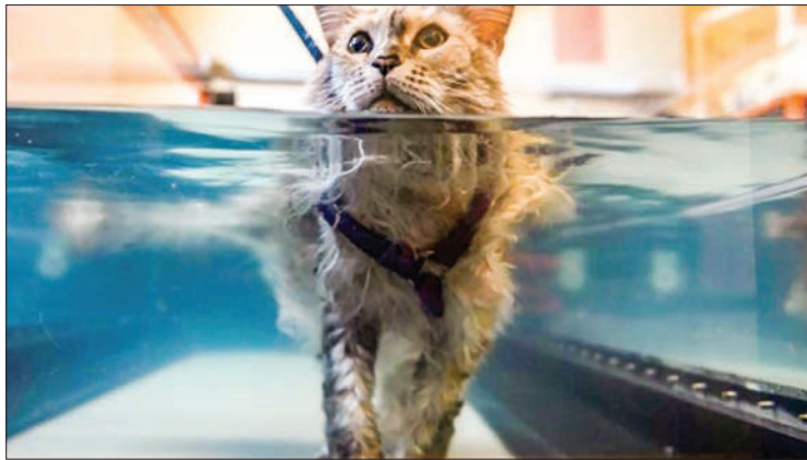
Pets in America now get human treatment.

“Millennials are the largest pet-owning demographic among