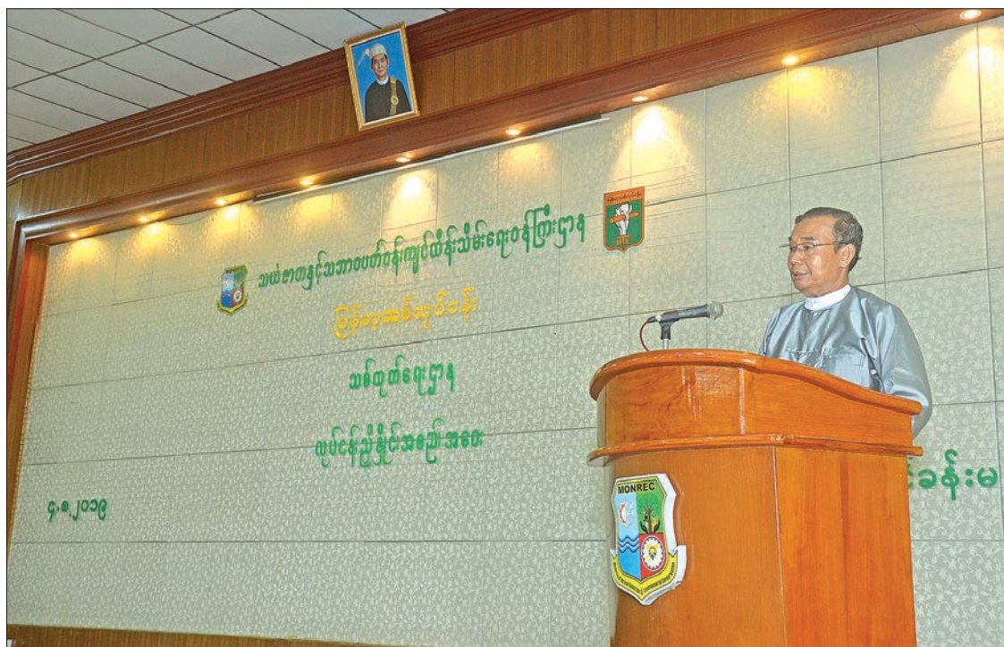
Union Minister U Ohn Win addresses the coordination meeting of the Myanma Timber Enterprise in Yangon yesterday.

Later in the afternoon, the Union Minister visited the Yangon Gems and Jewellery Sales Center in Hlinethaya Industrial Zone 2 where he observed the production and sale of raw and finished jade products, market penetration and employment creation. — MNA ■ (Translated by Zaw Htet Oo)