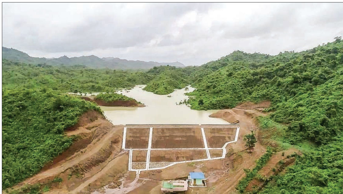
The Yoetayok Dam in Ponnagyun Township is preventing floods during the monsoon and supply water during the summer.

THE Rakhine State branch of the Department of Irrigation and Water Utilization Management (IWUMD) built the Yoetayok Dam in Ponnagyun Township in the fiscal year 2018-2019.