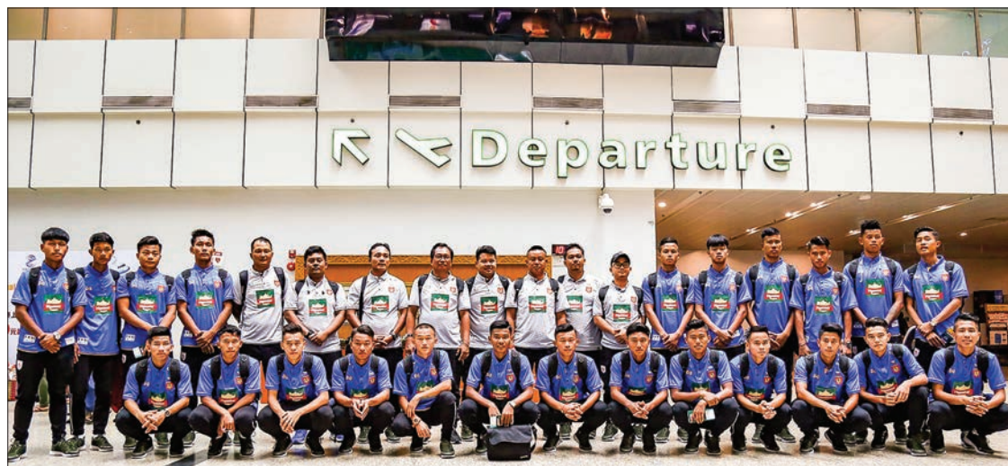
The Myanmar U-18 football team pose for a group photo with their coaches at the Yangon International Airport ahead of the AFF U-18 Championship 2019 in Viet Nam.