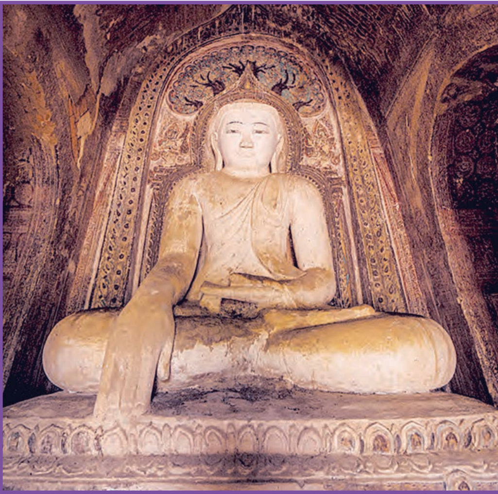
Ancient Buddha Statue.