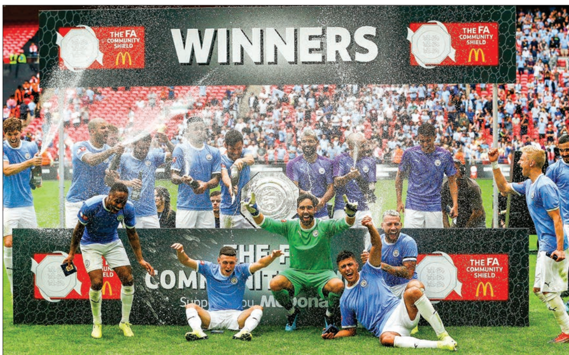
Manchester City players celebrate during the presentation of the trophy after winning the English FA Community Shield football match between Manchester City and Liverpool at Wembley Stadium in north London on 4 August 2019.

The jubilant celebrations from City’s players and fans showed inflicting an early psychological blow on Liverpool was a moment to savour, regardless