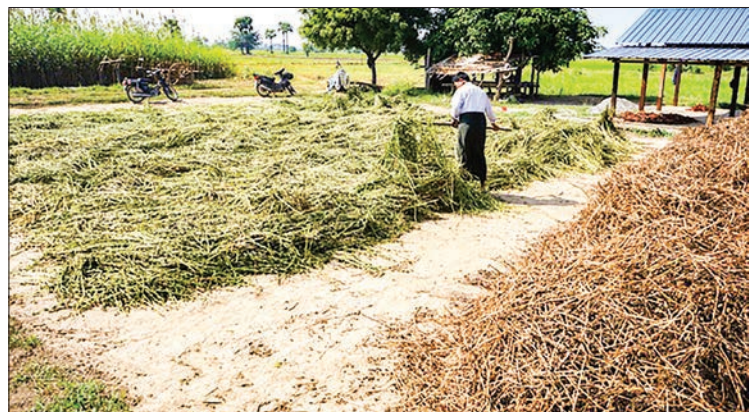
Sesame plantations seen in Kyaukse Township.

The area under sesame cultivation is also growing in Mandalay and Sagaing regions. Of the edible oil crops grown in Myanmar, the acreage under sesame is the highest, accounting for 51.3 per cent of the overall oil crop plantation. The volume of sesame exports was registered at over 96,000 tons, worth $130 million, in the 2015-2016 fiscal year; 100,000 tons, worth $145 million, in the 2016-2017 FY; and, 120,000 tons, worth $147 million, in the 2017-2018 FY.—GNLM ■ (Translated by Ei Myat Mon)