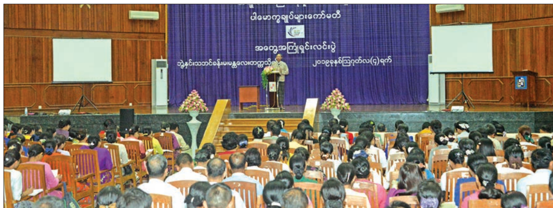
Union Minister Dr Myo Thein Gyi delivers speech at the experience sharing event of the Rector's Committee of the National Education Policy Commission in Mandalay yesterday.

Soe from Yangon University of Medicine (1) about 'Research Capacity Building in Universities'. The participants then discussed the topics in sub-groups, and exchanged the results, followed by adopting future plans.—MNA ■ (Translated by Aung Khin)