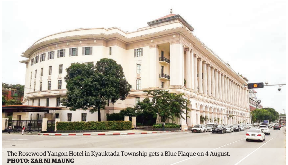
The Rosewood Yangon Hotel in Kyauktada Township gets a Blue Plaque on 4 August.

It was built between 1927 and 1931 as the New Law Courts, replacing the older District Courts and Public Offices constructed in 1868. The Burmese Socialist Programme Party used the building as its headquarters from 1965 until 1988. The building was once