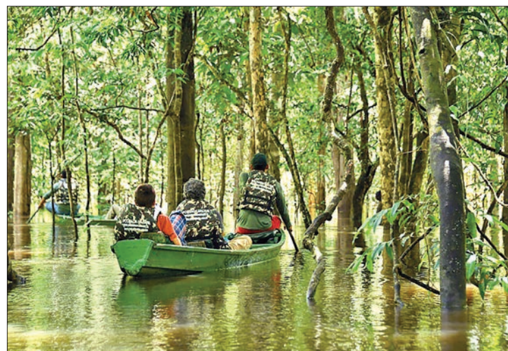
President Jair Bolsonaro has previously floated the idea of opening up protected rainforest areas to agriculture. PHOTO: AFP

The sacking of Galvao fueled criticism from environmental groups.— AFP ■