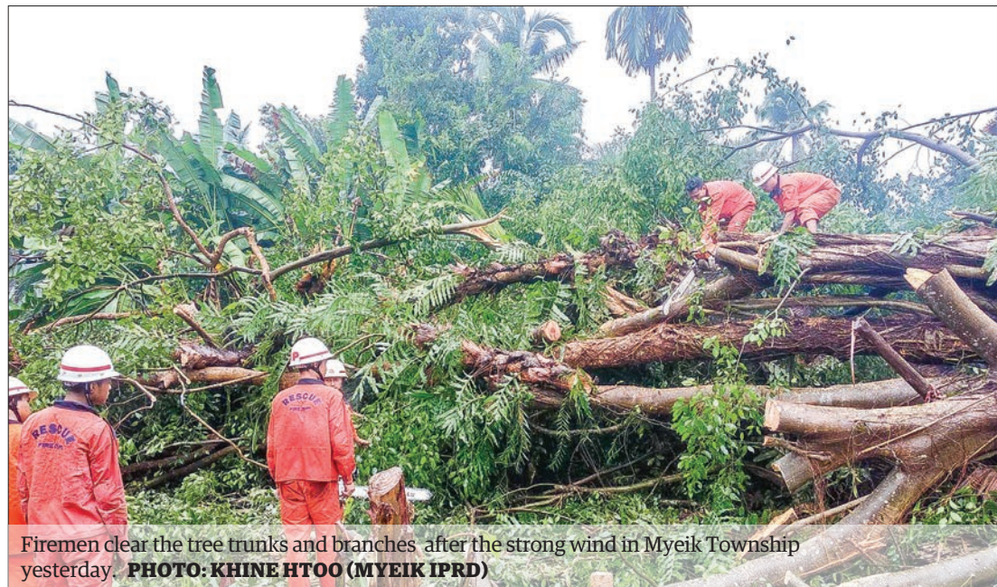
Firemen clear the tree trunks and branches after the strong wind in Myeik Township yesterday.