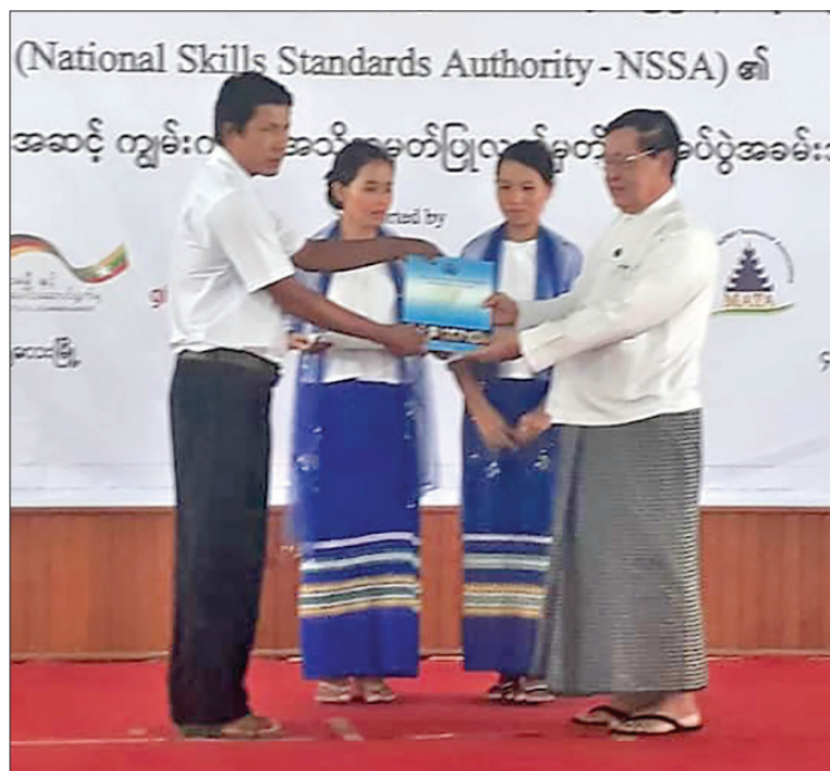
Union Minister U Thein Swe presents the national level skills certificate to a trainee at Ka Naung Hall in Mandalay yesterday.

ed with a "soon" (meal) to the Members of the Sangha.—MNA ■ (Translated by Kyaw Zin Lin)