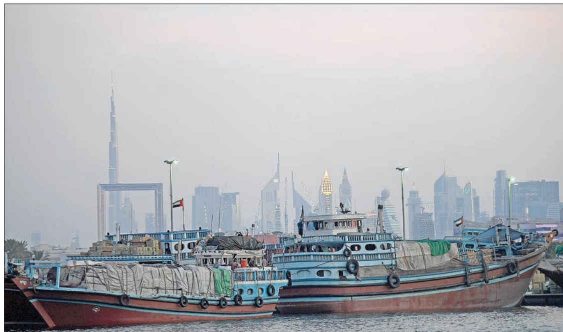
Iranian boats carrying commercial goods, mainly food ingredients, are shown docked at Ras al-Khor in Dubai early last month as tensions rose in Gulf waters.

On 18 July, the Guards said they had detained the Panama-flagged for MT Riah for alleged fuel smuggling. And a day later, they announced they had impounded the British-flagged Stena Impero in the Strait of Hormuz for breaking “international maritime rules”. —AFP ■