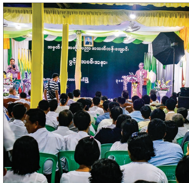
Rakhine State Chief Minister U Nyi Pu delivers the speech at the inauguration ceremony of upgraded No. 4 Basic Education High School in Taungup Township on 3 August.

The Chief Minister also presented K3.6 million cash fund for construction a creek bridge in Taungup Township to the ward administrator.— Tin Maung Lwin, Tin Tun (IPRD) ■ (Translated by Aung Khin)