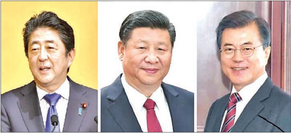
Combined file photo shows (from L) Japanese Prime Minister Shinzo Abe, Chinese President Xi Jinping and South Korean President Moon Jae In.

China, which this year holds the rotating chair of the trilateral framework,