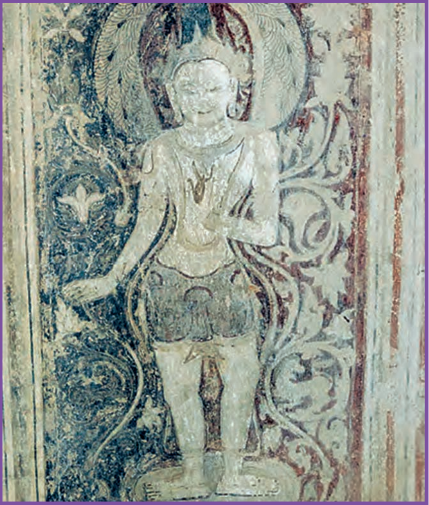
Ancient artwork.

around 12 th to 13 th century. The pagodas and temples were in a cluster of three or four located on small hills. I was trekking from one cluster to another viewing and observing it one by one. There were some pagodas or temples that are two tiers or two story and with cave like inside. There were some that can be ascended or entered while some had a strong smell of bats inside that prevent one from ascending or entering it. I entered and ascended one. Only when I was on top that I realize how close I was to Ayeyawady River. I can also see farmlands dotted with clusters of ancient pagodas and temples too.