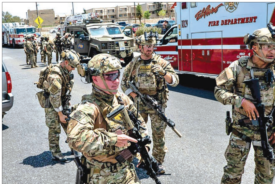
Law enforcement agents respond to an active shooter situation at a Walmart near Cielo Vista Mall in El Paso, Texas on Saturday, 3 August 2019.