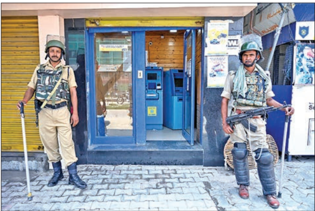
The recent spate of tensions in Kashmir started last weekend after New Delhi deployed at least 10,000 troops.

four-year-old boy — and critically injuring 11 others. New Delhi has denied the charge. Pakistan’s Prime Minister Imran Khan on Sunday accused India of taking “new aggressive actions”, saying it could “blow up into a regional crisis”. He called for a meeting of the country’s national security committee to review the situation in Kashmir. Fear grips locals Kashmir is a popular tourist destination for foreigners and Indians, who visit the picturesque valley in their tens of thousands every year. But tourists and students have been scrambling to leave since the government said they should depart “immediately”, amid new intelligence about “terror threats” to a major Hindu pilgrimage in the region. While the Indian military and the state government have highlighted the security risk, Kashmiri and opposition politicians in New Delhi are concerned the extra troops were deployed for other reasons.— AFP ■