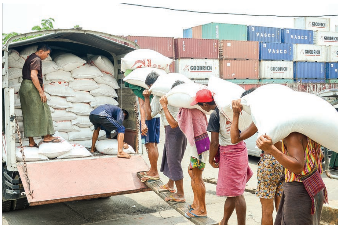
Workers loading rice sacks onto the truck in Yangon.

China, which accounts for 32.89 per cent of total rice export, is the main buyer of Myanmar's rice, followed by the Philippines and Cameroon in the second and third places respectively. Additionally, Côte d'Ivoire is ranked at the fourth place while Madagascar is the fifth largest buyer of Myanmar rice. European Union countries accounts for over 20 per cent of export, while 26 per cent of Myanmar's rice export goes to African countries. Myanmar's broken rice are mostly exported