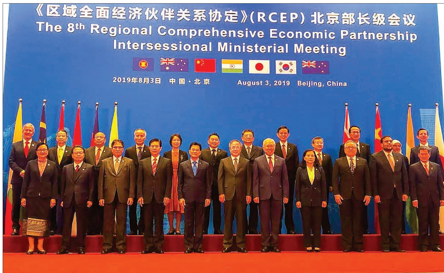
Union Minister U Thaung Tun poses for photos together with other attendees at the 8 th Regional Comprehensive Economic Partnership (RCEP) Intersessional Ministerial Meeting in Beijing on 3 August.

U NION Minister for Investment and Foreign Economic Relations, U Thaung Tun who led the Myanmar delegation to the 8th Regional Comprehensive Economic Partnership (RCEP) Intersessional Ministerial Meeting in Beijing, China 2-3 August 2019, arrived back in Yangon yesterday.