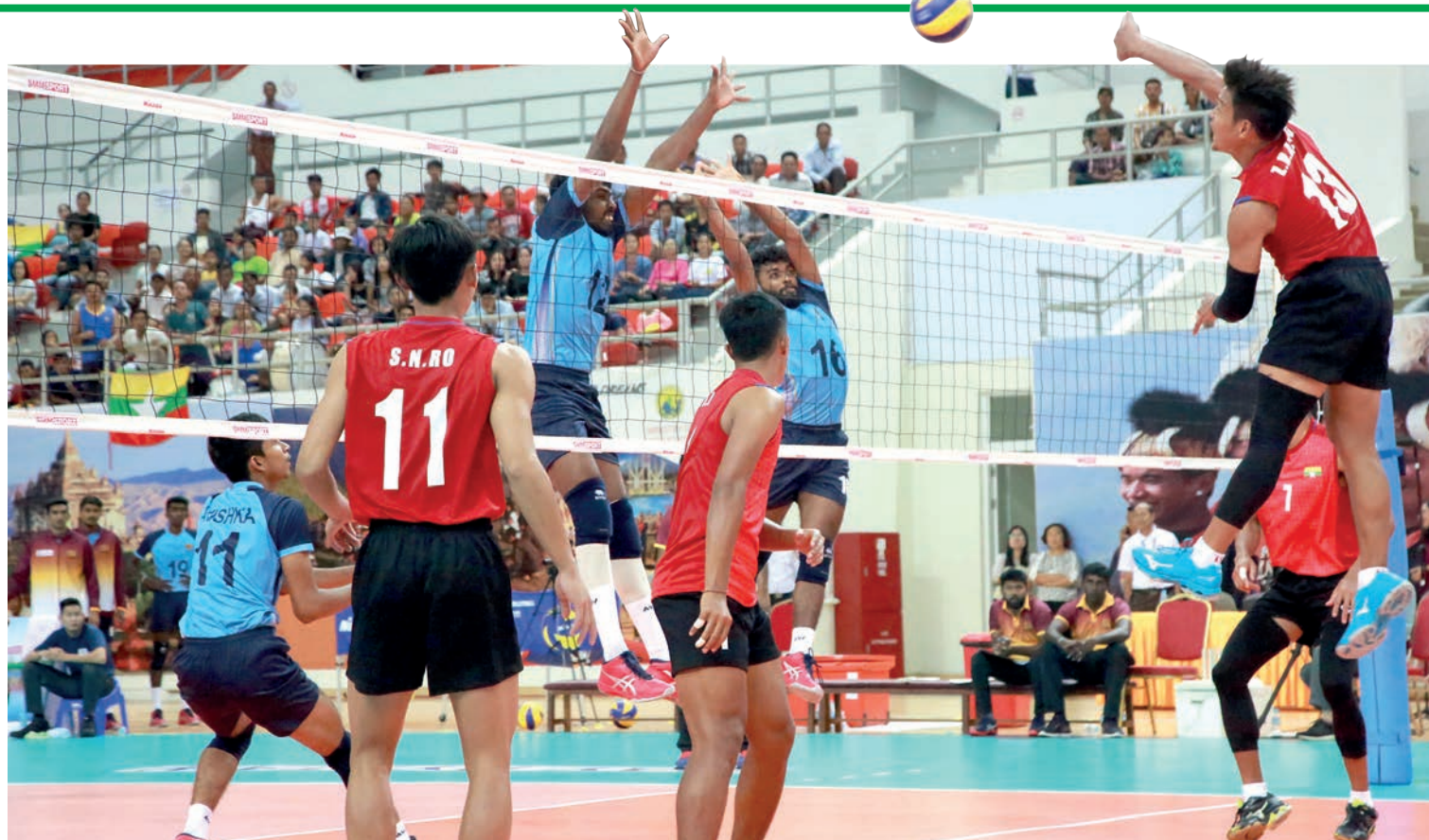
The Myanmar team (red) hits the ball towards the Sri Lankan team during the Group A match of the U-23 Asian Men's Club Volleyball Championship in Nay Pyi Taw yesterday.

The Lethwei championship will start at 2 pm Myanmar Standard Time on 18 August. — Lynn Thit (Tgi)