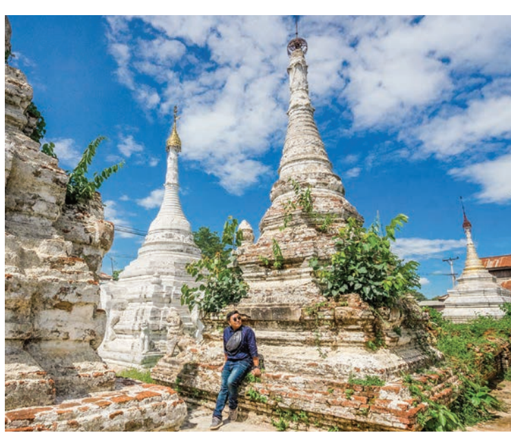
Will a few renovations be its attraction?