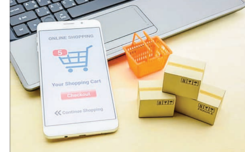
Nobel Prize-winning economist Joseph Stiglitz on Saturday urged the avoidance of zero-sum thinking and nationalistic mentalities so that all countries can reap the benefits of digital trade.

He said to achieve successful international cooperation, it is necessary to increase trans-