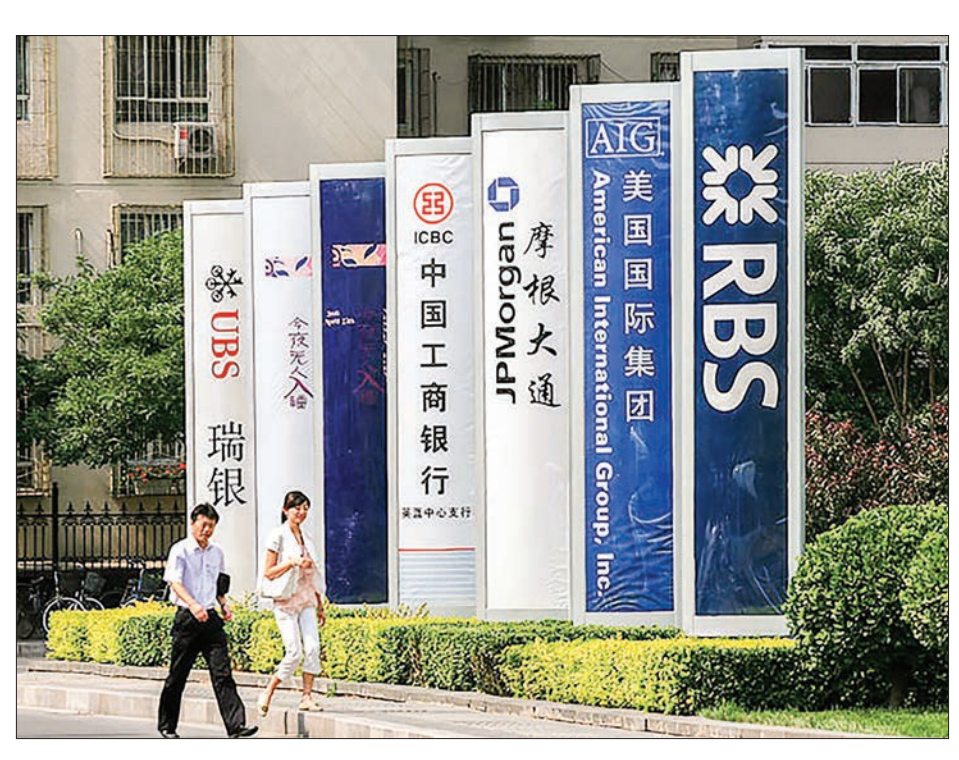
Chinese authorities have given approval to foreign banks and insurers to set up nearly 100 institutions in China since 2018.

BEIJING — Chinese authorities have given approval to foreign banks and insurers to set up nearly 100 institutions in China since 2018, an official said Sunday.