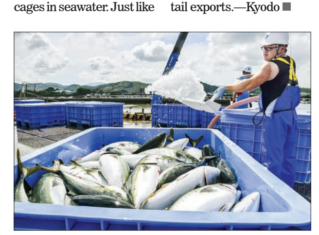
Photo taken July 2, 2020, shows yellowtail landed from open sea cages of a fish farm in Kushima in Miyazaki Prefecture, southwestern Japan.

unloaded a total of about 2,000 yellowtail in early July, said it takes about two years to grow fish in cages in seawater. Just like