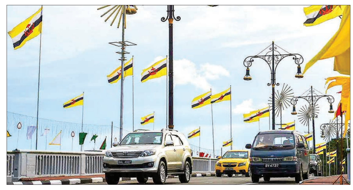
This file photo shows Brunei's national flags flown along a street in Bandar Seri Begawan.

The report said the study was made out of 250 nations and territories in a survey that looked into quarantine efficiency, monitoring and detection as well