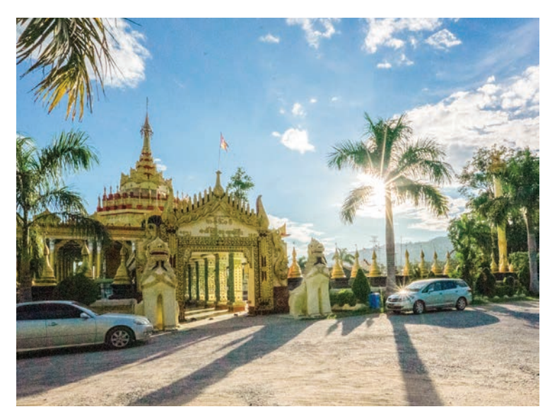
Baw Kyo pagoda. I arrived at Baw Kyo pagoda at 5pm.