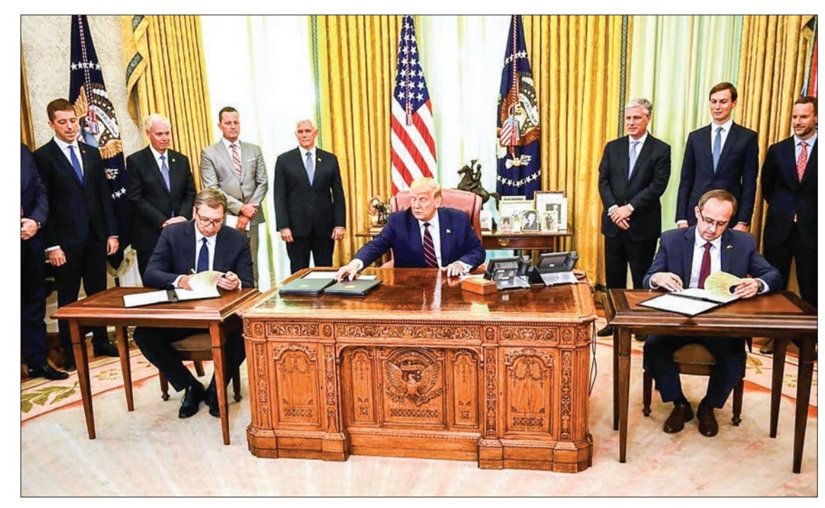
U.S. President Donald Trump watches as Kosovo Prime Minister Avdullah Hoti (R) and Serbian President Aleksandar Vucic (L) sign an agreement on opening economic relations, in the Oval Office of the White House in Washington, D.C., Sept. 4, 2020.

Israel seized control of East Jerusalem in 1967 and later annexed it in moves never recognised by the international community.—AFP ■