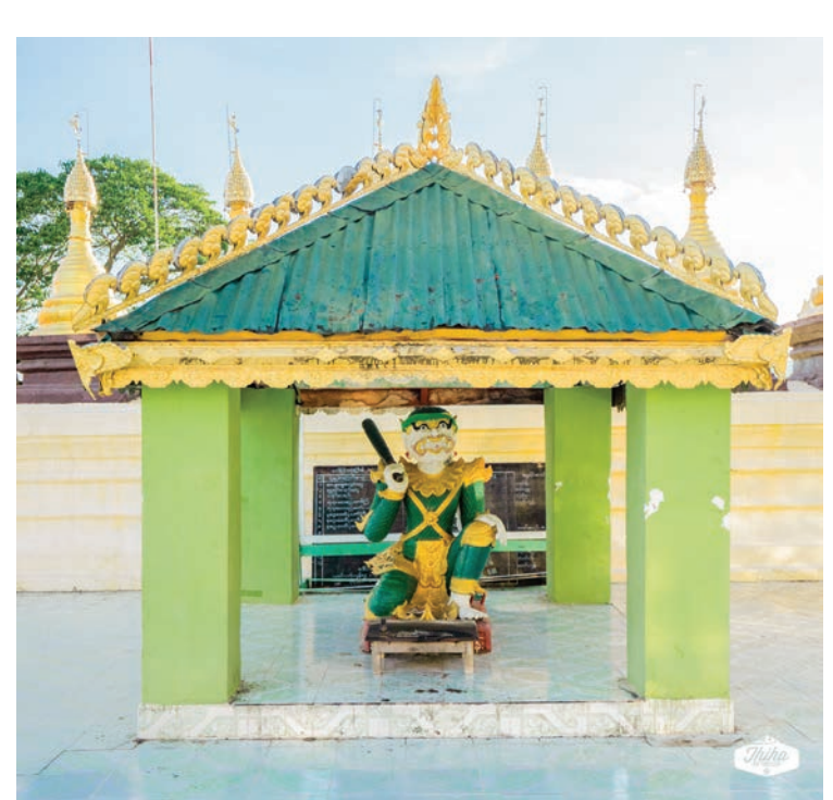
There are ogres' sculptures at every corner of the pagoda. The history of the pagoda is related with the ogres.