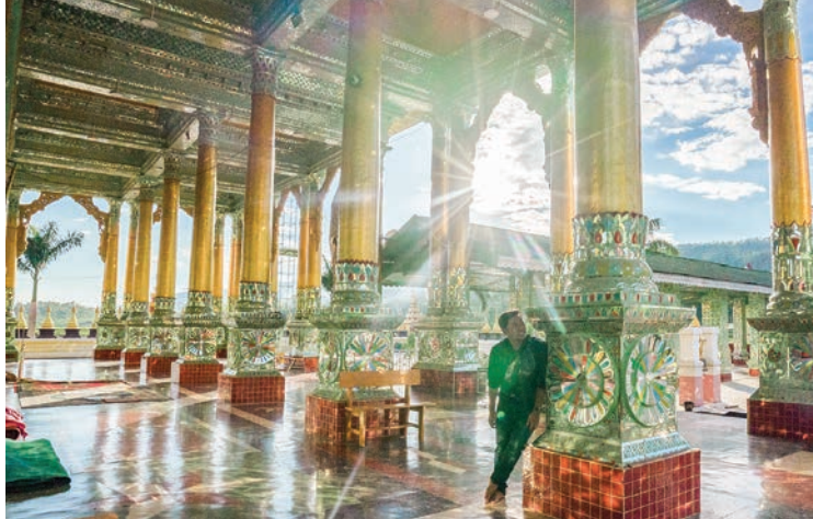
Stairways with glass mosaic embedded in gliding.