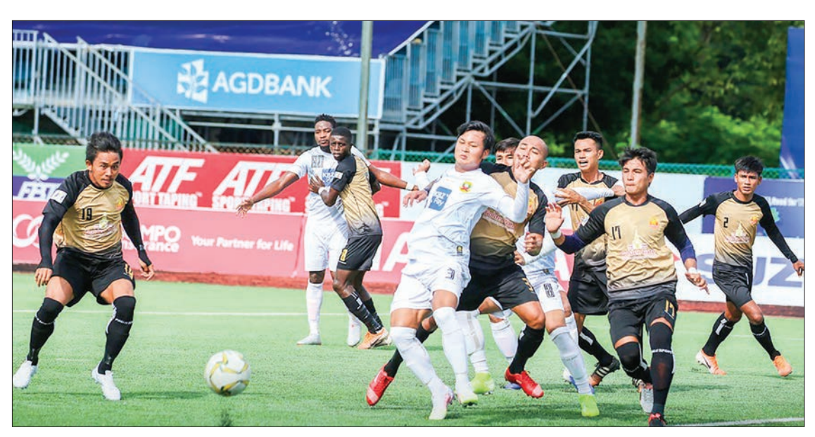
Shan United players (white) counter the ball with Rakhine United's players (brown) during the Week-13 MNL match played at Yangon United Sports Complex on 4 September 2020.

On 8 September, everyone will see another derby match: Yadanarbon FC vs Ayeyawady United scheduled to play at Thu-