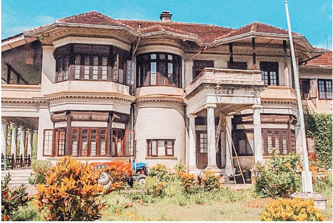
Hsipaw Haw Nan. A place that you should not miss. The visitors must pay a visit there during the fixed time. It is none other than the palaces of Sawbwa. The original Haw Nan and Sa Khan Tha Haw Nan were destroyed, and only Hsipaw Haw Nan left in its original style. It is now about 95 years old.