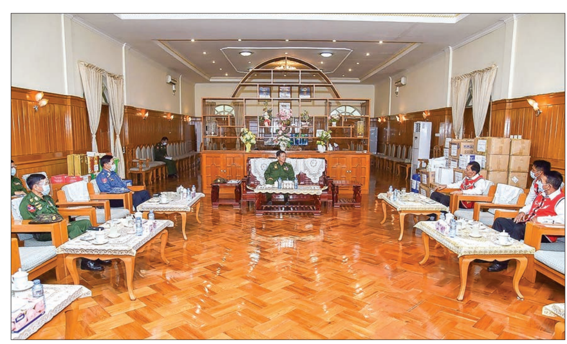
Senior General Min Aung Hlaing receives a delegation from United Wa State Army (UWSA) at Aung Pyi Hein Avenue in Tachilek Station of Triangle Region Command on 5 September .

At the ceremony, the Senior General donated 20,000 surgical masks, 300 sets of personal protective equipment (PPE), 1,000 N-95 masks, 250 face shields, six containers of sodium hypochloride with each container contain-