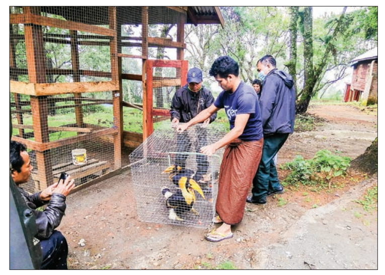
Wildlife conservationists releasing the two hornbills into Nat Ma Taung National Park in Kanpetlet, Chin State on 2 September, 2020.

TWO hornbills were released into Nat Ma Taung National Park, in Kanpetlet town, Mindat District, Chin State in the evening of 2 September as it is challenging to protect them due to extreme weather in Shwesettaw Wildlife Sanctuary.