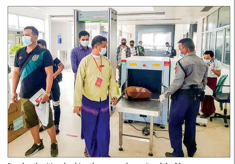
Local authorities checking the personal security of the Myanmar migrant workers in Myawady on 6 September, 2020.

457 Myanmar migrant workers in Thailand — 306 men and 151 women — returned home through the Myanmar-Thai Friendship Bridge No 2 in Myawady Border yesterday amid COVID-19 crisis.