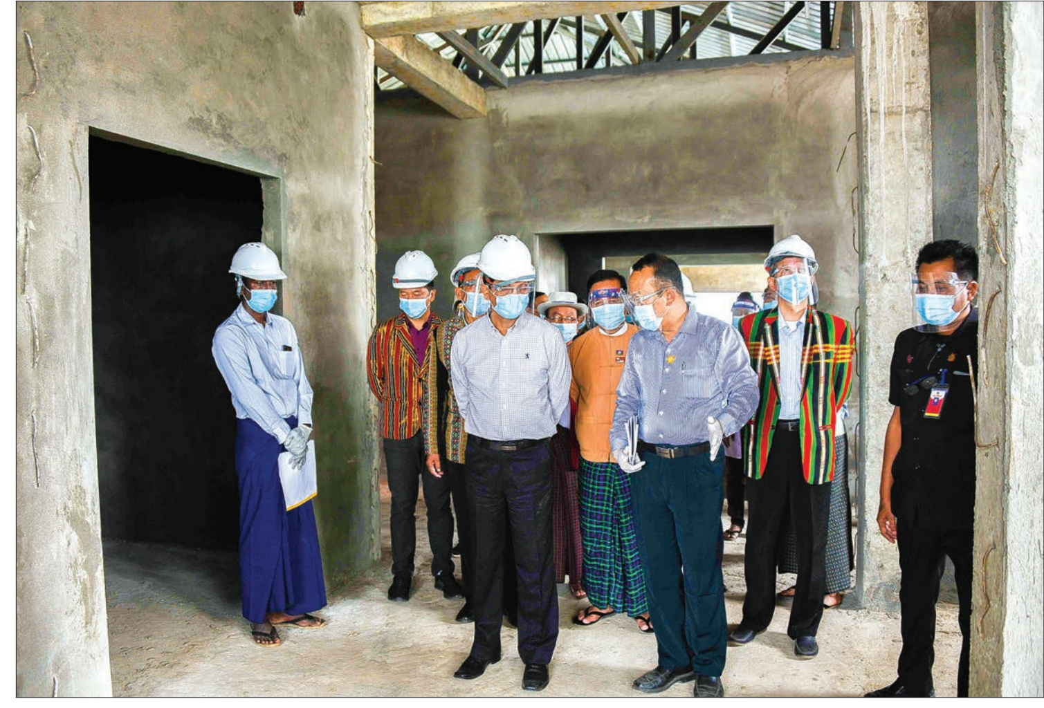
Vice President U Henry Van Thio inspects construction of extended building for the Rezwa Station Hospital on 5 September.