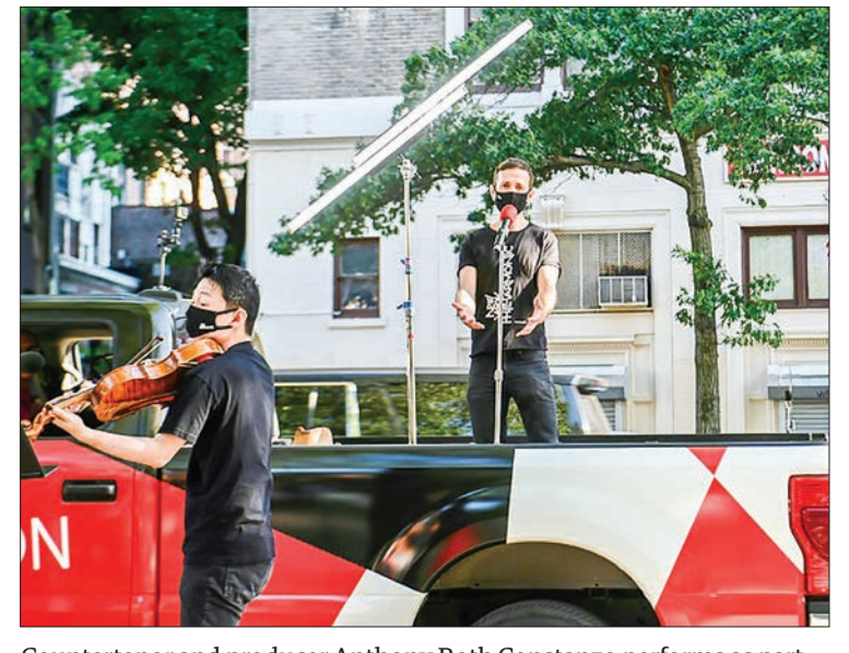
Countertenor and producer Anthony Roth Constanzo performs as part of the New York Philharmonic's new pop-up series.