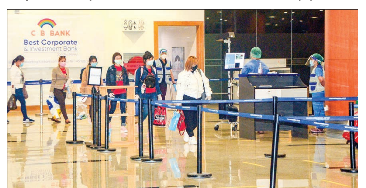
Myanmar nationals queuing for their immigration processes at Yangon International Airport on 6 September, 2020.