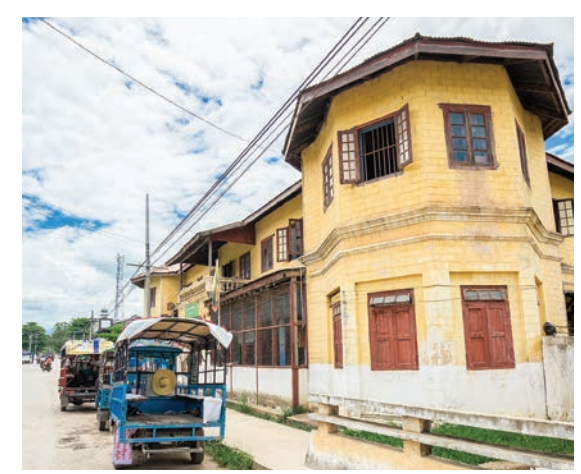
Bank opened at an ancient building near Hsipaw market in the downtown area.