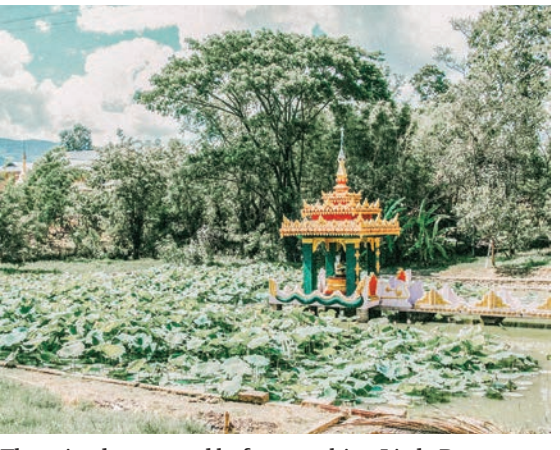
There is a lotus pond before reaching Little Bagan. Maha Nanda Kantha Monastery near the lotus pond is glorious.