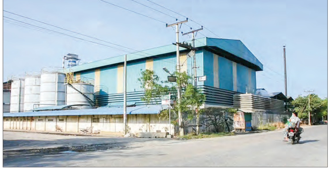
A factory in Mandalay is seen. Mandalay Region has reopened a total of 640 factories and workplaces on 5 May.

Those factories which returned to operations undertake food production, pharmaceutical