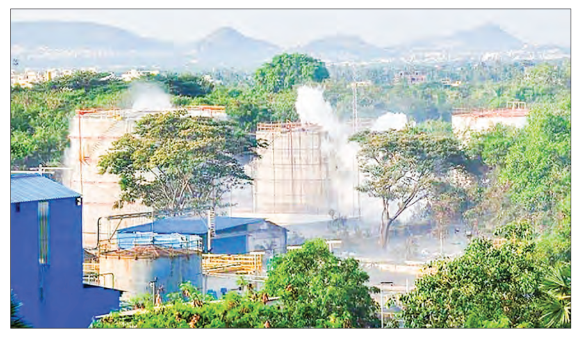
A gas leak at a chemical plant in eastern India left people lying unconcsious in the streets.

The plant, operated by LG Polymers, is a subsidiary of LG Chem, is on the outskirts of Visakhapatnam.