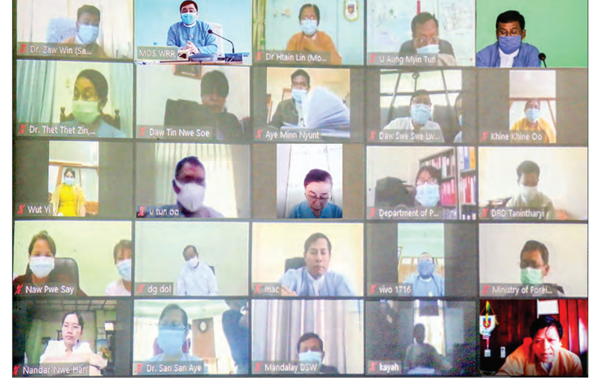
Myanmar National Committee on Women discusses activities on COVID-19 measures yesterday.

sons of women committees from Nay Pyi Taw Council, States and Regions, also discussed their ongoing activities for addressing violence against women and quarantine programmes for preg-