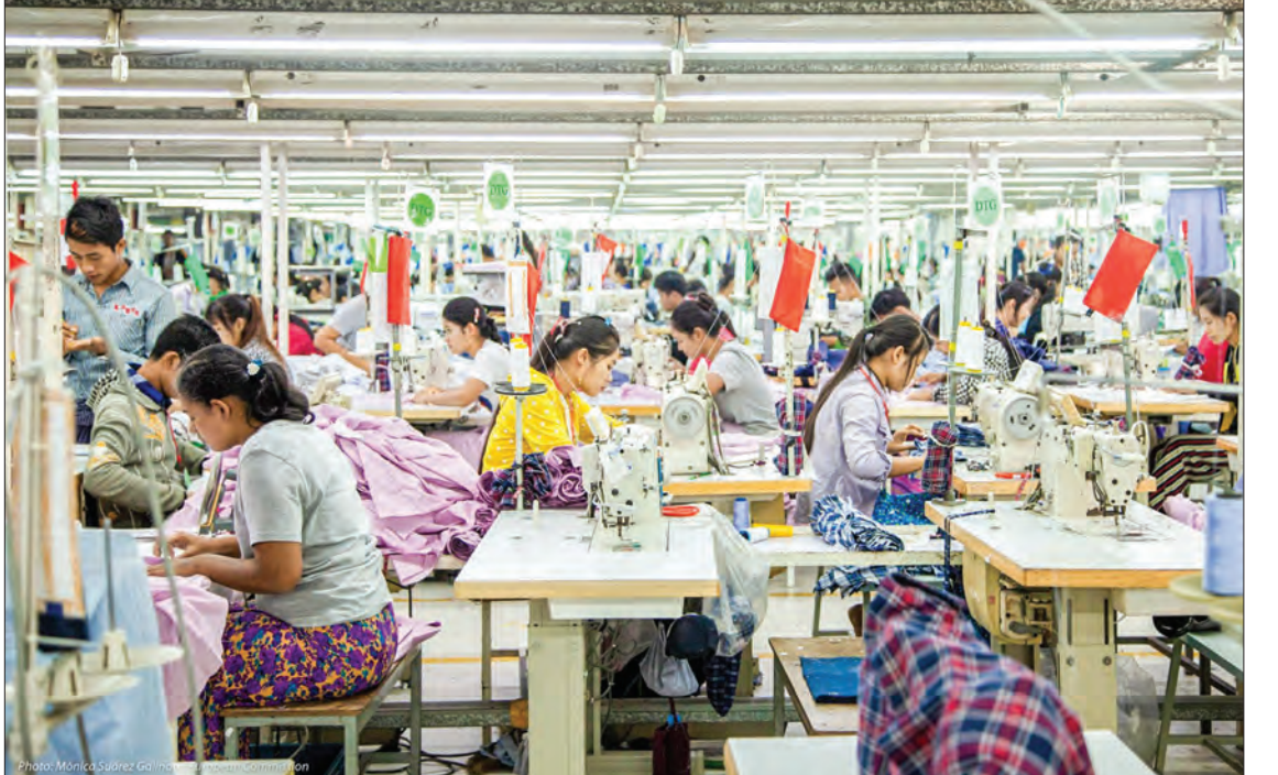
EU "Myan Ku" Emergency Cash Fund is underway for garment workers.

And fifth, while this crisis has disproportionally hit the poor and the vulnerable, it has also exposed our interdependence and that no society is stronger than its weakest link. We need societies with safety nets, not as an emergency measure, but as a permanent feature, and we need it for the international community. On 9 May, the EU marks Europe Day and the 70<sup>th</sup> anniversary of the Schuman Declaration. In 1950, former French Foreign Minister Robert Schuman in a powerful speech laid out his vision of a peaceful, prosperous Europe that is built on such unity and solidarity. In the face of the coronavirus crisis, his words ring truer than ever: We are stronger together.