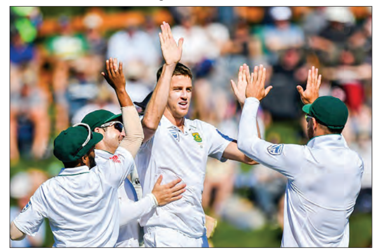
Wickets are commonly celebrated with high-fives in cricket.

NEW DELHI (India)—Namaste and clapping could replace handshakes and high-fives when cricket resumes after the coronavirus pandemic, India's Ajinkya Rahane said.