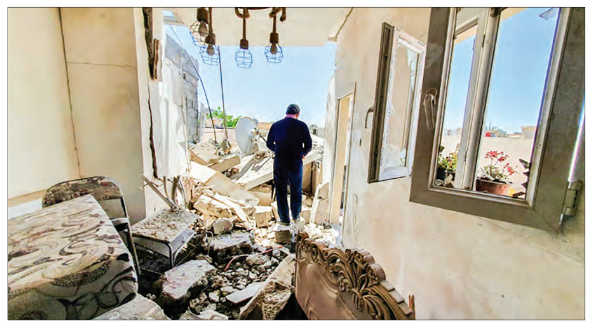
A man walks through the rubble of a building that was damaged when strongman Khalifa Haftar's forces shelled the neighborhood in the Libyan capital Tripoli on 1 May, 2020 – Hafter has been receiving help from Russian mercenaries, a UN report says.

UNITED NATIONS (United States)—Mercenaries from the Wagner Group, a Russian paramilitary organization seen as being close to Vladimir Putin, are fighting in Libya, UN diplomats said Wednesday, citing an experts' report on the country's