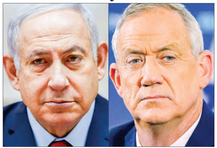
Bills passing into law a controversial coalition deal between Israel's ersthwile political rivals Prime Minister Benjamin Netanyahu and ex-military chief Benny Gantz are finally to be put to the vote in parliament.

Israel top court approves coalition deal, new govt to be sworn in 13 May