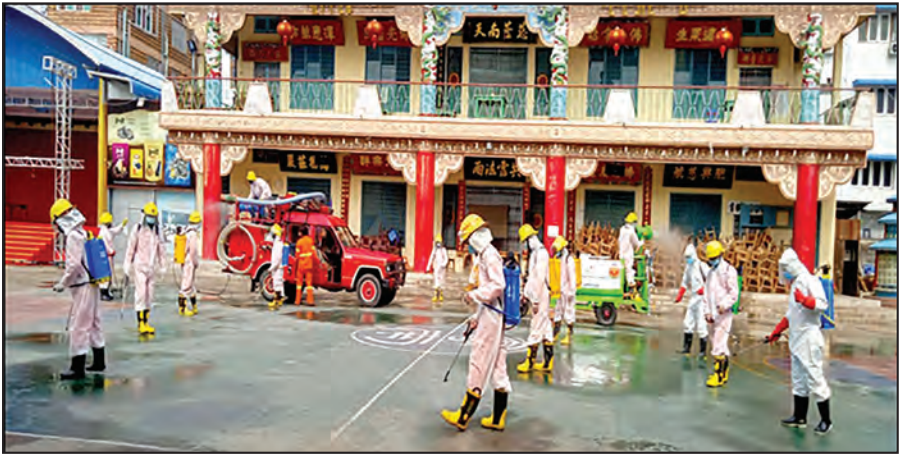
Spraying COVID-19 disinfectants at Yunnanese Buddhist Temple at Aung Nan East Ward in Chanayetharzan Township, Mandalay Region, on 30 April 2020.

Spraying COVID-19 disinfectants at Nay Pyi Taw Development Committee Guest House (1), on 30 April 2020.