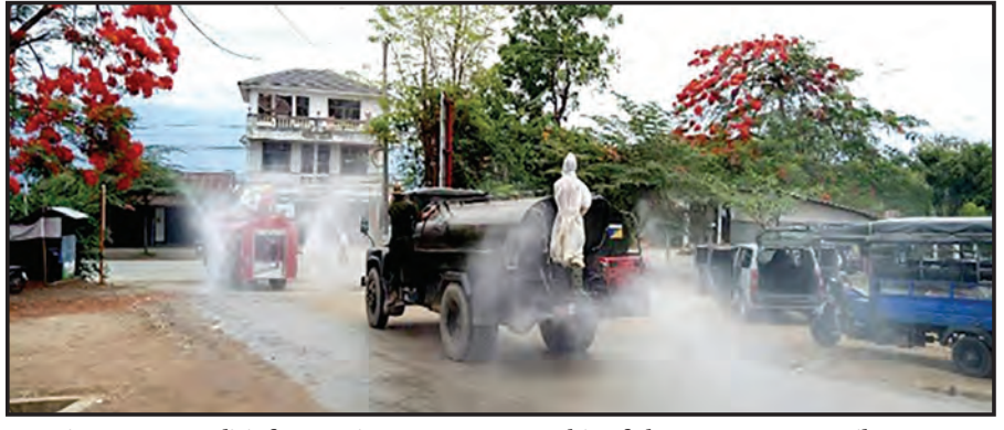
Spraying COVID-19 disinfectants in Kengtung Township of Shan State on 30 April 2020.

Spraying COVID-19 disinfectants at Nay Pyi Taw Development Committee Guest House (1), on 30 April 2020.