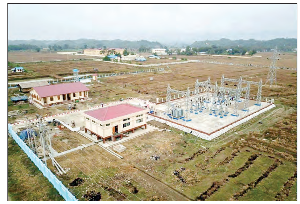
66/11 KV-5 MVA Sub-Power Station in Maungtaw.

In the cases where the confiscated lands could not be released and give back, the appropriate land compensation is being considered on (18) cases owned by (62) farmers. The land