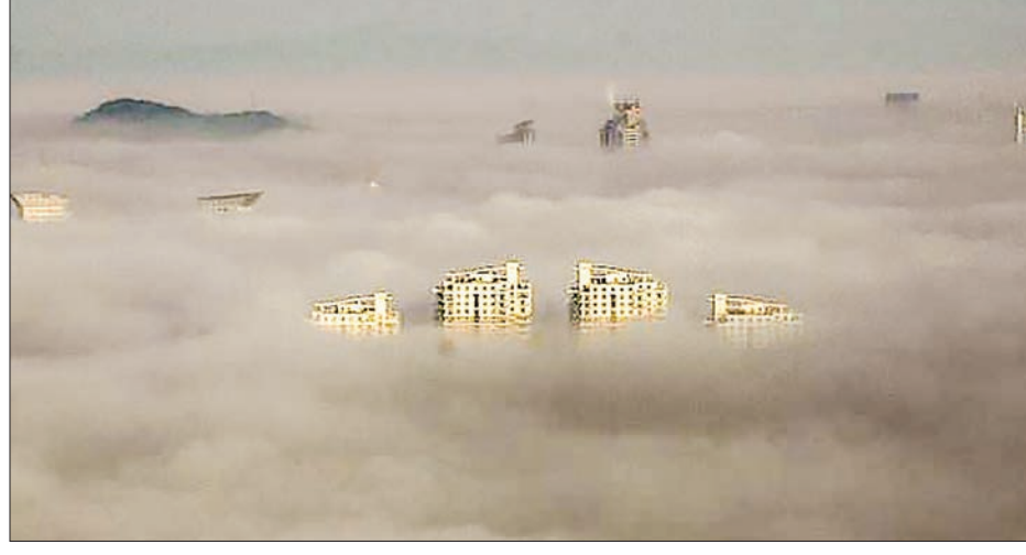
UN experts warn time is running out to stave off climate disaster.

"Things that scientists have been saying would happen further in the future are happening now,"