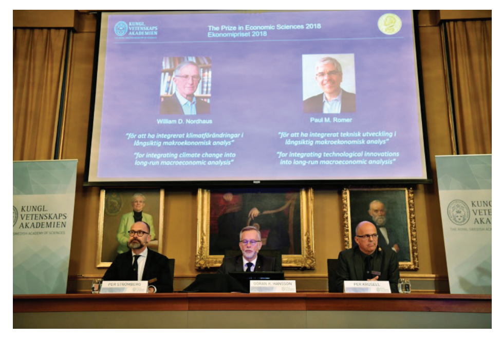
The Royal Swedish Academy of Sciences announced the winners of the Nobel Economics Prize in Stockholm.

STOCKHOLM — US economists William Nordhaus and Paul Romer on Monday shared the 2018 Nobel Economics Prize for constructing "green growth" models that show how innovation and climate policies can be integrated with economic growth.