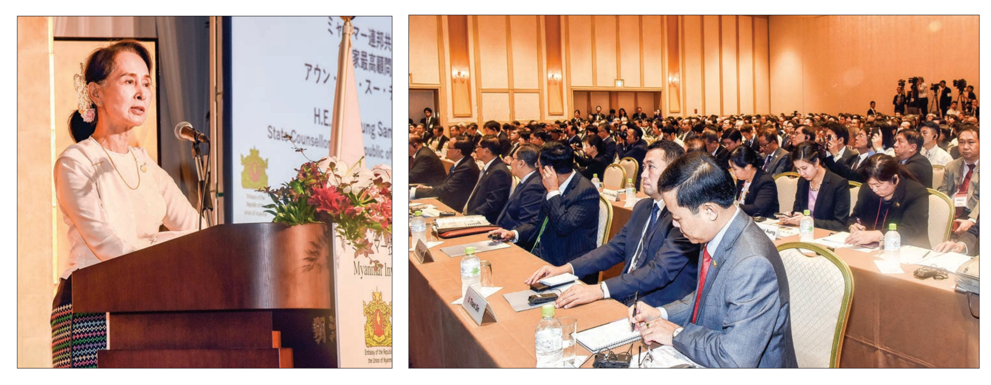
State Counsellor Daw Aung San Suu Kyi delivers the speech at the Myanmar Investment Conference in Tokyo, Japan yesterday.

State Counsellor attends Myanmar Silk Promotion Event, Myanmar Investment Conference