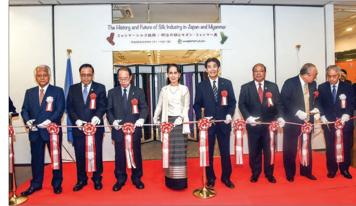
State Counsellor Daw Aung San Suu Kyi cuts the ceremonial ribbon alongside Japanese high-level officials to open the Myanmar Silk Promotion Event at the ASEAN-Japan Centre in Japan.

The State Counsellor said that since the incumbent government took office in 2016, it has been fully committed not just to the pursuit of economic development, but also to striking the right balance between development and stability-both economically and politically – and one cannot survive without the other. Striking the right balance is never easy. In Myanmar, we have boldly decided against taking a populist approach to macroeconomics and chosen to favour the less glamorous but still fundamentally important work required to reform and strengthen the management of our economy, increase resilience to shocks, and to stabilize macroeconomic foundations, such