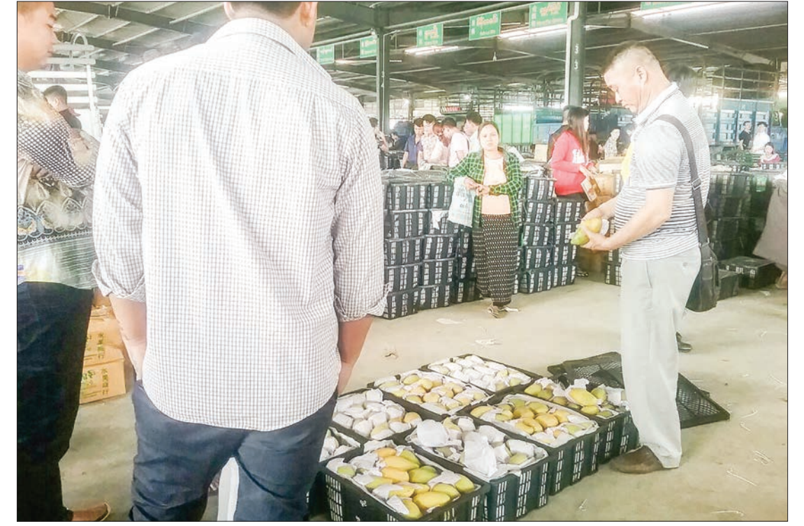
Merchants check the Myanmar's mangoes and fruits at Muse 105 mile check-point.

cased at China-ASEAN Expo held in Nanning city. They also offered to buy dried Kayen chilli. Nevertheless, Myanmar cannot seek China's AQSIQ registration. Therefore, MFVP called for government to government discussion for this between the two countries. Additionally, he also requested to set respective zone areas for each vegetable to produce quality vegetables and fulfill the market's demand. —Minthit / Ko Htet ■