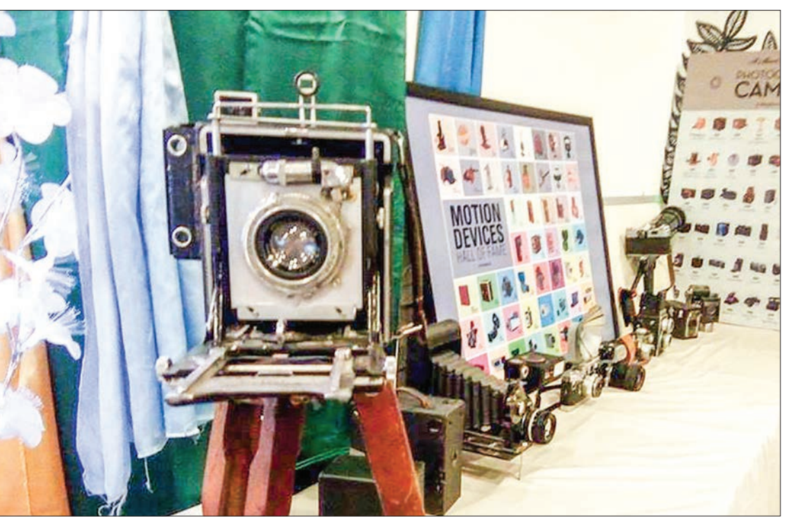
First antique cameras exhibition to be held in Yangon from 19 to 21 October.

"Actually I would like to show the cameras I collected in a small museum but there is difficulty to find even a small place in Yangon. It wouldn't be easy. That is why I'm holding this exhibition