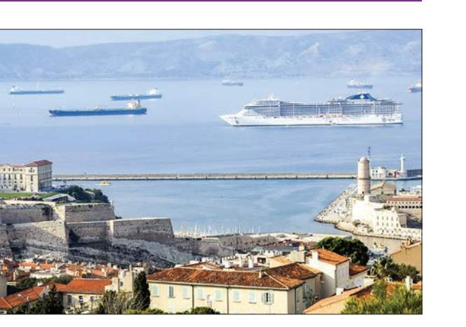
The southern French city of Marseille has been wrestling with growing air pollution as it seeks more of the lucrative cruise tourism business.

Consignees of cargo carried on M.V MAIESTIC