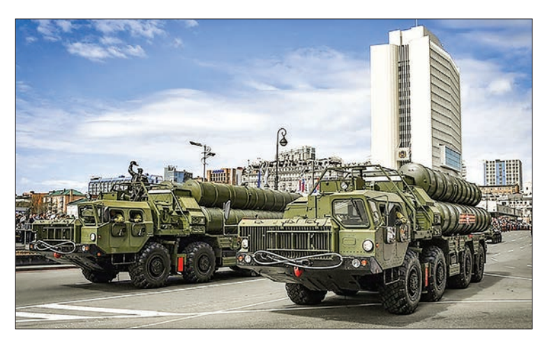
A contract for supplying S-400 air defence missile systems to India was signed on 5 October.

The Countering America's Adversaries Through Sanctions Act (CAATSA) was signed by US President Donald Trump in August 2017. The Act toughens sanctions on Russia, Iran and North Korea. It also provides for US sanctions against third countries cooperating with Russia's defence and intelligence sectors. New Delhi hopes Washington will make an exception for it, because it does not want to lose the Indian defence market. —Tass