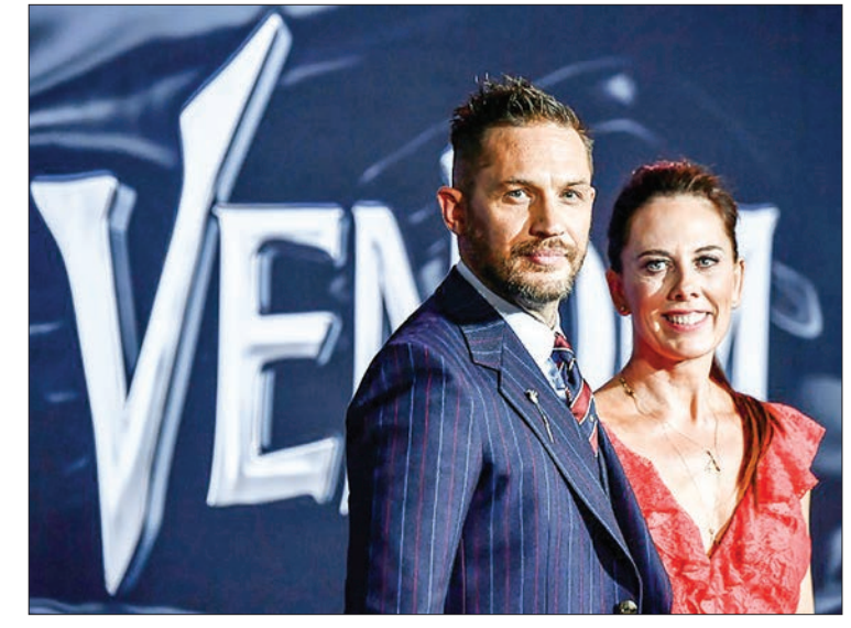
"Venom," which stars Tom Hardy (L) was met harshly by critics, but had a record opening weekend.

Third place went to Warner Bros.'s "Smallfoot," with earnings of $14.9 million in its second weekend. The comic family animation