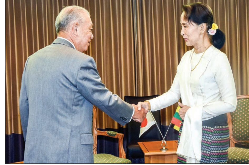
State Counsellor Daw Aung San Suu Kyi holds talks with New Komeito Party leader Mr. Yamaguchi Natsuo in Tokyo, Japan.