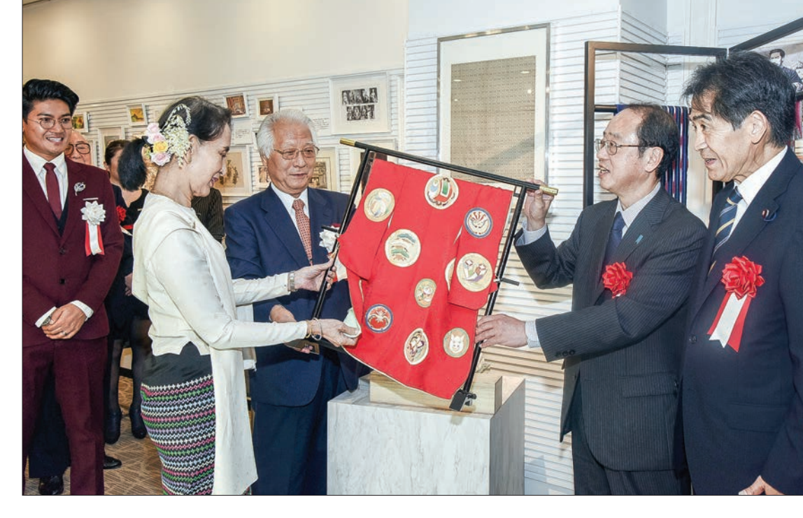
State Counsellor Daw Aung San Suu Kyi observes a piece of silk cloth woven with Japanese designs at the Myanmar Silk Promotion Event at the ASEAN-Japan Centre in Japan yesterday.

The fifth goal - natural resources management and environmental protection-highlights our commitment to play our part to protect our planet through sustainable environmental and natural resources management, she said. The State Counsellor said MSDP Goal 3 demonstrates our commitment to creating a favorable investment and business environment. In line with this commitment, the Myanmar Investment Commission, under its new Chair Union Minister U Thaung Tun, is now reviewing all processes not only within the MIC itself but also within other government agencies, with a view to establishing simple, clear and predictable Standard Operating Procedures (SOPs).