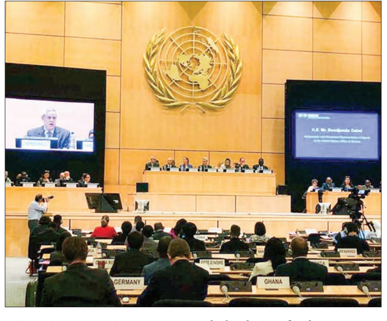
Union Minister Dr. Win Myat Aye attends the closing of 69th session of UNHCR's Executive Committee in Geneva, Switzerland, yesterday.

Union Minister Dr. Win Myat Aye also met with Mr. Antonio Vitorino, Director-General of the International Office for Migration-(IOM) on 4 October in Geneva and expressed thanks for IOM's assistance for disaster reducing efforts and damage and loss assessment during and after disasters. ■