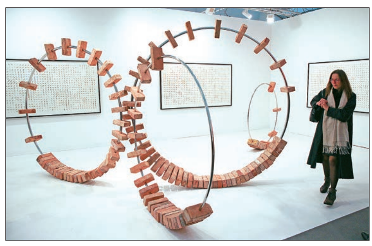
A visitor poses in front of an art installation by Polish artist AlicjaKwade, entitled "TrialTurn, 2017" during a photocall for the Frieze Art Fair in London on 4 October, 2017.

The event at Regent's Park in London comprises the main Frieze, which focuses on contemporary works, Frieze Masters, which showcases more traditional art, and Frieze Sculpture – with over 1,000 artists on display