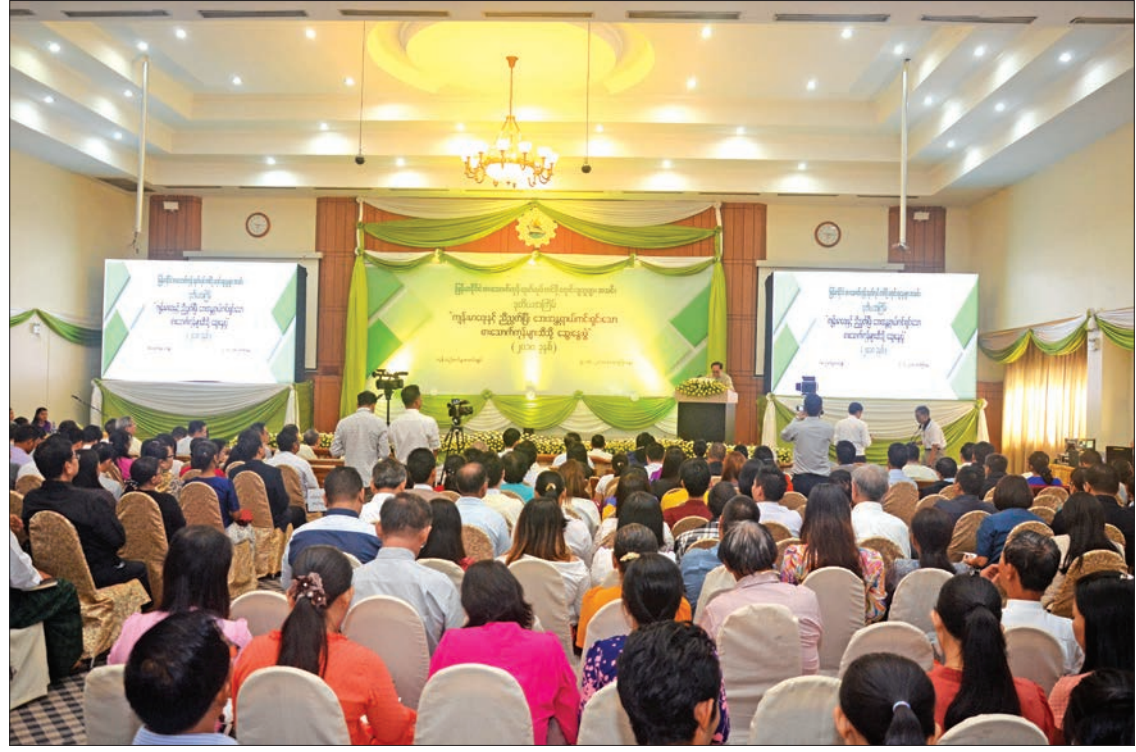
Union Minister Dr. Myint Htwe speaking at the "Moving Forward in Food Safety" discussions in Yangon yesterday.

The ministry alone cannot implement this. Concerted efforts need to be exerted by all stakeholders in food industry, including consumer associa-