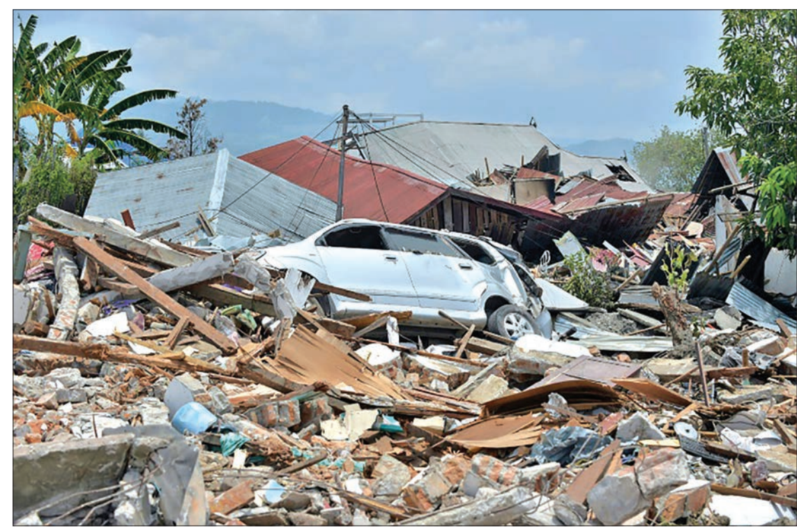
Palu was left grossly unprepared for the catastrophe, which has so far claimed more than 1,400 lives with hundreds more injured and missing.

"This is an earthquake that is not the standard mechanism to