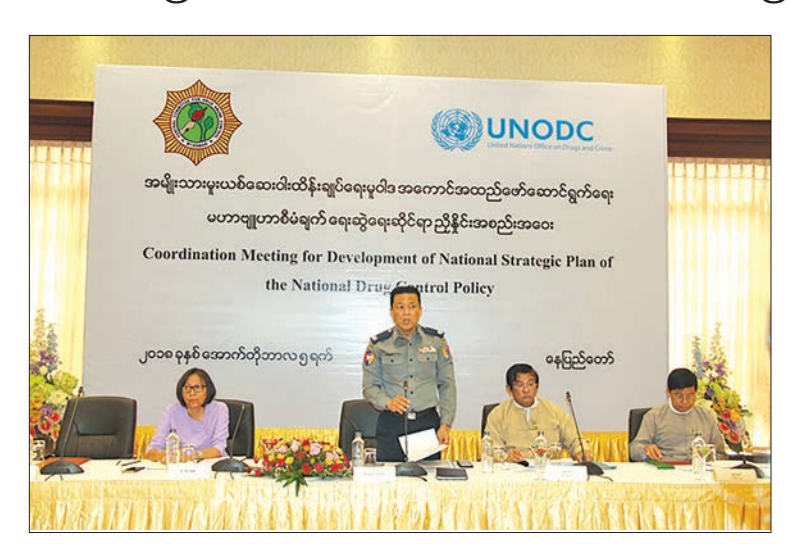
Police Brigadier General Win Naing delivers the speech at the coordination meeting for Development of National Strategic Plan of the National Drug Control Policy in Nay Pyi Taw.

A COORDINATION meeting for Development of National Strategic Plan of the National Drug Control Policy was held at Shwe San Eain Hotel, Nay Pyi Taw, yesterday morning. Police