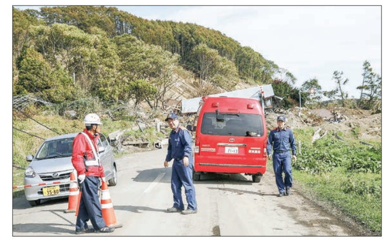
Officials from fire authorities patrol in Atsuma, Hokkaido, after a strong earthquake hit the region on 5 October 2018. PHOTO: KYODO NEWS

Although the quake temporarily suspended the operation of a shinkansen bullet train and local trains, New Chitose Airport was unaffected, according to Hokkaido Railway Co. and the transport ministry. — Kyodo News