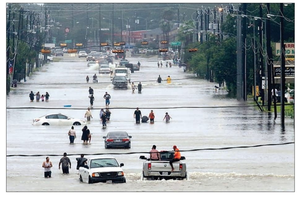
People walk through the flooded waters of Telephone Rd in Houston in August 2017 during tropical storm Harvey.

Thursday's paper picked out Jakarta, Bangkok, Lagos, Manila, Dhaka, Shanghai, Houston and London — home to a com-