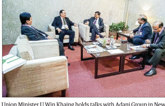
Union Minister U Win Khaing holds talks with Adani Group in New Delhi, India yesterday.

The government formed the Independent Commission of Enquiry to address reconciliation, peace, stability and development in Rakhine State. --MNA \blacksquare