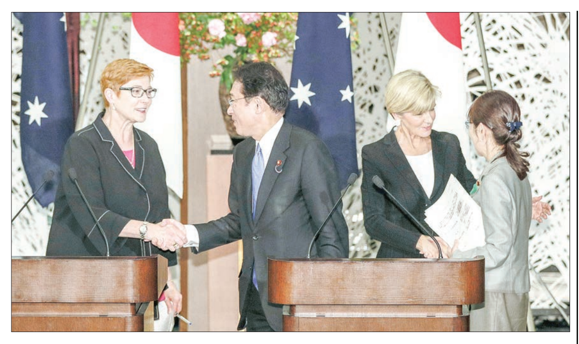
Australian Defence Minister Marise Payne (far l) and Foreign Minister Julie Bishop (2<sup>nd</sup> from R) shake hands with their Japanese counterparts, Foreign Minister Fumio Kishida (2<sup>nd</sup> from l) and Defence Minister Tomomi Inada, after a press conference as the two countries held "two-plus-two" talks in Tokyo on 20 April, 2017.

WORLD 6 OCTOBER 2018 THE GLOBAL NEW LIGHT OF MYANMAR