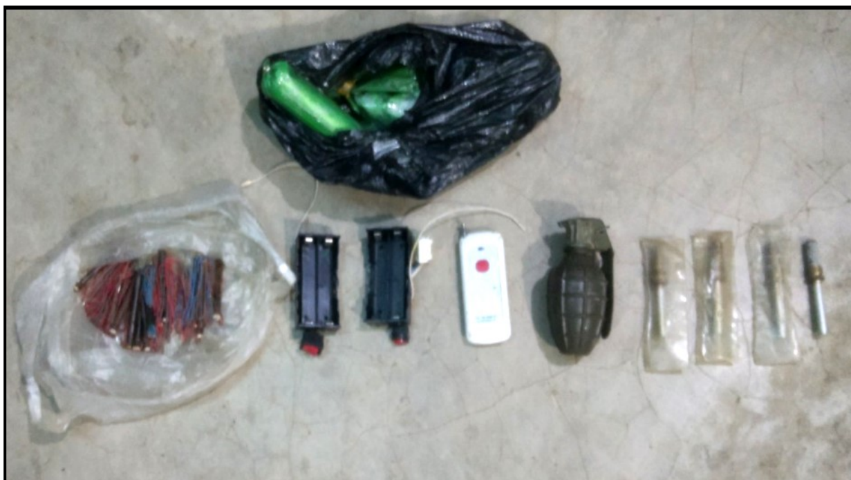
An explosive related materials seized in the compound of fugitive Than Tun (aka) Chindwin's house in Zeephyupin Village of Pyinmana Township