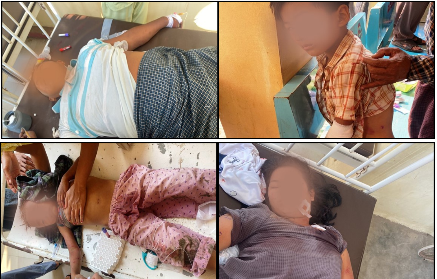
Innocent civilians killed and injured in a homemade mine explosion planted by the PDF terrorists