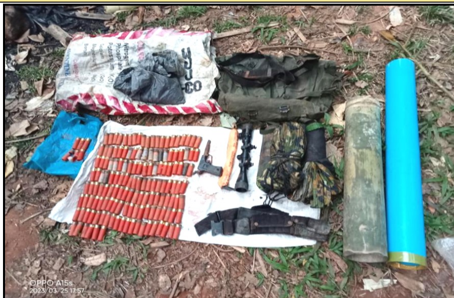
Weapons and explosive related materials seized near Mayantaung (upper) Village of Pyinmana Township

On 24 March, acting on the information tip-offed by conscientious people, security force members arrested two offenders, members of a terrorist group so-called Naypyitaw PDF: Sein Lwin (aka) Maung Sein (aka) Khayay and Win Myo Htet (aka) Win Noe (aka) Belar who were plotting to fire improvised 107mm rocket targeting the crowded places where innocent civilians are gathering for funfairs and the parade ground (Shan Su area) where the Armed Forces Day parade ceremony was held in Nay Pyi Taw Council Territory. The offenders were arrested along with a 107mm rocket in Zeephyupin village of Pyinmana township.