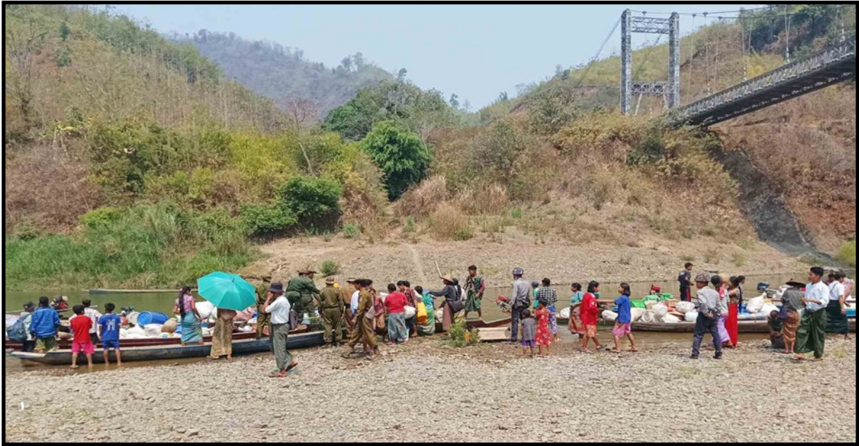
Local military personnel from Western Command, Myanmar Police Force members and departmental staff helping the IDPs to transport their belongings to motorboats

In Chin state, a total of 1,504 internally displaced people (IDPs) from 363 households sheltering in a displacement camp near Samee town's GAD office, Pyankya camp, Myopaingkone camp, and at their relatives' houses in Samee town of Chin state's Paletwa township are returning to the villages of their natives in Paletwa township on their own consent on 28 March. In this regard, Chin state government and the Tatmadaw reportedly made