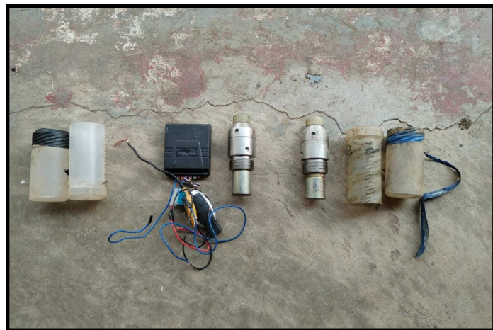
An explosive related materials seized inside the bushes near Awai Yar Dam in Zeephyupin Village of Pyinmana Township