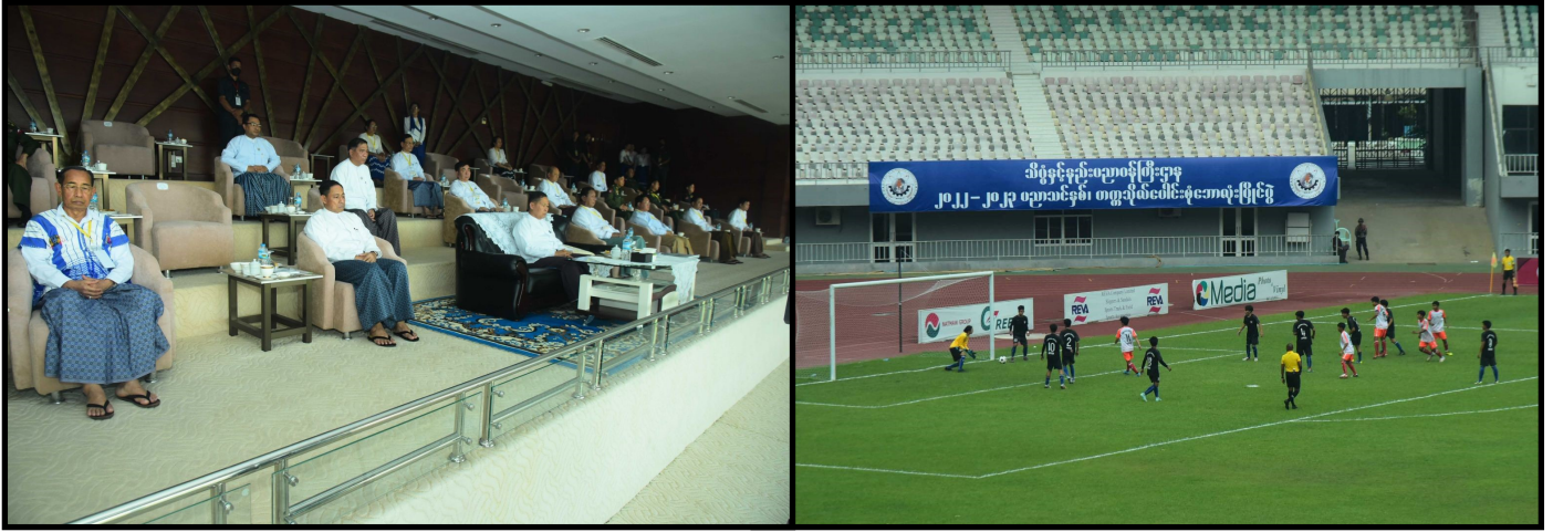
SAC Vice-Chairman Deputy Prime Minister Vice-Senior General Soe Win watching the opening match of the Inter-Technology and Computer University Football Tournament for the 2022-23 academic year