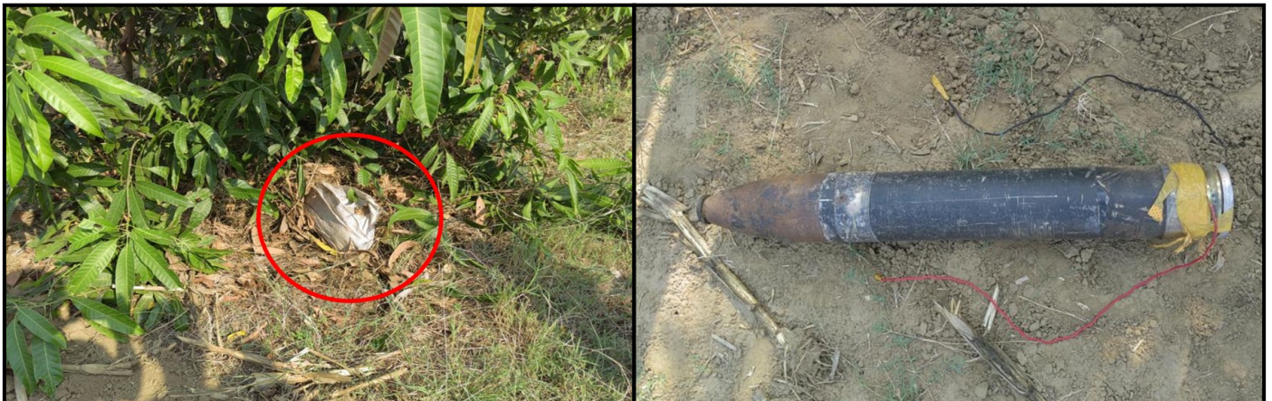
A 107mm rocket seized along with offender Sein Lwin (aka) Maung Sein (aka) Khayay