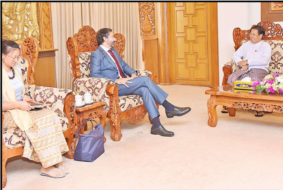
Union Minister U Than Swe receiving International Federation of Red Cross and Red Crescent Societies (IFRC) Regional Director for Asia Pacific