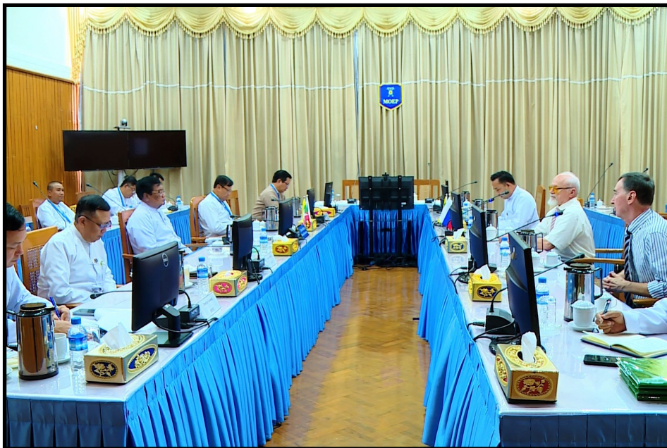
Union Minister U Thaung Han receiving a delegation headed by Senior Vice-President of the Russia-Myanmar Association of Friendship and Cooperation