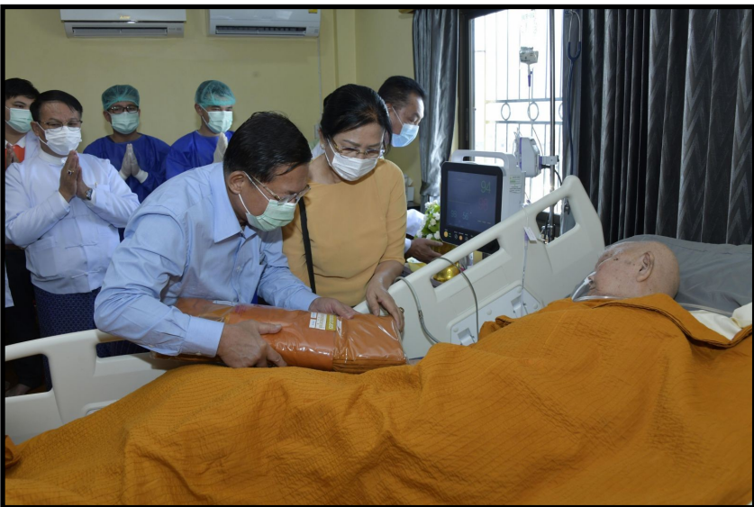
SAC Chairman Prime Minister Min Aung Hlaing and wife offering medicines, nutritious foods and cash for nine prerequisites to Presiding Patron of Naga Hnakaung Monastery