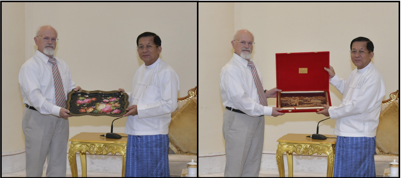
SAC Chairman Prime Minister and Vice-President of Russia-Myanmar Association of Friendship and Cooperation exchanging commemorative gifts