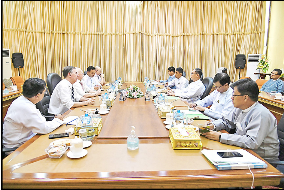
Union Minister U Khin Maung Yi receiving a delegation headed by Senior Vice-President of the Russia-Myanmar Association of Friendship and Cooperation