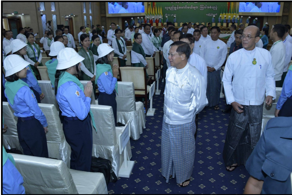
SAC Chairman Prime Minister Senior General Min Aung Hlaing cordially greeting the outstanding students