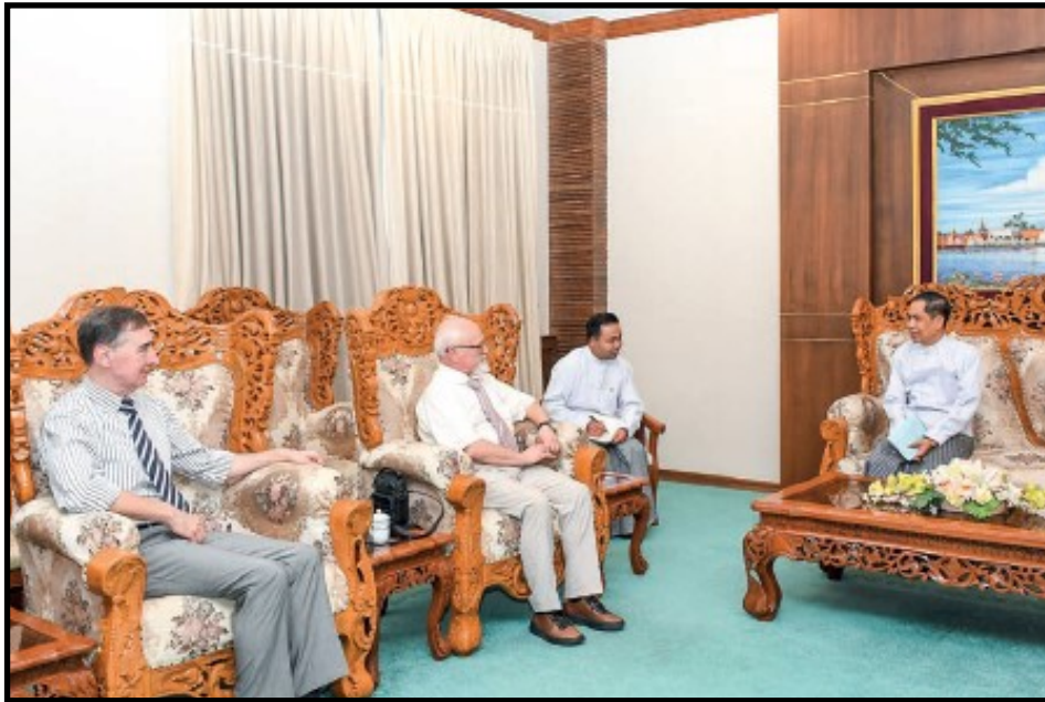
Union Minister U Ko Ko Hlaing receiving a delegation headed by Senior Vice-President of the Russia-Myanmar Association of Friendship and Cooperation