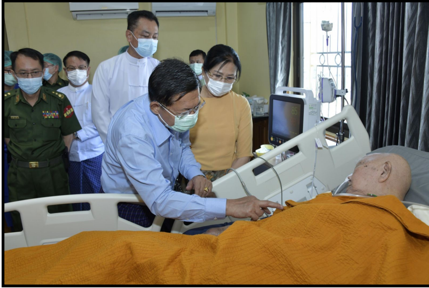
SAC Chairman Prime Minister Min Aung Hlaing and wife asking about health conditions of Presiding Patron of Naga Hnakaung Monastery