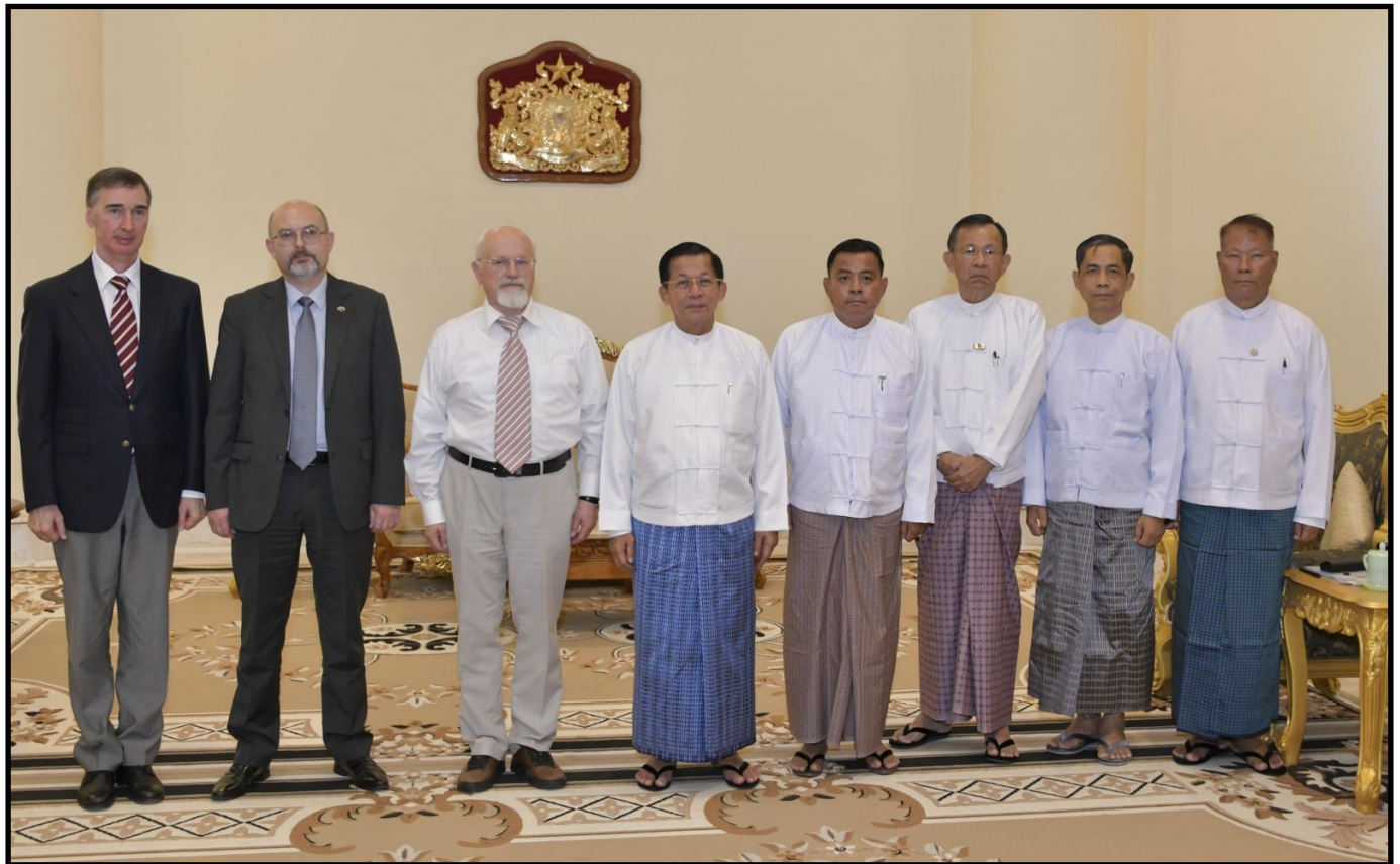
SAC Chairman Prime Minister Senior General Min Aung Hlaing and a delegation led by Vice-President of Russia-Myanmar Association of Friendship and Cooperation taking a commemorative photo