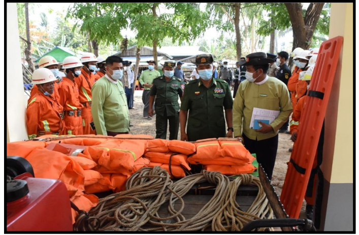
South-West Command Commander inspecting the rescue tasks and preparations for natural disasters