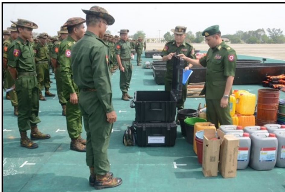
The Commander of Nay Pyi Taw Command inspecting natural disasters prevention rehearsal by the military personnel

The low-pressure area over the Southeast Bay of Bengal and the adjoining South Andaman Sea persists. It is likely to intensify into a Cyclonic Storm and is likely to move towards Myanmar. Therefore, precautionary measures are being taken in momentum in regions and states for disaster relief and emergency care.