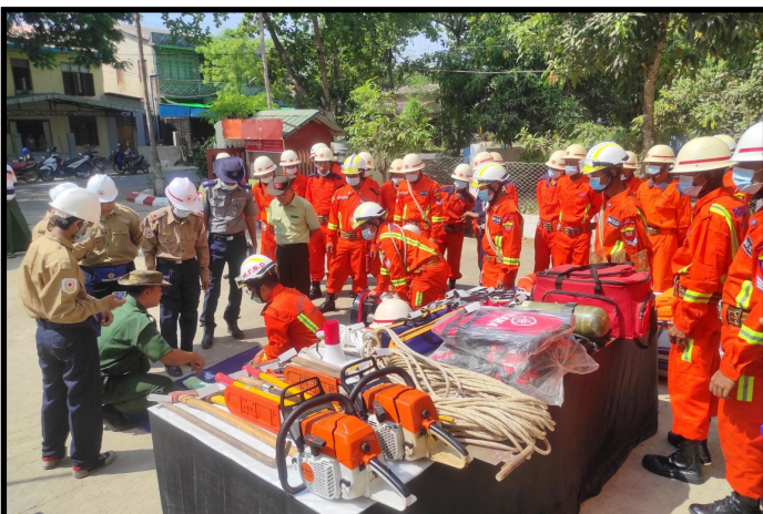
Rescue task force at Zalun Fire Service Department in stand-by