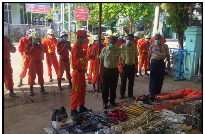
Preparedness for natural disasters in Nyaungdon Township