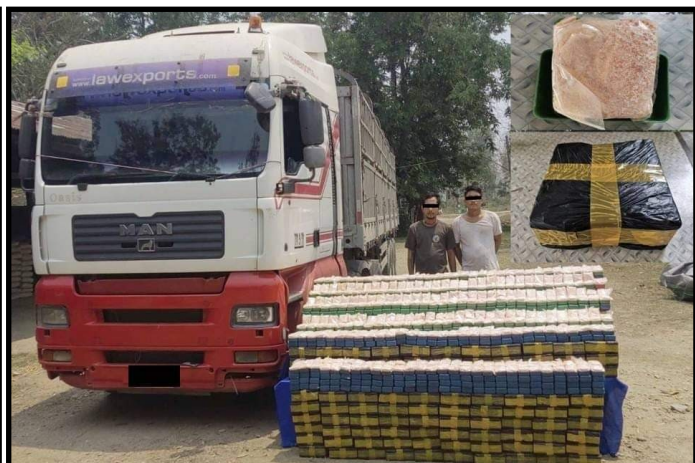
Seizures of over K690 million worth heroine along with offender in Mohnyin Township