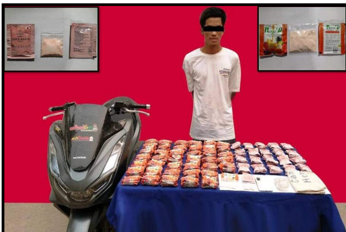
Seizures of K900 million worth psychotropic drugs along with offender in Tachileik Township