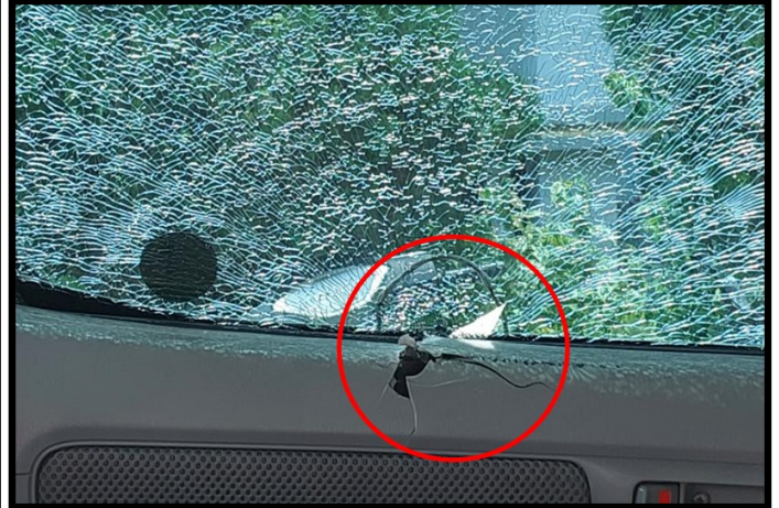
The vehicle carrying representatives of AHA Centre, Indonesia, Singapore Embassies in the attacks of terrorists

On 7 May, the representatives of the AHA Centre, Indonesia and Singapore Embassies to Myanmar, to provide humanitarian assistance went to Hsihseng by cars to deliver supplies to temporarily displaced persons in Yayphyu Village of Hsihseng Township in Shan State (South). When the convoy arrived about 200 metres north of Nanaw village of Hsihseng, the terrorists opened fire to them. As the security forces shot back at the terrorists, they fled in disorder. During the incidents, no casualties were reported but some bullets hit the car carrying security personnel.