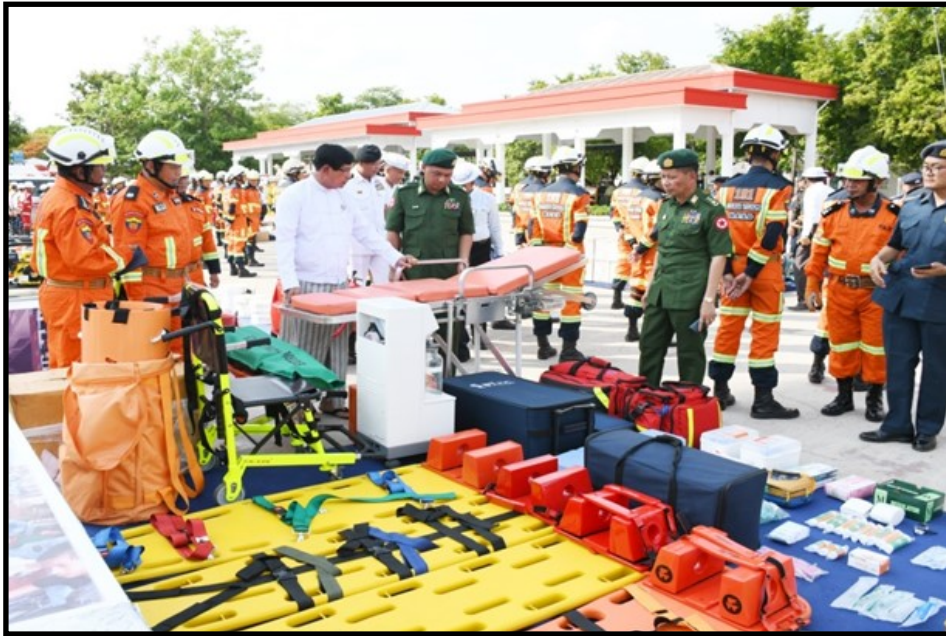
Yangon Region Chief Minister and Yangon Command Commander inspecting the preparation for natural disasters at the Myanmar Fire Service Department Headquarters

tation of flight clearance and landing permits of the flights, tariff exemptions, entry visas, and loading and unloading matters among others.