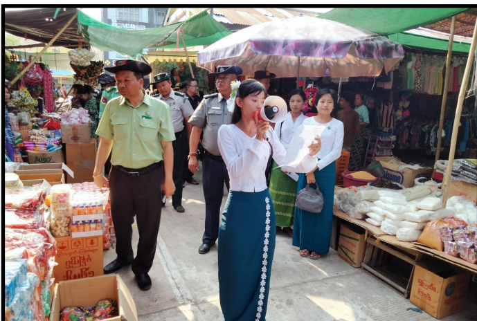
Possible cyclonic storm awareness campaign in Natmauk Township