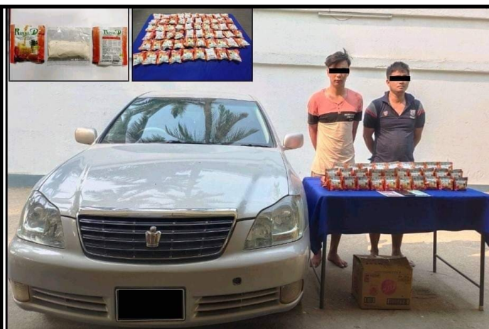
Seizures of K1.1 billion worth psychotropic drugs along with offenders in Tachileik Township