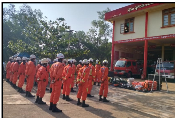
Preparedness for natural disasters in Launglon Township