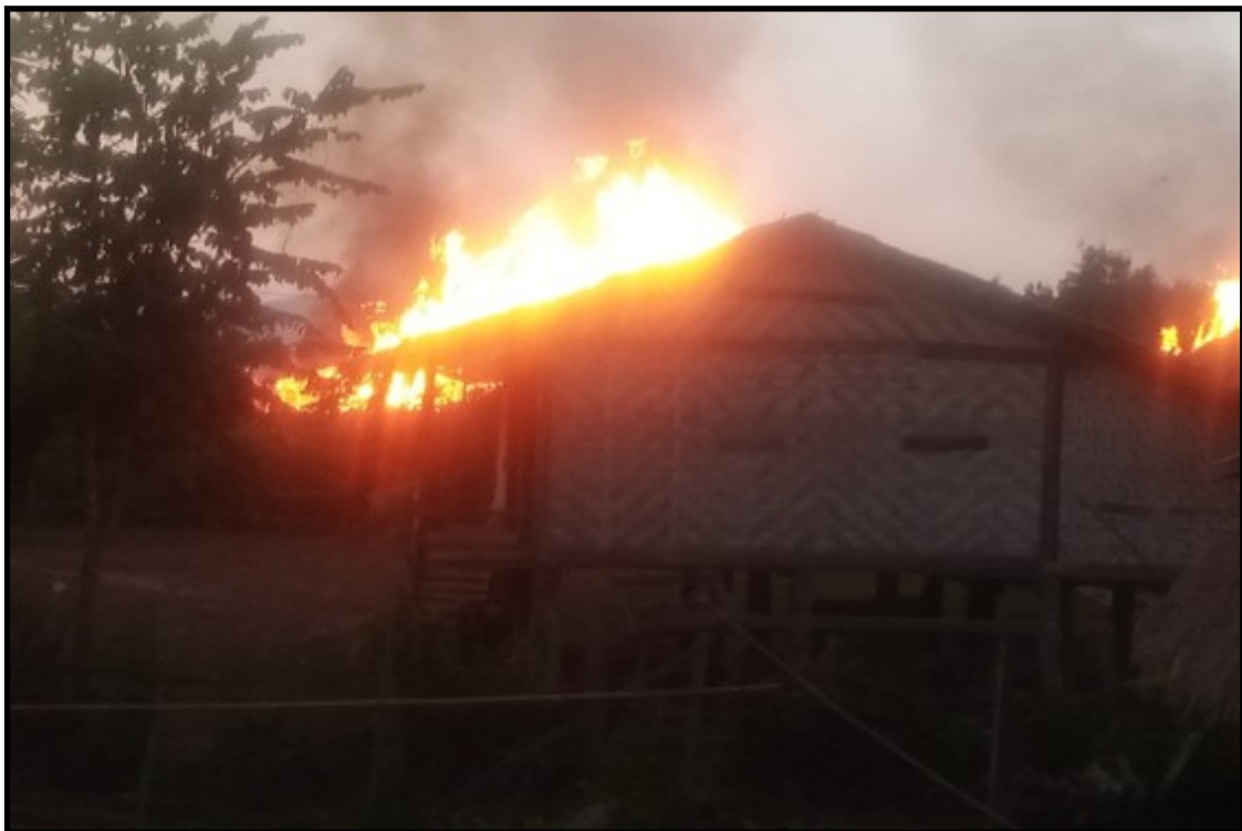
The residential houses in Tharyarkone Village on fire in the heavy weapons attacks of the KIA members who support terrorism and so-called PDFs