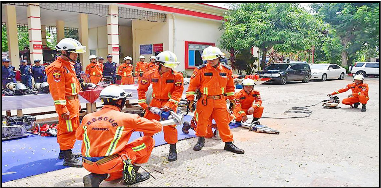
The rescue tasks and preparations for natural disasters ongoing in Nay Pyi Taw Council Area