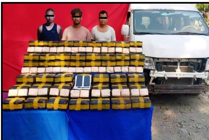
Seizures of K1.1 billion worth heroine drugs along with offenders in Kale Township