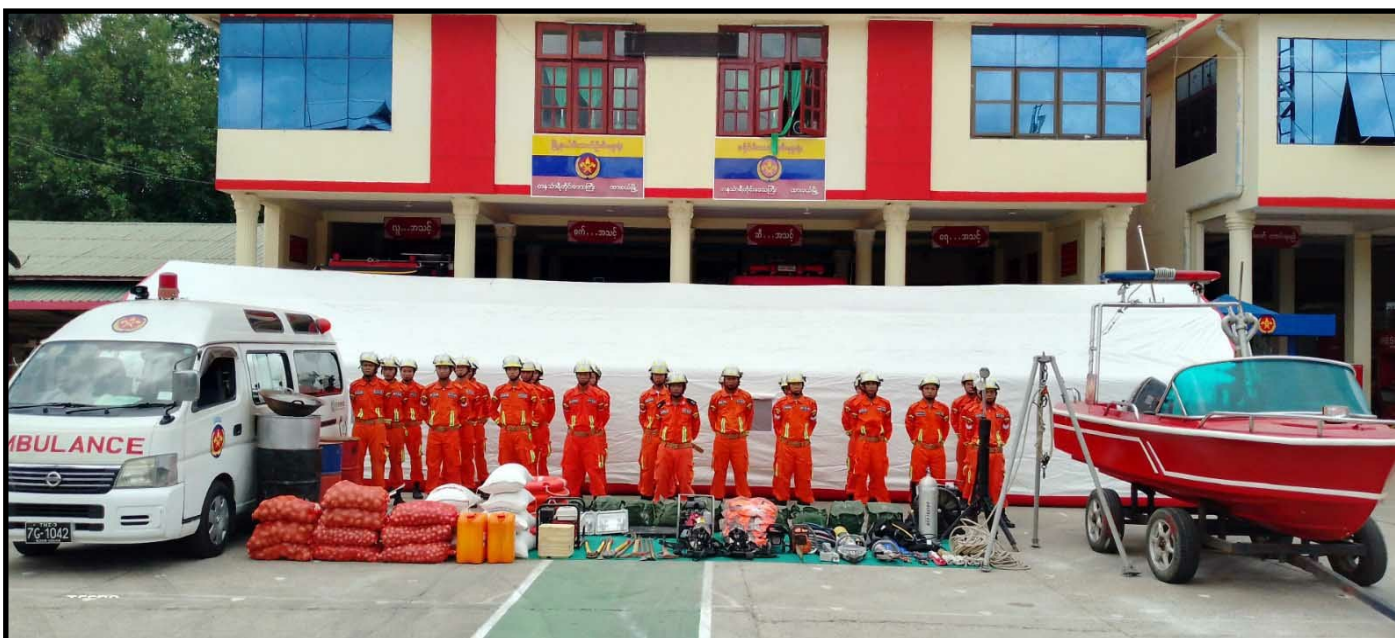
Preparedness for natural disasters in Dawei Township