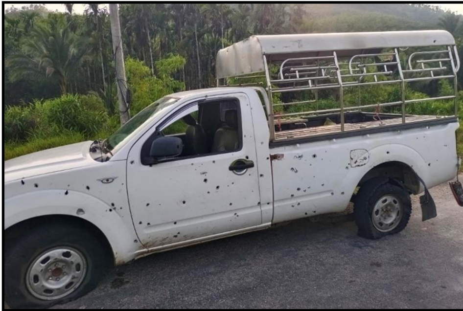
The vehicle damaged in the IED attacks of the so-called PDFs

mistakenly shoot civilians. Local civilians clearly know that such activities are carried out by NUG/PDF terrorists, and therefore, they are disgusted by their acts of terrorism.