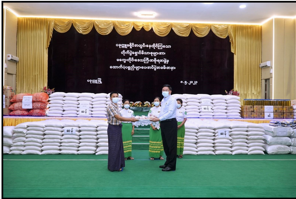
Supplies provided to the displaced persons in Pakhokku District

The state/region governments are holding the events of providing foodstuffs, cash assistance and school supplies for students to temporarily displaced persons in their respective regions and states as follows –