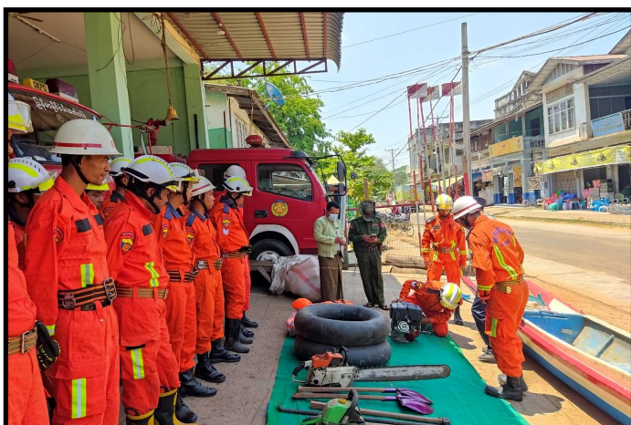
Preparedness and rehearsals of the disaster rescue teams in Oakpho Township