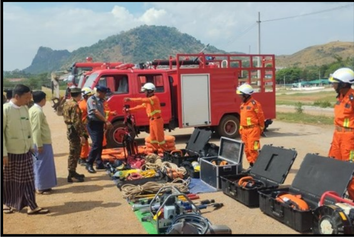
Eastern Command Commander inspecting the rehabilitation activities