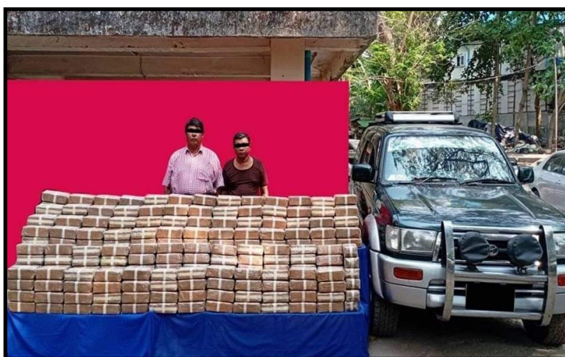
Seizures of K3.2 billion worth stimulant tablets along with offenders in Hline and Mayangone Townships