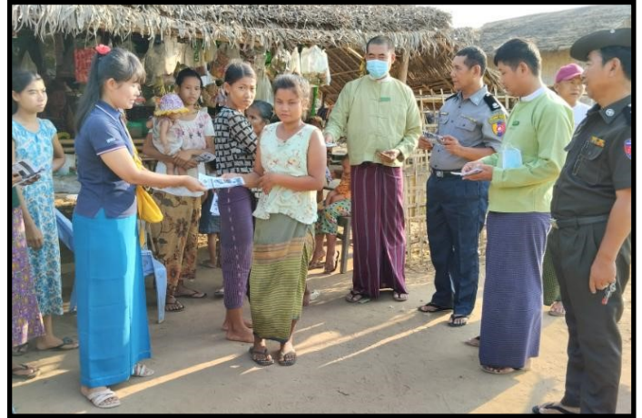
Possible cyclonic storm awareness campaign in Gwa Township