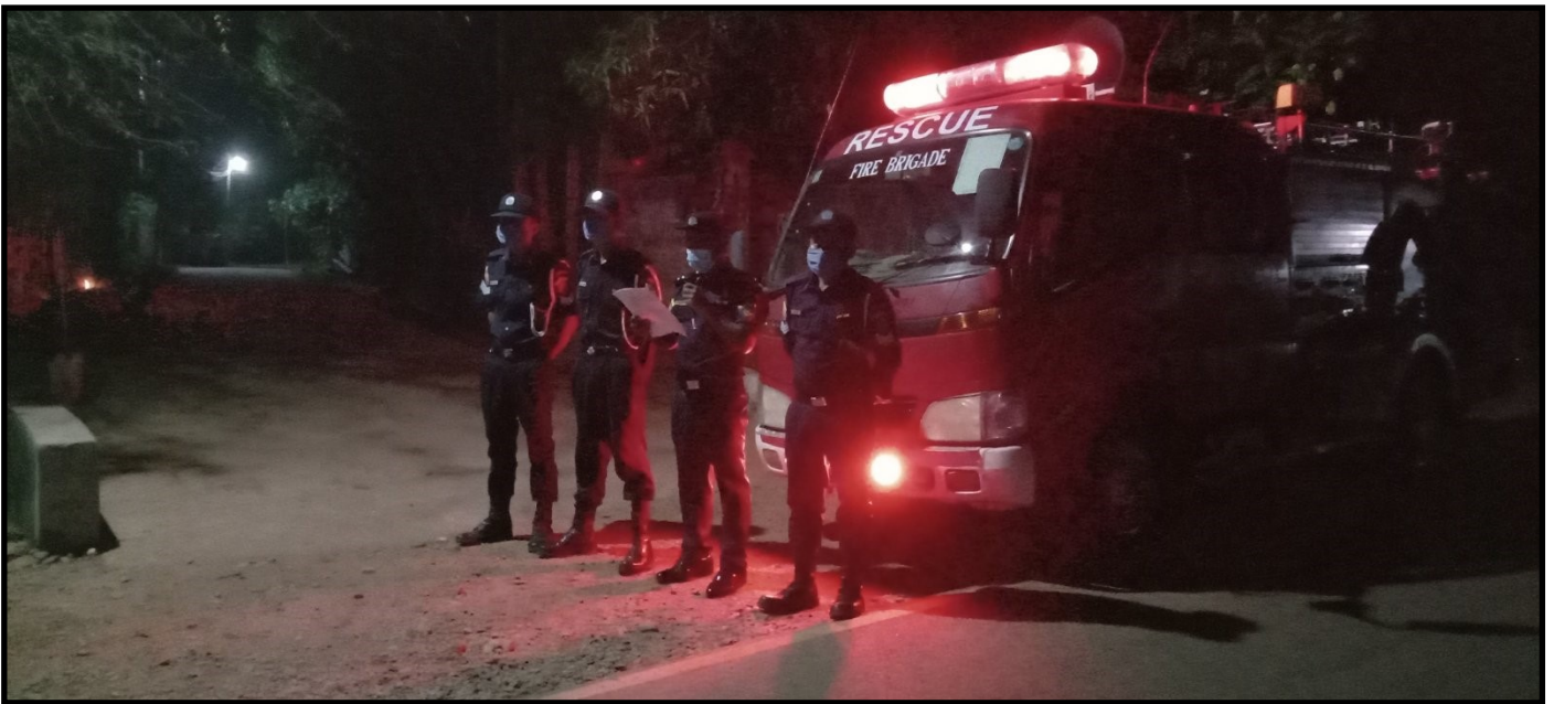
Possible cyclonic storm awareness campaign in Thayetchaung Township