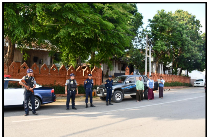
Possible cyclonic storm awareness campaign in Kengtung Township