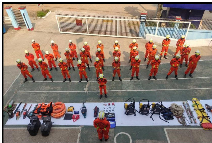
Natural disasters prevention rehearsal in Pyinmana Town