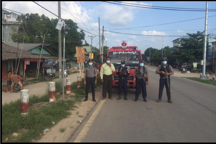
Possible cyclonic storm awareness campaign in Palauk Township