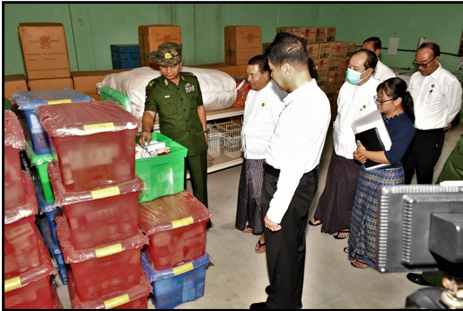
Mandalay Region Chief Minister and Central Command Commander inspecting the store of medicine and medical supplies

ness and rehearsals of the disaster rescue teams and the store of medicine and medical supplies as well as food and drinking water.