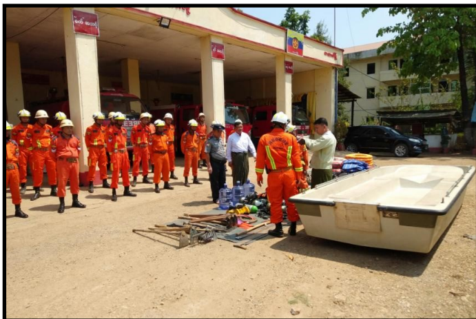
Preparedness and rehearsals of the disaster rescue teams in Thayawady Town