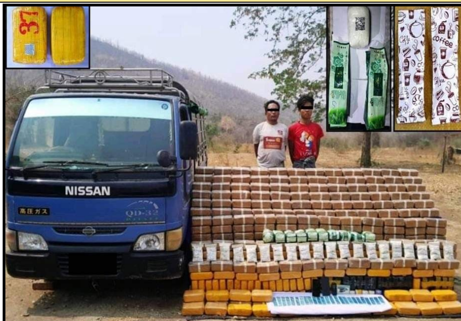
Seizures of over K10 billion worth narcotic and psychotropic drugs along with offenders

Members of anti-narcotic task force from Ministry of Home Affairs joining hands together with security personnel are putting stress on anti-narcotic measures, and the seizures of narcotic drugs in April 2023 were as follows: