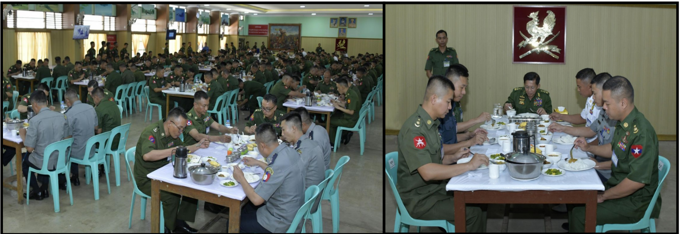
SAC Chairman Commander-in-Chief of Defence Services having lunch together with senior officer instructors and senior officer trainees