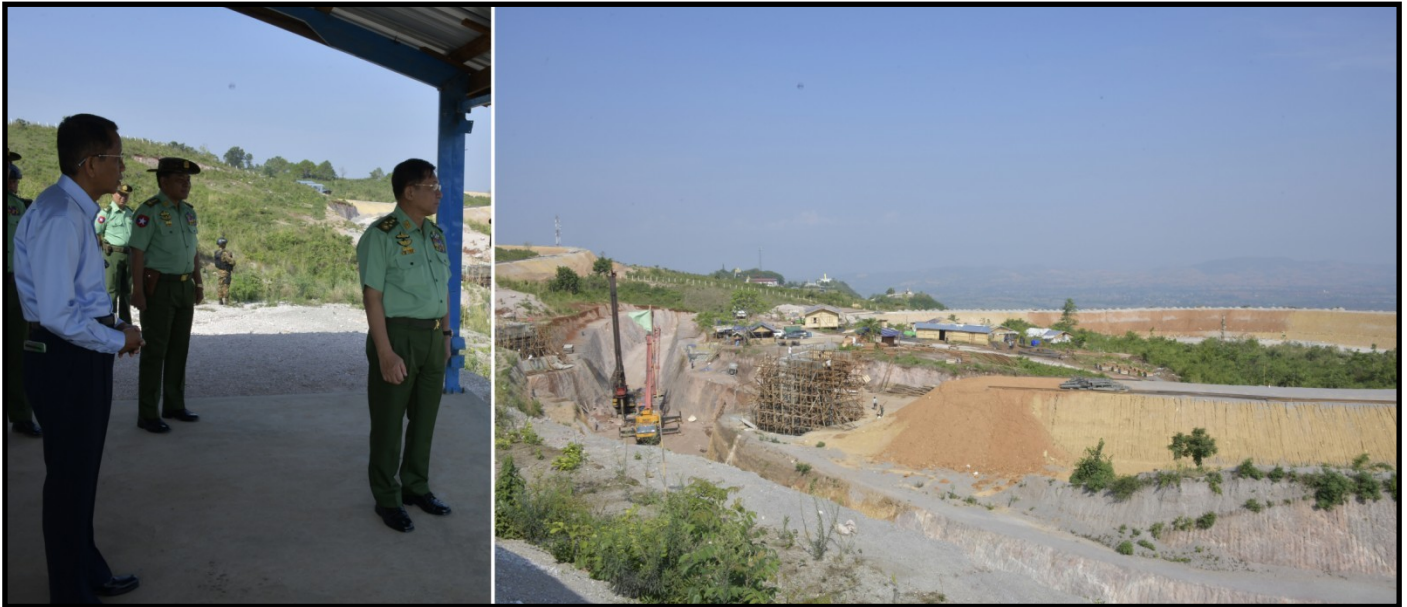
SAC Chairman Prime Minister interestingly viewing round the railway circular site near Htithein railway station

way circular site near Htithein railway station, and presented cash awards to the project employees.