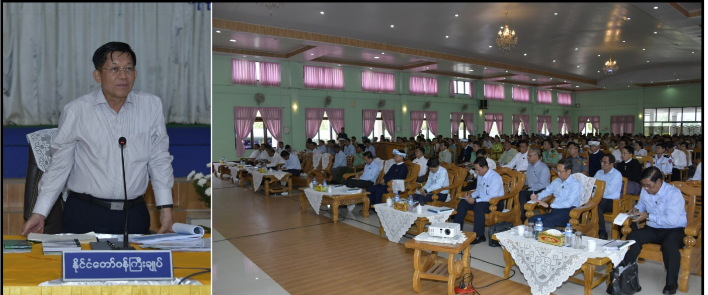
SAC Chairman Prime Minister holding discussions with the MSMEs businesspersons from Pa-O Self-Administered Zone

The Chairman of the State Administration Council (SAC) Prime Minister Senior General Min Aung Hlaing met the businesspersons of micro, small and medium-sized enterprises (MSMEs) from Pa-O Self-Administered Zone at the hall of Pa-O Self-Administered Zone Office in Hopong on 29 May, and MSMEs businesspersons from Danu Self-Administered Zone at the hall of Danu Self-Administered Zone Office in Pindaya on 30 May, to discuss about regional and economic development measures respectively.