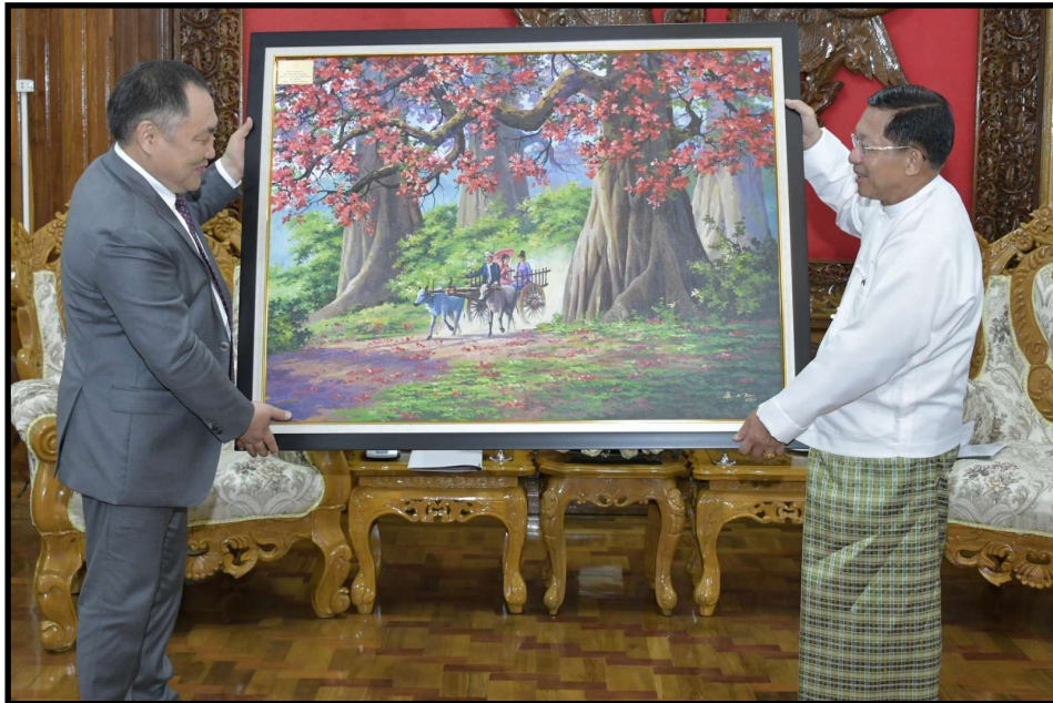
SAC Chairman Prime Minister presenting commemorative gifts to the Deputy Chairman of the State Duma, Federal Assembly of the Russian Federation