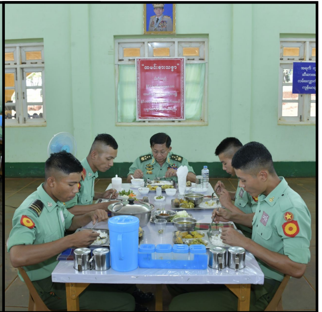
SAC Chairman Commander-in-Chief of Defence Services having lunch together with the trainees