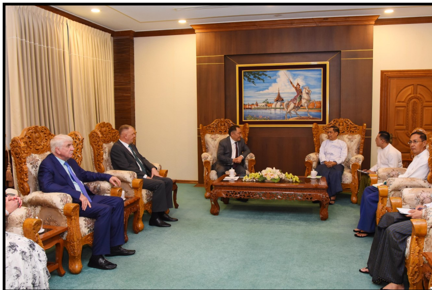
Union Minister U Ko Ko Hlaing receiving Russian State Duma delegation led by Mr. Sholban Kara-Ool, Deputy Chairman of the State Duma, Federal Assembly of the Russian Federation

sectors, and enhancement of cooperation through regional and international organizations.