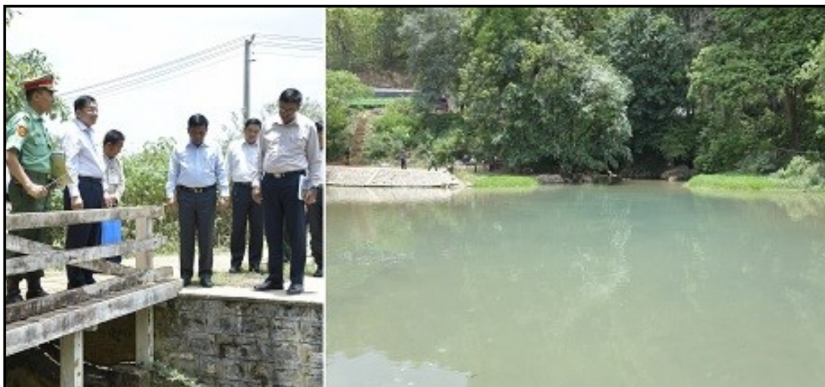
SAC Chairman Prime Minister inspecting the conservation of the spring at Hopong Yayhtwetgyi in Hopong