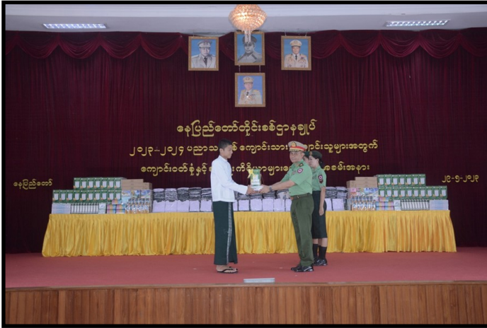
Nay Pyi Taw Council Territory