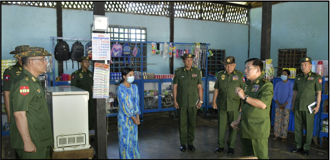
SAC Chairman Commander-in-Chief of Defence Services inspecting the sale of foodstuffs and consumer goods at fair prices at the shop of the headquarters of local battalions in Kalaw station