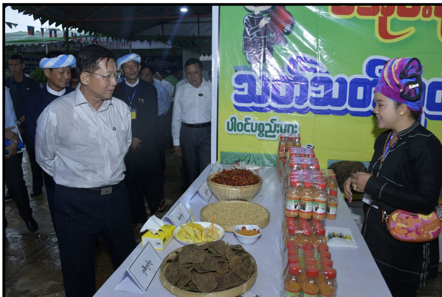
SAC Chairman Prime Minister interestingly viewing round the displays domestic products and foodstuffs