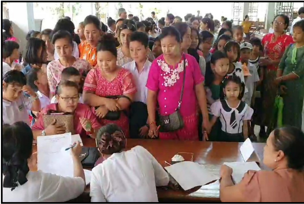
School enrolment underway in Taninthayi Region

to students, who are going to attend the schools for 2023-2024 academic year, at Aung Nyein Aye hall of Nay Pyi Taw Command, local military station hall of North-eastern Command, Mingala hall of Yangon Region Government office, Ayeyarwady hall of Southwestern Command and Aye Chan Phyto hall of Southern Command on