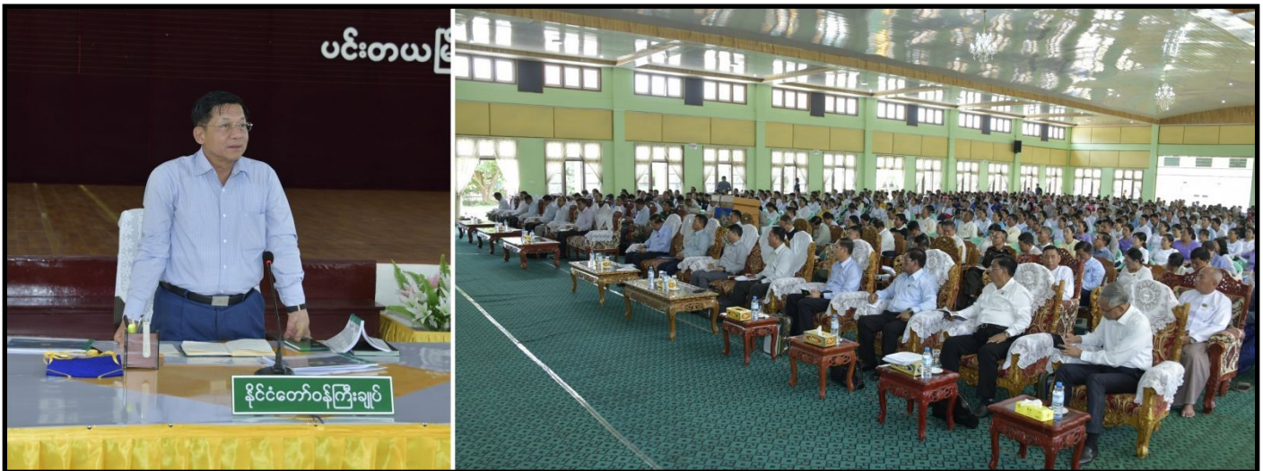
SAC Chairman Prime Minister holding discussions with the MSMEs businesspersons from Danu Self-Administered Zone