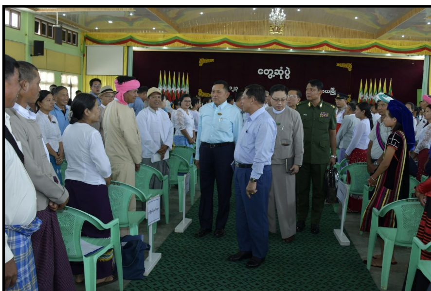
SAC Chairman Prime Minister cordially greeting the MSMEs businesspersons at the meetings