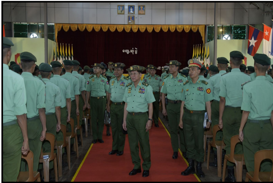
SAC Chairman Commander-in-Chief of Defence Services cordially greeting the trainees