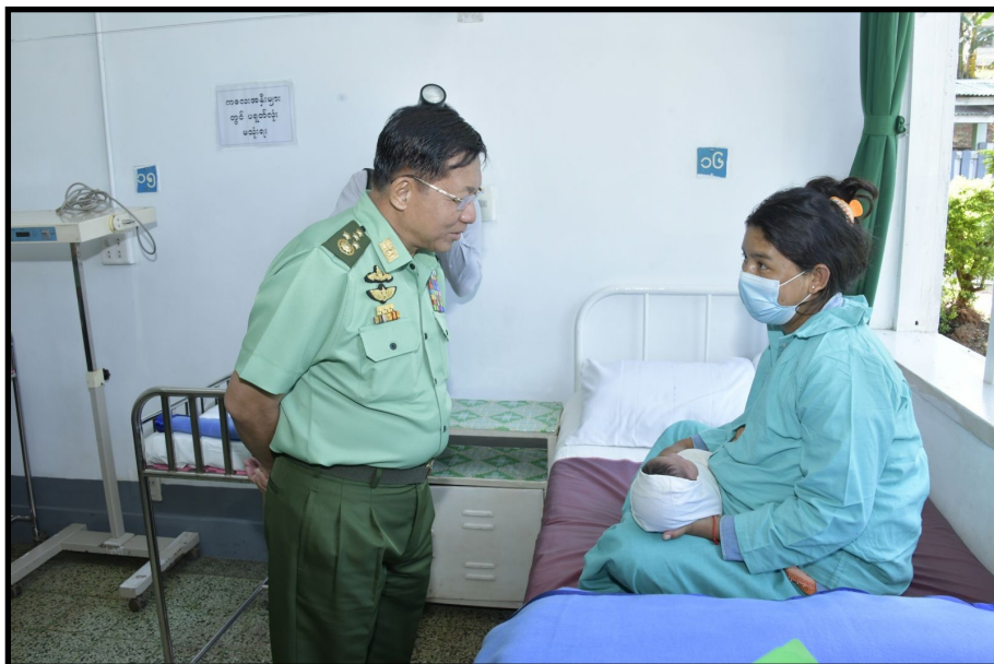
SAC Chairman Commander-in-Chief of Defence Services comforting officers, other ranks and family members receiving medical treatments at the local military hospital in Taunggyi