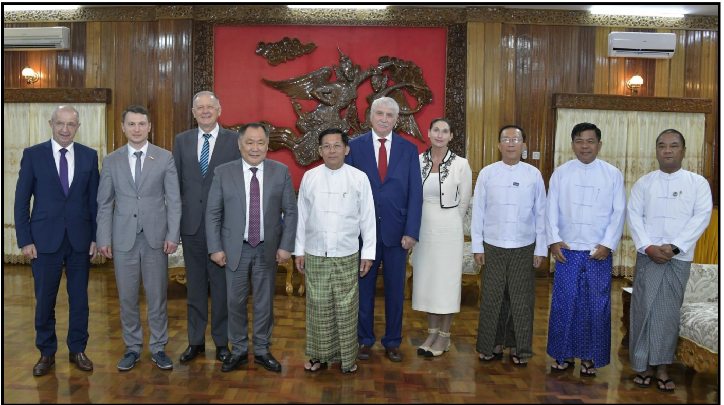
SAC Chairman Prime Minister taking a commemorative photo with a delegation led by Deputy Chairman of the State Duma, Federal Assembly of the Russian Federation