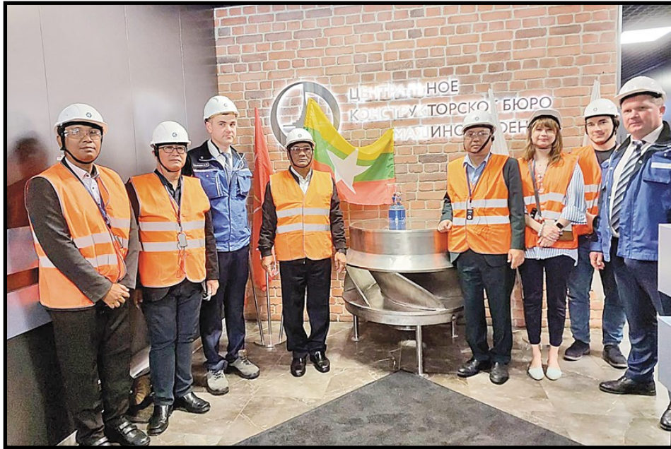
Myanmar delegation led by Union Minister U Thaung Han making tour to the JSC Atomenergomash (AEM-Technologies 'Izhora') workshop and Central Design Bureau of Mechanical Engineering workshop in St. Petersburg