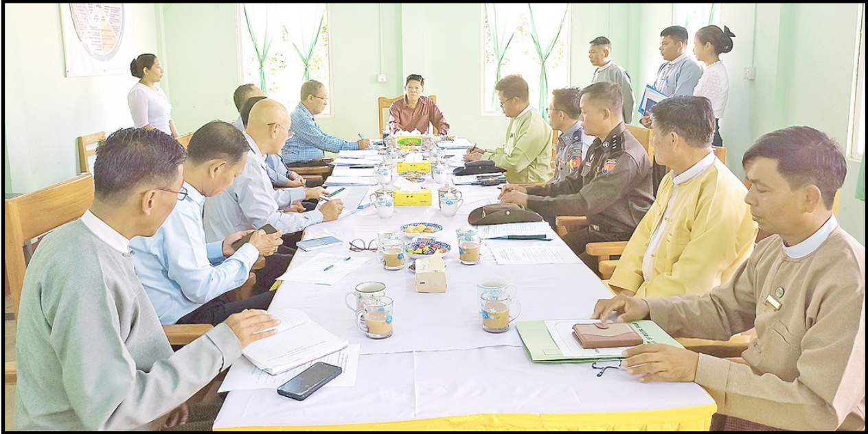
UEC Chair and party meeting the departmental officials and Sub-election Commission in Mongyal Township