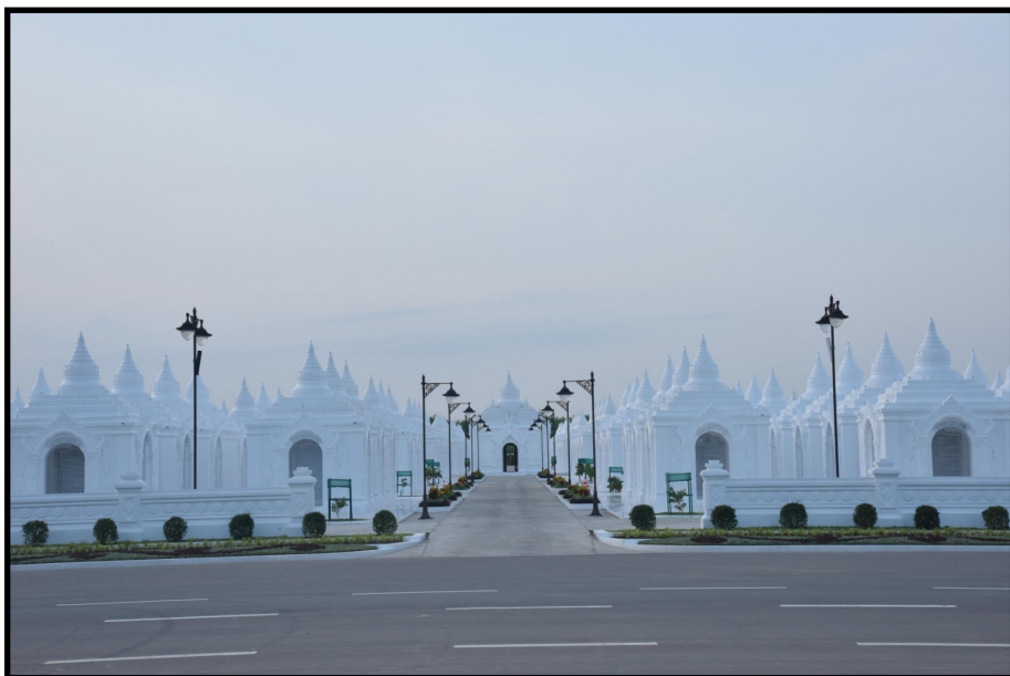
Completion of the stone inscription chambers