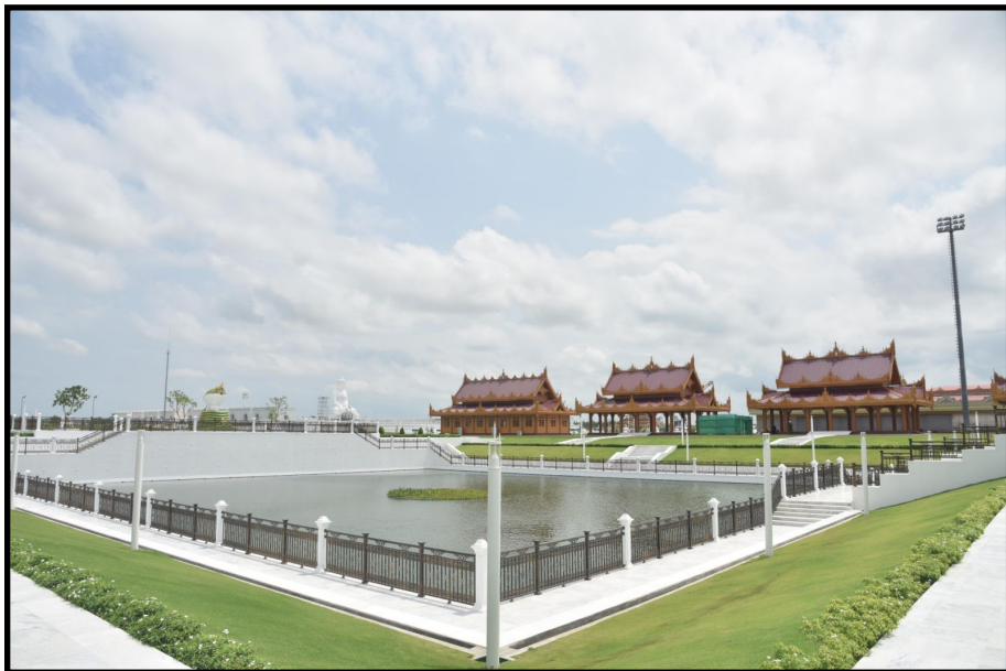
Completion of Mucalinda Lake and Thudhamma public rest houses in progress