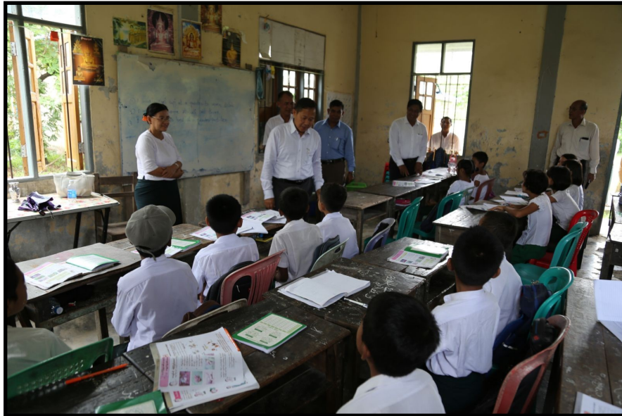
SAC Vice-Chairman Deputy Prime Minister cordially greeting the students of Basic Education High School in Minbya