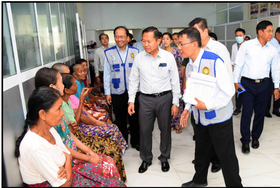
SAC Vice-Chairman Deputy Prime Minister comforting the locals receiving medical treatments at the hospital