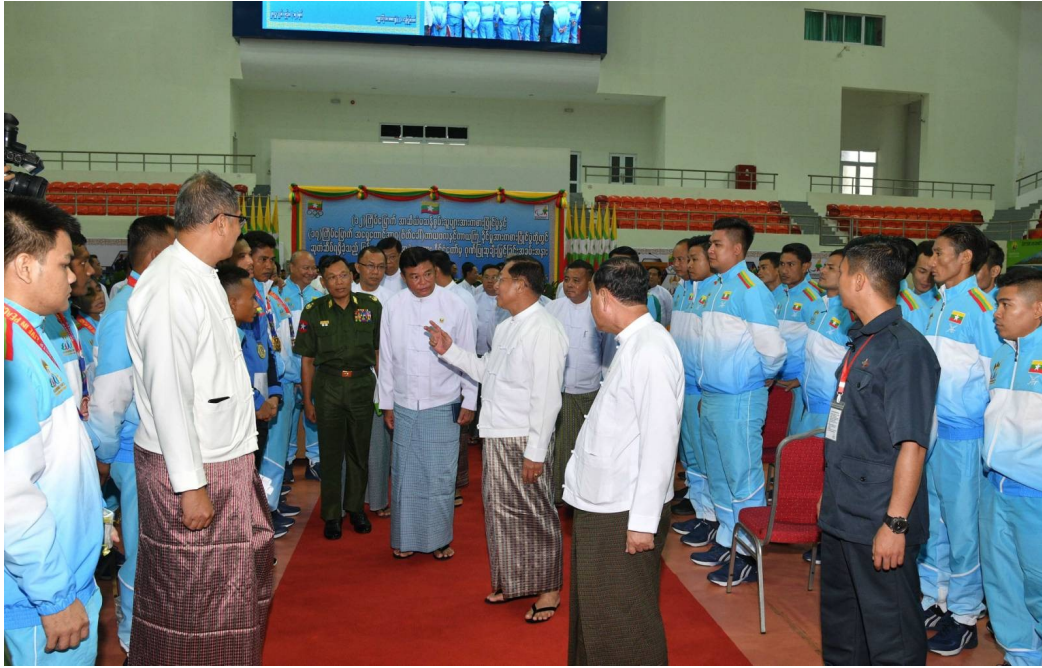
SAC Chairman Prime Minister cordially greeting the athletes and coaches who brought honor to the State