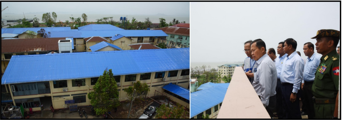
SAC Vice-Chairman Deputy Prime Minister inspecting the progress of repair works of the damaged hospital (500-bedded general hospital) in Sittwe