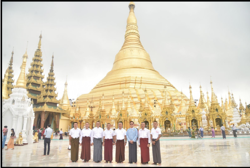
The delegation from the Royal Thai Air Force taking commemorative photo after paying homage to Shwedagon Pagoda