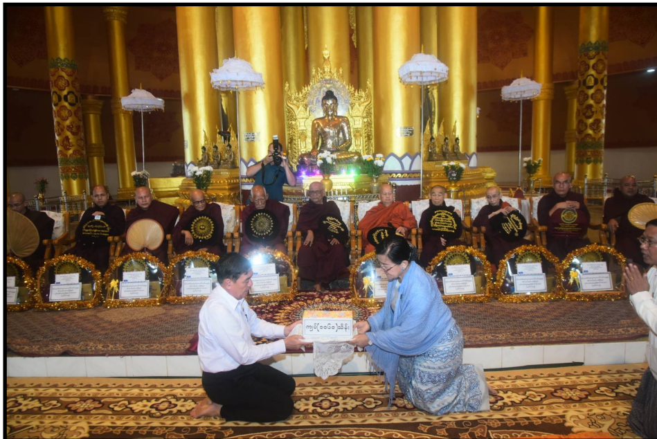
Deputy Minister for Religious Affairs and Culture Daw Nu Mra Zan donating K106 million for monasteries and monastic education schools damaged by Cyclone “Mocha” in Rakhine State to the State Chief Minister

Buddhist Learning Centre and offered alms to members of the Sangha. Then, Deputy Minister for Religious Affairs and Culture Daw Nu Mra Zan donated K106 million for monasteries and monastic education schools