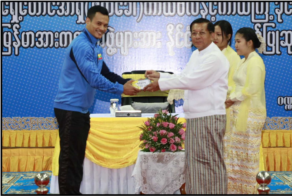
SAC Chairman Prime Minister presenting cash awards to an athlete who secured medal in the 17 th SEA (Invitational) Body Building and Physique Sports Championships