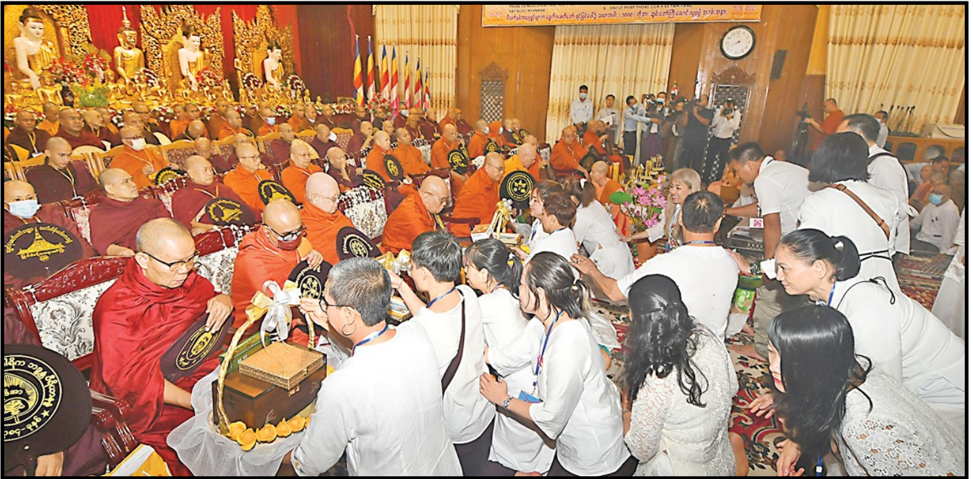
Well-wishers from Vietnam donating offertories to the venerable Sayadaws