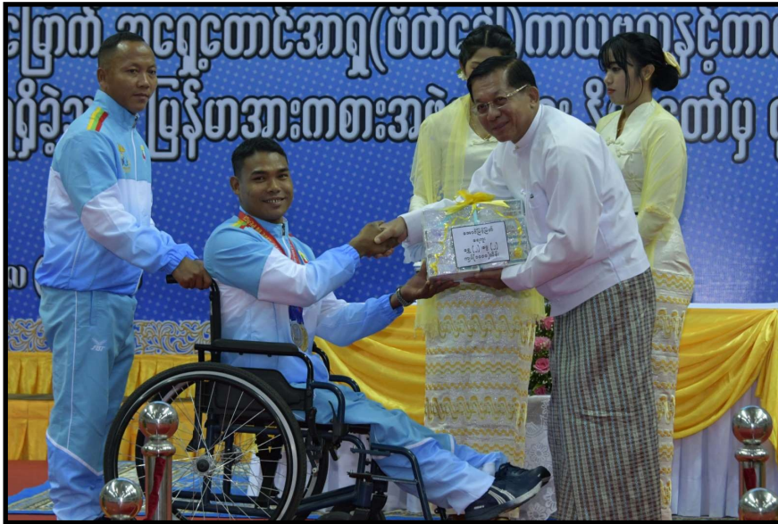
SAC Chairman Prime Minister presenting cash awards to an athlete who secured medals in the 12 th ASEAN Para Games

ior General then cordially greeted the athletes and coaches.