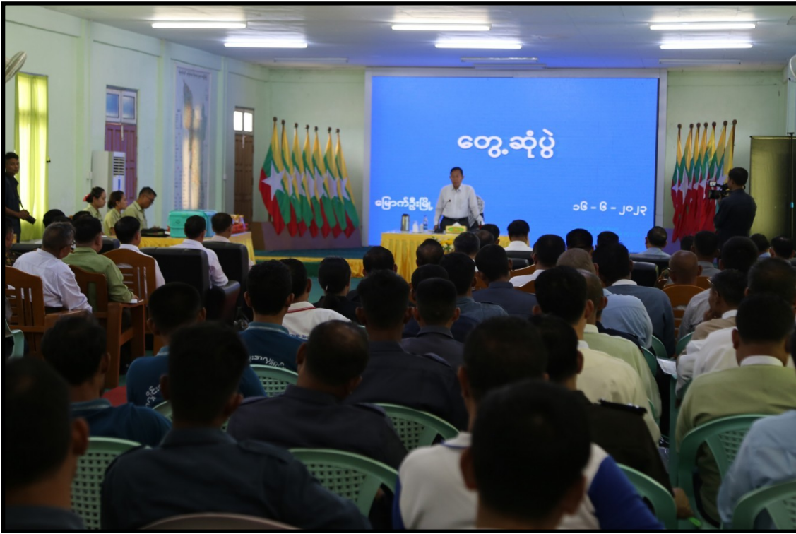
SAC Vice-Chairman Deputy Prime Minister delivering a speech at the meeting with the departmental officials and relief teams in MraukU Township

departmental staff, relief and rescue teams and voluntary teams and inspected the repair works of hospitals damaged during the storm. They also comforted the patients being undergone treatment at the hospitals and presented foodstuffs and cash assistance. Moreover, the Vice-Senior General and party comforted officers, the ranks and families of local battalions as well as members of border guard police force and families, and presented foodstuffs and cash assistance to them.