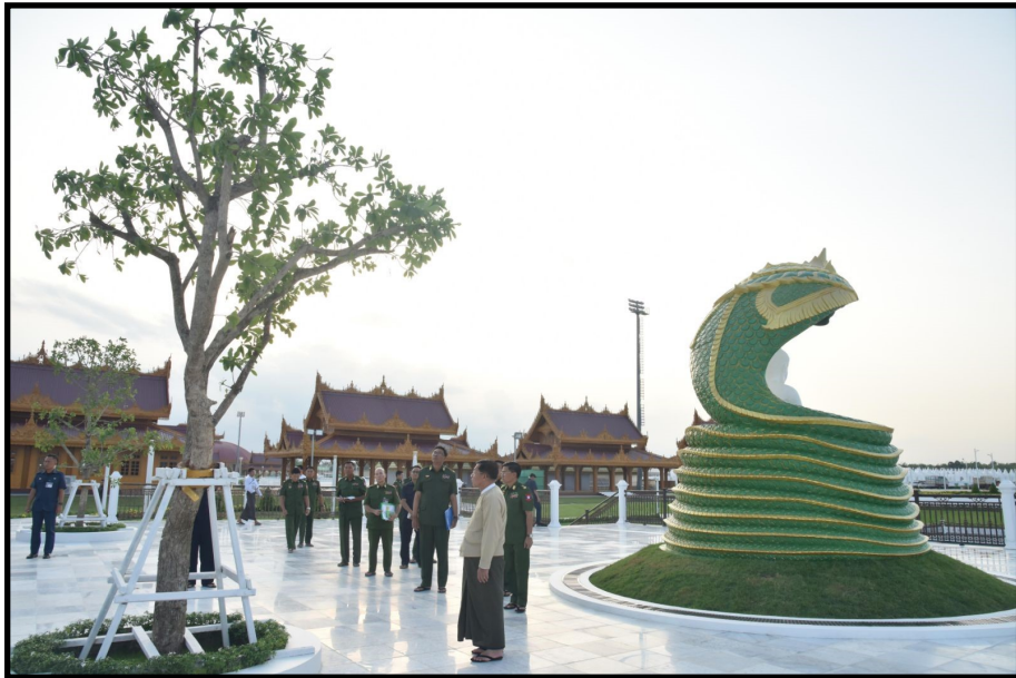
SAC Chairman Prime Minister inspecting the thriving of fish-poison trees (Barringtonia Asiatica)