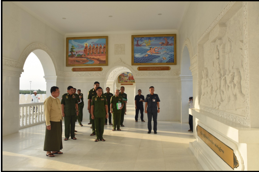
SAC Chairman Prime Minister viewing the progress of carving the Gandakuti chambers