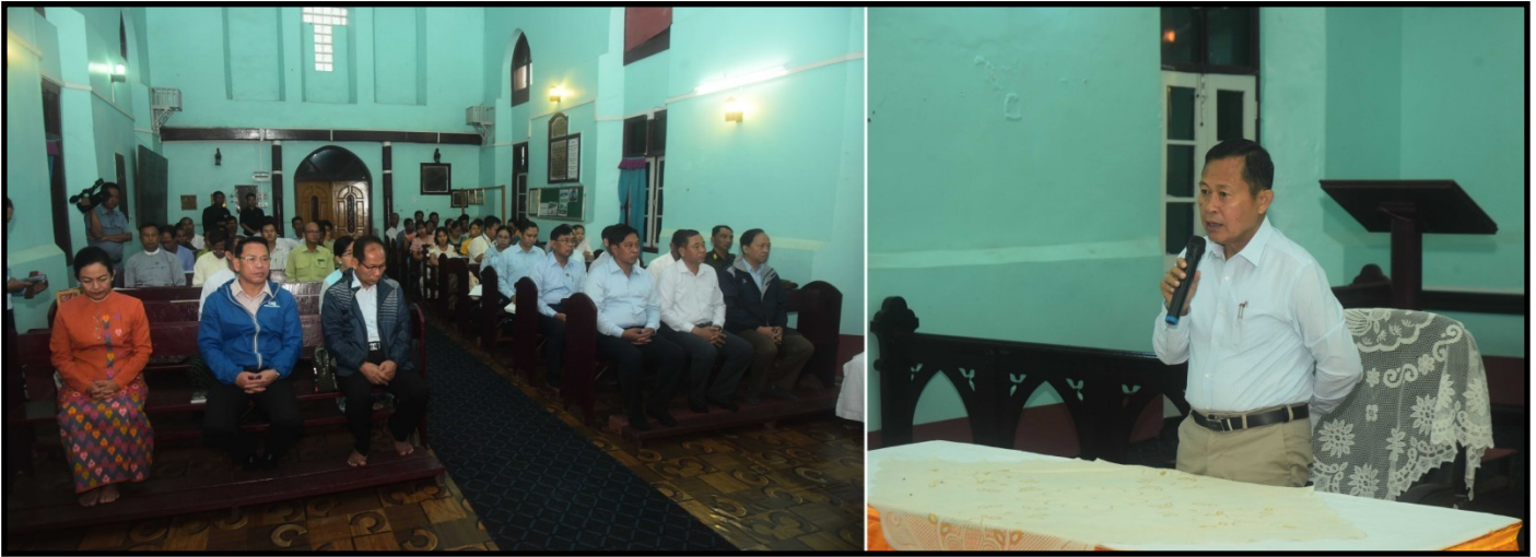
SAC Vice-Chairman Deputy Prime Minister giving speeches at the meeting with the officials of the Christian Church in Sittwe

Vice-Chairman of the State Administration Council (SAC) Deputy Prime Minister Vice-Senior General Soe Win, in his capacity as the Chairman of the National Natural Disaster Management Committee, accompanied by officials, visited St. Mark Cathedral in Sittwe on 15 June and viewed the renovation of the Church damaged by the storm.