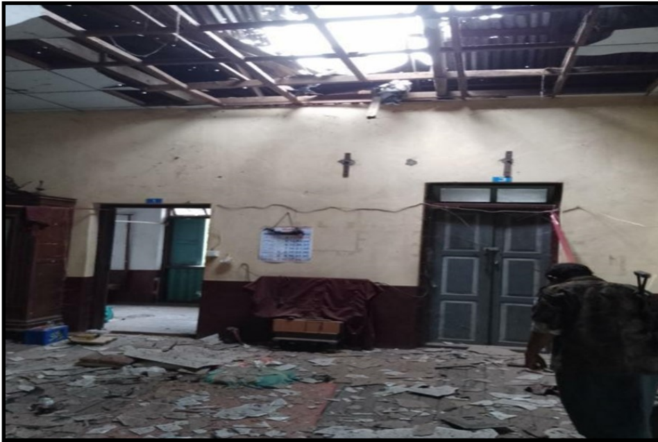
The monastery damaged in the heavy weapon attacks of KKO (splinter group) and PDF terrorists

On 15 June, KKO (splinter group) and PDF terrorists fired heavy weapons targeting Kawkareik township of Kayin state and the shells fell and exploded on the main building of Zawtiyarma monastery and its compound. Due to the attack, the abbot monk Bandanta Kawvida got severe injuries.