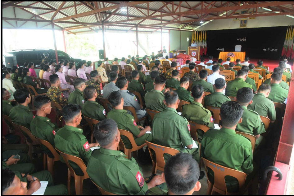
SAC Vice-Chairman Deputy Prime Minister delivering a speech at the meeting with Tatmadaw personnel and their families in Sittwe Station