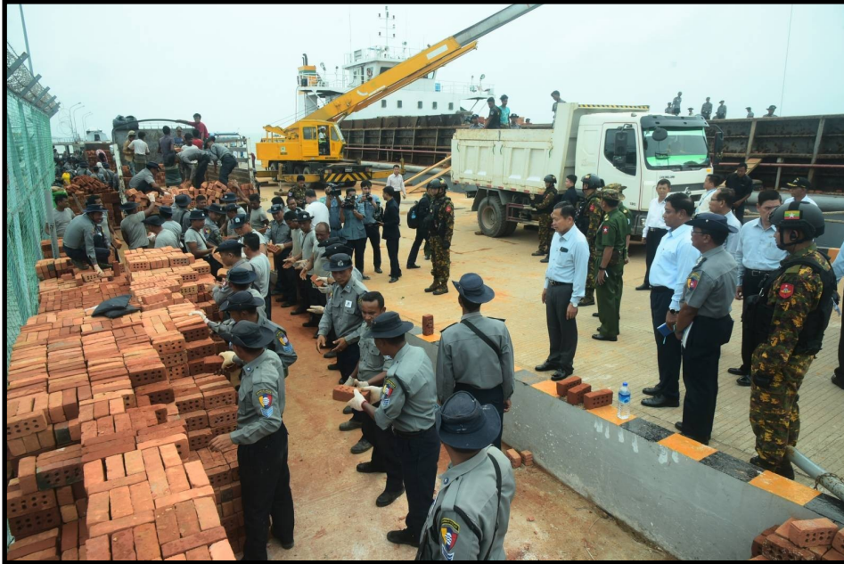
SAC Vice-Chairman Deputy Prime Minister inspecting the relief and rehabilitation undertakings at Kaledan multi-modal port in Sittwe

The cash awards presented to a total of 20 relief and rescue teams and charity organizations today amounted to Ks-49 million.