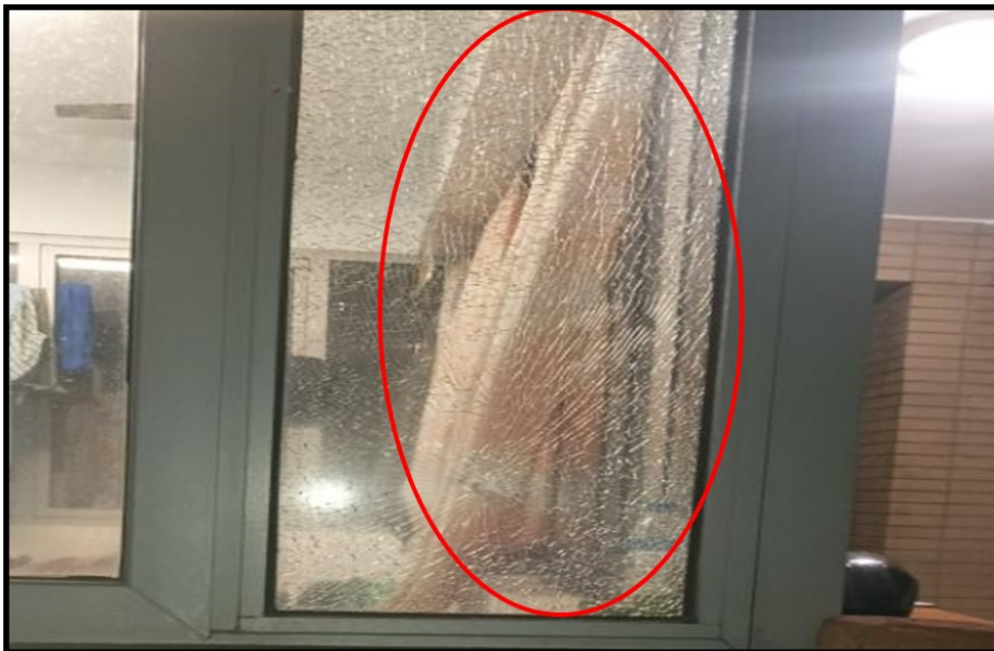
Damages seen in the aftermath of grenade attacks on Entrance Gate (2) to MICC-II in Zabuthiri Town

On 12 June 2023, two males (under investigation) made a grenade attack on Lewe Myoma police station, and in the evening of the same day, three males (under investigation) also carried out a grenade attack on the entrance (2) to the MICC-II.