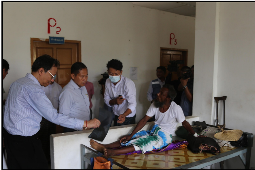
SAC Vice-Chairman Deputy Prime Minister comforting patients receiving medical treatments at public hospital of Maungtau Township