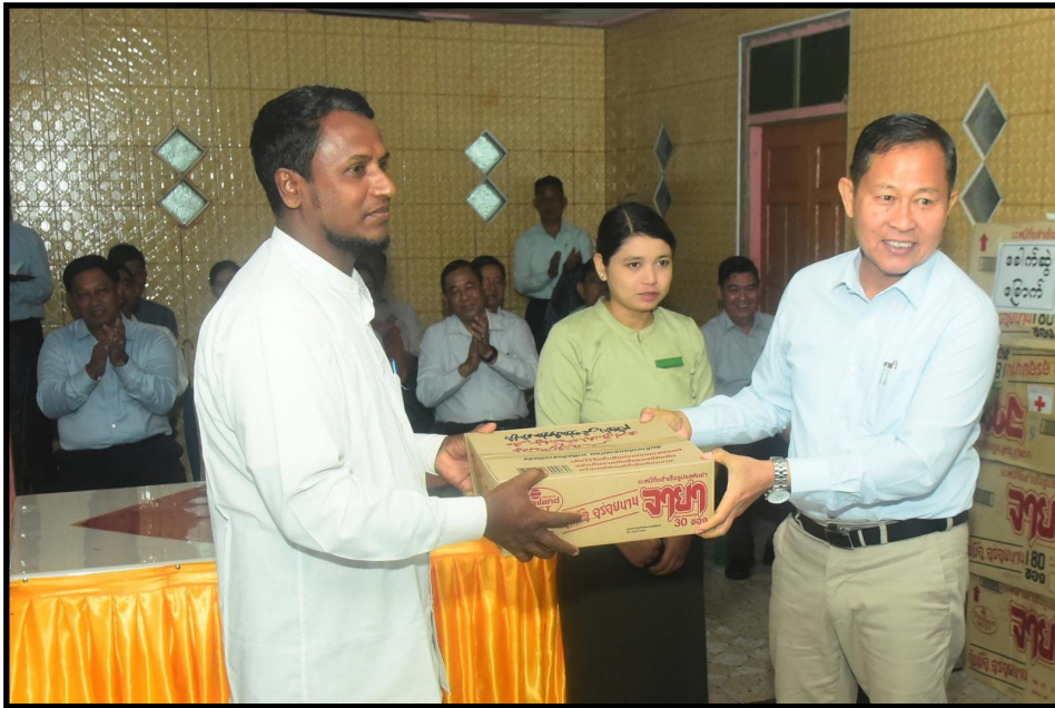
SAC Vice-Chairman Deputy Prime Minister presenting foodstuffs and tarpaulin rolls to an official of Thetkaepyin camp in Sittwe