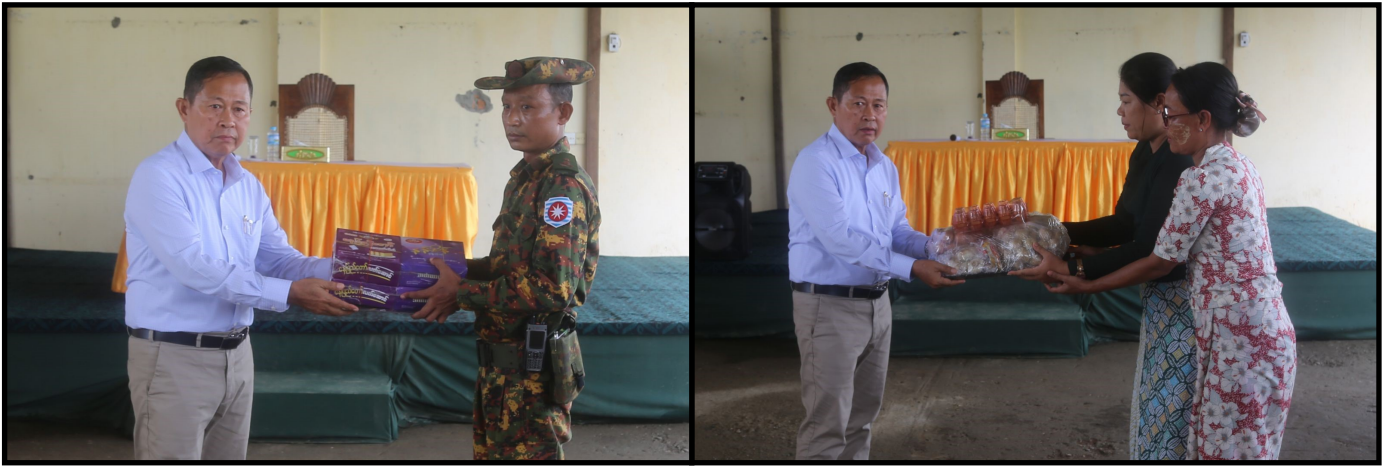
SAC Vice-Chairman Deputy Prime Minister providing foodstuffs for the Tatmadaw personnel and their families in Rathedaung Station