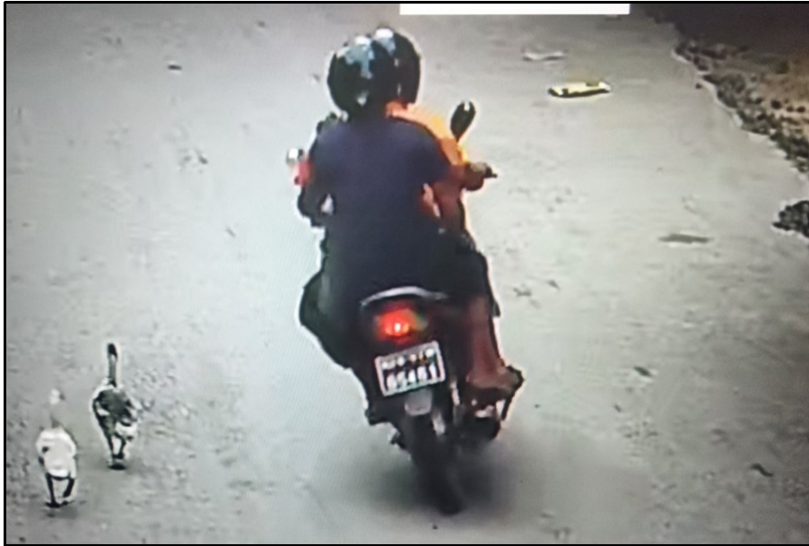
The CCTV footage showing two perpetrators who carried out grenade attacks on Lewe Myoma Police Station and Entrance Gate (2) to MICC-II

he would pay cash to them for it if they joined the acts of violence in Nay Pyi Taw council area. So, they accepted what he persuaded for their personal interests.