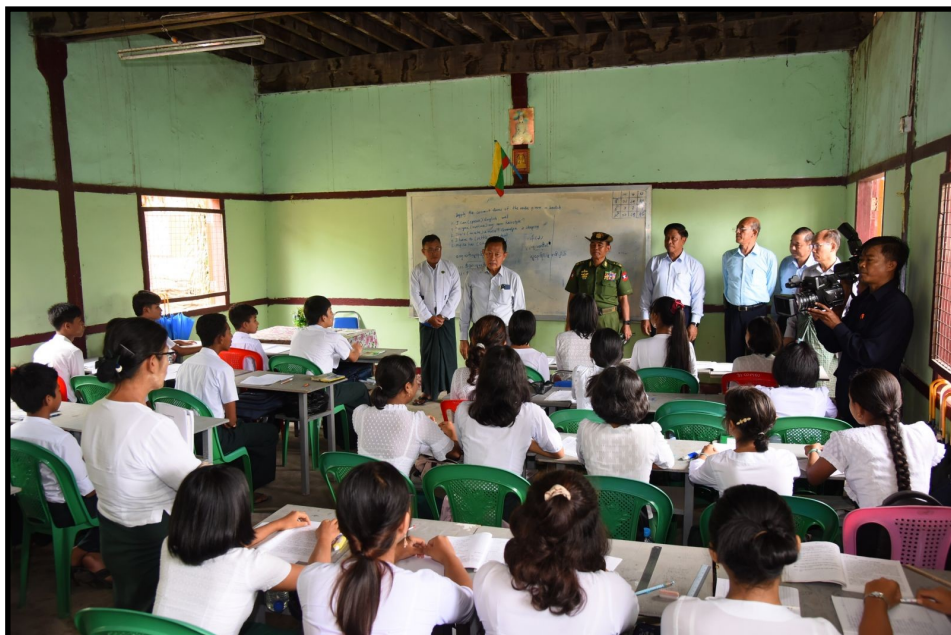
SAC Vice-Chairman Deputy Prime Minister delivering speech to the students of No (1) Basic Education High School in Sittwe