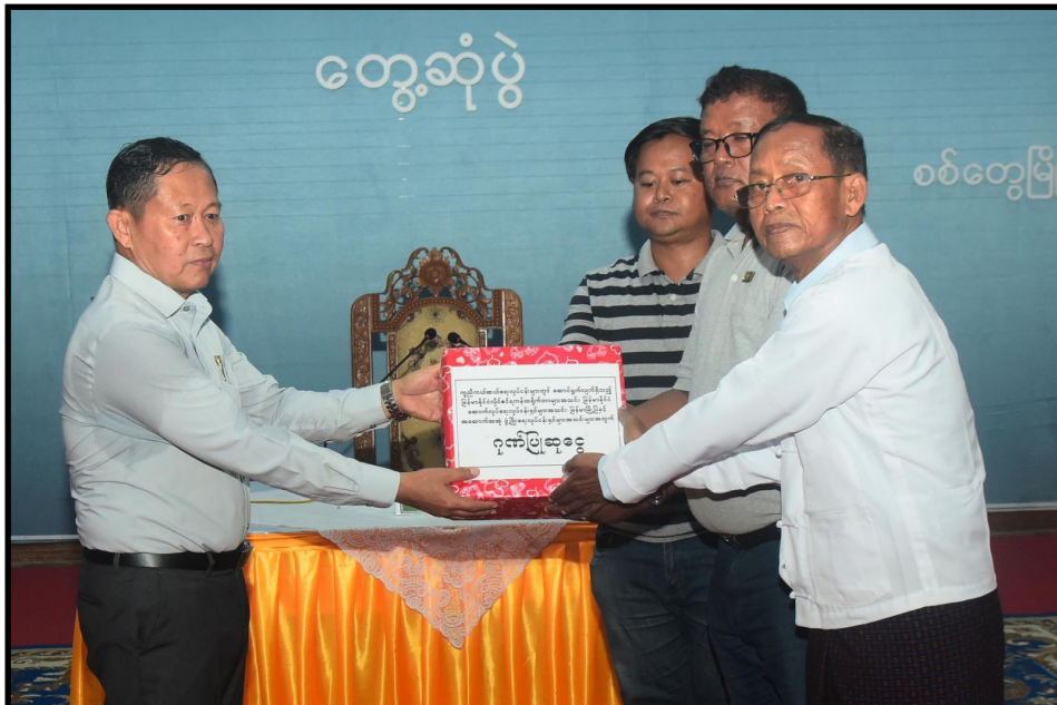
SAC Vice-Chairman Deputy Prime Minister presenting awards to the relief and rescue teams for their sacrifices in cleaning up the debris due to storm Mocha