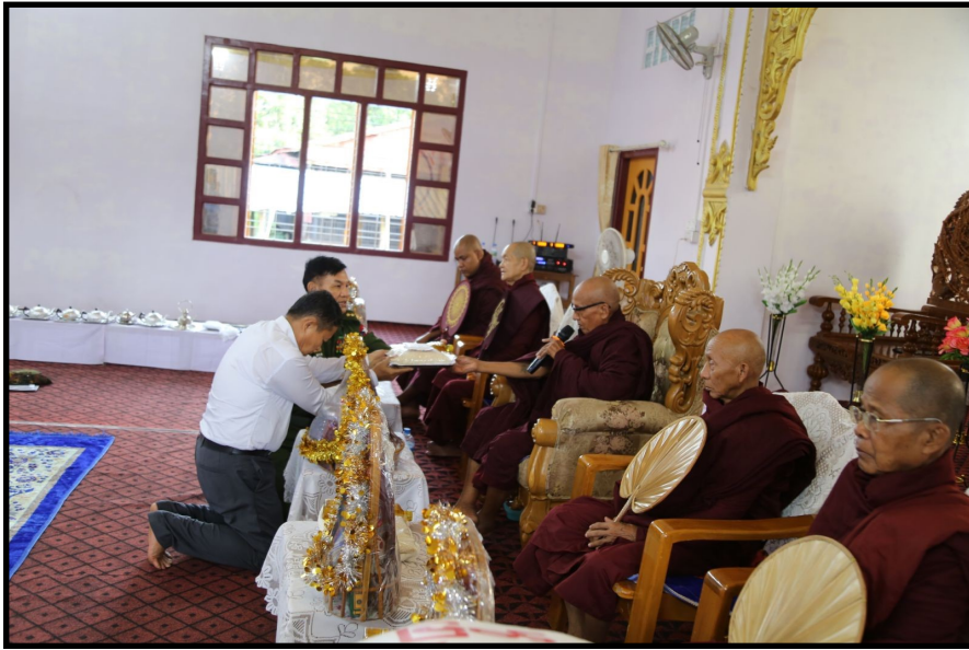
SAC Vice-Chairman Deputy Prime Minister donating offertories to the members of the Sangha at the monastery of Kyaukpyu