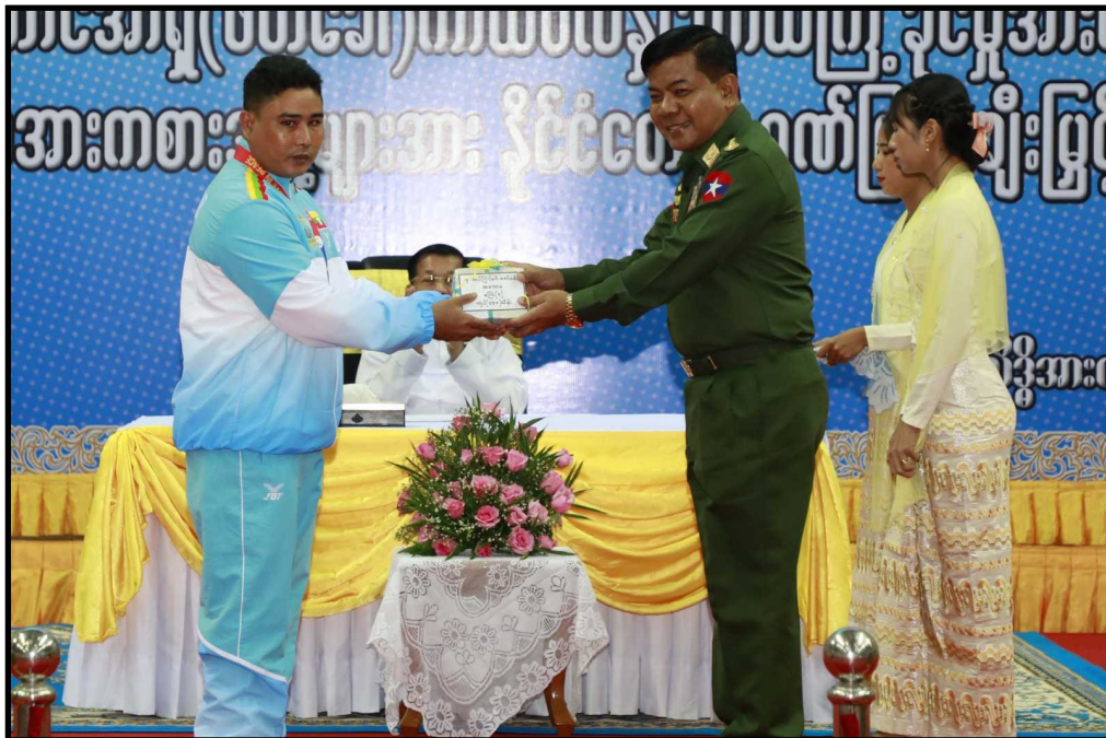
Chief of the General Staff (Army, Navy and Air) General Maung Maung Aye presenting cash awards to a medallist