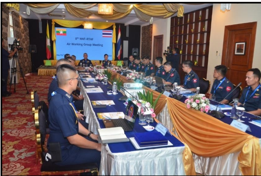
Holding the 8 th MAF-RTAF Air Working Meeting

nowned Maravijaya Buddha image, Up-patasanti Pagoda, and the captivating white elephants.