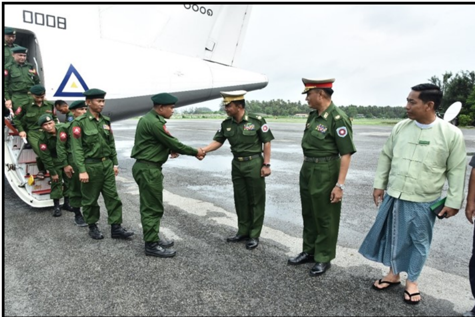
Western Command Commander welcoming Tatmadaw members who are now recovered from their wounds after they had injured in doing the State defence duty, on their trips to Ngapali Beach

As the the instruction of the Head of the Tatmadaw, recreational travel arrangements have been made by military aircrafts and by cars starting from 11 June for Tatmadaw members who are now recovered from their