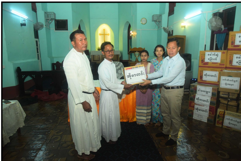
SAC Vice-Chairman Deputy Prime Minister presenting foodstuffs and aid to the officials of the Christian Church in Sittwe

vegetable seeds and tarpaulin rolls to officials.