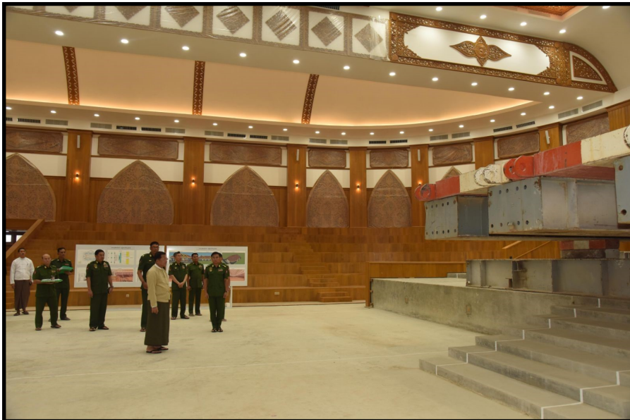
SAC Chairman Prime Minister viewing the completion of the Sasana Beikman