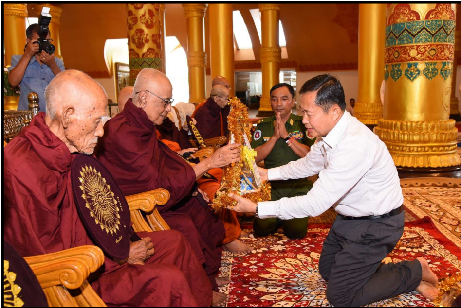
SAC Vice-Chairman Deputy Prime Minister donating offertories to venerable Sayadaws