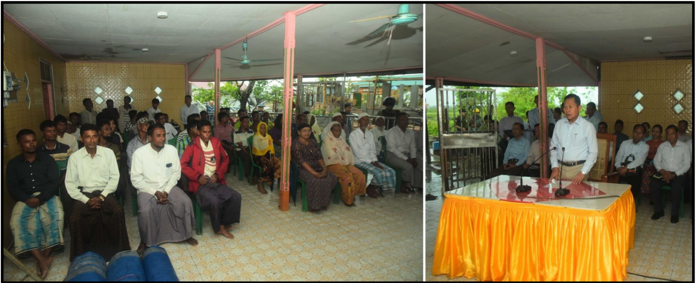
SAC Vice-Chairman Deputy Prime Minister delivering a speech to those living in the Thetkaepyin camp of Sittwe