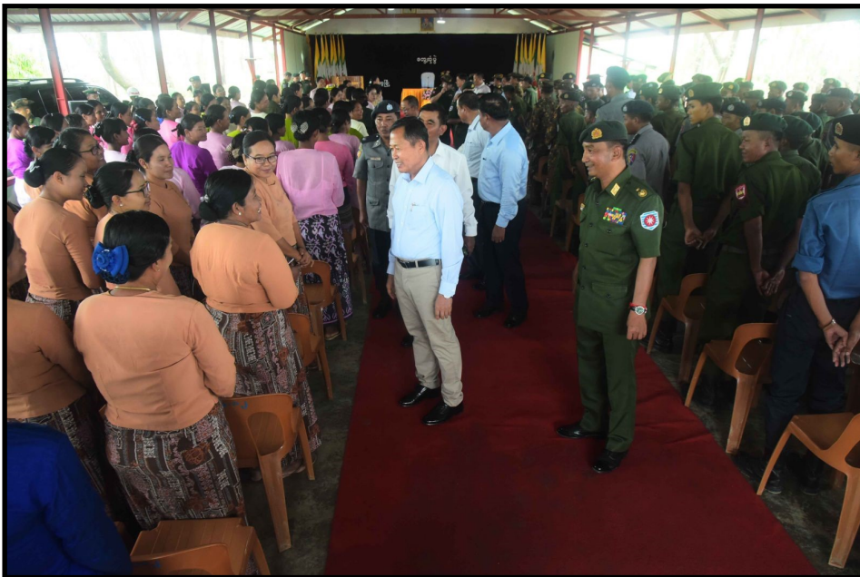
SAC Vice-Chairman Deputy Prime Minister cordially greeting the Tatmadaw personnel and their families in Sittwe Station

relief teams from relevant stations through officials.