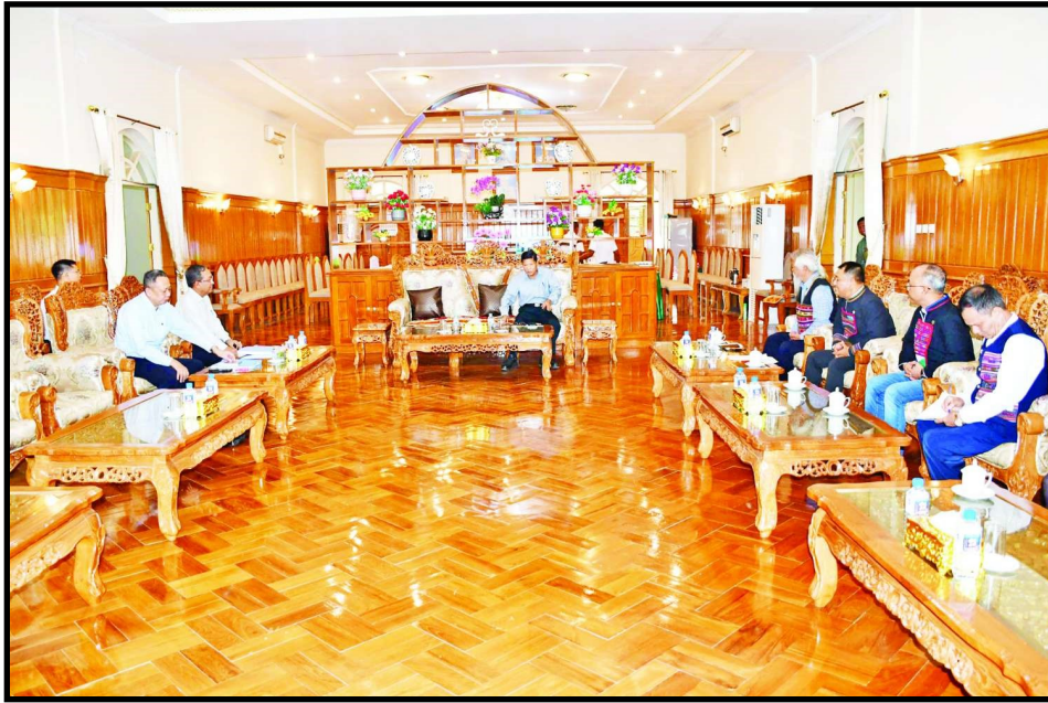
UEC Chair inspecting the activities of the Akha National Development Party