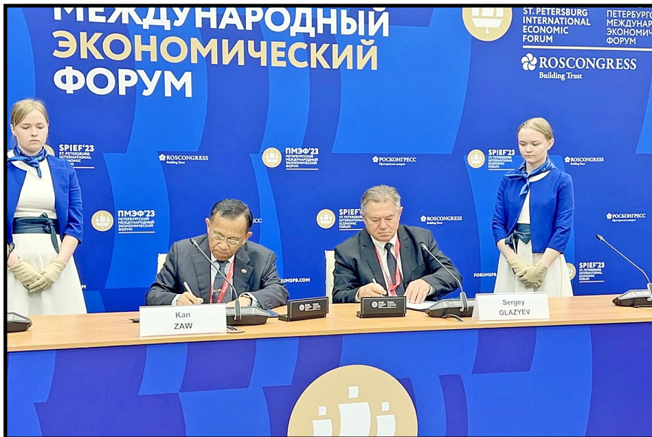
Myanmar delegation participating in the 26 th St Petersburg International Economic Forum

cling of waste to generate energy, development of municipal disposed waste management system and cooperation in waste classification project in Myanmar.