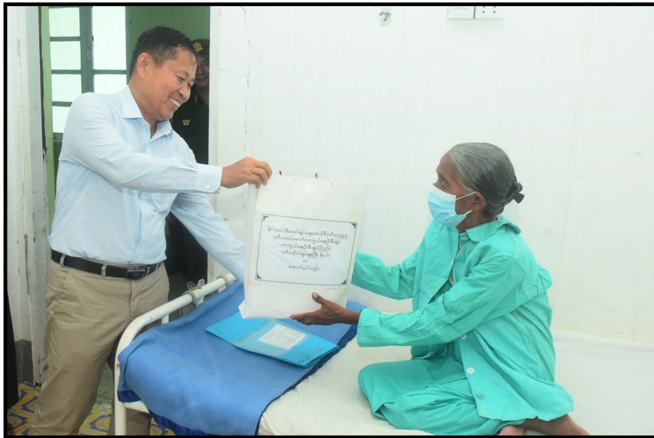
SAC Vice-Chairman Deputy Prime Minister comforting a family member of the Tatmadaw personnel receiving medical treatments at local medical unit in Sittwe