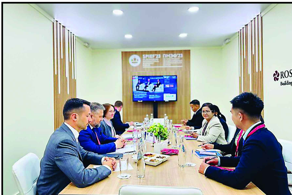
The Governor of the Central Bank of Myanmar participating in the 26 th St Petersburg International Economic Forum