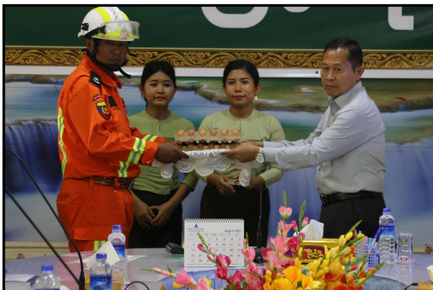
SAC Vice-Chairman Deputy Prime Minister presenting cash assistance to the relief and rescue teams and voluntary teams carried out rehabilitation measures in Buthidaung