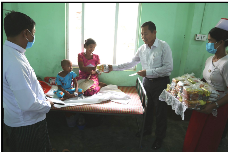
SAC Vice-Chairman Deputy Prime Minister presenting foodstuffs and cash assistance to the patients receiving medical treatments at public hospital of Minbya Township