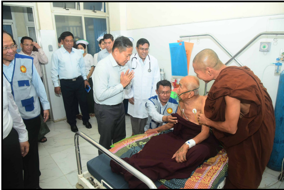
SAC Vice-Chairman Deputy Prime Minister asking after the health of Sayadaw receiving the medical treatments at the hospital