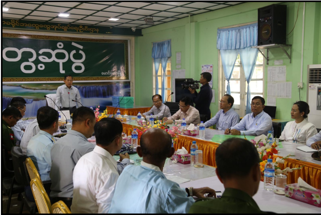
SAC Vice-Chairman Deputy Prime Minister delivering a speech at the meeting with the departmental officials and relief teams in Maungtaw Township

Chairman of the National Disaster Management Committee Vice-Chairman of the State Administration Council Deputy Prime Minister Vice-Senior General Soe Win, who is currently in Sittwe, and party made an inspection tour of Maungtaw, Buthidaung, Rathedung, Myauk-U, Minbya and Kyaukpyu Townships to view round rehabilitation tasks on 14, 15 and 16 June. Then, he addressed departmental staff, relief teams and voluntary teams in offices of district and township General Administration Department separately.