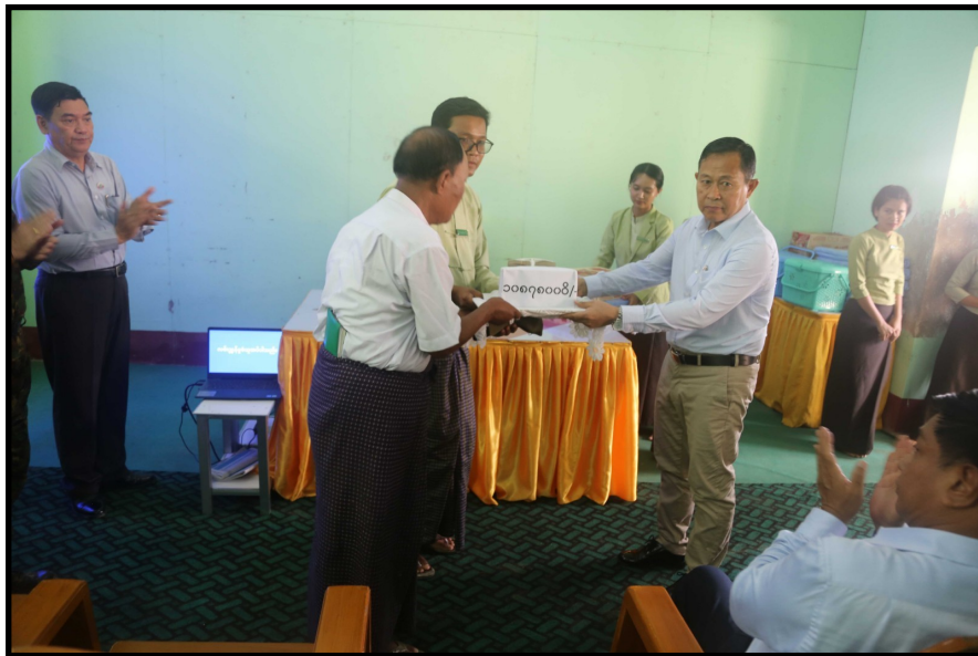
SAC Vice-Chairman Deputy Prime Minister presenting cash assistance to the relief and rescue teams and voluntary teams carried out rehabilitation measures in Rathedaung