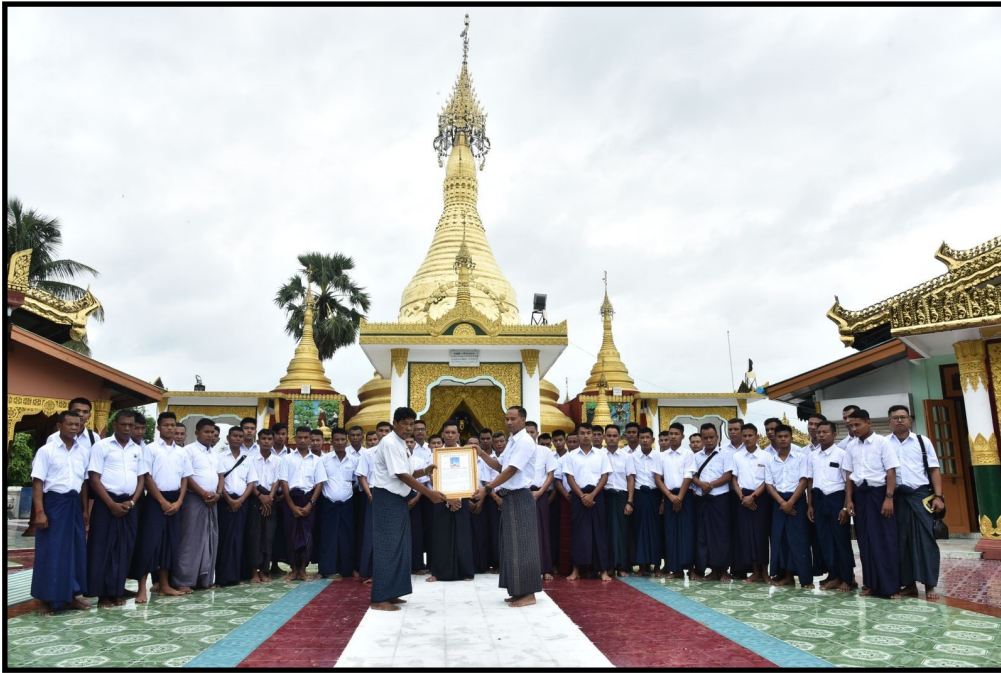
Tatmadaw members who are now recovered from their wounds after they had injured in doing the State defence duty, paying homage to the famous pagodas in Chaungtha and Thandwe Townships

for recreation. They paid homage to famous pagodas in Pathein and Chaungtha, and visited popular places, such as Thephyu island, Shwe Thaungyan of Chaungtha, Marine Institute, Pathein 'Halawa' dessert business and traditional Pathein umbrella business.