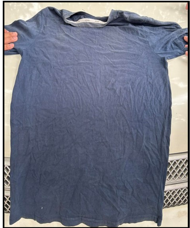
The evidence items of perpetrators who committed grenade attacks on Lewe Myoma Police Station and Entrance Gate (2) to MICC-II