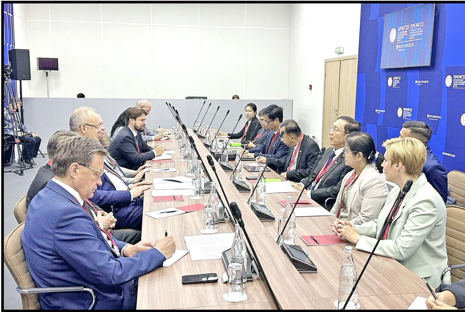
Myanmar delegation led by Deputy Prime Minister and Union Minister U Win Shein participating in the 26 th St Petersburg International Economic Forum

From Waste to Resources’, Union Minister for Investment and Foreign Economic Relations Dr. Kan Zaw served as a panellist and discussed Myanmar’s activities for sustainable development of the natural environment, laws and procedures related to waste management, strategic waste management projects, environmental issues stated in the Investment Law, challenges, and ongoing work plans.