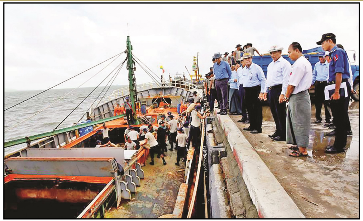
SAC member Deputy Prime Minister and Union Minister Admiral Tin Aung San inspecting the plans to distribute the relief aids to be used in relief and rehabilitation measures to the storm-hit areas on the ships docked at Multi-purpose port and the Phaung Daw Gyi port in Sittwe

Rehabilitation Activities Underway for the Loss and Damage caused by Cyclonic Storm (MOCHA)