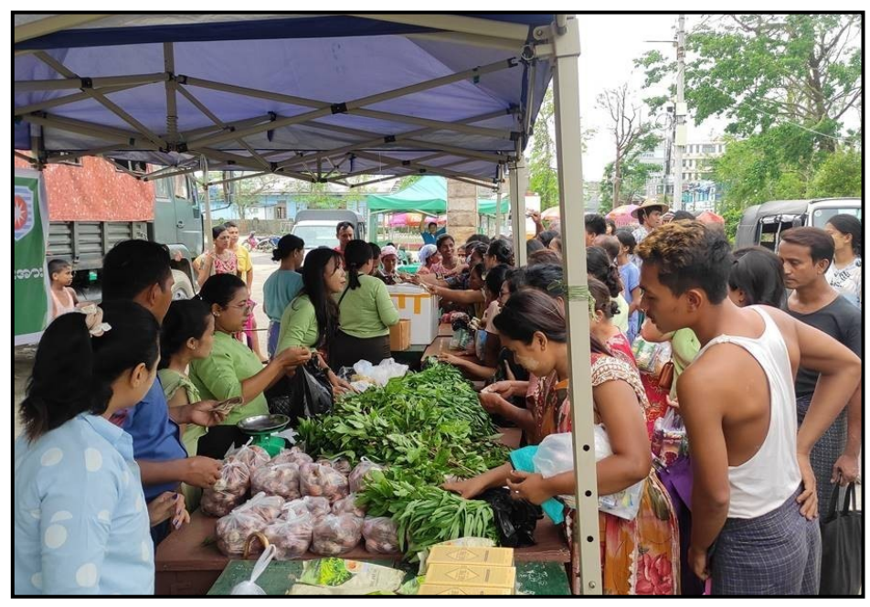
Local Military Units selling food items at cheaper prices to Cyclone victims in some townships of Rakhine State

• Military personnel from local units under Western Command have been selling rice, cooking oil, salt, meats, fish, eggs, vegetables and other food staffs at a cheaper price than the current price for people of cyclone victims at U Ottama Park in Sittwe since 21 May.