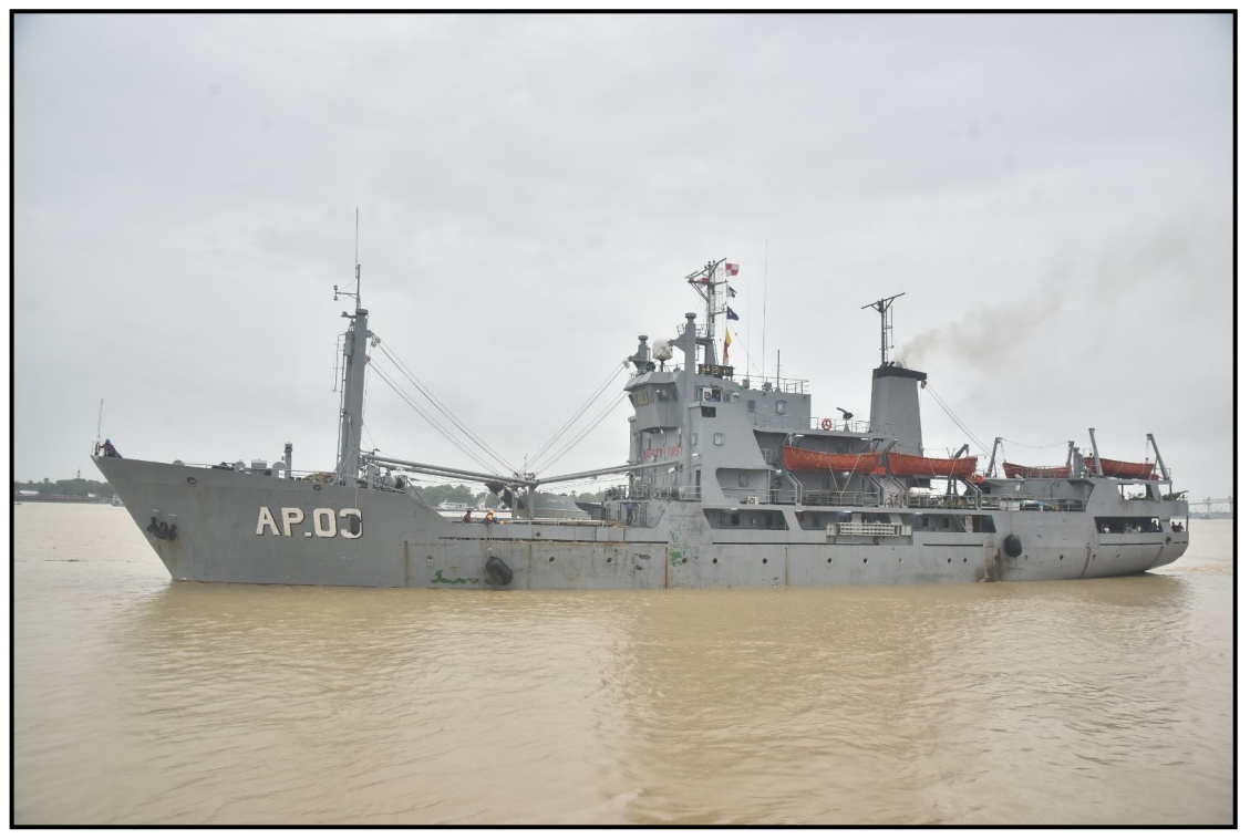
Aids, relief materials, supplies transported to victims of Cyclonic Storm MOCHA in Rakhine State