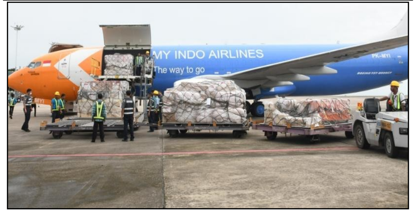
International Community Delivering Relief Supplies to Myanmar

International organization and countries are delivering relief items and foodstuffs to be used in the relief and rehabilitation activities for the cyclone-hit victims in the areas where damage and loss occurred due to the Cyclone Mocha. On 26 June, C-130 cargo plane of Indonesia's military carrying a total of weight over 13.594 tonnes of emergency supplies donated by ASEAN arrived at Yangon International Airport.