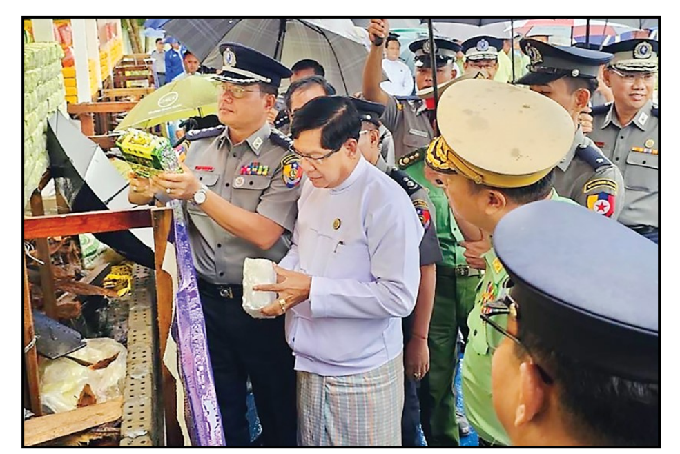
Yangon Region Chief Minister viewing the narcotic drugs to be incinerated in Yangon

lion (over US $ 446.058 million) including more than 1,130.149 kilograms of opium, more than 1,265.777 kilograms of heroin, over 154 million ecstasy tablets, more than 21,069.367 kilograms of ICE, more than 728.838 kilograms of opium powder, more than 841 kilograms of marijuana, more than 4,991.165 kilograms of ketamine and more than 307.315 kilograms of brown opium powder seized in 2023 were destroyed.