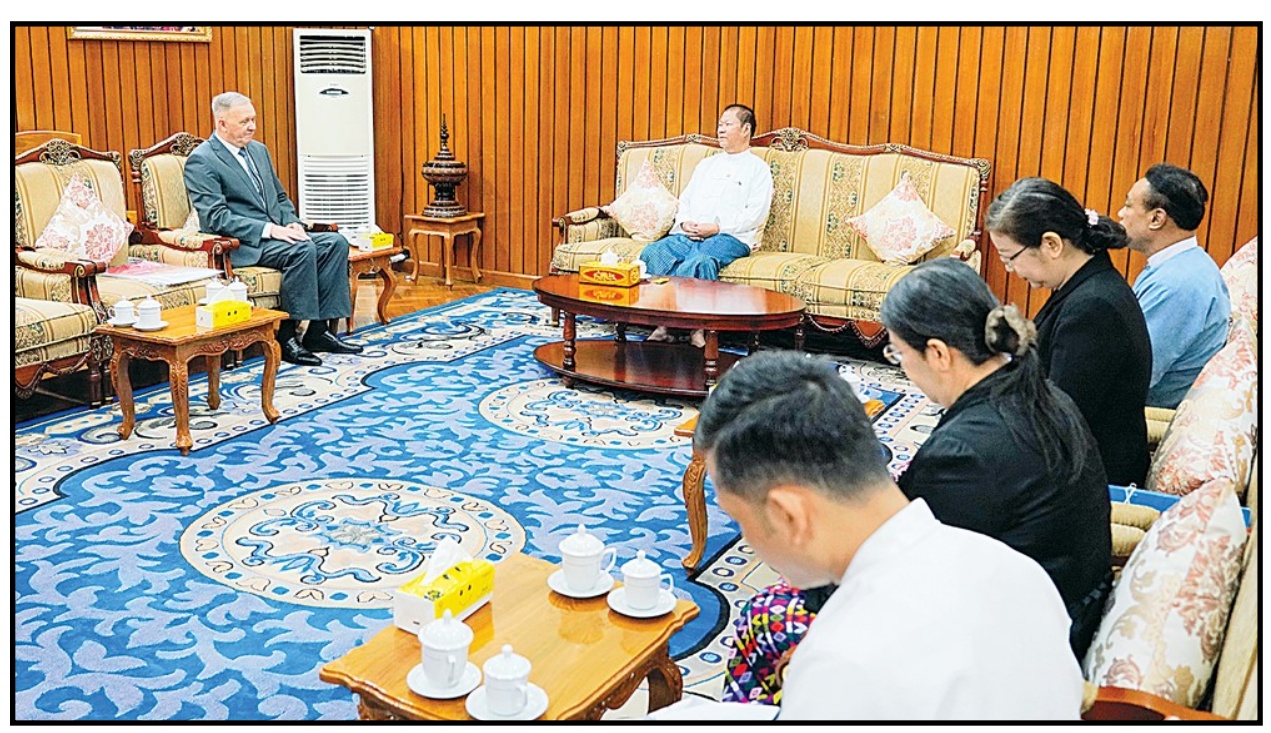
Union Minister for Hotels and Tourism U Aung Thaw receiving the Russian Ambassador to Myanmar