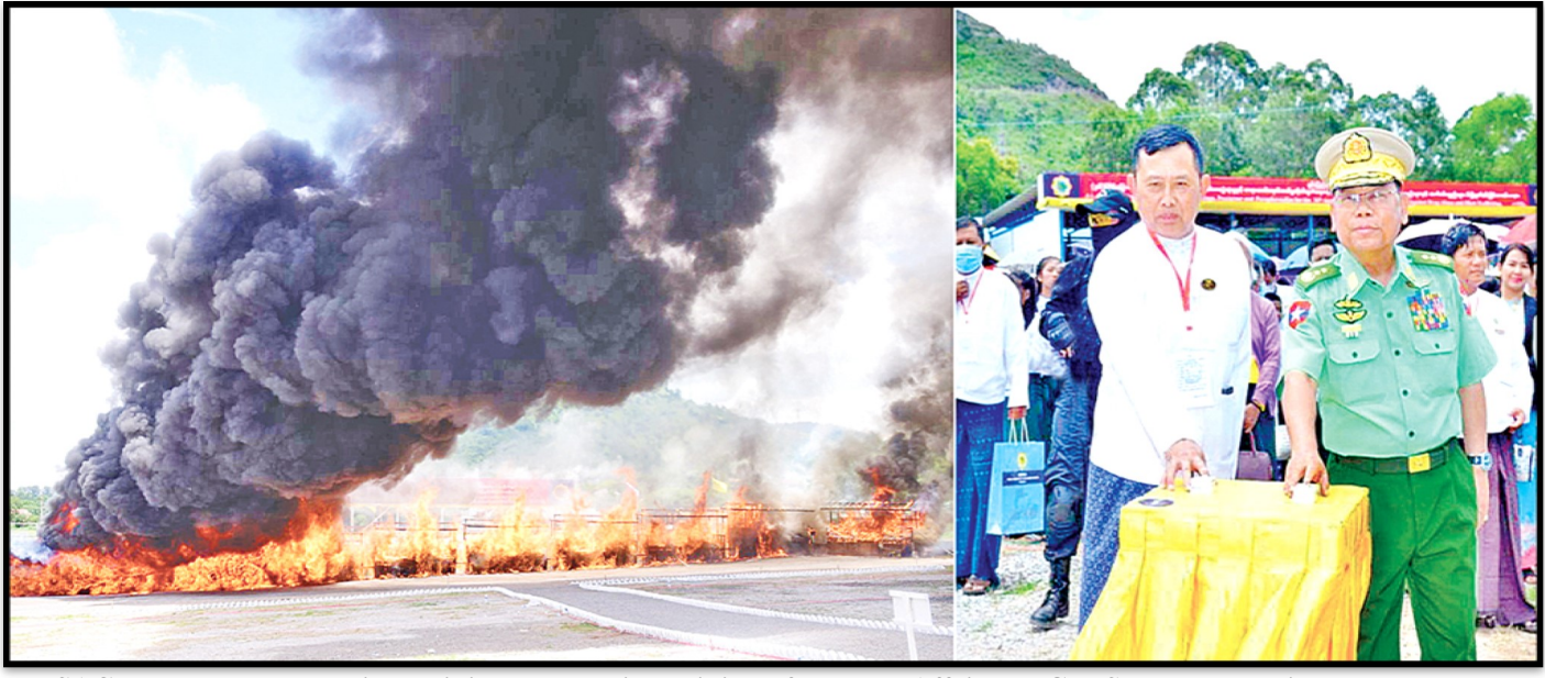
SAC member Deputy Prime Minister and Union Minister for Home Affairs Lt-Gen Soe Htut pressing the button to incinerate the narcotic drugs and related items

tralian Federal Police (AFP), China National Narcotics Control Commission (NNCC), Office of the Narcotics Control Board (ONCB) and international community attended the ceremony in Yangon. Consulate General from the Mandalay-based Chinese Consulate General Office and representatives from partner organizations attended the ceremony in Mandalay.