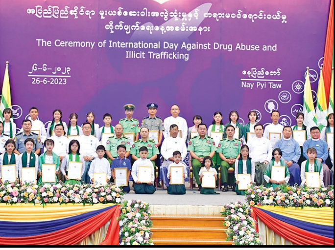
Nay Pyi Taw