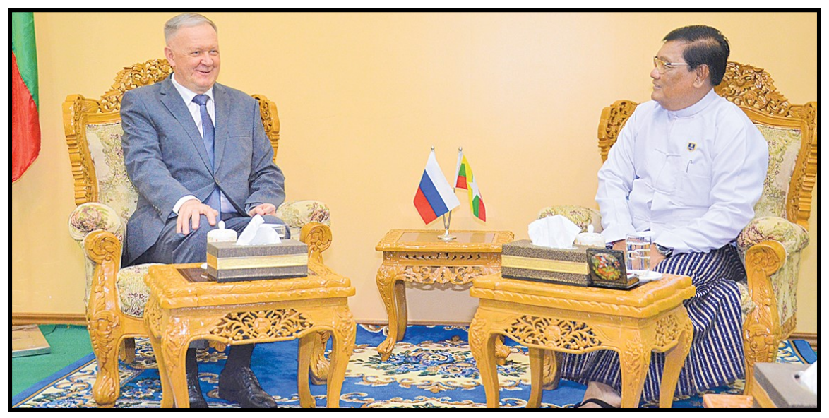
Union Minister for Electric Power U Thaung Han receiving the Russian Ambassador to Myanmar

ment in tourism industry of the two countries, potentials and opportunities of Myanmar's tourism industry, holding forums and online meetings on tourism industry and the running of chartered flights between the two countries.