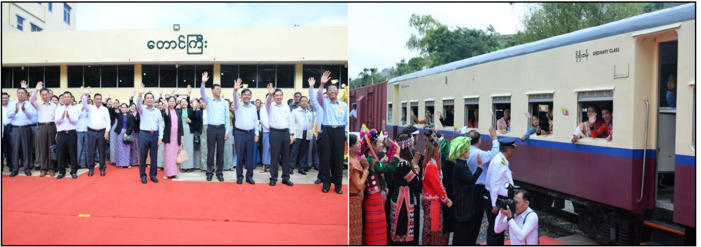
SAC Chairman Prime Minister and wife cordially greeting the locals who were on the train