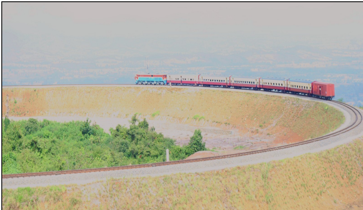
Railway circular near Htithien railway station seen