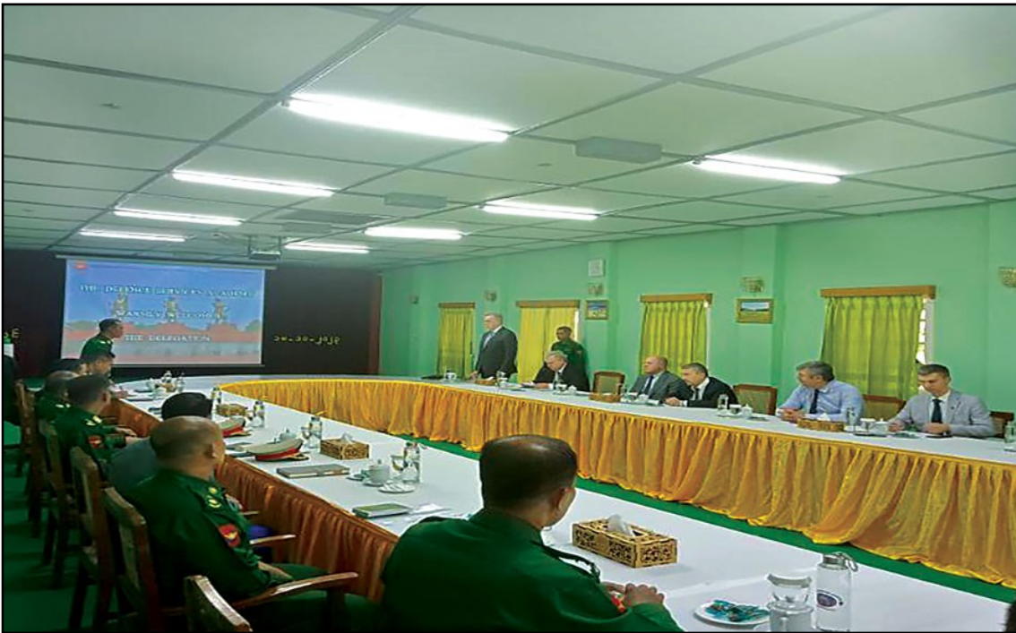
A Delegation led by the Chairman of the External Relations Committee of the Government of St. Petersburg in the Russian Federation making excursion trip to the Defence Services Academy