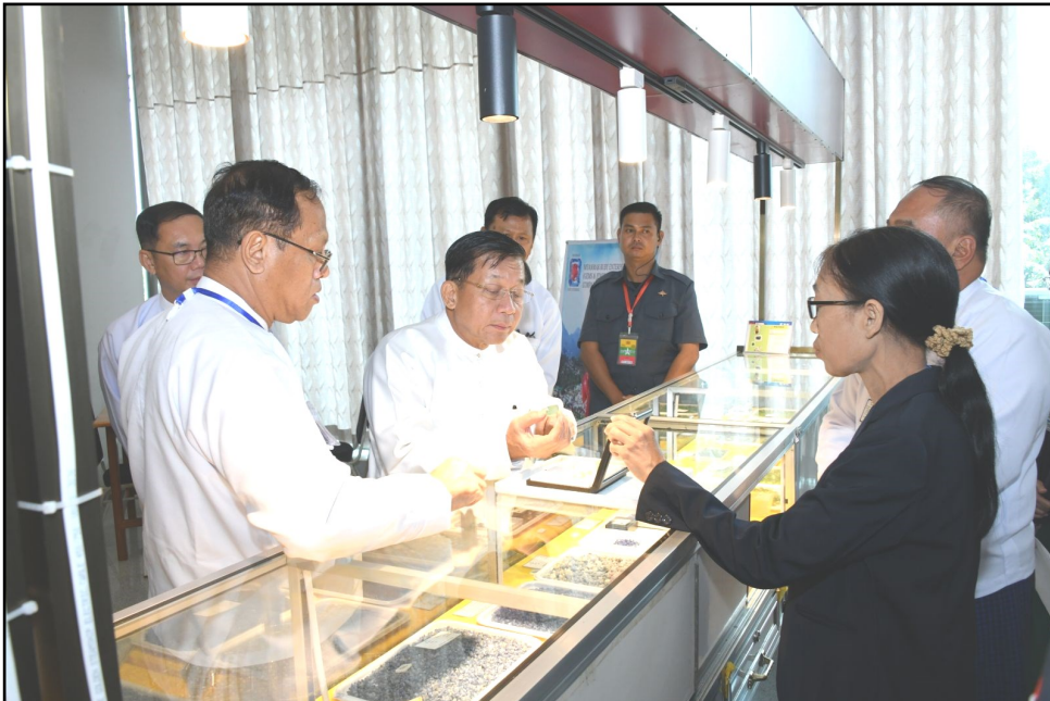
SAC Chairman Prime Minister interestingly observing the jeweler items to be sold in the emporium