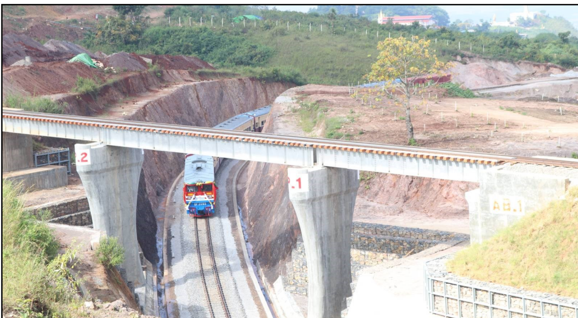
Railway circular near Htithien station which is a similar shape to the eminent Bawa Thanthaya railway