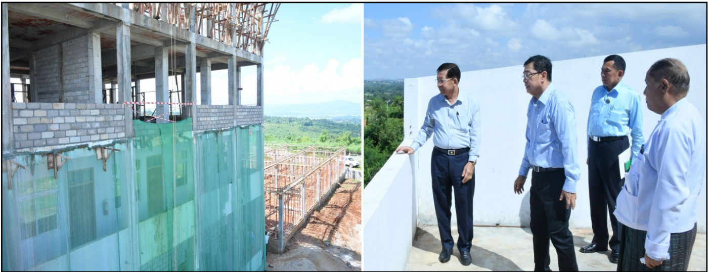
SAC Chairman Prime Minister inspecting the construction of the Shan State Ethnic Affairs and Vocational Training Centre