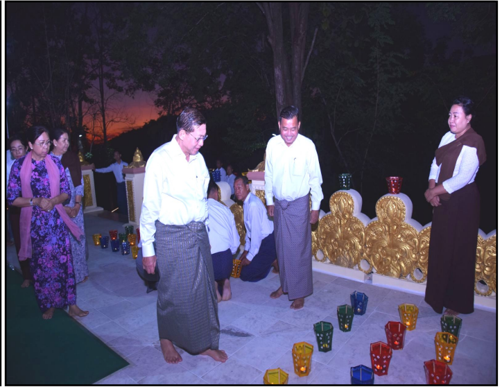
SAC Chairman Commander-in-Chief of Defence Services and wife offering oil lamps dedicating to the Lord Buddha at the Shwe Phone Pwint Pagoda

On the occasion of the full moon day of Tazaungmone (Samañaphala Day) which falls on 27 November, Buddhists made meritorious deeds such as taking Sabbaths dedicated to the Lord Buddha, reciting Pathana Desana and Paritta, donating Kathina robes at monasteries, celebrating Kathina donation ceremonies, and paying homage to pagodas, stupas and temples across the country peacefully.