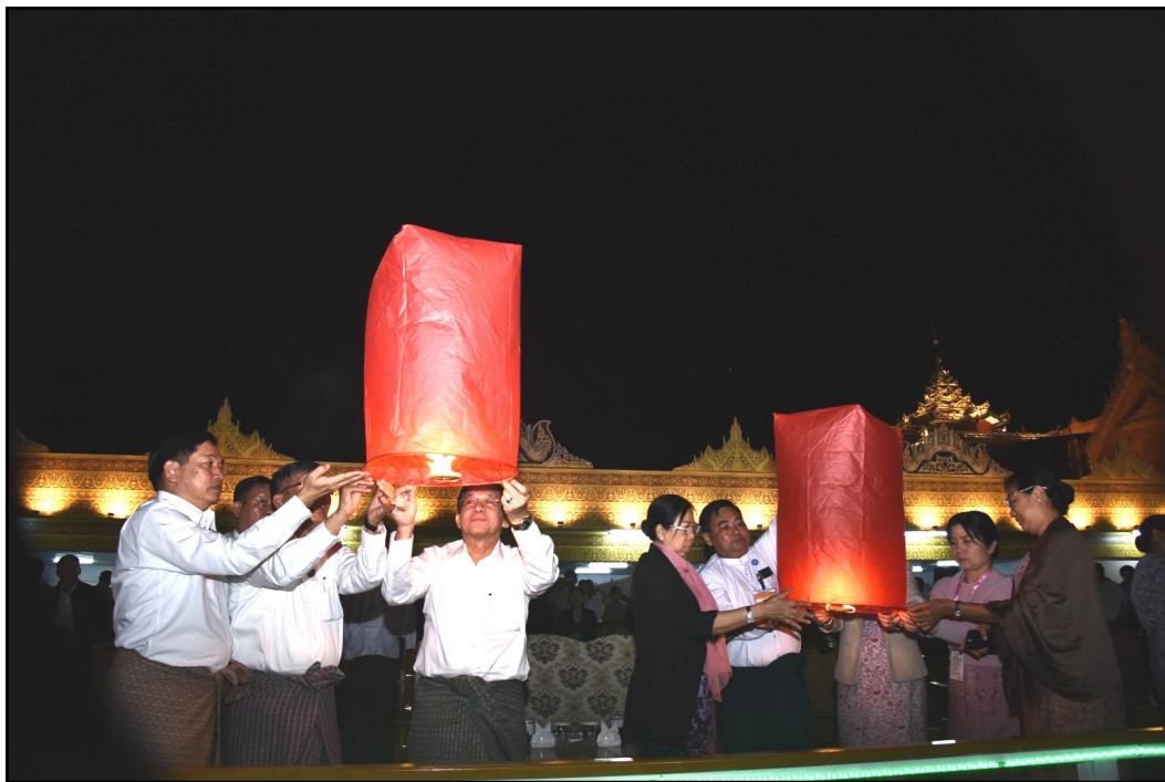
SAC Chairman Prime Minister and wife participating in the release of small hot-air balloons dedicating to the Maravijaya Buddha Image