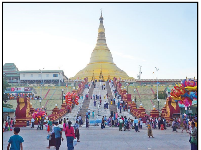
A famous pagoda in Nay Pyi Taw Union Territory