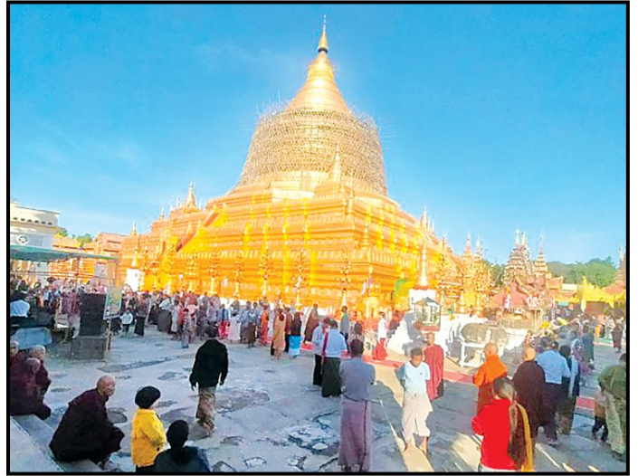
A famous pagoda in Bagan Township