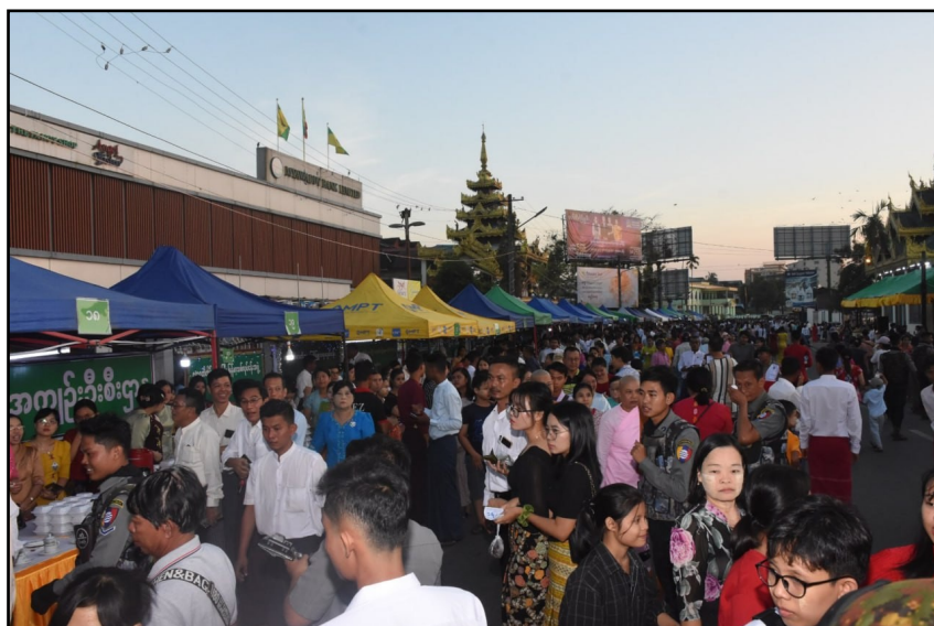
Holding charity fairs (locally known “Nirvana Market”) and night market with the participation of large crowds in Ayeyawady State