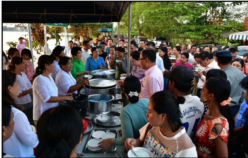
Holding charity fairs (locally known “Nirvana Market”) with the participation of large crowds in Kayin State