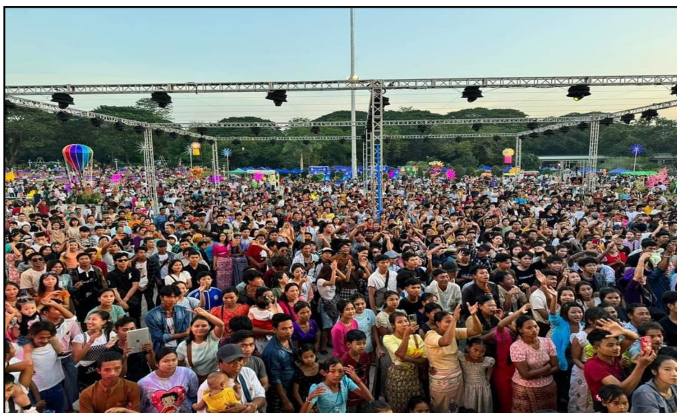
Tazaungdine Lighting Festival in Yangon