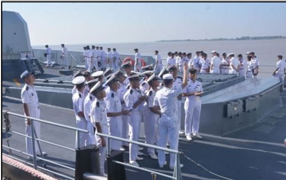
Chinese goodwill delegation visiting to the Naval Training Command Headquarters and military personnel from Myanmar Navy boarding and studying the Chinese warships