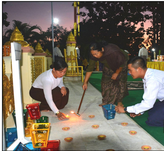
Wife of the SAC Vice-Chairman Deputy Commander-in-Chief of Defence Services and wife offering oil lamps to the Shwe Phone Pwint Pagoda