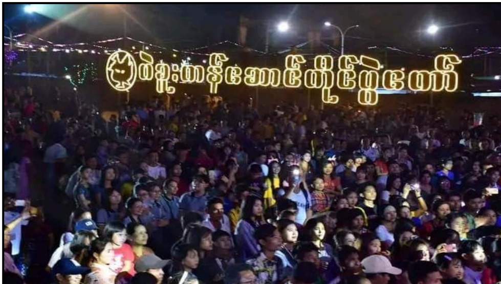
Tazaungdine Lighting Festival in Bago Region