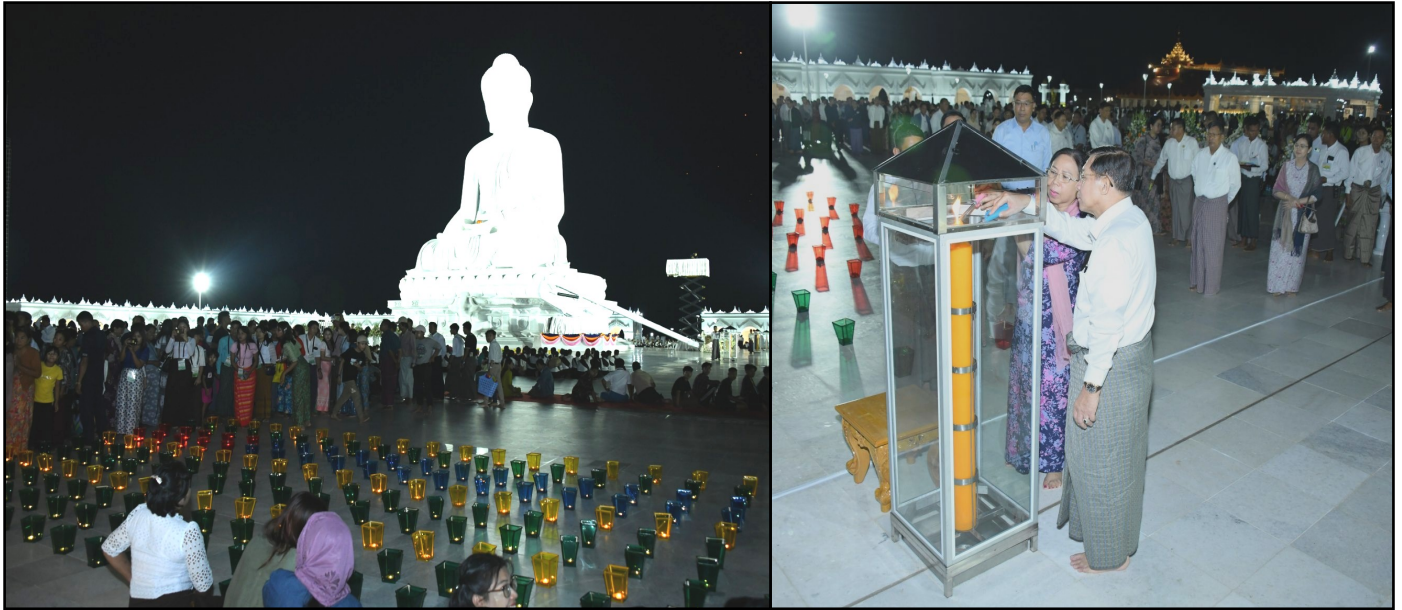
SAC Chairman Prime Minister and wife offering lamps to the Maravijaya Buddha Image

A ceremony to release hot-air balloons of Tazaungdine Lighting Festival was held at the Maravijaya Buddha Image in Dekkhinathiri Township of Nay Pyi Taw Union Territory starting from 25 November. In this regard, the Chairman of the State Administration Council (SAC) Prime Minister Senior General Min Aung Hlaing and wife Daw Kyu Kyu Hla, together with a large crowd of pilgrims who came to pay homage to the Buddha Image, enjoyed the launching of fireworks, Nya Mee Gyi and Sein Na Pan hot-air balloons to the Maravijaya Buddha Image which was held in the Maravijaya Buddha Park on 27 November.