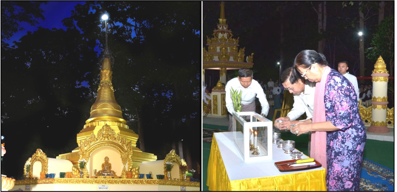
SAC Chairman Commander-in-Chief of Defence Services and wife offering flowers and water to the Shwe Phone Pwint Pagoda