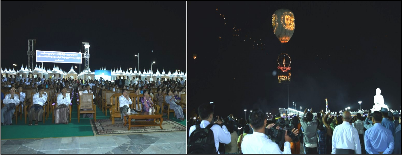
SAC Chairman Prime Minister and wife enjoying the release of fireworks and hot-air balloons dedicating to the Maravijaya Buddha Image