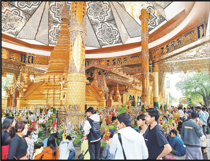
A famous pagoda in Kyaukse Township