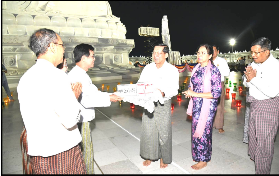
SAC Chairman Prime Minister and wife presenting cash awards to weaving teams in the first golden lotus robe-weaving contest