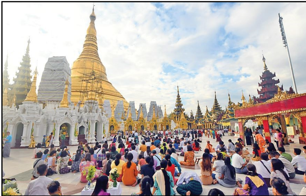
A famous pagoda in Yangon City