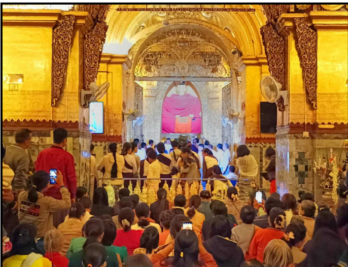
A famous pagoda in Mandalay City