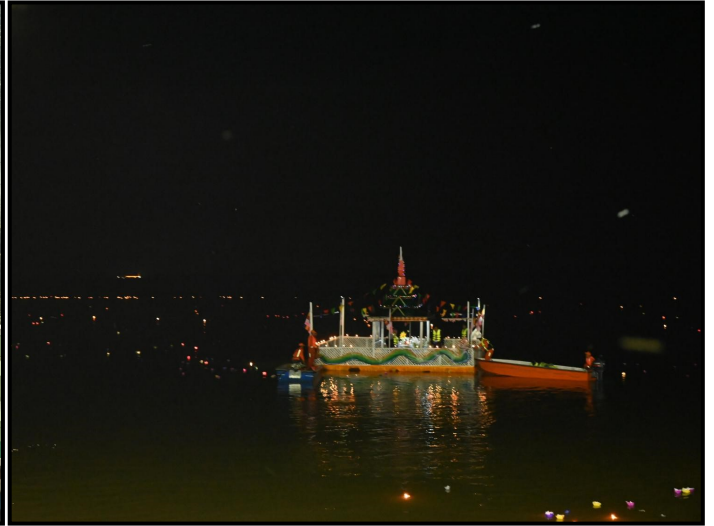
Holding the ceremonies to set Shin Uppagutta Image and 9,000 oil lamps adrift in the water at the religious edifices of Kachin State