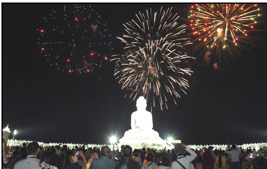
Launching fireworks and small hot-air balloons dedicating to the Lord Buddha at the Maravijaya Buddha Image