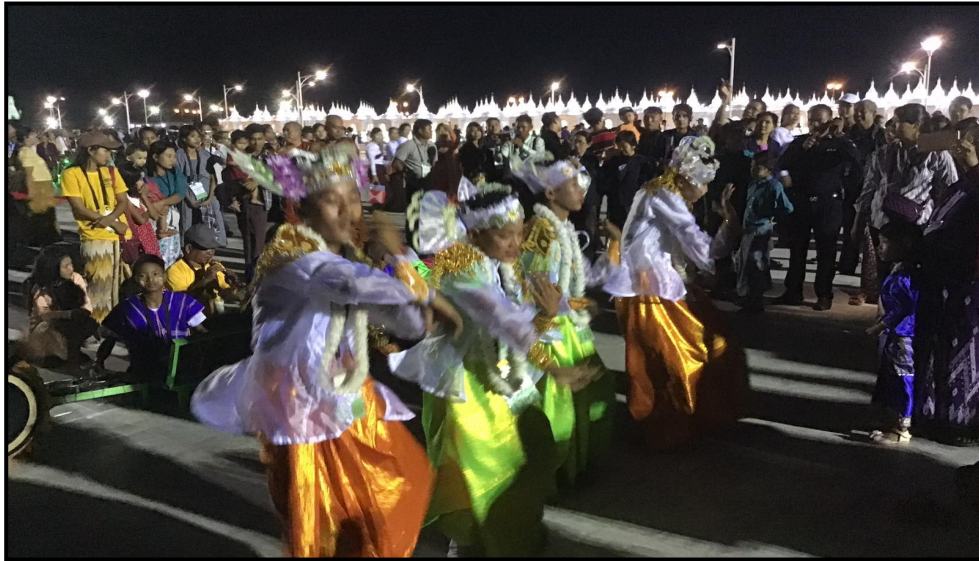
Tazaungdine Lighting Festival in Nay Pyi Taw Union Territory