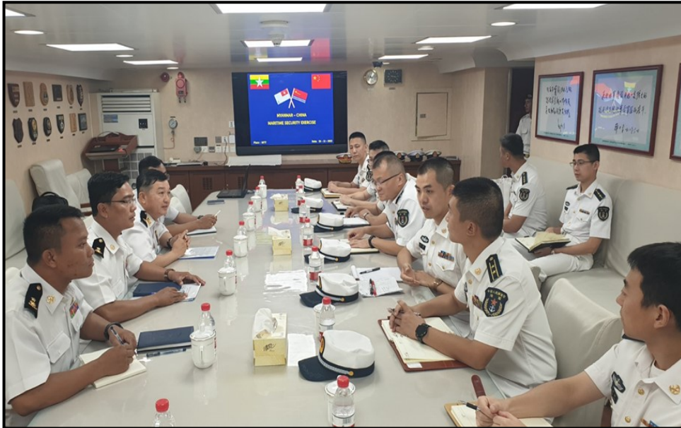
Chinese goodwill delegation from the Navy Escort Task Group of People's Liberation Army and officials from Myanmar Navy holding discussion on the maritime security exercise to be conducted