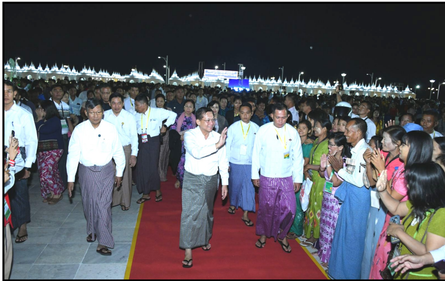
SAC Chairman Prime Minister and wife cordially greeting the pilgrims visiting to the Tazaungdine Lighting Festival of the Maravijaya Buddha Image