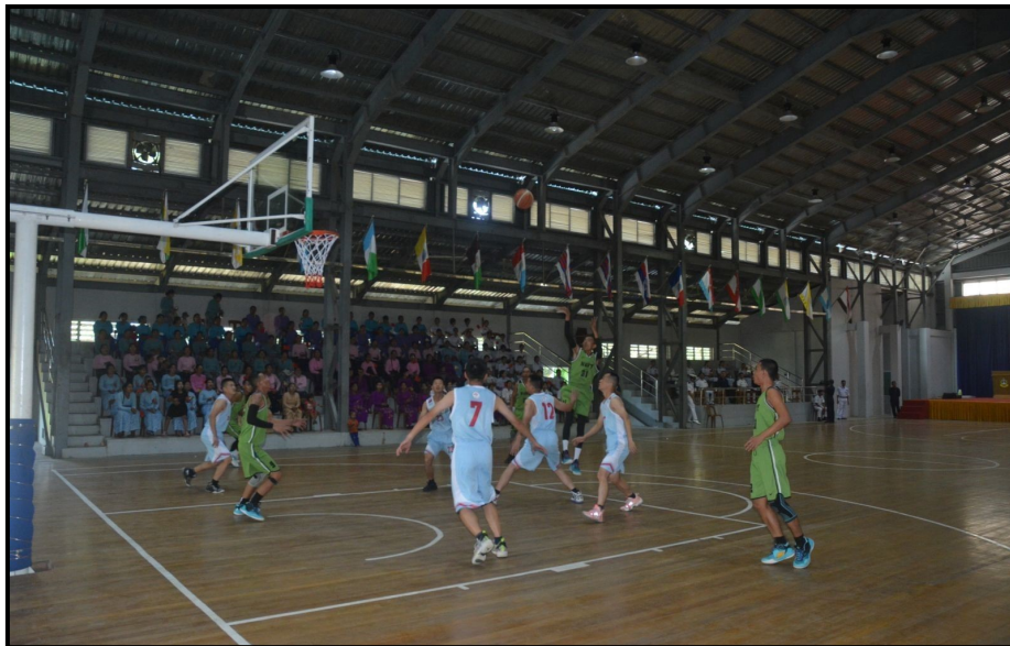
Officers and other ranks from PLA Navy Escort Task Group and Myanmar Navy participating in the friendship sports event