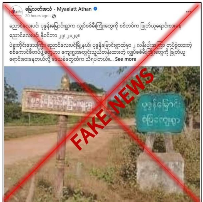
The above screenshots describing terrorist groups spreading disinformation in Burmese language on social media to cause unrest and misunderstand the Tatmadaw