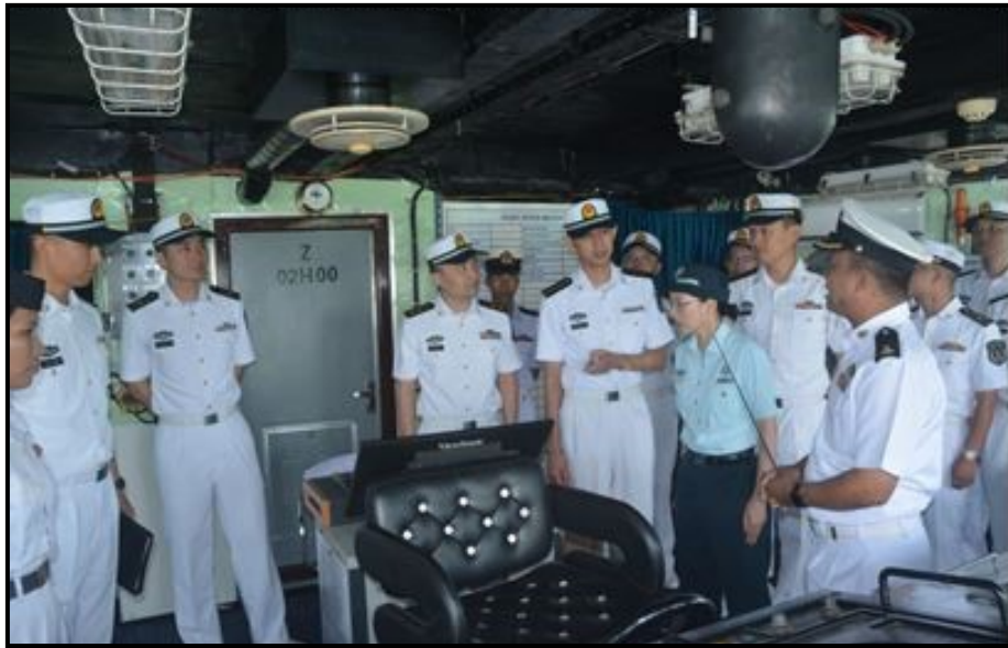
Officers and other ranks from PLA Navy Escort Task Group visiting the UMS Kyansitta