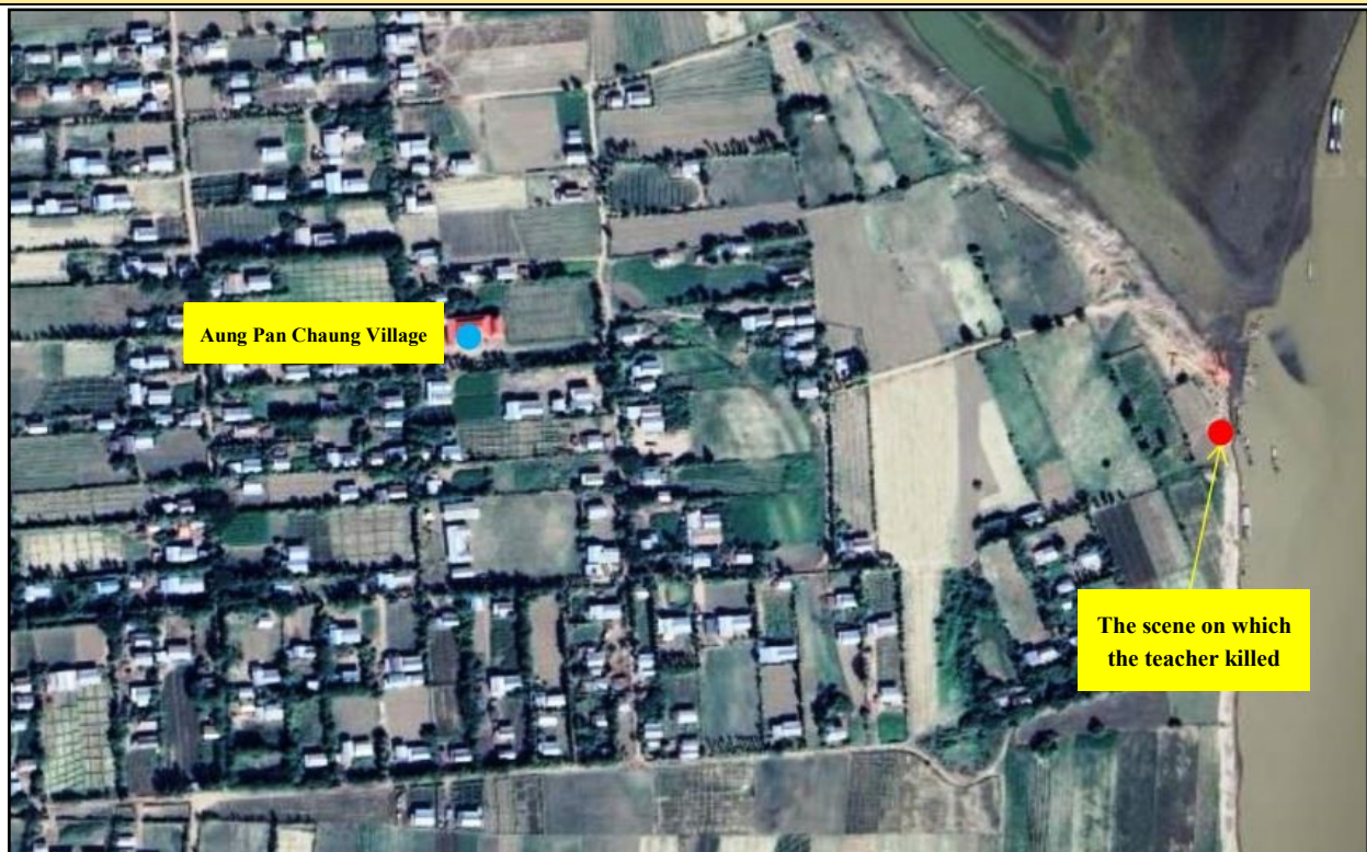
Map showing the scene of killing the teacher by PDF terrorist group

NUG and CRPH and their subordinates PDF, declared as terrorist groups by the Government, are lawlessly committing acts of terrorism such as brutal killings of those who differ with them including monks, civil servants, administrative officials and peaceable civilians by accusing them of spies, informants, and decoys in order to strike terror into the public.