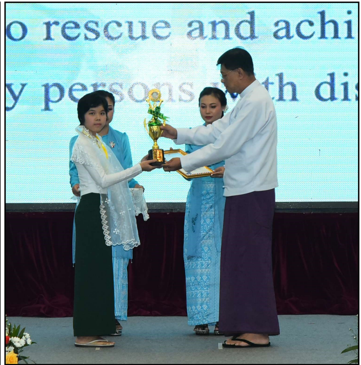
Union Minister General Mya Tun Oo presenting prize in honour to a winner in the high school-level essay competition

Later, the SAC Vice-Chairman Deputy Prime Minister Vice-Senior General Soe Win took a commemorative photo together