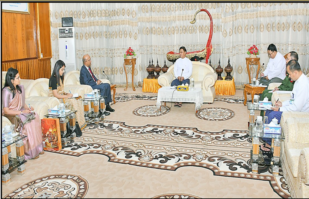
Union Minister Admiral Tin Aung San receiving Ambassador of India to Myanmar H.E. Mr. Vinay Kumar

Member of the State Administration Council, Deputy Prime Minister and Union Minister for Defence Admiral Tin Aung San and Deputy Prime Minister and Union Minister for Foreign Affairs U Than Swe received Ambassador of India to Myanmar H.E. Mr. Vinay Kumar in Nay Pyi Taw on 29 November.