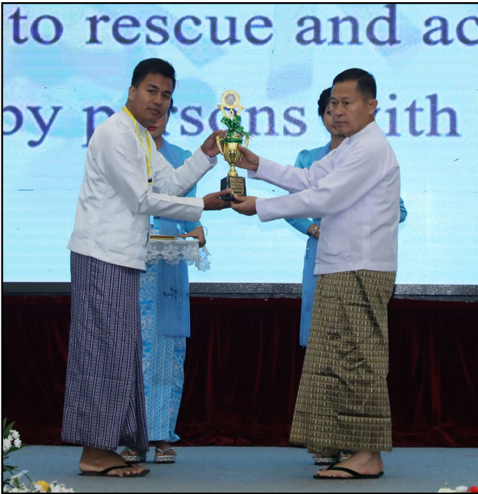
SAC Vice-Chairman Deputy Prime Minister Vice-Senior General Soe Win presenting prize in honour to a winner in the open article contest

Then, the youths with disabilities from the School for the Deaf (Mandalay) and the School for the Disabled Children (Yangon) performed the Enaung Dance, and U Shwe Yoe and Daw Moe dance (traditional dance) respectively.