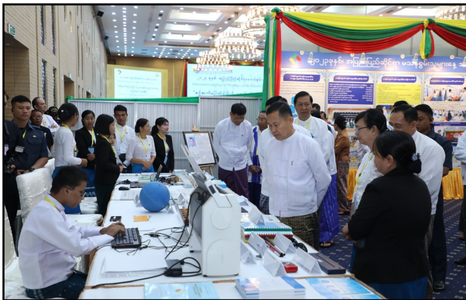
SAC Vice-Chairman Deputy Prime Minister and party viewing round the books, handiworks and documentary photos related to the persons with disabilities displayed at the ceremony