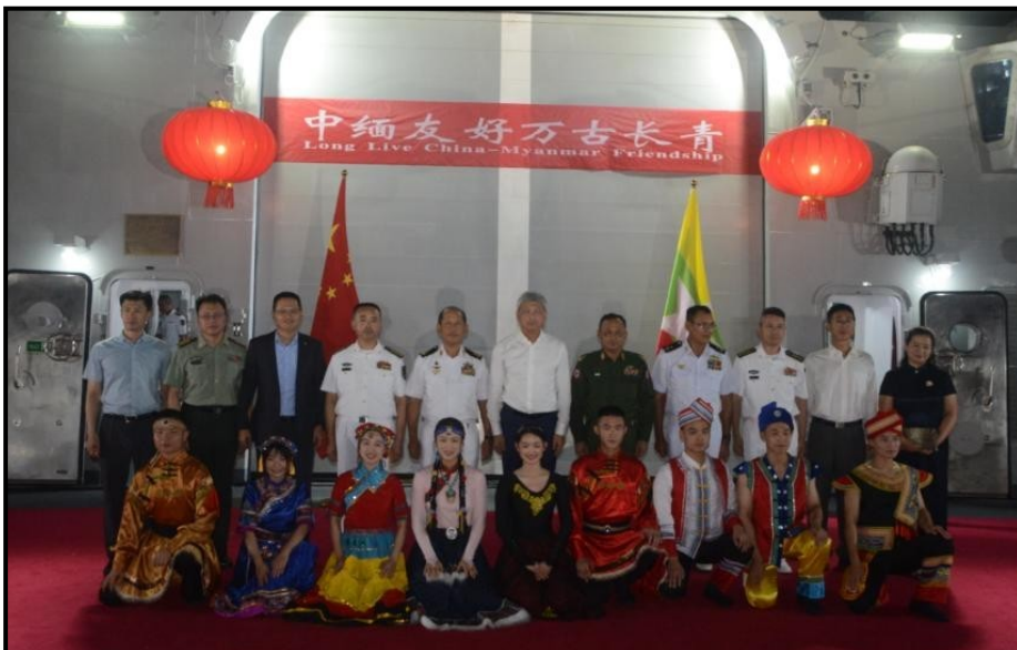
Commemorative photo taken with the delegates from PLA Navy Escort Task Group