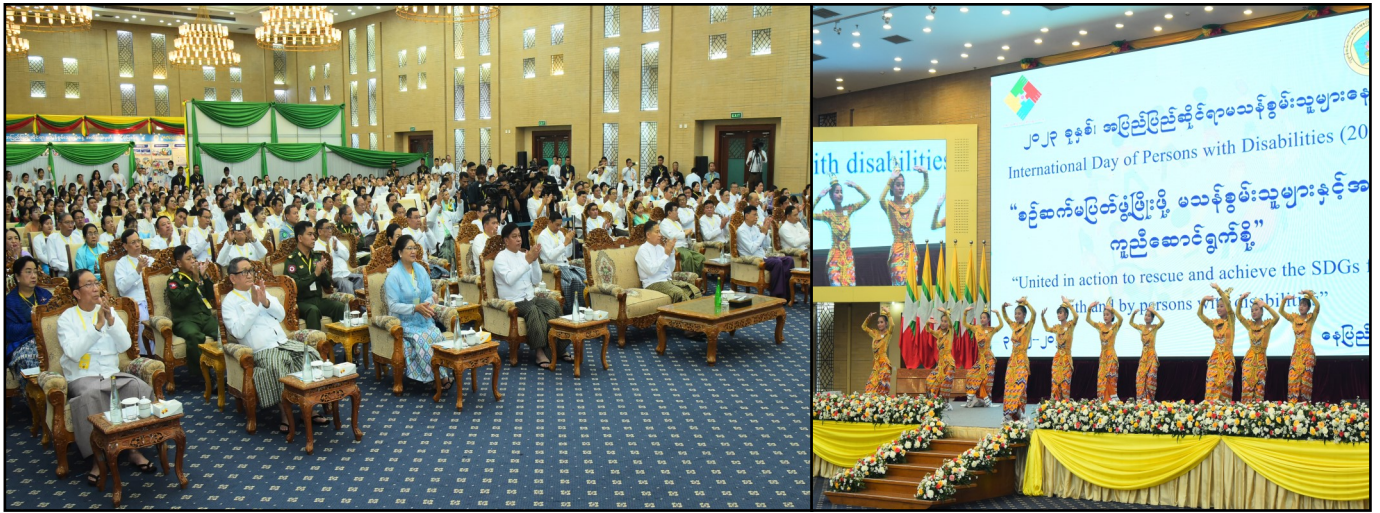
SAC Vice-Chairman Deputy Prime Minister and dignitaries enjoying the Enaung Dance performed by the youths with disabilities from the School for Deaf (Mandalay)