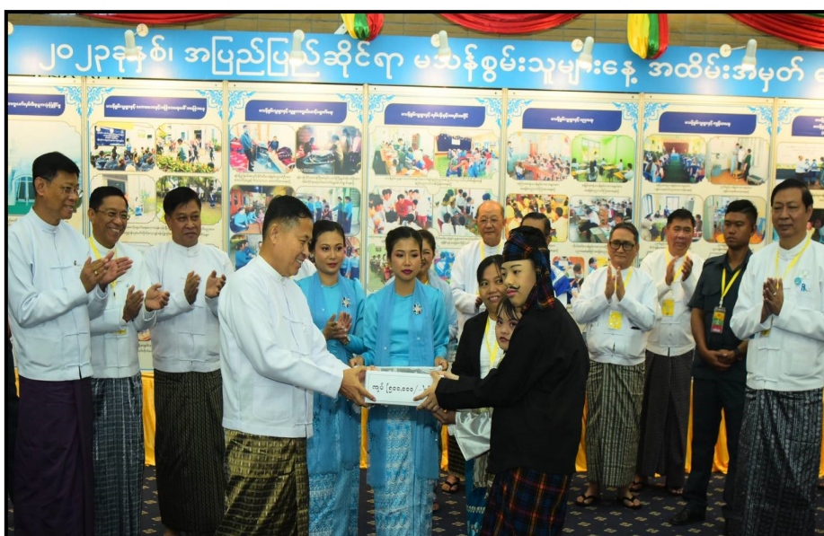
SAC Vice-Chairman Deputy Prime Minister presenting cash rewards to the youths with disabilities who performed dances at the event