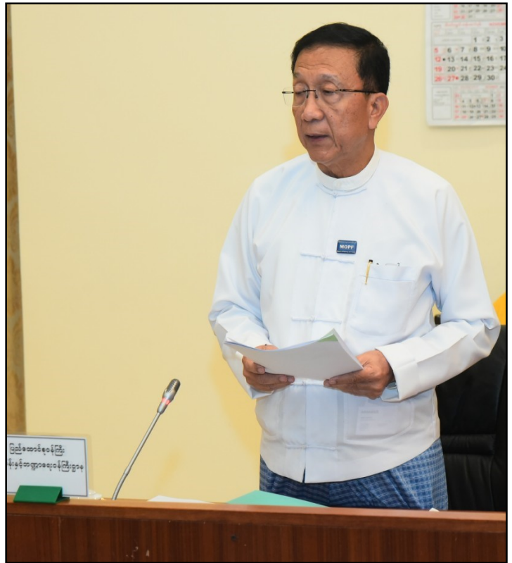
Union Minister U Win Shein making explanations before the meeting