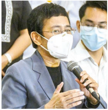
High-profile Philippine journalist Maria Ressa, co-founder of online news outlet Rappler, meets the press in Manila on June 15, 2020, shortly after she was found guilty of “cyber-libel” by a Manila court.

MANILA — High-profile Philippine journalist Maria Ressa, co-founder of online news outlet Rappler, was on Monday found guilty of “cyber-libel” by a Manila court, CNN Philippines reported.