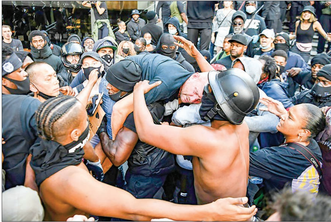
Black Lives Matter demonstrators clashed with rival groups in London.

“We need to tackle the substance of the problem, not the