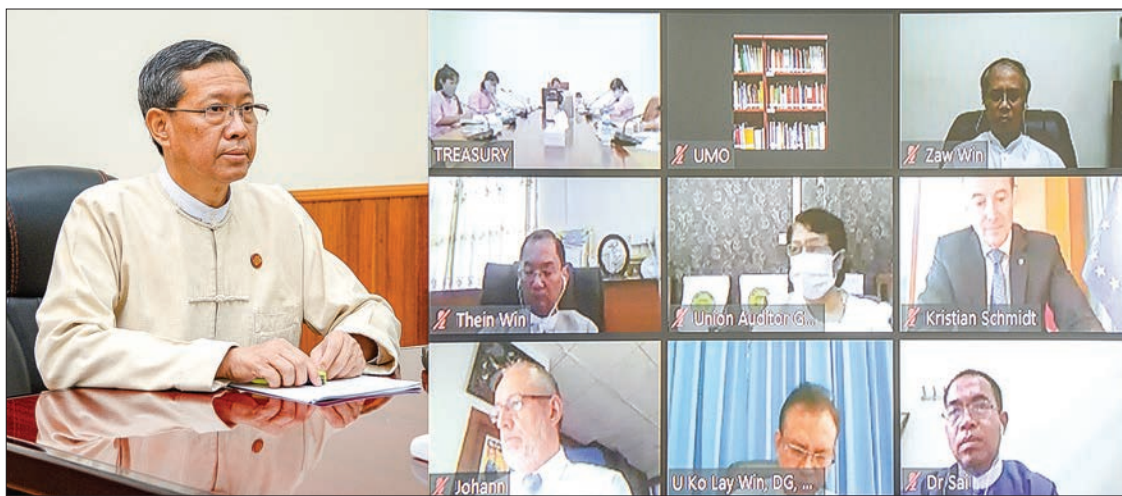
Union Minister for Education Dr Myo Thein Gyi (left photo) holds a virtual meeting with the delegation led by EU Ambassador Mr Kristian Schmidt on 15 June 2020.

UNION Minister for Education Dr Myo Thein Gyi held a videoconference with EU Ambassador Mr Kristian Schmidt and delegation on the works for education sector yesterday morning.