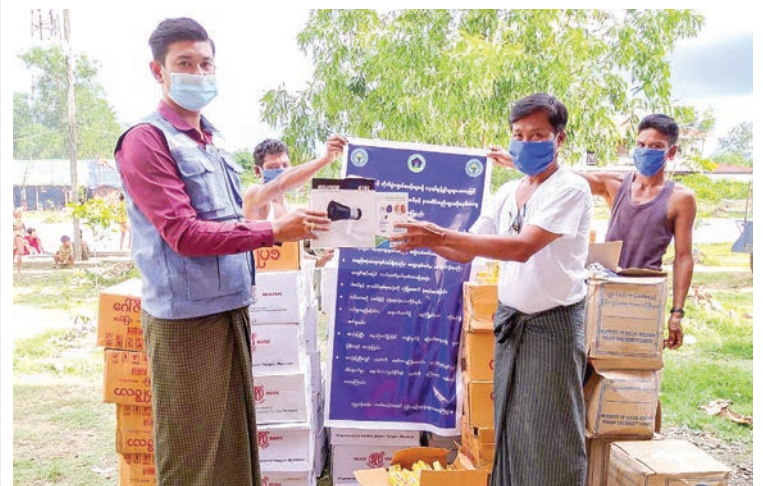
An official (left) presents the hand speaker to a local man as part of MoSWRR's efforts to fight against COVID-19.