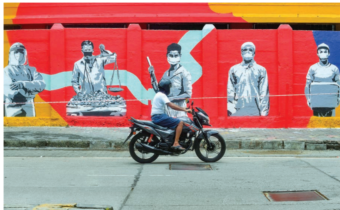
A motorist drives past a wall mural painted to thank frontline workers fighting against the spread of the COVID-19 coronavirus, in Mumbai on June 15, 2020.

The United States has the most deaths, with 115,732, followed by Brazil with 43,332, Britain with 41,698, Italy with 34,345 and France with 29,407 fatalities.