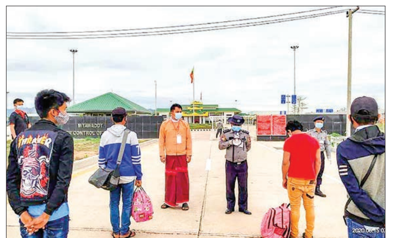
Myanmar citizens returned from Thailand queue at the Myawady border on 15 June 2020.