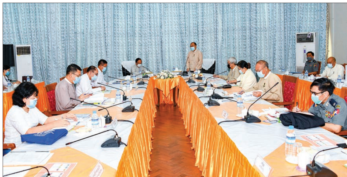
Union Minister for Transport and Communications U Thant Sin Maung speaks during the meeting on safety requirements of helmet in Nay Pyi Taw on 15 June 2020.

Director-General U Zaw Min Oo from the Department of