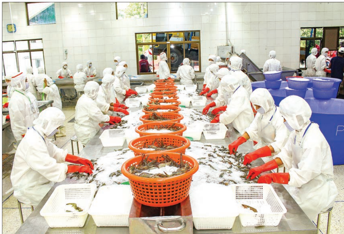
Female workers sort shrimp at a cold storage factory in Kawthoung.

Myanmar's exports between 1 October and 5 June in the 2019-2020 financial year shot up to US$12.1 billion from $11.6 billion registered in the corresponding period of the previous fiscal, according to data from the Ministry of Commerce.