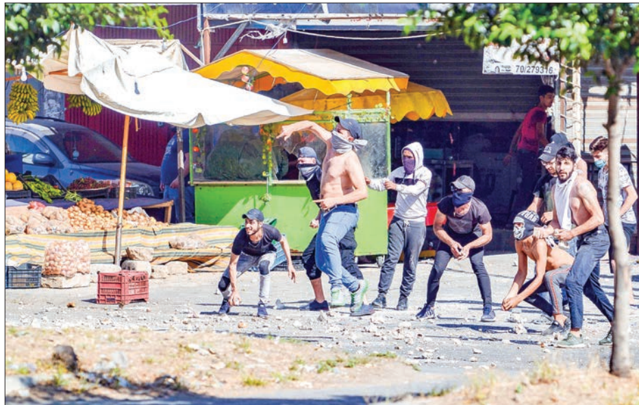
Lebanese anti-government protesters hurl rocks at soldiers amid clashes in the Bab al-Tabbaneh neighbourhood in the northern port city of Tripoli, on June 13, 2020, on the third consecutive day of angry demonstrations across the country due to a deepening economic crisis.

Lebanese media reported that the exchange rate had tumbled to 6,000 per dollar on the black market early on Friday, compared to the official peg of 1,507 in place since 1997.