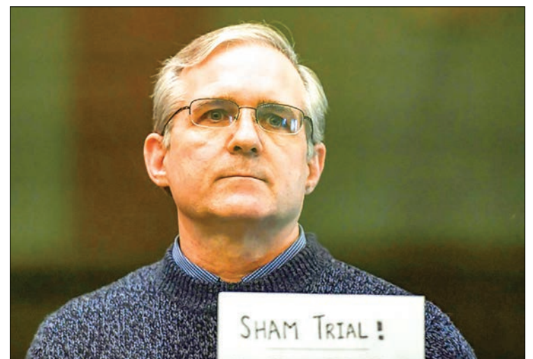
Paul Whelan blasted the case as a ‘sham trial’ as he stood in the dock.

“Russia thought they caught James Bond on a spy mission, in reality they abducted Mr Bean on holiday,” he said.