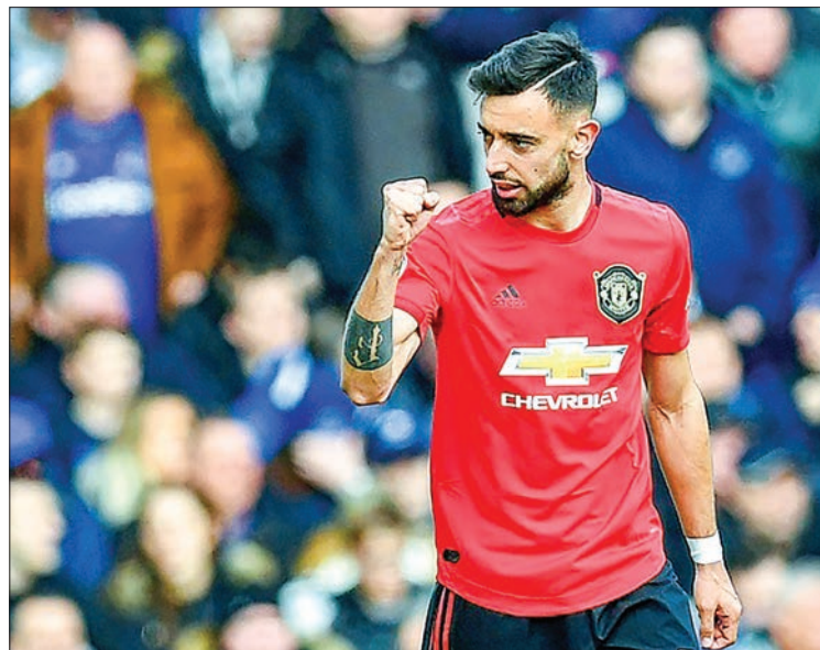
Inspired by Bruno Fernandes, Manchester United hope for a strong end to the season.

However, no boss has benefited more from the three-month break than Mourinho and eighth-placed Tottenham will return rejuvenated after Harry Kane, Son Heung-min, Steven Bergwijn, Erik Lamela and Moussa Sissoko regained their fitness. —AFP ■