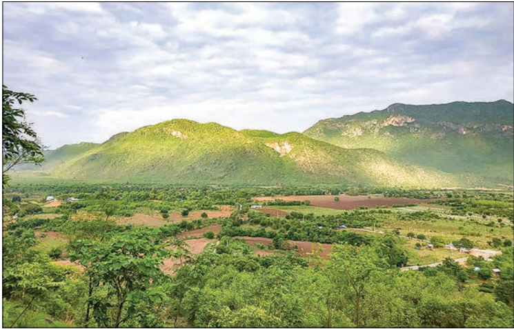
Wanet and Deedote elephant camps between Mandalay and PyinOoLwin offer spectacular views.