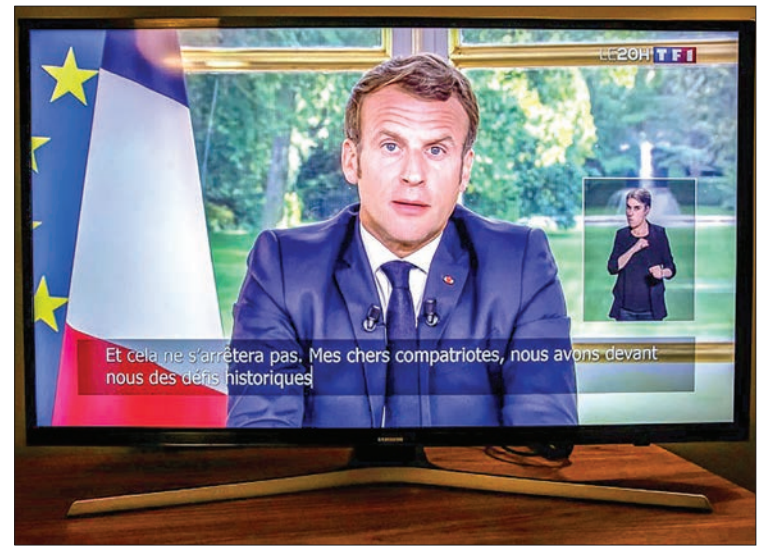
France and Africa need to find a 'present and future' acceptable to both, said Macron.

In a sign of the sensitivities in France, former prime minister Jean-Marc Ayrault had Saturday urged a new designation for a hall in parliament named after the 17th-century statesman Jean-Baptiste Colbert. It was Colbert who drew up the “Code Noir” that defined the conditions for slavery.—AFP ■