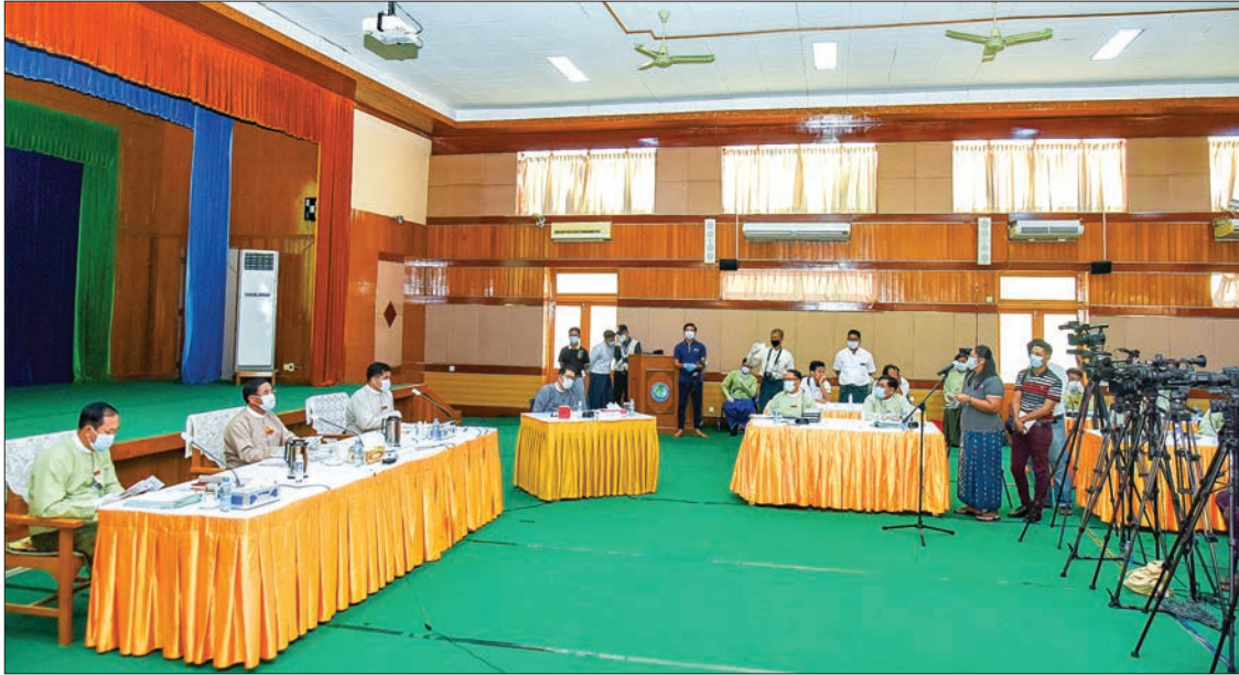
Senior officials from Ministry of Union Government Office give press briefing on their 4 th -year performances in Nay Pyi Taw on 15 June 2020.

T HE Ministry of Union Government Office, the Ministry of Construction and the Central Bank of Myanmar presented their 4 th -year performances in press briefings in Nay Pyi Taw yesterday.