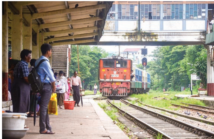
Passengers wait for the train at a railway station in Yangon.