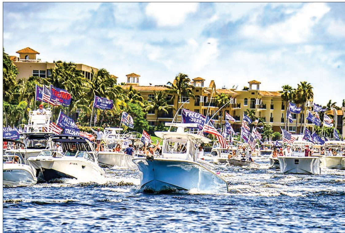
Boats in the “Trumptilla” -- a flotilla of Donald Trump supporters -- wave American flags, Trump 2020 flags and MAGA flags for the US president’s birthday on June 14, 2020 in Fort Lauderdale, Florida.

Pro-Trump flotillas for the president’s birthday also took place in Tampa, Pensacola and Sarasota on Florida’s west coast, as well as in the Keys off the state’s southern tip. The Republican Party announced Thursday that Trump will accept the GOP presidential nomination in Jacksonville following a row over coronavirus restrictions with the governor of North Carolina, where the event was originally scheduled.—AFP ■