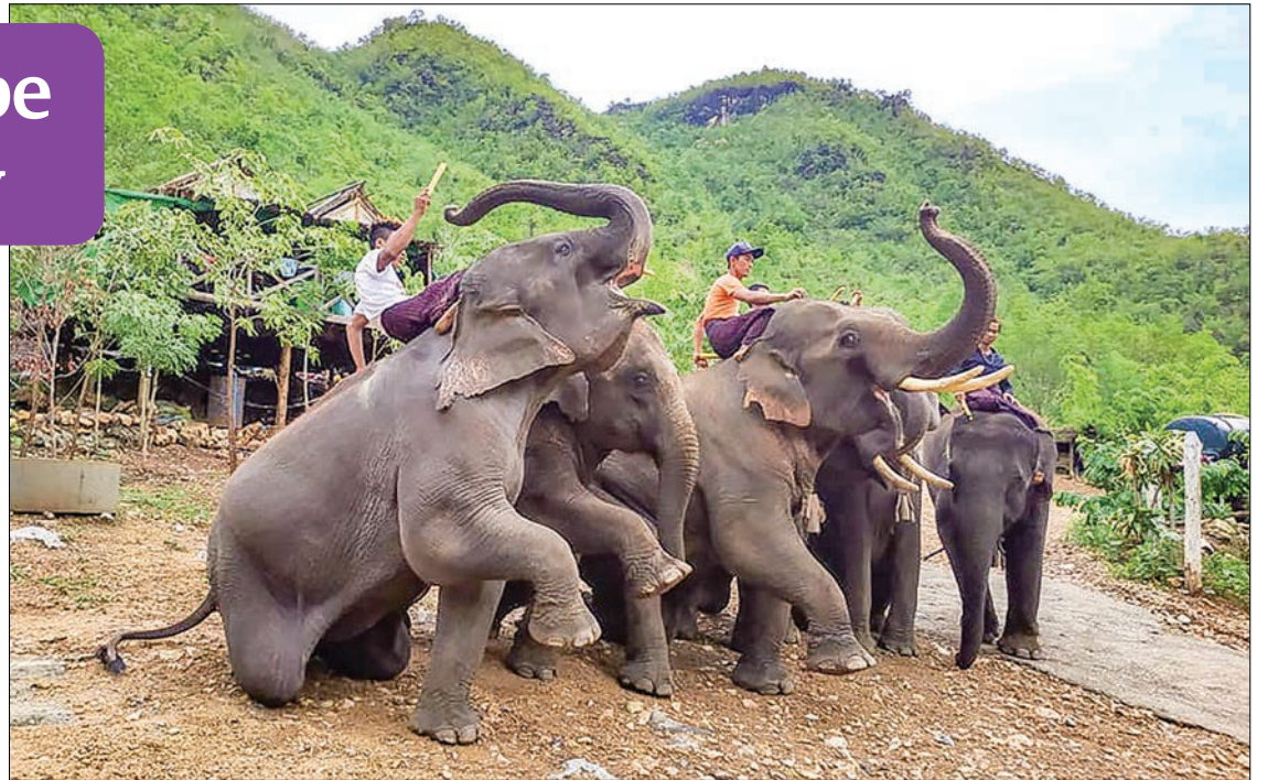
Mahouts ride elephants at an elephant camp located between Mandalay and PyinOoLwin.

cial are exploring the mountain routes for elephant riding tour at present, and the service is expected to be available in July.