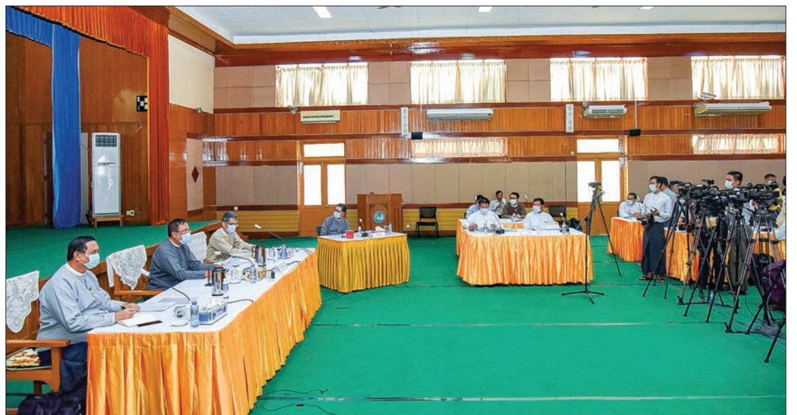
Ministry of Construction holds press conference on their fourth-year performances at the Office No.7 of Ministry of Information in Nay Pyi Taw on 15 June 2020.