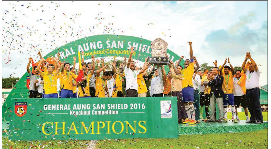
Players of Magwe FC celebrate their winning of the General Aung San Shield 2016 after the final game against Yangon United FC on 17 August 2016.

The 2020 General Aung San Shield is the sixth season of Myanmar knockout football competition. The tournament is organized by the Myanmar Football Federation. This cup succeeded the Myanmar Football Federation Cup. — Kyaw Khin ■