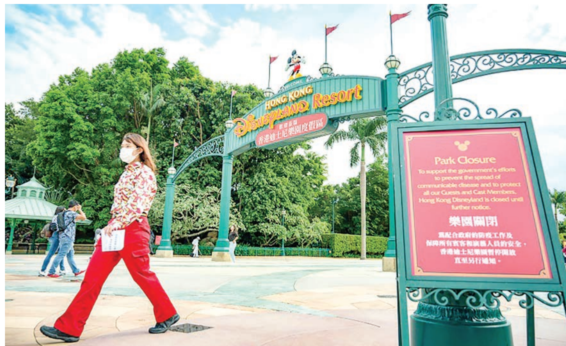
Hong Kong Disneyland is set to reopen after nearly five months of closure forced by the coronavirus pandemic.

Last year, the city was rocked by seven straight months of huge and often violent pro-democracy demonstrations and Beijing has since vowed to impose a new sweeping national security law on the business hub.—AFP ■