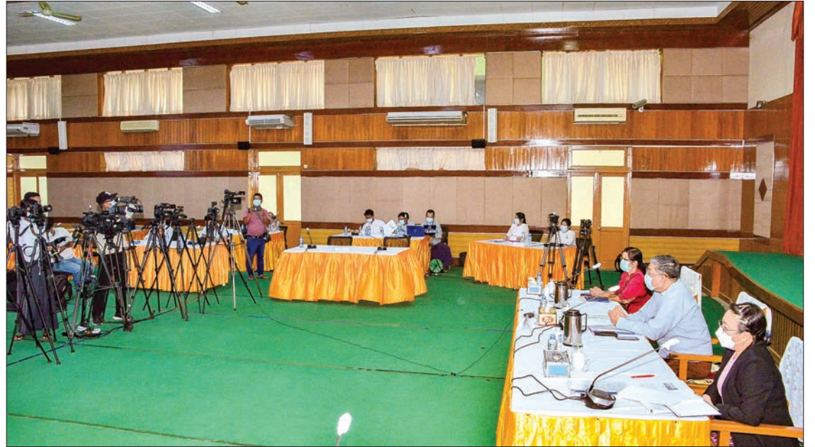
Senior officials from the Central Bank of Myanmar give press briefing on their fourth-year performances at the Office No.7 of the Ministry of Information in Nay Pyi Taw on 15 June 2020.

The CBM has conducted on-site examinations and inspections on whether banks adhere to the Central Bank of Myanmar Law and Financial Institution Law in addition to