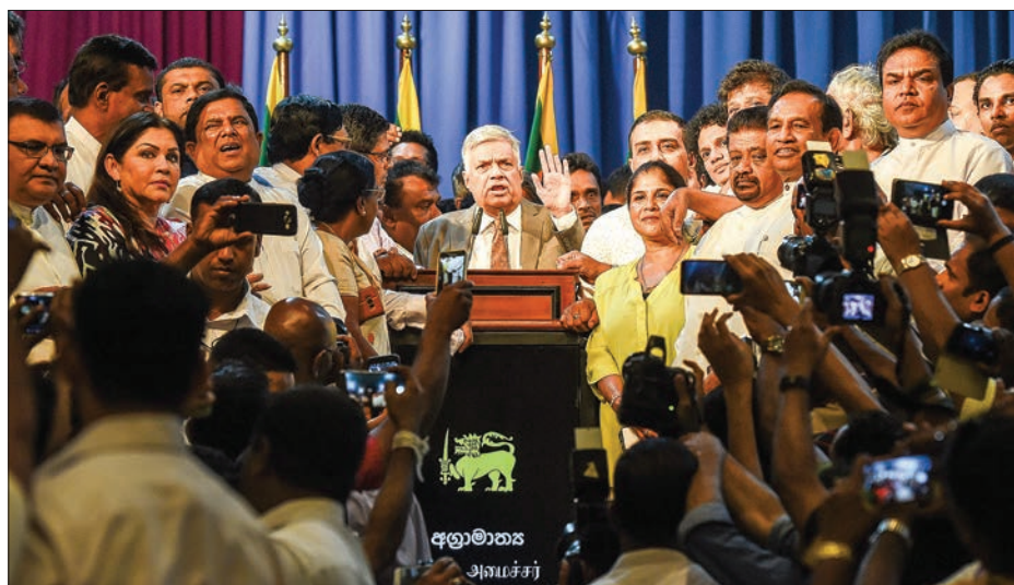
Sri Lanka's Prime Minister Ranil Wickremesinghe (C) speaks to supporters at the prime minister's official residence in Colombo on 16 December, 2018.

never reappoint Wickremesinghe—who he publicly castigated in speeches in recent weeks—as prime minister under his watch. The acrimony between the two was underscored Sunday when Sirisena barred journalists from attending the swearing-in ceremony