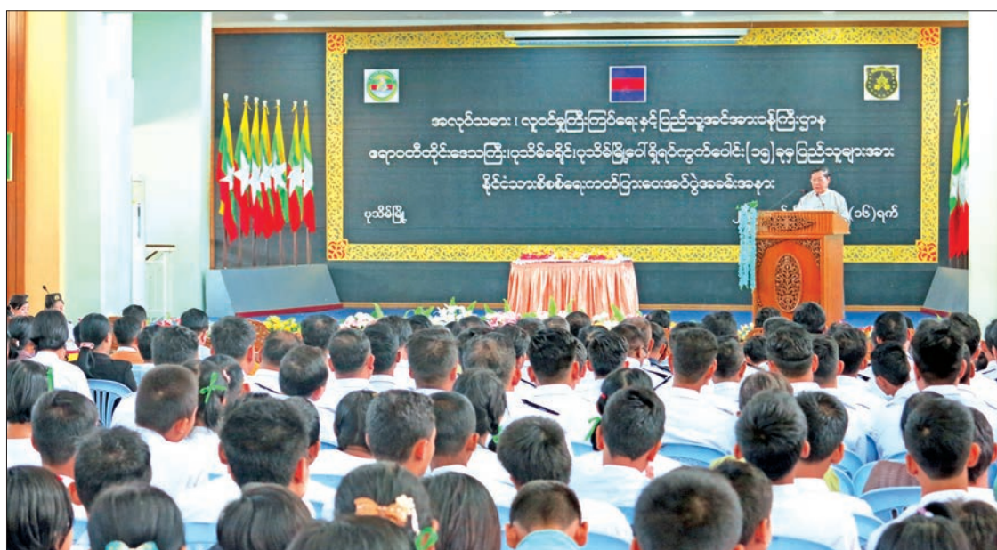
Union Minister U Thein Swe meeting with the local people at the ceremony to issue citizenship verification cards in Pathein, Ayeyawady Region.

"Today, the internal migrant people can apply the national citizenship verification cards at local offices where they are living currently and they don't need to go back to their original places to get the cards," said Union Minister U Thein Swe.