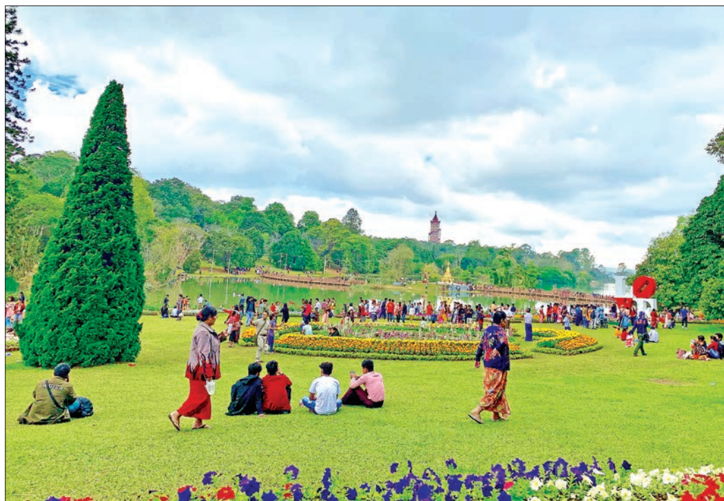
13th Flower Festival at the National Kandawgyi Lake in Pyin Oo Lwin was crowded with visitors one day after opening yesterday despite showers. The festival started on 15 December, 2018.

Due to limitation of space we are only able to publish "Letter to the Editor" that do not exceed 500 words. Should you submit a text longer than 500 words please be aware that your letter will be edited.