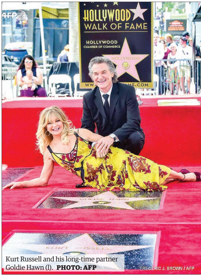
Kurt Russell and his long-time partner Goldie Hawn (l).

'(Goldie's) energy is incredible, she still looks great, she is in great shape and she is interested in things other than primarily what is going on in this town but every once in a while she ducks her head in and has some fun.—PTI ■