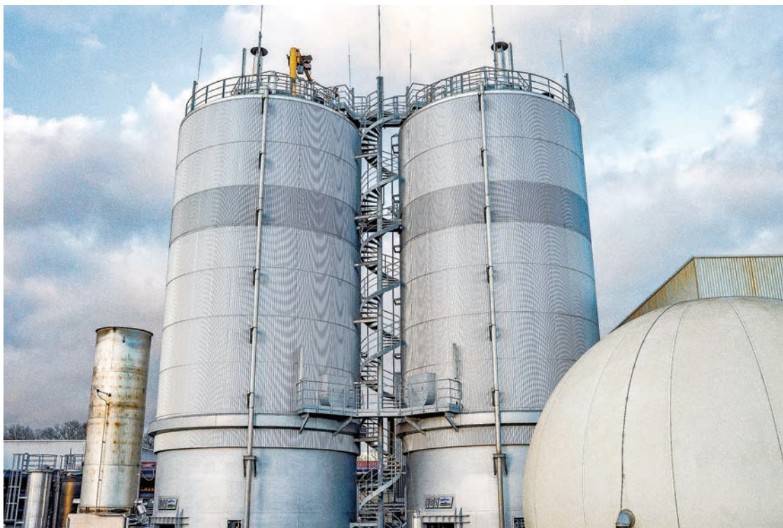
Qatar to invest $20 bn in US energy sector.

“We are contemplating moving (the project) forward with our partners,” said Kaabi, adding that a final decision on the matter would be taken shortly.