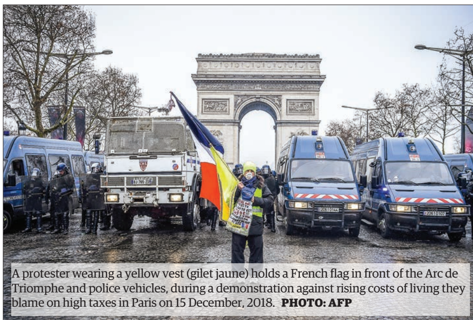
A protester wearing a yellow vest (gilet jaune) holds a French flag in front of the Arc de Triomphe and police vehicles, during a demonstration against rising costs of living they blame on high taxes in Paris on 15 December, 2018.

“Dialogue now needs to unite all those who want to transform France.” Richard Ferrand, the head of the National Assem-