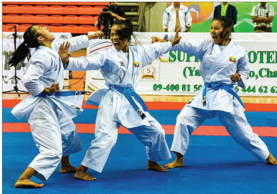
Myanmar women's Kata team performing in yesterday's Karate's Kata competition in the 19th ASEAN University Games in Nay Pyi Taw.