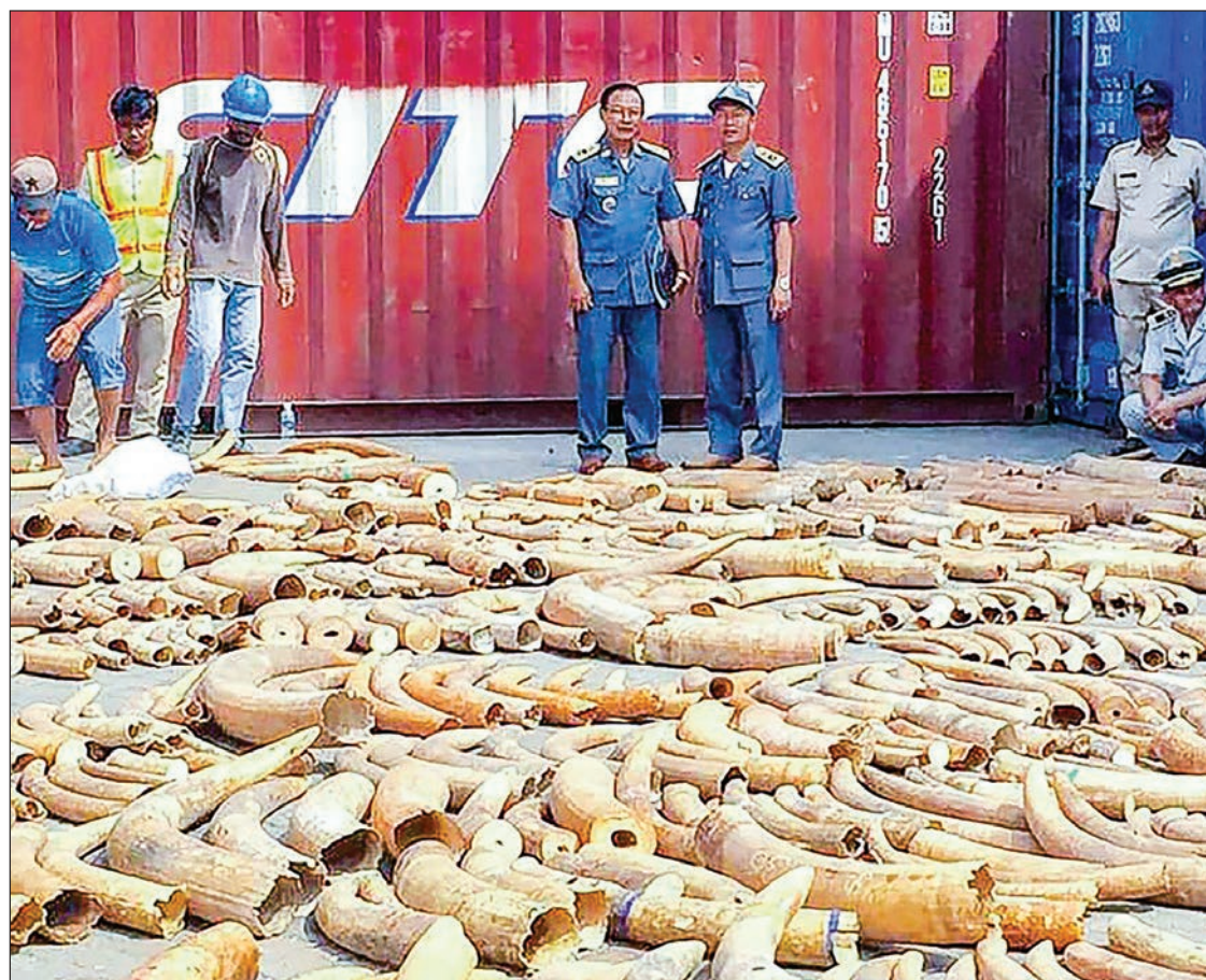
Pictures of the massive haul showed long rows of confiscated tusks spread out on the ground at the port.

Demand from China and Vietnam has fuelled the growth of illegal wildlife trafficking via Cambodia.