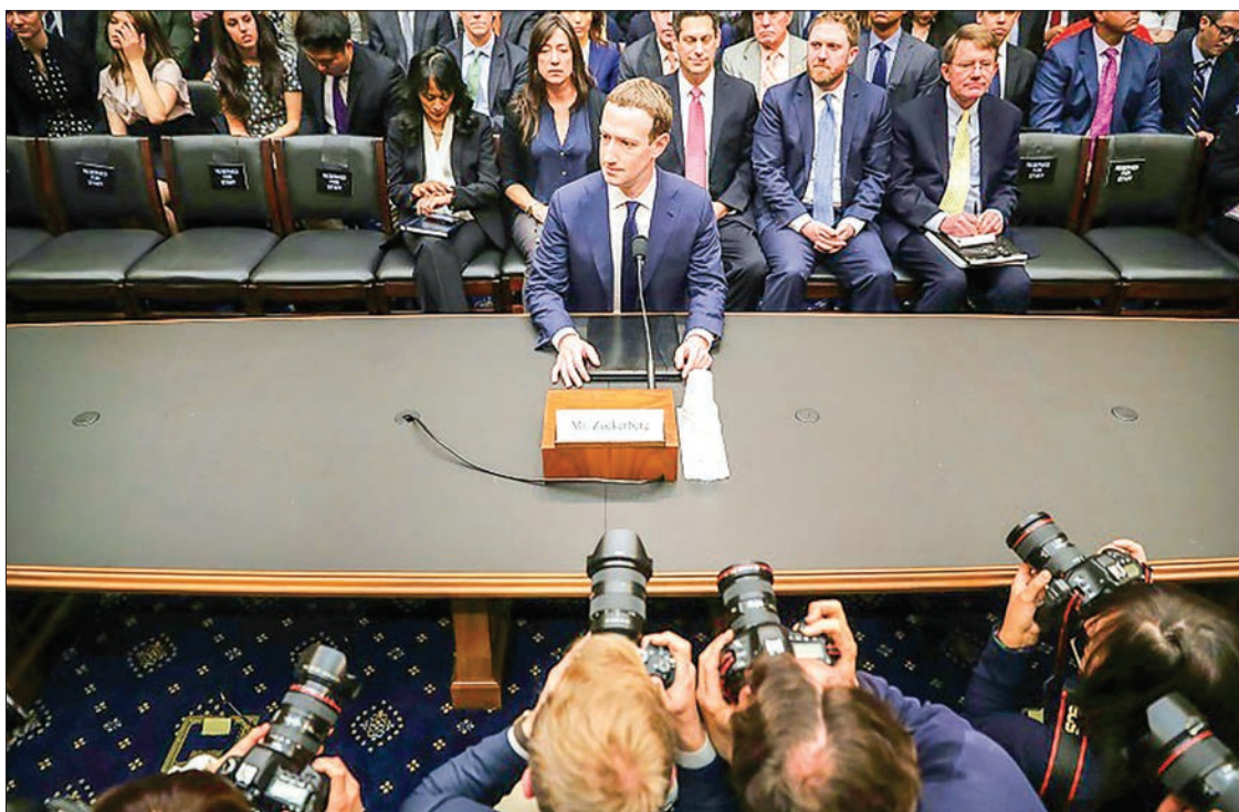
Facebook boss Mark Zuckerberg was grilled at the US Congress after the Cambridge Analytica scandal that saw mass data breaches.

Some studies even suggest that, as partisanship has risen, more people are willing to believe falsehoods. One 2017 survey, for example, showed 51 per cent of Republicans still believed that Barack Obama was born in Kenya, despite the hoax having been debunked.