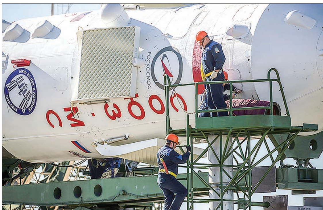
The samples from a hole and the meteorite shield in the Soyuz MS-09 spacecraft will be transferred on 20 December to the laboratory of the Federal Security Service for analysis, a source said.

Kononenko and Sergei Prokopyev made a spacewalk overnight to 12 December to inspect the hole in the Soyuz spacecraft’s casing. They unsealed the thermal insulation layer and the meteorite shield, inspected and photographed the hole and also scraped off samples from