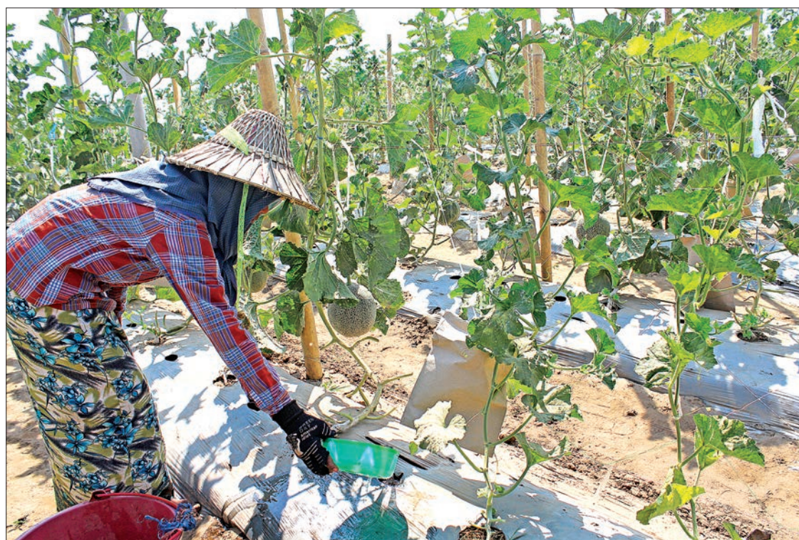
A farmer watering the plants at her farm in a village.

“It will be better if fruits such as watermelons, muskmelons, mangoes, and pomelo are allowed