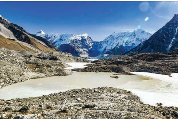
Scientists warn that as Himalayan glaciers melt, lakes like Imja could swell further and eventually collapse.