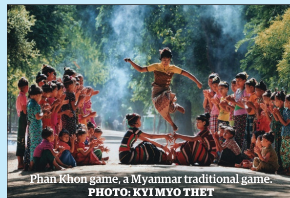
Phan Khon game, a Myanmar traditional game.

(Excerpt from the speech by State Counsellor Daw Aung San Suu Kyi on the 2nd Anniversary of NLD Government on 1 April 2018)