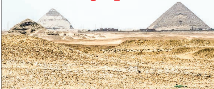
A picture taken on 14 July, 2018 shows a general view of the Saqqara necropolis south of Cairo where Egyptian antiquities officials say a new tomb belonging to a high priest and dating back more than 4,400 years.

CAIRO (Egypt)—Egyptian archaeologists have discovered the tomb of a priest dating back more than 4,400 years in the pyramid complex of Saqqara south of the capital Cairo, authorities said on Saturday. “Today we are announcing the last discovery of the year 2018, it’s a new discovery, it’s a private tomb,” Antiquities Minister Khaled el-Enany told an audience of invited guests including reporters.