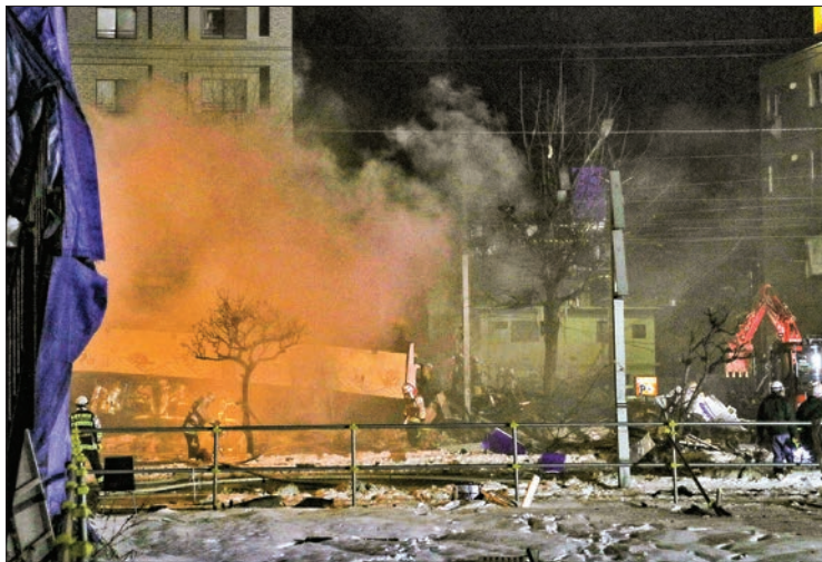
Firefighters carry on rescue works after an explosion at a restaurant in Sapporo, in the northern Hokkaido prefecture on December 16, 2018. Dozens have been injured and no casualties have been reported.

National broadcaster NHK said the flames were extinguished several hours after the fire broke out, with police and fire department officers still at