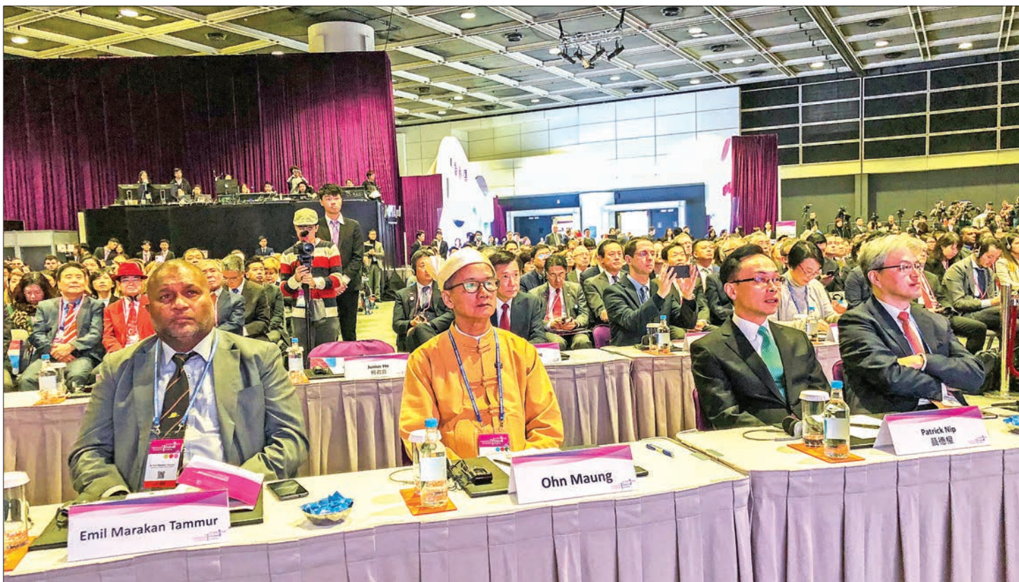
Union Minister U Ohn Maung attends Hong Kong International Tourism Conference in Hong Kong on 12 December .

T HE Union Minister for Hotels and Tourism, U Ohn Maung, attended the Hong Kong International Tourism Conference at the Hong Kong Convention in the Hong Kong Special Administration Region on 12 December and held talks with the Secretary for the Social Affairs and Culture of Macau on 15 December.