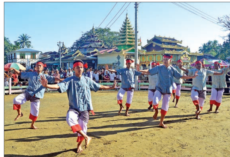
Young Rakhine men perform a Kyin dance before the Kyin traditional wrestling event.