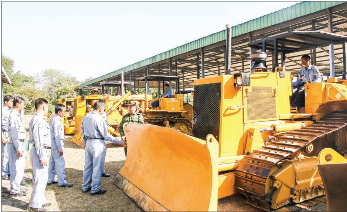
Union Minister Lt-Gen Ye Aung inspects the storage of vehicles and mechanical equipment for border region development work at the development supervision office in Meikhtila District yesterday.

UNION Minister for Border Affairs Lt-Gen Ye Aung inspected the storage of vehicles and mechanical equipment for border region development work at the development supervision office in Meikhtila District yesterday.