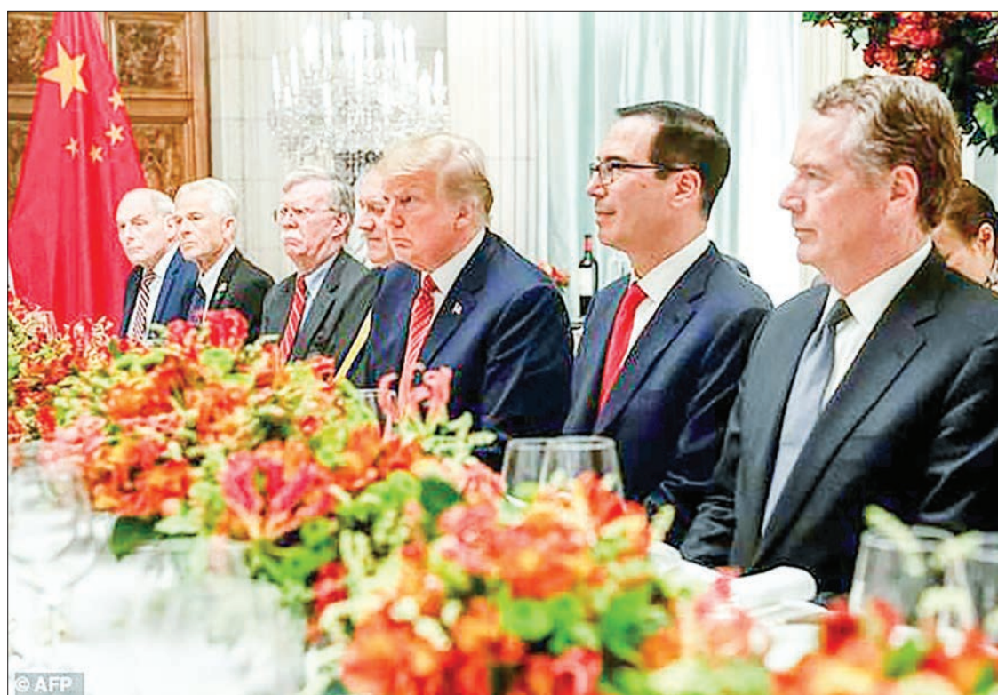
US Trade Representative Robert Lighthizer, right, will lead the talks with China.

In fact, Beijing on Friday announced that starting on 1 January it would suspend the additional pu-