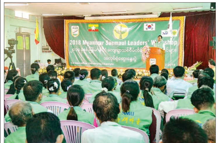
The 2018 Myanmar Saemaul Leaders' Workshop held in Thanlyin Township yesterday.

The judges selected winners based on the maximizing the effectiveness of their programs, their constructive influence on surrounding villages, the sustainability and gender equality of their programs, the application of environmental conservation methods, and the progress of the activities. Four villages were awarded prizes at the workshop. —MNA ■ (Translated by TMT)