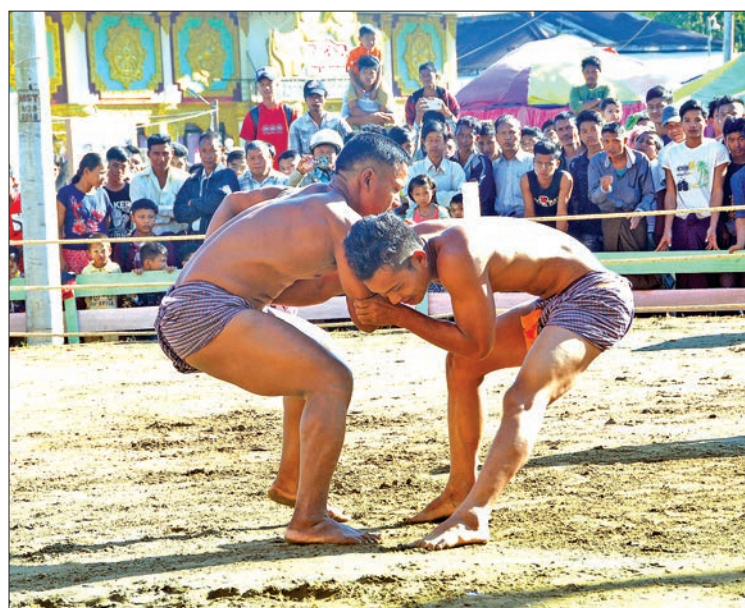
Two Rakhine men participate in traditional Kyin wrestling contest in Sittway, Rakhine State.

"KYIN, a wrestling-like sports, is an age-old tradition and the soul of the Rakhine people," said a regional cabinet member at the opening of the Kyin competition, held to mark the 44th Anniversary Rakhine State Day in Sittway.