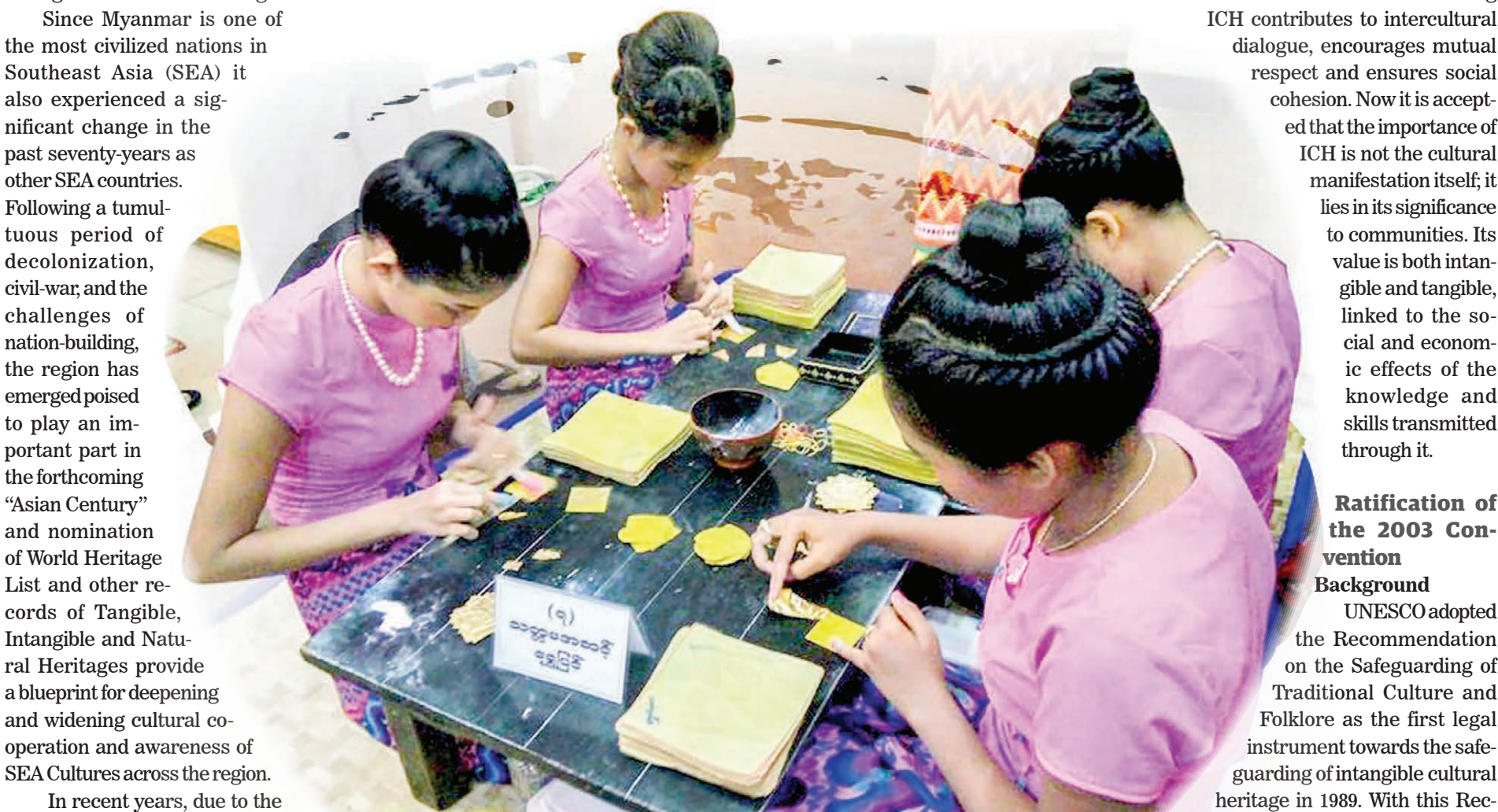
Traditional Gold Leaf Industry.

ideas of the earlier Conference in Mexico City, UN-ESCO conducted some promotional programmes for raising awareness of this Recommendation. In the late 1990s, there was a conference held for the assessment of this Recommendation, which pointed out some problems to be considered in