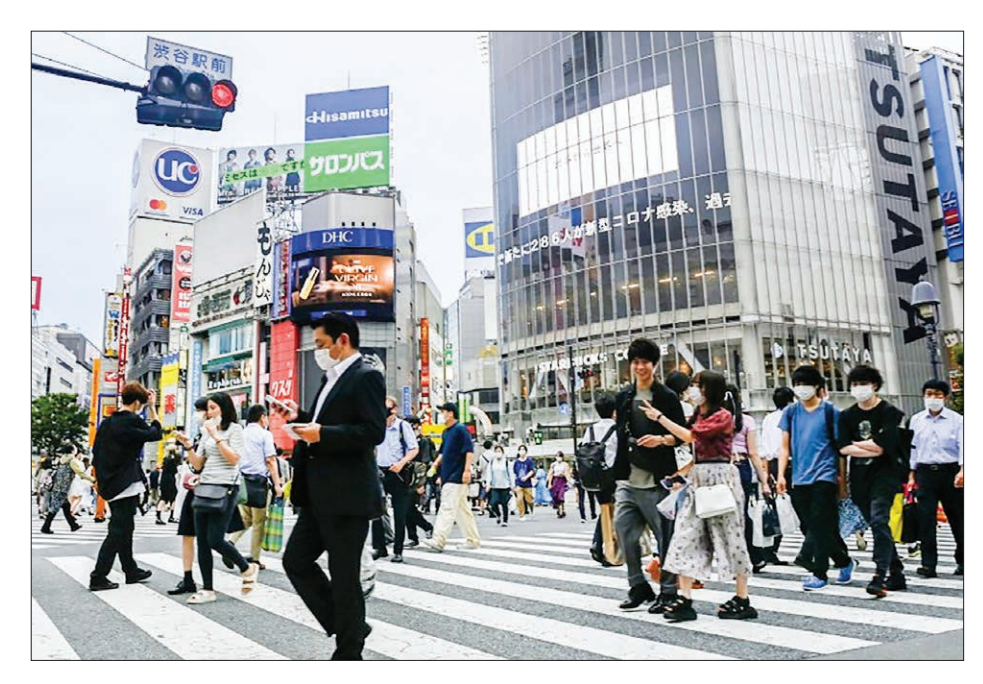
The projections were made under a scenario assuming the world's third-largest economy will achieve real growth of over 2 per cent and nominal growth of 3 per cent annually for five years from fiscal 2021, which begins next April.

Prime Minister Shinzo Abe said at a government meeting, where the estimates were presented, that the projections this time showed that the country's "mid- to long-term economic and fiscal conditions are severe," and vowed to "continue steadily promoting integrated economic and fiscal reforms."—Kyodo