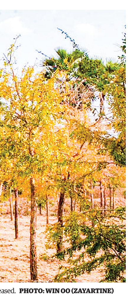
FIIO 10: WIN OO (ZAIAKTINE)