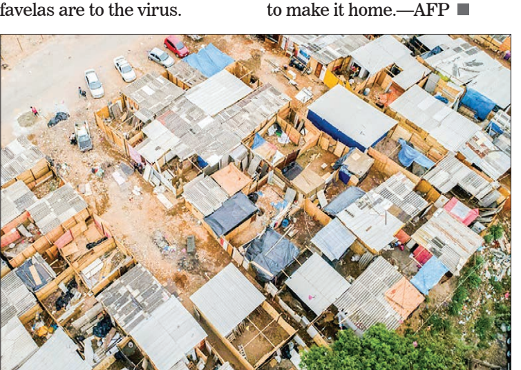
Aerial view of the Jardim Julieta favela, in the outskirts of Sao Paulo, Brazil, on July 15, 2020.

ent, highlighting how vulnerable favelas are to the virus.