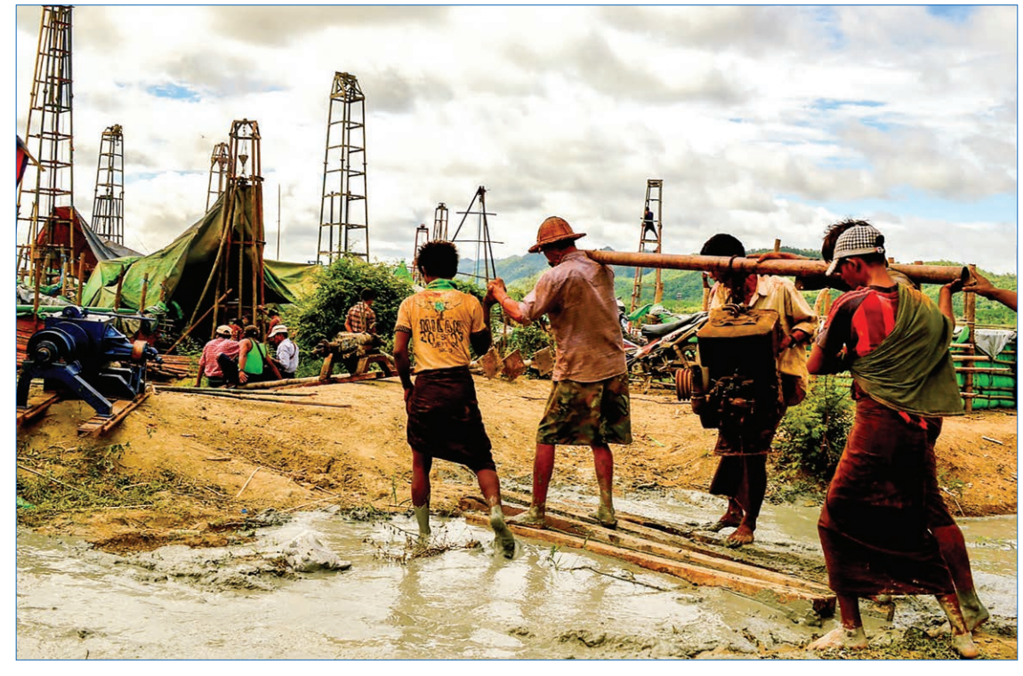
Workers carry an engine on their shoulder at a construction site in Kawthoung, Taninthayi Region on 31 July 2020.