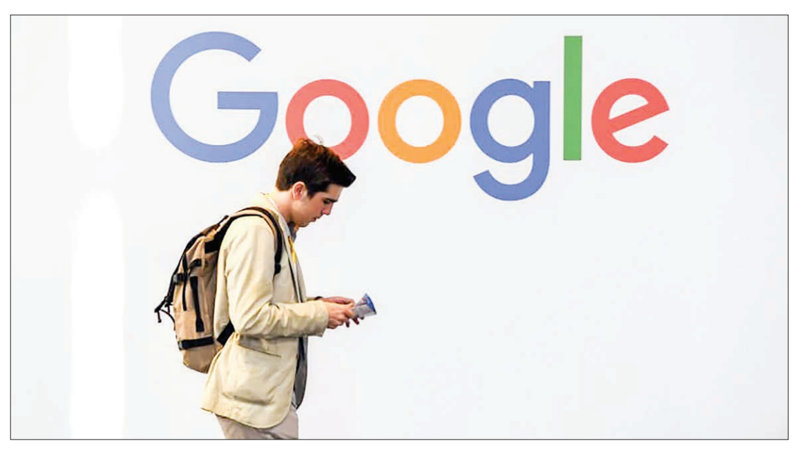
Facebook and Google have strongly opposed any move forcing them to share advertising revenue.

SYDNEY — Australia unveiled a draft law Friday (July 31) to force Google and Facebook to pay news media for their content in a "world-leading" initiative sure to prompt a confrontation with the digital giants.