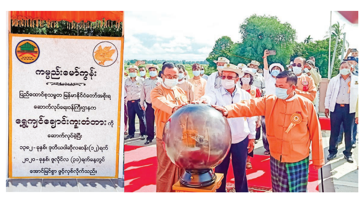
Union Minister U Han Zaw (C), Bago Region Chief Minister U Win Thein (R) and Hluttaw Speaker U Khin Maung Yin (L) unveil the Shwekyin Creek-Crossing Bridge Plaque on 31 July 2020.

UNION Minister for Construction U Han Zaw officially opened Sittoung River-Crossing Bridge (Myo Soe) in Ottwin Township and Shwekyin Creek-Crossing Bridge in Shwekyin Township, Bago Region yesterday.