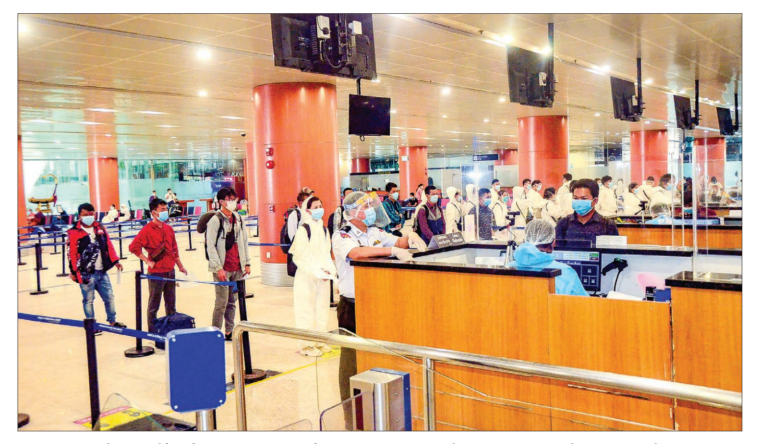
Myanmar nationals returned from foreign countries queue for immigration services at the Yangon International Airport on 31 July 2020.

RELIEF flight of Myanmar Airways International brought back 121 Myanmar nationals stranded in Jordan with the help of Myanmar embassy in Tel Aviv, and it landed at Yangon International Airport yesterday morning.