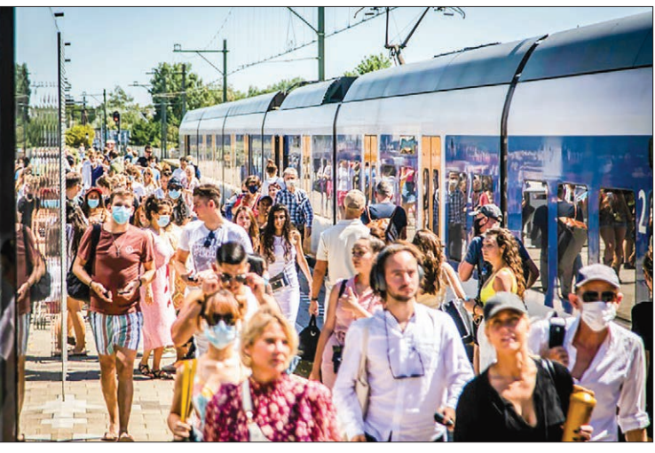
Dutch authorities warned that the beach in Zandvoort was getting dangerously crowded.

Fourteen Italian cities were placed on high alert, while France issued warnings for around one-third of the country's 101 departments. Paris officials imposed driving restrictions to limit ozone pollution as tens of thousands of vacationers prepared to flee to cooler climes, according to the nation's traffic surveillance agency.