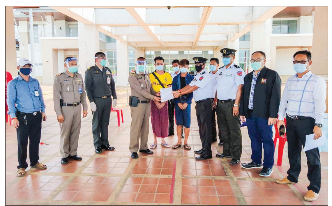
Myanmar and Thai officials exchange documents on transfering two Thai nationals in Tachilek on 31 July 2020.