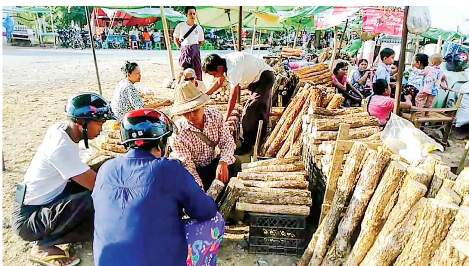
Myanmar Thanaka bark being sold in the market.