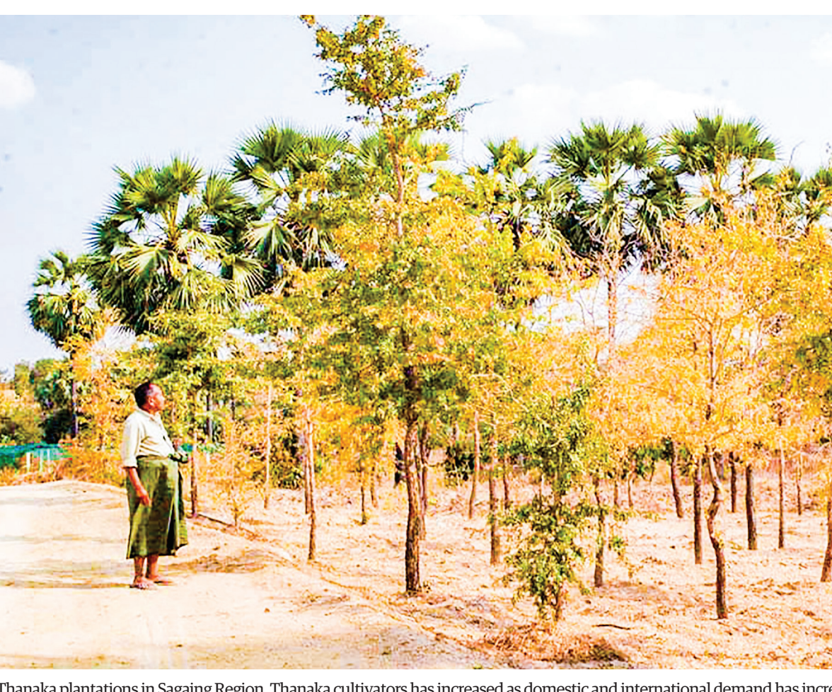
Thanaka plantations in Sagaing Region. Thanaka cultivators has increased as domestic and international demand has increased

Since Myanmar is one of the largest repositories of tangible heritage in the world, a major part of this heritage has been preserved through ancient monuments, sites and antiquities of varied nature. The range of