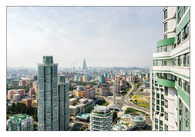
Construction in North Korea turned positive last year, Seoul said, as did the agriculture, forestry and fishing sector.

resented the second consecutive contraction in the face of increasingly tough international sanctions over its banned weapons programmes. But construction turned positive last year, the BOK said in a statement, as did the agriculture, forestry and fishing sector, while contraction in mining and manufacturing narrowed.