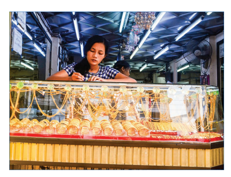
(FILES) Salewomen wait for customers at a gold shop in Yangon on 11 April 2017.