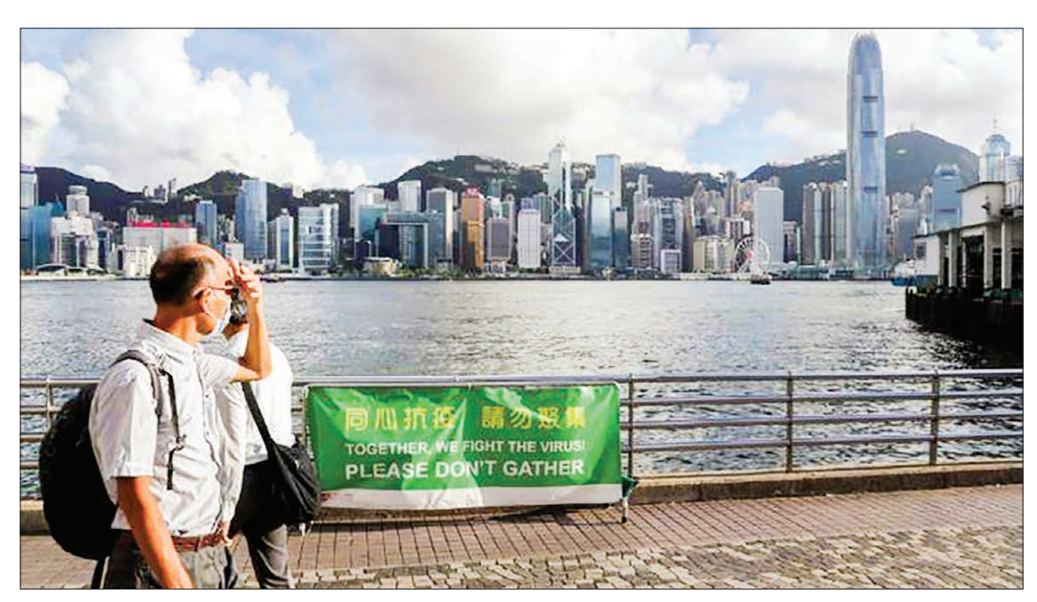
The Legislative Council election, which was set for Sept. 6, is now scheduled to be held on Sept. 5, 2021, to curb the epidemic, protect the health and safety of people and ensure a fair and open election.

HONG KONG — Hong Kong's September legislative election will be postponed for a year due to health concerns amid the coronavirus pandemic and China's parliamentary advice will be sought for setting a legal basis to extend incumbent lawmakers' term of office, government leader Carrie Lam announced Friday.