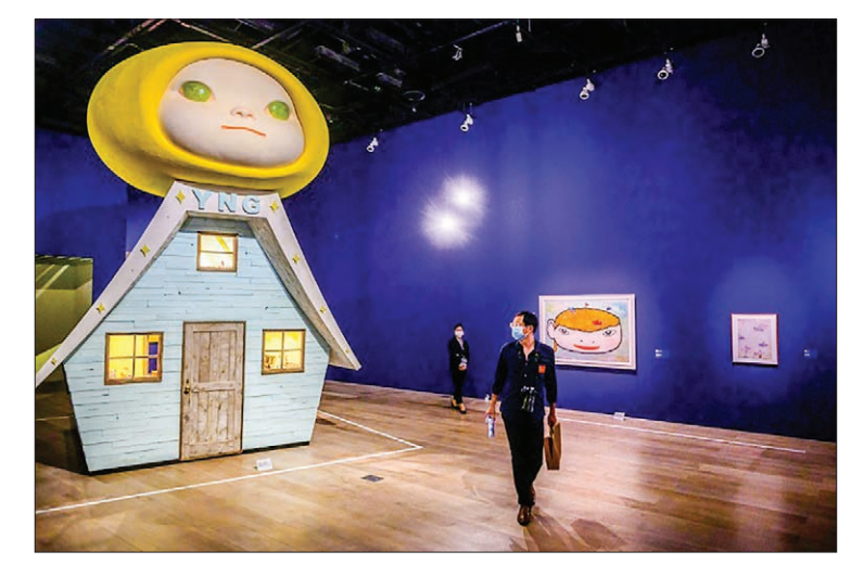
Pieces by artist Yoshitomo Nara are among the works on display at a major exhibition of contemporary Japanese artists opening in Tokyo as coronavirus infections spike.