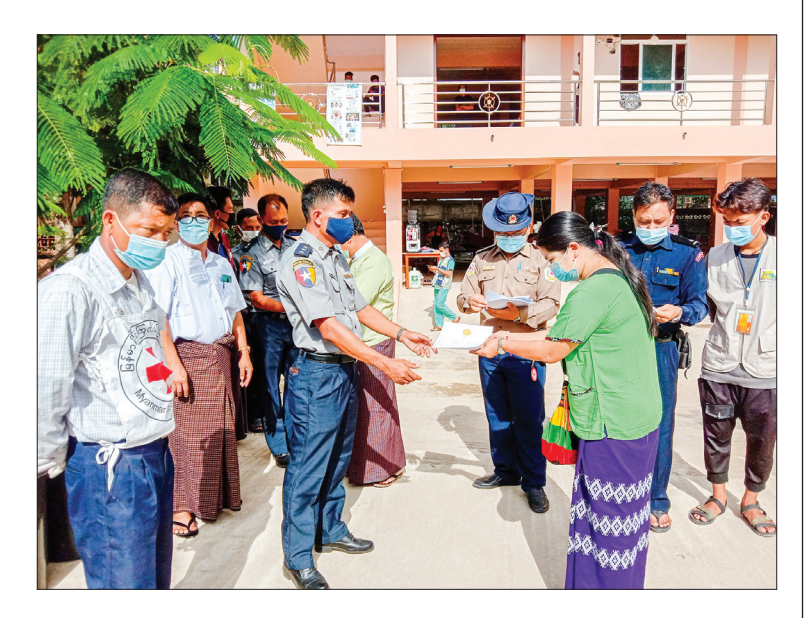
Fifty-eight Myanmar nationals who tested negative for COVID-19 are allowed to return home on 31 July 2020.