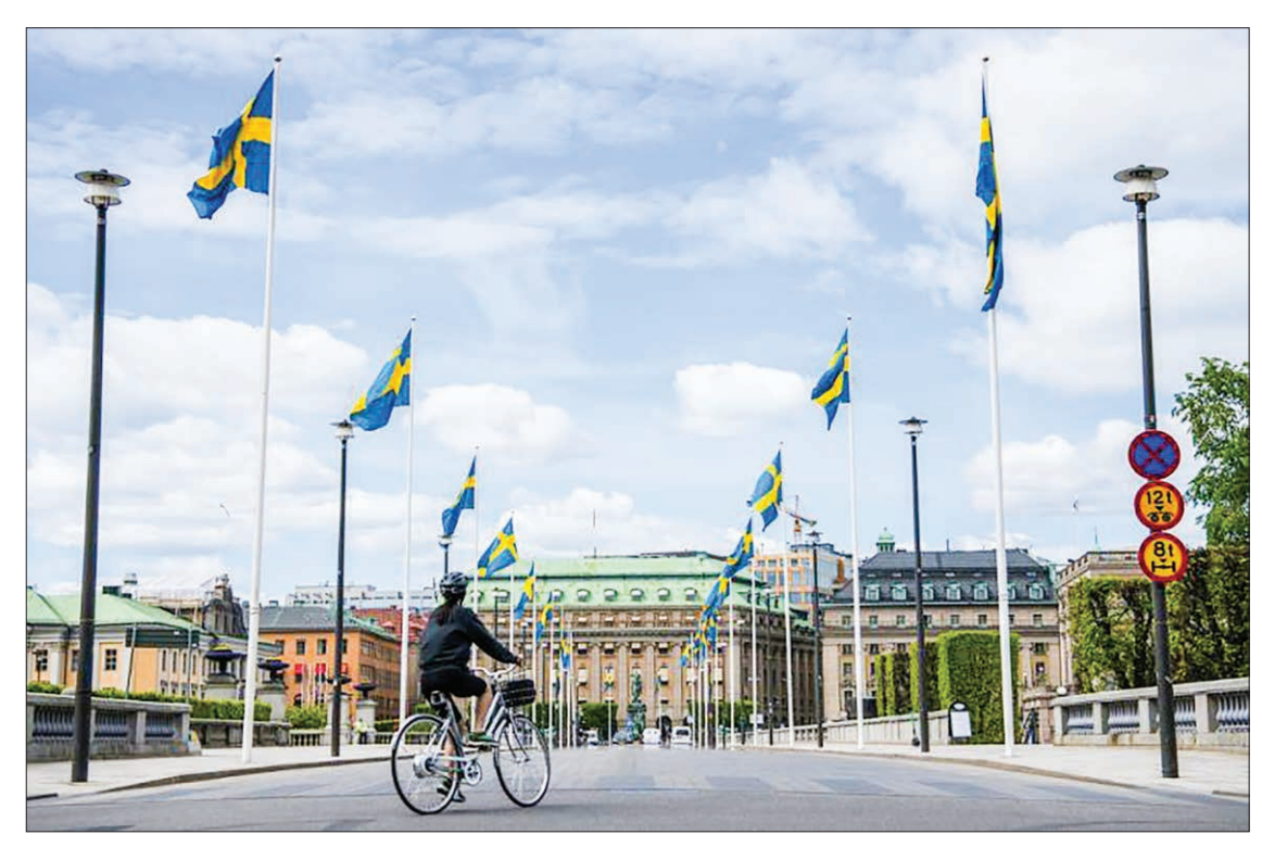
The recommendation will remain in place until the New Year.

SWEDEN, whose controversial softer approach to curbing COV-ID-19 has received worldwide attention, said Thursday it would