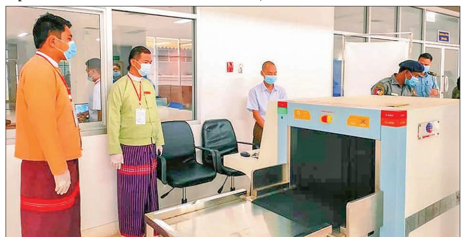
Officials are seen checking returnees at Myawady border's security control on 31 July 2020.