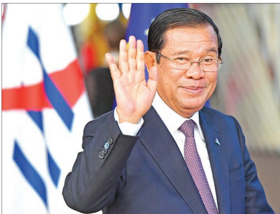
Cambodia's Prime Minister Hun Sen waves as he arrives for a Asia Europe Meeting (ASEM) at the European Council in Brussels on 18 October, 2018.

"I have received a letter from Mike Pence, US Vice President, regarding