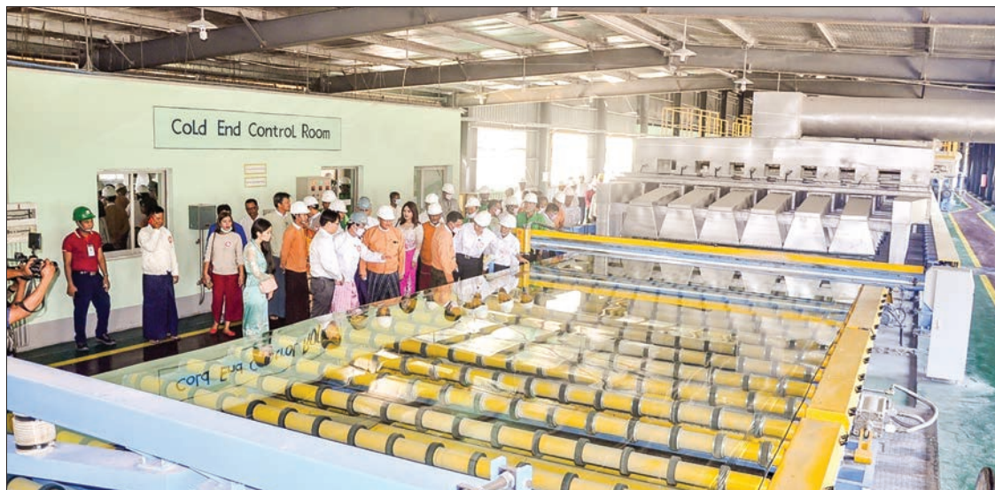
Union Minister U Khin Maung Cho inspects No.36 Heavy Industry (Kyaukse) yesterday.

The inauguration ceremony was attended by the Union Minister for Industry, U Khin Maung Cho, the Deputy Minister for Natural Resources and Environmental Conservation, Dr. Ye Myint Swe, Mandalay Region's Minister for Agriculture, Livestock, and Irrigation, Dr. Soe Than, International Glass