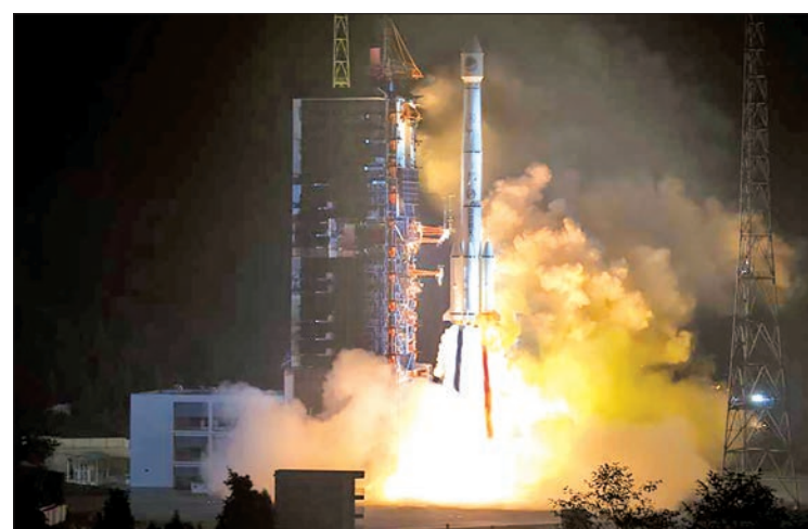
China sends two new satellites of the BeiDou Navigation Satellite System (BDS) into space on a Long March-3B carrier rocket from the Xichang Satellite Launch Centre in Sichuan Province at 2:07 am on 19 November, 2018.

“When friends or relatives learn that I am working on the development of the BDS satellites, they often show me the BDS signals on their mobile phones. People still mainly depend on navigation by GPS, supplemented by