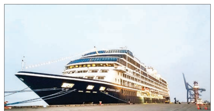
Luxury cruise ship MS Azamara Quest docks in Yangon.