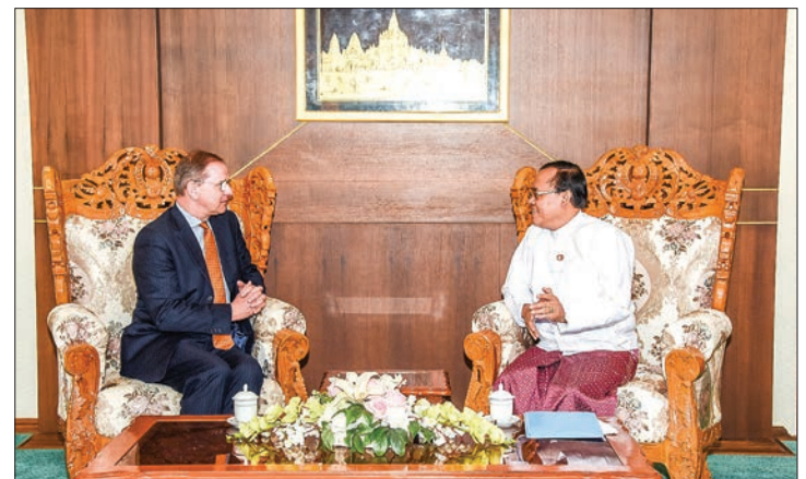
Union Minister U Kyaw Tin meets with the newly-appointed UNHCR Representative Mr. Johan Cels in Nay Pyi Taw.

UNION Minister for International Cooperation U Kyaw Tin received Mr. Johan Cels, the newly-appointed UNHCR Representative in Myanmar and accepted his credentials at 10:00 am on 19 November 2018 at the Ministry of Foreign Affairs in Nay Pyi Taw.