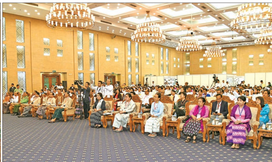
Students perform with music at the ceremony to mark World Toilet Day 2018 at the Myanmar International Convention Centre-II in Nay Pyi Taw yesterday.