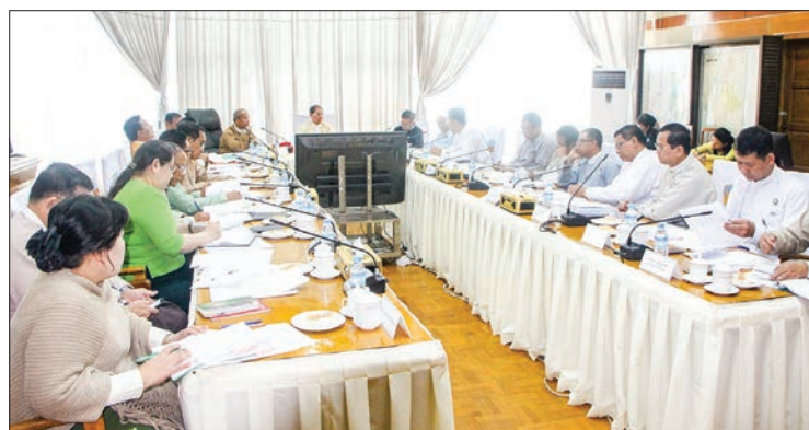
The joint committee meeting of China-Myanmar Economic Corridor held in Yangon yesterday.

The Chief Minister of Magway Region, joint committee members from the Nay Pyi Taw