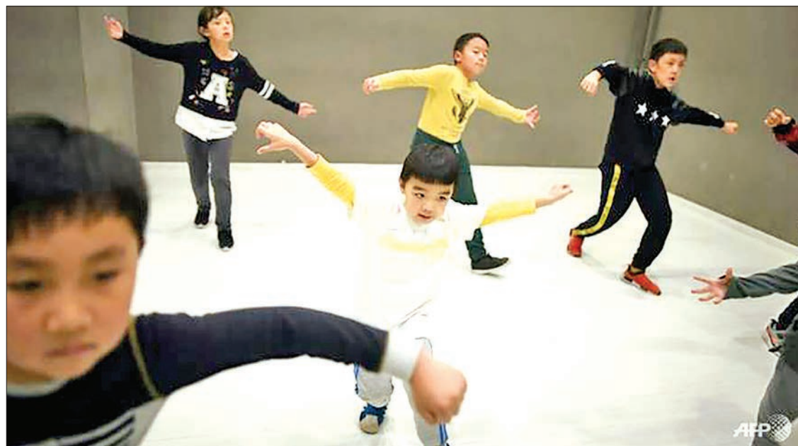
Some children practise in earnest while others treat the class more like play.

BEIJING (China) — In China, where children are often saddled with a packed schedule of extracurricular activities before they even enter grade school, some parents are making room for a surprising pursuit: hip-hop dance classes.