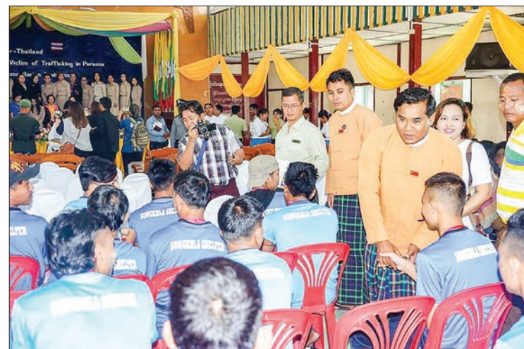
Kayin State authorities welcome the 73 Myanmar nationals trafficked to Thailand back in Myawady, Kayin State.