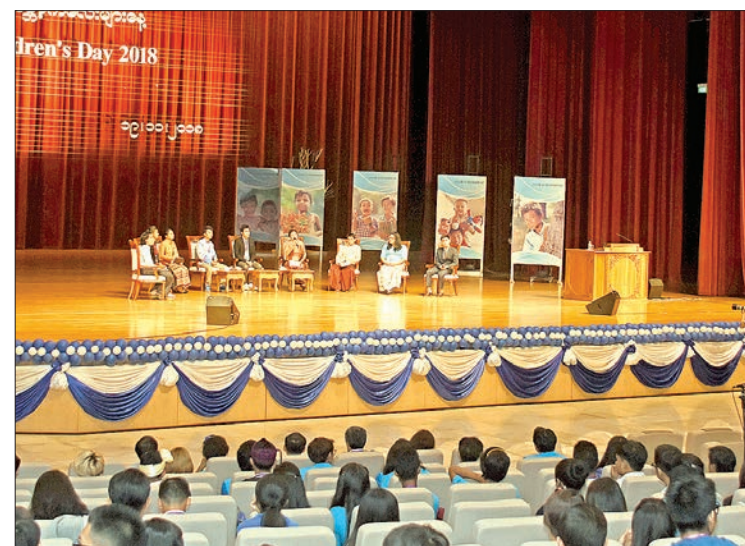
Roundtable discussions on education, violence against children, and peace held by Pyidaungsu Hluttaw representatives and members of U-Report at the World Children's Day ceremony.

to promote children's right to education, protection, and peaceful existence. — MNA / (Translated by Zaw Htet Oo)