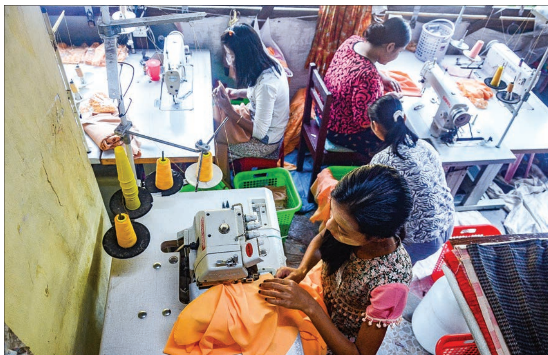
Employees work at the small garment factory in South Dagon Township, Yangon.

“Under the ASEAN strategic action plan for SME de-