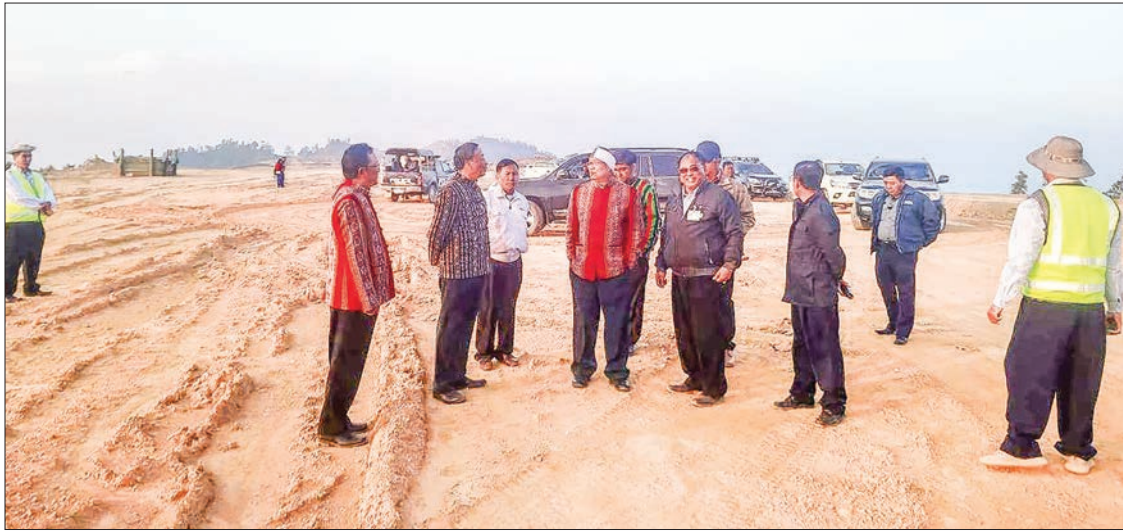
Union Minister U Thant Sin Maung and officials inspect the construction site of the Falam Airport in Falam Township, Chin State yesterday.

UNION Minister for Transport and Communications U Thant Sin Maung accompanied by Chin State Chief Minister Salai Lian Luai arrived at Falam Airport construction project office on 17 November where Department of Civil Aviation Director U Kyaw Soe explained about the project in detail covering the aim of the project; site selection; restrictions related to air traffic; design based on International Air Transport Association terms and condition on safe landings of aircrafts; construction works including retaining walls, apron, runway, terminal, control tower; connecting electrical cables for lighting; water drains; project cost and project processes.