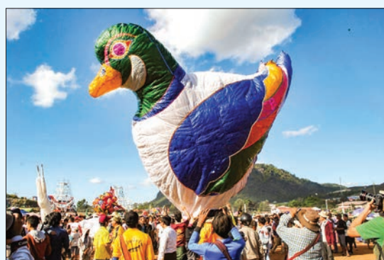
Homemade hot air balloons in the shapes of animals and traditional cylindrical designs are released into the sky at the festival in Taunggyi, Shan State.