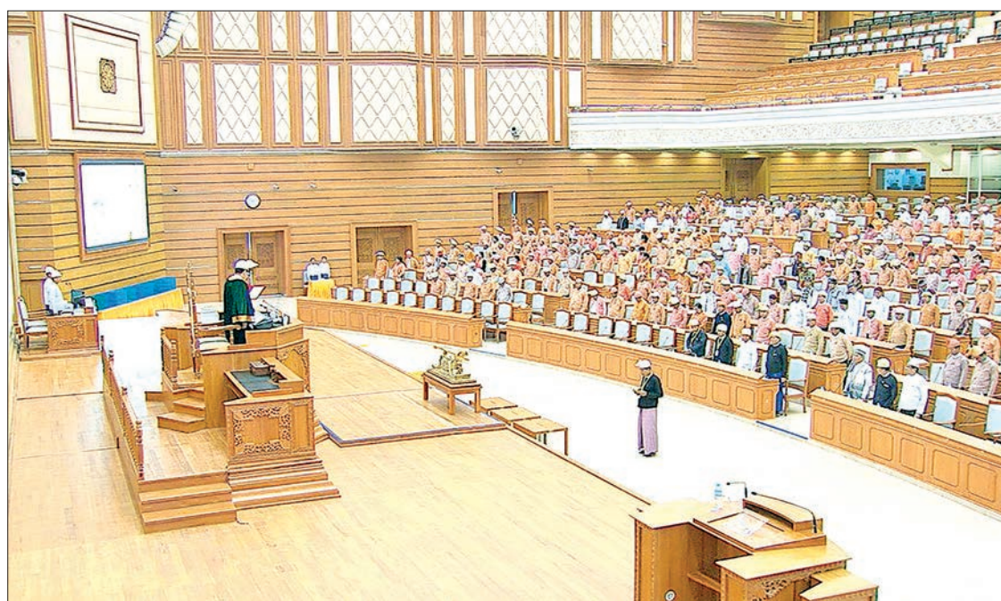
U Myo Win takes the oath at tenth regular session of 2 nd Pyidaungsu Hluttaw.

Ministry of Investment and Foreign Economic Relations is formed to fulfill the requirement of the State and the people according to international, regional and the country's geo-economic situation, increasing local and foreign businesses and investments, improving the investment image of the country, quickly creating opportunities for entrepreneurs, all round regional economic cooperation in ASEAN, Greater Mekong Sub-region and BIMSTEC etc. and cooperating in socio-economic development programs with