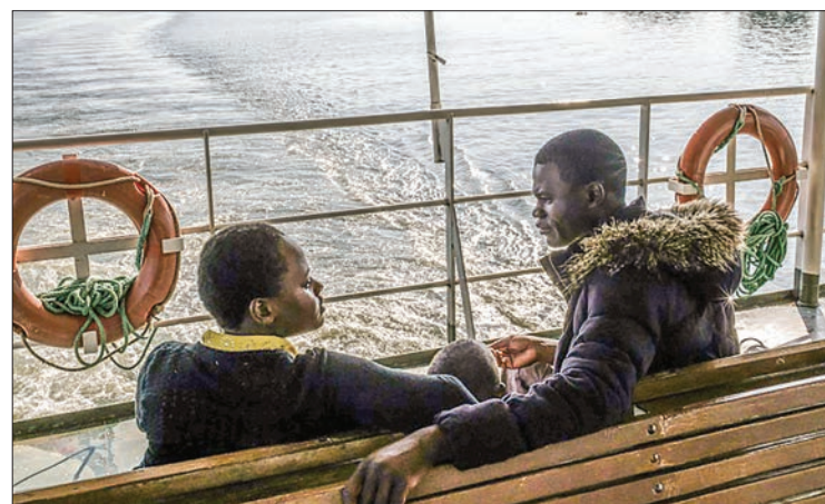
It is not uncommon for ferries to capsize on Lake Victoria and the number of fatalities is often high due to a shortage of life jackets and the fact many local people cannot swim.