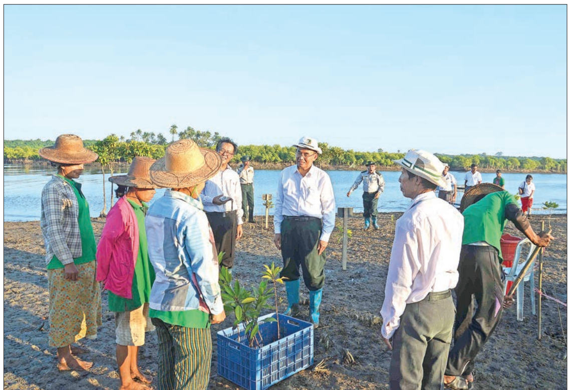
Union Minister U Ohn Win inspects the community-based mangrove forest conservation in Patheingyi.

He toured the area where 1,800 acres of mangrove trees are being planted and conserved in Patheingyi Township. Officials presented a report on conservation of rare tree species and progress of work to the minister. Afterwards, U Ohn Win planted a sapling in the area. — MNA ■