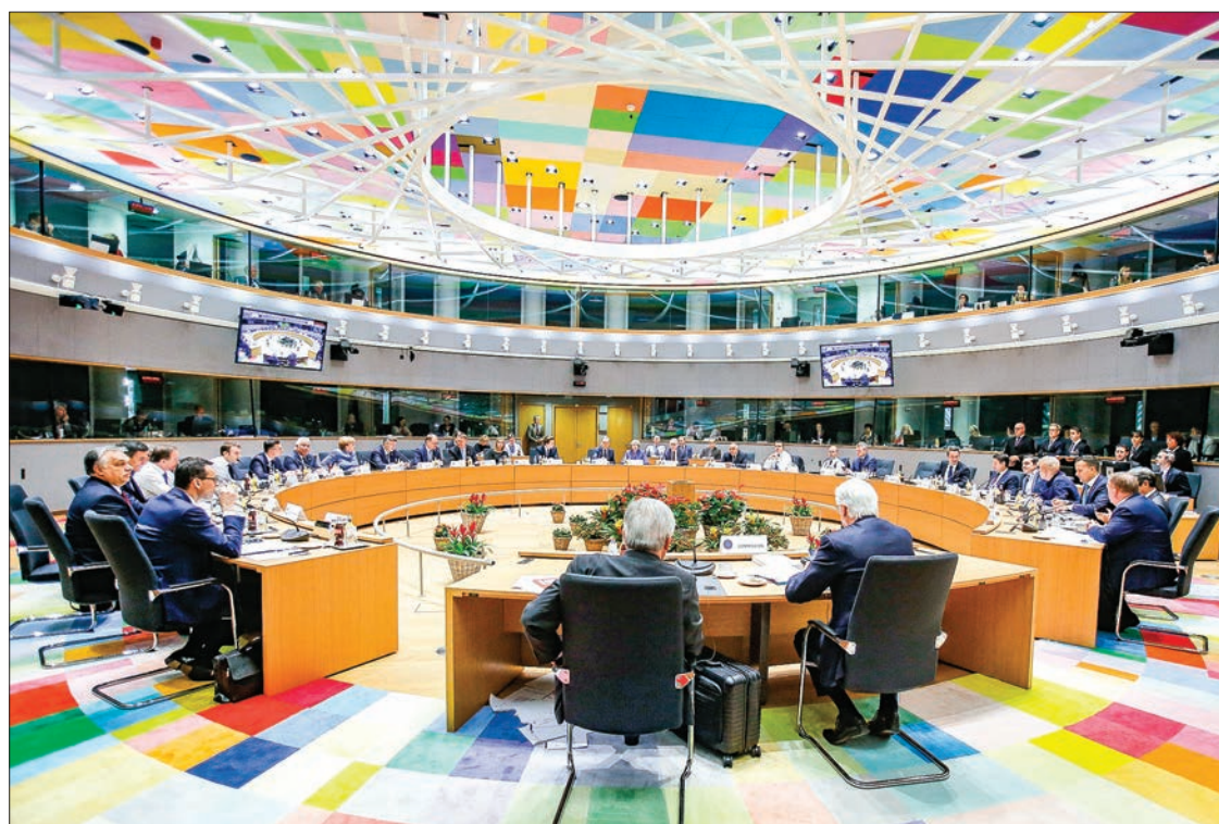
A general view of UE leaders with Britain's Prime Minister Theresa May (background) during a special meeting of the European Council to endorse the draft Brexit withdrawal agreement and to approve the draft political declaration on future EU-UK relations on 25 November, 2018 in Brussels.

Arriving for a special summit in Brussels, European Commission President Jean-Claude Juncker, head of the bloc's executive arm, said it was a "sad day". "To see a country like Great Britain ... leave the EU is not a moment of joy nor of celebration, it's a sad moment and it's a tragedy," he said. Michel Barnier, the former French foreign minister who negotiated the deal on behalf of the bloc, added: "We will remain allies, partners and friends." May, who arrived in Brussels on Saturday evening for final talks with Tusk and Juncker, was due to join the other leaders later in a highly symbolic moment. Forged during 17 months of tough negotiations, the withdrawal agreement covers financial matters, citizens' rights, Northern Ireland and arrangements for a 21-month post-Brexit transition phase. A short political declaration that accompanies the text sets out hopes for future security and trade ties. But it is not the final stage, as the House of Commons in London must still approve