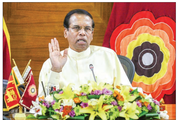
Sri Lankan President Maithripala Sirisena addresses the Foreign Correspondents Association (FCA) in Colombo on November 25, 2018.

Wickremesinghe, who occupies the prime minister's resi-