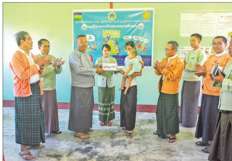
A mother receives the cash aid presented by officials of the Rakhine State Government.