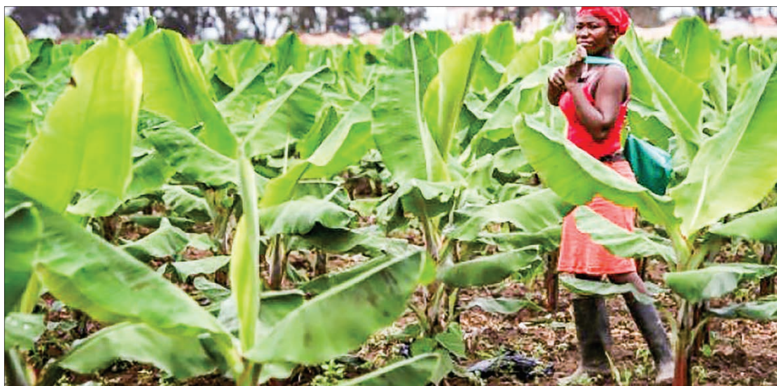
Angola is aiming to expand its agricultural sector, which could provide many with employment.

Authorities say allowing through traffic would ease congestion in other parts of the city.—AFP ■