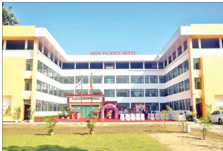
Japanese-themed hotel, Shin Ye Htut, was inaugurated in Yangon yesterday.