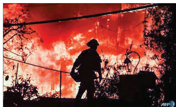
Climate change is expected to cause growing losses to American infrastructure and property and impede the rate of economic growth, according to a major new study.