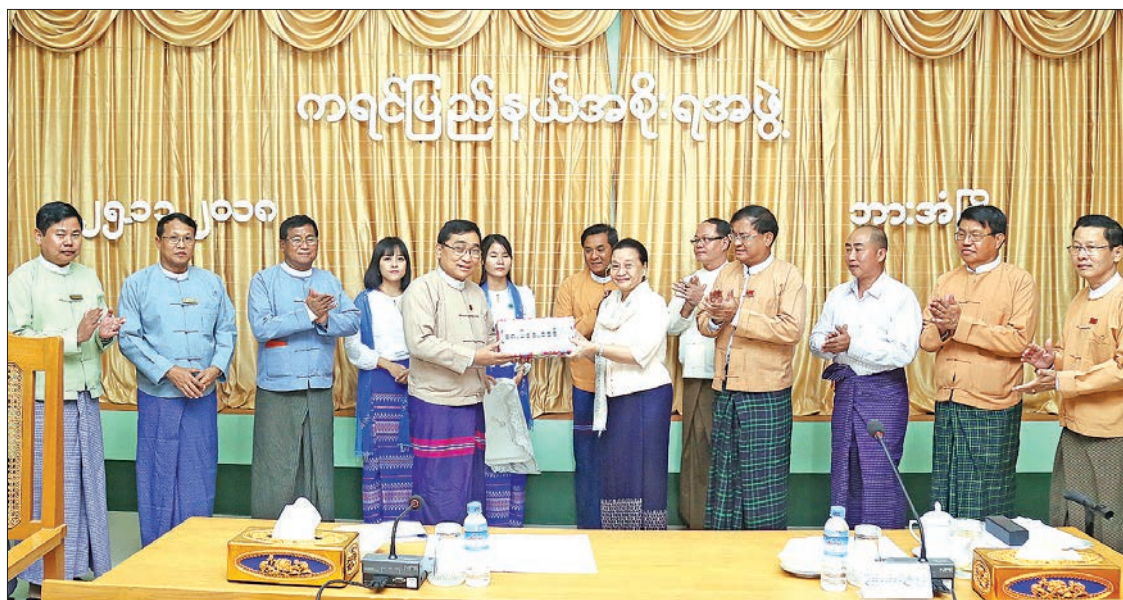
Union Minister Dr. Win Myat Aye hands over Ks18.6 million to Kayin State Chief Minister Daw Nan Khin Htwe Myint as assistance to help provide portable water to rural areas in the state yesterday.

THE Union Government has provided Ks18.6 million to Kayin State as assistance to help provide portable water to rural areas in the state, which is located southeast of Yangon.