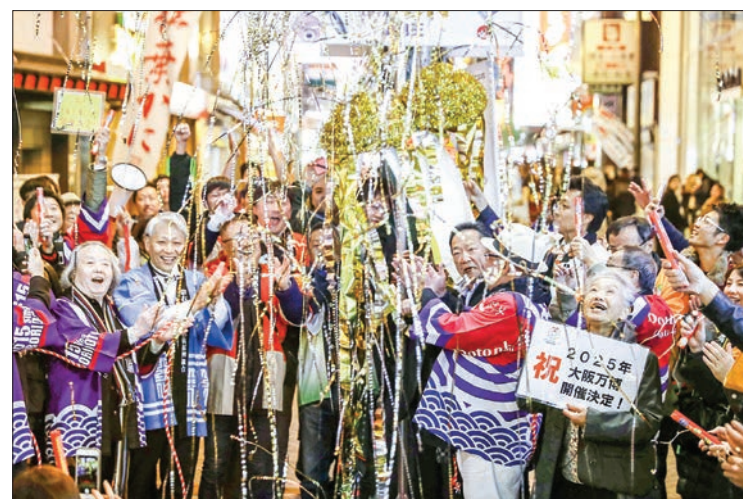
People celebrate in Osaka on 24 November, 2018 after the Japanese city was picked to host the 2025 World Expo.

"The name derives from the preponderance of frogs which have always lived in this low-lying marshy area," according to the royal family's website. —AFP ■