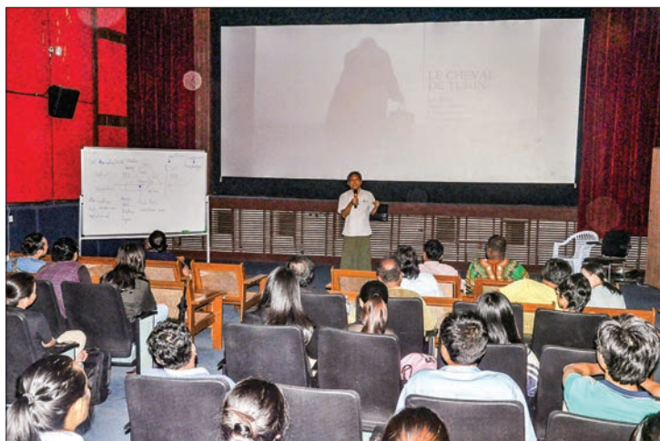
The 5 th Film Analysis being convened in Yangon yesterday.