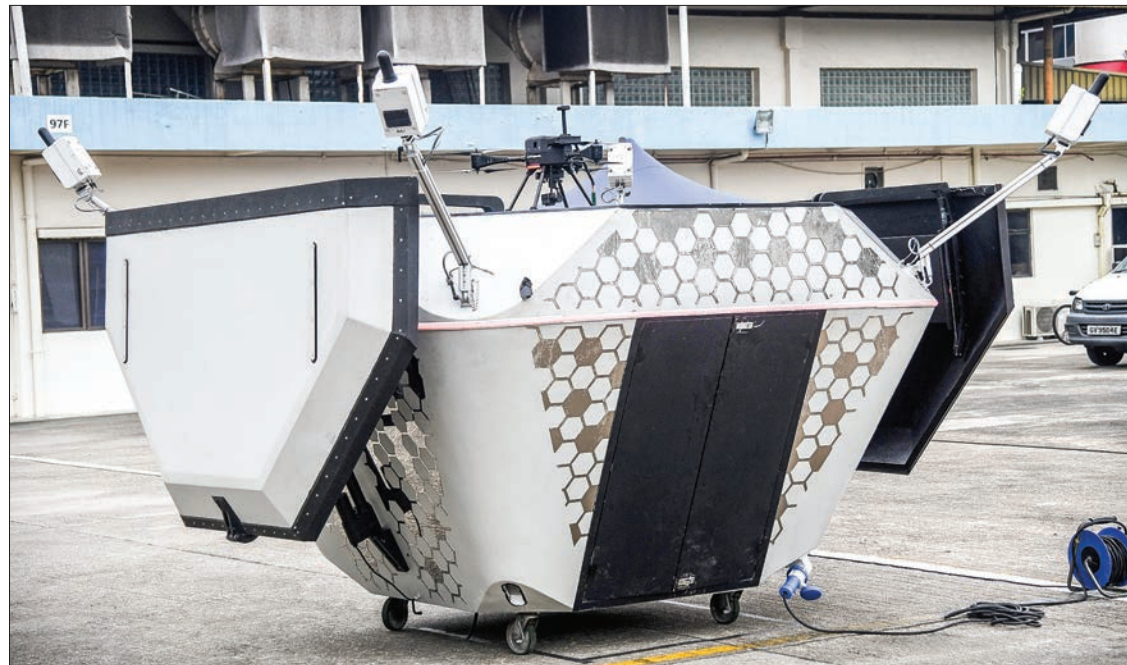
This photo taken on 17 October, 2018 shows a Singapore Technologies Aerospace owned drone on a mobile landing and charging station during a demonstration in Singapore.

Drones are also being tested as robotic guards by local firm ST Aerospace. At its command centre, screens show a simulated security breach in a fence. A black drone is deployed, which chases an intruder while transmitting live images that direct security officers towards him to make an arrest. Tests have also been carried out for drone parcel delivery while a hospital operator plans to use the devices to transport blood samples and specimens between its hospitals and central laboratory. But transforming the futuristic vision into reality faces hurdles. The prospect of having a drone suddenly whizz by your apartment or office has sparked privacy concerns in the land-scarce city.—AFP ■