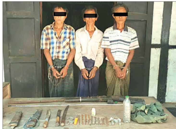
Three suspects seen with weapons which were used for killing an elephant.