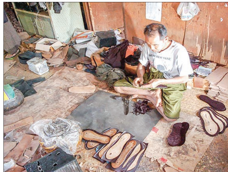
A man making slippers for local market.

Slippers manufactured in Kanya village were well known for their quality among residents of the upper Chindwin Townships. But within the past six years, cheap foreign slippers entering the local market resulted in falling sales for local slippers.—Win Oo (Zeyya Taing) (Translated by Kyaw Zin Lin)