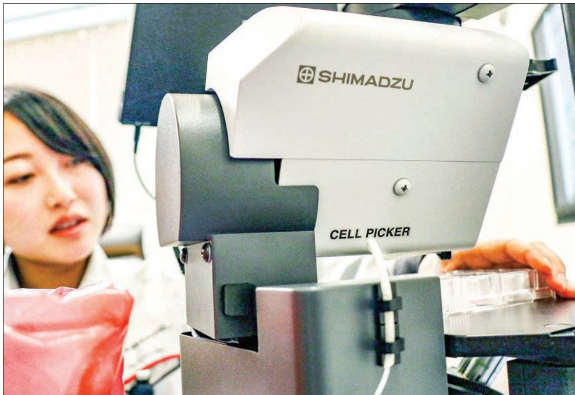
Precision instrument maker Shimadzu Corp unveils its Cell Picker device developed to automatically remove unnecessary cells during preparation procedures for iPS cells, in Kyoto on 19 March, 2018.

The company plans to apply the latest method to diagnosis of early stage breast cancer and pancreatic cancer in the future.