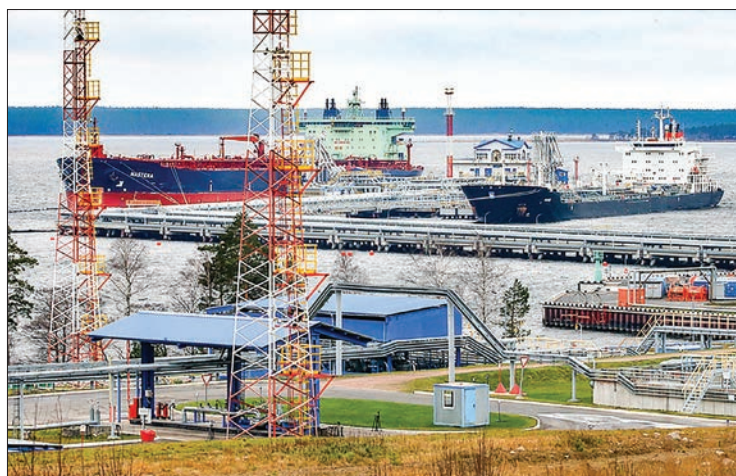
Primorsk Port is the largest Russian oil loading port on the Baltic Sea and the endpoint of the Baltic Pipeline System.

PRIMORSK — Russia’s oil pipeline company Transneft has dispatched one billion tonnes of liquid hydrocarbons (oil and diesel fuel) for export via Primorsk Port in Russia’s north-west since loading its first tanker in 2001.