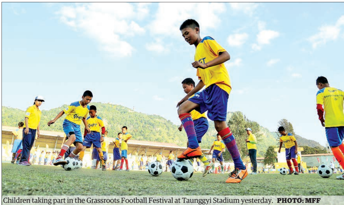
Children taking part in the Grassroots Football Festival at Taunggyi Stadium yesterday.

The MFF plans to hold similar events later in other cities in different states and regions.—Lynn Thit(Tgi) ■