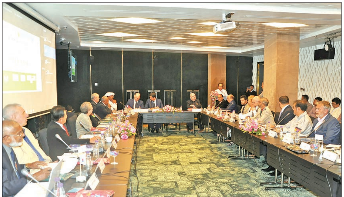
The annual general meeting of the International Billiards and Snooker Federation (IBSF) is in progress in Yangon yesterday.

MYANMAR hosted the annual general meeting of the International Billiards and Snooker Federation (IBSF) in Yangon yesterday.