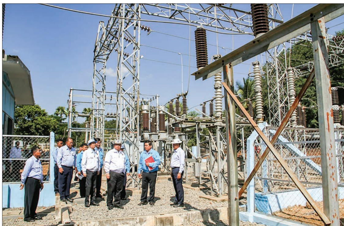
Union Minister U Win Khaing and party inspect the 66kVA Pannaetaw sub-power station in Kyaukpadaung.

Natural pozzolans are also mixed with cement to construct RCC dams (Roller Compacted Concrete dams). Two concrete dams in Myanmar, Ye Ywar and Ahtet Paunglang, were constructed using the mixture of natural pozzolans and cement. Additionally, pozzolan-mixed cement can be used to build a standard one-storey building, road, wall, or water tank at a lower cost.