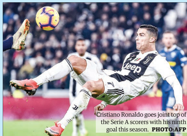
Cristiano Ronaldo goes joint top of the Serie A scorers with his ninth goal this season.

"Cristiano moves and thinks so quickly, he saw Douglas Costa coming out the corner of his eye and pulled the pass back. We need to all improve in that sense, being able to think ahead to the next move." SPAL, fighting relegation, were no match for Allegri's reigning champions who are nine points ahead of Napoli, with Carlo