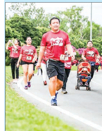
People take part in the friendship run in Kota Kinabalu, Sabah, Malaysia, 25 November, 2018.