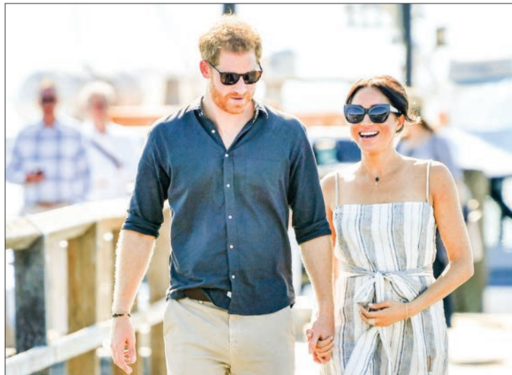
Britain's Prince Harry and his wife Meghan.

LONDON (United Kingdom) — Prince Harry and his pregnant wife Meghan Markle will move into a historic cottage on the royal family's Windsor Estate early next year, Kensington Palace said on Saturday.