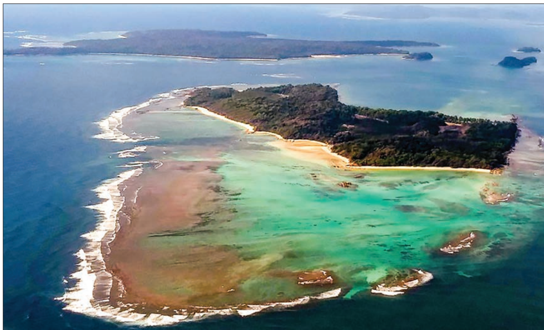
A lack of knowledge of the Sentinelese, who 13th century adventurer Marco Polo called "brutish and savage", is the main handicap to recovering a body.