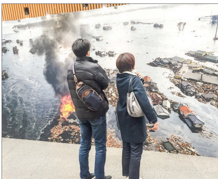
A couple look at a photograph of the aftermath of a huge tsunami triggered by the Great East Japan Earthquake in 2011 at an exhibition entitled "Footprints of The Heisei Era - A news agency as eyewitness" at Tokyo International Forum on 24 November, 2018.

The photo exhibition, which runs through 2 December, is the 10th and latest in a series of photo exhibitions organized by the nonprofit Japan Press Research