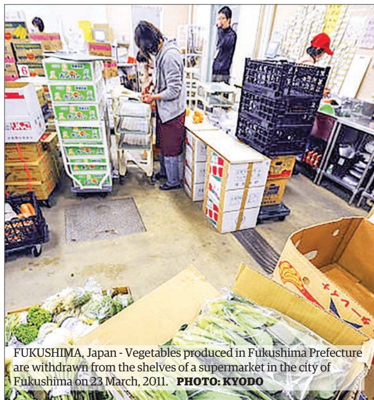
FUKUSHIMA, Japan - Vegetables produced in Fukushima Prefecture are withdrawn from the shelves of a supermarket in the city of Fukushima on 23 March, 2011.

In 2017, typhoons claimed the lives of 386 people in Viet Nam, damaged more than 600,000 houses and caused economic losses of about 60 trillion Vietnamese dong (2.6 billion US dollars), according to the country's agriculture ministry.—Xinhua ■