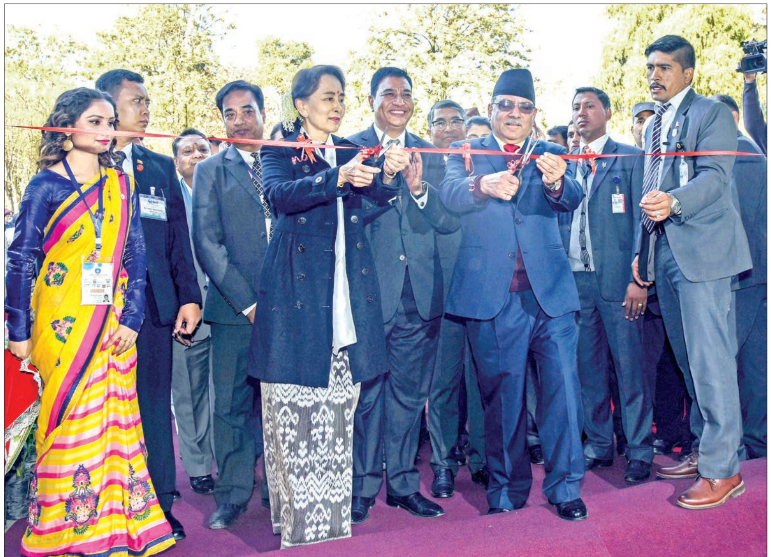
State Counsellor Daw Aung San Suu Kyi officially opens the Nepal Chamber Expo-2018 in Kathmandu, Nepal.

In the afternoon, the State Counsellor received the Foreign Minister of Nepal Affairs Mr. Pradeep Kumar Gyawali at the Soaltee Crowne Plaza Hotel.