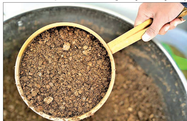
Photo taken on 21 November 2018 shows the herbs of Lum medicinal bathing of Sowa Rigpa in southwest China’s Tibet Autonomous Region.

A five-year safeguarding plan (2019-2023) has been made on the basis of a monitoring system so as to ensure coordinated safeguarding and development of the Tibetan tradition. Measures include special vocational training and increasing youth’s awareness of safeguarding through compilation of primary