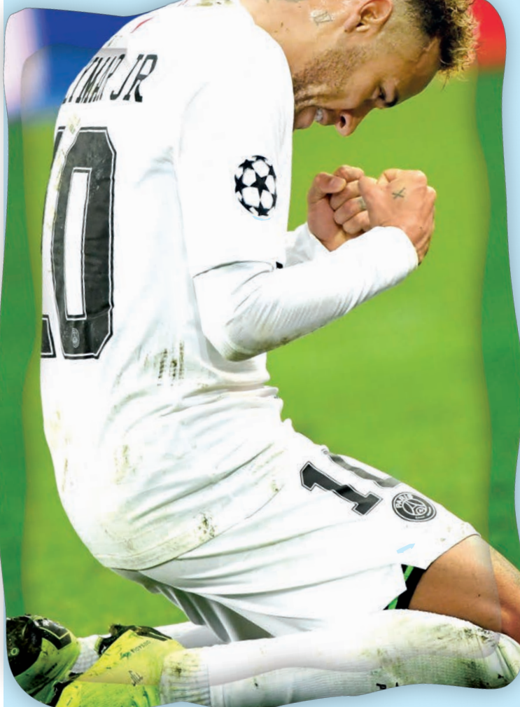
Neymar scored the decisive goal for Paris Saint-Germain in his side's 2-1 win over Liverpool on Wednesday.

“Let's raise a trophy,” Schweinsteiger said in a statement issued by the club. “I believe in this club and I believe that we can be champions. “This American journey has been very special for me and my family,” added Schweinsteiger, who is married to former WTA tennis player Ana Ivanovic. “I love being a part of the Chicago Fire and we appreciate how the city has embraced us with open arms.”—AFP ■