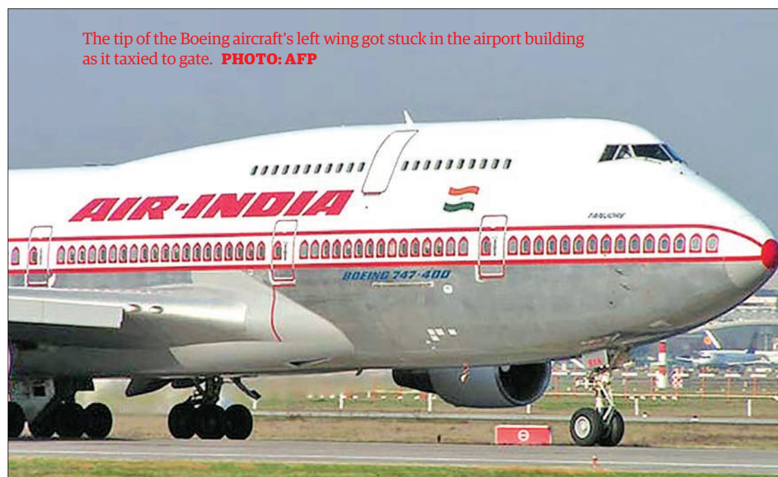
The tip of the Boeing aircraft's left wing got stuck in the airport building as it taxied to gate.

According to airport operator Swedavia's website, the flight had originated in New Delhi. —AFP ■