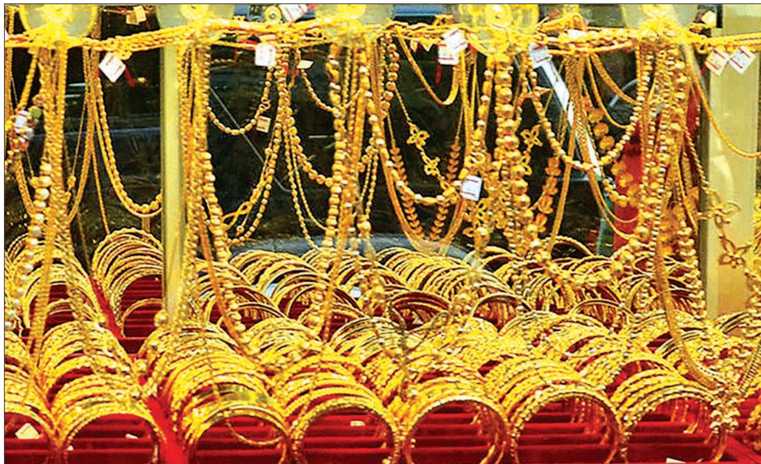
Gold jewellery displayed at a shop in downtown Yangon.