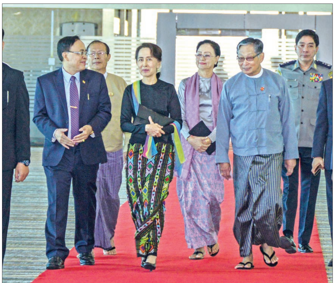
State Counsellor Daw Aung San Suu Kyi is seen off by Union Minister U Kyaw Tint Swe (Right) as she leaves for Nepal to attend the Asia-Pacific Summit-2018.