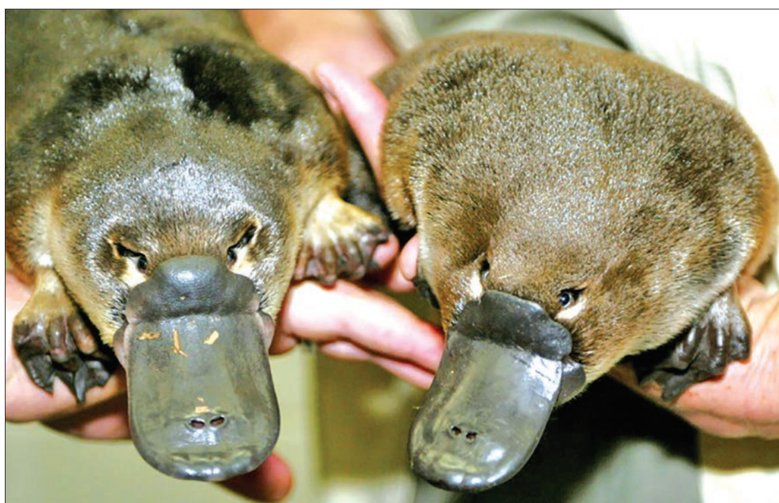
These platypus twin puggles were born in captivity in 2003.

"We cannot afford as a world, let alone Australia, to let his ani-