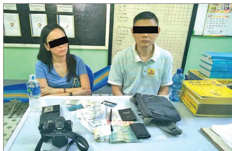
The Singaporean couple claim the counterfeit notes were acquired at a money exchange in Changi Airport.

The police have lodged a case against them for using counterfeit money.—GNLM (Translated by JT)