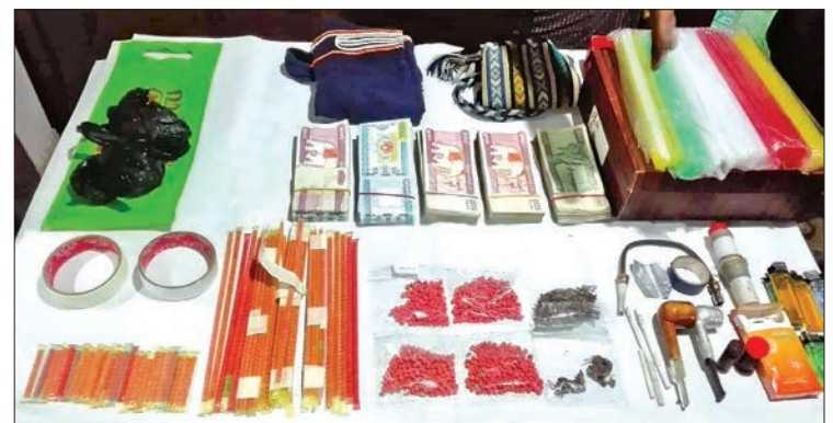
Illegal drugs, accessories and money seen.