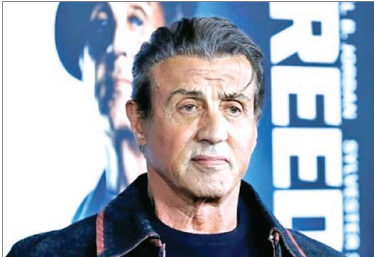
Sylvester Stallone attends “Creed II” New York Premiere at AMC Loews Lincoln Square on 14 November 2018 in New York City.

Stallone said he couldn’t be happier for the way things