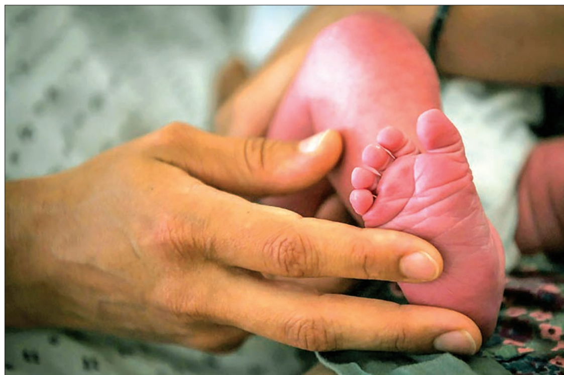
Researchers say the 'mini-placentas' could shed light on a host of poorly understood reproductive disorders.

But human and animal placentas are too different to provide a good model for research, and the last 30 years has seen increasing efforts to grow placental cells outside the body. Moffett and the team managed to nurture a miniature model placenta under lab conditions by identifying and isolating cells from the trophoblast—the membrane that provides nutrients to an embryo and helps the placenta attach to the uterus. These organoids were able to survive long-term, and even began to secrete the same proteins and hormones that would affect a mother's natural functions during pregnancy. Even over-the-counter home pregnancy tests identified the presence, for example, of the hormone HCG.