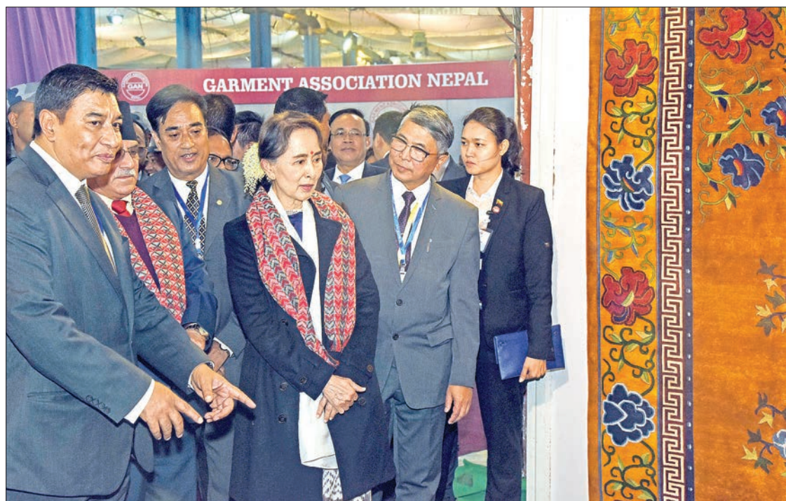
State Counsellor Daw Aung San Suu Kyi visits the booth displaying textile produced by Nepal.

for registration of ten Nepalese companies with the Myanmar Investment Commission as of March 2018.