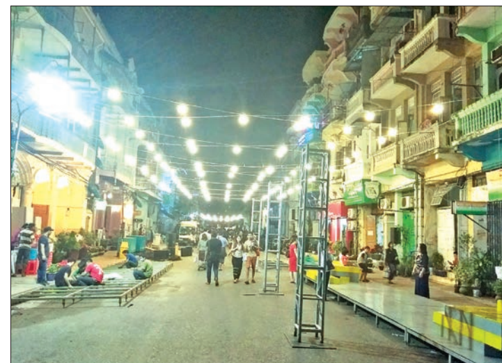
Workers make preparation for holding Singapore Festival 2018 in Yangon.

Art, entertainment fairs, and music shows will be arranged at the event. Singapore's famous rapper The Lion City Boy and Myanmar singer Helay are scheduled to perform at the festival, which will also host meetings with Singapore artists. The festival aims to showcase Singapore-Myanmar relations.—Min Thit, Thant Zin Win (Translated by Myat Thandar Aung)