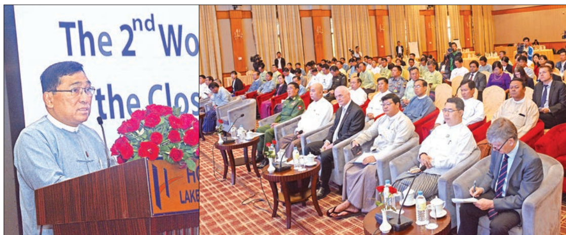
Union Minister Dr. Win Myat Aye addresses the workshop on Myanmar's strategy for closing IDP camps in Kachin, Shan, Rakhine, and Kayin states at the Horizon Lake View Resort Hotel in Nay Pyi Taw yesterday.

though the new administration has endeavored to bring about nationwide peace with earnest efforts through the Union Peace Conference – 21 st Century Panglong, and the reconciliation effort in Rakhine State, there were still a number of challenges standing in the way of success. He said these challenges could only be overcome through negotiations and cooperation.