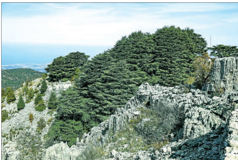
The cedar tree, with its majestic horizontal branches, graces Lebanon's flag and its bank notes.

But today's culprits lie underground, just several centimetres (inches) below the tree trunk: bright green, wriggling larvae no larger than a grain of rice.