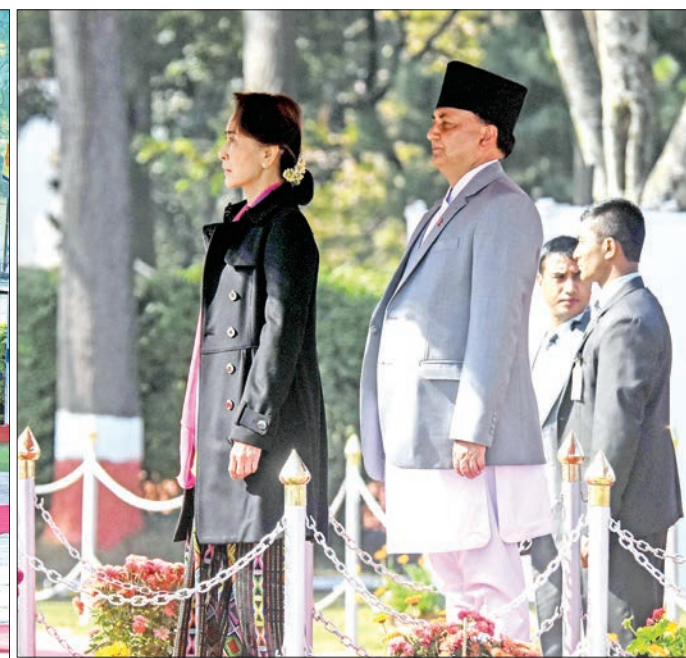
State Counsellor Daw Aung San Suu Kyi and Deputy Prime Minister of Nepal Mr. Ishwor Pokhrel receive the Guard of Honour at Tribhuvan International Airport in Nepal.