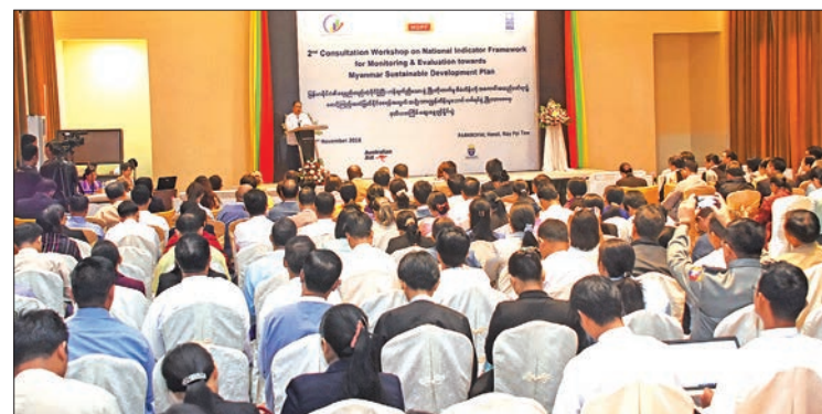
Union Minister U Set Aung addresses the second meeting on national indicator framework in Nay Pyi Taw.

speeches. The meeting was held to measure the effectiveness, capacity, sustainability, and long-term effects of Myanmar's Sustainable Development Plan during and after the implementation period.—Myo Myint, Han Lin Naing