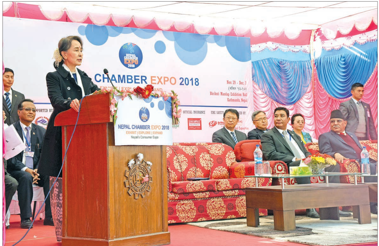
State Counsellor Daw Aung San Suu Kyi delivers the speech at the opening of Nepal Chamber Expo 2018.

The officials and the State Counsellor then cut ceremonial ribbons to open the Nepal Chamber Expo 2018. The State Coun-