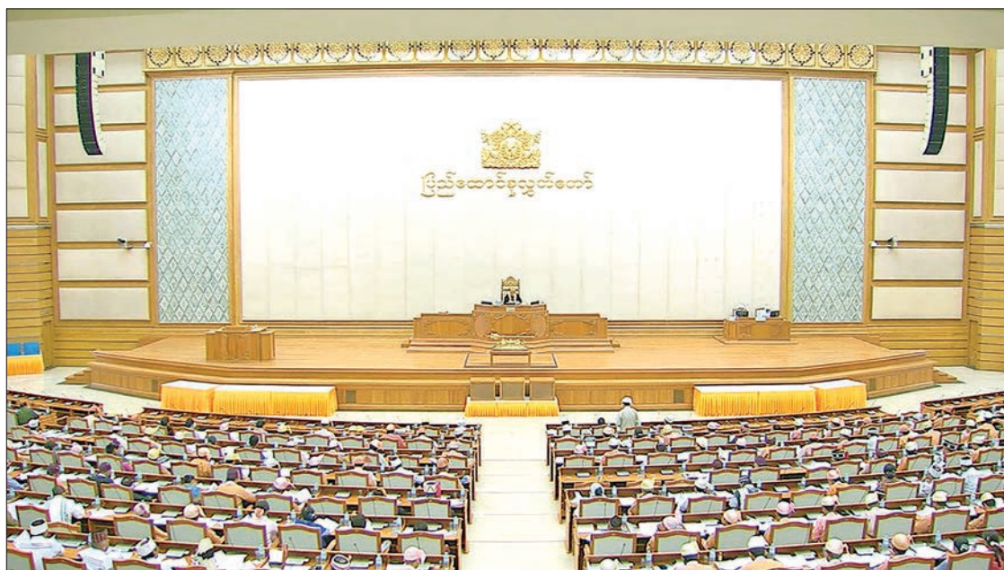
The fifth-day meeting of the Second Pyidaungsu Hluttaw's tenth regular session being convened in Nay Pyi Taw yesterday.

As the report was prepared as discussed and suggested by