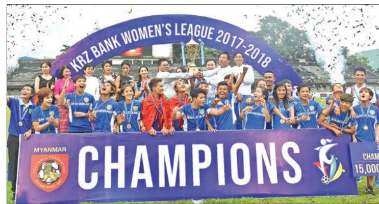
Champion of the KBZ Bank Women's League 2017-2018, Myawady team.

“Let's raise a trophy,” Schweinsteiger said in a statement issued by the club. “I believe in this club and I believe that we can be champions. “This American journey has been very special for me and my family,” added Schweinsteiger, who is married to former WTA tennis player Ana Ivanovic. “I love being a part of the Chicago Fire and we appreciate how the city has embraced us with open arms.”—AFP ■