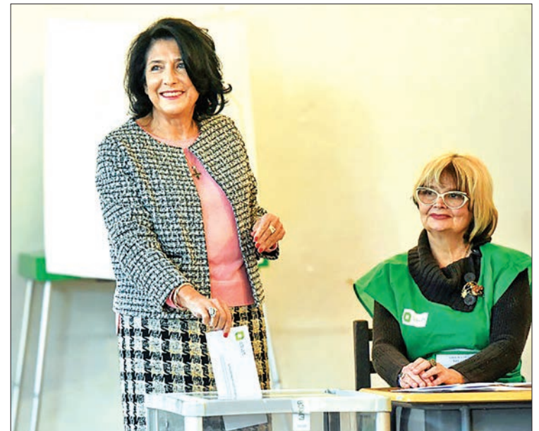
Former Georgian foreign minister and France's ambassador to Tbilisi in the early 2000s, French-born Salome Zurabishvili is supported by the ruling Georgia Dream party.

eign service culminated in a posting to Tbilisi, where then-president Saakashvili appointed her foreign minister.