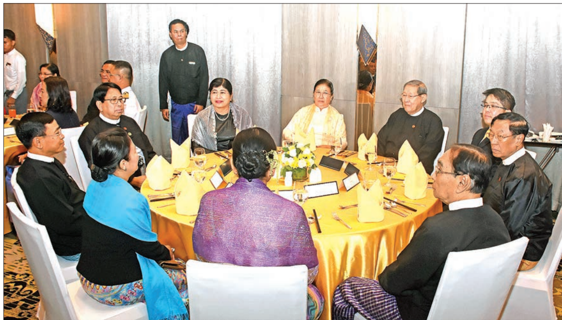
UEC Chairman, Union ministers and their wives attend dinner hosted by Embassy of Thailand.

A CEREMONY to mark the coming National Day of Thailand was held at the Hilton Hotel in Nay Pyi Taw at 7 pm yesterday.