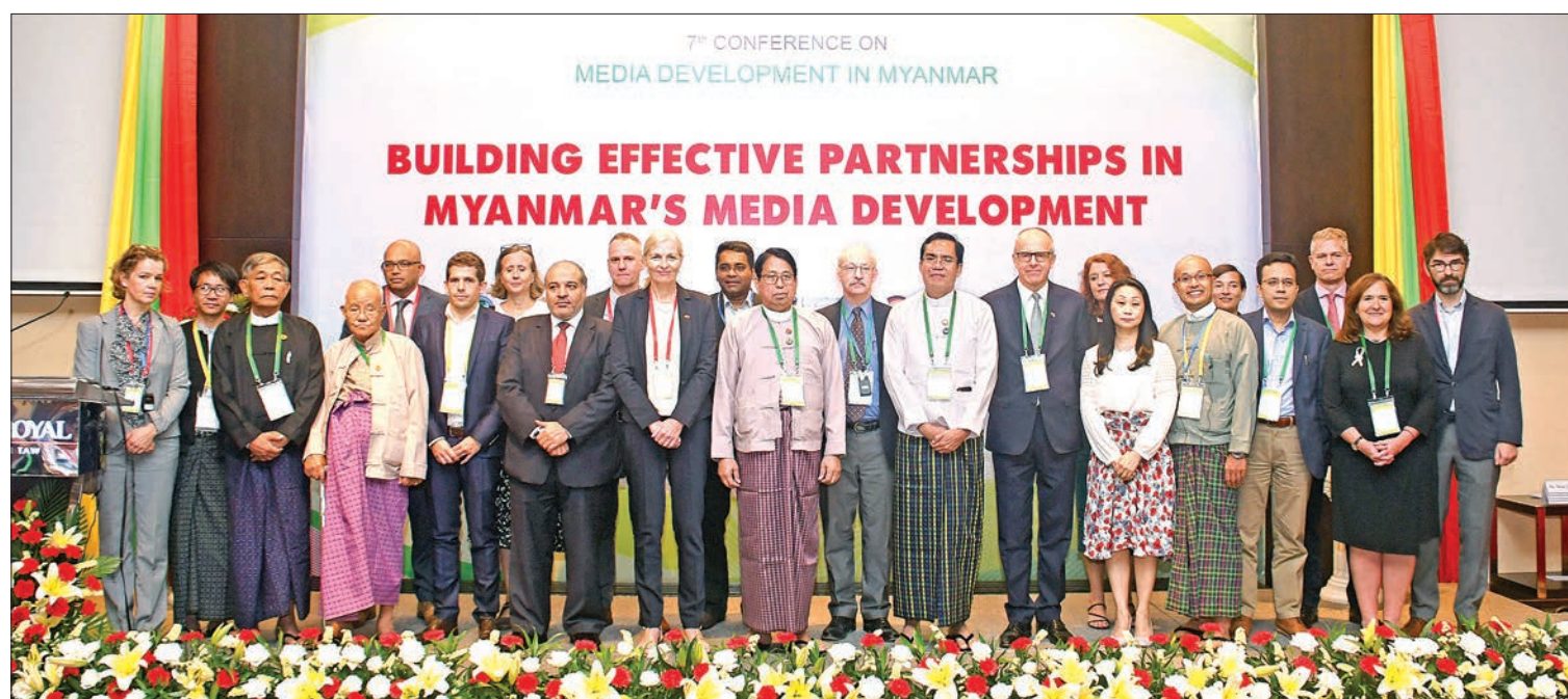
Union Minister Dr. Pe Myint and Deputy Minister U Aung Hla Tun pose for documentary photo together with the attendees of the 7th Media Development Conference.