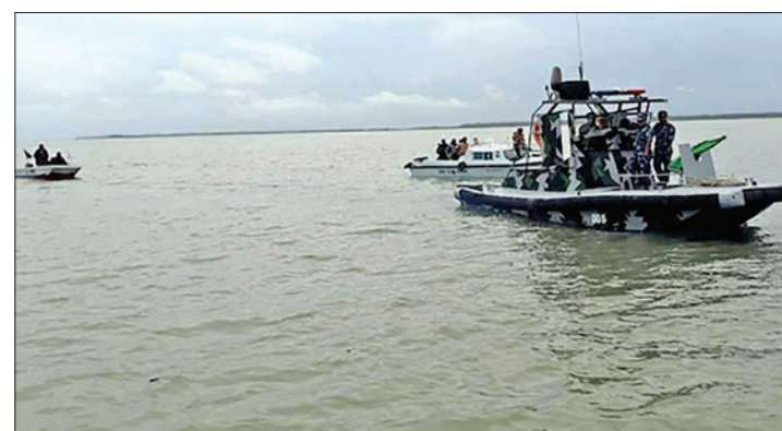
Myanmar-Bangladesh border guard troops patrol in the Naf River.

The Myanmar troops on two water crafts led by Police Captain Kyaw Thet Oo of Magyichaung Office in No. 1 Border Guard unit in area-7 met with two water crafts of Bangladeshi troops from BGB-2 Shahparitirdip outpost at the middle of the Naf River near the the entrance of Magyichaung Creek and conducted the patrol along the river. — GNLM ■