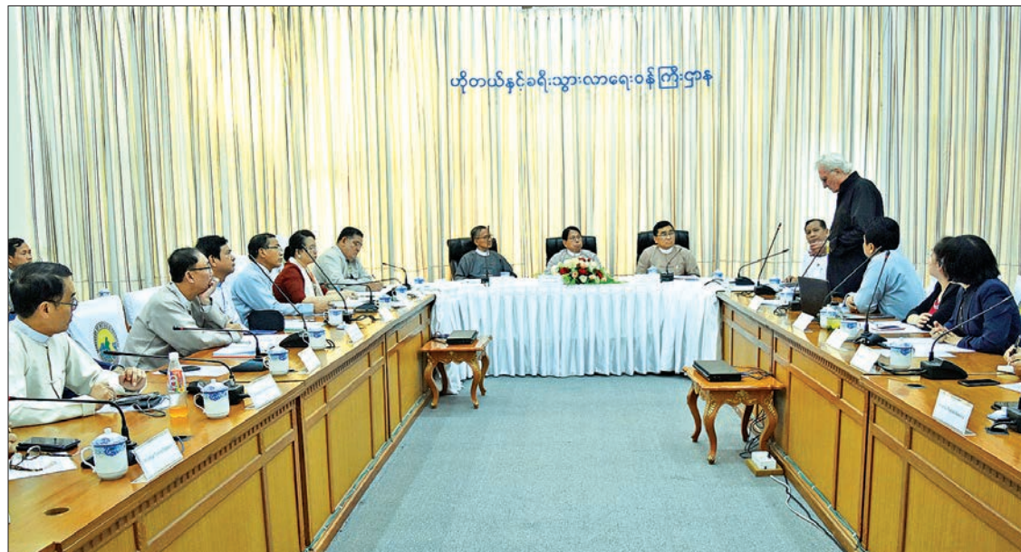
A coordination meeting for producing tourism video held in Nay Pyi Taw yesterday.

A COORDINATION meeting to discuss a documentary video producing with Monarex Hollywood Corporation to promote Myanmar's tourism industry was held at the Nilar meeting hall of the Ministry of Hotels and Tourism yesterday.