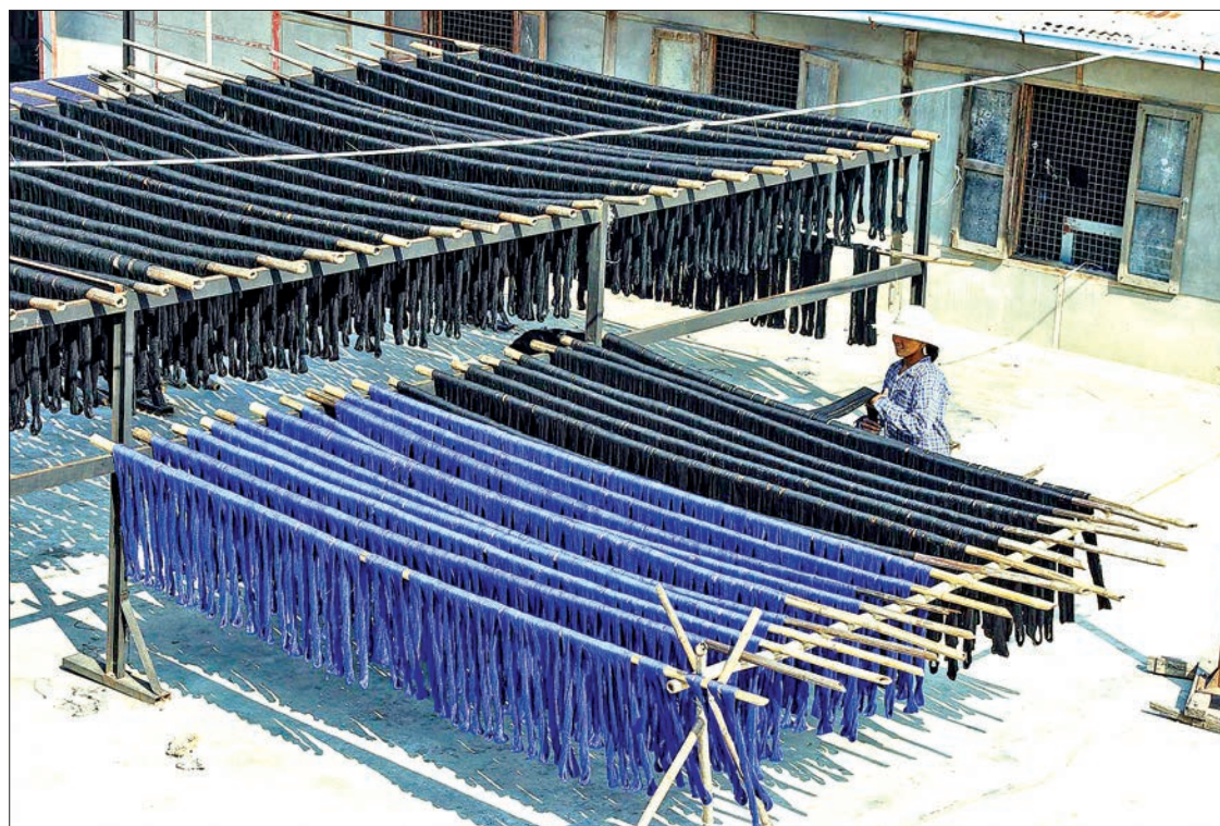
A woman drying colorful fabric after traditional dye process.

The MAB is offering two types of five-year loan plans. The first is a working capital loan to finance the everyday operations of a business such as sales and marketing, product