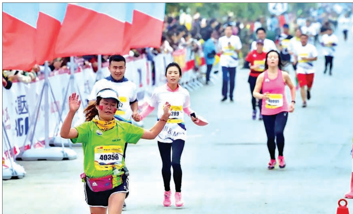
Runners compete at Myanmar-China International Marathon in 2017.

“This year’s marathon will be an important platform for cultural, social, peace, eco-