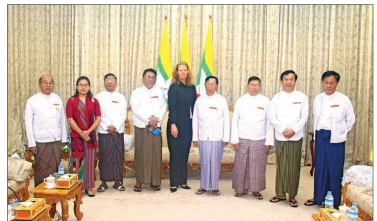
Union Election Commission Chairman U Hla Thein receives Ms. Helene Catherine e/v Otttrngat from MySop.

MySop for acting political parties, meeting of old attendees, holding party discussions, promoting the Multi Party Academy under the program of STEP Democracy in the framework of MySop and International IDEA, conducting courses for coordination, agendas to be extended for genders equality and programs to be cooperated with the UEC. — MNA (Translated by Kyaw Zin Lin)