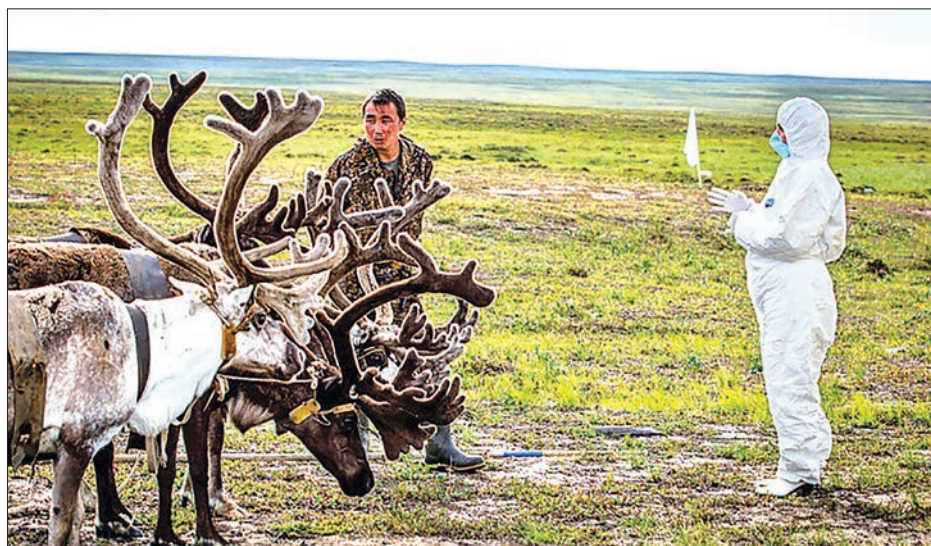
In 2016 a child died in Russia's far northern Siberia in an outbreak of anthrax that scientists said seemed to have come from the corpses of infected reindeers buried 70 years before but uncovered by melting permafrost.

When permafrost thaws, this matter warms up and decomposes, eventually releasing the carbon that it holds as carbon dioxide (CO 2 ) and methane, gases which have a greenhouse warming effect on