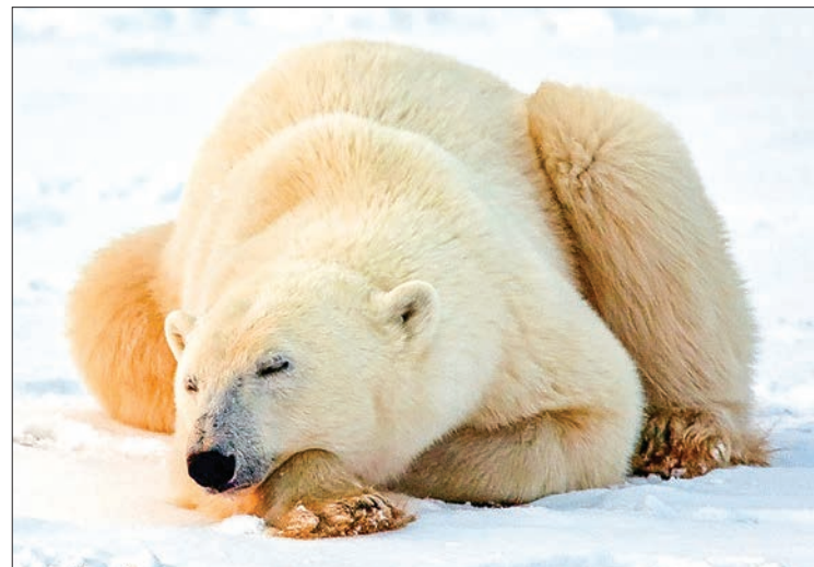
At last count in 2011, there were 15,500 polar bears in Canada.

COSEWIC also expressed concerns about declining Chinook salmon stocks along the Pacific coast, and Black Ash after two billion of the trees in the Great Lakes region were killed by Emerald Ash Borer beetles. —AFP ■