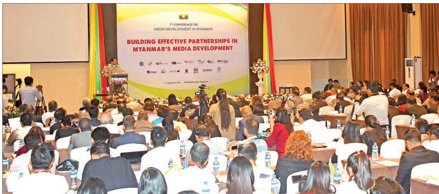
Union Minister for Information Dr. Pe Myint delivers the opening speech at the 7 th Conference on Media Development in Nay Pyi Taw.

The Union Minister said the government has worked to ensure all journalists have access to information. He urged journalists and media organizations to build mutual trust to develop