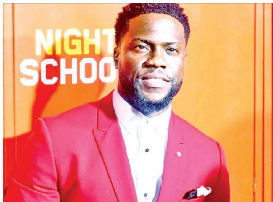
Comedian and actor Kevin Hart arrives for the premiere of 'Night School' in Los Angeles, California on 24 September, 2018.