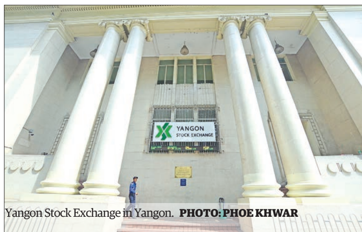
Yangon Stock Exchange in Yangon.

This year, the YSX increased its stock trade matching time from two to four per day. In addition to this, the exchange held a promotional event to attract new investors and encourage existing investors to trade more actively. Financial reviews and future prospects of YSX listed companies were shared during