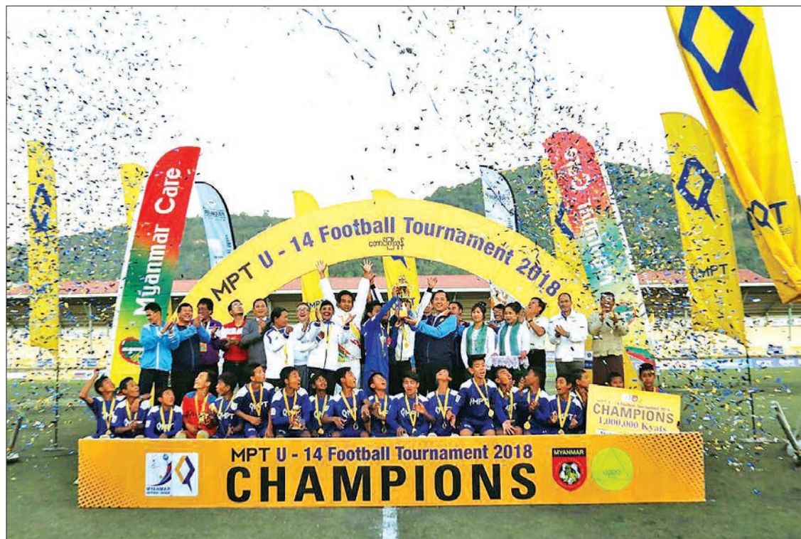
Kalaw U-14 football team, winner of the MPT U-14 Football Tournament 2018, celebrates the victory while receiving the trophy at Taunggyi Stadium in Taunggyi yesterday.