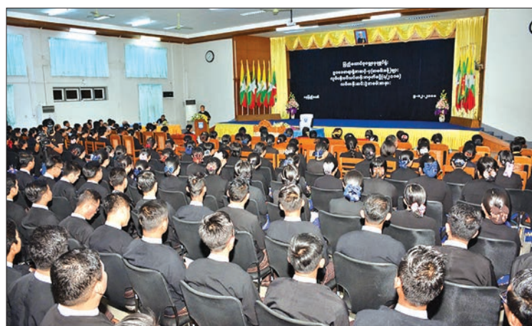
Union Attorney-General U Tun Tun Oo delivers the speech at the graduation ceremony in Nay Pyi Taw yesterday.

UNION Attorney-General U Tun Tun Oo addressed the conclusion of training No. 1/2018 of the Grade 4 Law Officers (Probationary) at the meeting hall of the Union Attorney-General's Office yesterday.