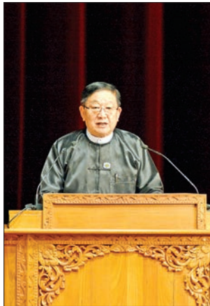
U T Khun Myat, Speaker of both the Pyidaungsu and Pyithu Hluttaws, addresses the conference on disseminating knowledge of Red Cross education in Nay Pyi Taw.

In his opening speech, U T Khun Myat said that the activities of the Myanmar Red Cross Society have been operated as a branch of the Indian Red Cross Society since 1920 in Myanmar. In 1937, The Burma Red Cross Society obtained official, national status and was recognized by the International Committee of the Red Cross (ICRC) in 1939. Myanmar became a member of the International Federation of Red Cross and Red Crescent