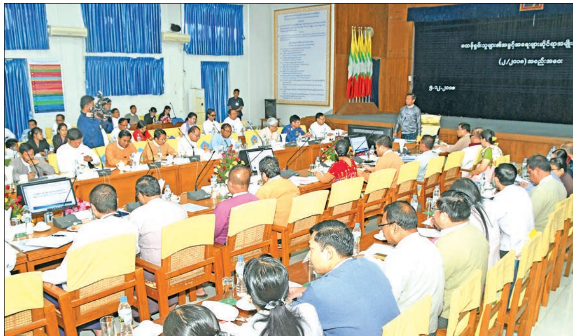
Vice President U Henry Van Thio addresses the coordination meeting of National Committee on the Rights of Persons with Disabilities (NCRPD) in Nay Pyi Taw yesterday.

Meanwhile, to create job opportunities for persons with physical disabilities, a project to provide vocational training to people with physical disabilities is being implemented. To promote creating job opportunities for persons with physical disabilities, a manual for