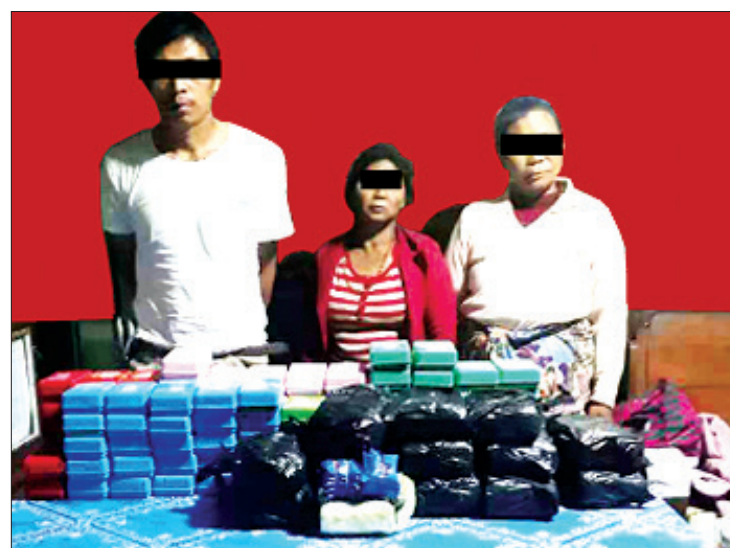
Drug suspects arrested in search operation in Momauk Township.

All suspects have been charged under the Narcotic Drugs and Psychotropic Substances Law.—MNA (Translated by Hay Mar)