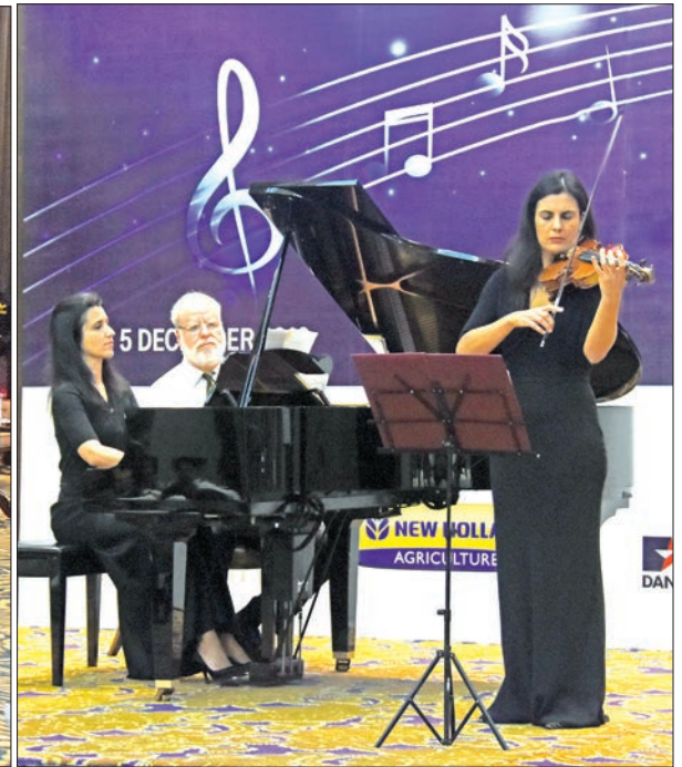
State Counsellor Daw Aung San Suu Kyi enjoys "Duo Gazzana" violin and piano concert in Nay Pyi Taw yesterday.