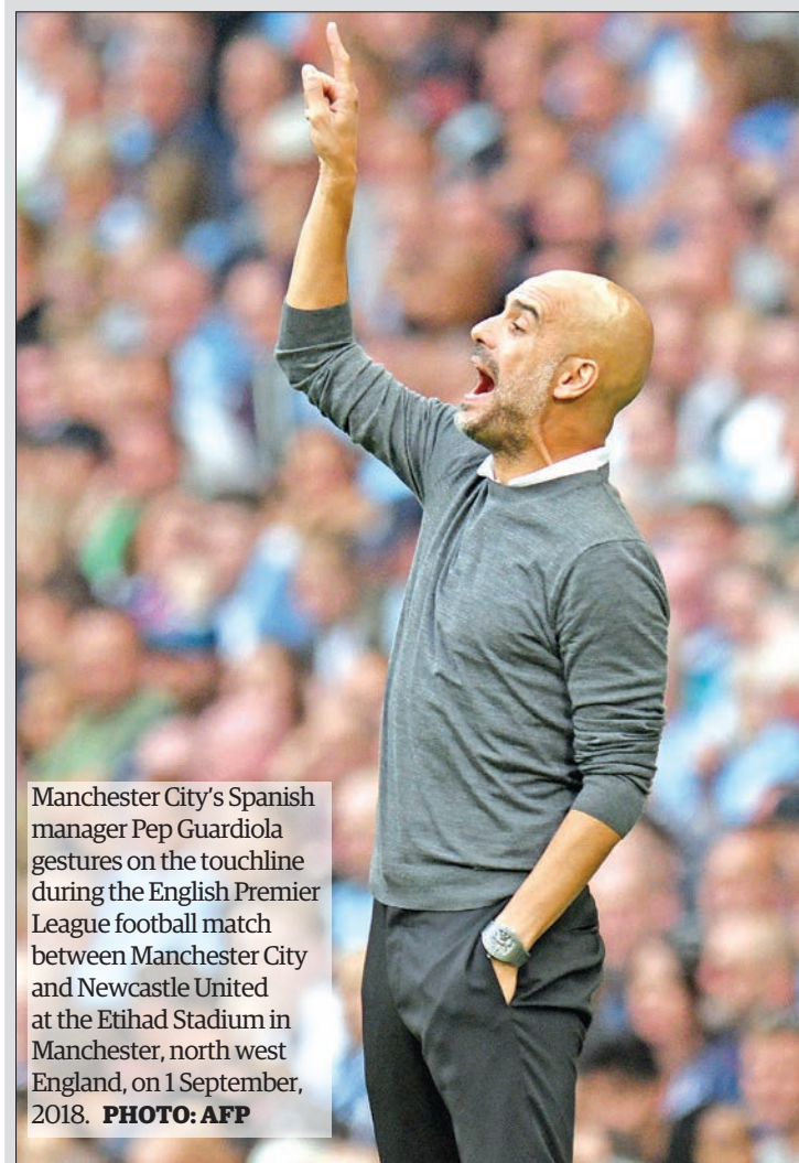
Manchester City's Spanish manager Pep Guardiola gestures on the touchline during the English Premier League football match between Manchester City and Newcastle United at the Etihad Stadium in Manchester, north west England, on 1 September, 2018.

In a repeated statement City said they would not comment on what they described as "out of context materials purportedly hacked or stolen from City Football Group and Manchester City personnel and associated people".—AFP ■