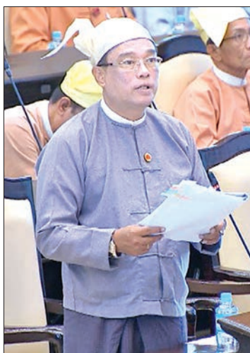
U Kyaw Lin.

U Myint Naing of Rakhine State constituency 5 asked the government if it plans to construct an access road between Thadarseik and Shwe Hlaing villages, and a road between Byar Lar and Sainohchaing villages through the fields. Regarding this query, Deputy Minister for Construction U Kyaw Lin replied that currently there was no plan