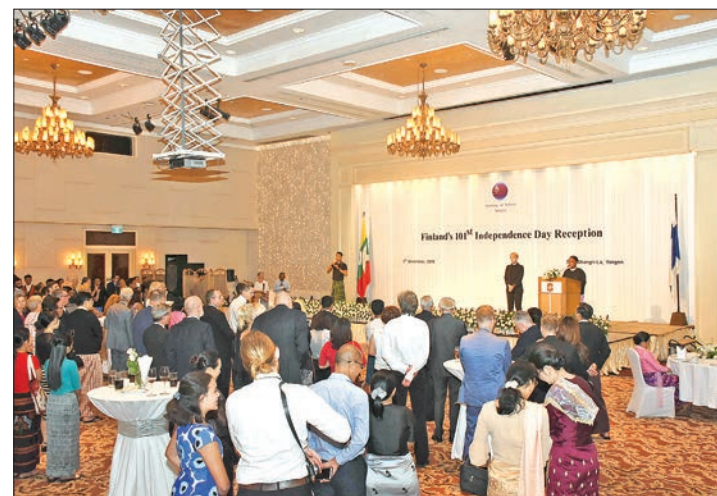
Union Minister Dr. Than Myint delivers the speech at the ceremony to mark the 101 st anniversary of Finland's Independence Day in Yangon.

Next, the Union Minister and guests attended a dinner hosted in honor of the 101 st anniversary of Finland's Independence Day. The event was attended by diplomats in Yangon, resident representatives of UN agencies and invited guests. —MNA (Translated by JT) ■