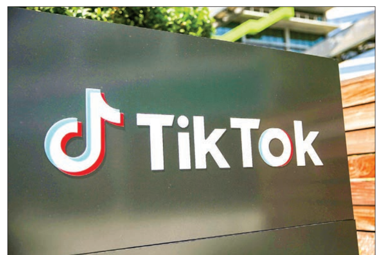
(FILES) In this file photo taken on 27 August 2020, The TikTok logo is displayed outside a TikTok office on in Culver City, California.

Microsoft had indicated at the beginning of August that