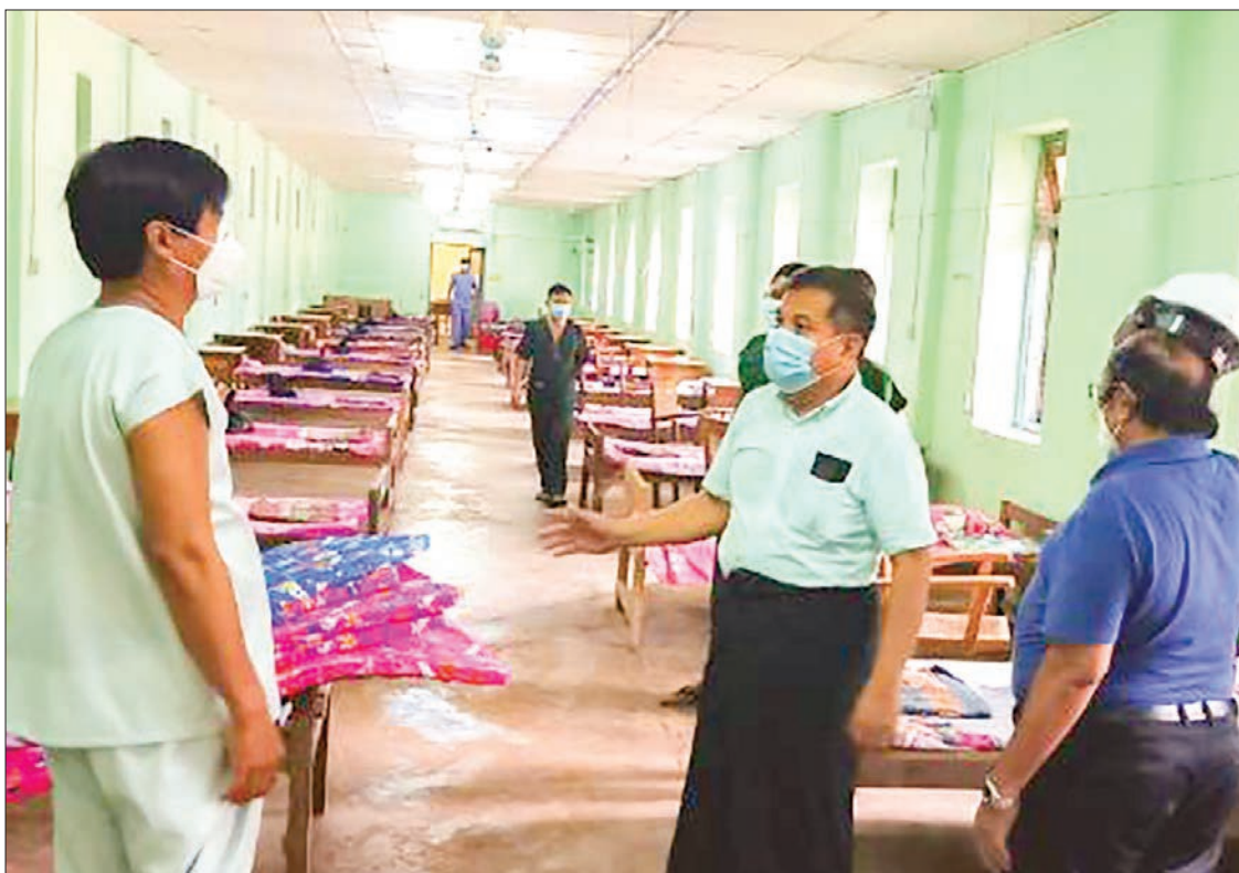
On completion, the expanded quarantine facilities will be able to accommodate 1,220 patients.