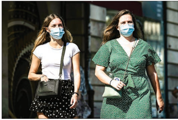
Pedestrians wearing protective face masks due to the COVID-19 disease caused by the novel coronavirus, walk in a street of Bordeaux, southwestern France, on 14 September 2020.

COPENHAGEN (Denmark) — The World Health Organization expects Europe to see a rise in the daily number of Covid-19 deaths in October and November, the head of the body's European branch told AFP.