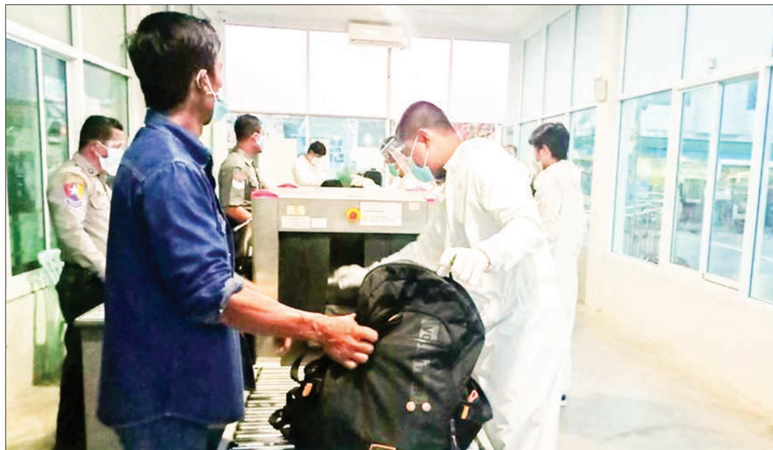
Seamen signed off from the ships in the Andaman Sea undergo hotel quarantine in Kawthoung.