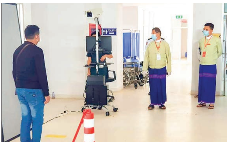
A Myanmar national returned from Thailand (L) has temperature checked at Myawady border on 14 September.