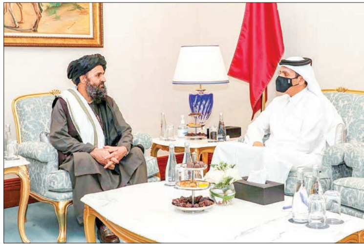
A handout picture released by the Qatar News Agency (QNA) on 12 September 2020 shows Qatar's Deputy Prime Minister and Foreign Minister Sheikh Mohammed bin Abdulrahman al-Thani (R) meeting with Taliban co-founder Mullah Abdul Ghani Baradar on the sidelines of the opening ceremony of the Afghan negotiations.

DOHA (Qatar) — The Afghan government ratcheted up pressure for a truce with the Taliban on Monday, reiterating calls for