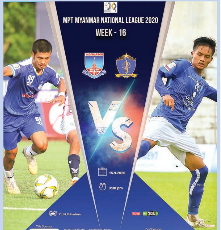
Yadanarbon FC and Southern Myanmar FC will meet in Week-16 of MPT MNL 2020 at the Yangon United Sports Complex on 15 September 2020.

place with 29 points, Shan United in the fourth place with the same points, followed by Rakhine United in the fifth place with 17 points.