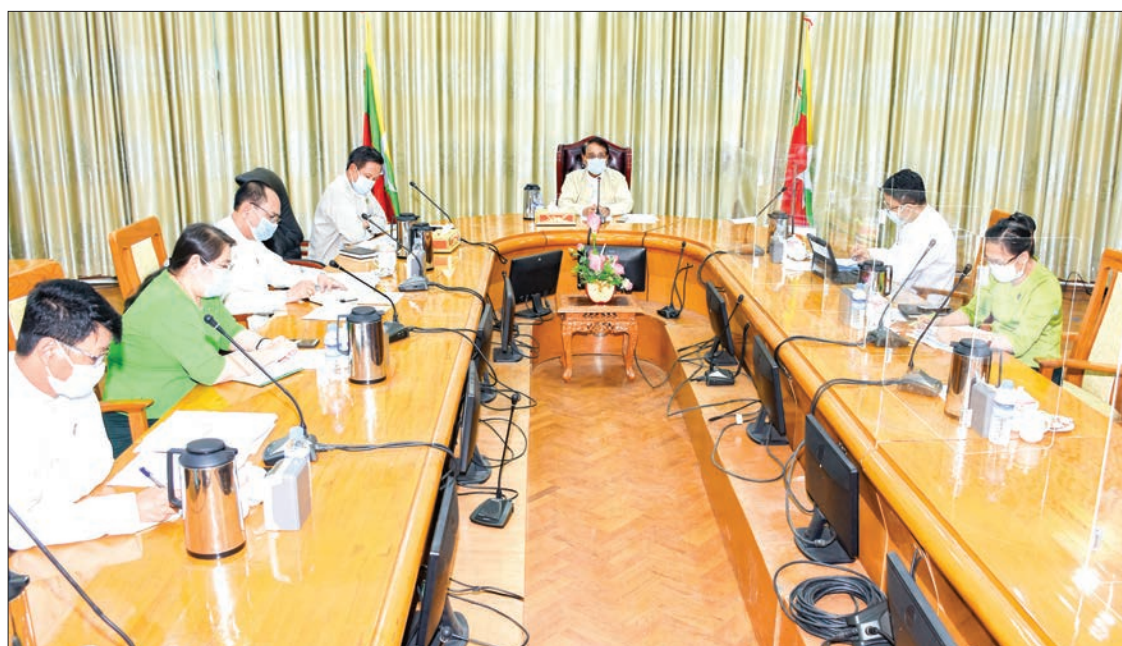
Union Minister Dr Than Myint discusses plans for price stability and smooth flow of goods during COVID-19 via Zoom from the Ministry of Commerce on 14 September 2020.

He said that increasing cases in Yangon Region showed that COVID-19 can rapidly spread in