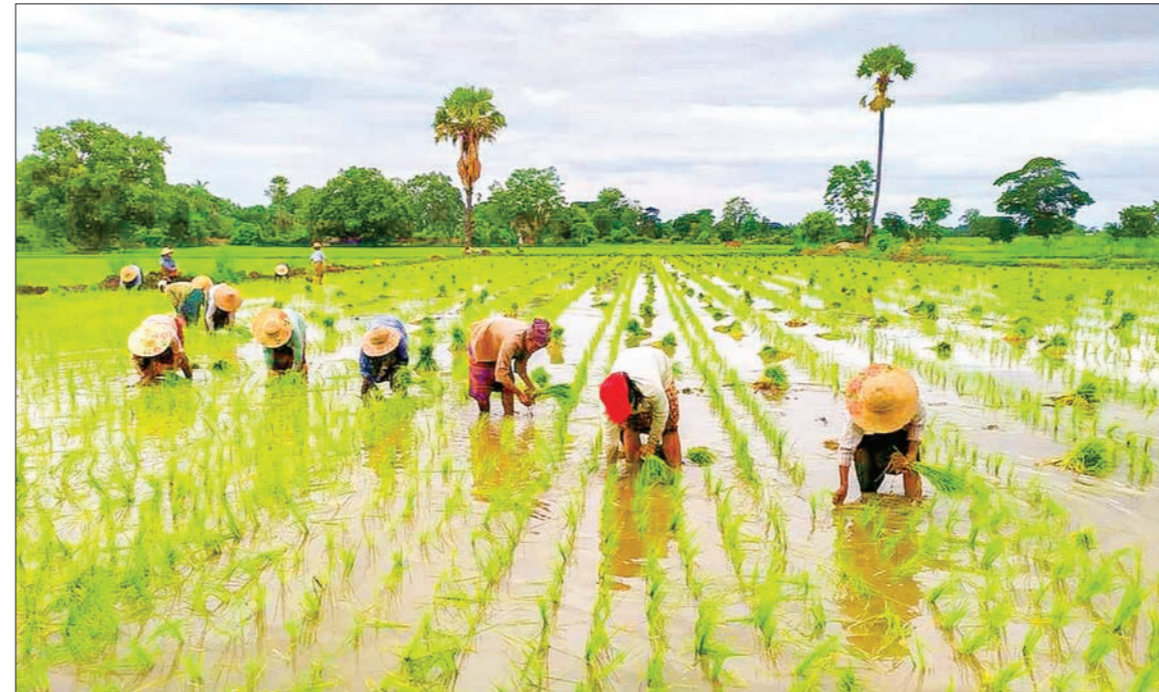
Farmer are planting paddy in rain-fed field in Minbu.

enhancing data collection methods at the country, regional and global levels, as data collection processes have been disrupted by physical distancing measures to contain the pandemic. For instance, FAO has recently released the FAO Data Lab to bring real time data on food prices and sentiment analysis. We have also developed the Hand-in-Hand Geospatial Platform which brings more than 1 million geospatial layers to help prioritize interventions within countries.