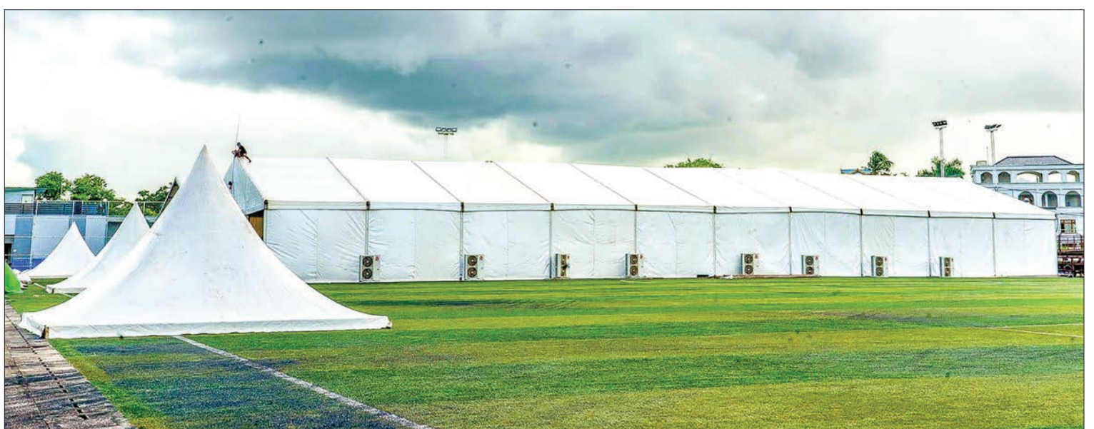
Temporary medical treatment centre set up by Ayeyarwady Foundation at the Thuwunna Youth Training Centre in Yangon is about to be completed this week.

The Ayeyarwady Foundation is working together with the Ministry of Health and Sports in measures against