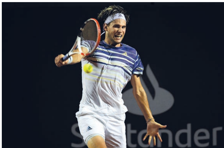
Austria's Dominic Thiem hits the ball during a quarter-final match against Italy's Gianluca Mager during the ATP World Tour Rio Open 2020 tournament, Jockey Club in Rio de Janeiro, Brazil in the early hours of 22 February 2020.

NEW YORK (United States)— Dominic Thiem produced a historic comeback to beat Alexander Zverev in a nervy five-setter and win the US Open on Sunday for