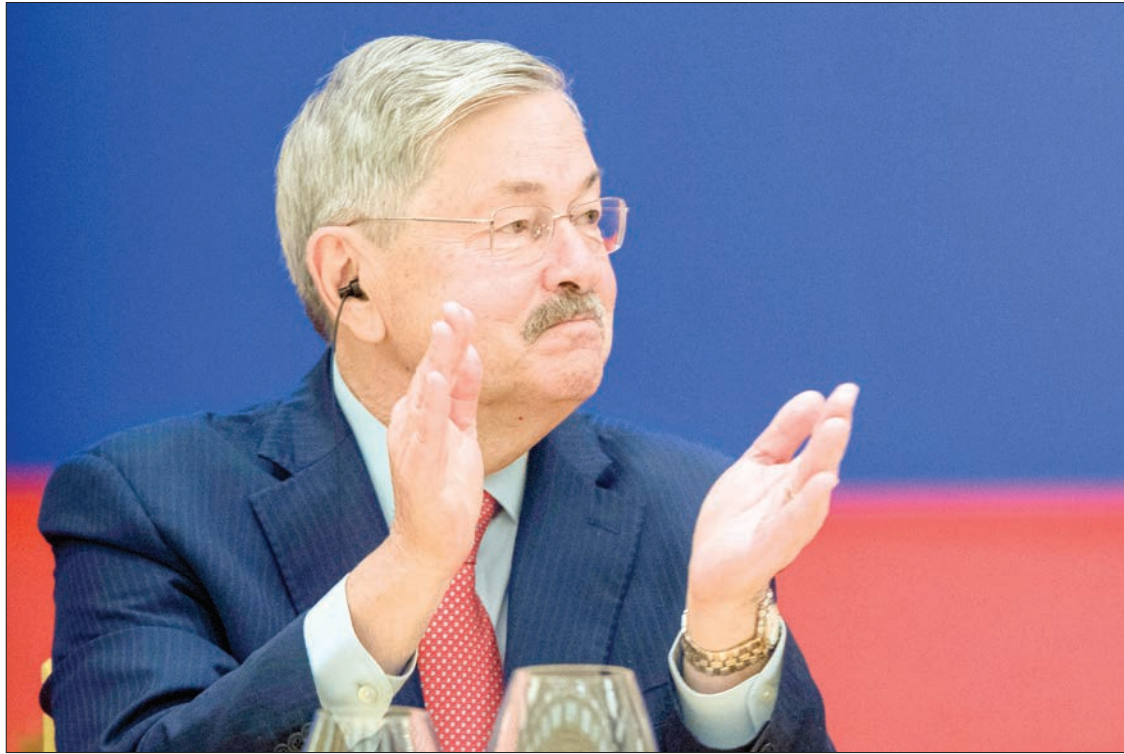
(FILES) This file photo taken on January 10, 2019 shows US Ambassador to China Terry Branstad applauding at an event commemorating the 40th anniversary of the establishment of diplomatic relations between the US and China at the Great Hall of the People in Beijing.

WASHINGTON (United States) — US ambassador to China Terry Branstad is stepping down, Secretary of State Mike Pompeo announced Monday, at a time of increasingly strained ties be-