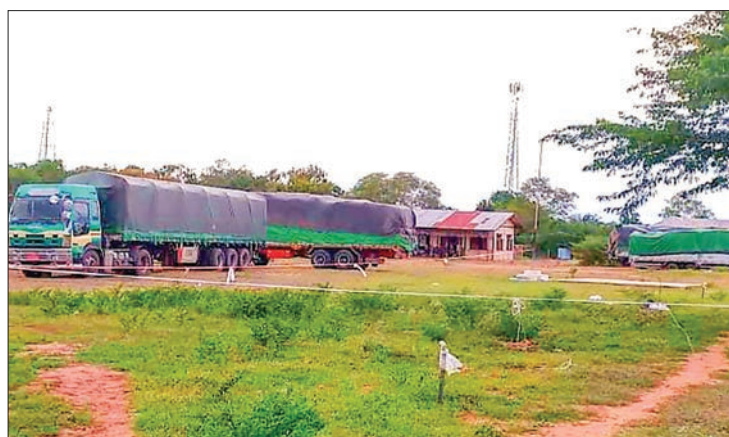
Lorries come from Yangon are seen outside Magway City on 14 September.

Magway Region bans highway buses to fight the COVID-19 resurgences starting from 14 September. However, a temporary truck terminal has been arranged for the movement of trucks and goods carriers from outside of the region.