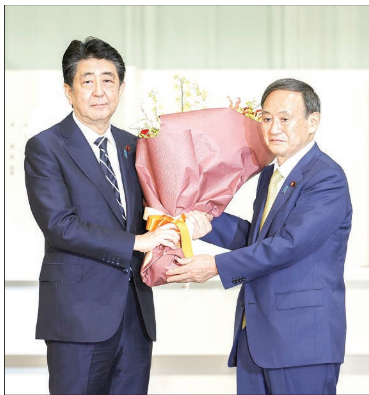
Outgoing Japanese Prime Minister Shinzo Abe (L) and Chief Cabinet Secretary Yoshihide Suga pose for a photo after the Liberal Democratic Party's presidential election to choose Abe's successor in Tokyo on 14 September 2020.

A total of 394 ballots were given to LDP lawmakers and 141 to delegates of local chapters, while the party's rank-and-file members were excluded from the vote this time to speed up the process amid the coronavirus pandemic. Suga secured his win among the local chapters' votes as well after most of them held primaries, with each chapter deciding whether to give all three allotted ballots to a single candidate or to multiple candidates in proportion to primary results.