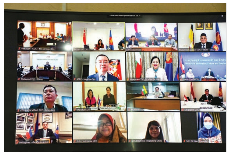
ASEAN Committee on Culture and Information organizes its 55th meeting online on 14 September 2020.

the estimated budget for ASEAN cultural fund, financial procedures for culture and information projects, the proposed projects from member countries and approved Thailand to host the next round of COCI meeting in 2021.