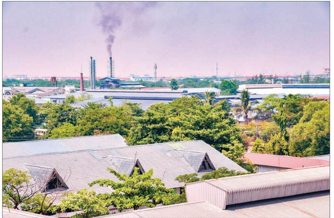
Workers retain jobs as factories in Hlinethaya continue operations amid COVID-19.