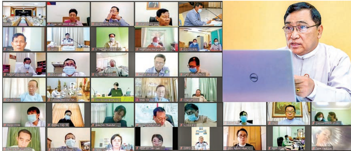
Union Minister Dr Win Myat Aye presides over the coordination meeting with National Committee on Rights of Child via videoconference on 14 September 2020.

In his opening remarks, the Union Minister explained the formation of management committees, work committees and technical teams for the emergence of Early Childhood Intervention (ECI) services for prompting the rights of children; the ECI pilot project is being im-