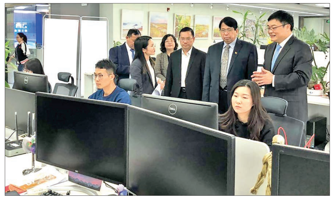
Union Minister Dr Pe Myint visits Guangxi Daily newspaper in Nanning City, Guangxi Zhuang Autonomous Region of People's Republic of China yesterday.

During the meeting, they discussed technology integration of mainstream and modern media, cooperation in news media between the two countries, collaboration in film and music, in addition to media sector, when holding 70<sup>th</sup> anniversary to mark the establishment of