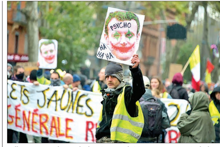
Yellow vest marches took place in several cities across France, including Bordeaux.

In the biggest anti-government protest in years, more than 20,000 demonstrators rallied Sunday outside the parliament building and some protesters who attempted to block building entrances were dispersed on Monday.—AFP■