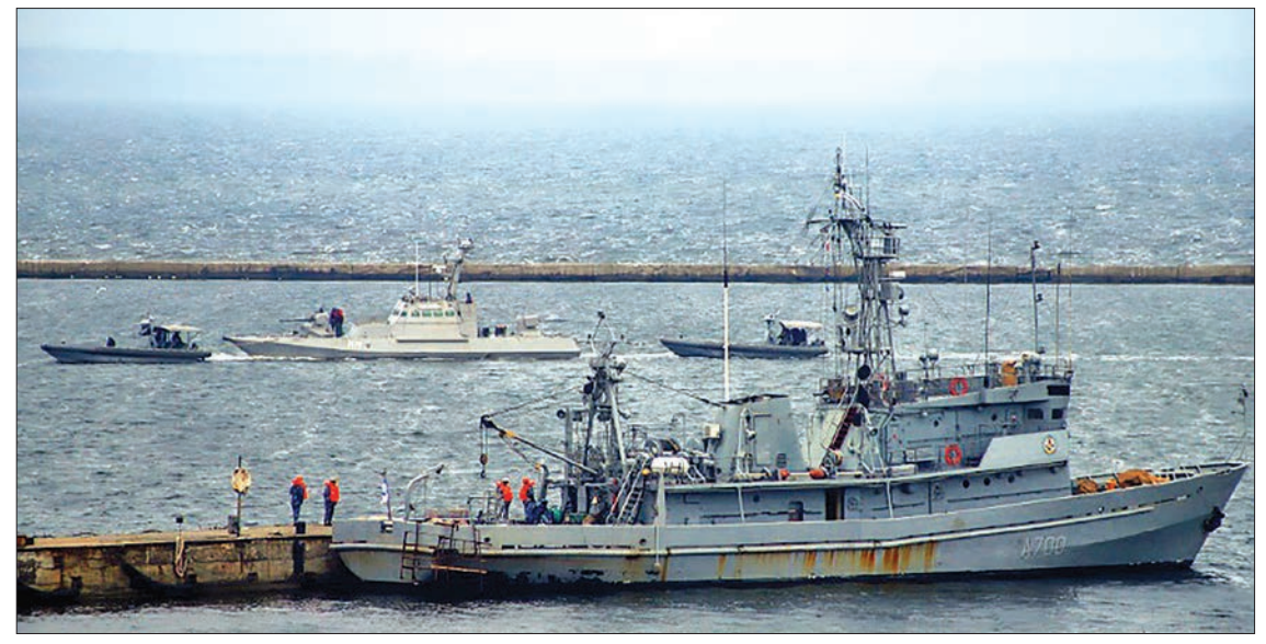
The two gunboats and a tugboat were handed back this week after they were held in evidence following what Moscow says was an illegal breach of the Russian border.

navy vessels are back where they belong. As promised, we have brought back our sailors and our ships," Zelensky said.