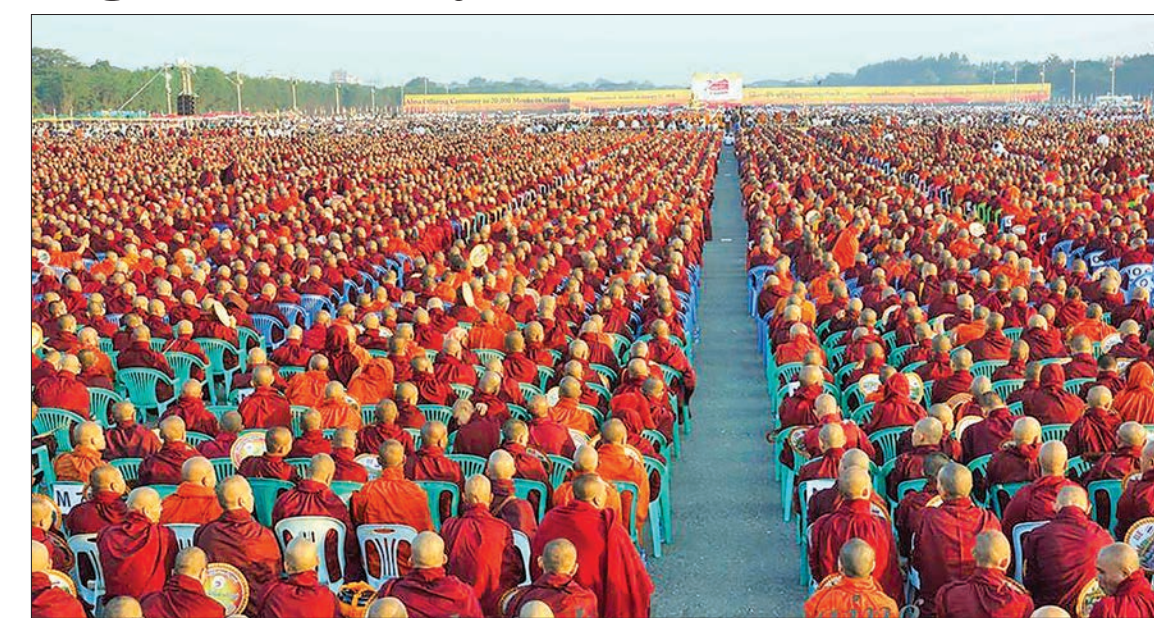
Myanmar and Thai Buddhist monks participate in an alms-offering ceremony in Mandalay last year. The similar ceremony will be held on 8 December which will also include a photo contest.

The competition will be open for everyone. Photographers will be allowed to submit five 10X15 inch photo entries. The winner of the contest will be awarded K700,000, the second placed winner will get K500,000, the third placed winner will get K300,000, and there will also be a consolation prize of K100,000.