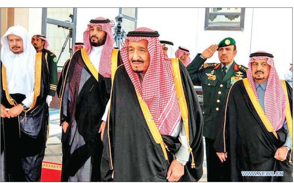
Saudi King Salman bin Abdulaziz Al Saud (c, Front) attends the 7<sup>th</sup> session of the Shura Council in Riyadh, Saudi Arabia, on 20 November, 2019.

He also said Saudi Arabia is determined to carry on with its reform programs to raise its competitiveness to become one of the 10 most business-friendly countries in