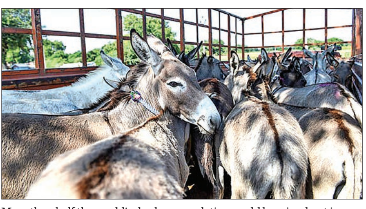
More than half the world's donkey population could be wiped out in five years due to demand in Chinese medicine for skins to make ejiao, charity Donkey Sanctuary has warned (file picture).

At a holding facility in Brazil, malnourished animals were being kept in the same pens as "hundreds of donkey carcasses" that had contaminated the only available water source, "putting remaining donkeys at risk of either infectious disease or severe dehydration".—AFP ■