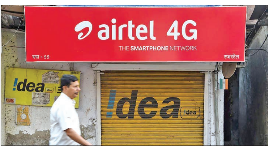
An Indian man walking past a shop with an advertisement for mobile service provider Airtel and Idea in Mumbai.