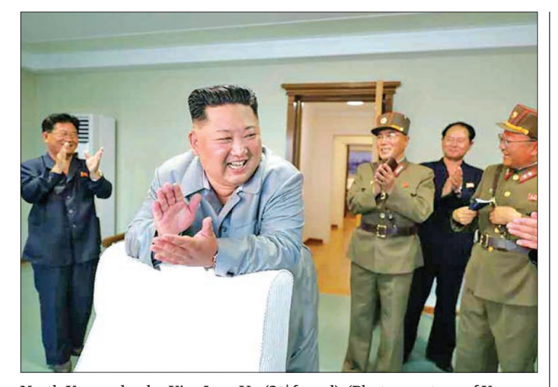
North Korean leader Kim Jong Un (2<sup>nd</sup> from l).

billion Catholics met with Thailand's Prime Minister Prayut Chan-O-Cha at a red-carpet welcome ceremony at the government guest house, before addressing medical staff at Bangkok's St. Louis hospital.