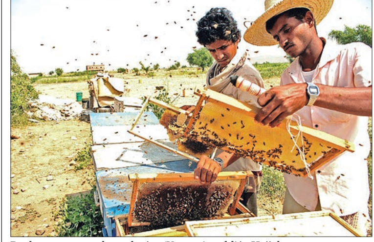
Beekeepers at work producing 'Yemen's gold' in Hajjah province.

Ahead of its formal establishment the union registered 400 expressions of interest from Samsung Electronics employees, the FKTU says.—AFP■