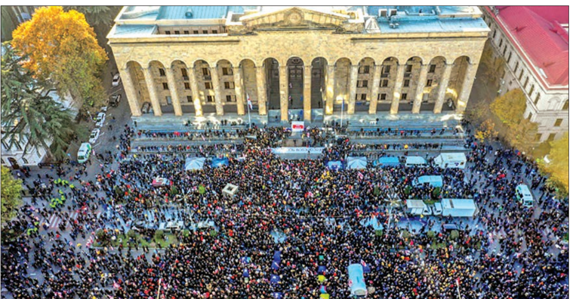
Tens of thousands of protesters gathered outside parliament on Monday.

The brigadier, a member of France's elite CRS riot-control police based in the southwestern city of Toulouse, faces charges of "deliberate violence by a person in a position of public authority."—AFP ■