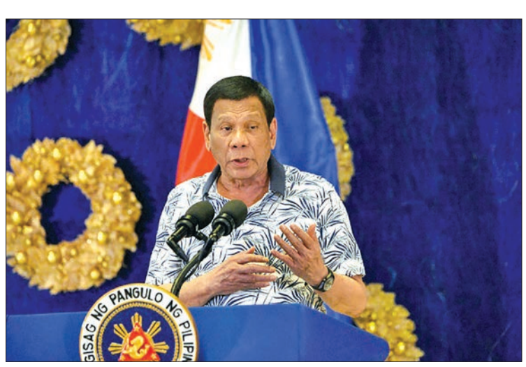
The president told a late-night press conference that the use and import of electronic cigarettes would be banned.

Duterte is notorious internationally for his deadly an-