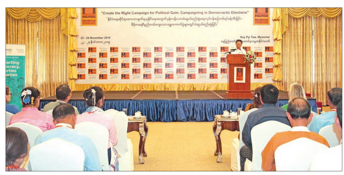
Union Election Commission Chairman U Hla Thein addresses the opening ceremony of 8<sup>th</sup> Alumni Forum of MySoP (Myanmar School of Politics) in Nay Pyi Taw yesterday.