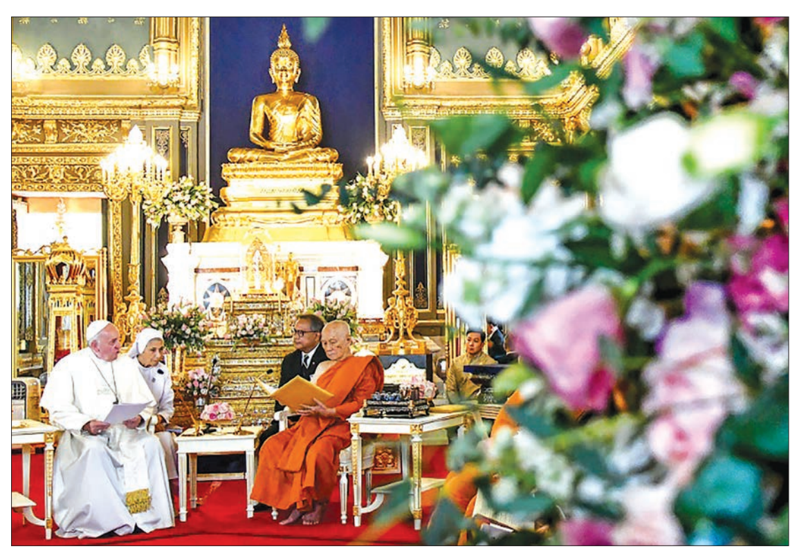
Pope Francis meets Thailand's Supreme Buddhist Patriarch at Wat Ratchabophit Monastery in Bangkok.

In an earlier speech, the Pope said the meeting was "a sign of the importance and ur-