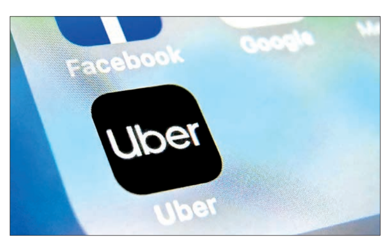
Transport NGOs say Uber is not helping solve urban transport systems, attracting more cars onto the road and increasing pollution as a result.

LONDON — Ride-hailing pioneer Uber, rather than being part of the solution to urban transport may be adding to related problems, especially pollution from diesel cars, a study showed Thursday.