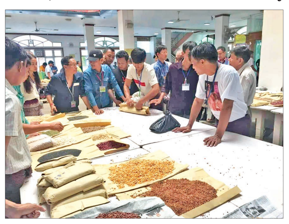
Merchants evaluate quality of pulses at the Mandalay wholesale market.

BLACK sesame from Bhamo, Katha and Htigyaing townships and white sesame from Shwebo and Wetlet townships has started to enter the Mandalay market and is commanding a good price, according to Mandalay bean traders.