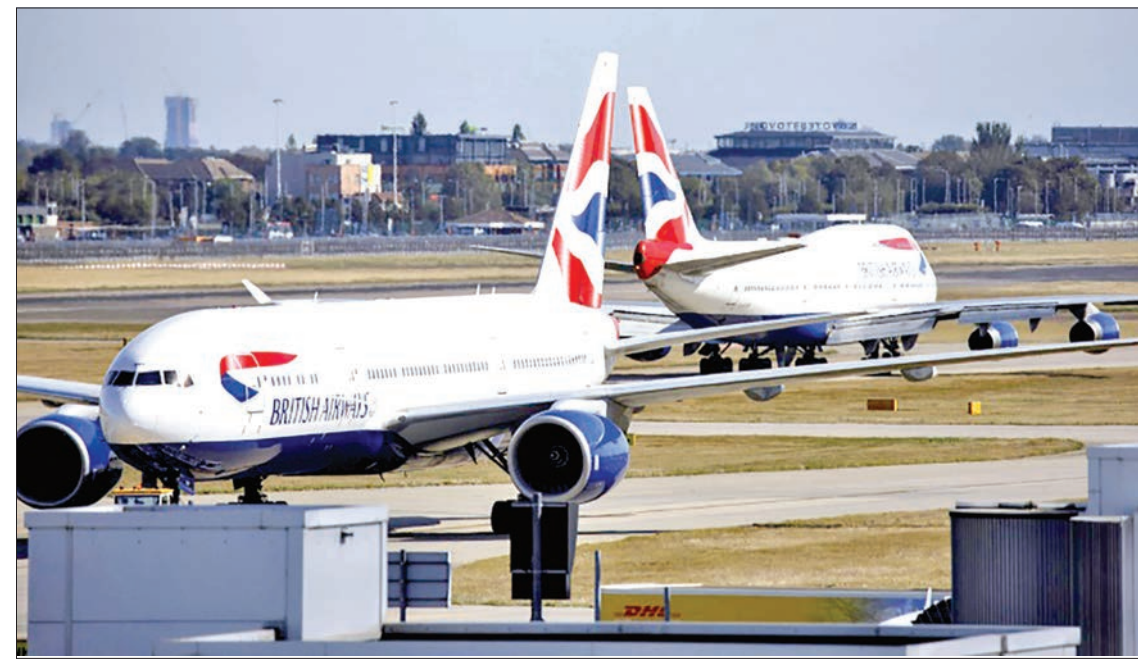
BA suffered a computer glitch in 2016 that severely affected its global check-in system.

"Yet again it's thousands of passengers who are paying the price—left tired, frustrated and with a lack of information and assistance from the airline."