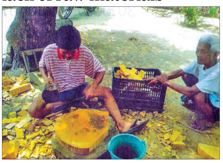
Workers make wooden combs at work in Thet Kael Kyin Village, Monywa Township.

WOODEN comb-making businesses in Thet Kael Kyin Village, Monywa Township, have almost vanished due to lack of raw materials and substitution products.